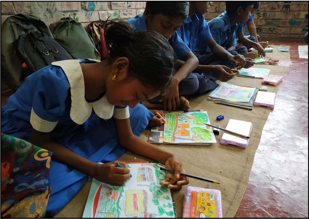
Drawings competition at Jogahati village...