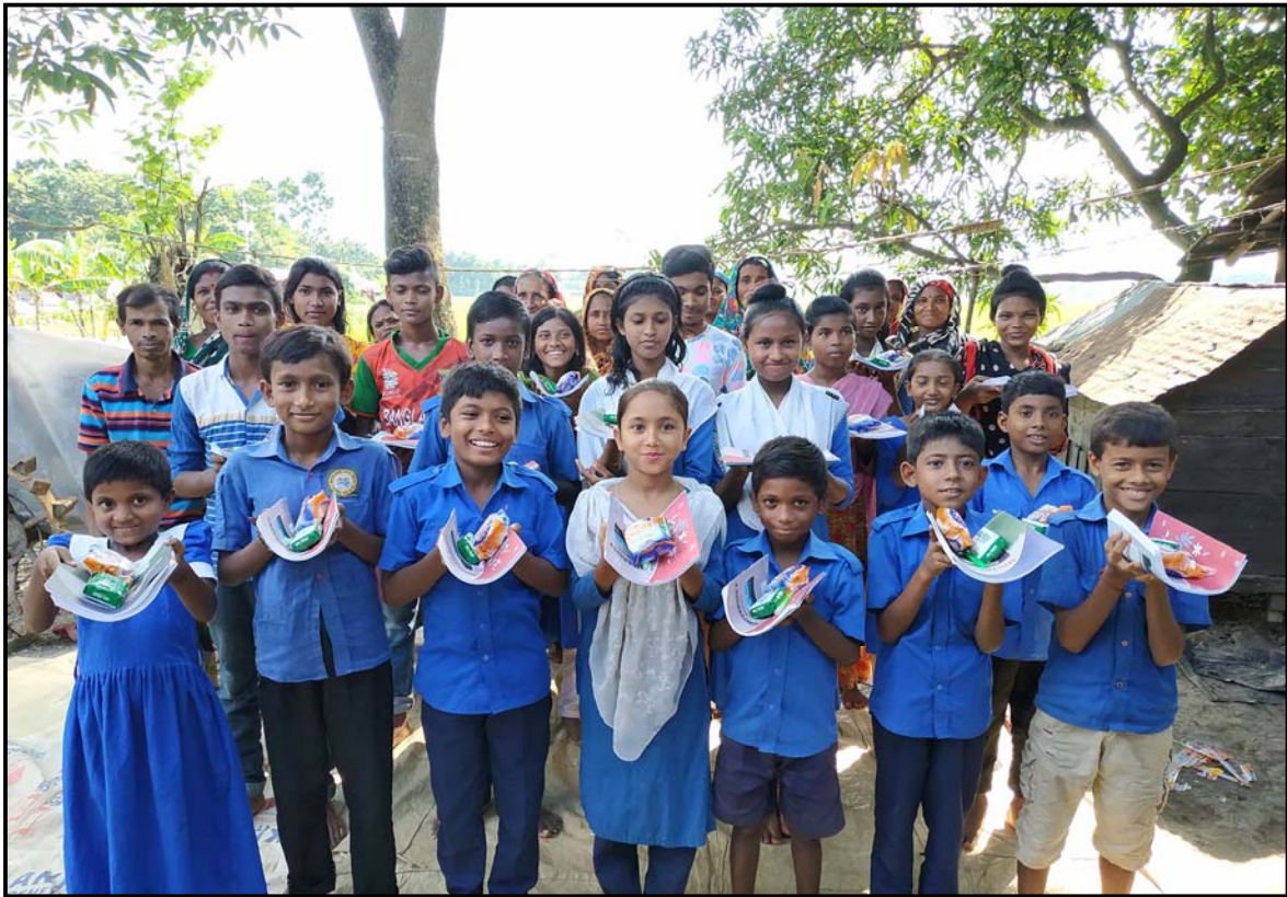
Sorupdaho happy students with the materials...