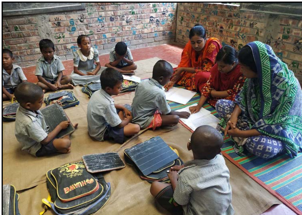
Pre-school students 2 nd term exam was conducted...