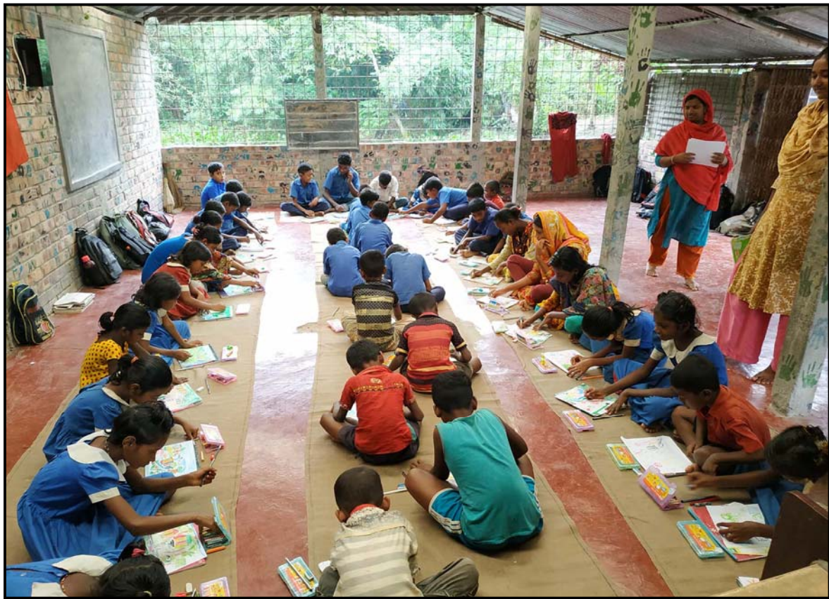
Drawings competition at Jogahati village...