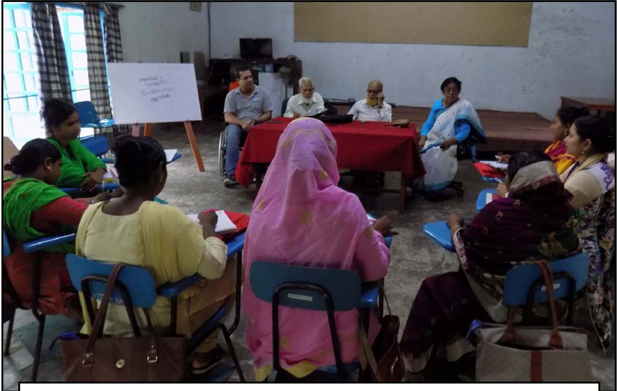
Monthly teachers coordination meeting...