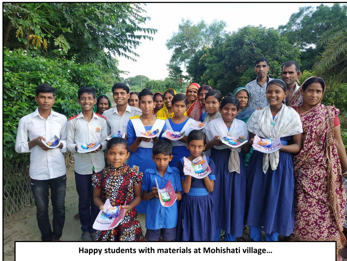
Happy students with materials at Mohishati village...