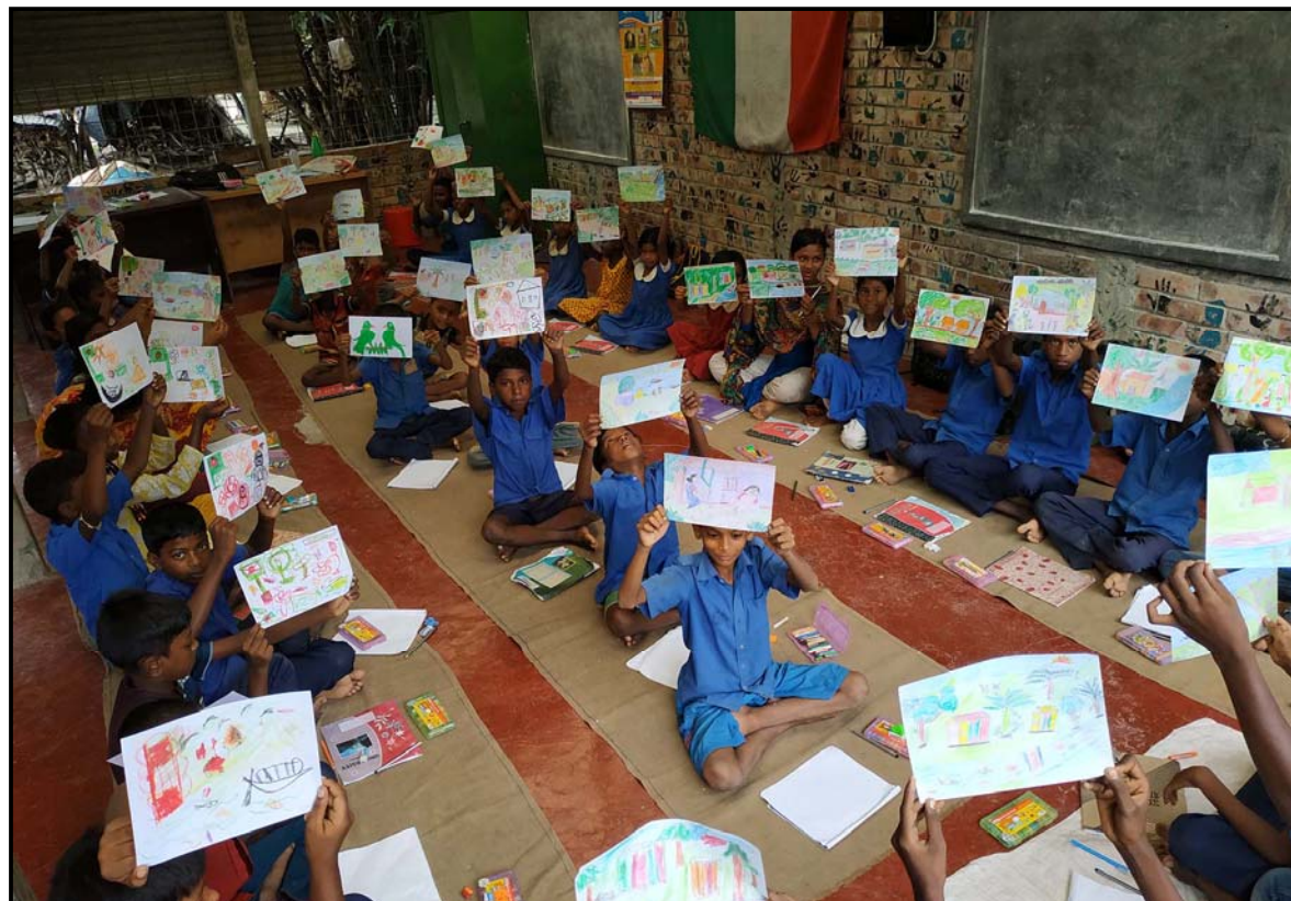
Proud to show the creative arts...