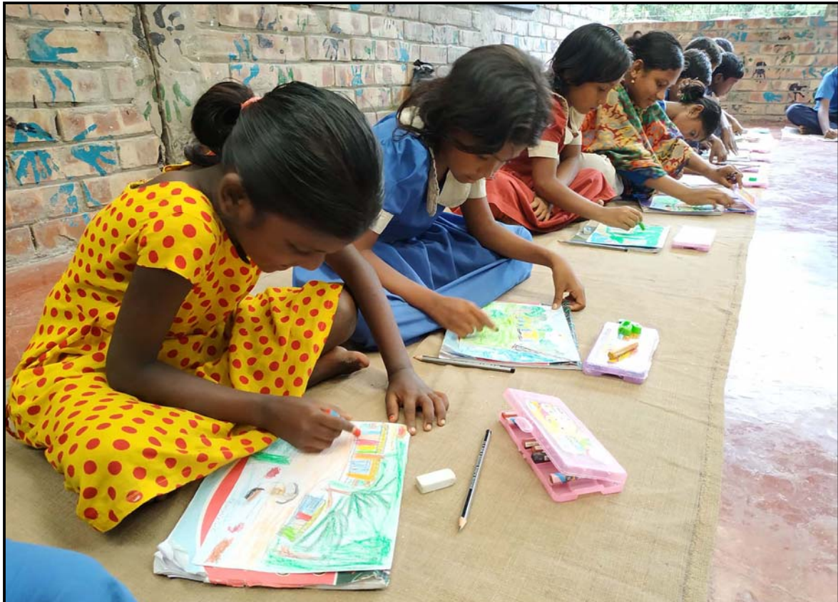
Drawings competition at Jogahati village...