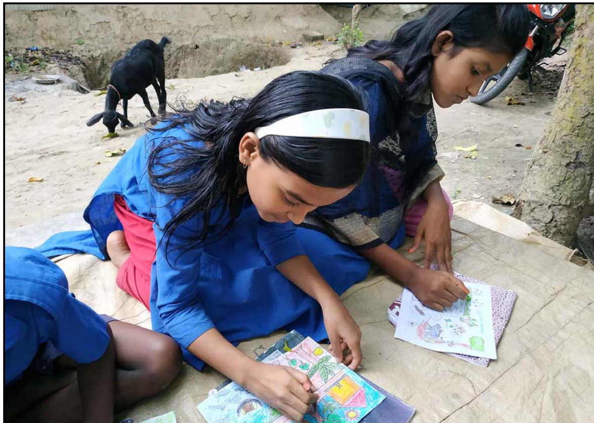
Drawings going on in Sorupdaho village...