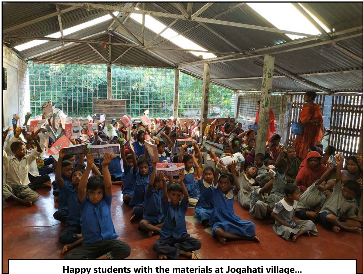
Happy students with the materials at Jogahati village...