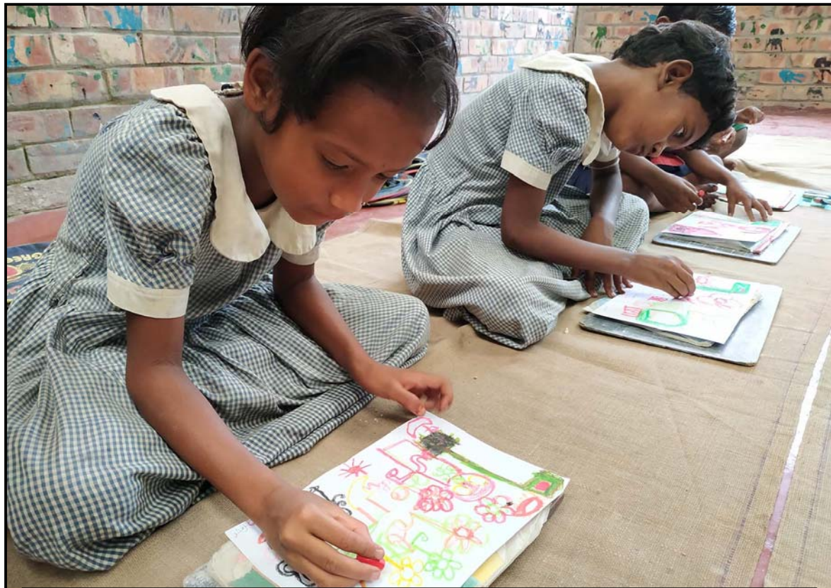
Drawings competition at Jogahati village...