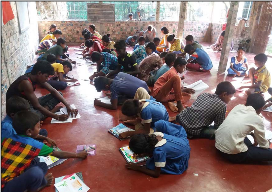
Drawing programme at Jogahati village...