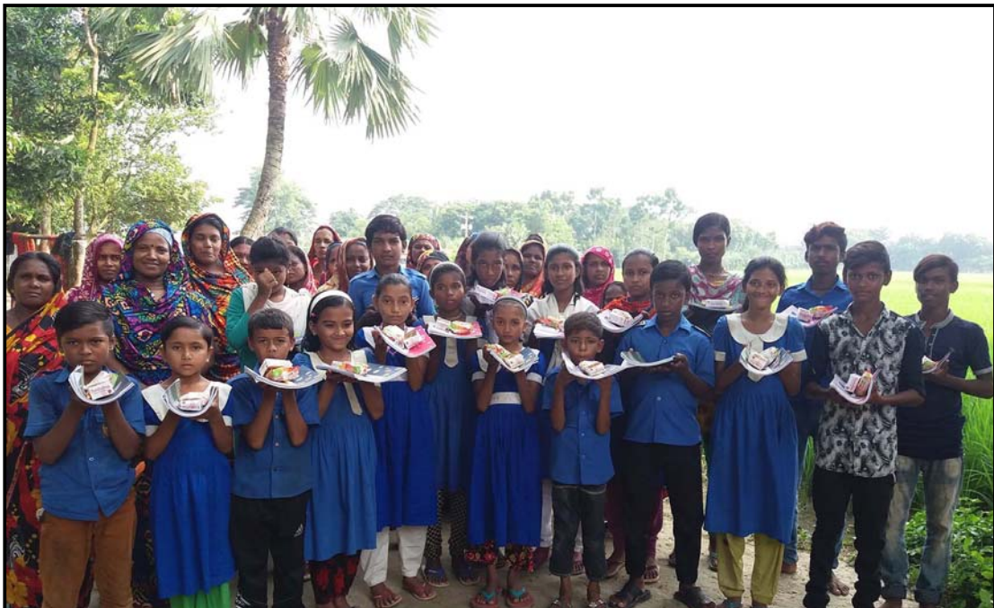
Happy students with the materials at Sorupdaho village...