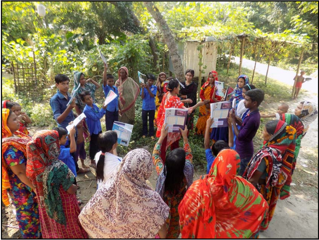
Materials distribution at Mohishati village...