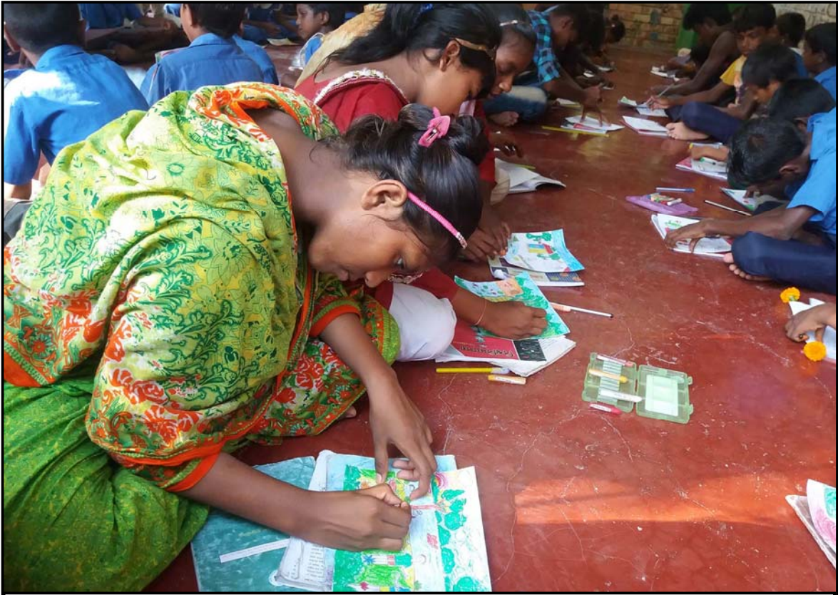
We arrange art competition for Christmas greetings....