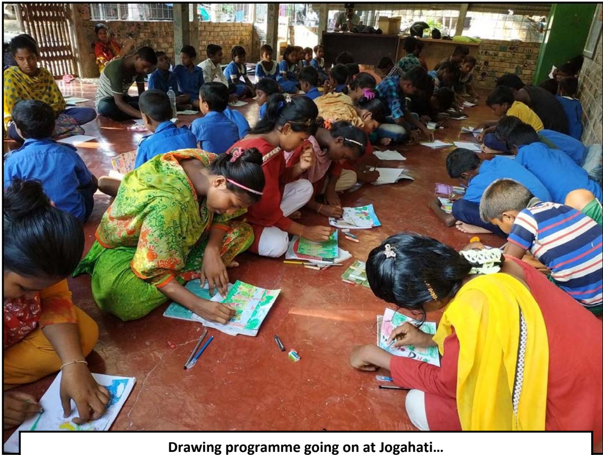
Drawing programme going on at Jogahati...