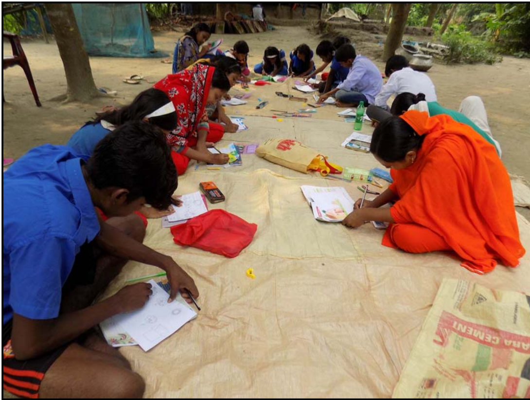
Drawing programme going on...