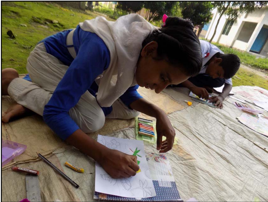
Drawing programme going at Churamankati village...