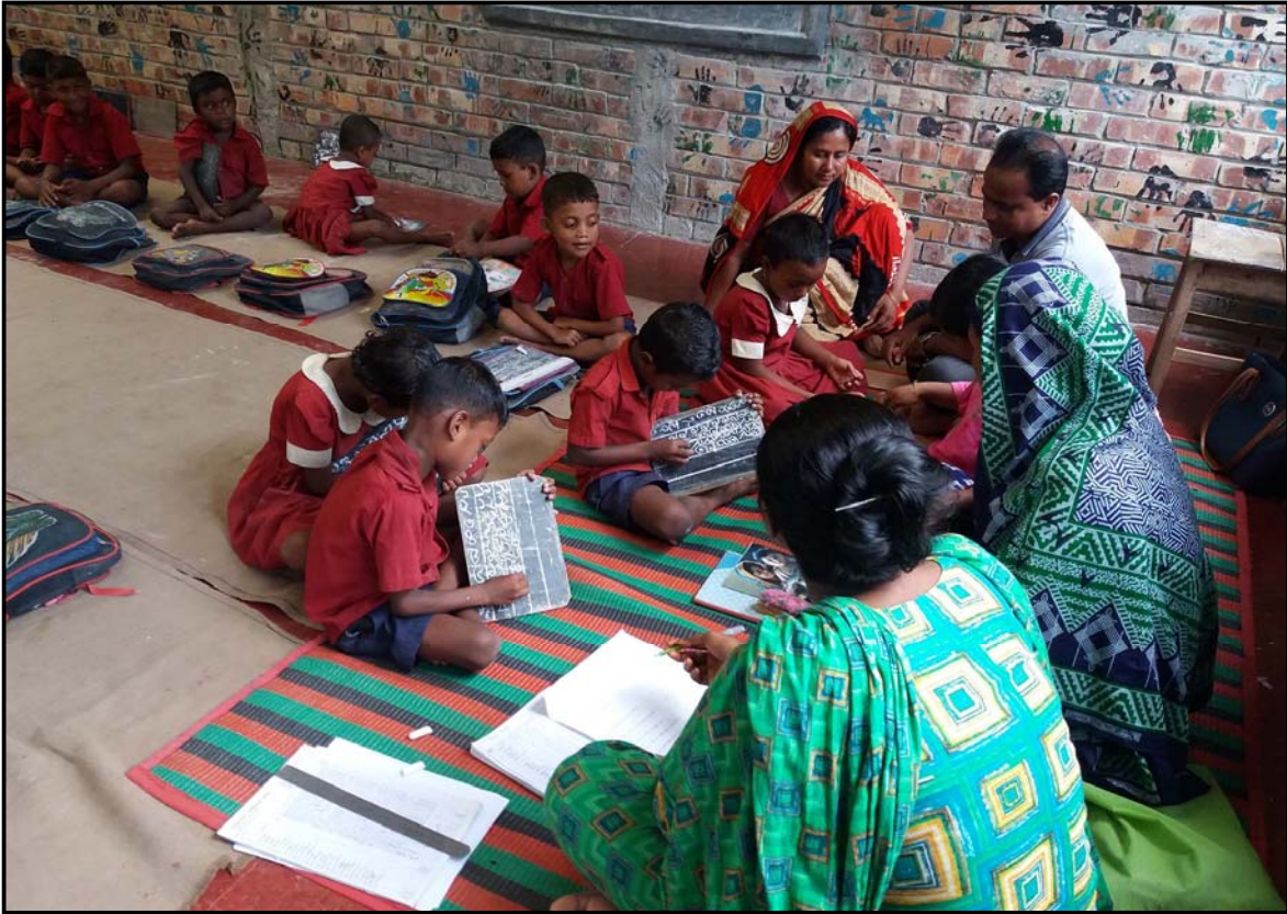
Preschool students giving class test...