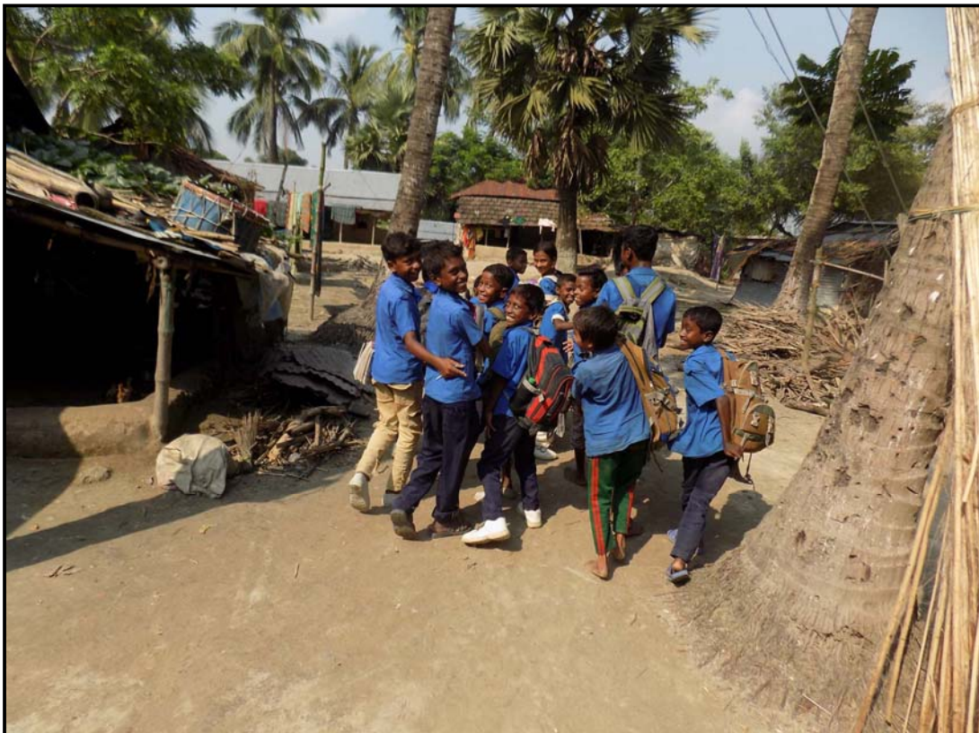
Students back to village after school...