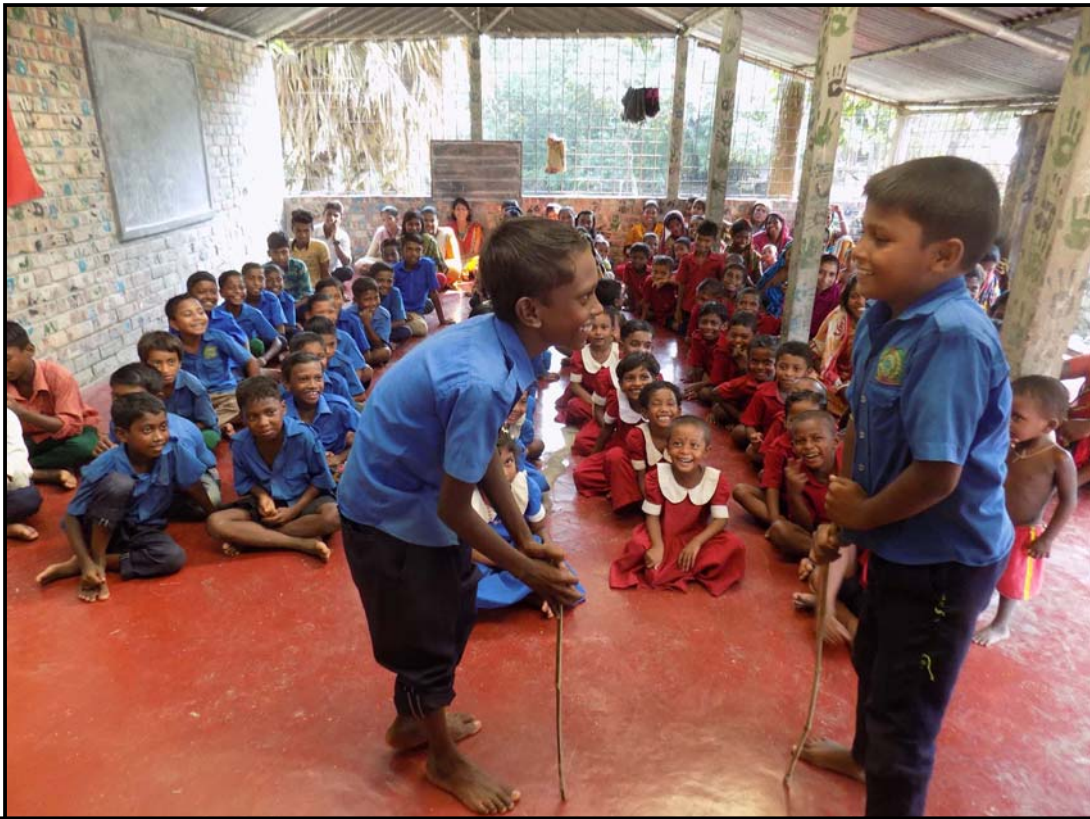
During parents meeting, students make drama show regarding prevent of early marriage...