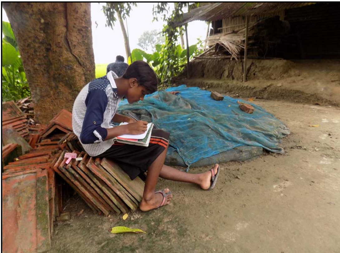
Drawing programme going on...