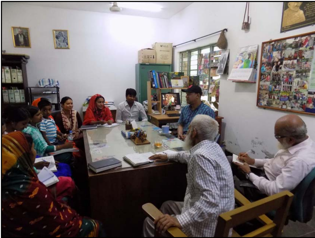
Monthly teachers coordination meeting...