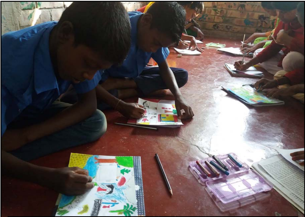
Drawing programme going on...