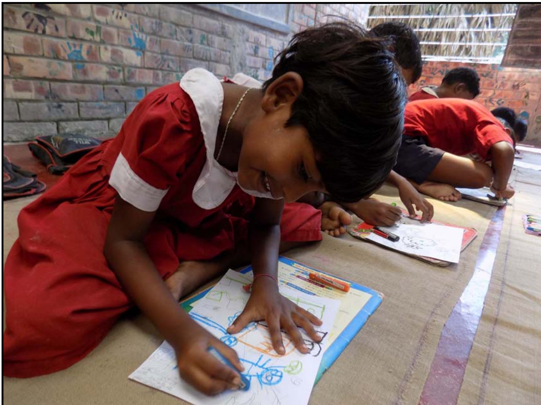
Drawing programme going on at preschool...