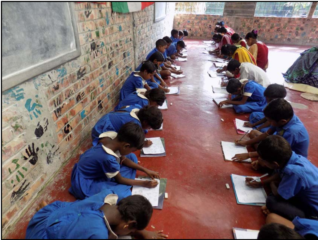
Drawing programme going on...