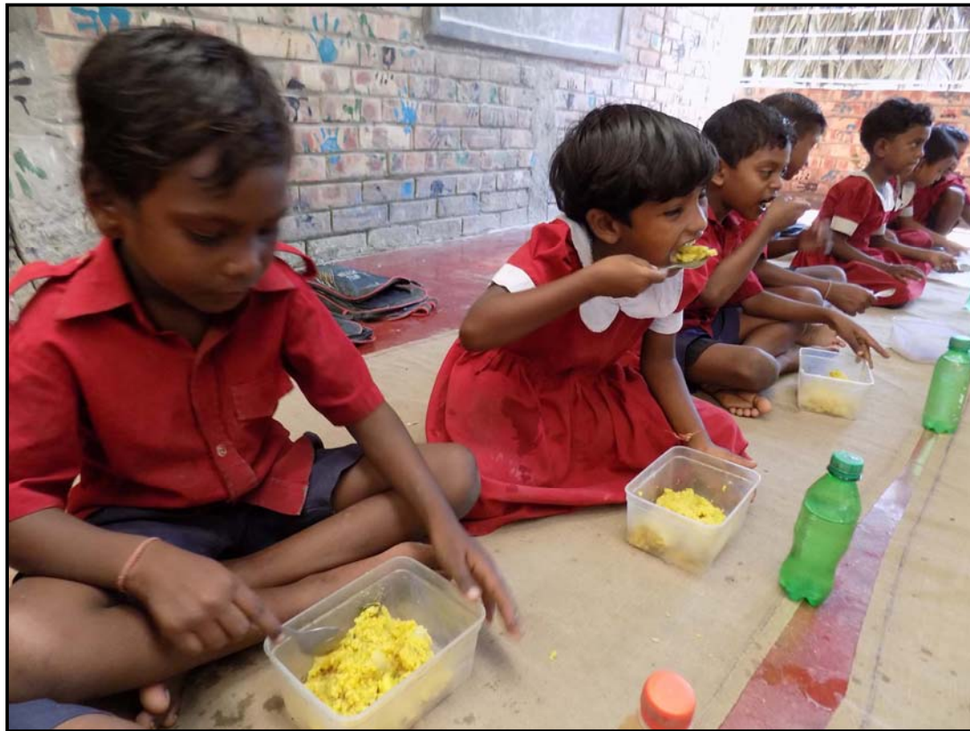
Preschool students enjoying the meal...