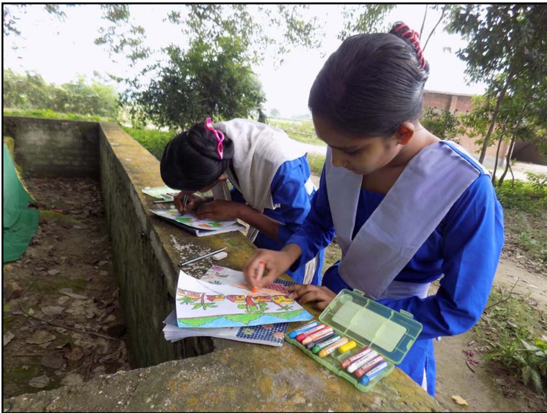
Drawing programme going on...