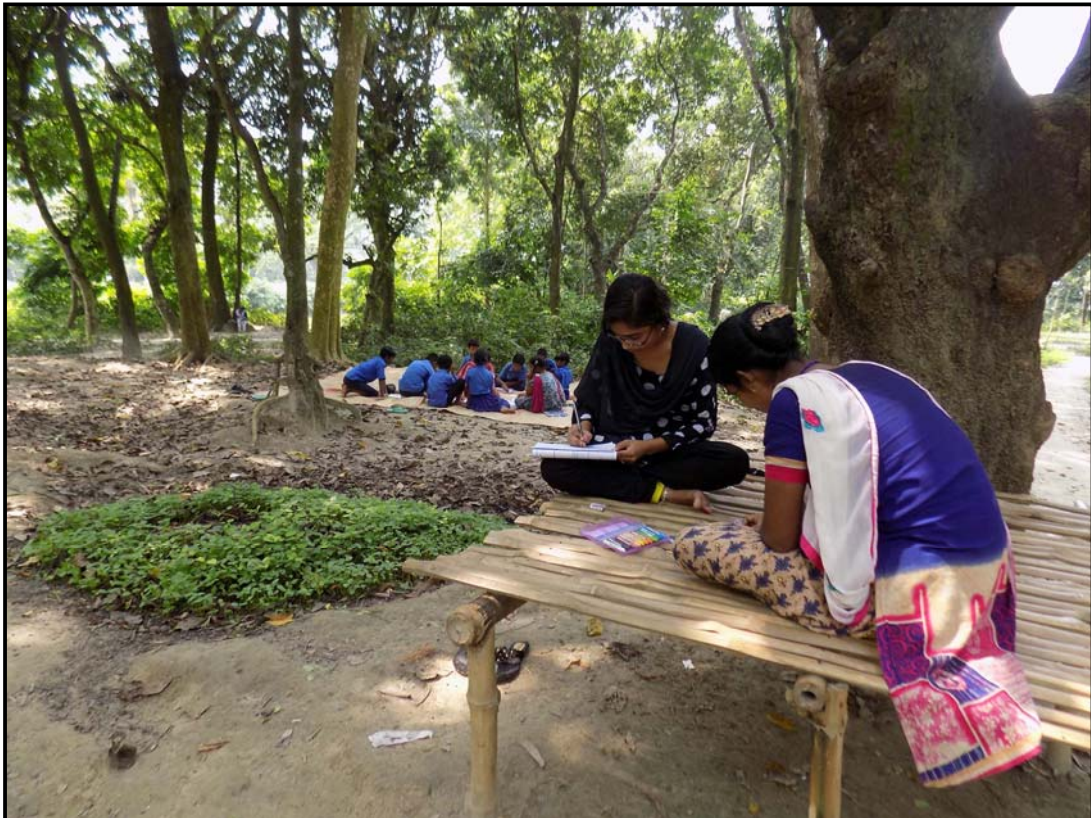
Drawing programme going on...