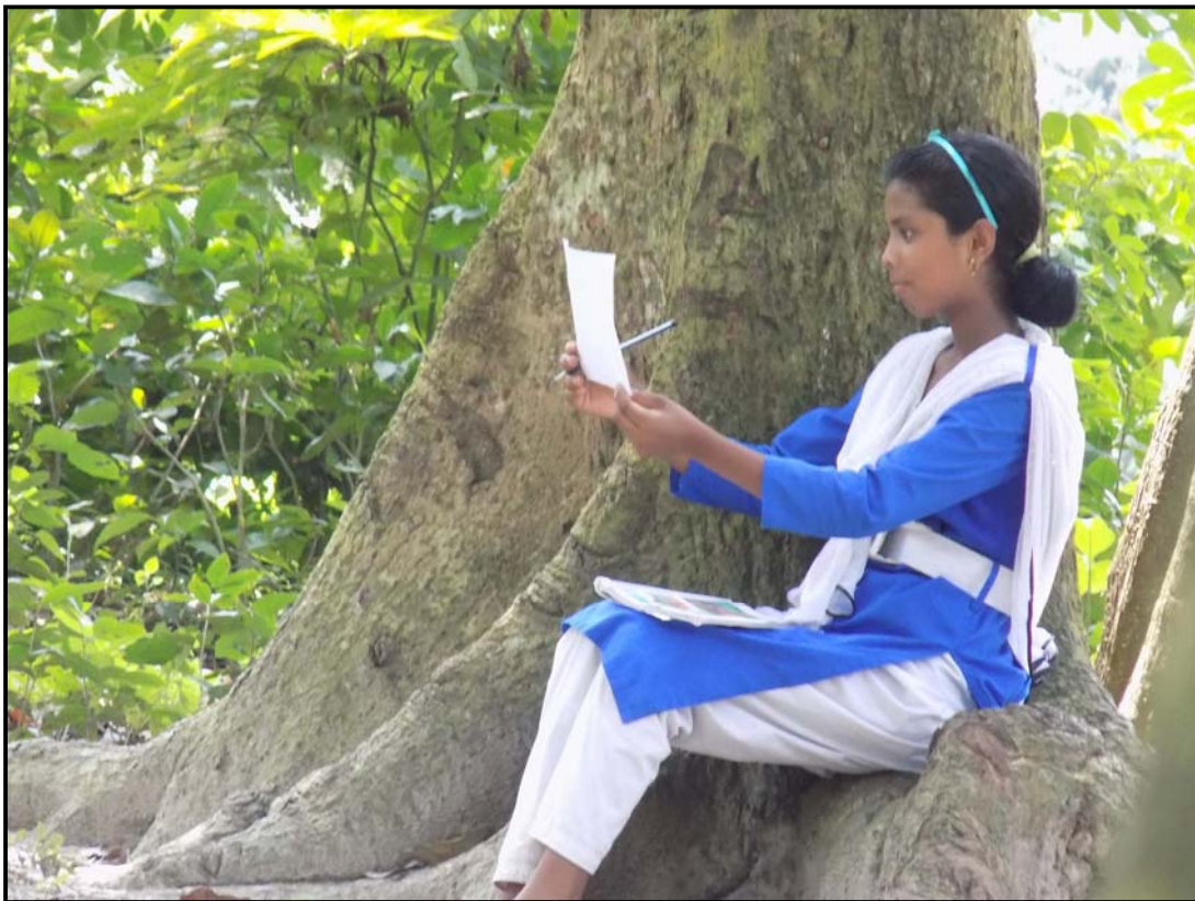
Drawing programme going on...