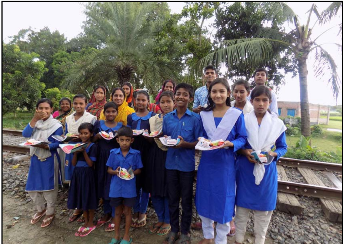
Happy students at Churamankati with the materials...