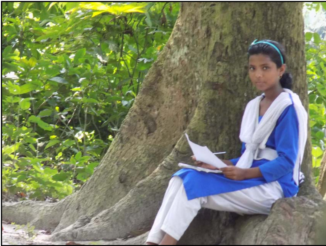
Drawing programme going on...