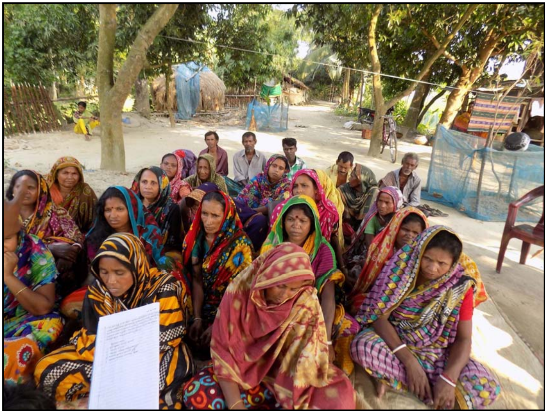
Monthly parents meeting at Sorupdaho