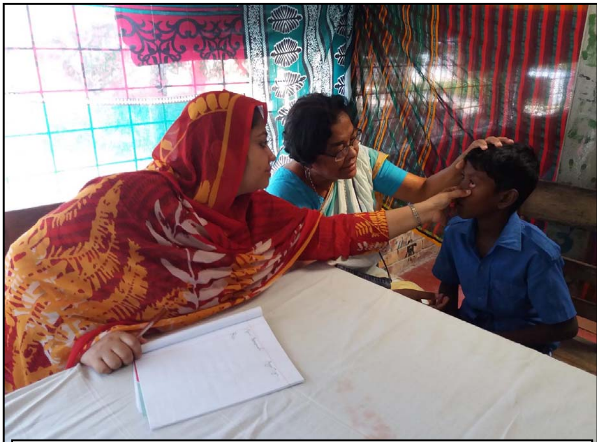
Medical health check-up at Jogahati village...