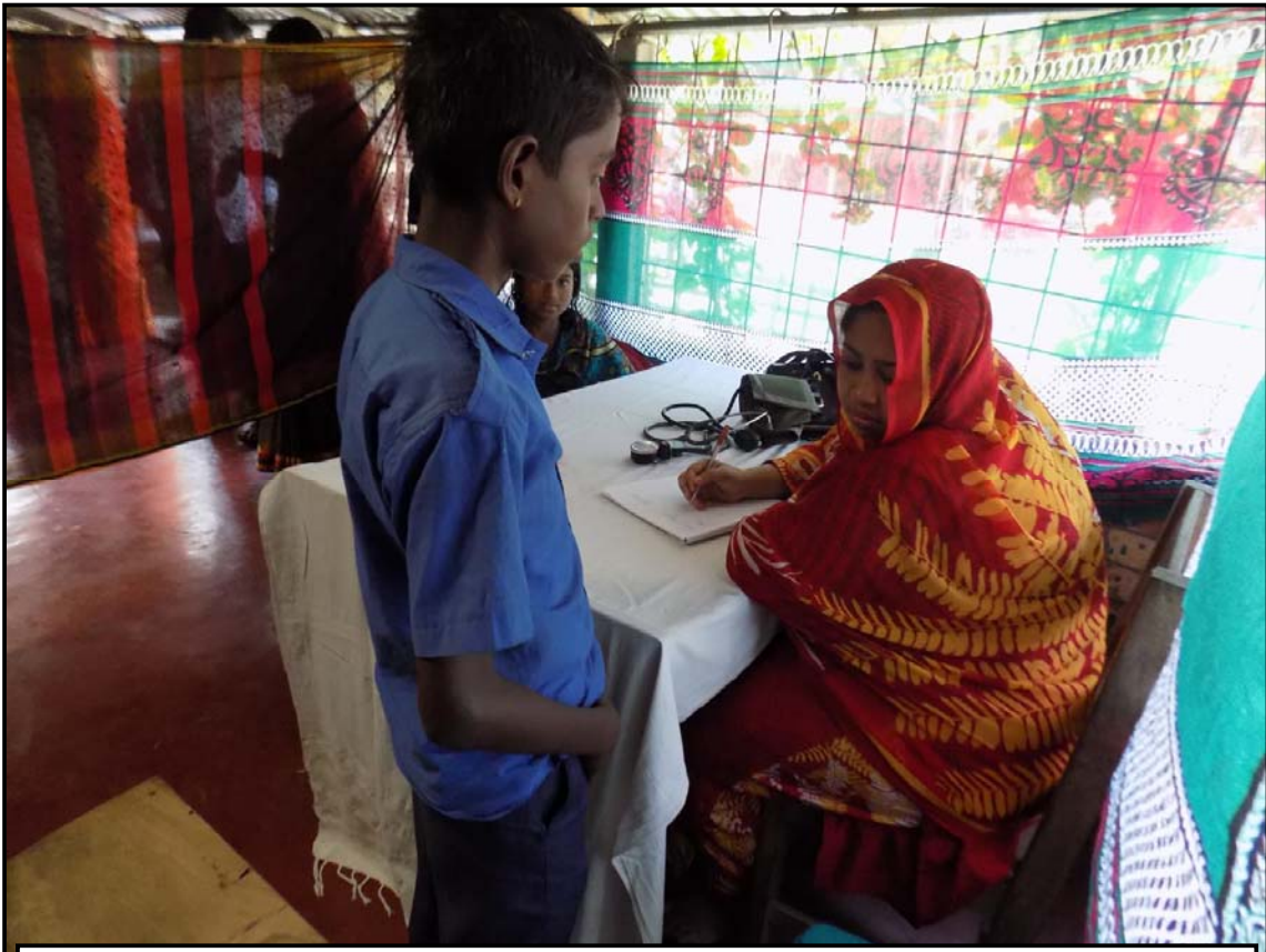
Medical health check-up at Jogahati village.....