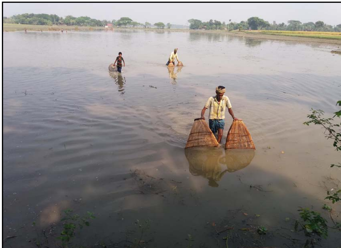
Fishing at the pond...