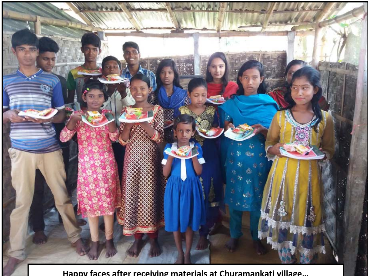
Happy faces after receiving materials at Churamankati village...