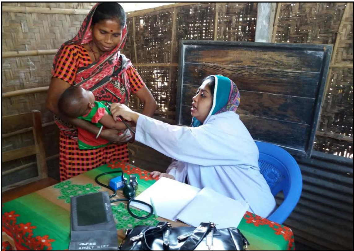
Medical health check-up at Lolitadaho village...