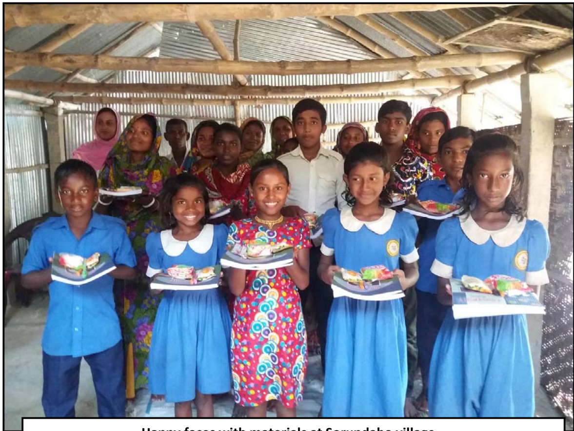
Happy faces with materials at Sorupdaho village...