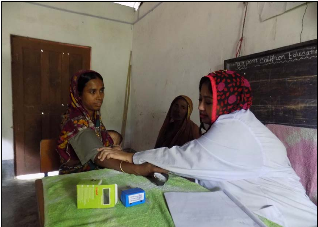
Medical health check-up at Mohishati village...