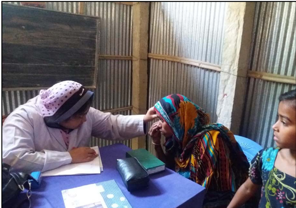
Medical health check-up at Sorupdaho village...