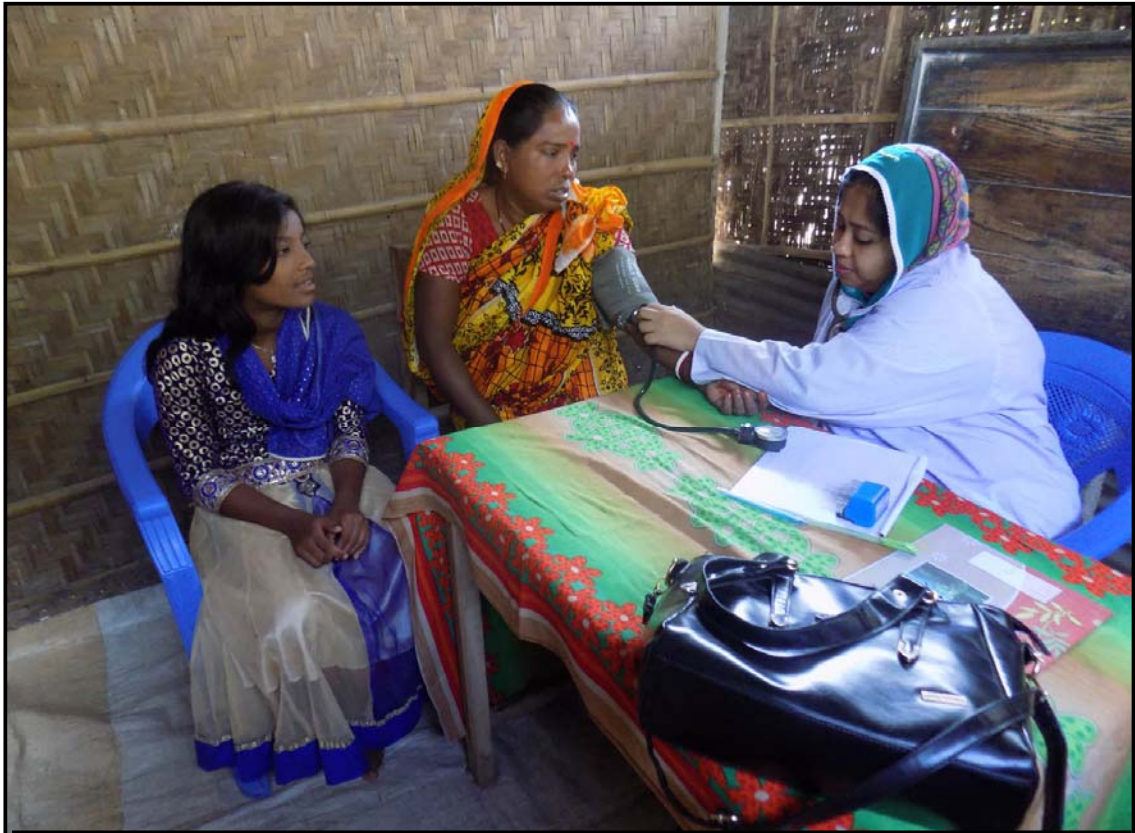
Medical health check-up at Churamankati village.....