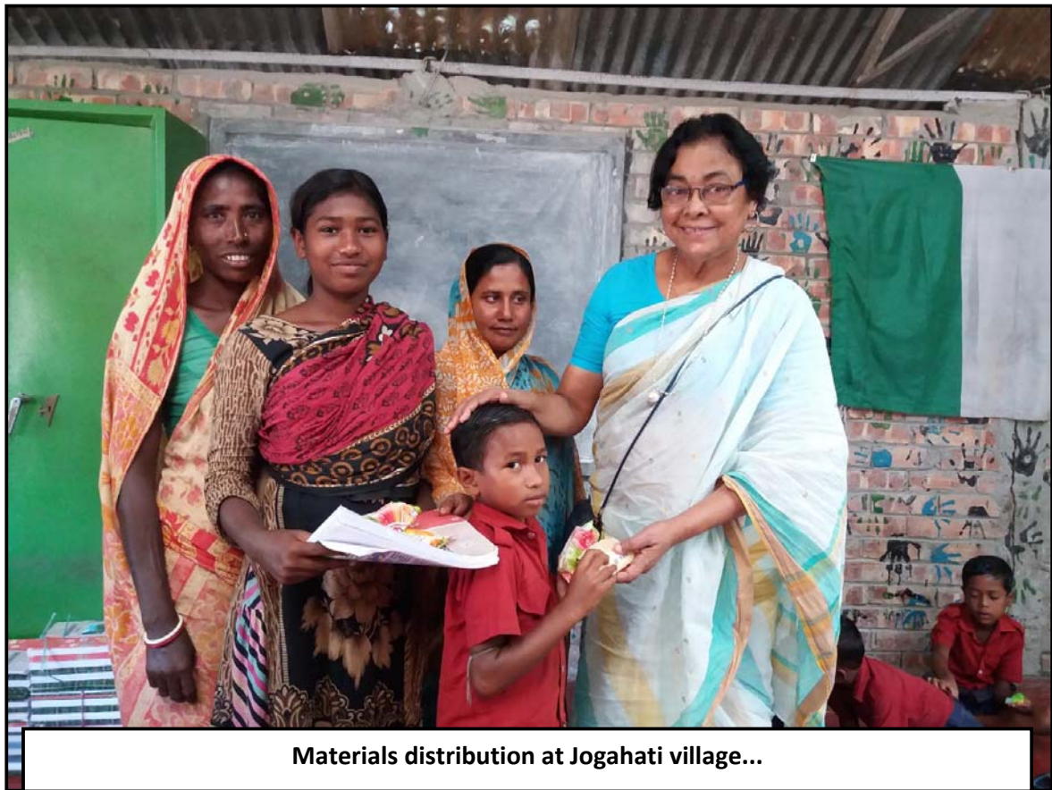
Materials distribution at Jogahati village...