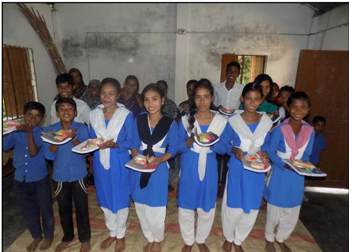
Happy faces in Mohishati with materials...