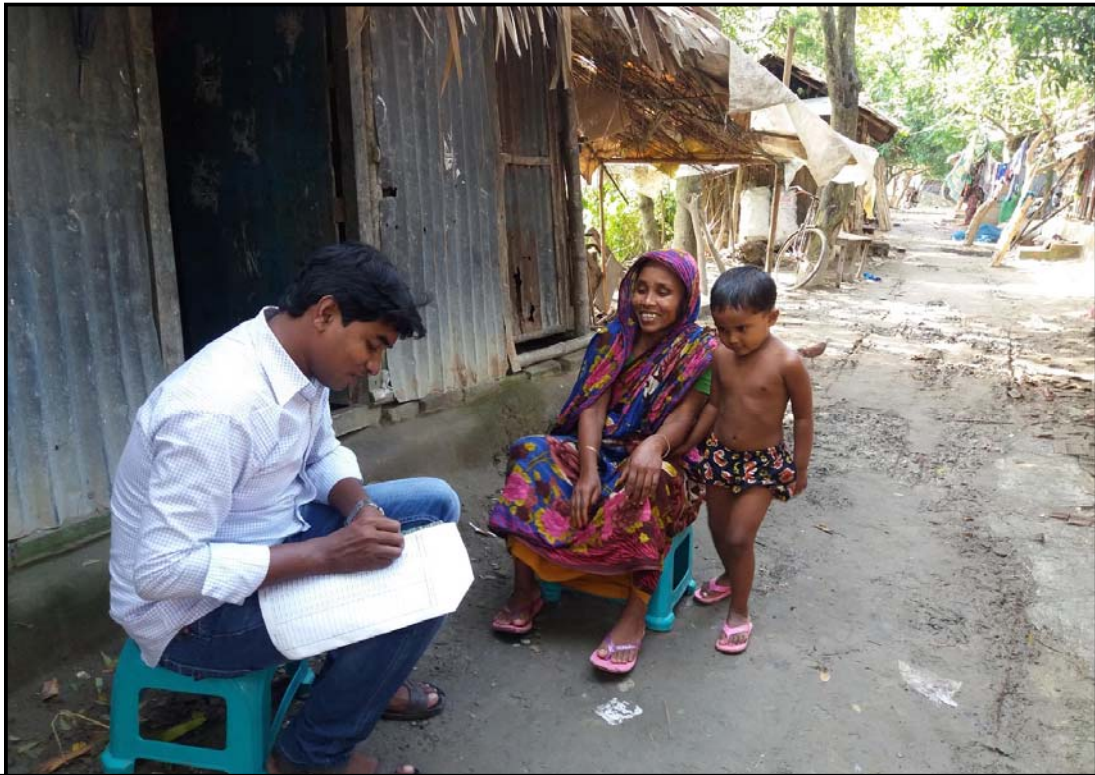
Community survey for the medical health check-up...