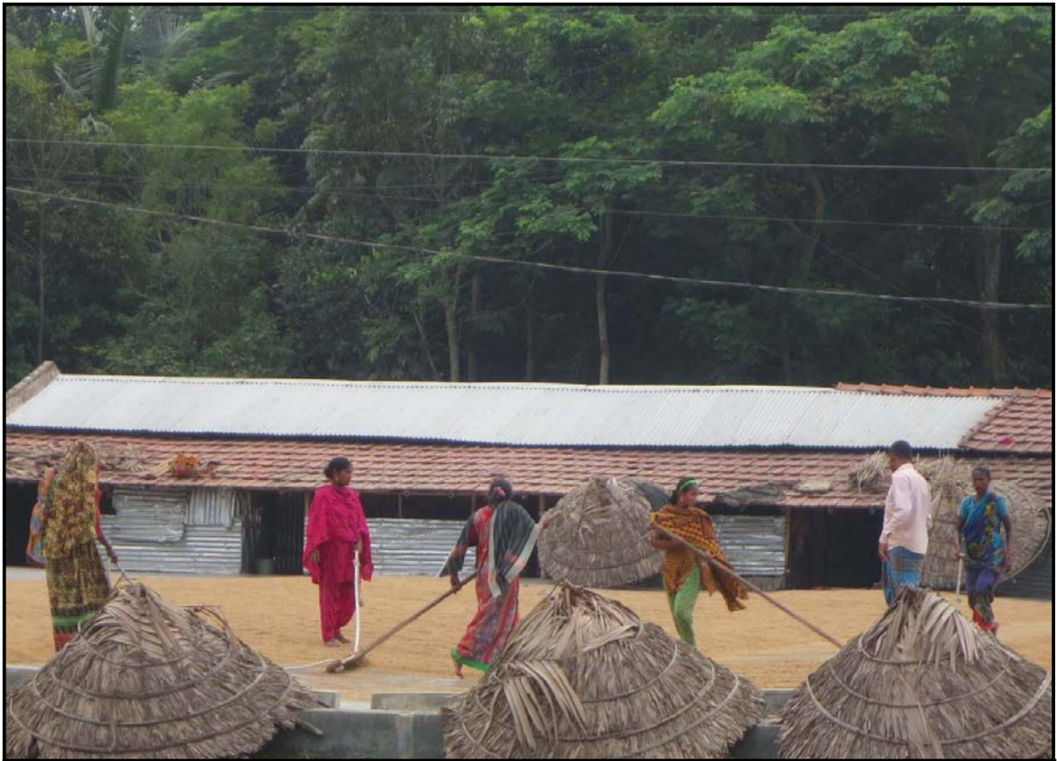
Women empowerment: Our community women working in the rice mill...