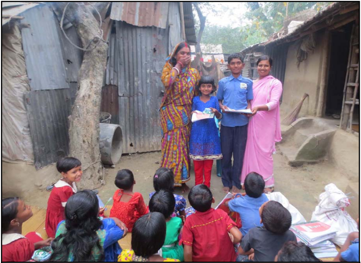
Materials distribution at Churamankati...