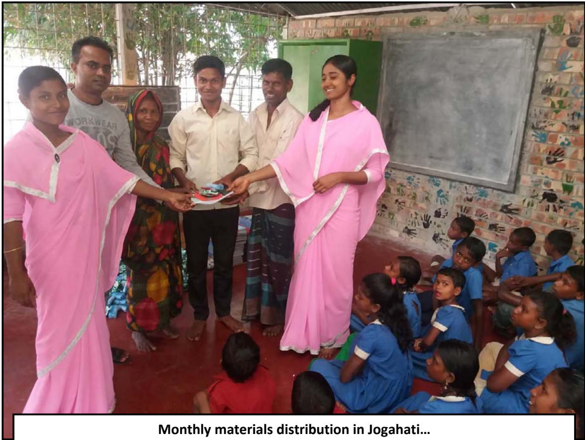
Monthly materials distribution in Jogahati...