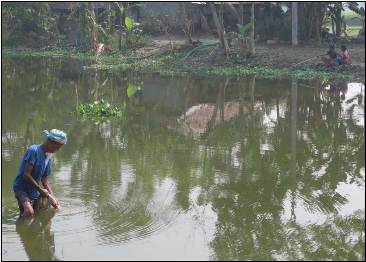
Catching fish at community...