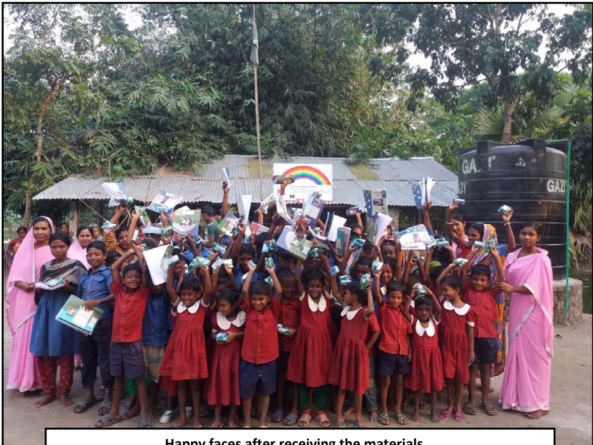
Happy faces after receiving the materials...