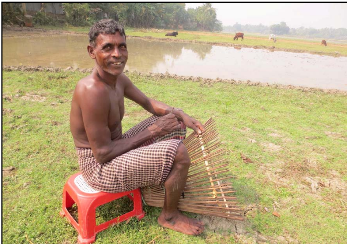
Sorupdaho community member preparing fishing net with bamboo...