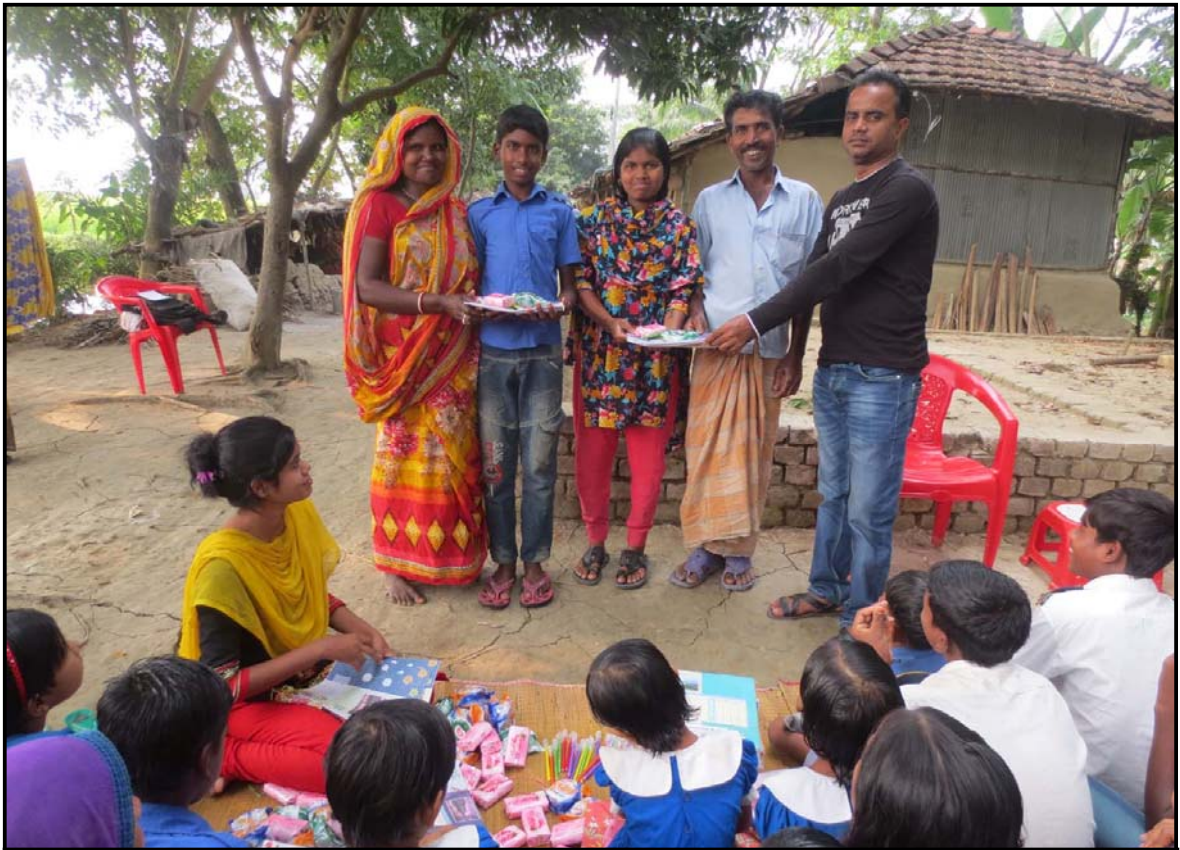
Materials distribution at Sorupdaho...