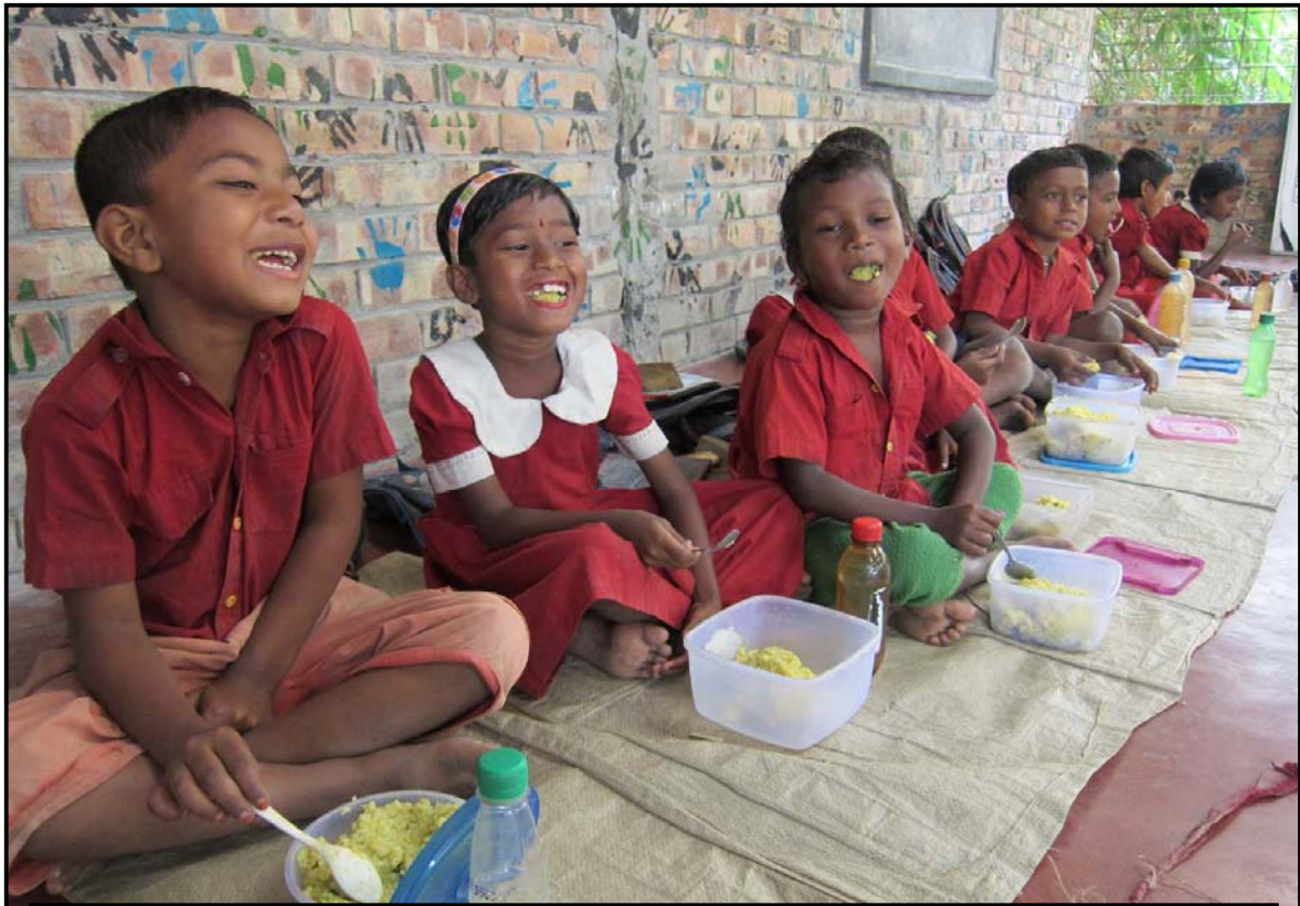
Pre-school kids enjoying the daily hot meal...