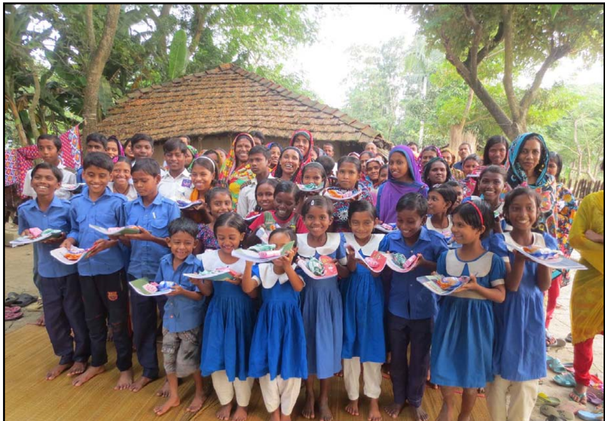
Happy parents and children in Sorupdaho...