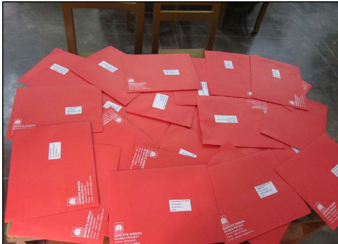
Greetings envelop ready to post...