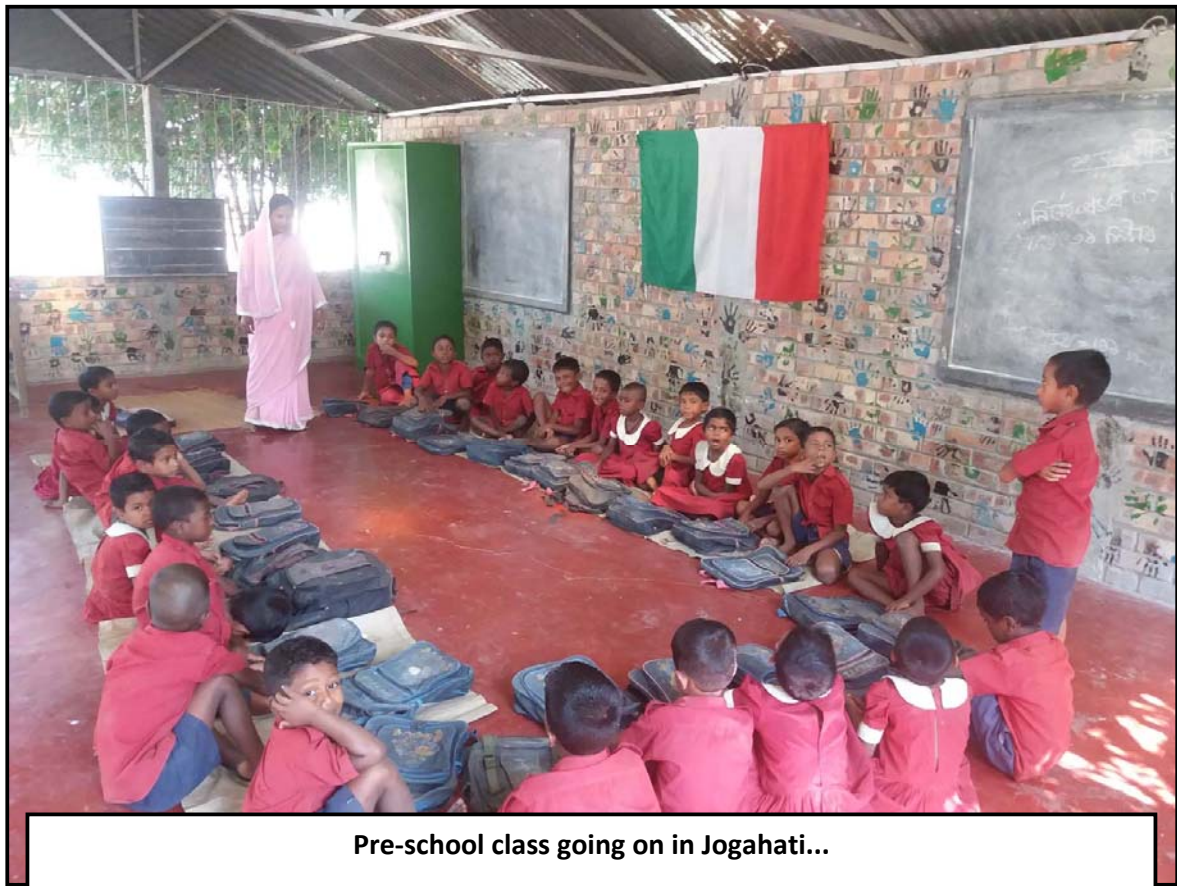
Pre-school class going on in Jogahati...