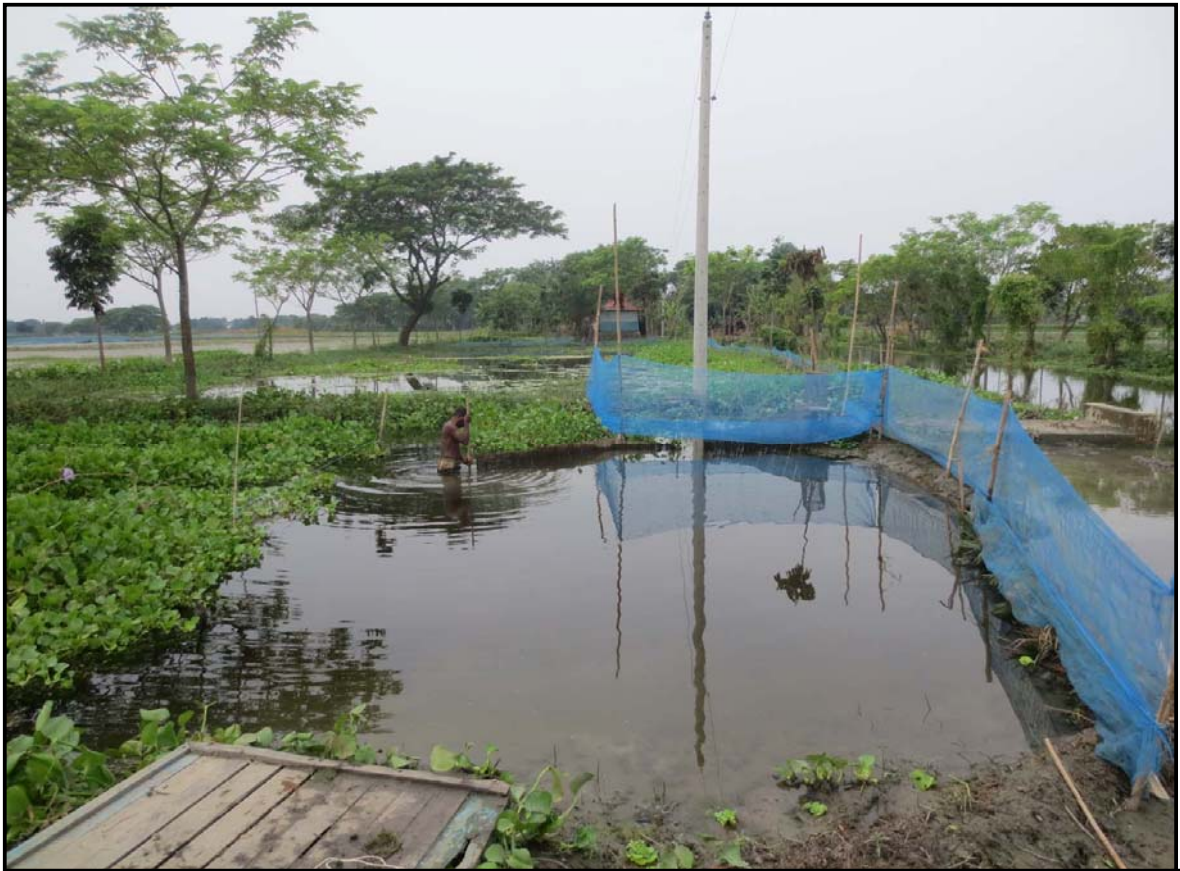
Fishing at Sorupdaho...