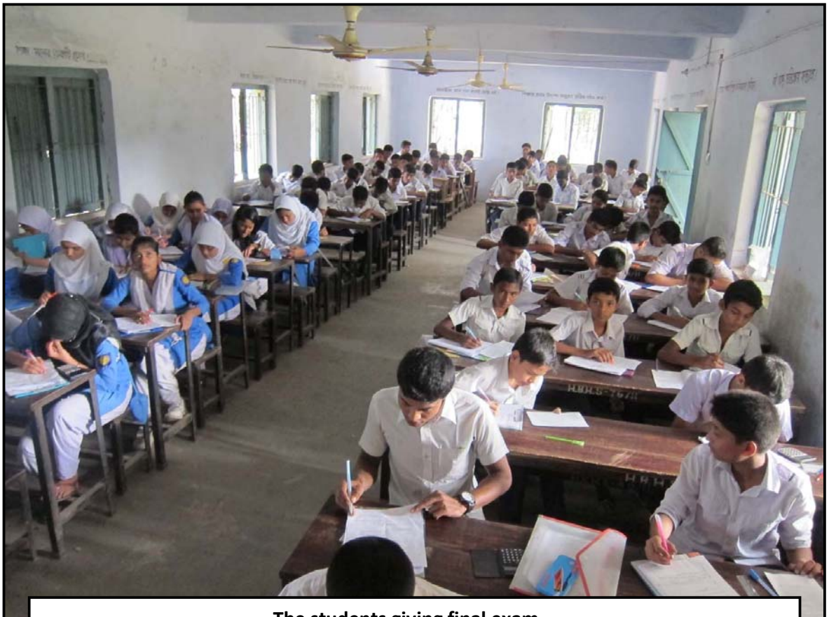
The students giving final exam...