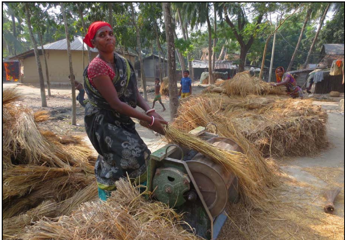
Women empowerment: Our community women working in the rice husking...