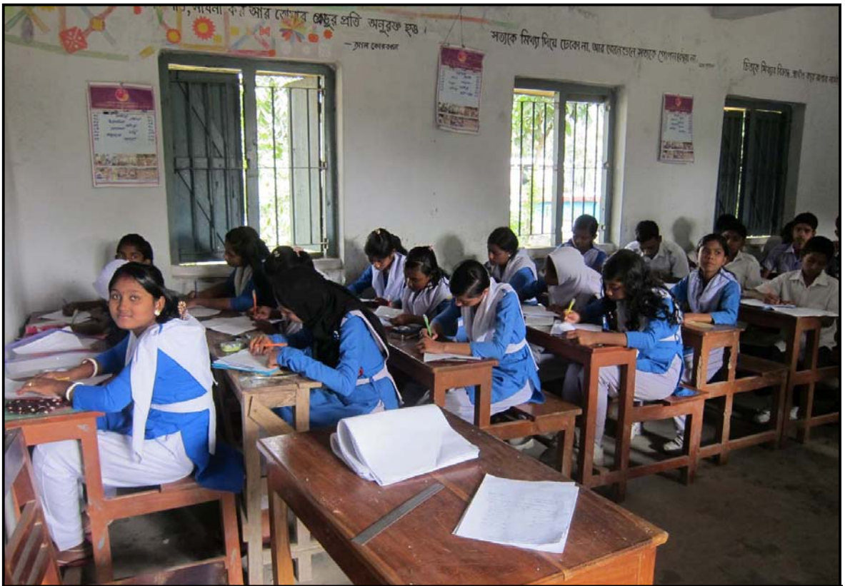
School class final exam going on...