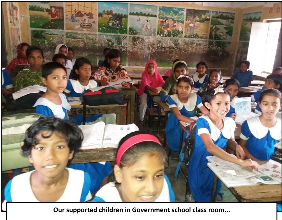
Our supported children in Government school class room...