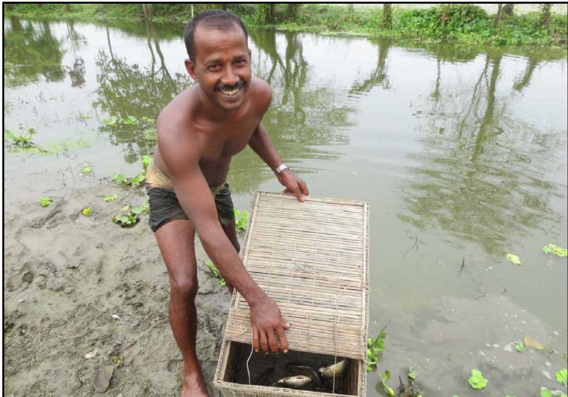
Catches fish by the Sorupdaho community member...