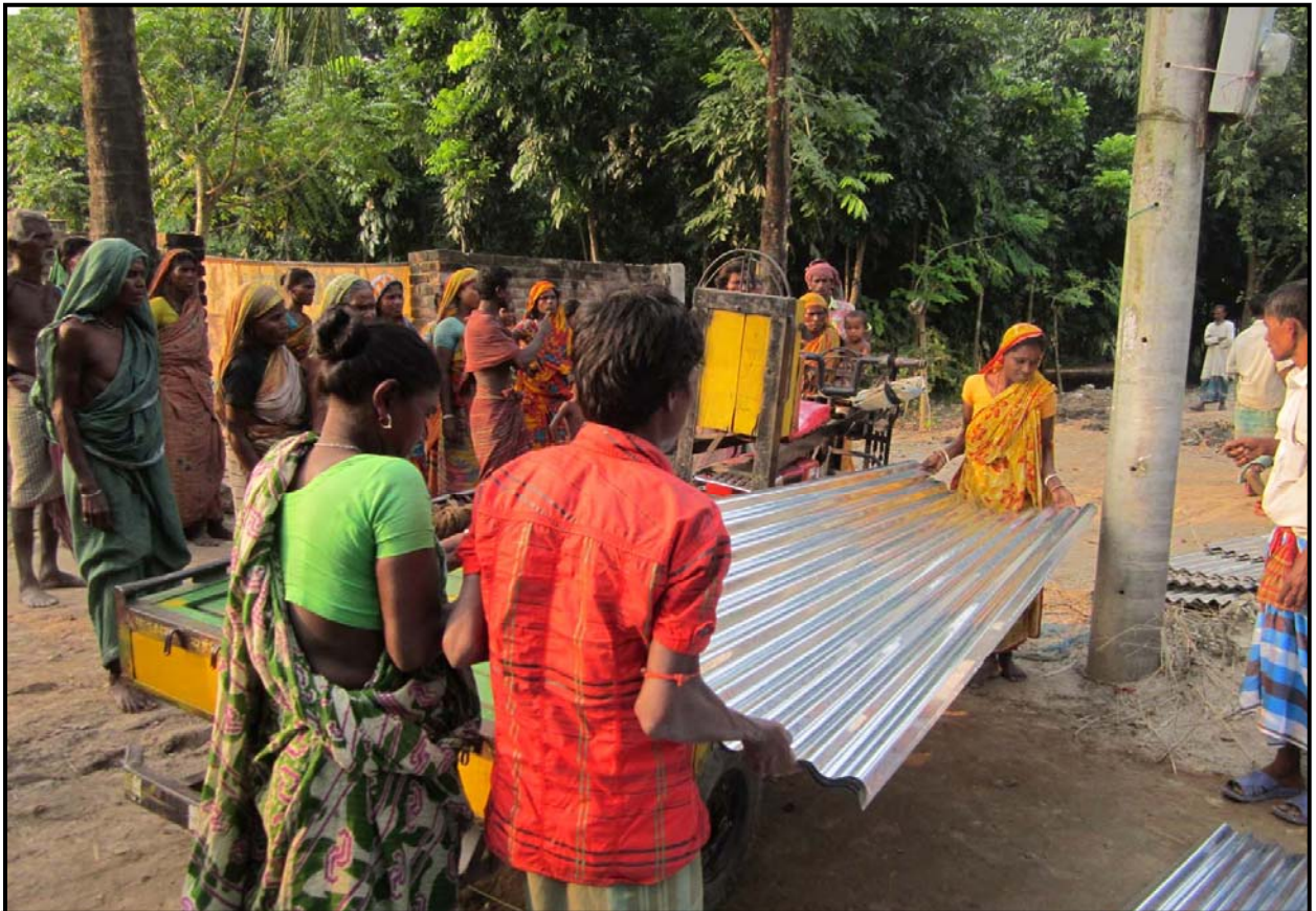
Jogahati family members receiving tin for roof...