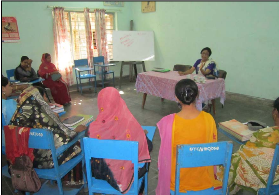
Monthly teacher's coordination meeting at BS Office...