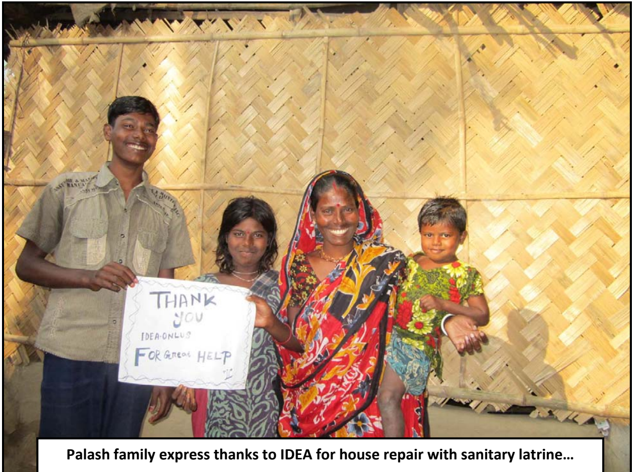
Palash family express thanks to IDEA for house repair with sanitary latrine...