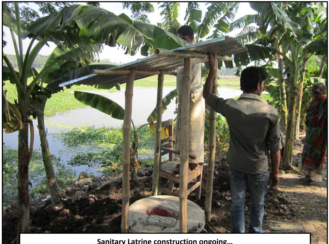
Sanitary Latrine construction ongoing...