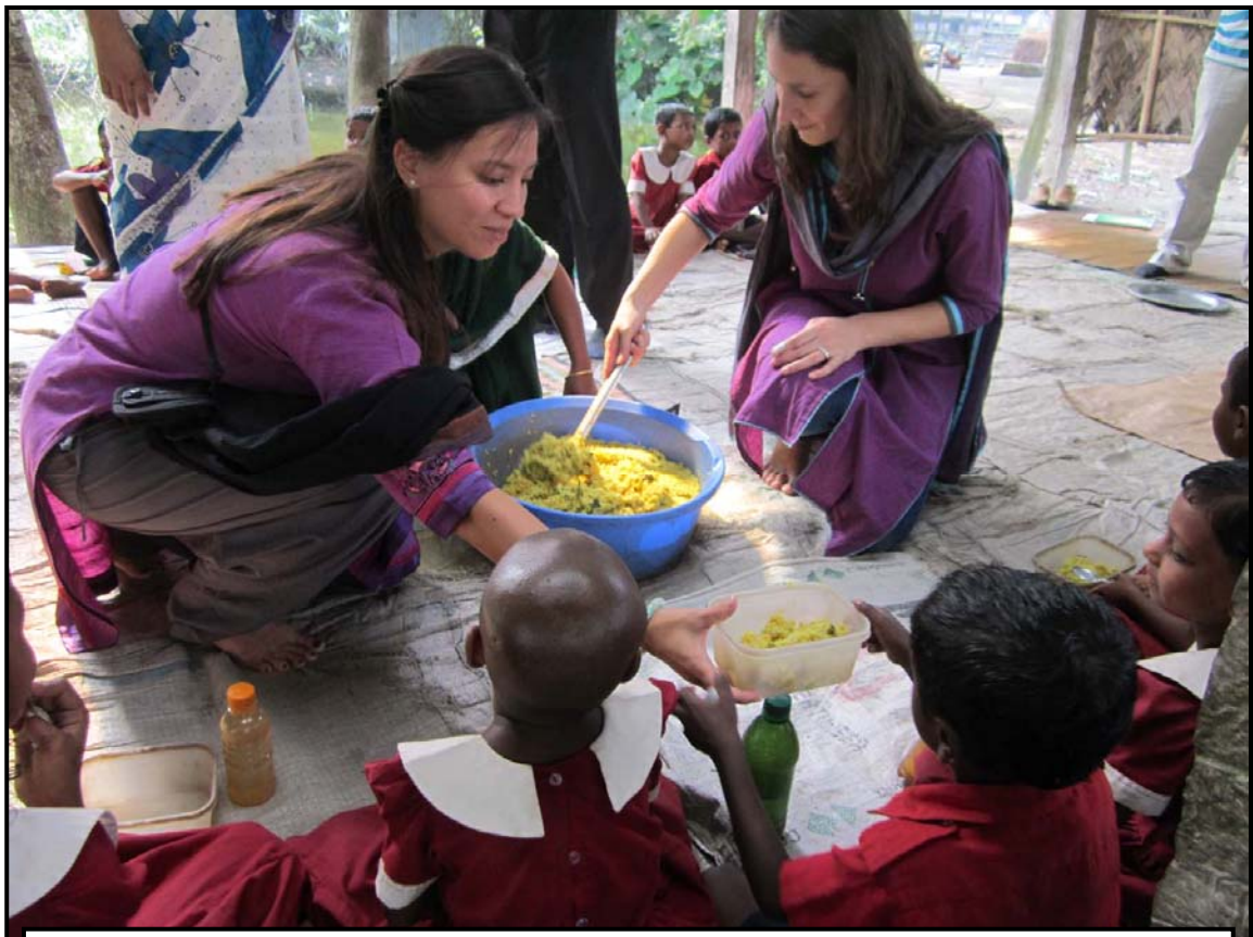
Swiss visitors distributing warm foods to the Pre-school Children...