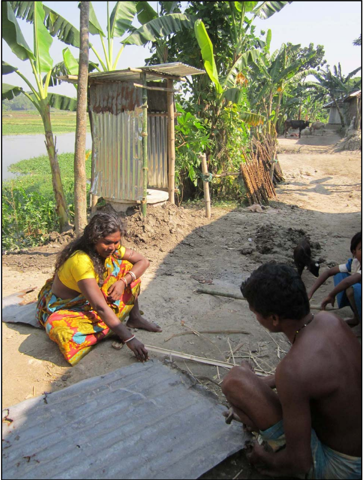
Uzzol family preparing the materials for toilet construction...