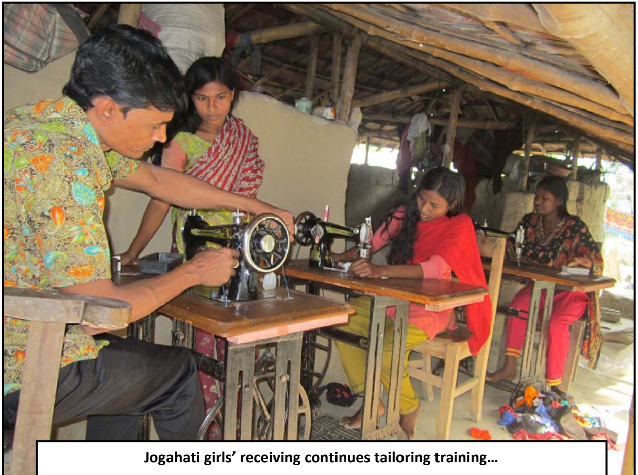
Jogahati girls' receiving continues tailoring training...