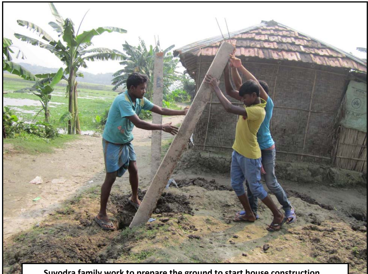
Suvodra family work to prepare the ground to start house construction...