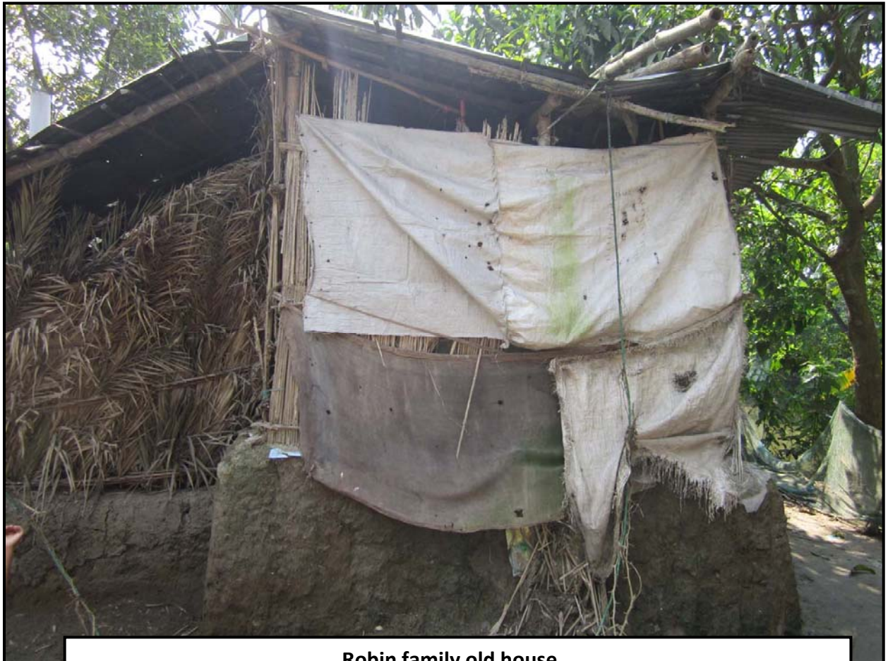
Robin family old house...