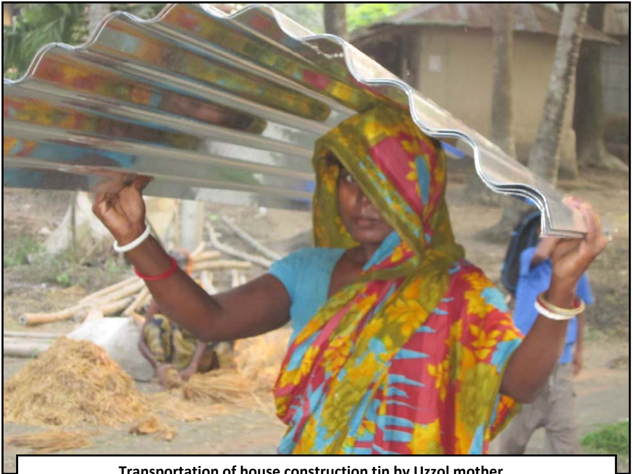
Transportation of house construction tin by Uzzol mother...