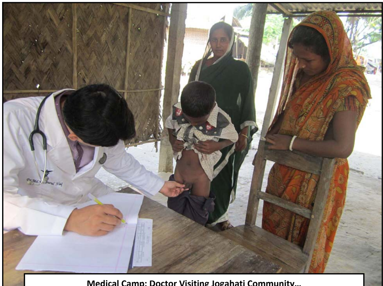
Medical Camp: Doctor Visiting Jogahati Community...