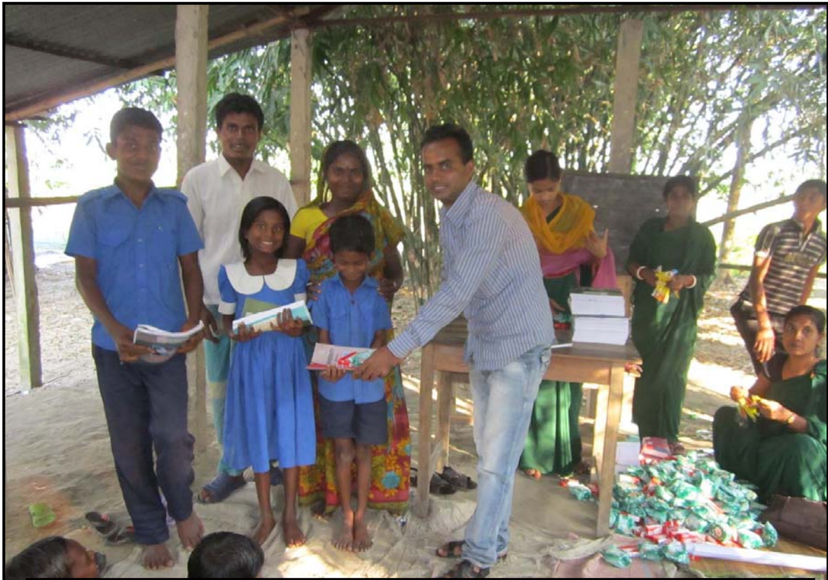
Materials distribution programme at Jogahati...