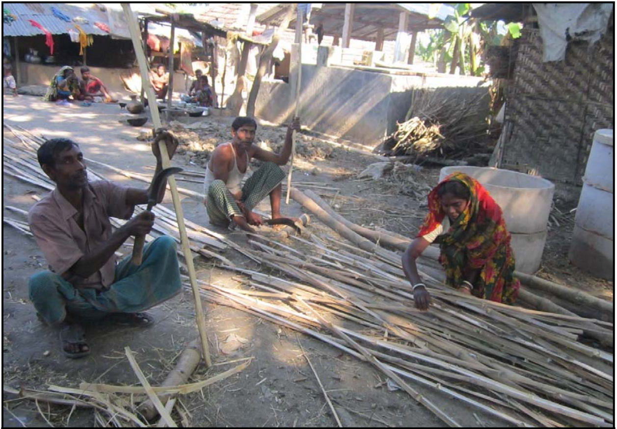
Uzzol family preparing the materials for house construction...