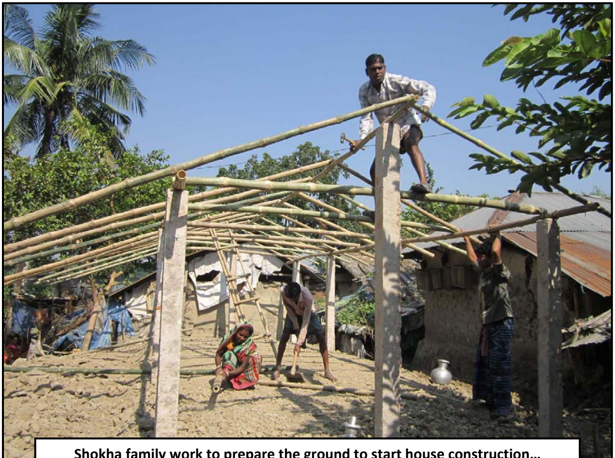
Shokha family work to prepare the ground to start house construction...