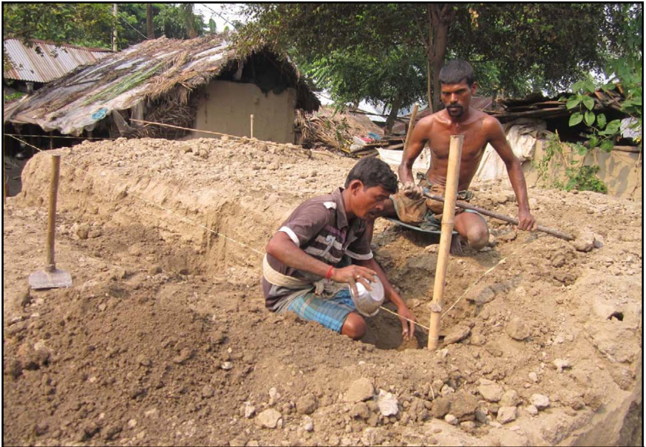
Chaitonno family work to prepare the ground to start house construction...