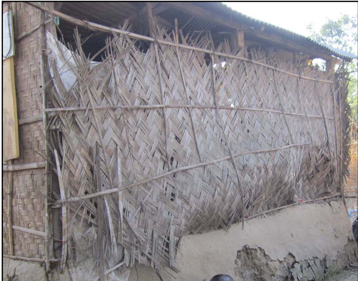
Palash family old house...