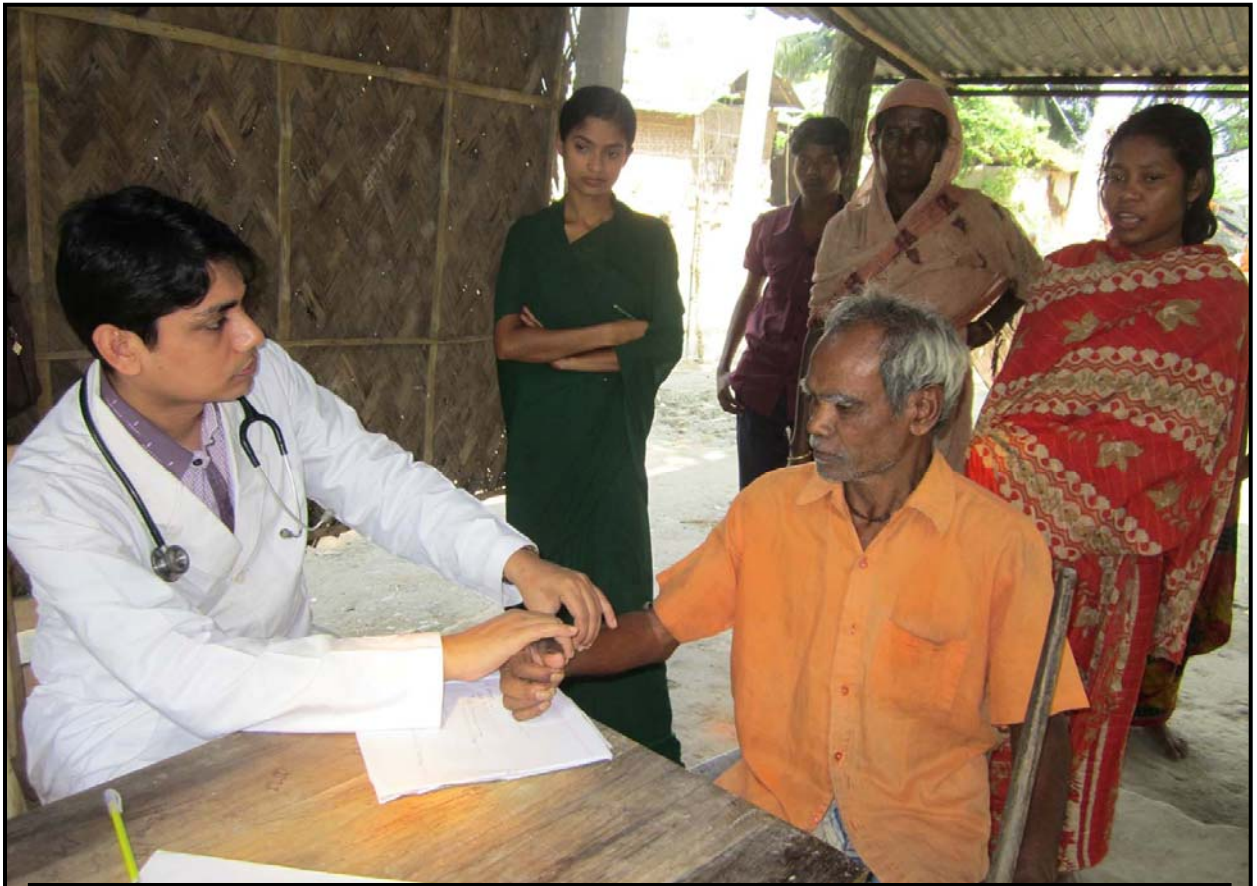
Medical Camp: Doctor Visiting Jogahati Community...