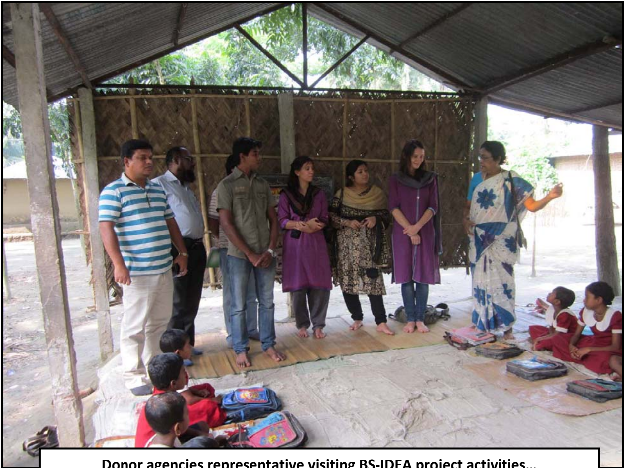
Donor agencies representative visiting BS-IDEA project activities...