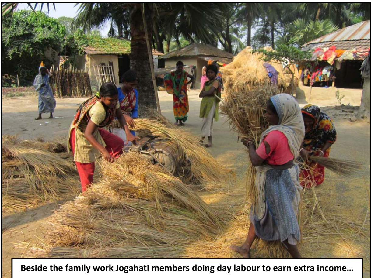
Beside the family work Jogahati members doing day labour to earn extra income...