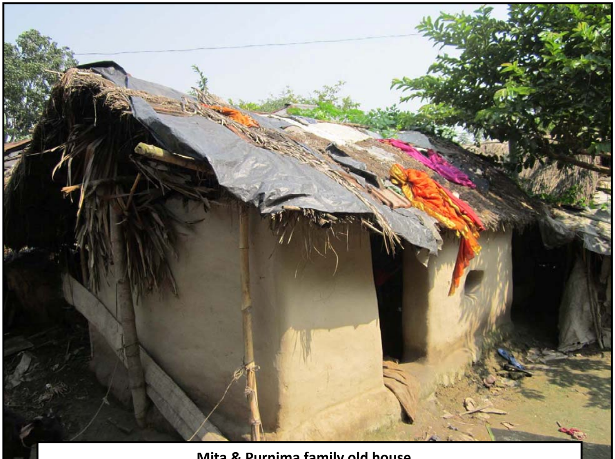
Mita & Purnima family old house...