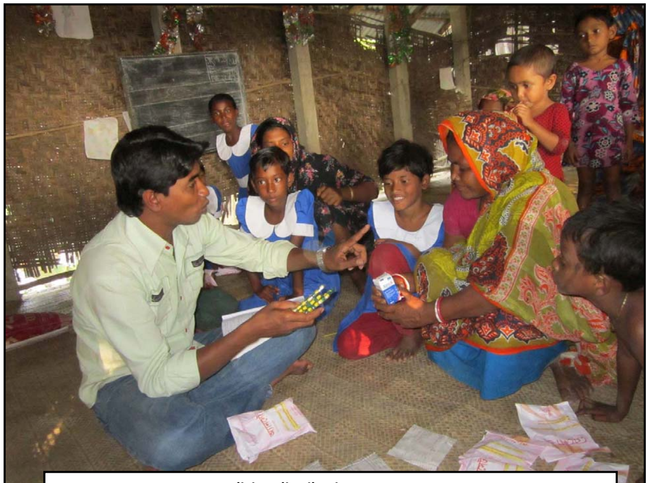
Medicine distribution programme...