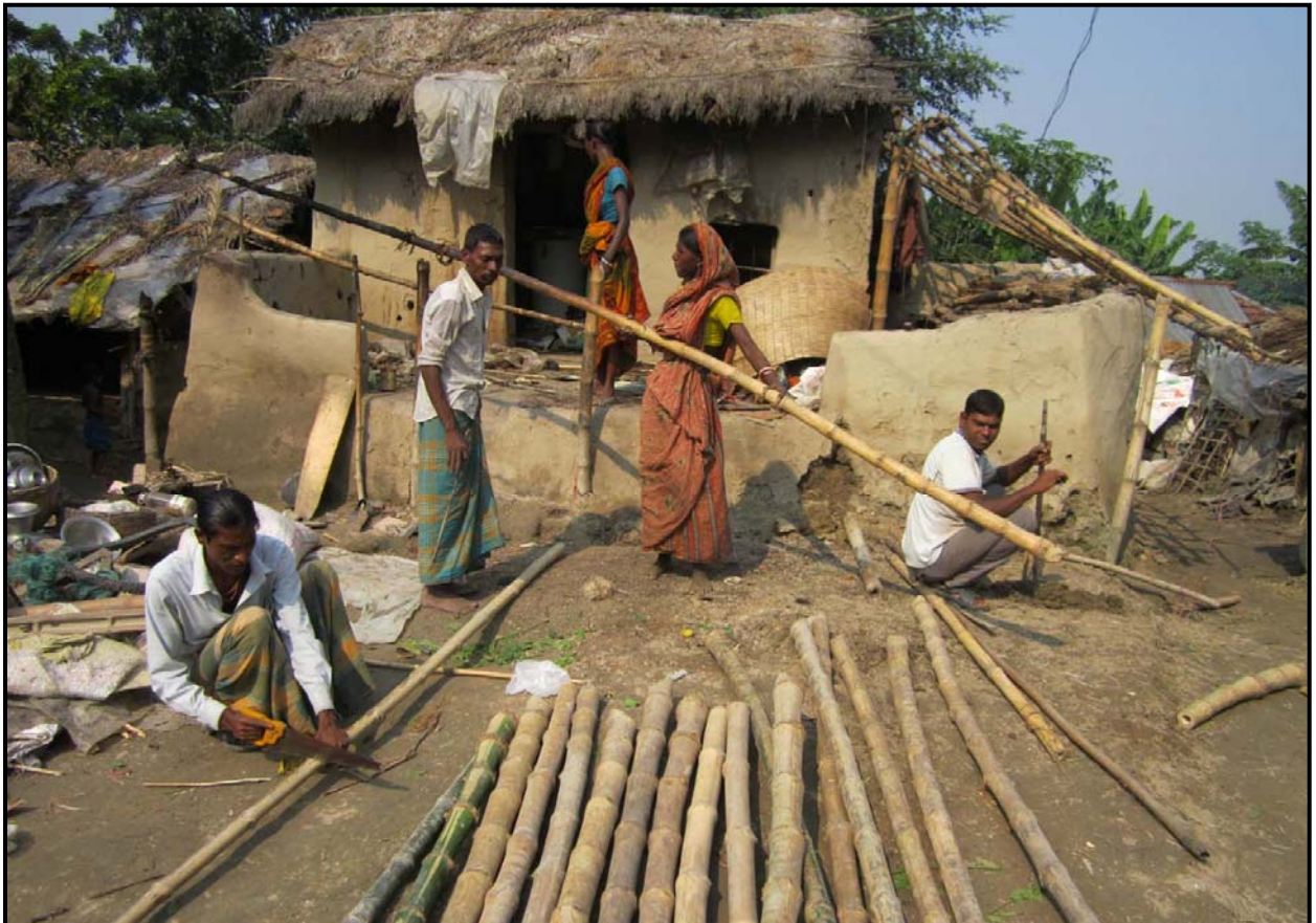
Chuti Rani family preparing the materials for house construction...