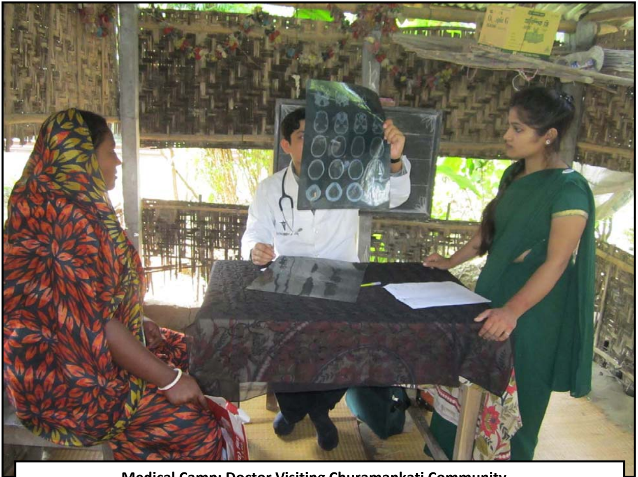
Medical Camp: Doctor Visiting Churamankati Community...