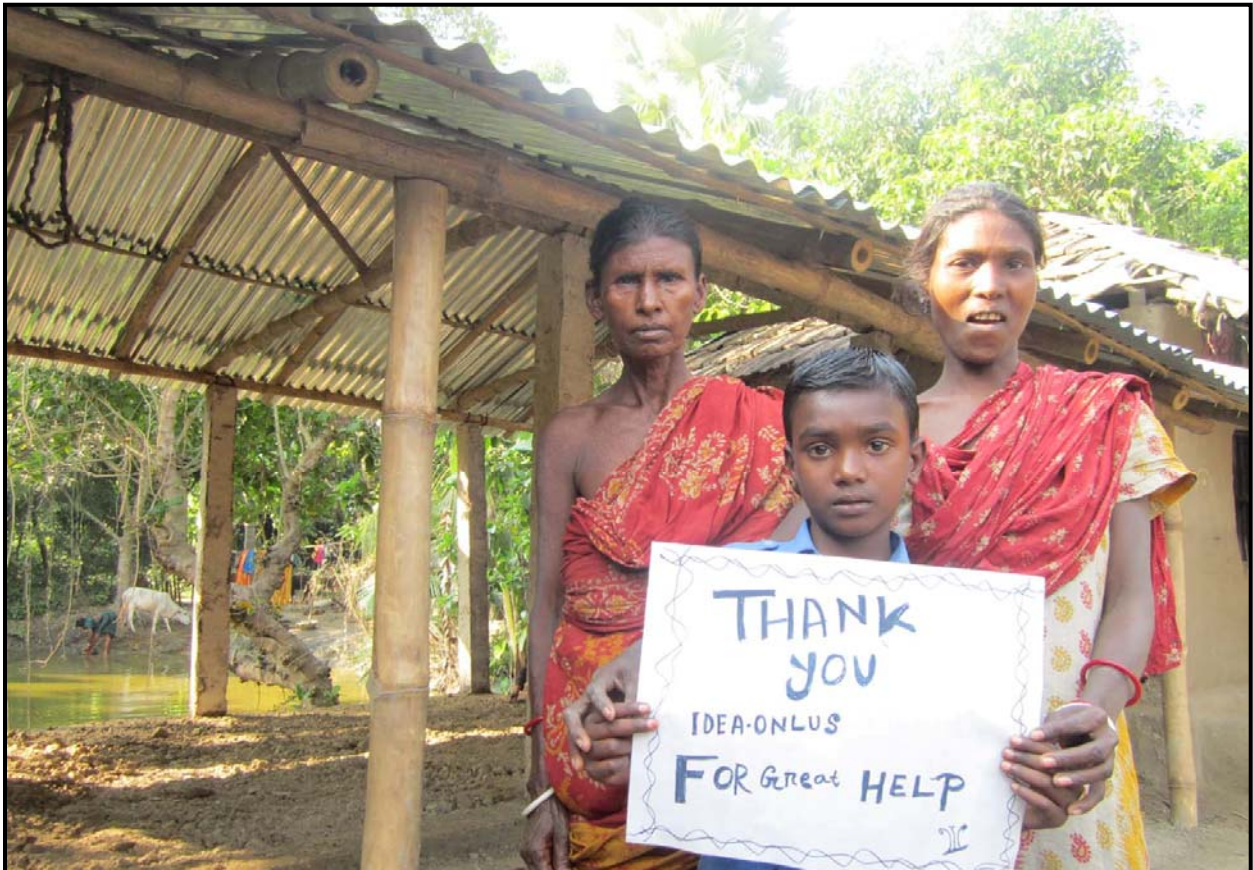
Robin family express thanks to IDEA for new house with sanitary latrine...