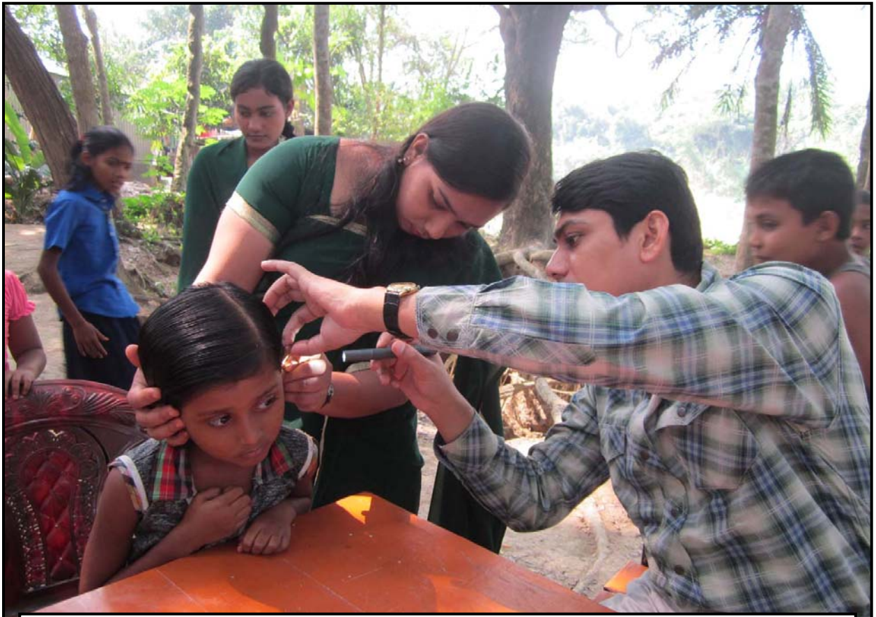
Medical Camp at Mohishati Community: Doctor Visiting...