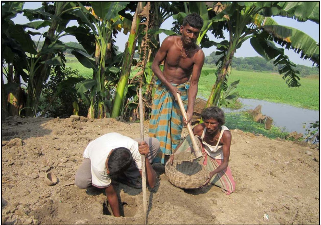
Madhob family work to prepare the ground to start house construction...