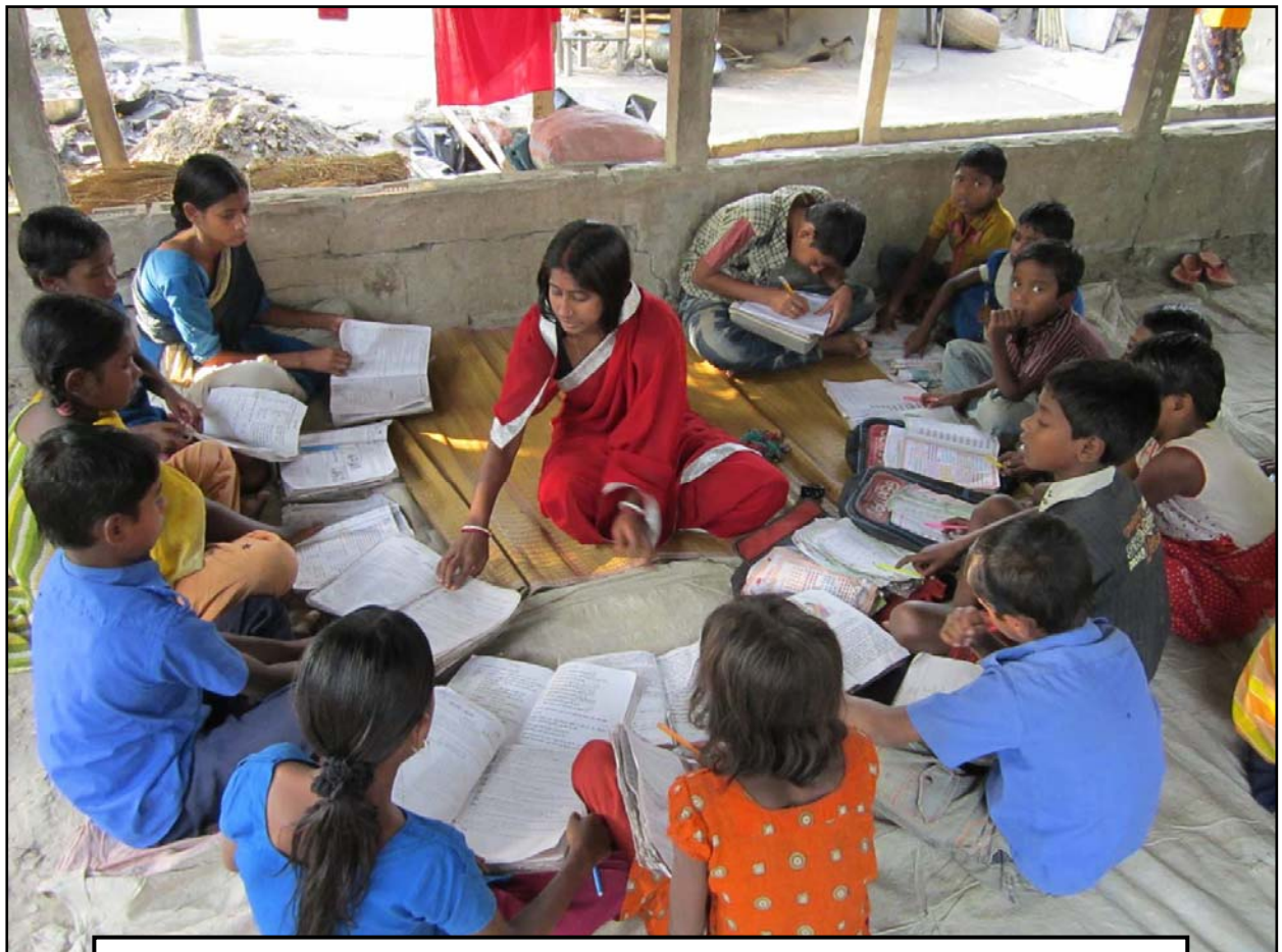
Tuition Programme at Jogahati Village...