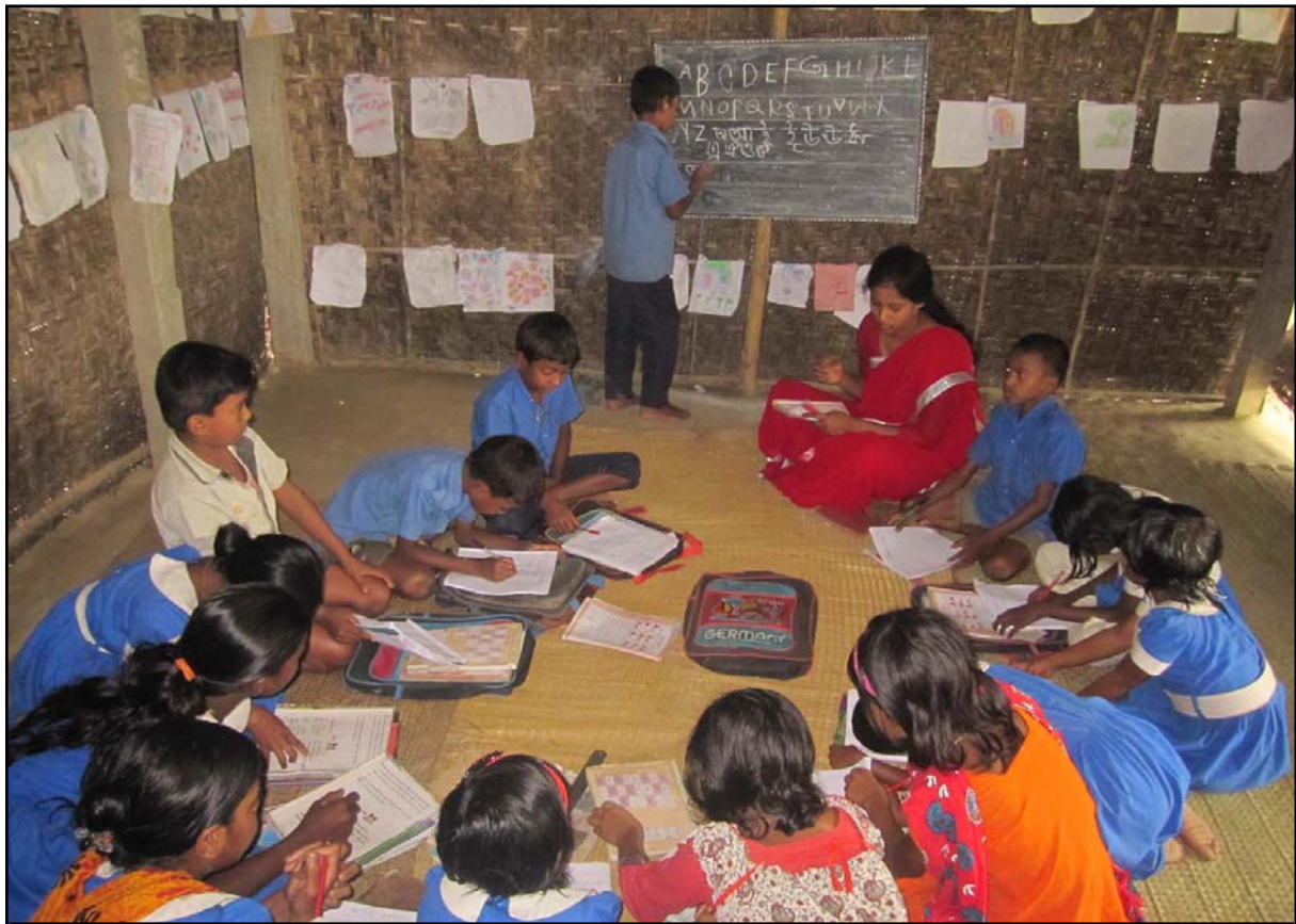
Tuition Programme at Sorupdaho Village.....