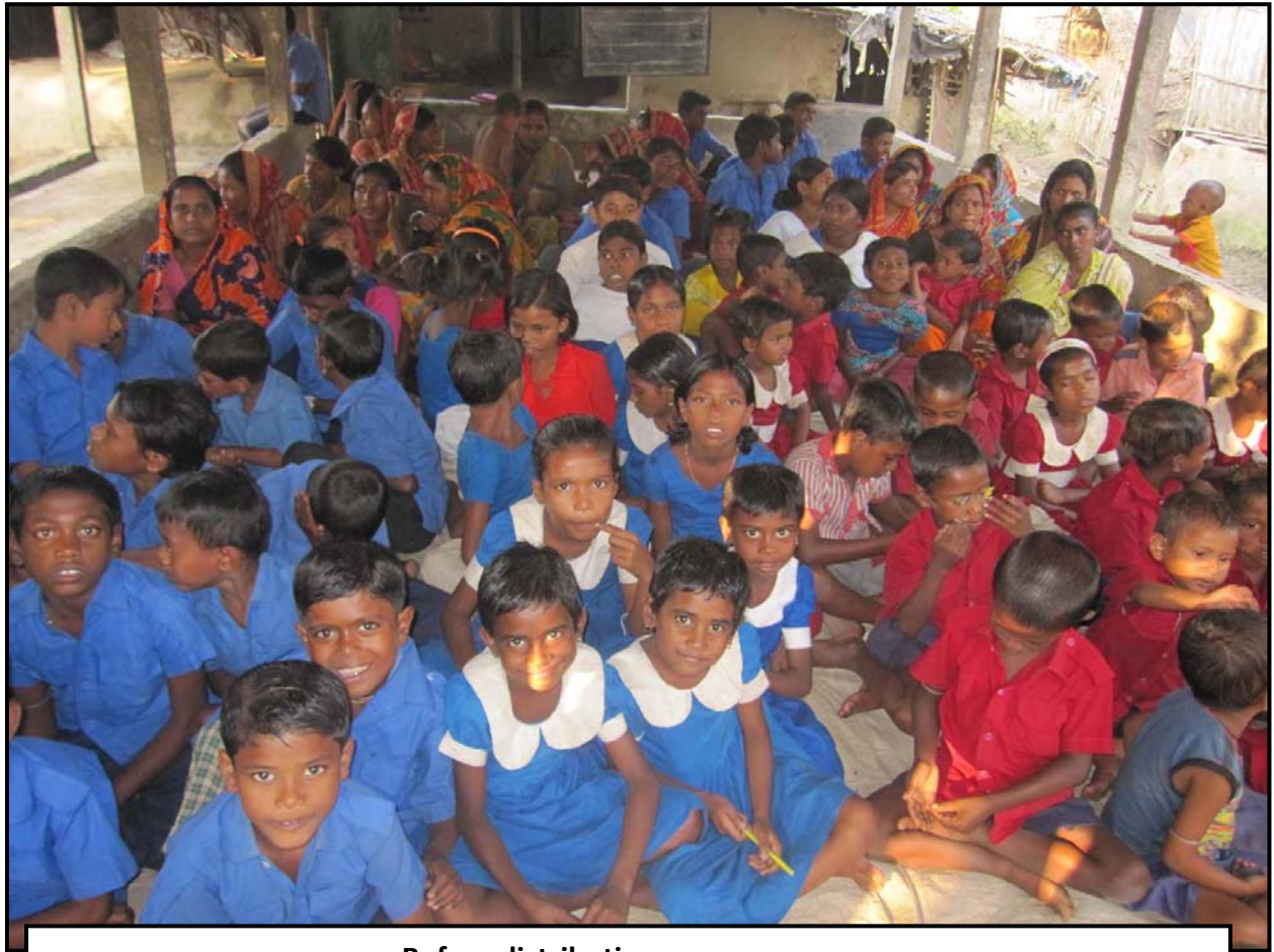
Before distribution programme....