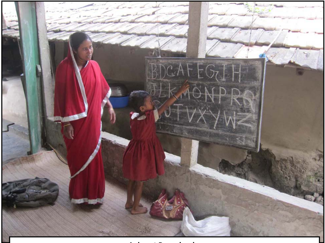
A day at Pre-school...