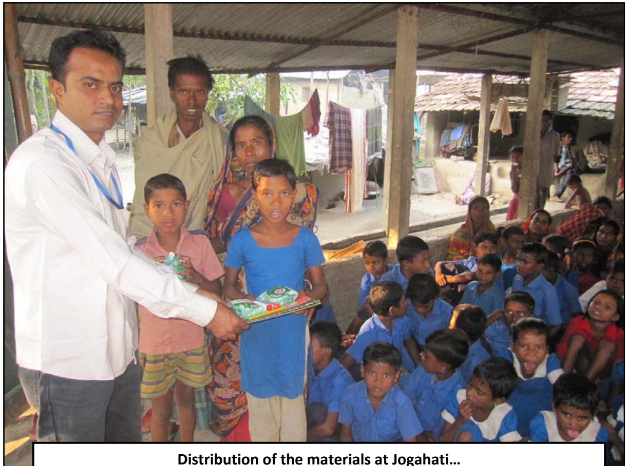
Distribution of the materials at Jogahati...