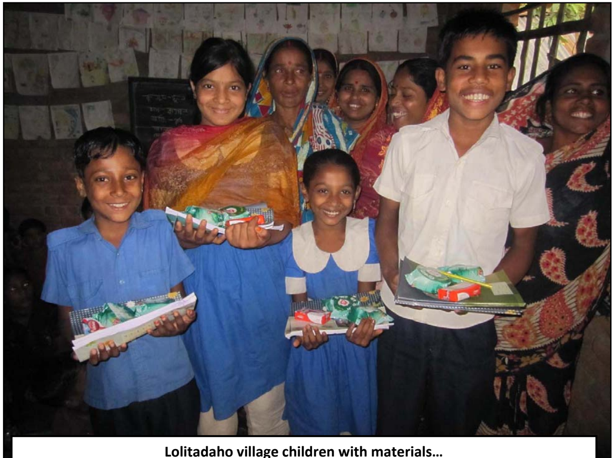
Lolitadaho village children with materials...