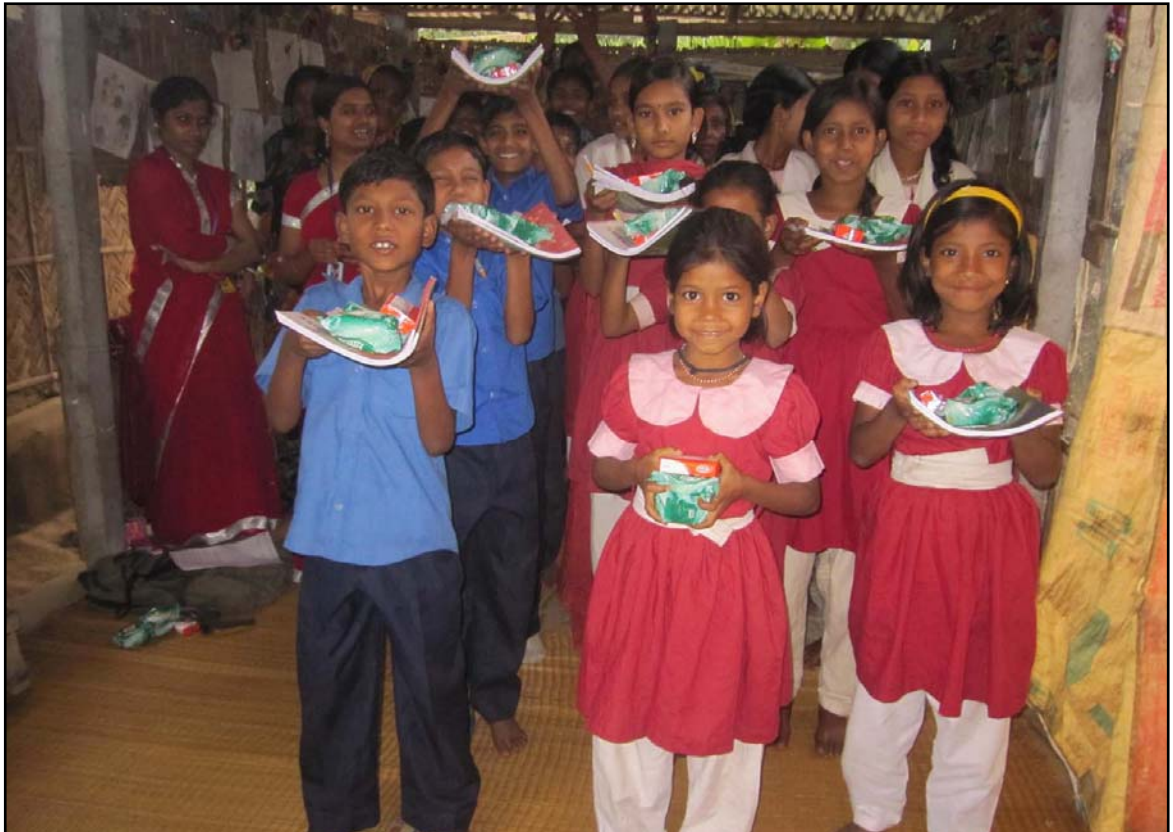
Churamankati village children with materials...