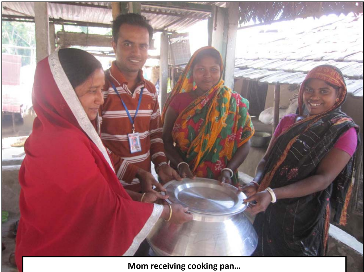
Mom receiving cooking pan...