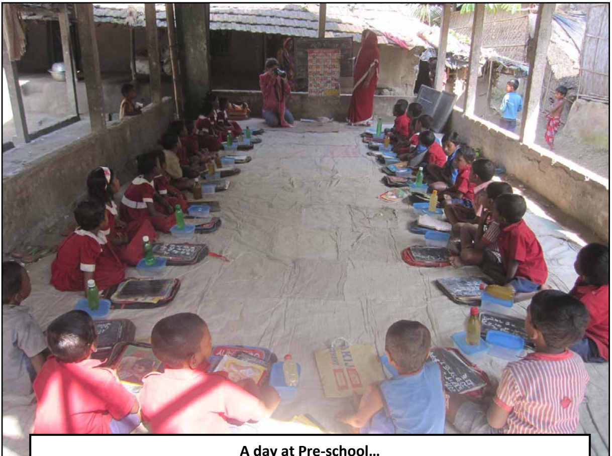
A day at Pre-school...