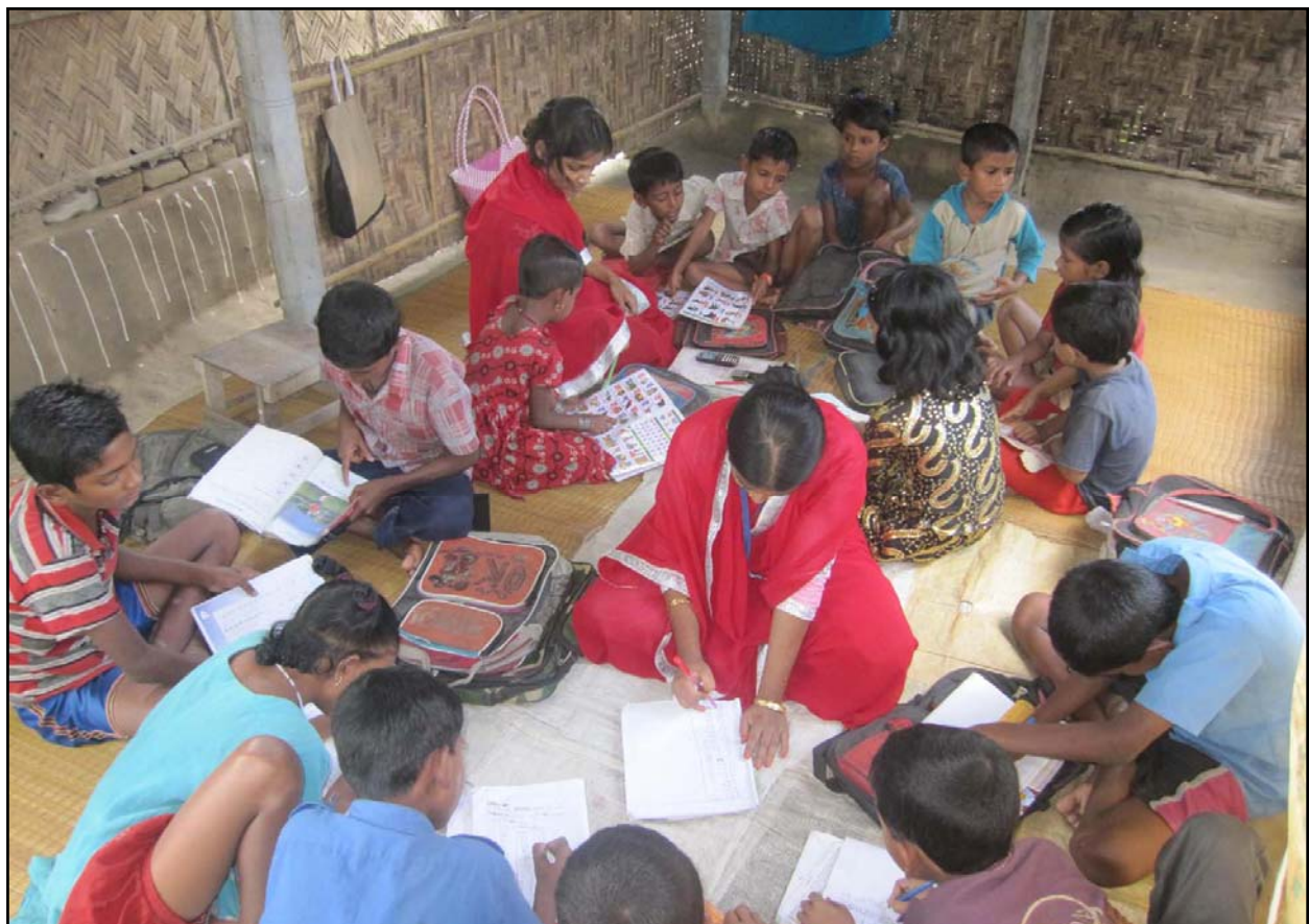
Tuition Programme at Churamankati Village.....