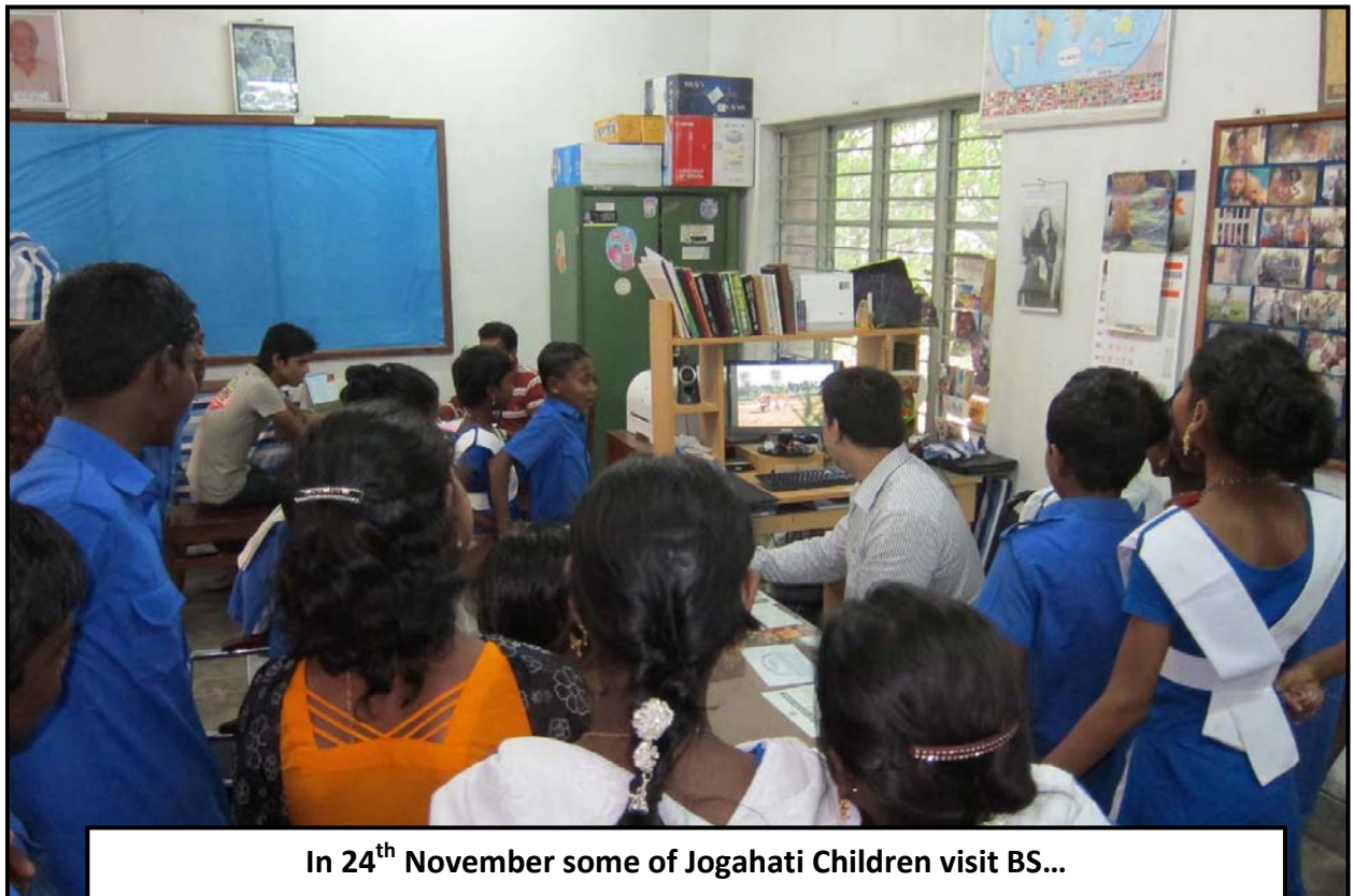
In 24 th November some of Jogahati Children visit BS...