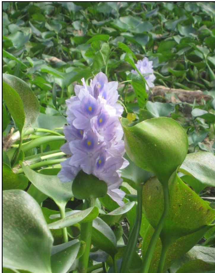
Water Lettuce at Jogahati pond...