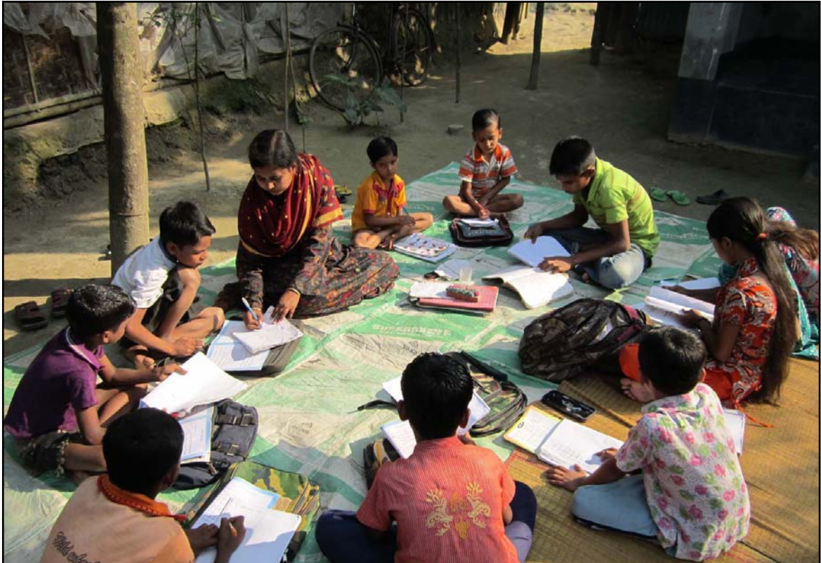
Tuition Programme at Lolitadaho Village...