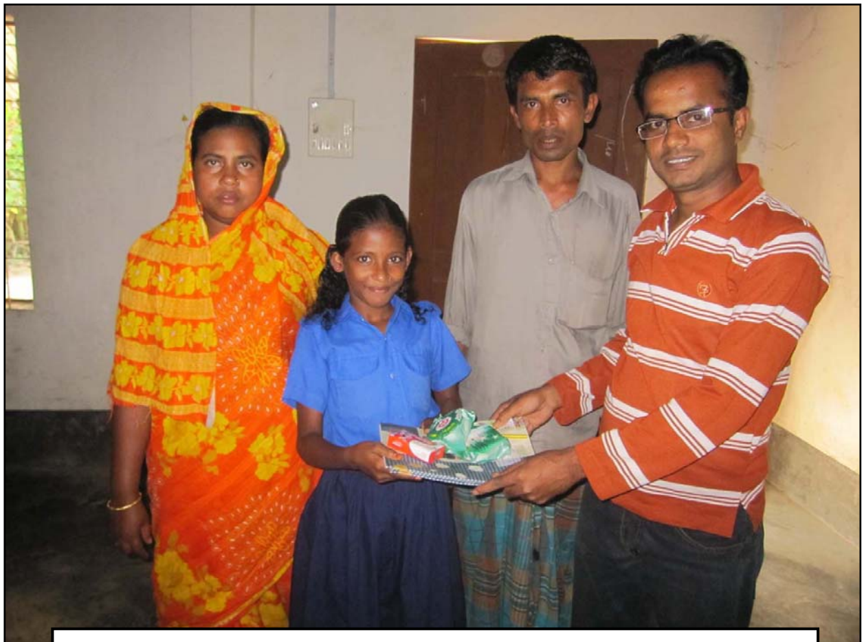
Distribution of the materials at Mohishati village.....