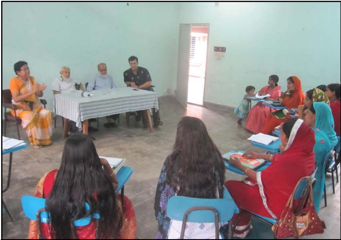
Tuition Teachers Monthly Coordination Meeting...