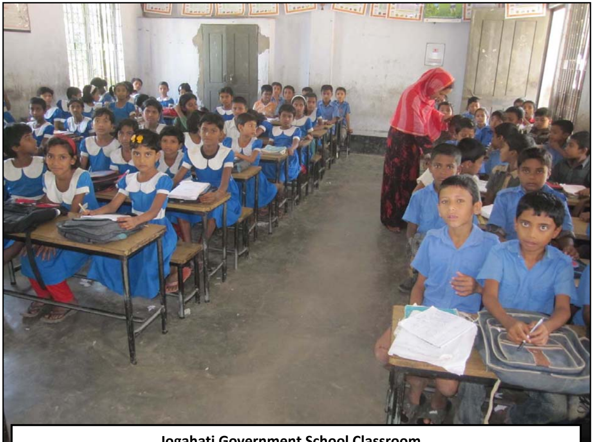
Jogahati Government School Classroom...