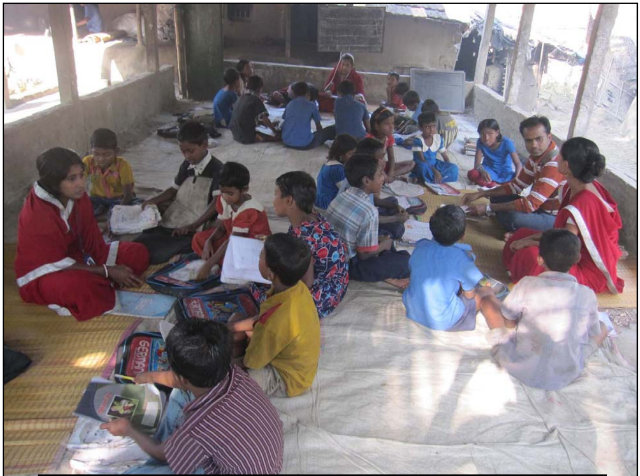
Tuition class at Jogahati...