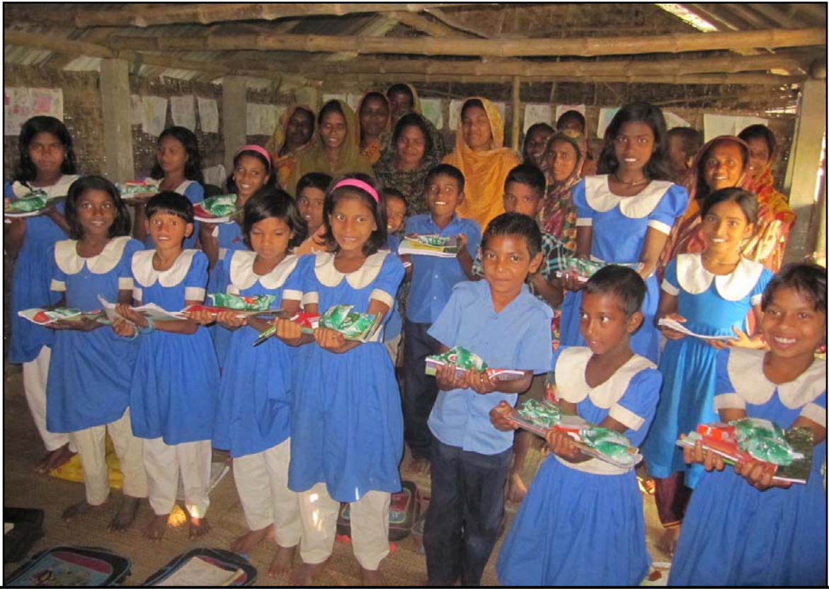
Sorupdaho village children with materials...