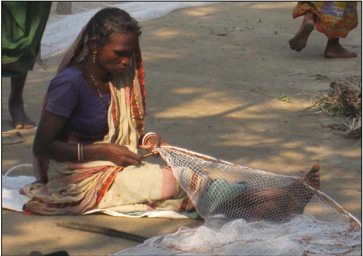
Jogahati villager repairing fishing net...