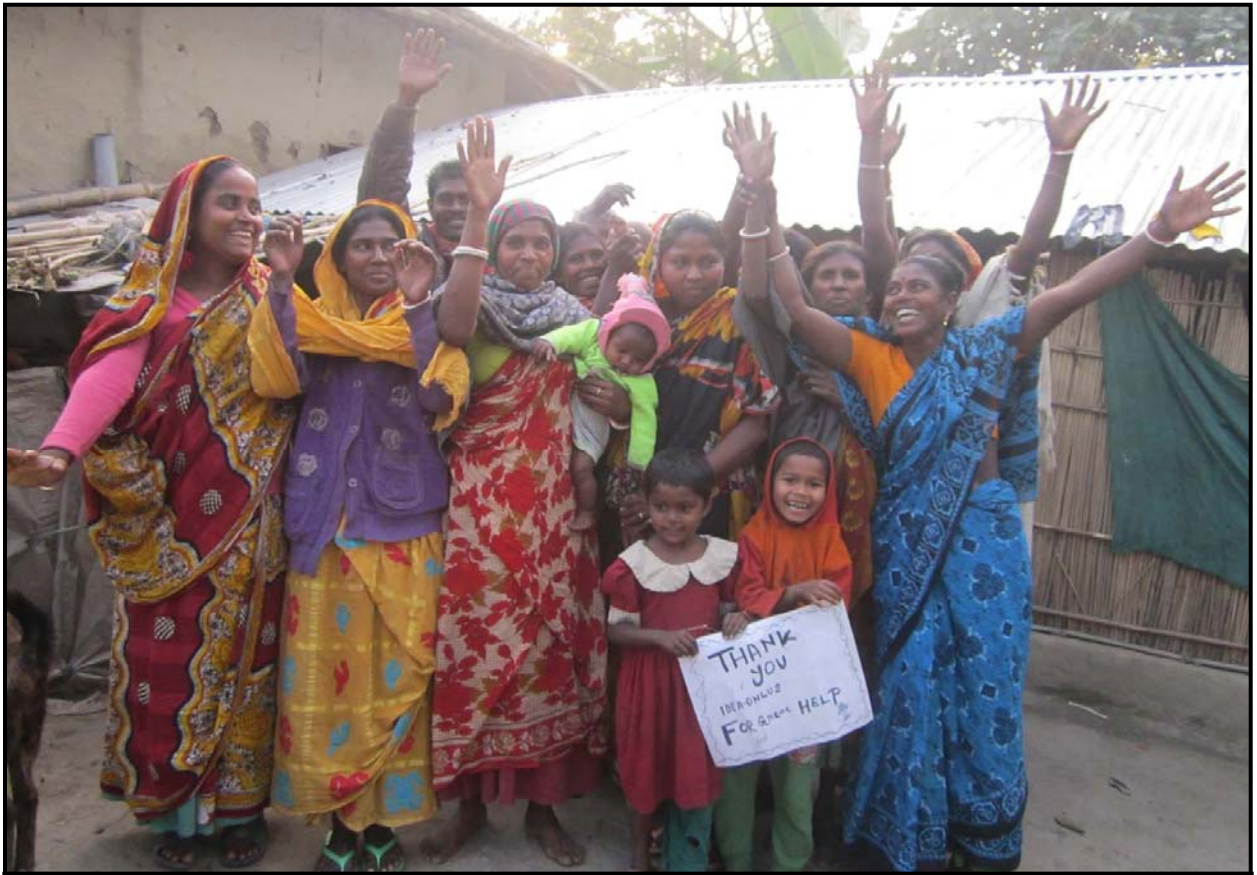
The happy families express their thanks and greetings to IDEA...