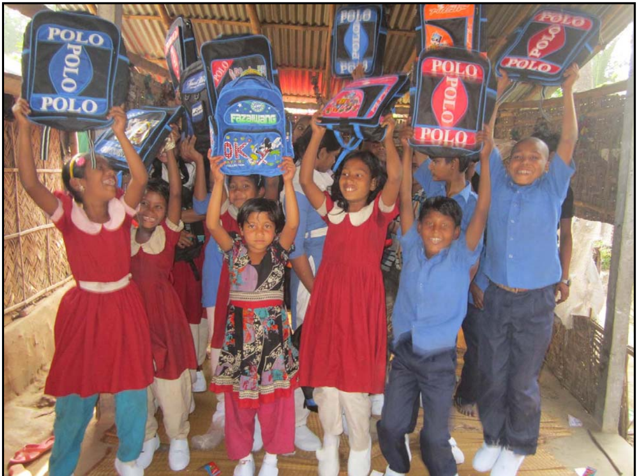
Churamankati Community: Happy students with new materials...