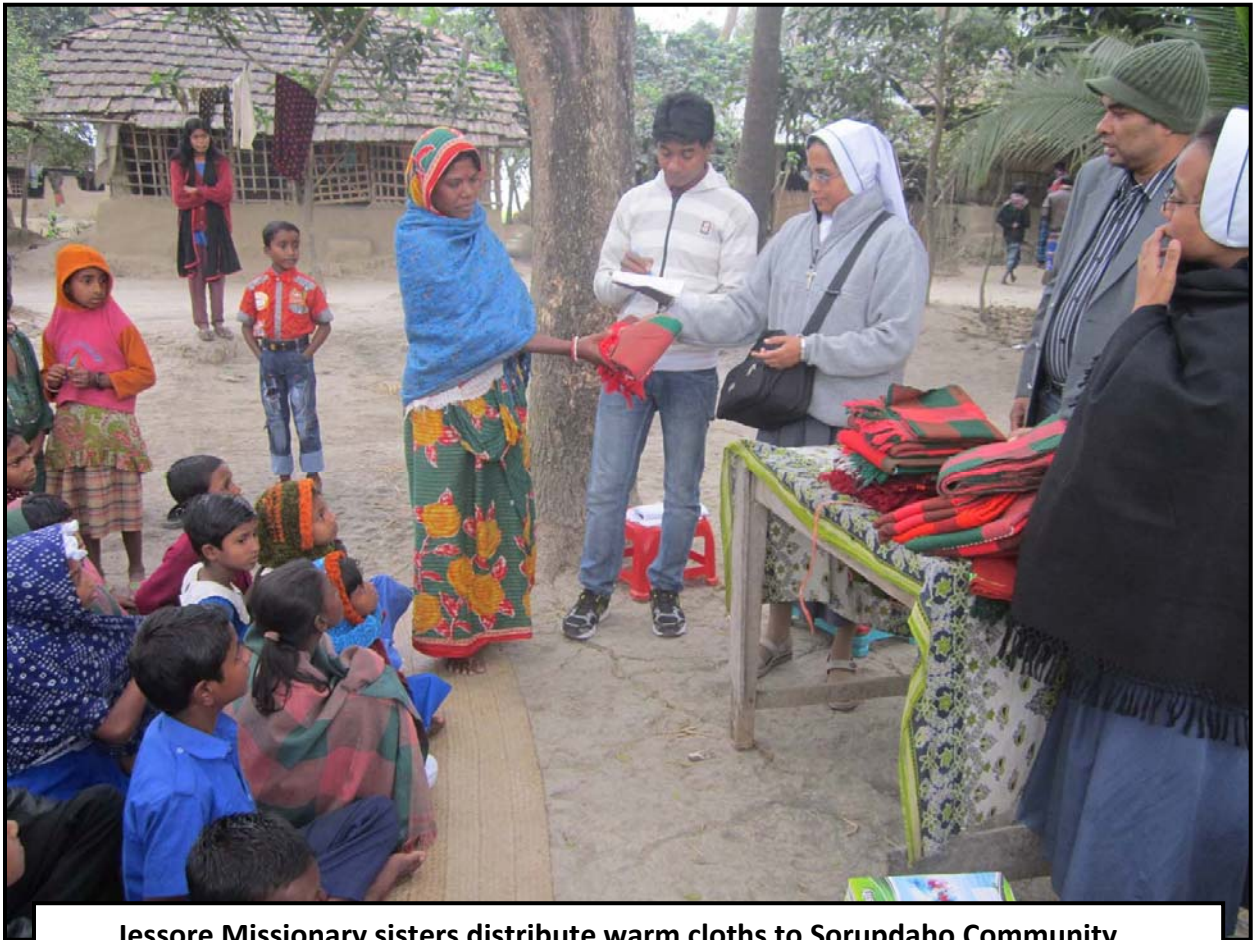
Jessore Missionary sisters distribute warm cloths to Sorupdaho Community...