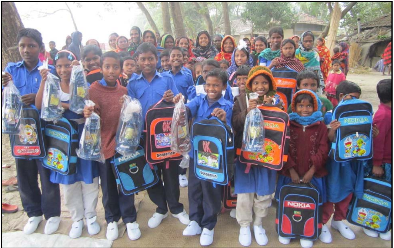
Sorupdaho Community: Happy students with new materials...