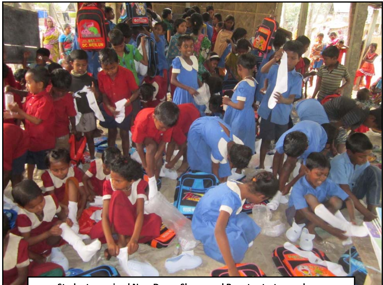
Students received New Dress, Shoes, and Bags to start new class...