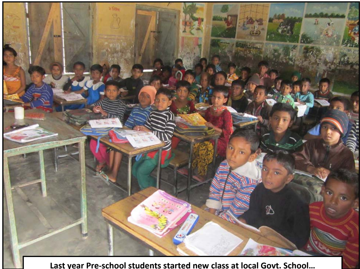
Last year Pre-school students started new class at local Govt. School...