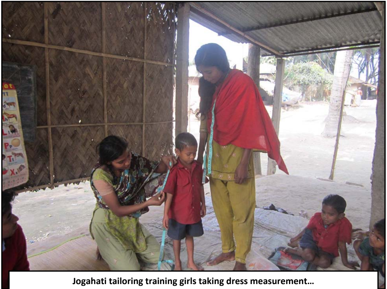
Jogahati tailoring training girls taking dress measurement...