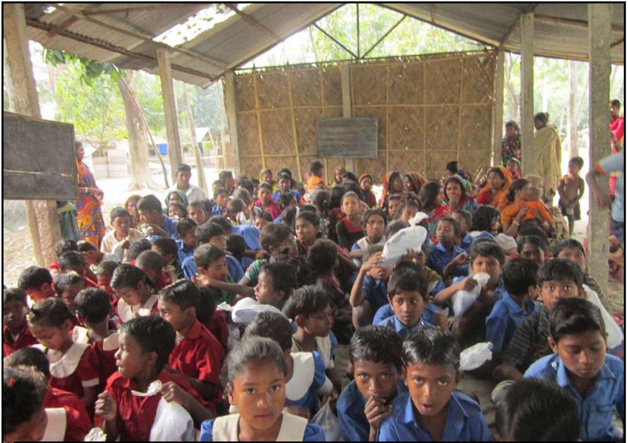
Jogahati Community: Parents-Students-Teachers Meeting...