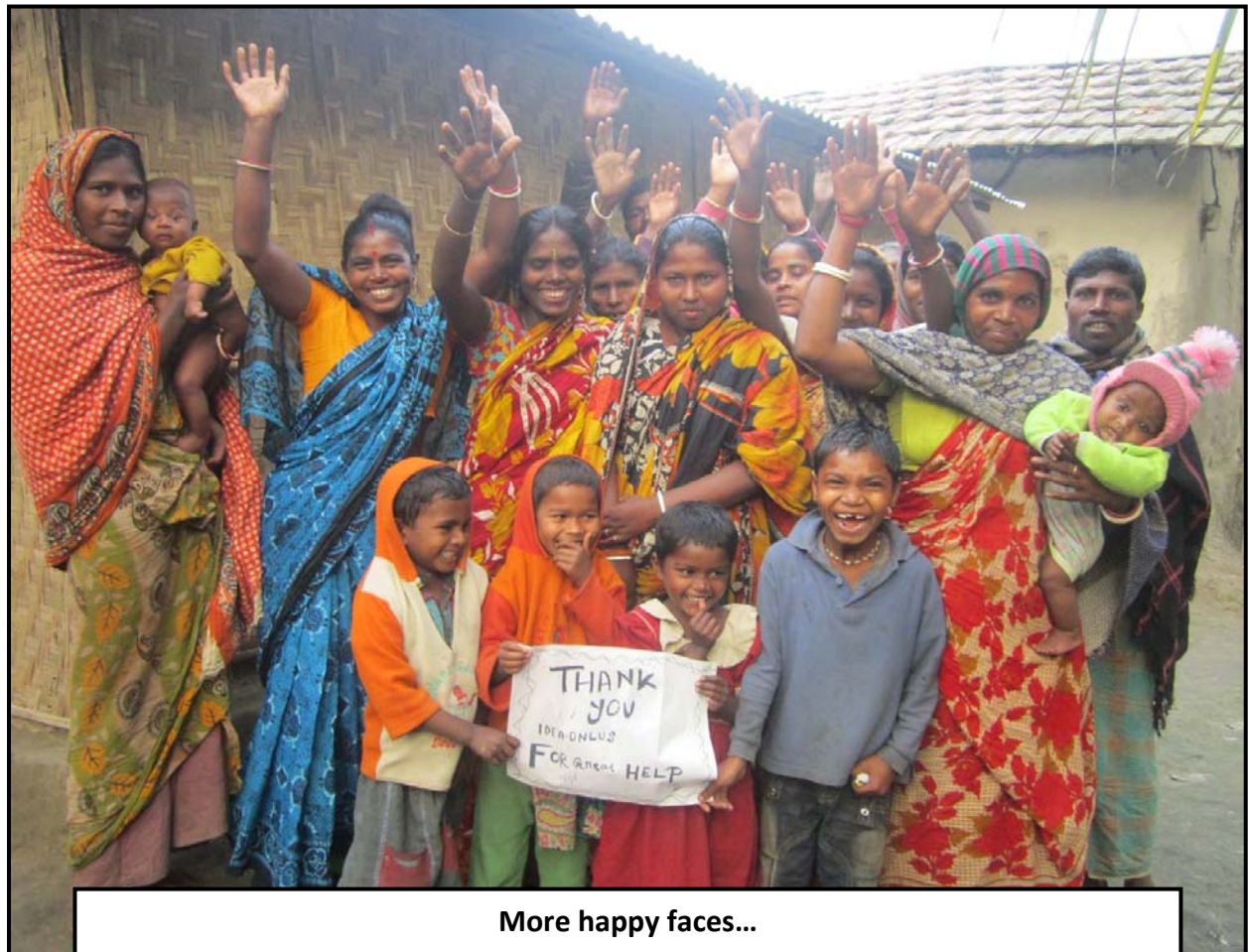
More happy faces...