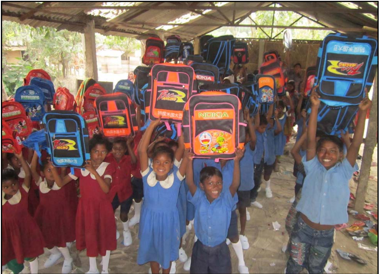
Jogahati Community: Happy students with new materials...