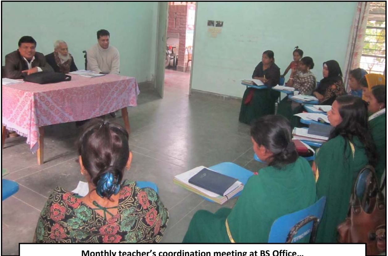
Monthly teacher's coordination meeting at BS Office...