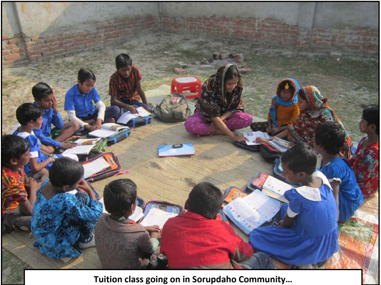
Tuition class going on in Sorupdaho Community...