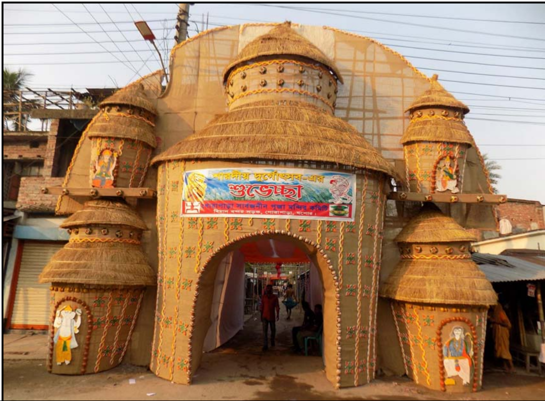
Near BS the temple gate....