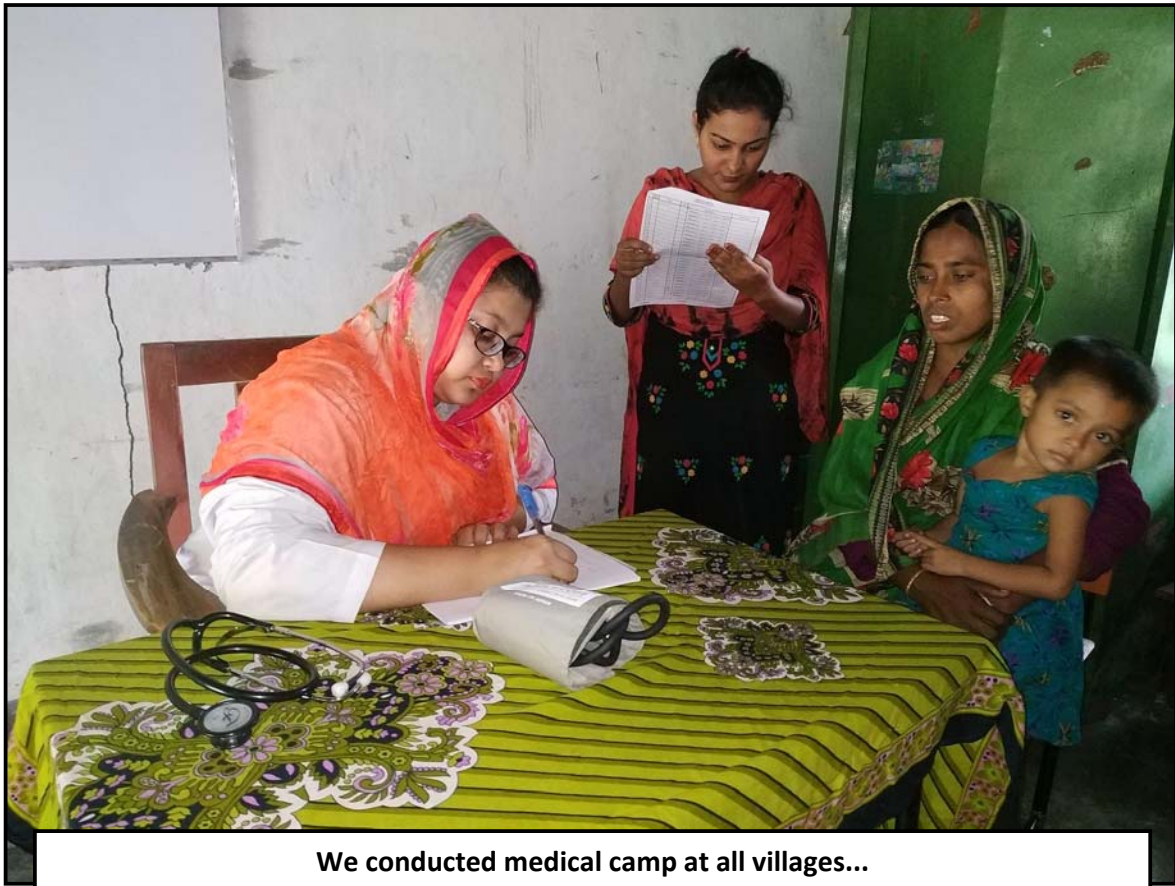
We conducted medical camp at all villages...