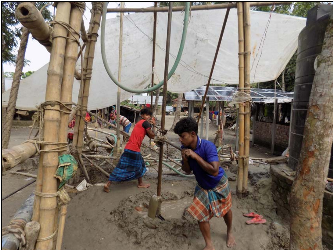
Digging for water irrigation...