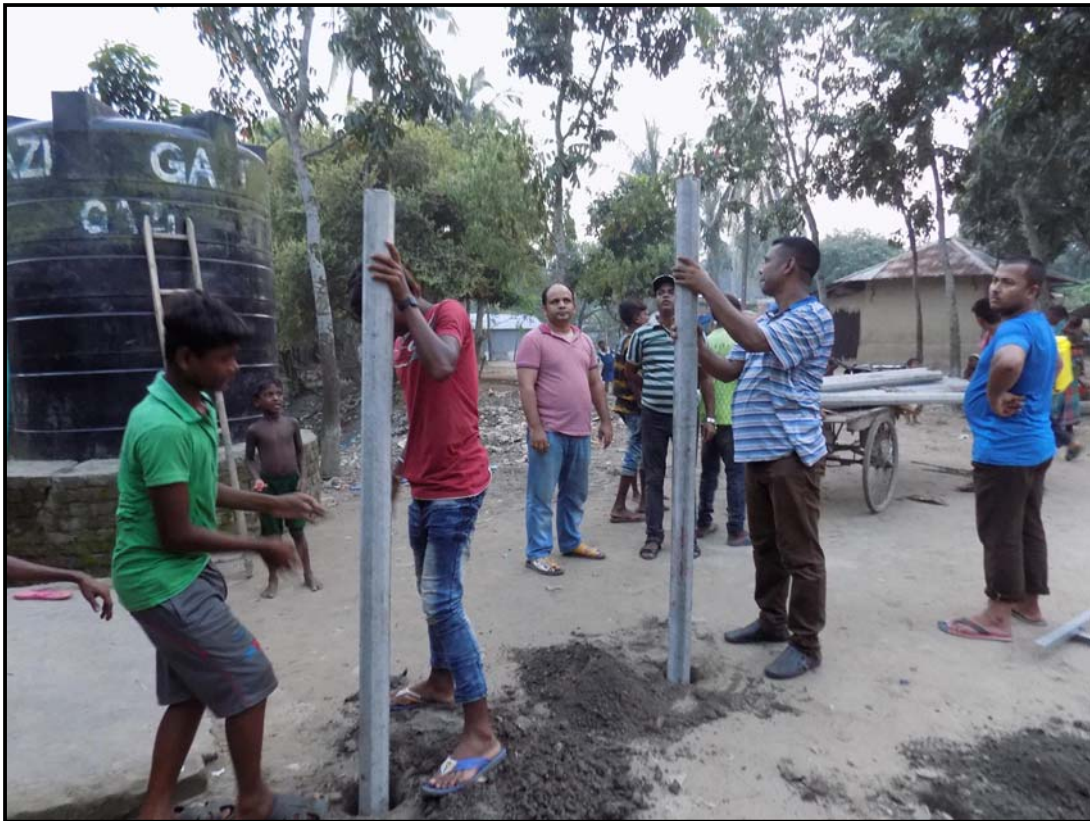
Community members provide active support for the solar installation...