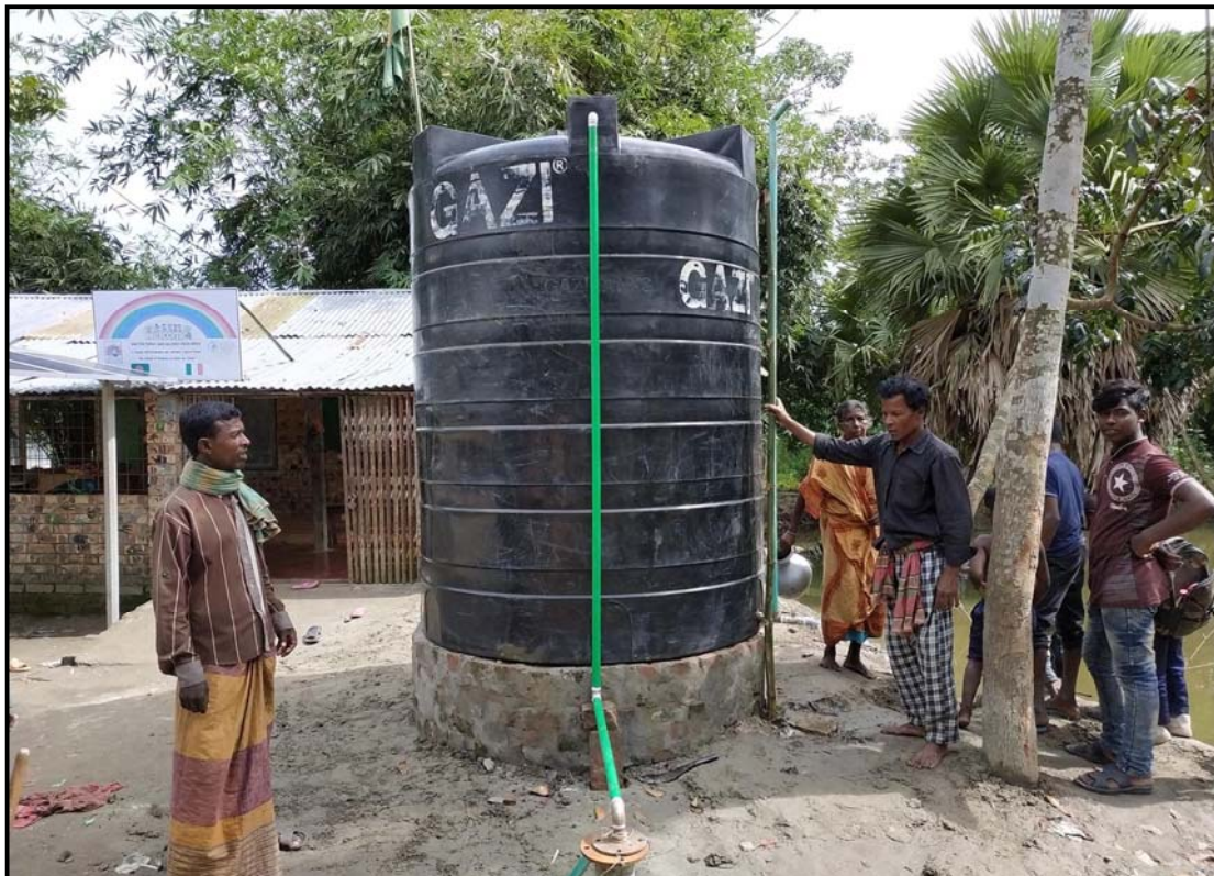
We setup 500ltr. water tank to reserve the water....