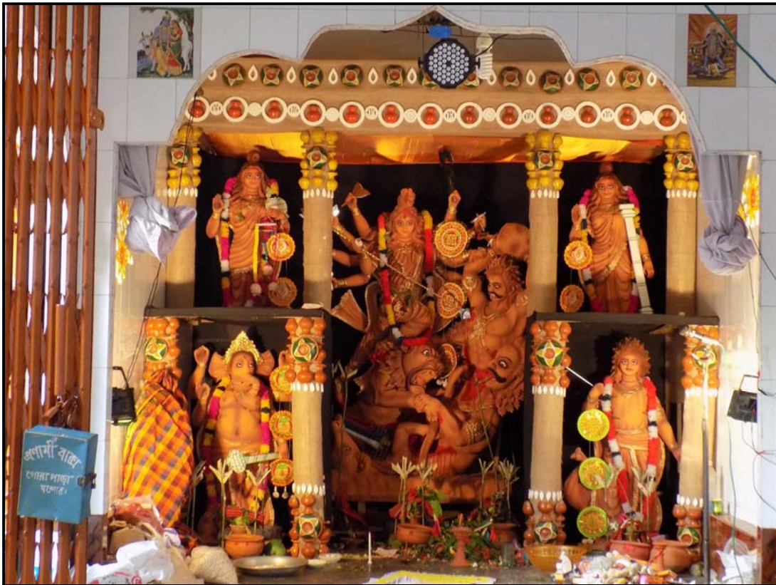
A local temple preparing for puja (prayer)...