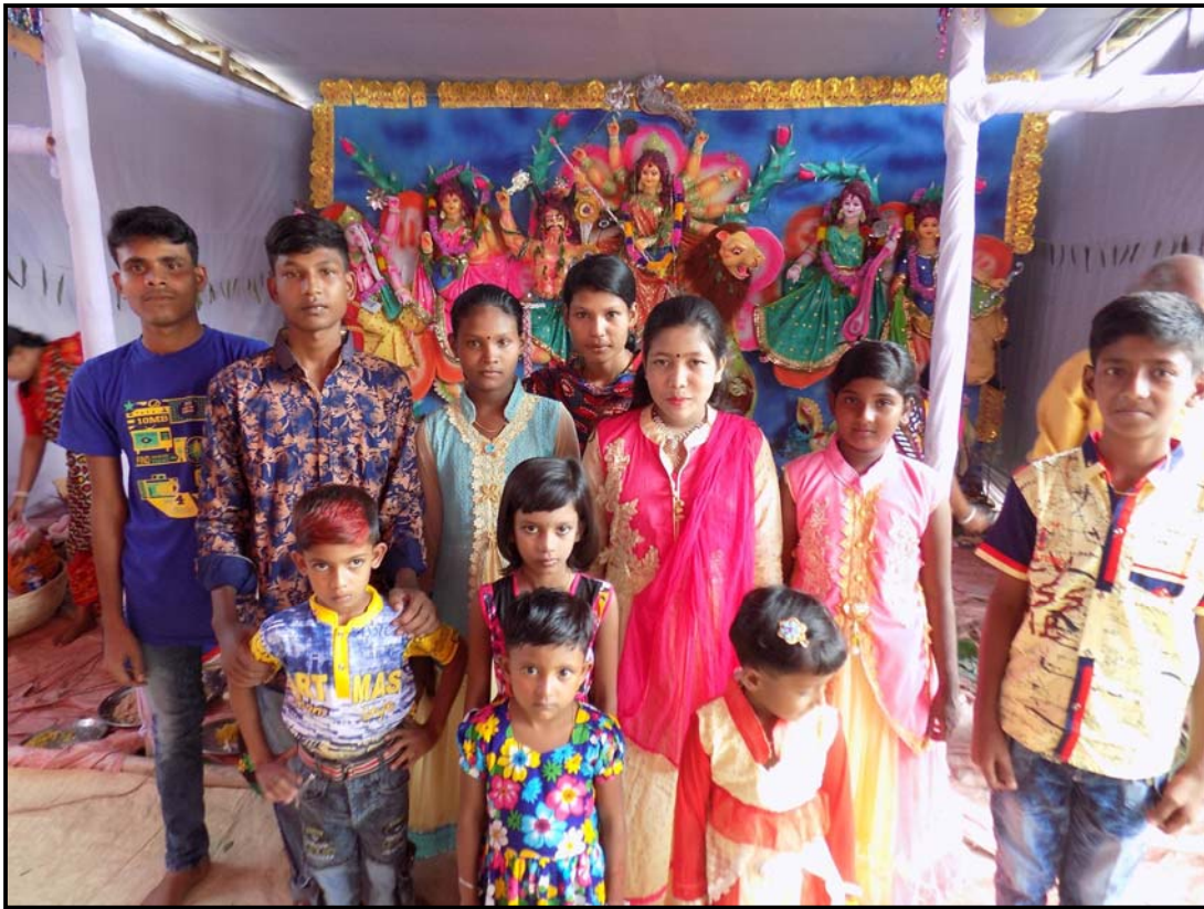
Churamankati students visiting local temples and enjoying the 'Puja'...