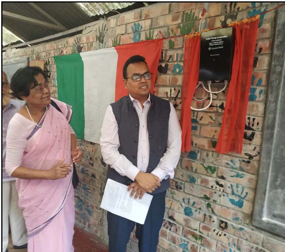
DC (Deputy Commissioner) inaugurated the Solar Pump at Jogahati...