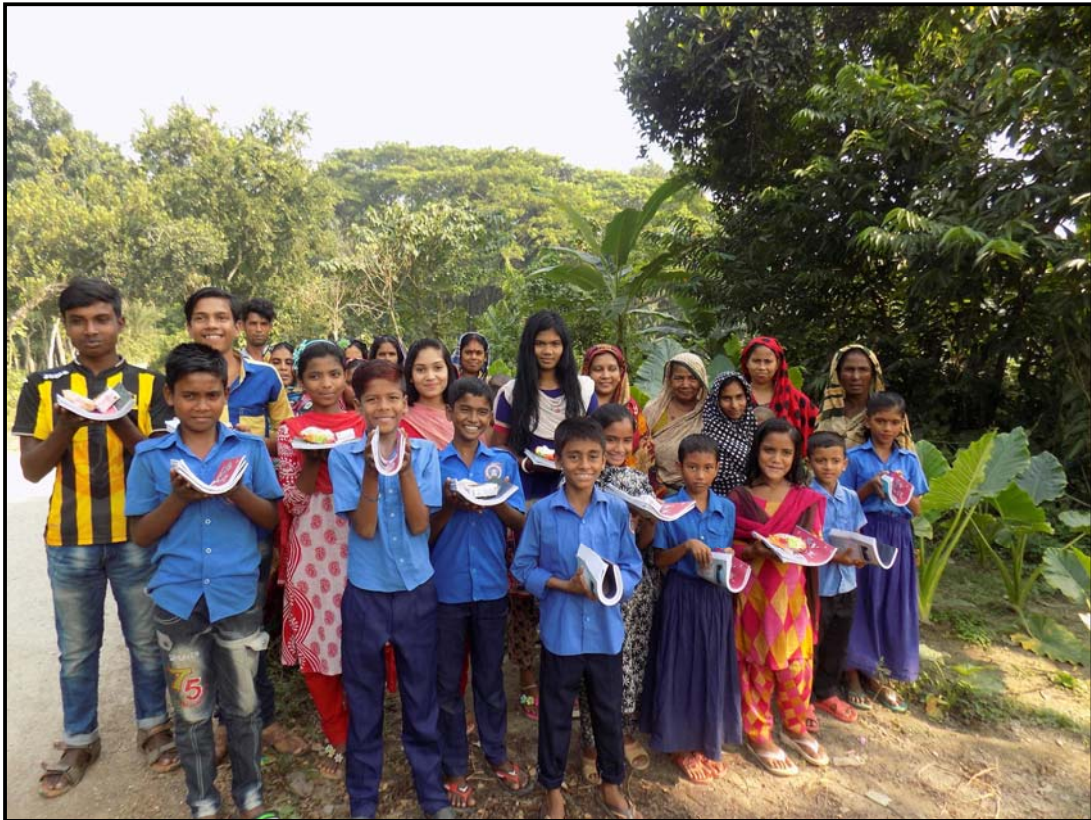
Mohishati Students with materials...