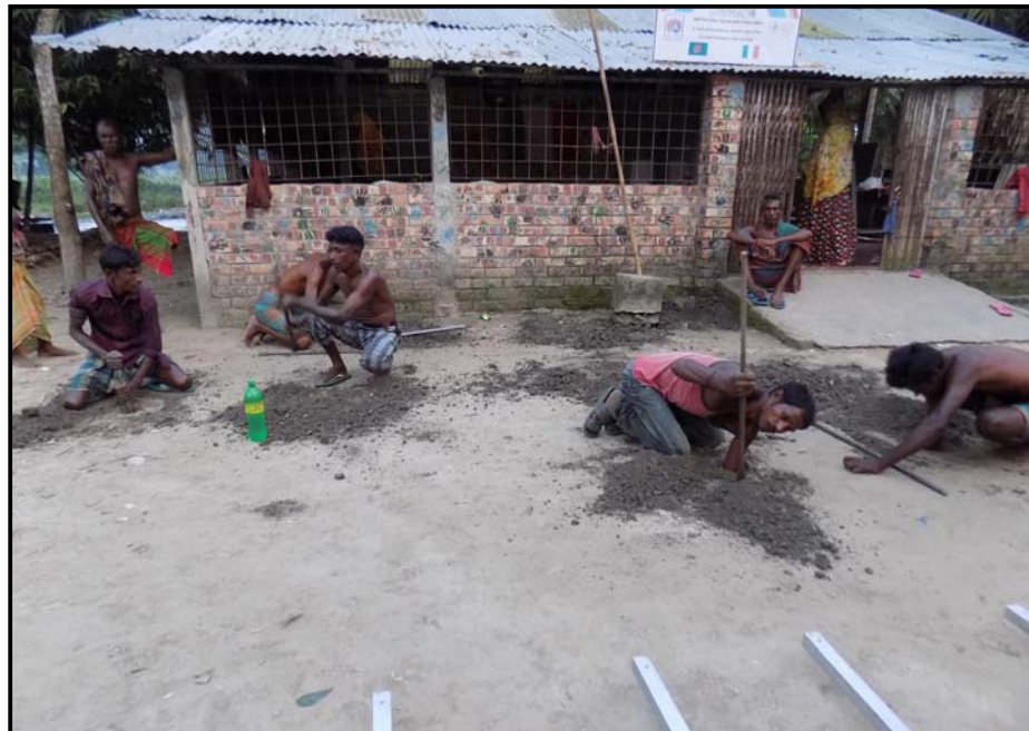
Jogahati villagers supporting to setup the solar panels...