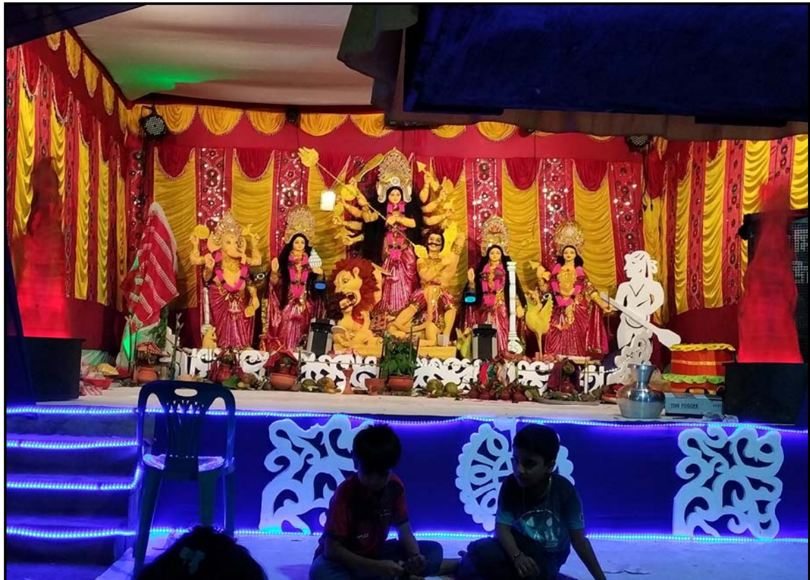
Another temple ready for the festival...