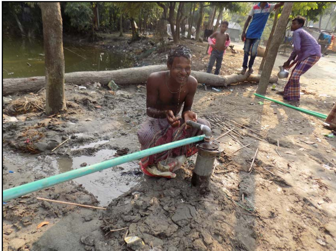
Happy to have own source of drinking water...