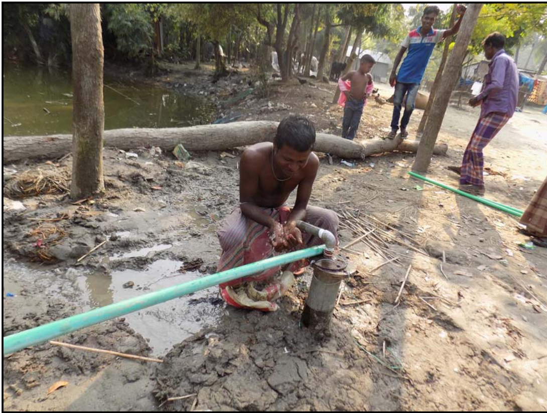
After digging 500mt. the drinking water, pump out by solar panels...