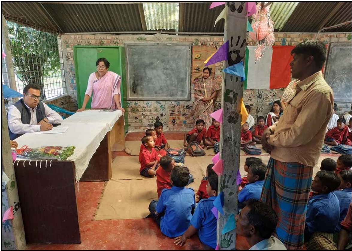
Community members express their problems to Jashore DC (chief of local administration)...