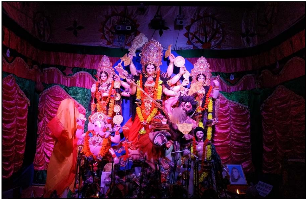
Hindu community biggest festival 'Durga Puja' has been celebrated. Our students and community members enjoyed the 'puja'. Every village made the temporary stage for the god & goddess and for seven days the celebration has been go on...