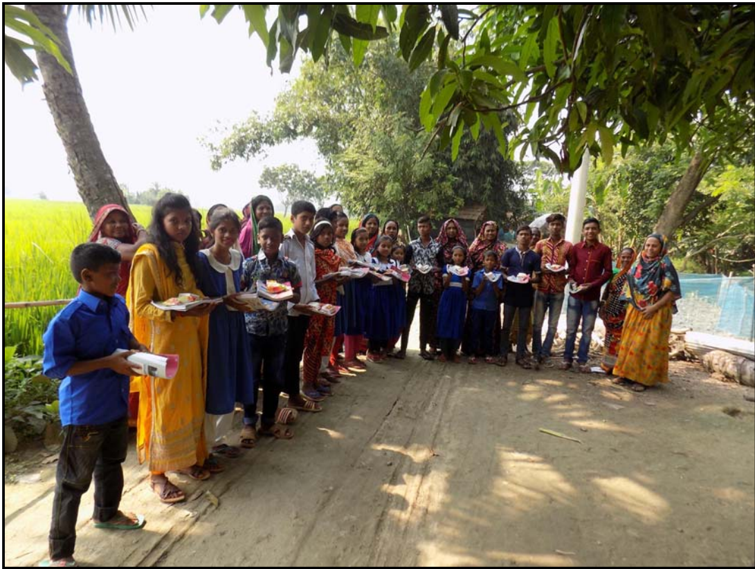
Sorupdaho students with the materials...