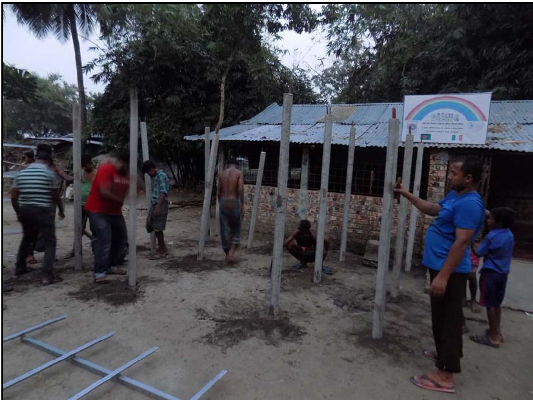
Front of the school we setup the solar panels...