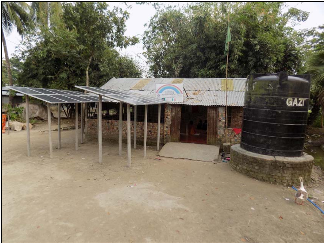
After complete the solar panel setup...