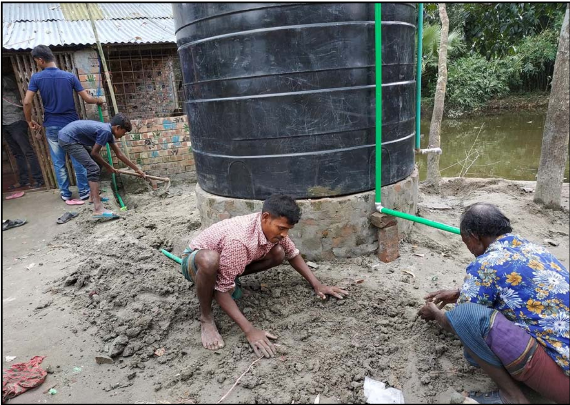
Community put full physical support in installation process....