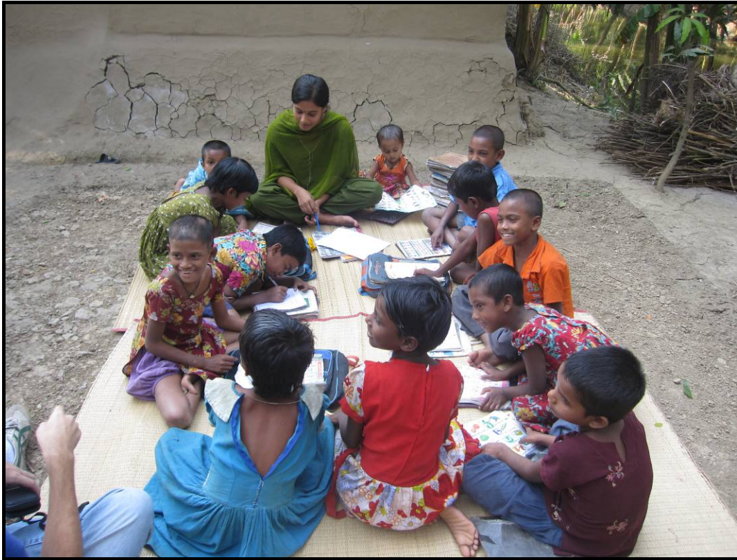
Sorupdaho Tuition Programme “Under Construction”