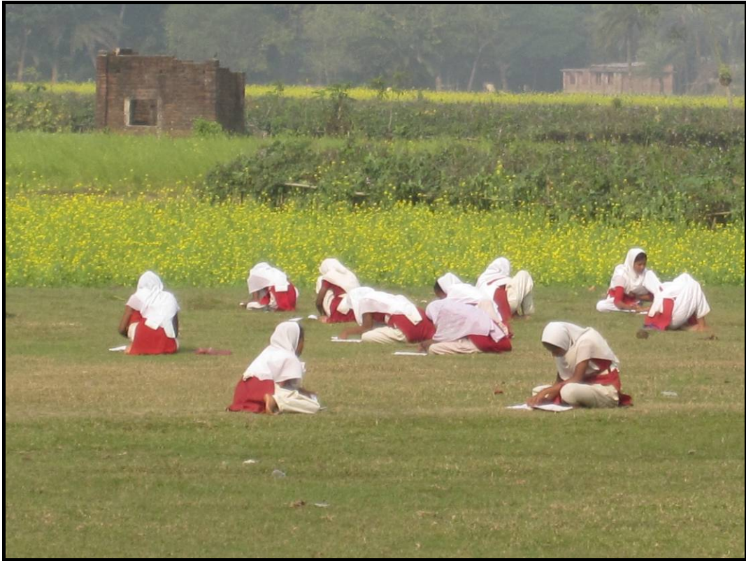
Girls studying in the nature