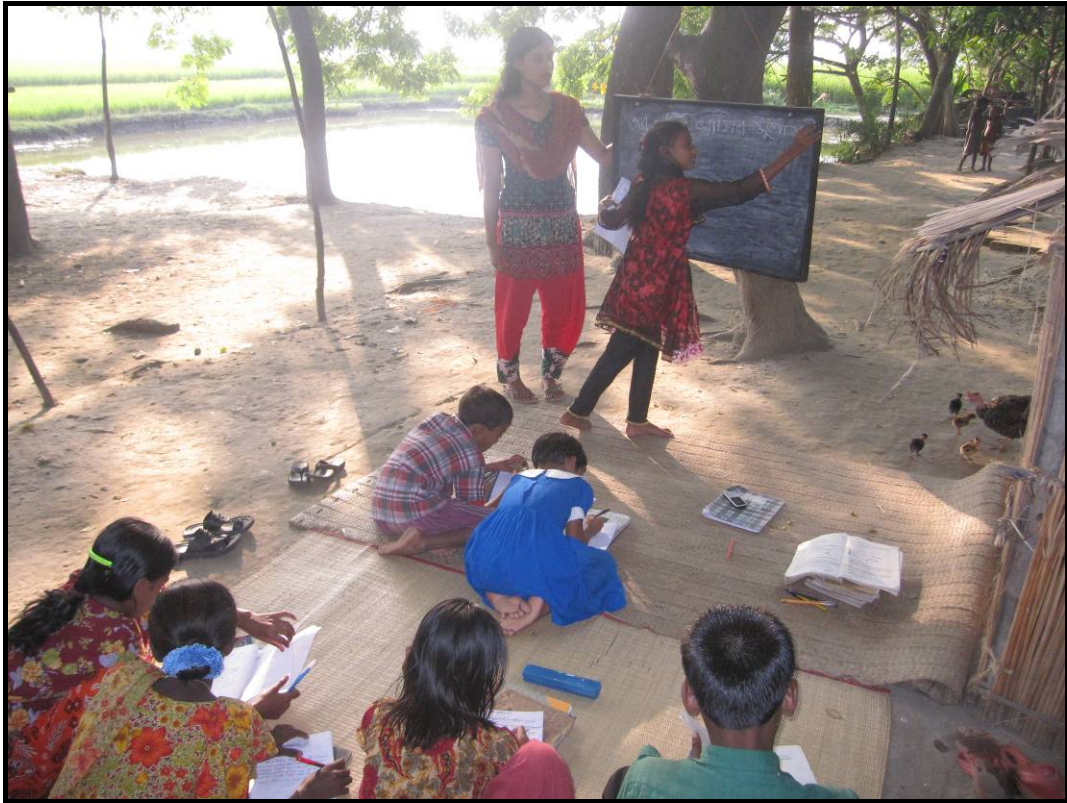
Students using the new blackboard in Sorupdaho