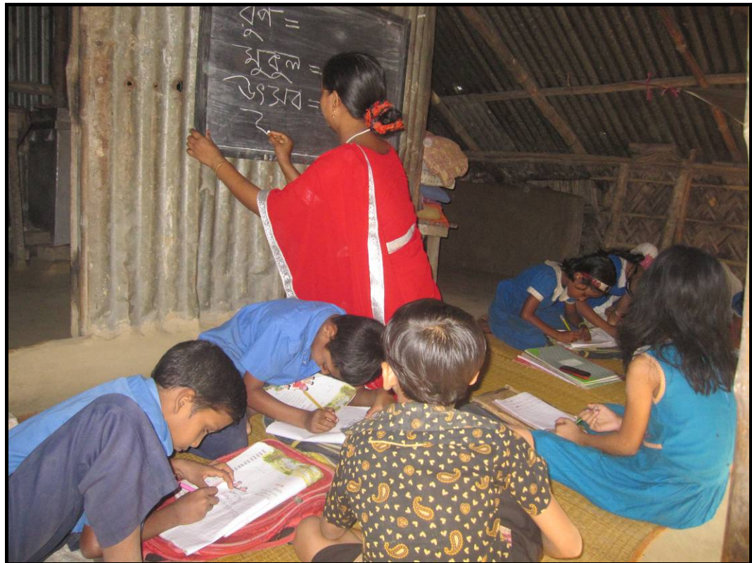
Tuition Programme in Lolitadaho