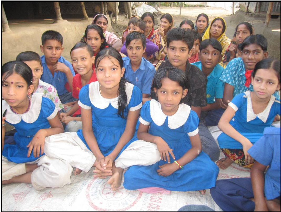
The students of Lolitadaho