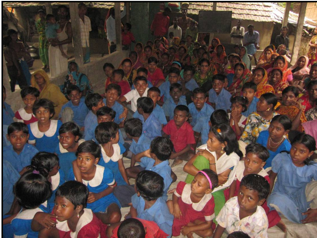
Waiting for the material distribution in Jogahati