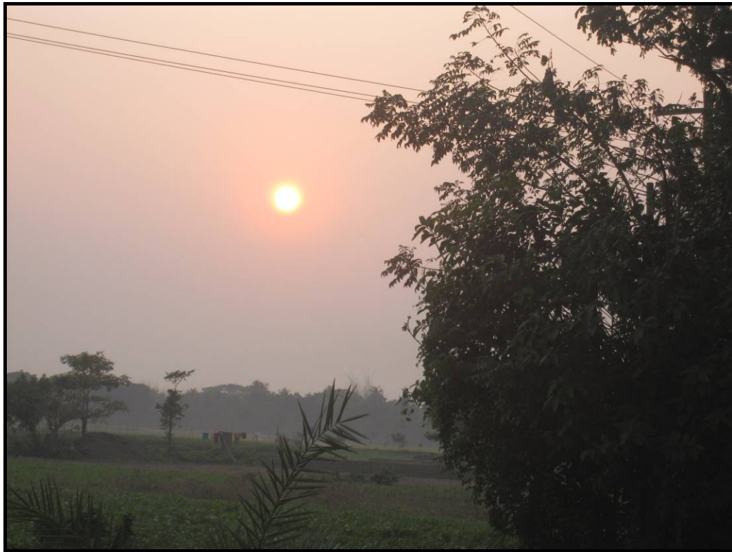
Sun set at the village...