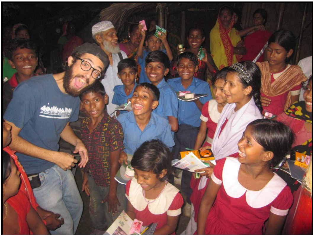
A serious moment during Material Distribution in Churamankati