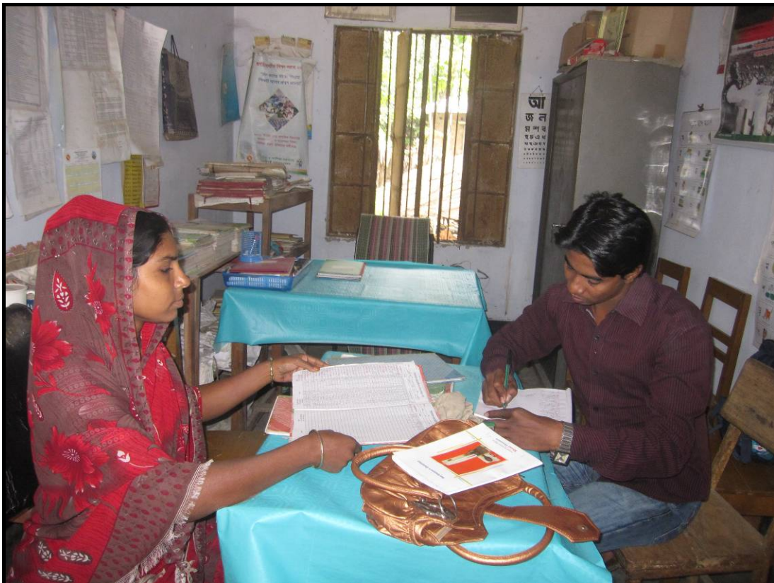
Community Motivator collecting attendance data