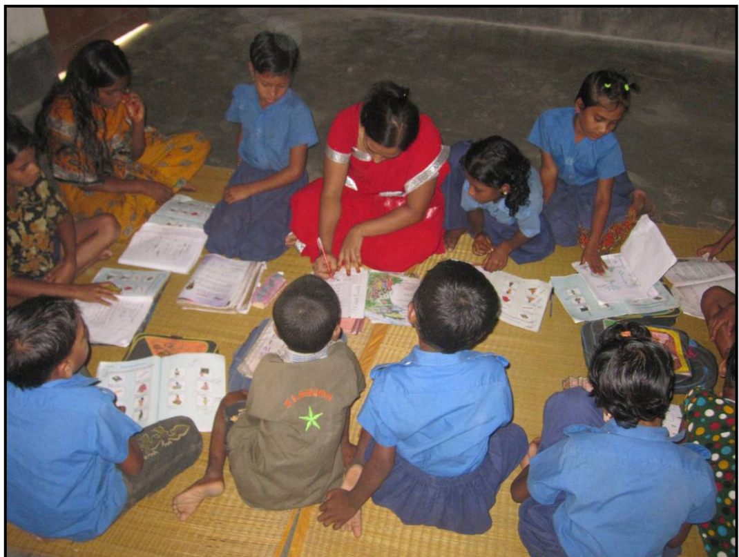
Tuition Programme in Mohishati