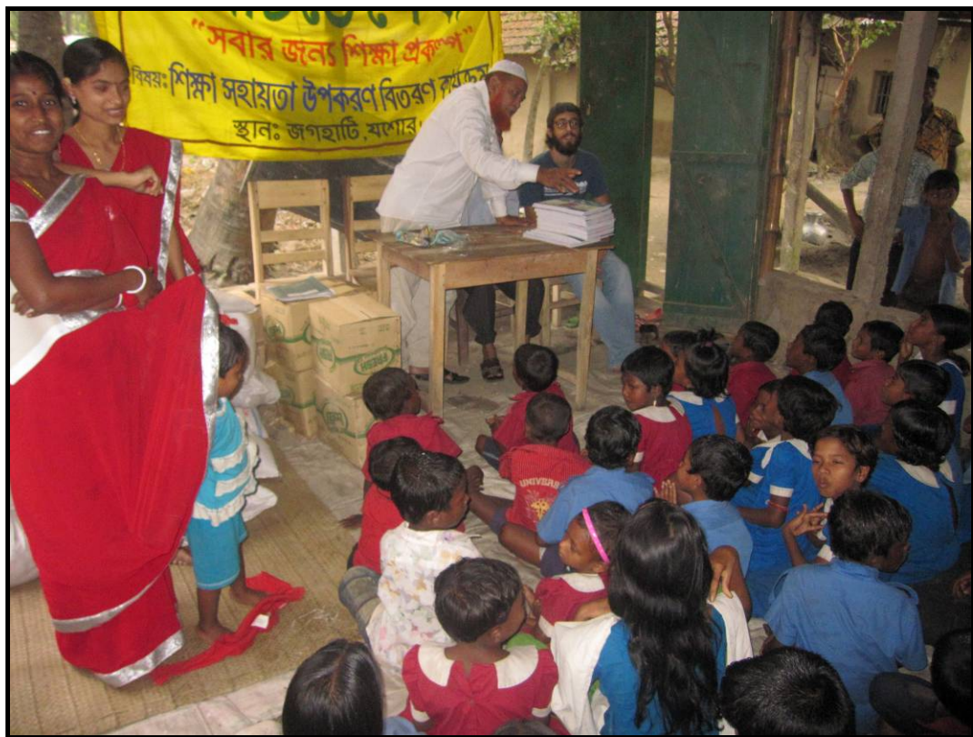
Distribution Programme at Jogahati