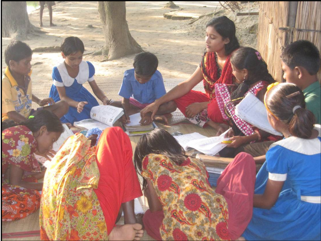
Students doing homework in Sorupdaho