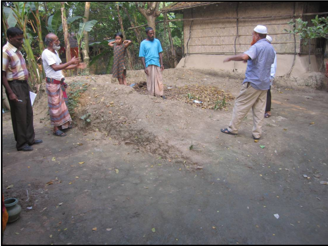
Measuring Space for Sorupdaho Study Centre