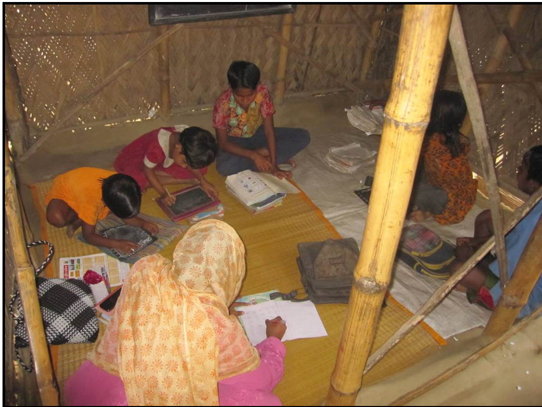
Tuition Programme in Churamankati