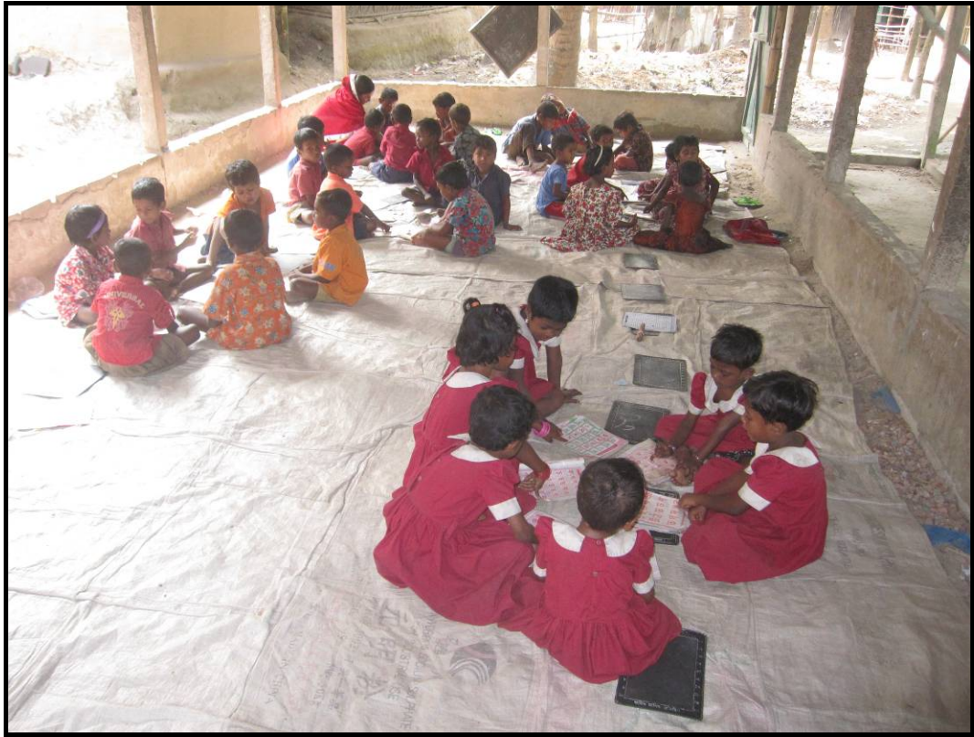
Group study at Jogahati pre-school