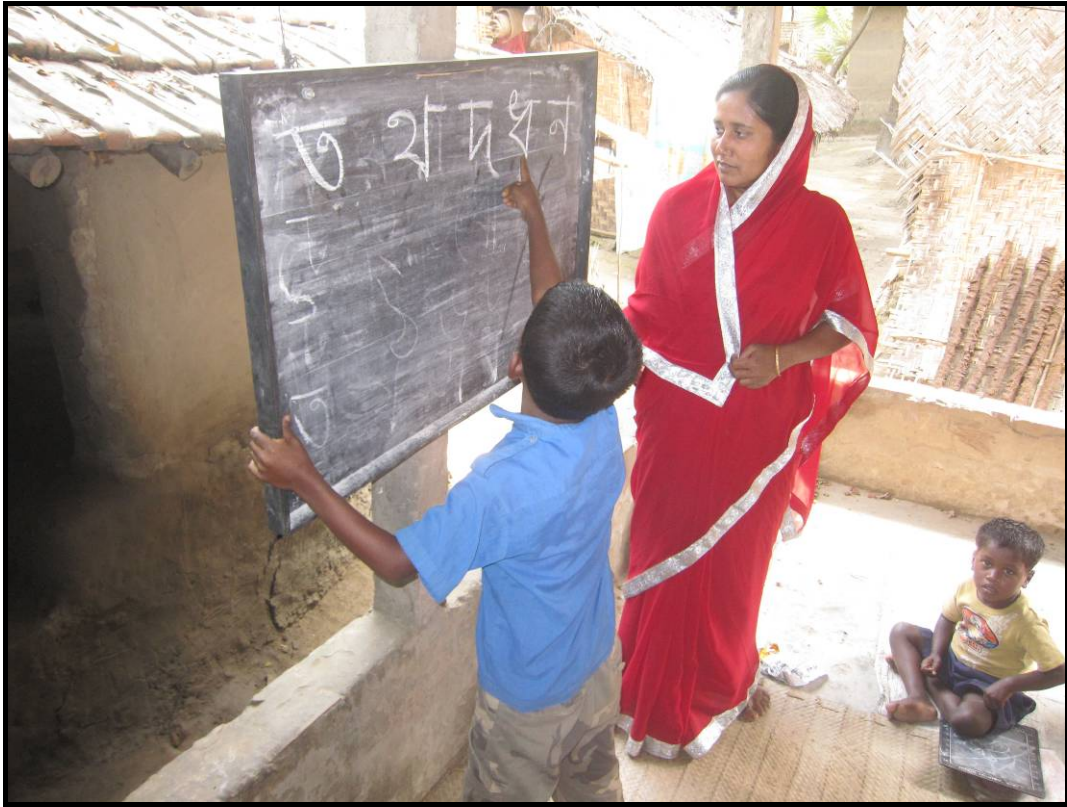
Learning the alphabet in Jogahati Pre School