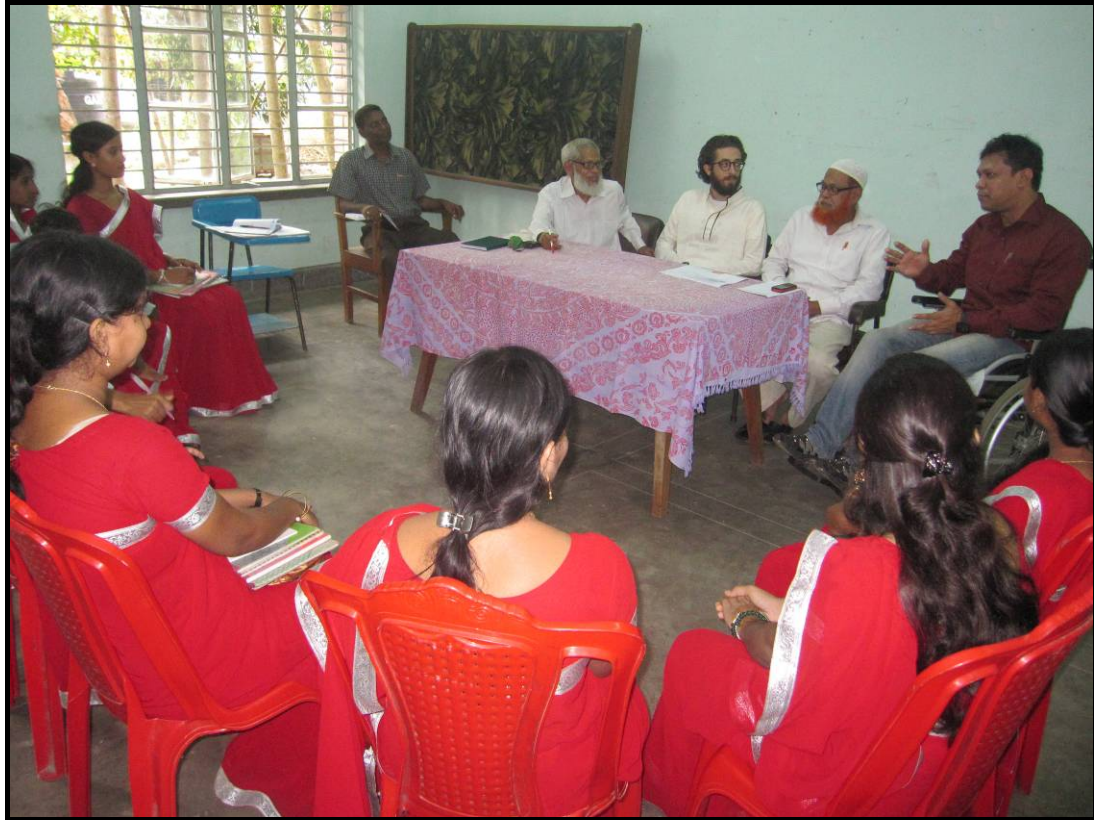
This month's Teachers Coordination Meeting