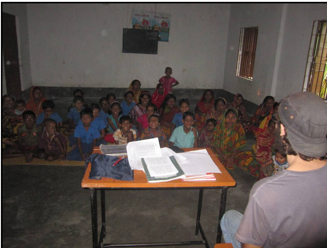
Guardians and student in Mohishati