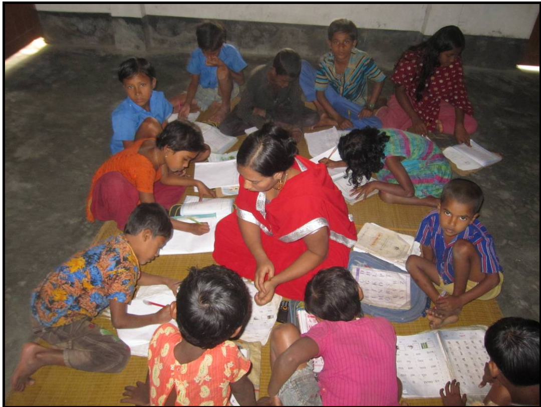
The first shift of Mohishati Tuition Programme