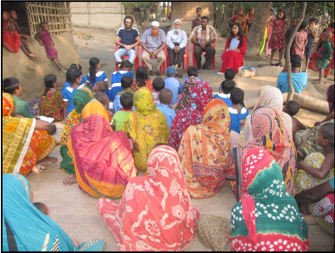
Guardians and Students in Sorupdaho