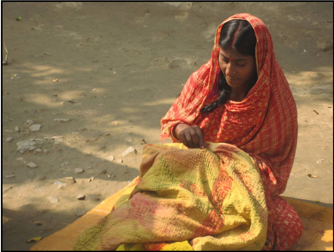
Winter is coming...Preparing the Kantha...