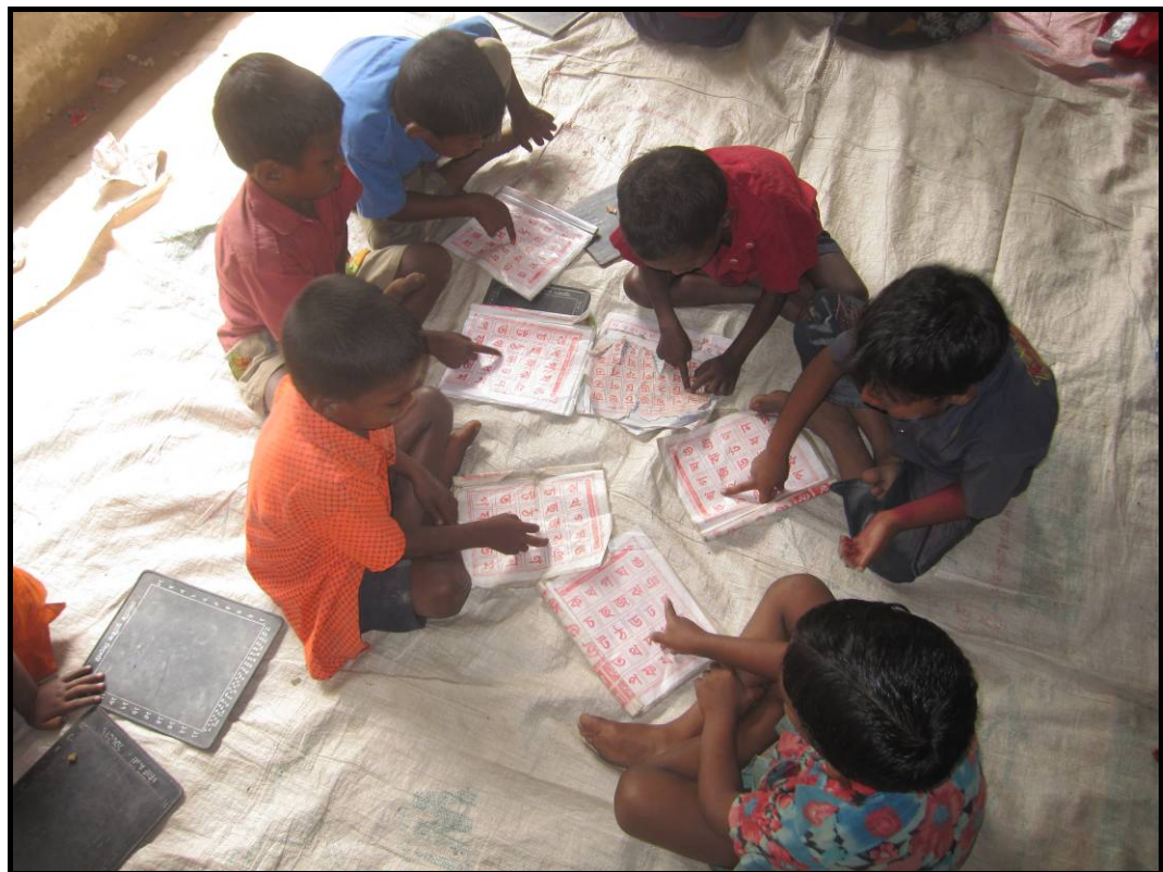
“Study Group” in Jogahati Pre School