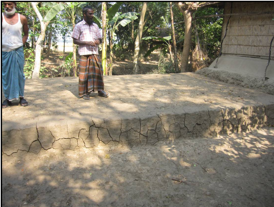
Community prepare the base for Study Centre