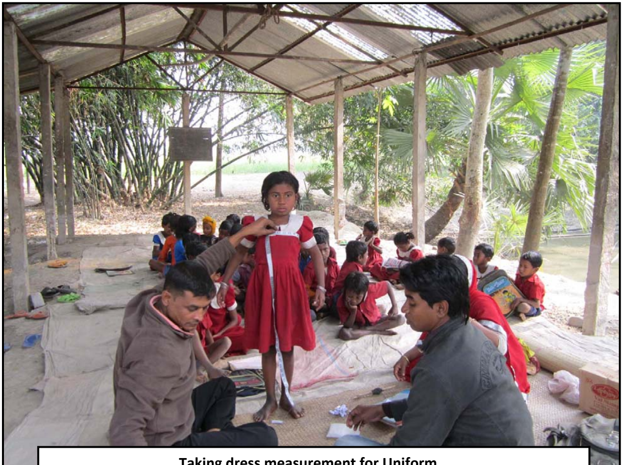
Taking dress measurement for Uniform...