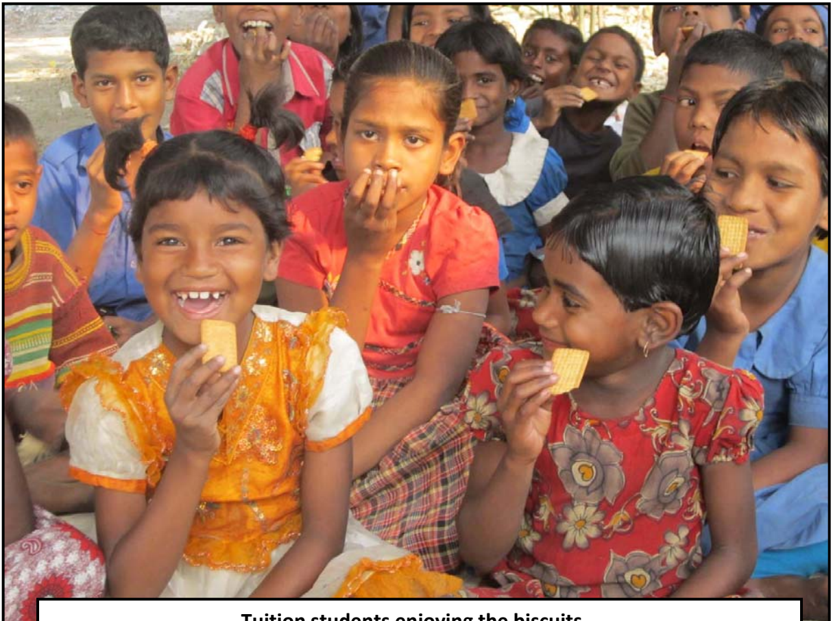
Tuition students enjoying the biscuits...