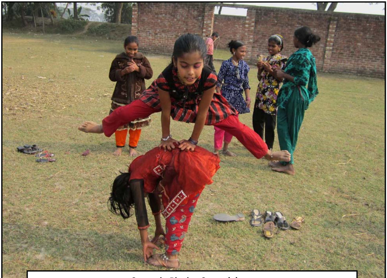
Sports in Picnic...Sorupdaho...