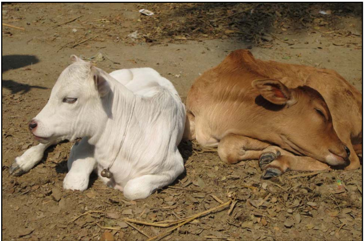
Calf of Jogahati village...