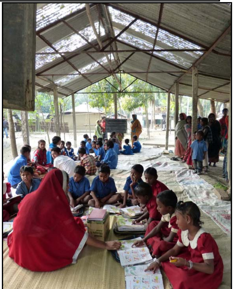
Tuition class at Jogahati village...