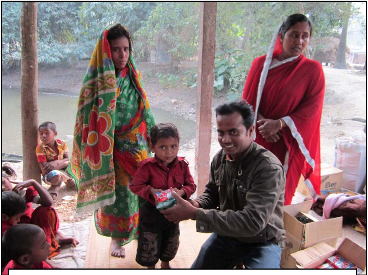
Jogahati students with materials....