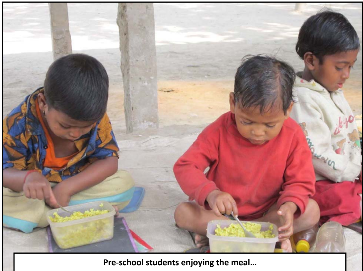
Pre-school students enjoying the meal...