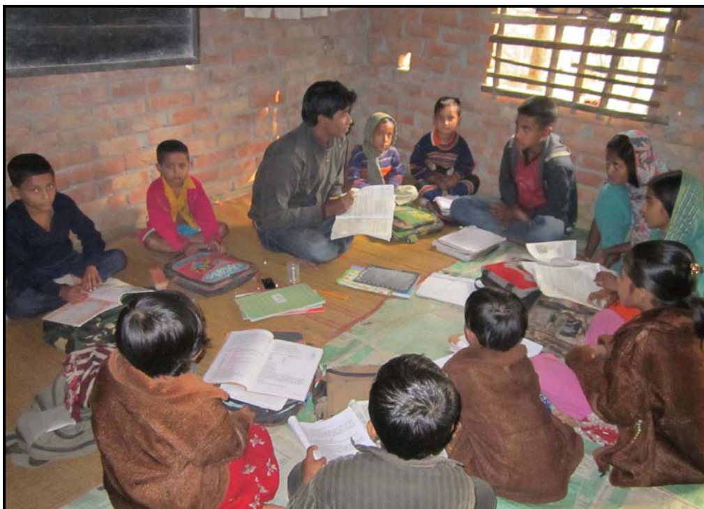
Tuition Class conducting by Community Motivator...