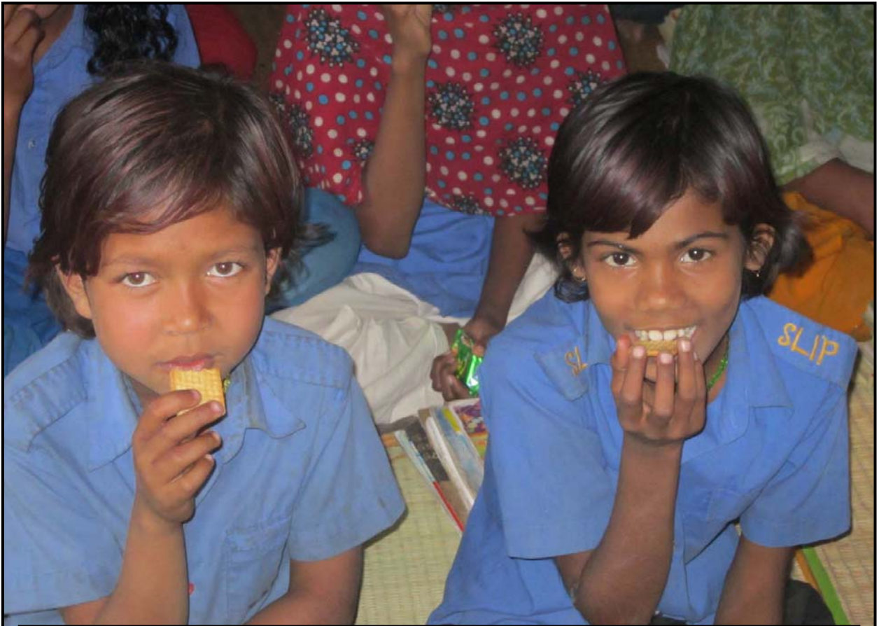
Tuition students enjoying the biscuits...