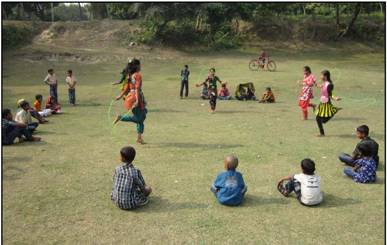
Sports in Picnic...Churamankati...