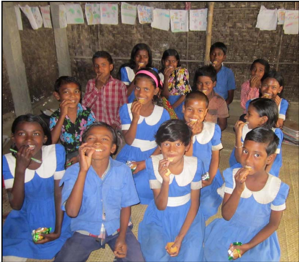
Tuition students enjoying the biscuits...