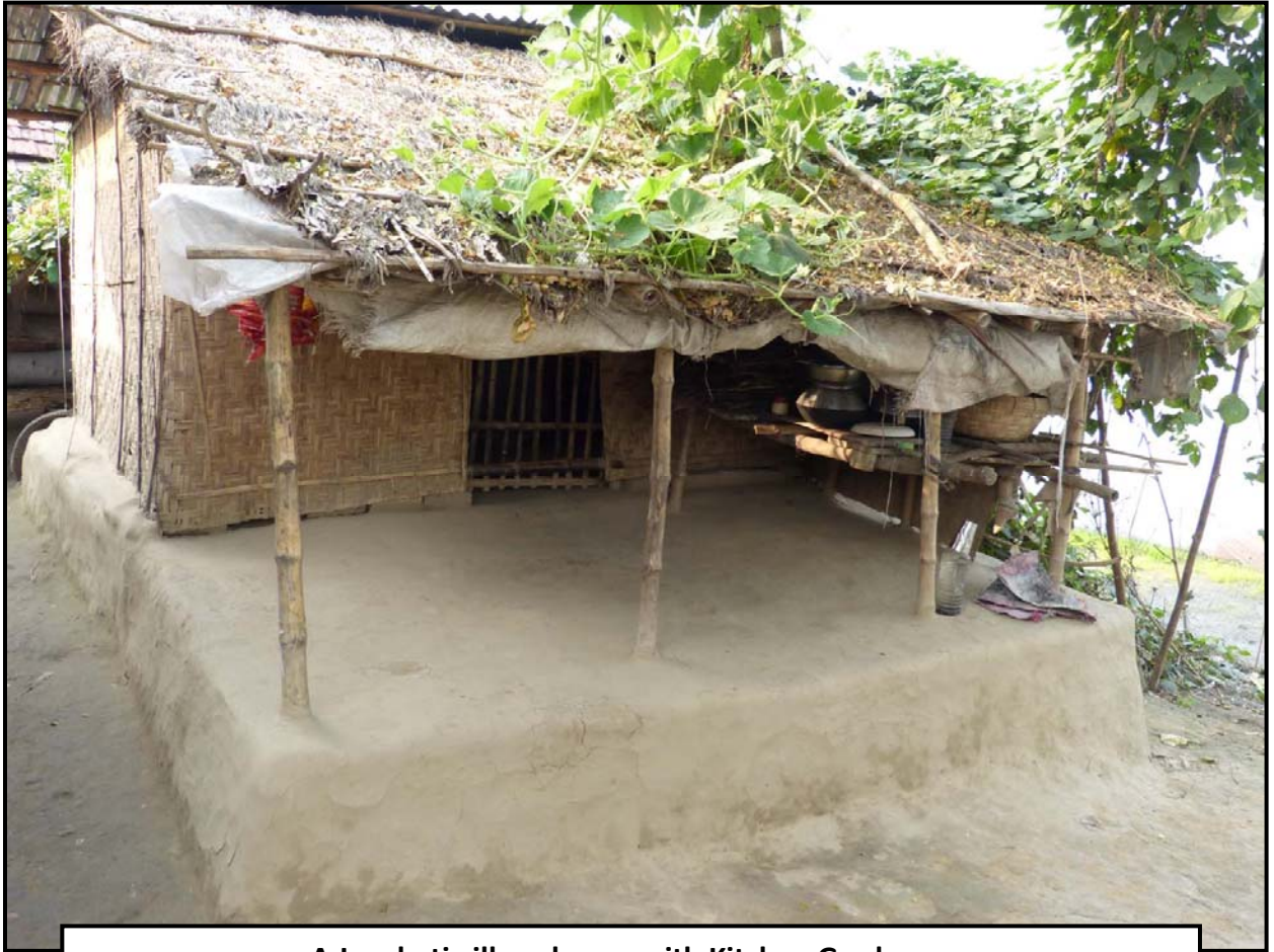
A Jogahati village house with Kitchen Gardern...