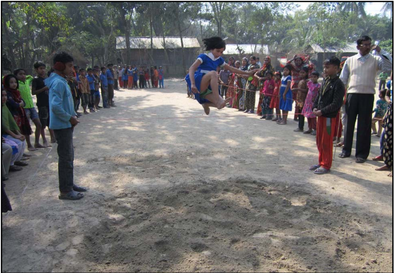
Annual sports...High jump...