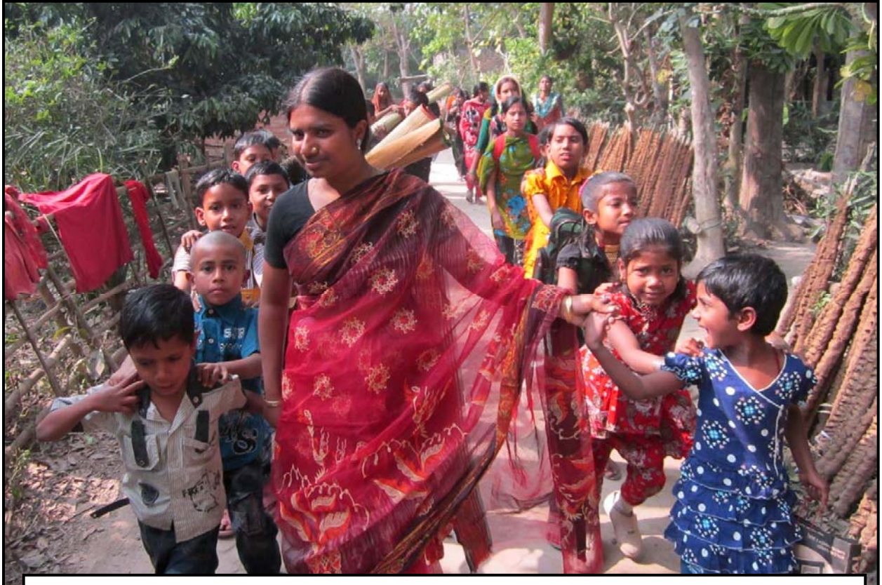
Lets go for Picnic...Churmankati children...