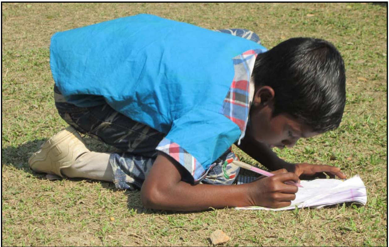
Very passionate student...Study at outdoor...