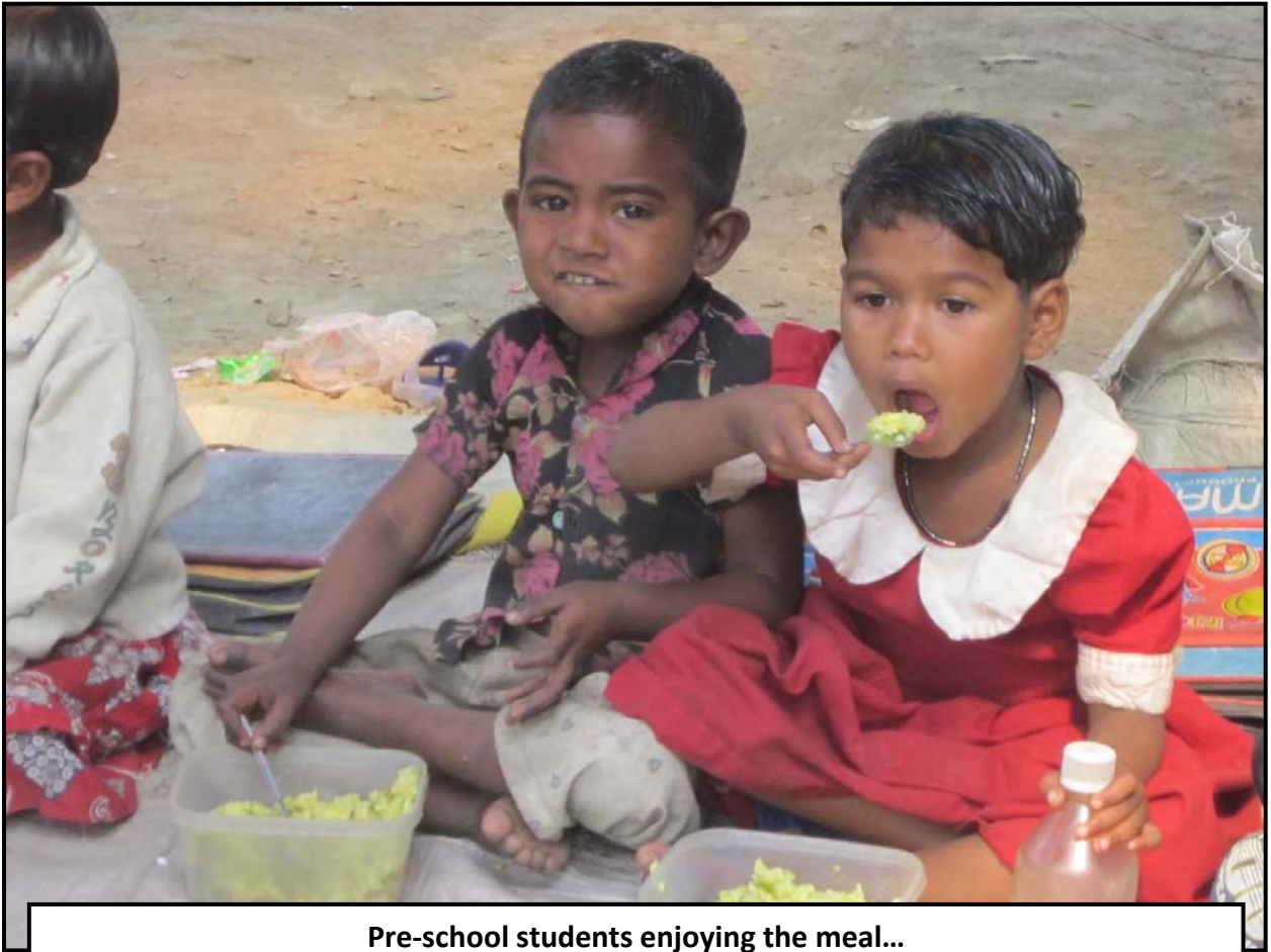
Pre-school students enjoying the meal...