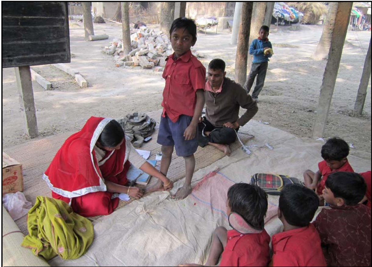
Taking feet measurement of each students for shoe...