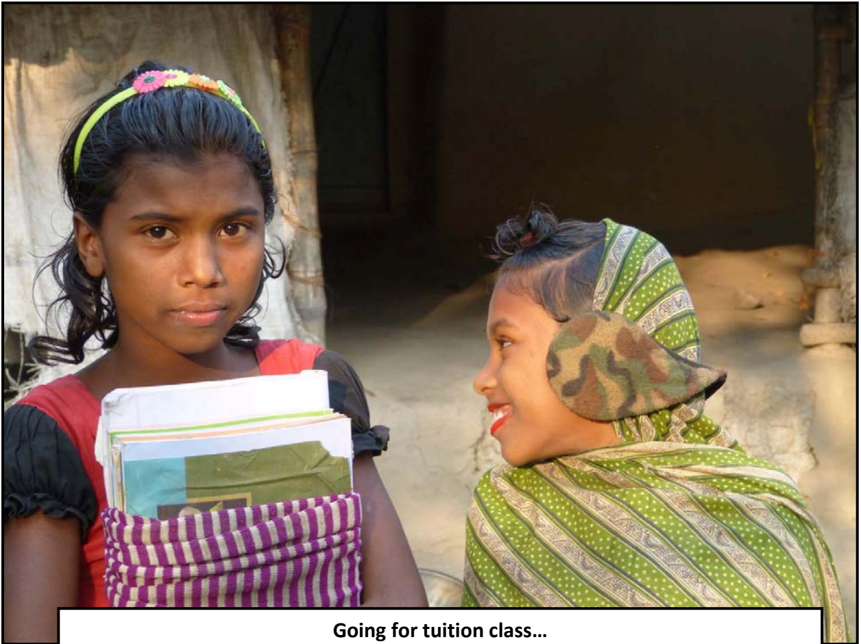
Going for tuition class...