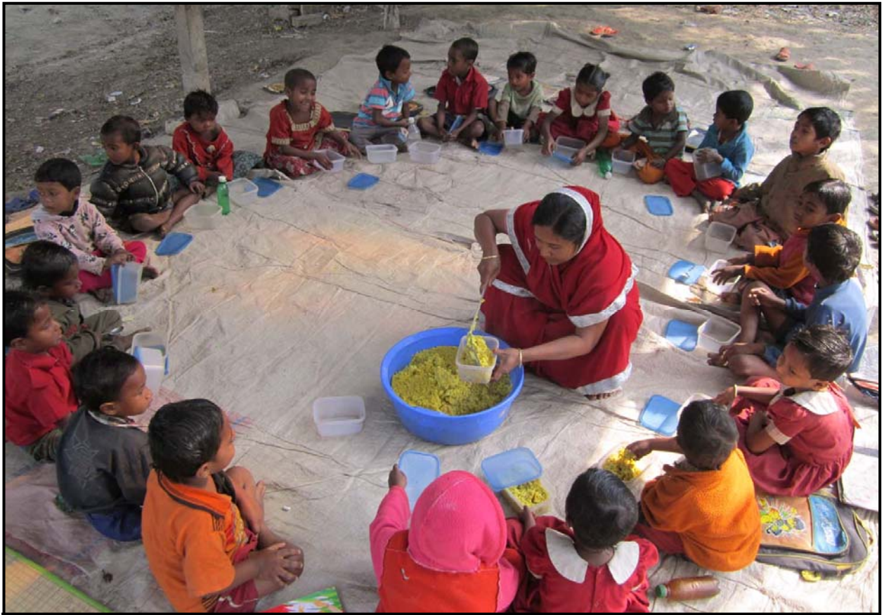
Khitchury meal for Pre-school students...