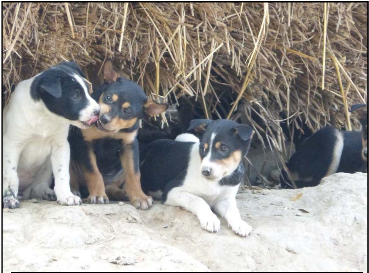
Puppies of Jogahati village...