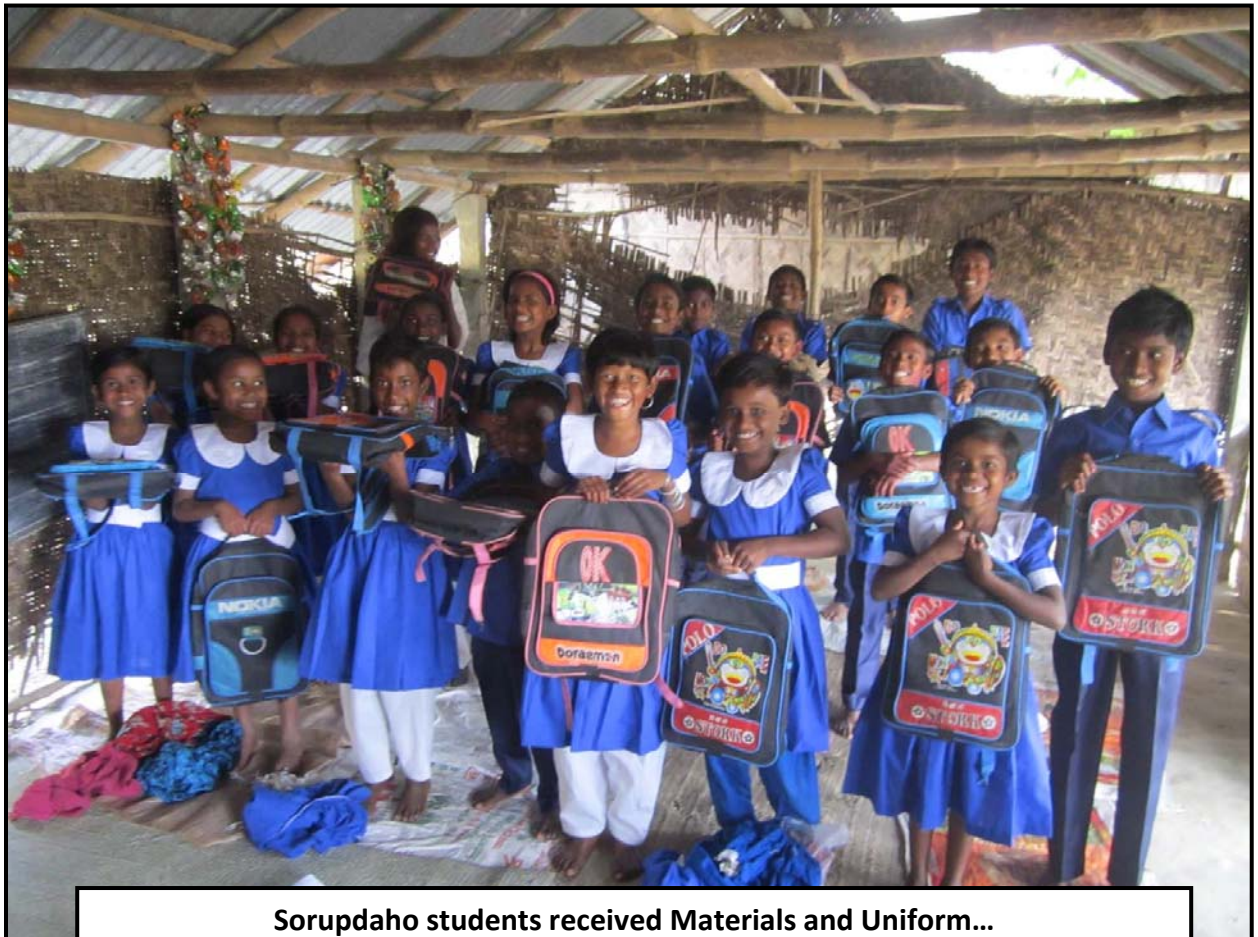
Sorupdaho students received Materials and Uniform...