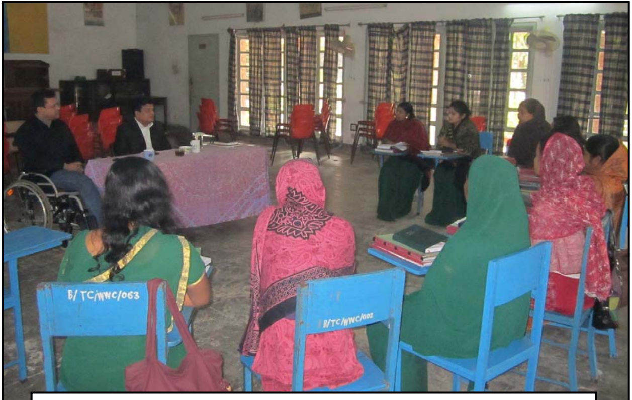
Monthly teacher's coordination meeting at BS Office...