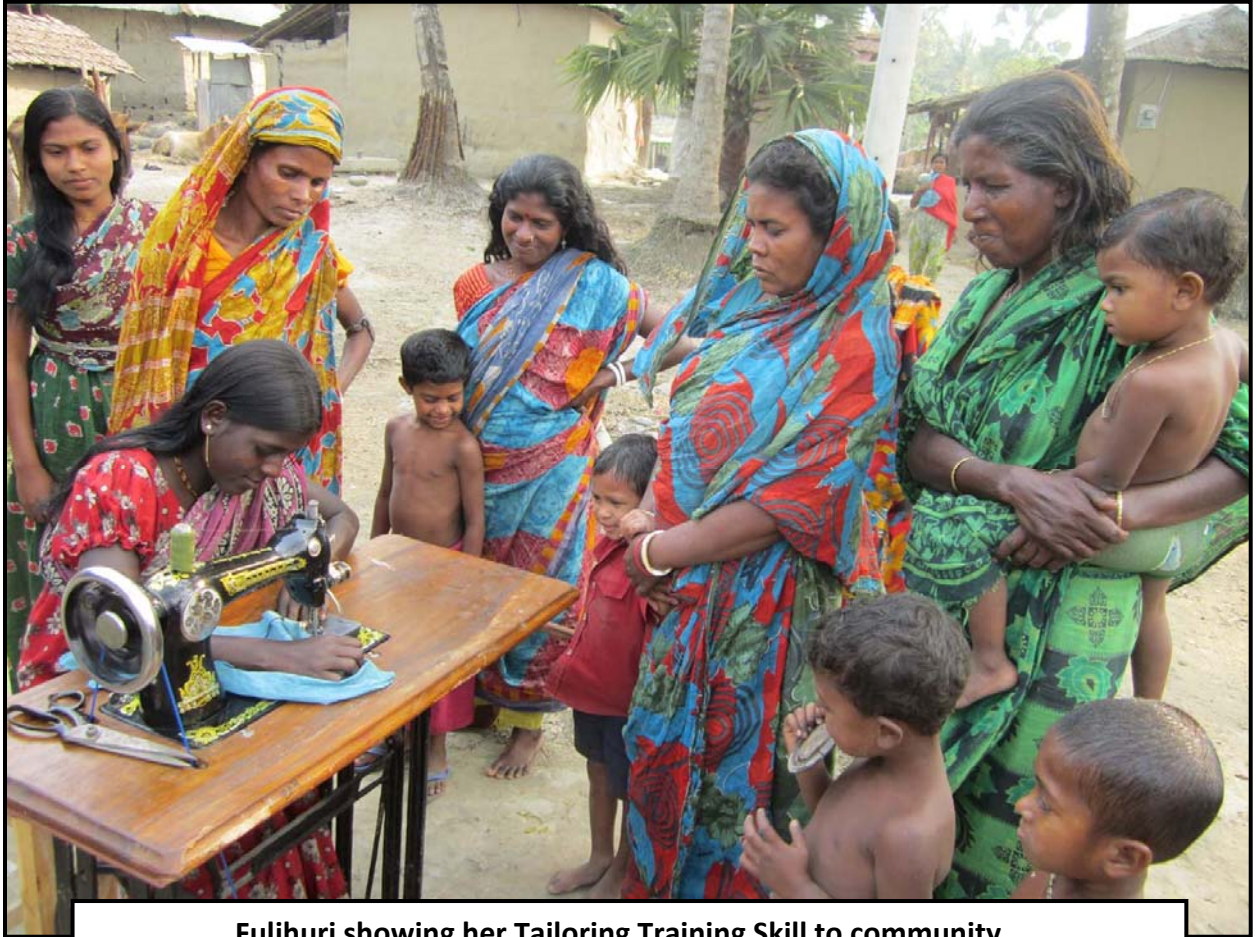
Fuljhuri showing her Tailoring Training Skill to community...