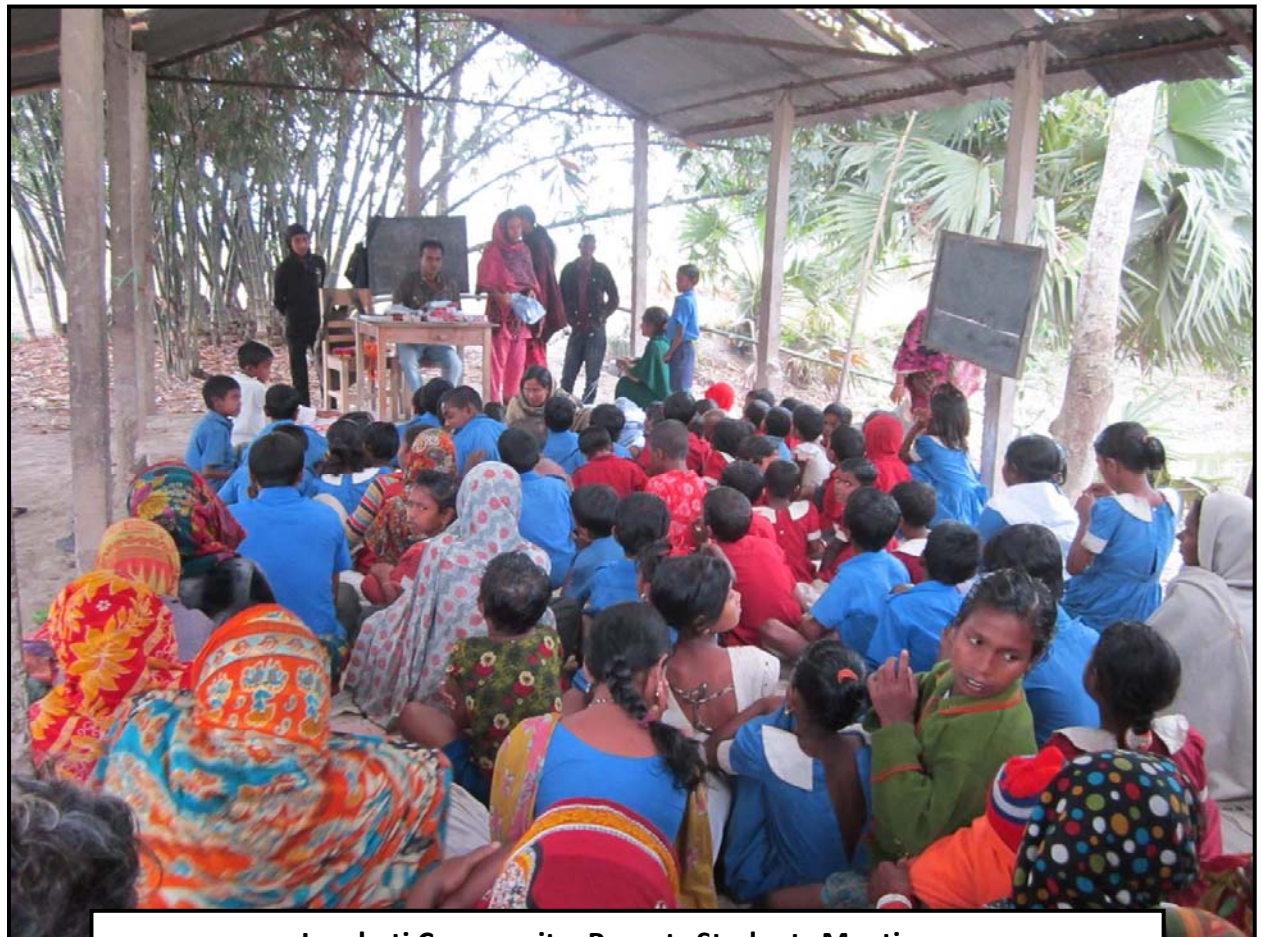
Jogahati Community: Parents Students Meeting...