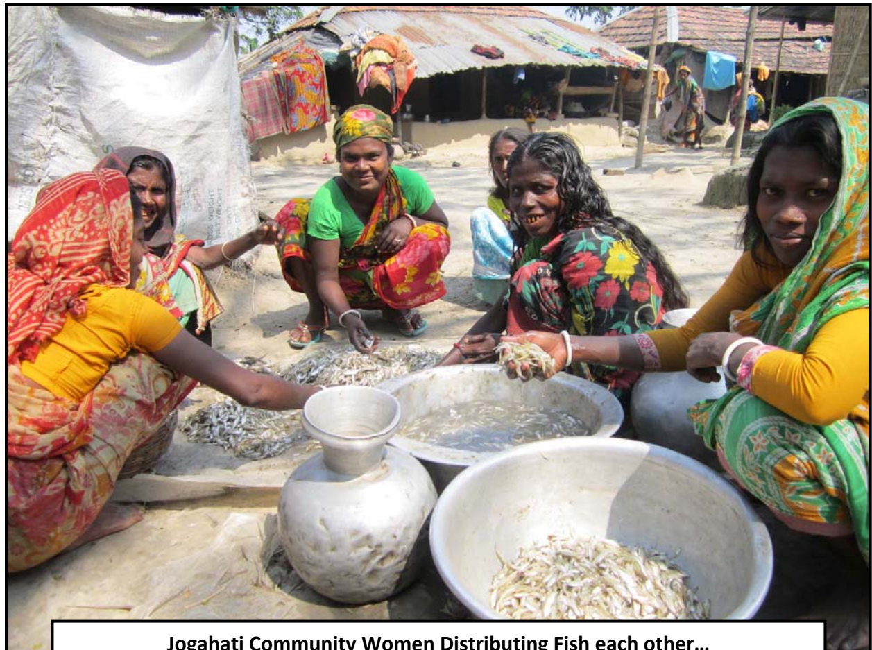
Jogahati Community Women Distributing Fish each other...