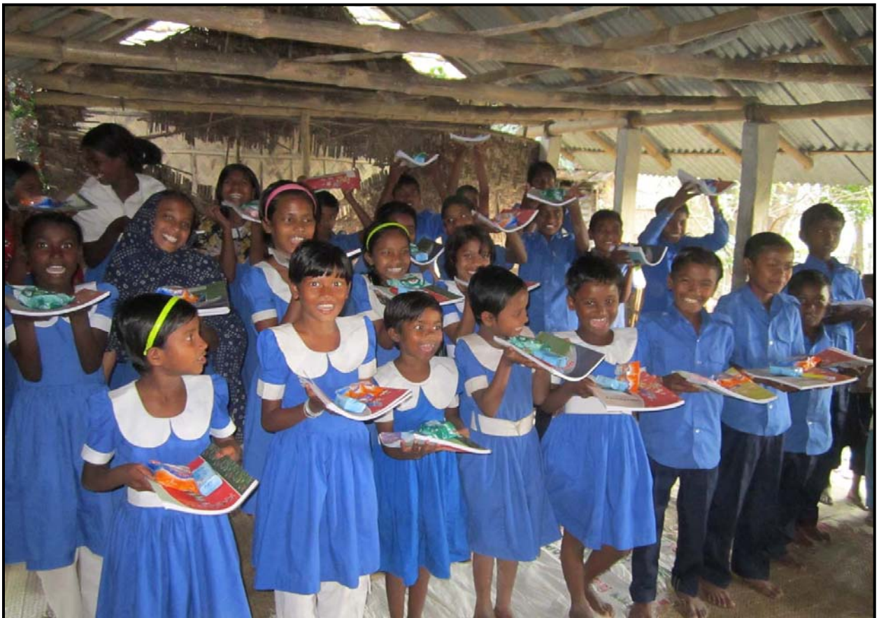
Sorupdaho Community: Students with Materials...