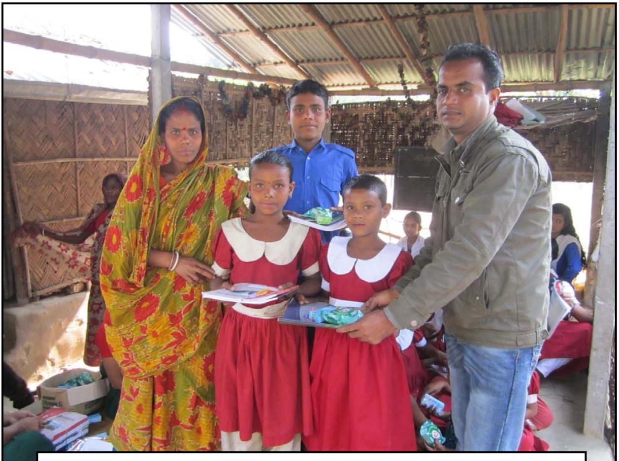
Churamankati Community: Happy students with new materials...