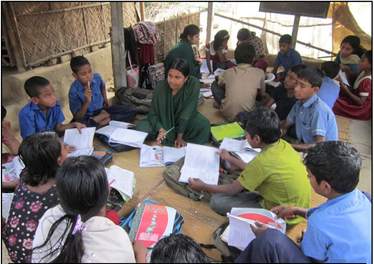
Churamankaty Community: Tuition Programme...