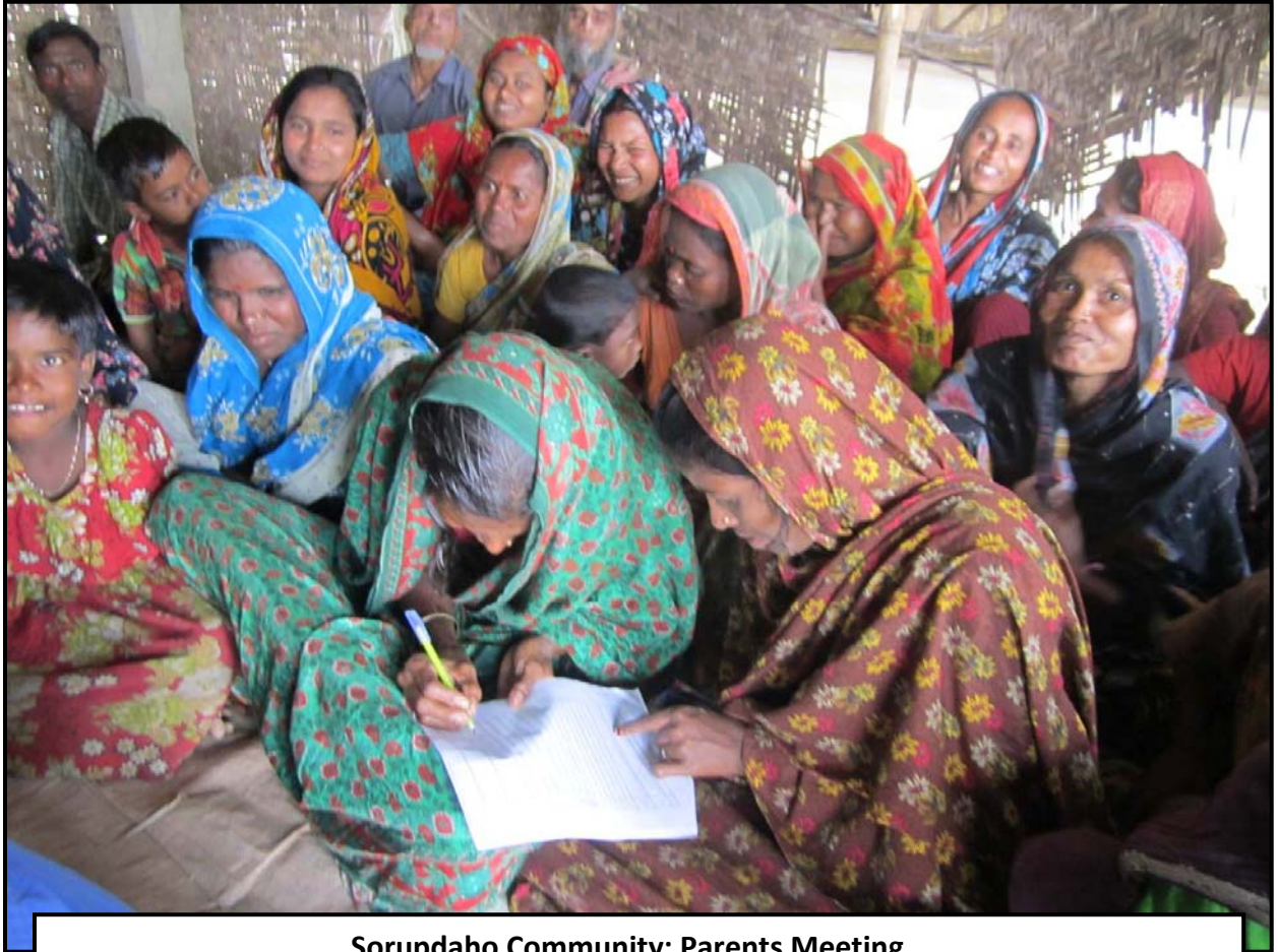
Sorupdaho Community: Parents Meeting...