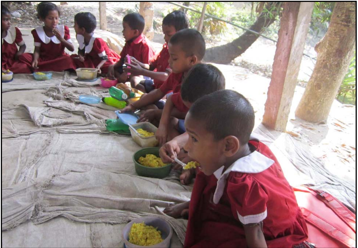
Jogahati Pre-School: Students enjoy the Hot Meal...