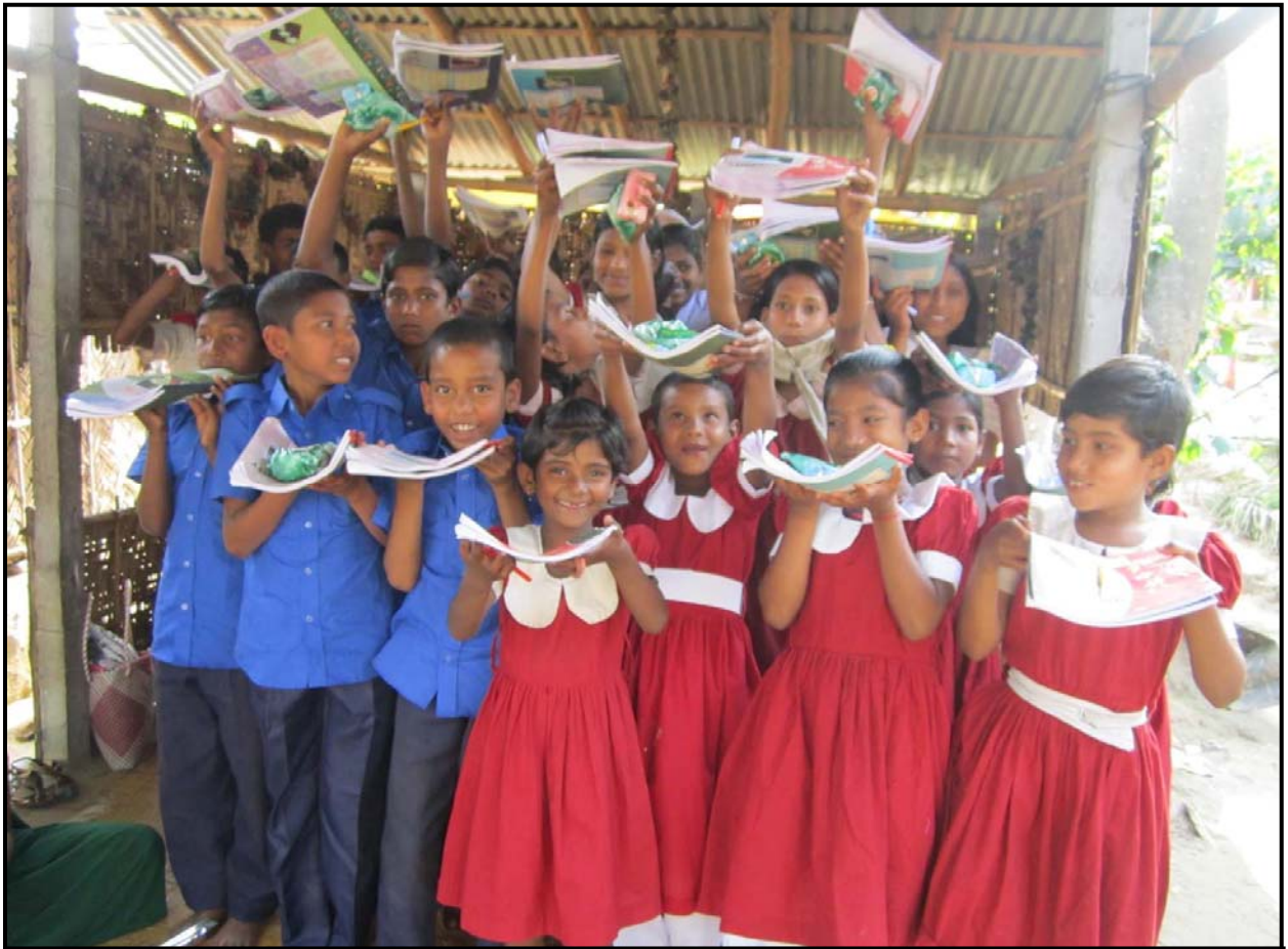
Churamankati Community: Students with Materials...