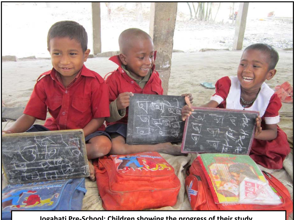
Jogahati Pre-School: Children showing the progress of their study...