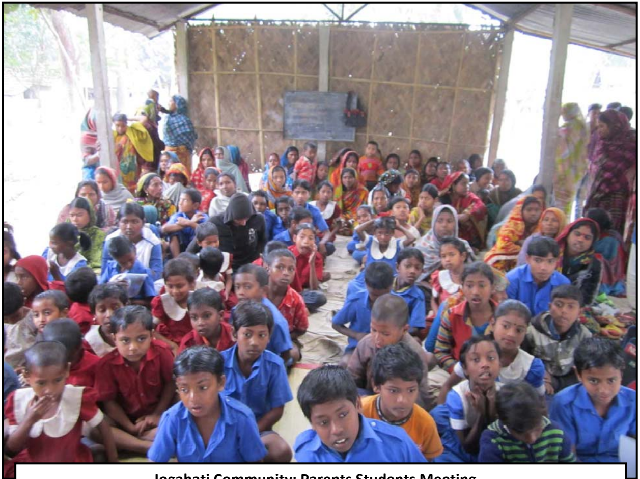
Jogahati Community: Parents Students Meeting...