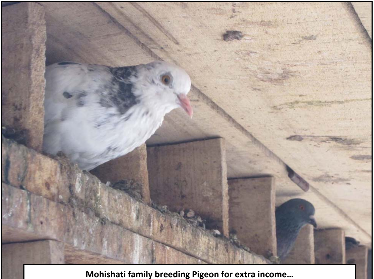
Mohishati family breeding Pigeon for extra income...