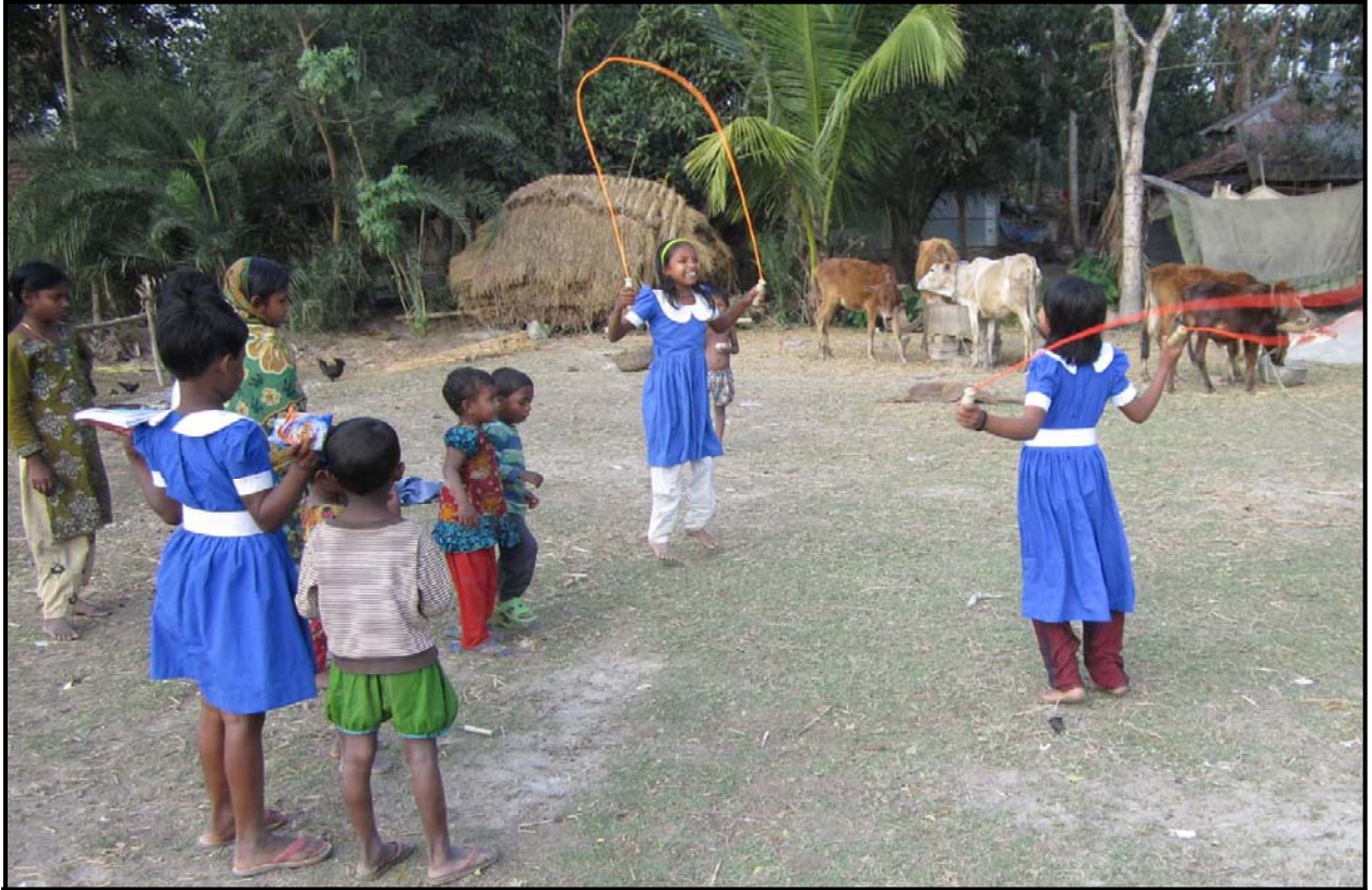
Sorupdaho Community: Student enjoying new sports materials...