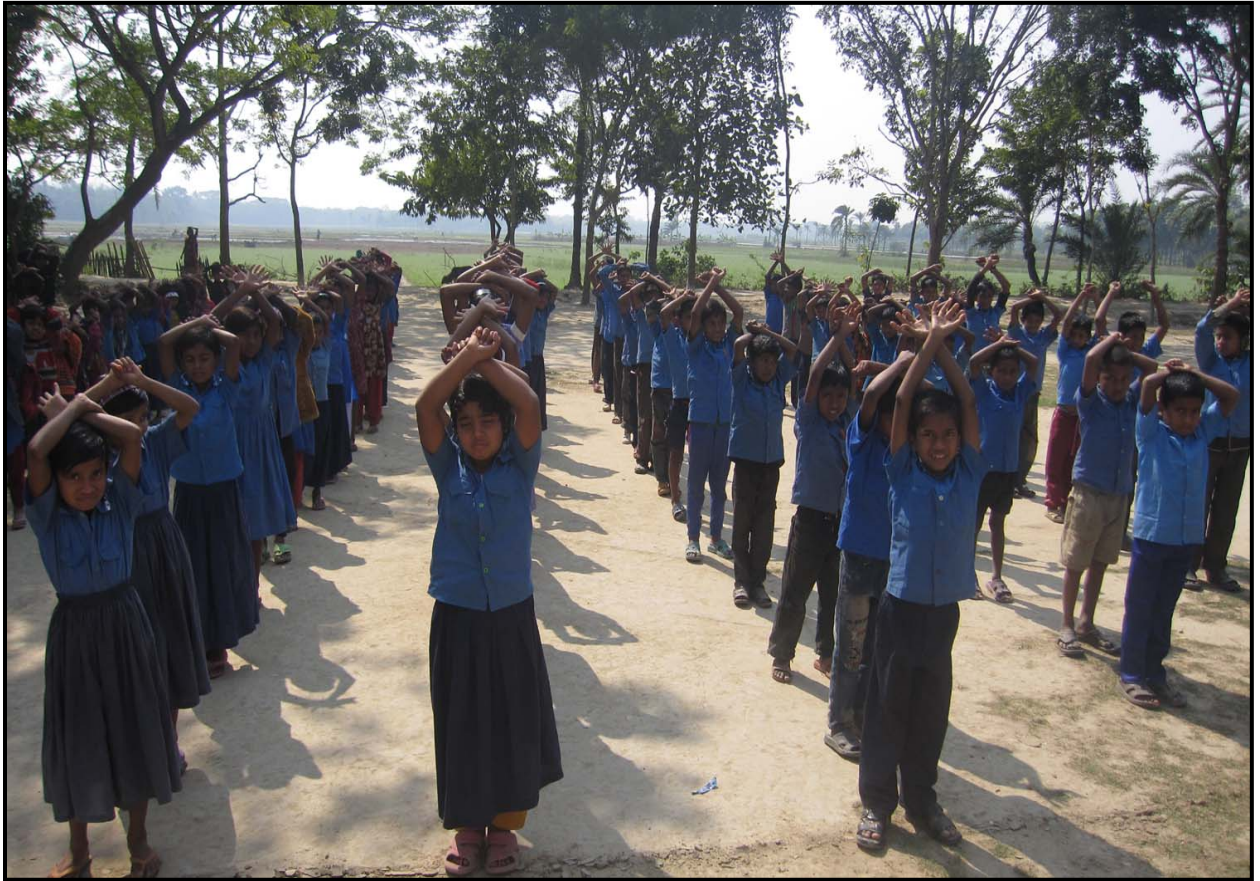
Lolitadaho Government School Morning Exercise...