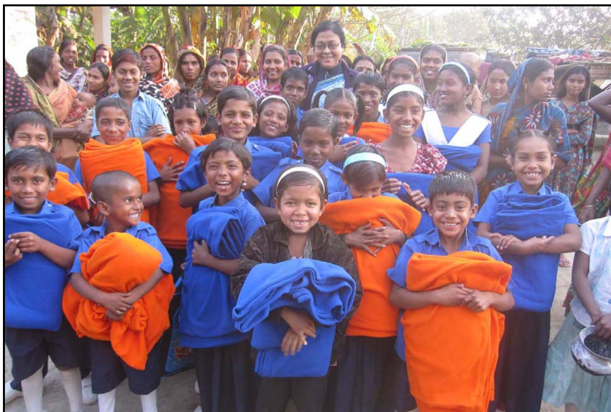
Blanket and happiness at Mohishati