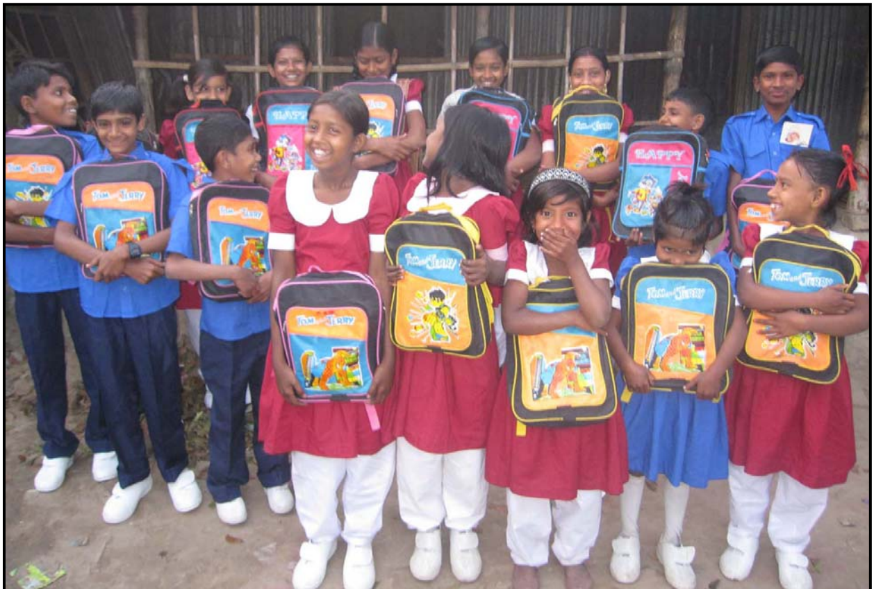
Oh..we too...Churamankati students with materials...