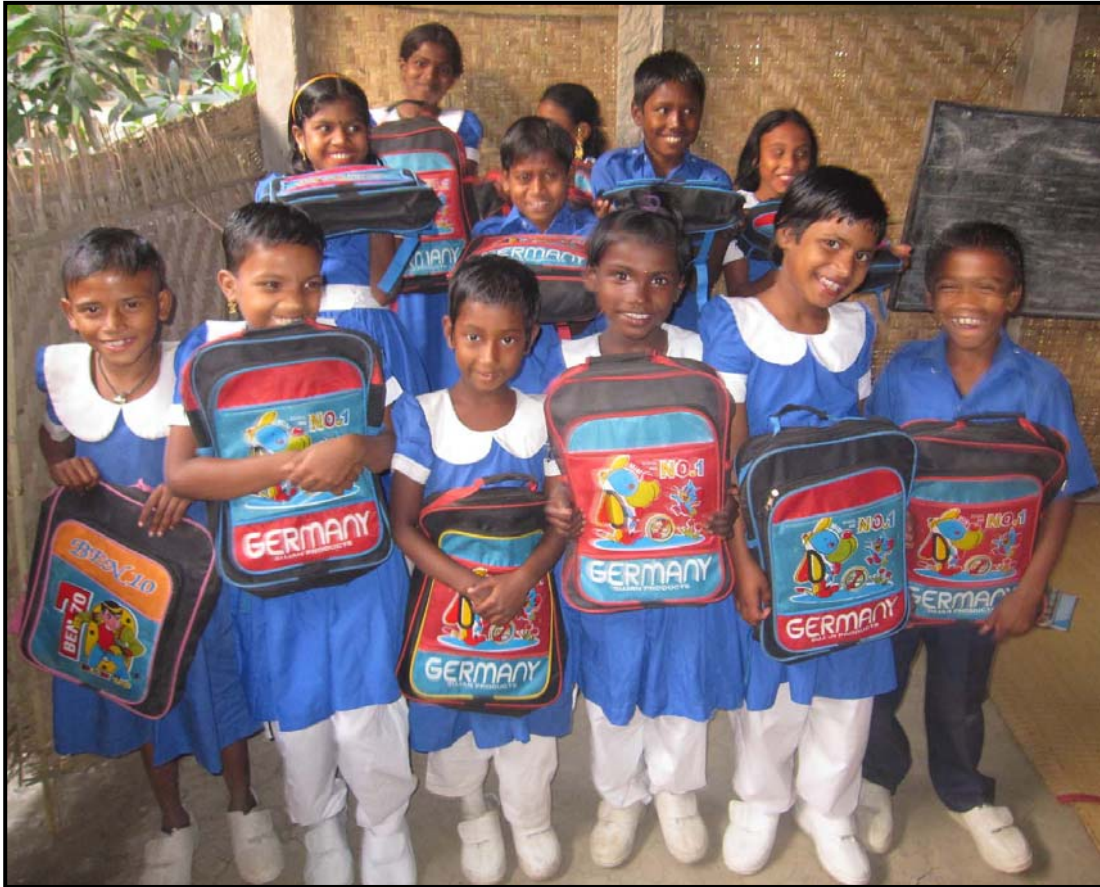
We also...Sorupdaho students with materials...