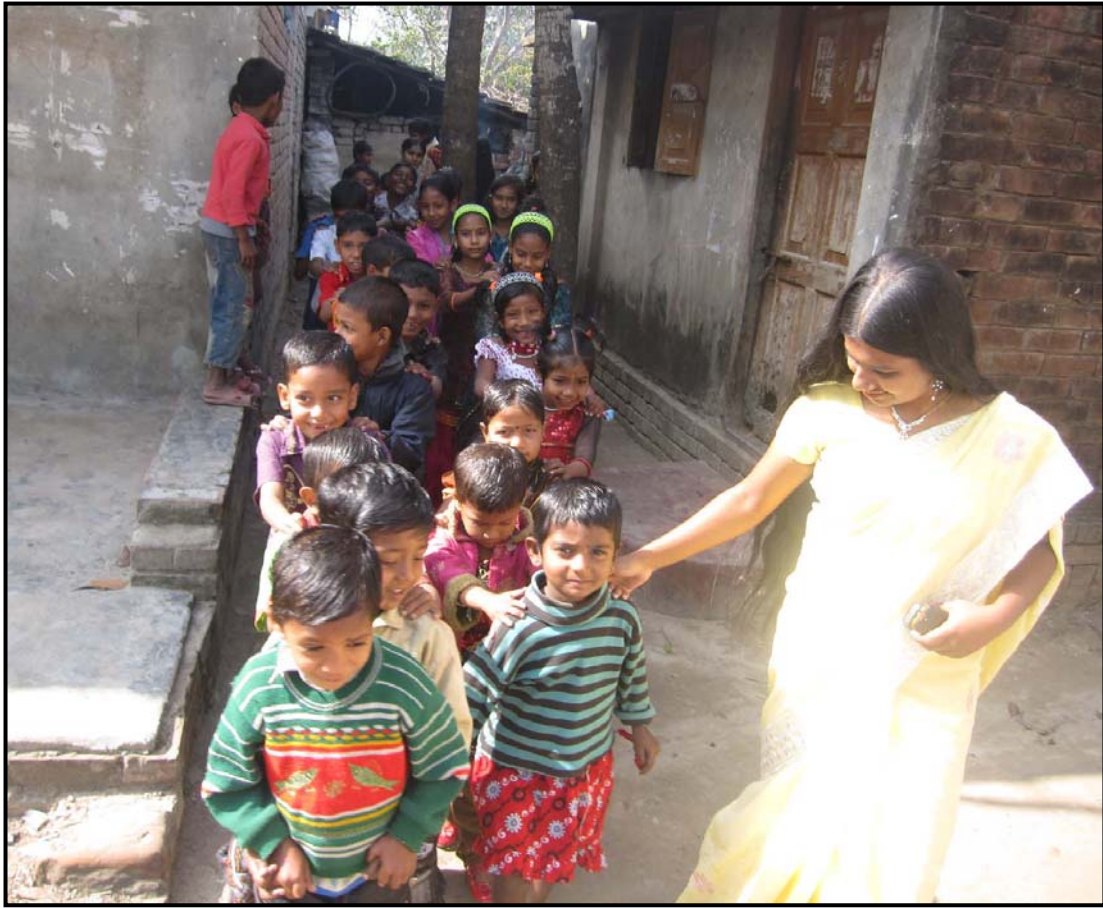
Let's go for PICNIC...Churamankati students outing...