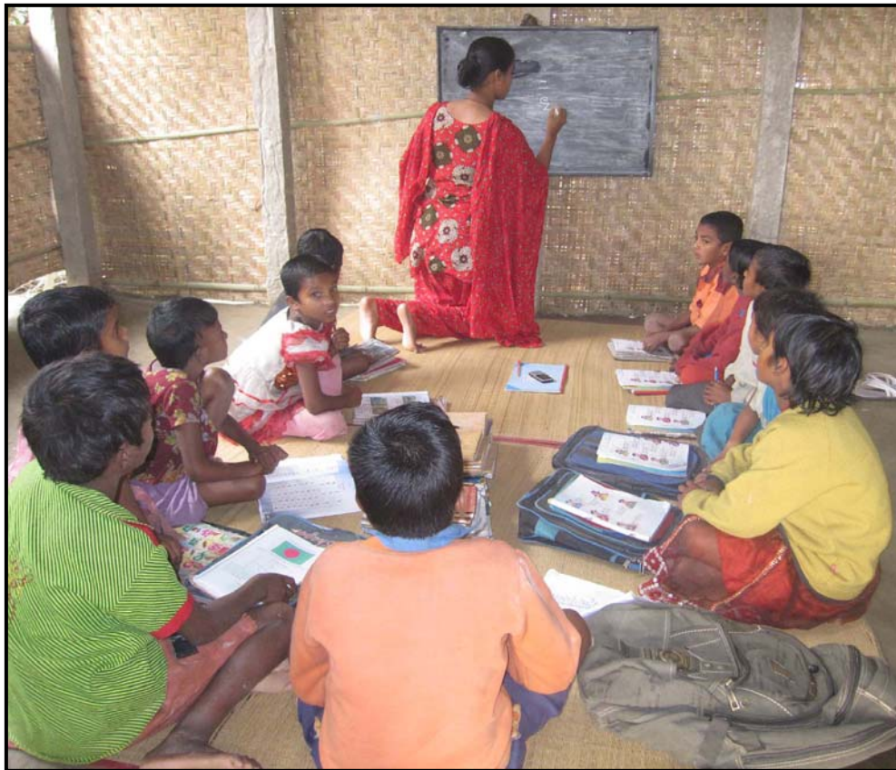
Tuition class at Sorupdaho Study Centre...