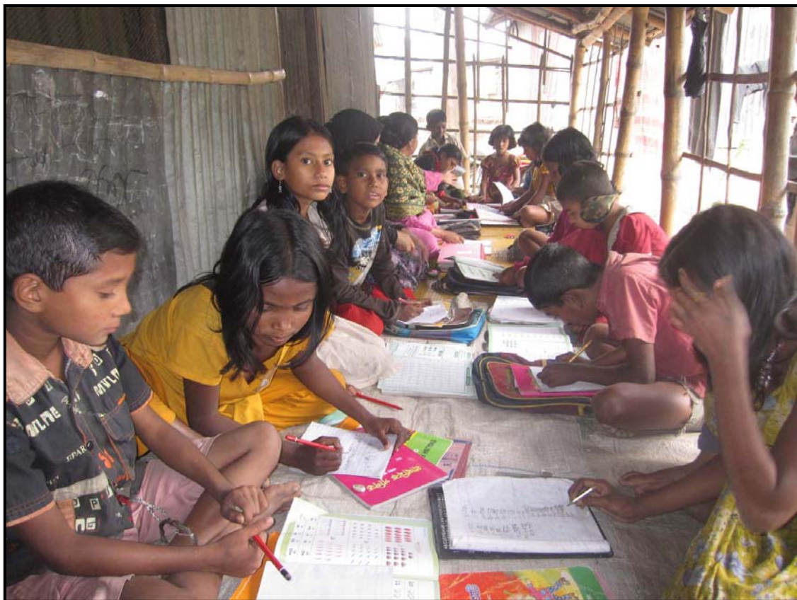
Churamankati tuition programme...