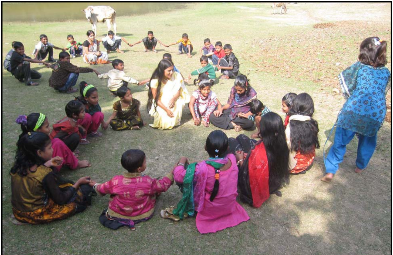
Sports and Fun at Picnic...