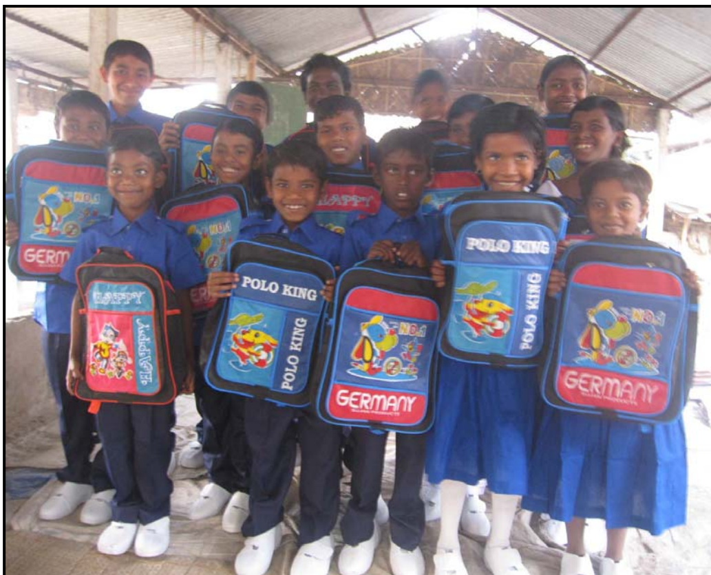
YES...we got too...Jogahati students with materials...