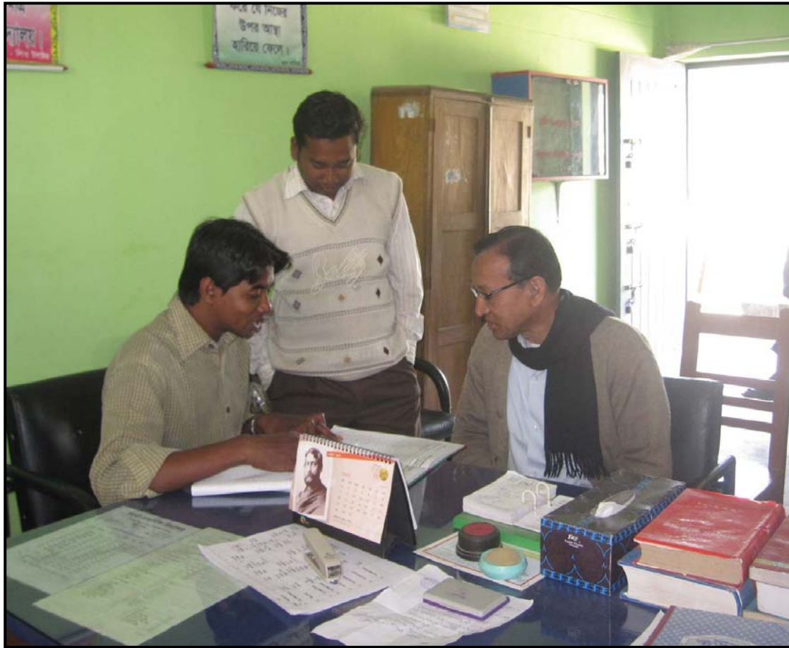
Students attendance data collection at Jogahati High School...