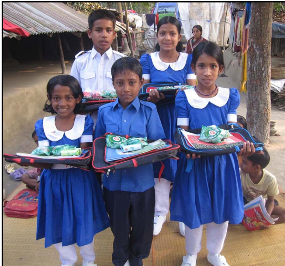
Lolitadaho Students with new Uniform, Shoes, Bags and Materials...