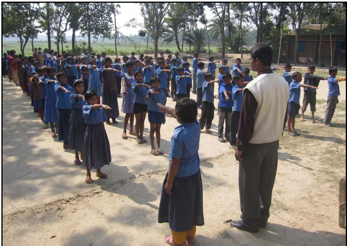
Lolitadaho Government School Students daily oath for goodness...