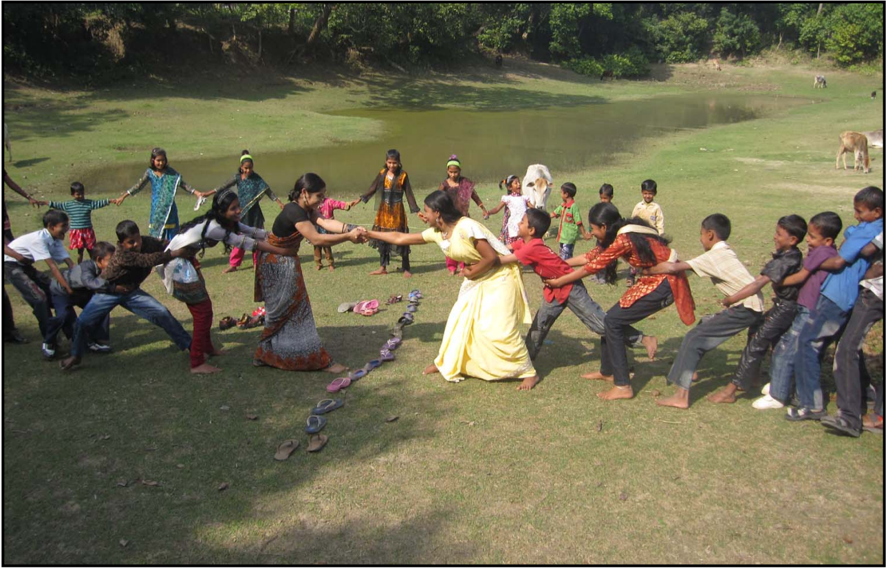
Sports and Fun at Picnic...