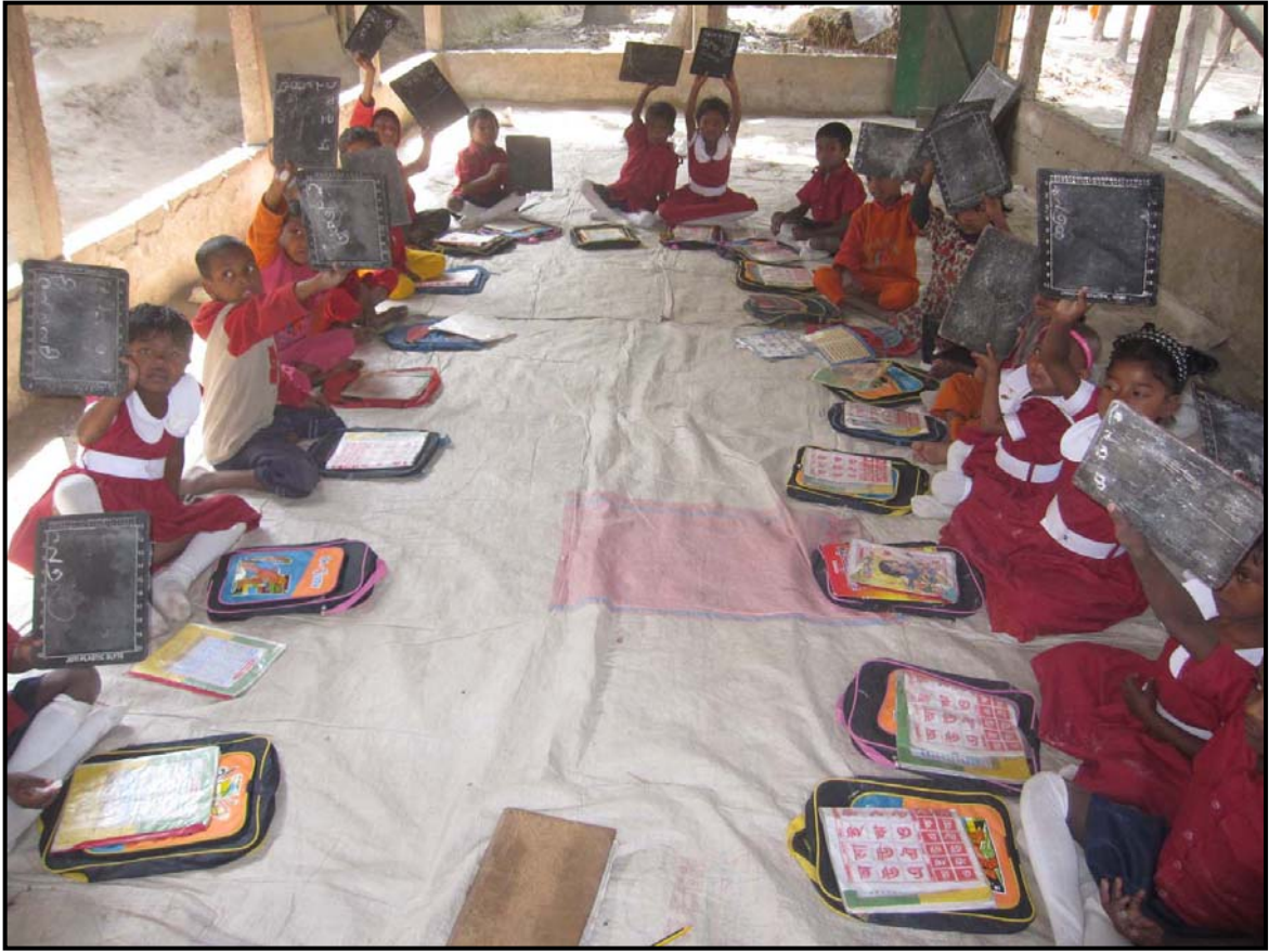
Look we can write...