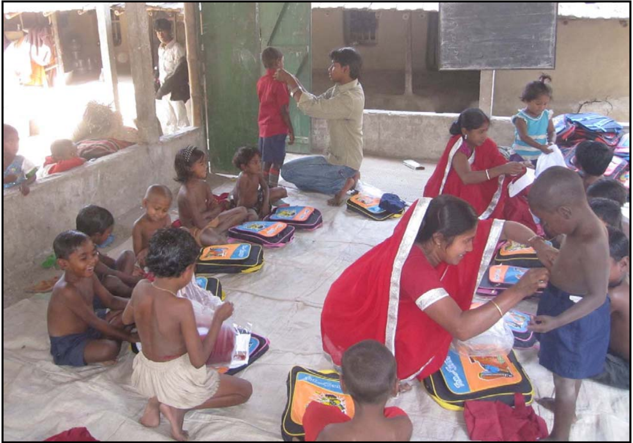
Testing School Dress with Jogahati Pre-school students...