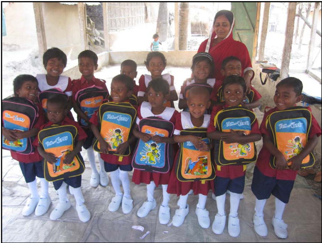
Now we looks different!!!...