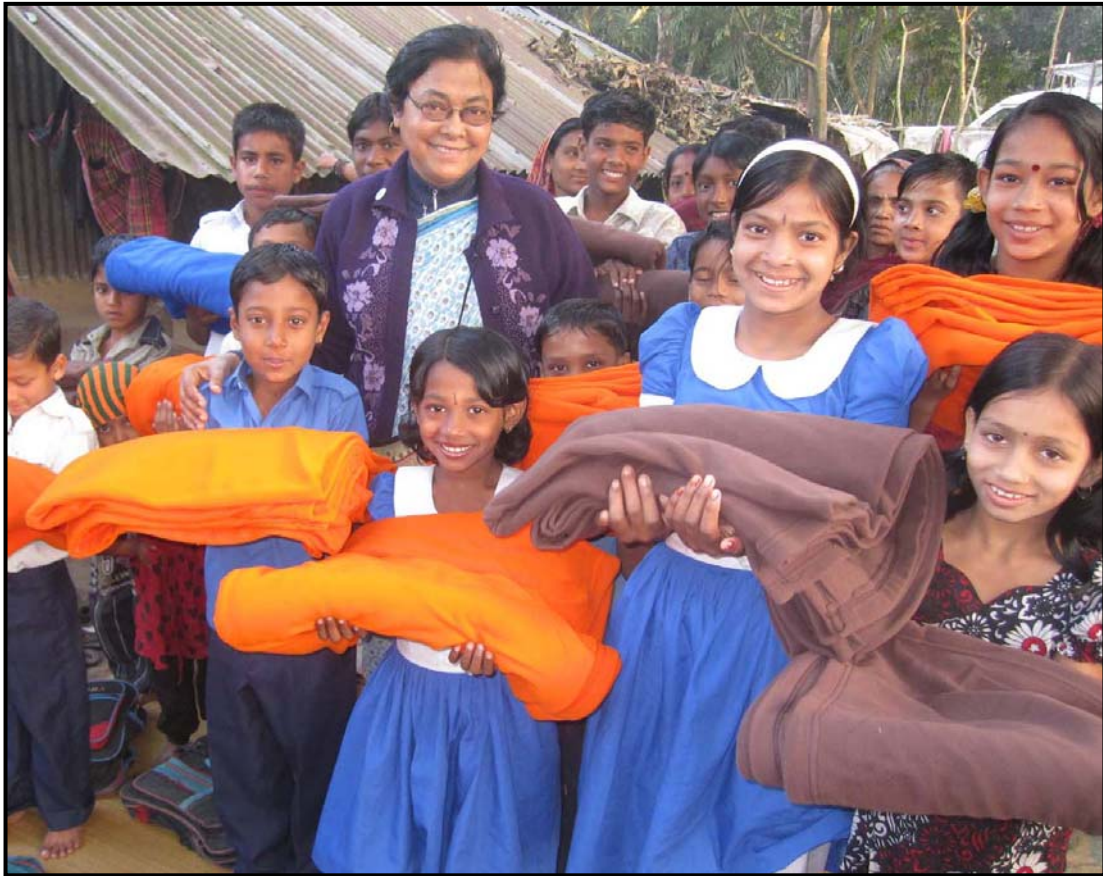
Blanket and smile at Lolitadaho