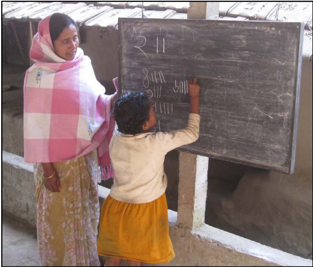
Students at Jogahati pre-school class...