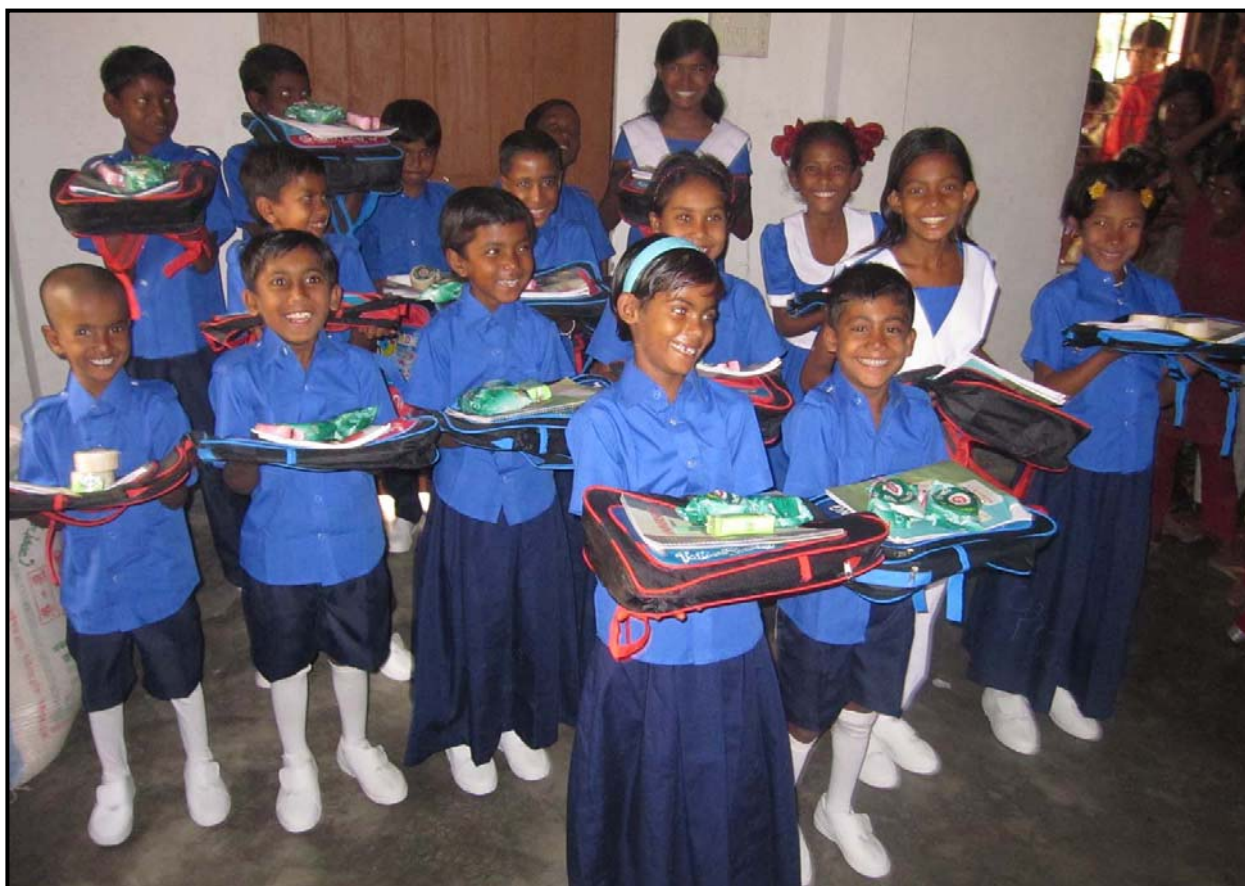
Happy faces at Mohishati Community for the new Uniform, Shoes, Bags and Materials