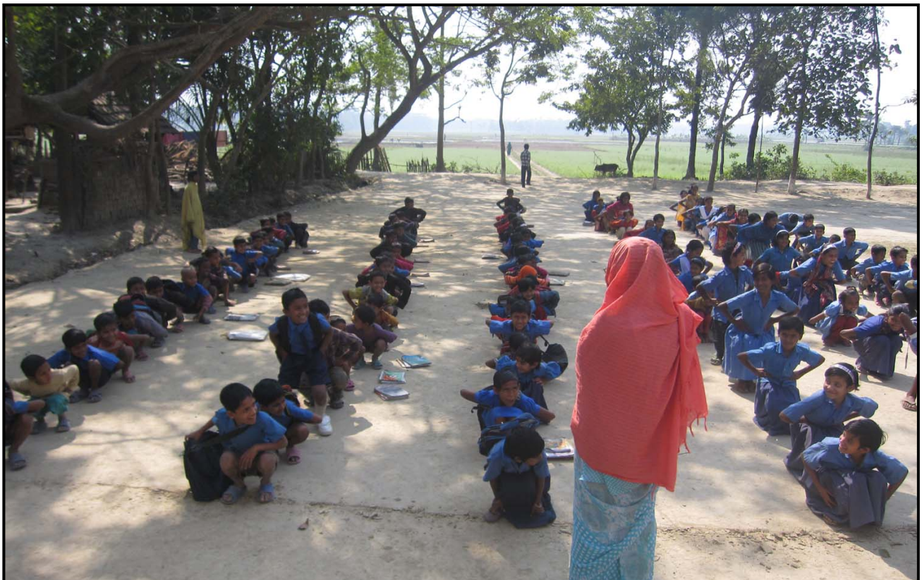
Lolitadaho Government School Morning Exercise...