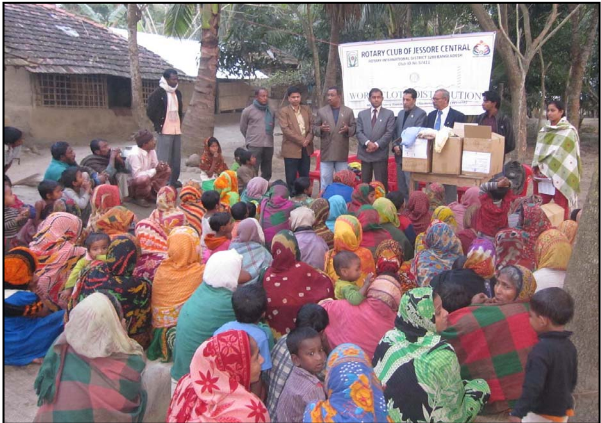
Rotary Club Warm Cloth Distribution at Sorupdaho Community...