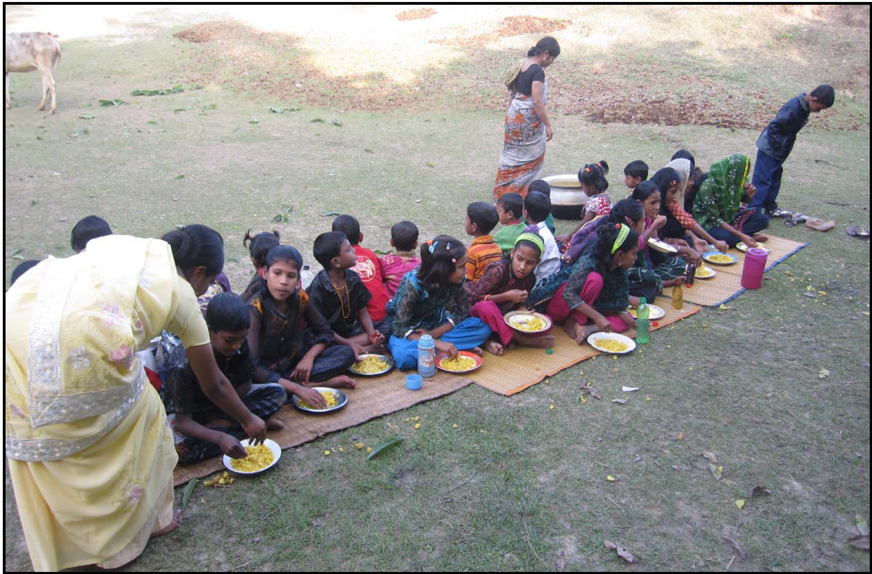
Feast at Picnic...