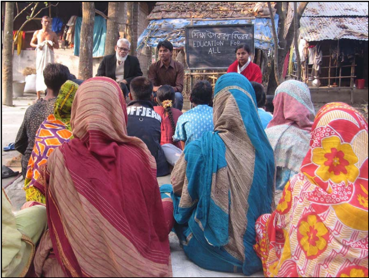
Distribution programme at Lolitadaho...