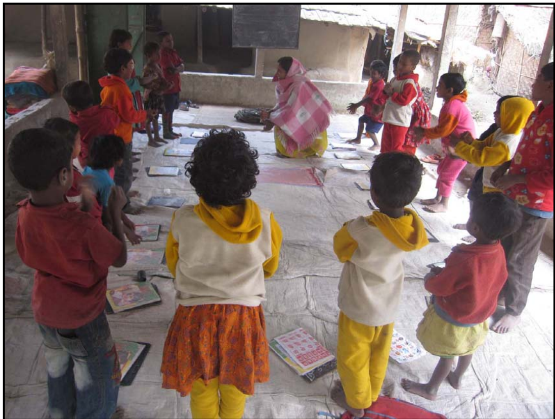
Let's play together...