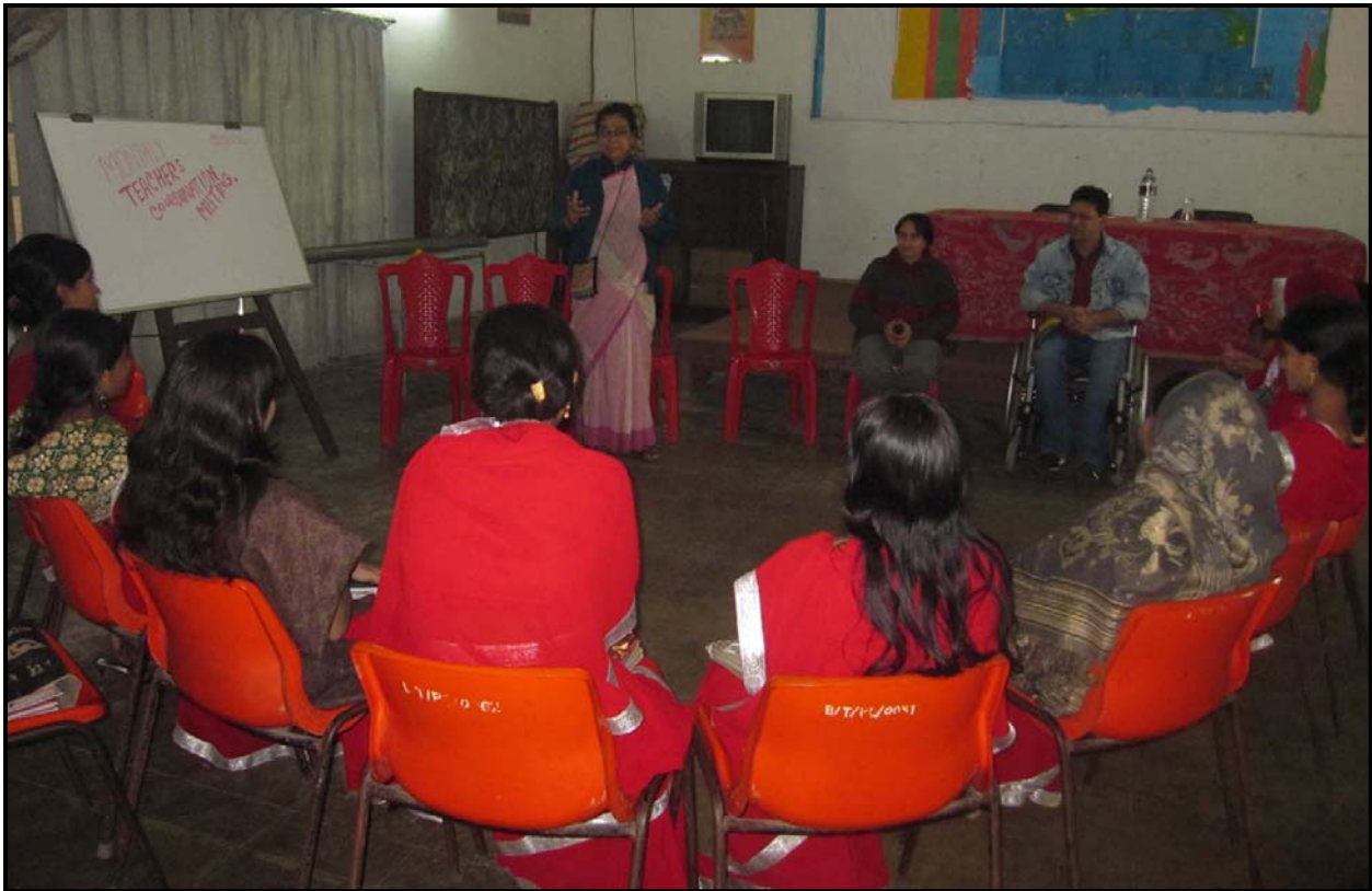
Tuition teacher's coordination meeting...