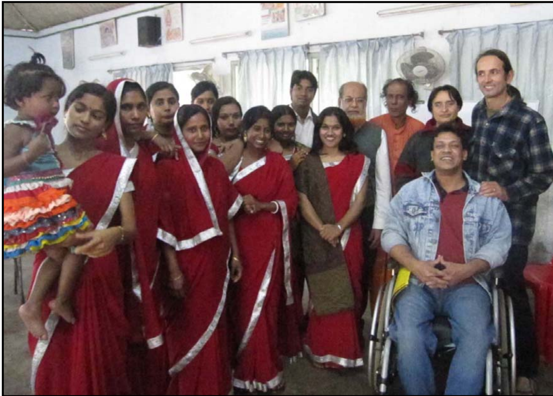
The EDUCATION FOR ALL Team...