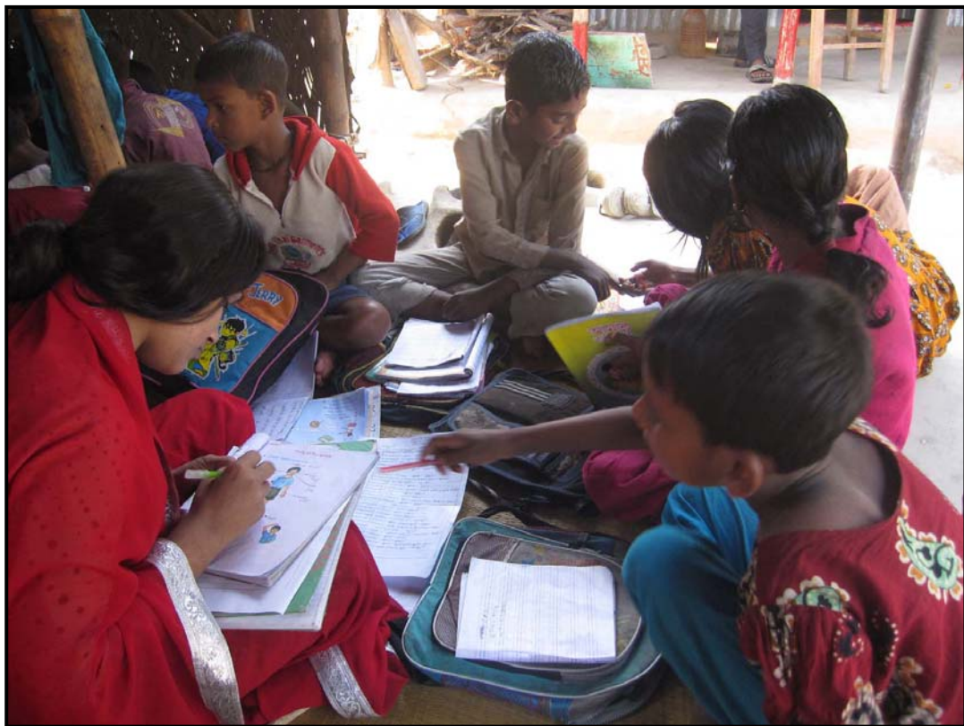
Tuition programme at Churamankati...