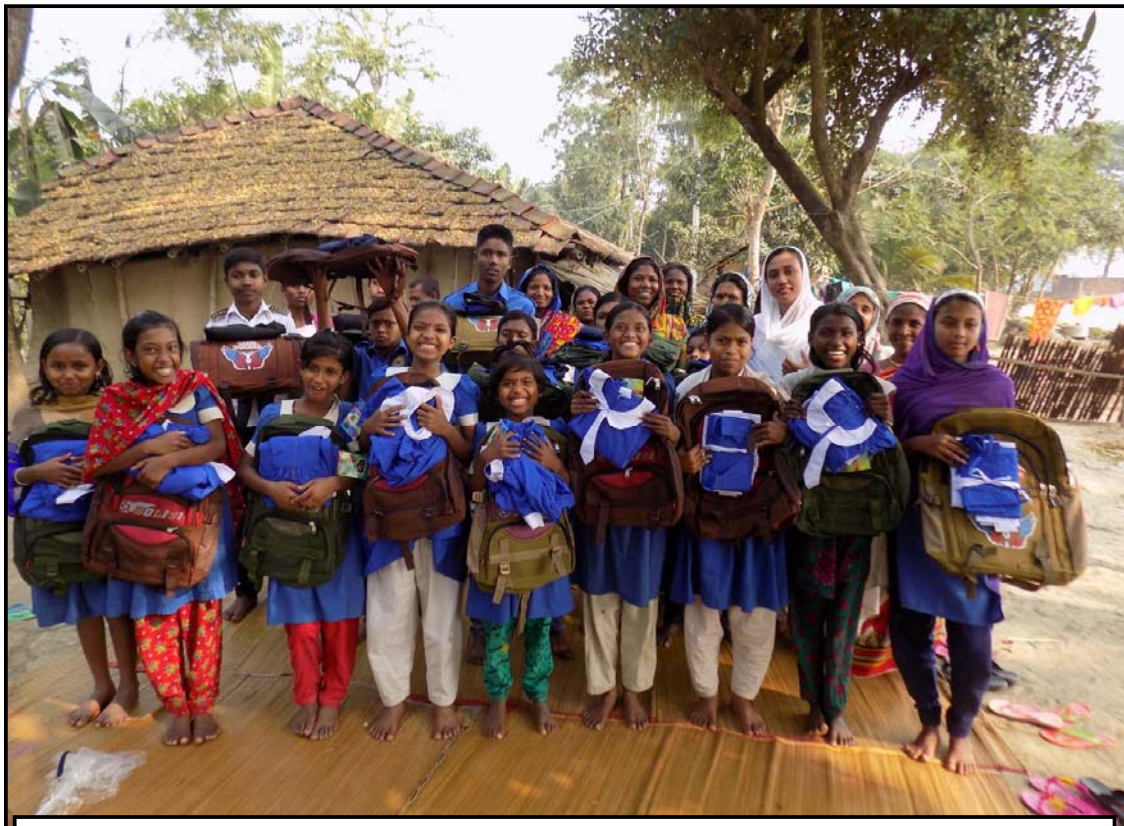
Sorupdaho Community Students happy with new bag, uniform and materials...