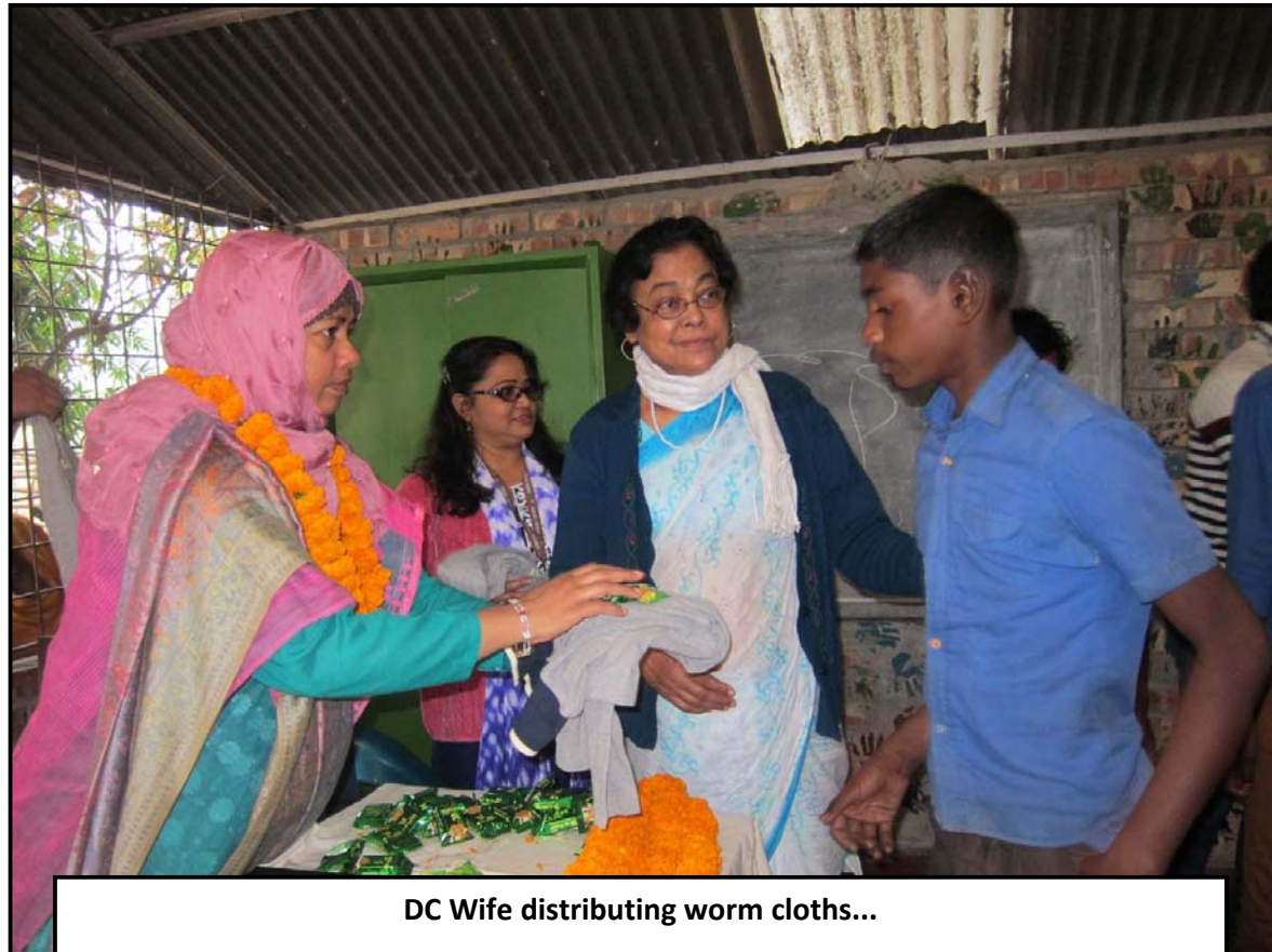
DC Wife distributing worm cloths...