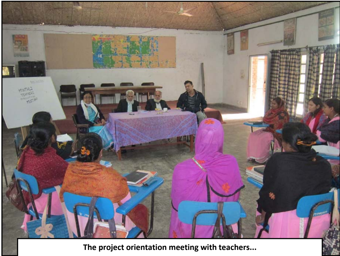
The project orientation meeting with teachers...