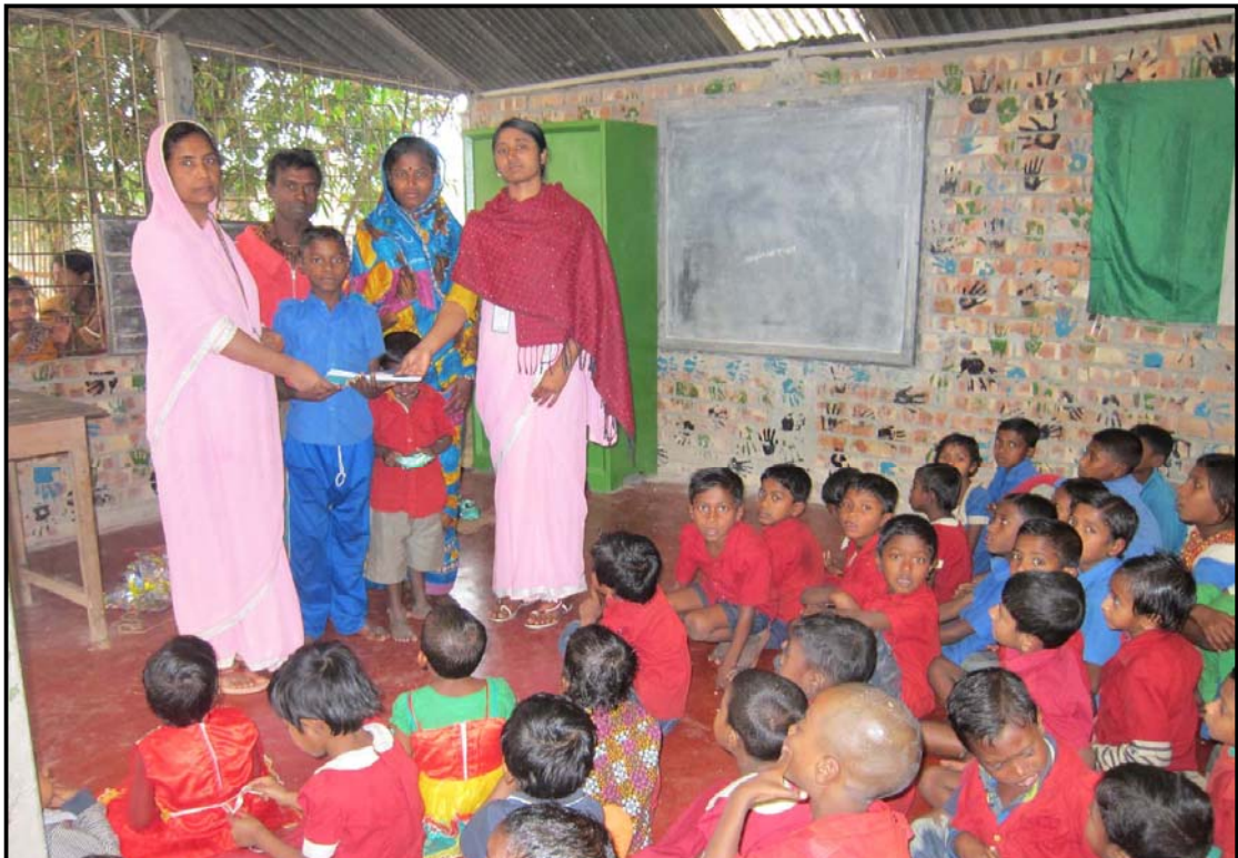
Materials distribution at Jogahati...