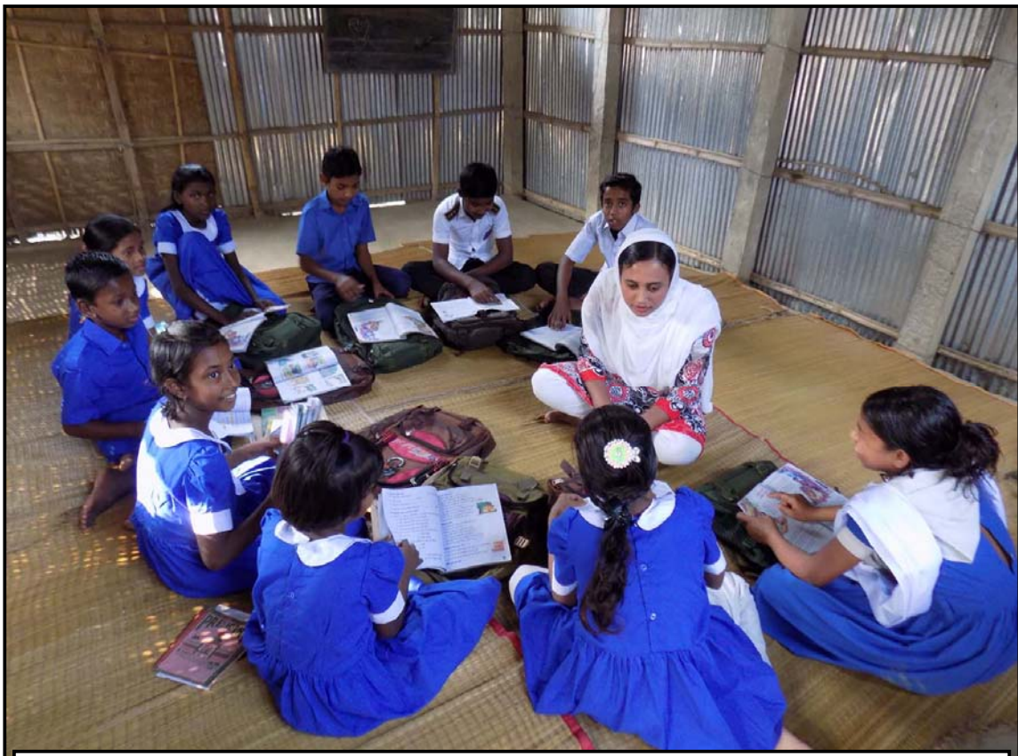
New teacher in Sorupdaho community...