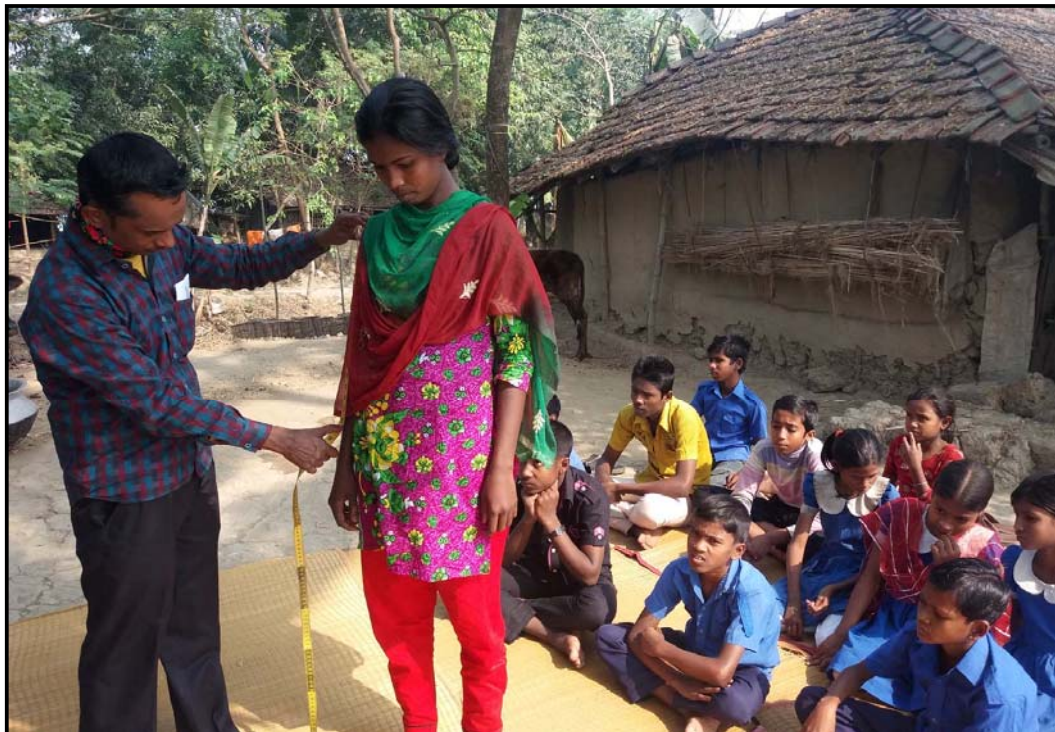
We took school uniform measurement for students...