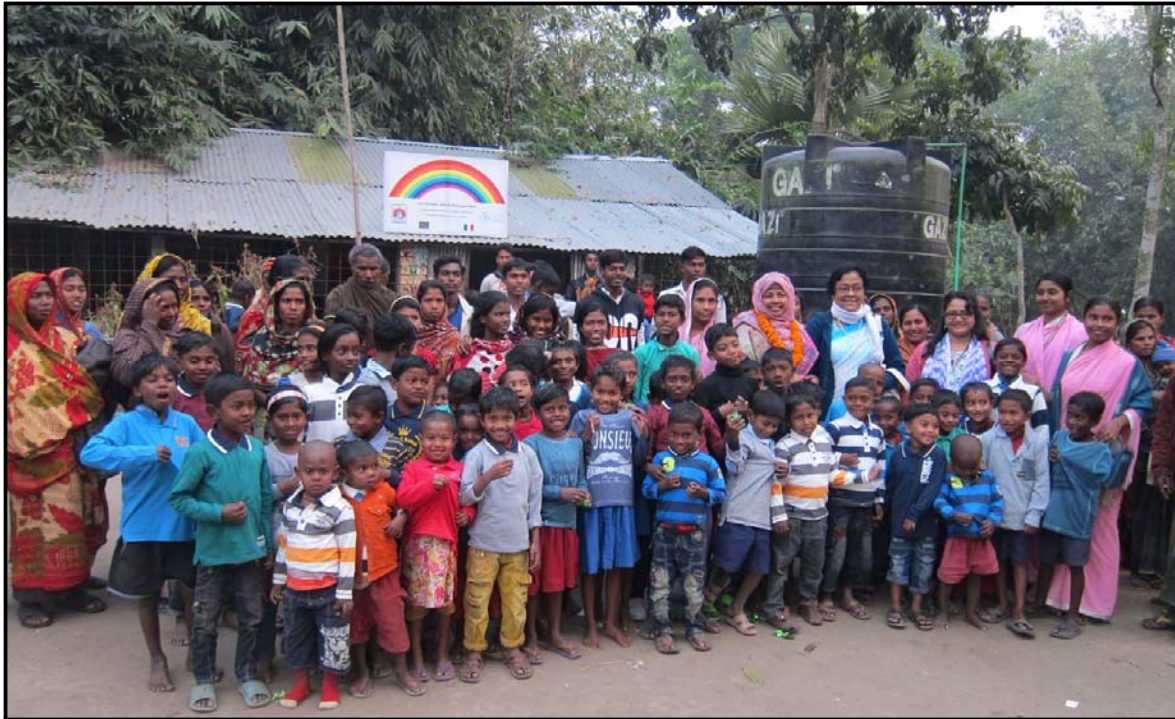
All together at the Jogahati...