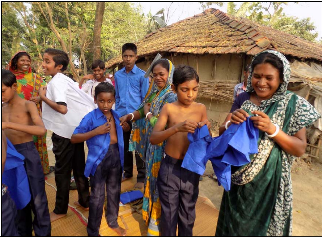
The parents also happy to wear the kids new school uniform...