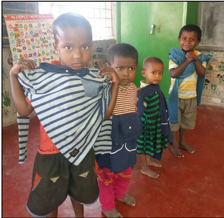
Children happy to have the cloths...