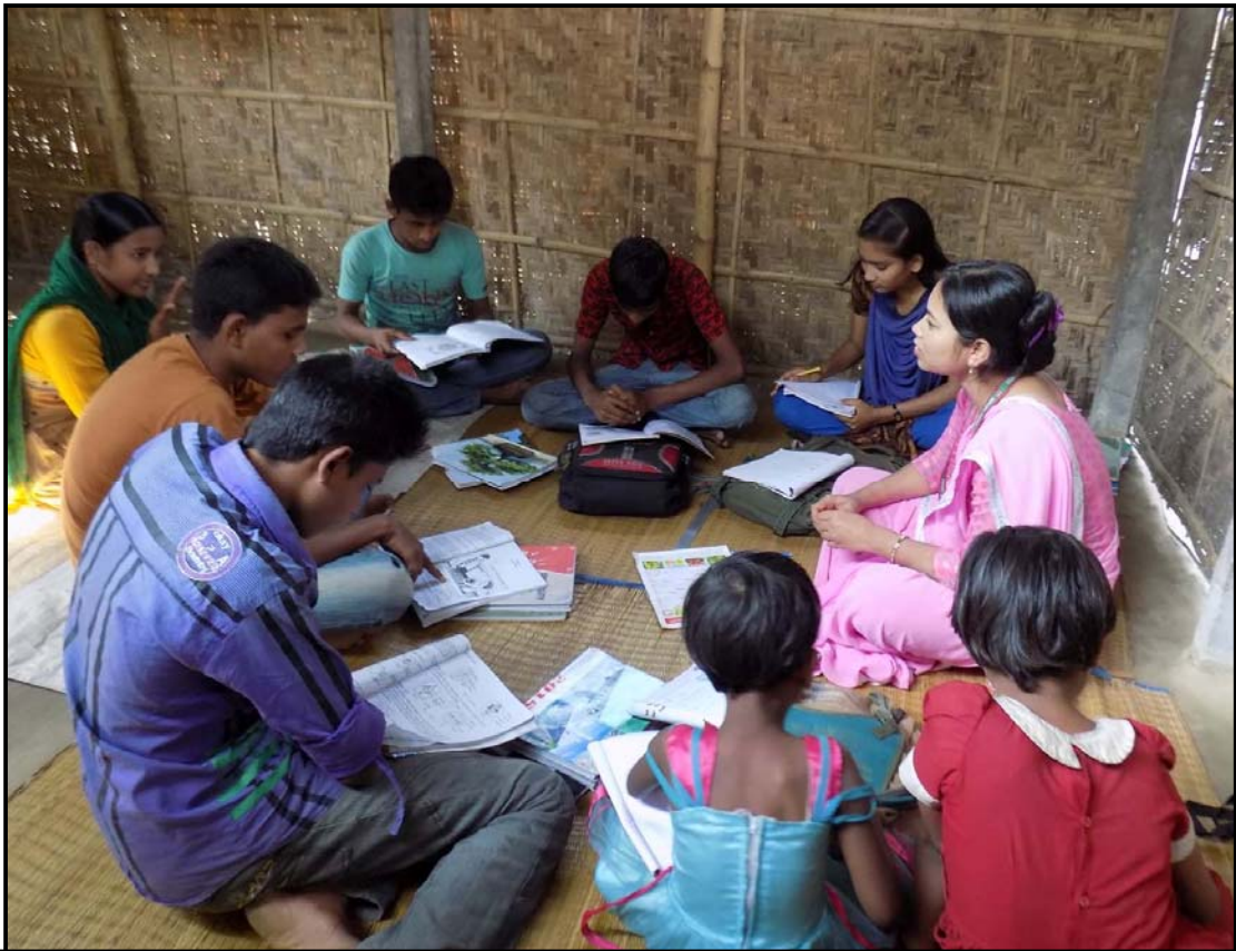
Tuition Class at Churamankati Community...