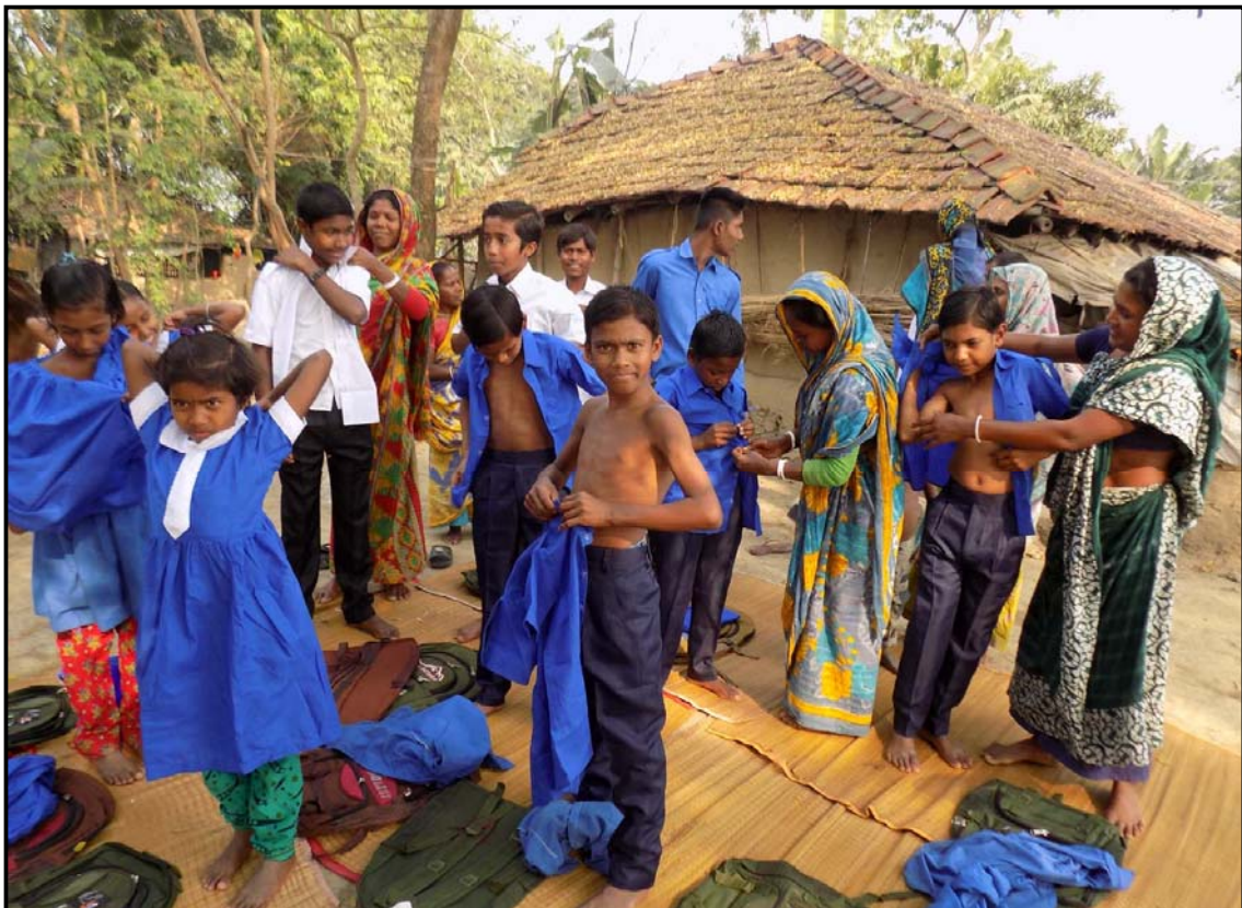
Happy to have new school uniform...