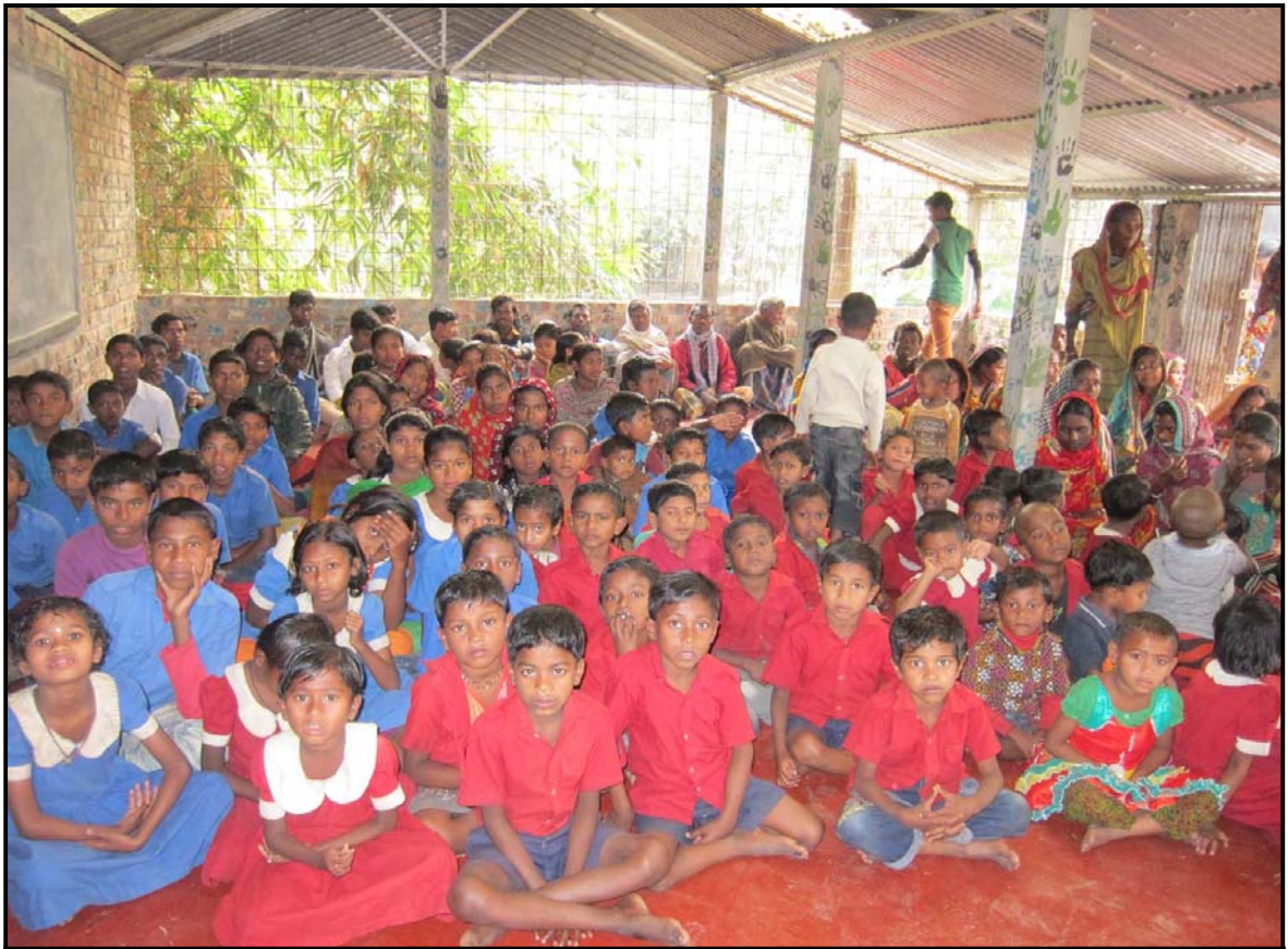
Jogahati community monthly students and parents meeting...