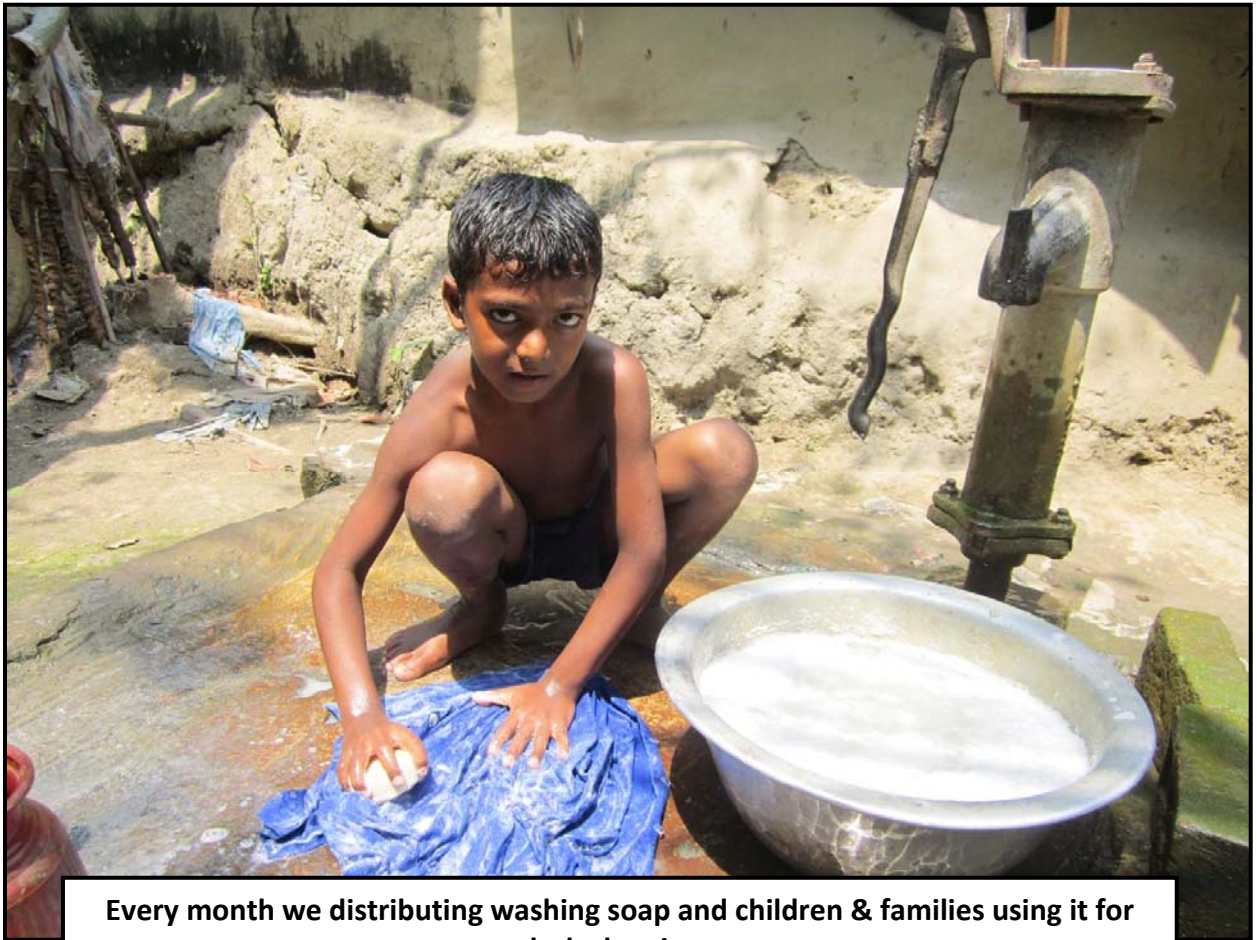
Every month we distributing washing soap and children & families using it for cloth cleaning...