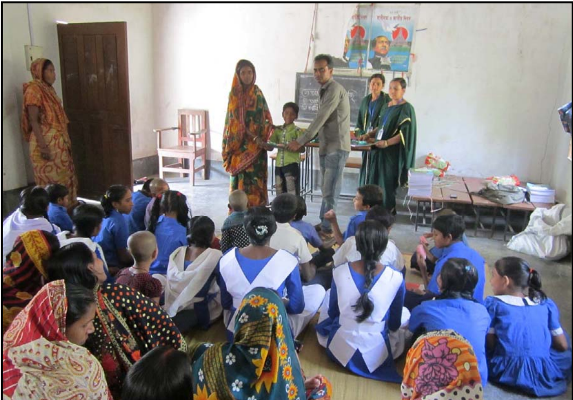
Mohishati Community: Distribution Programme...