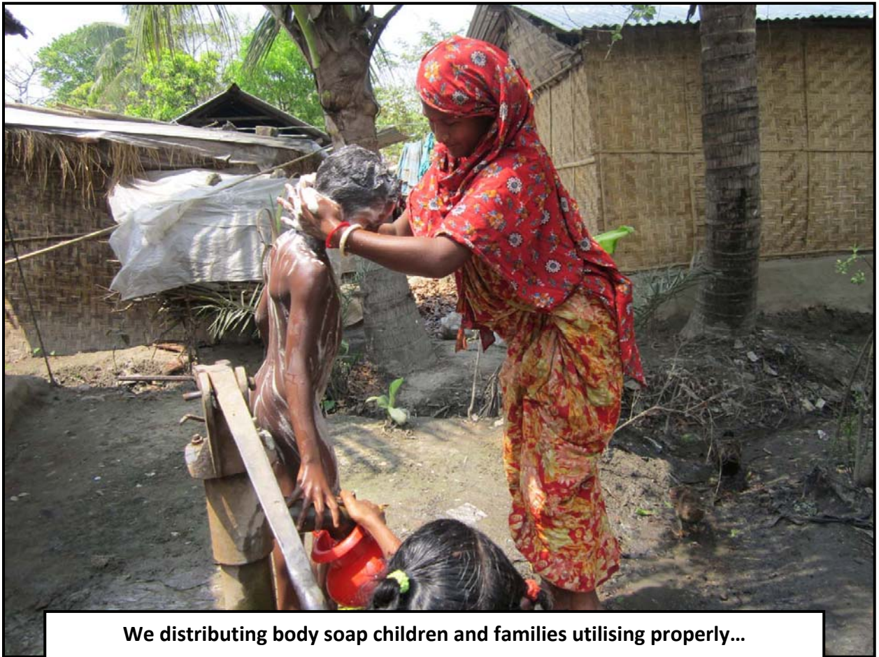
We distributing body soap children and families utilising properly...