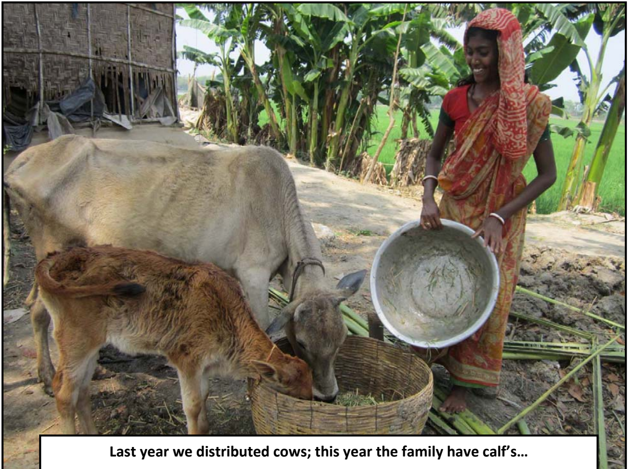
Last year we distributed cows; this year the family have calf's...