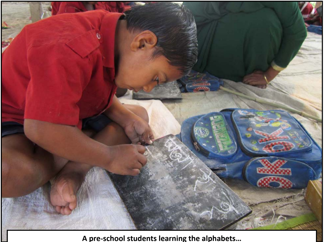
A pre-school students learning the alphabets...