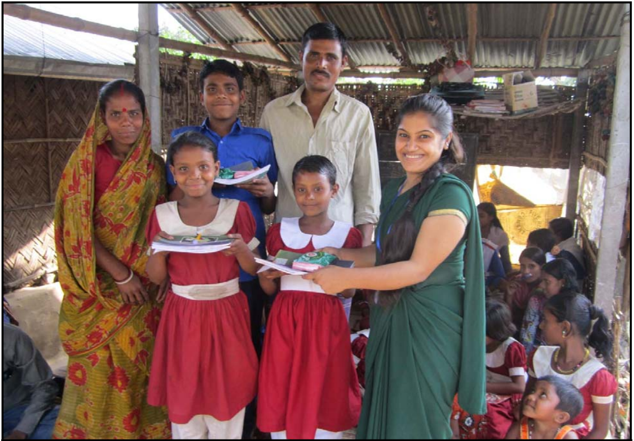
Churamankati Community: Distribution Programme...