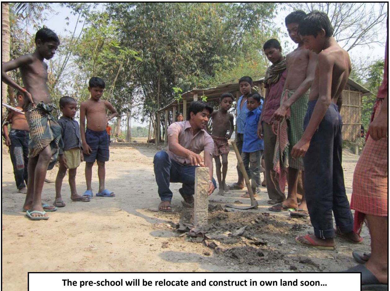
The pre-school will be relocate and construct in own land soon...