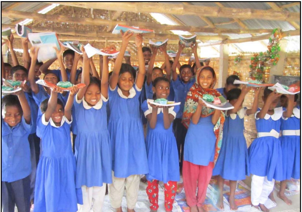
Sorupdaho Community: Students with Materials...