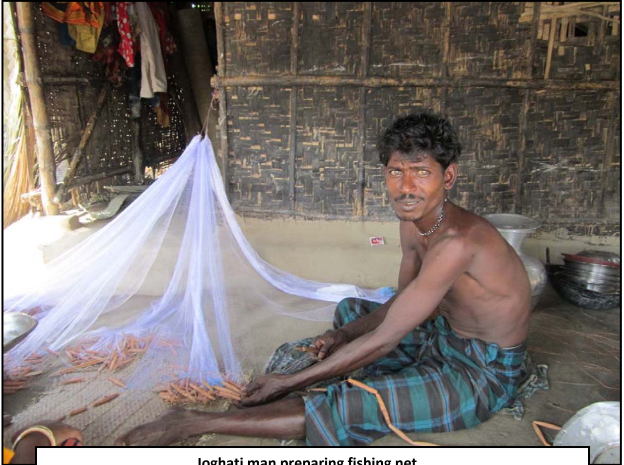
Joghati man preparing fishing net...