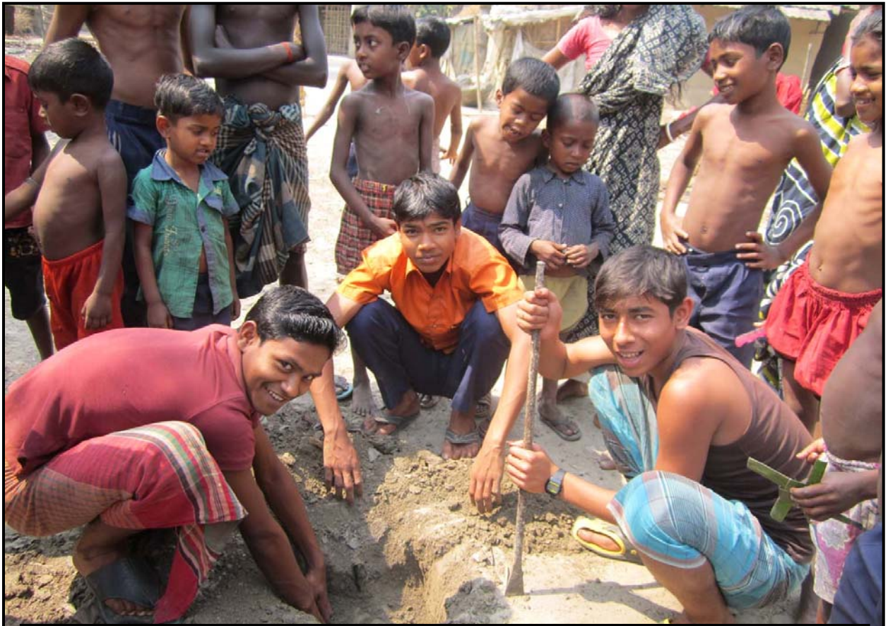
Jogahati students preparing boundary line for school...