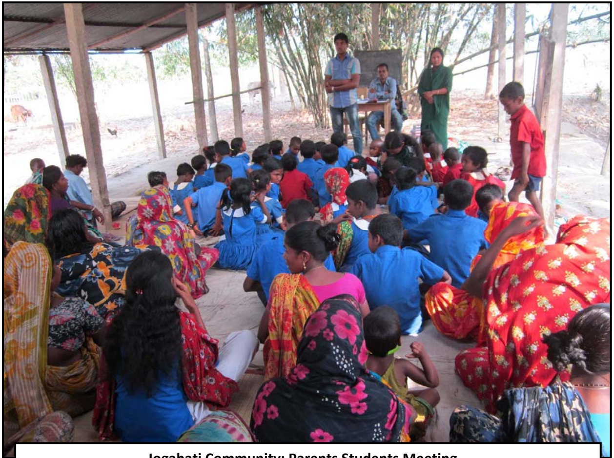
Jogahati Community: Parents Students Meeting...