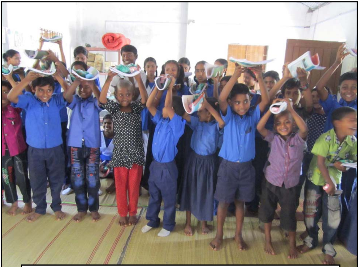
Mohishati Community: Happy students with new materials...