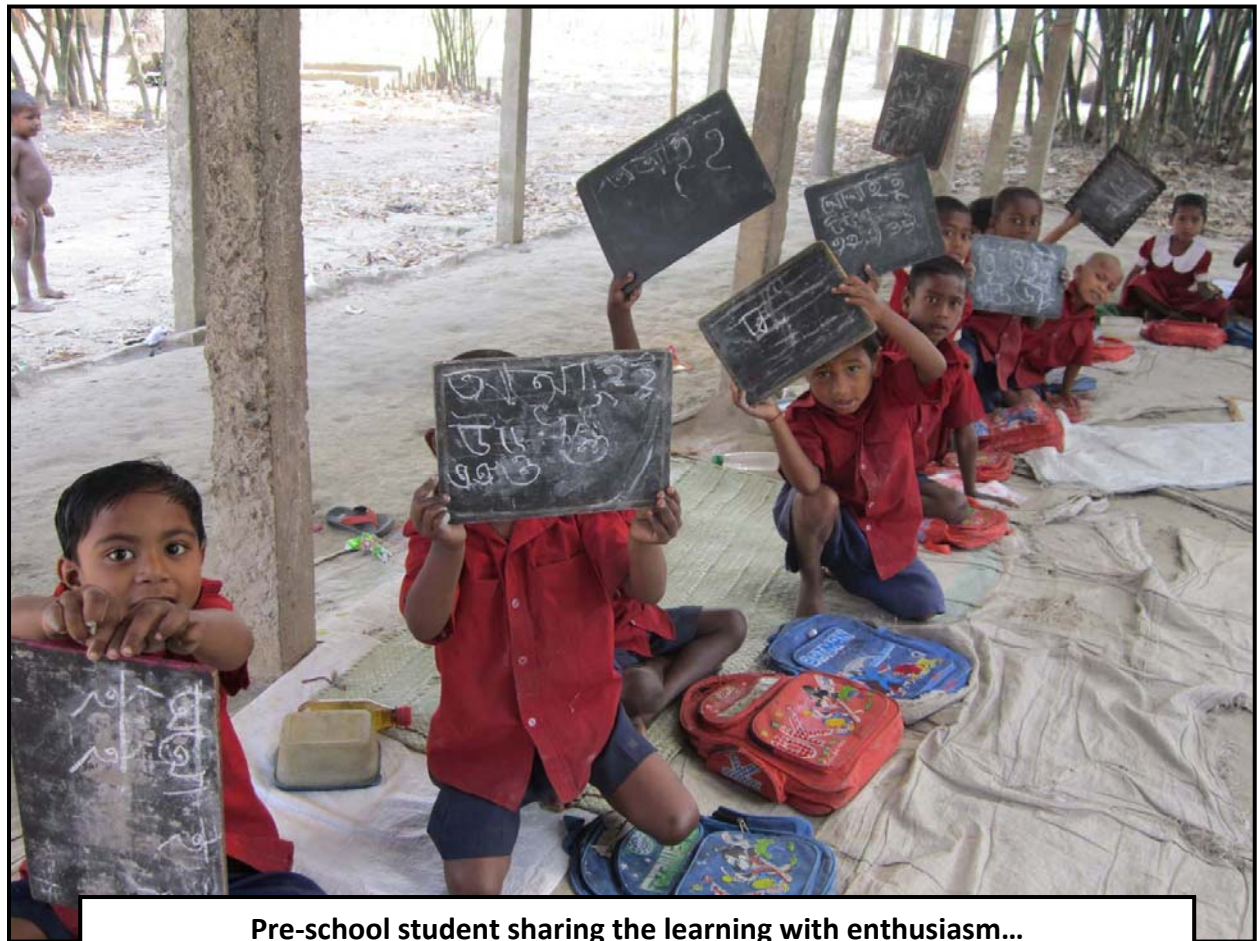
Pre-school student sharing the learning with enthusiasm...