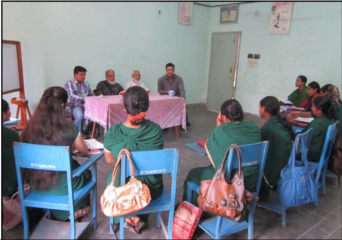
Monthly teacher's coordination meeting at BS Office...