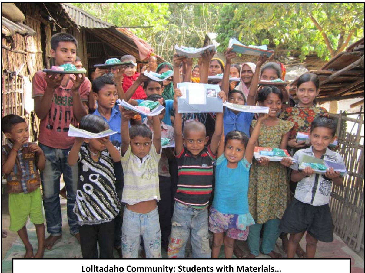
Lolitadaho Community: Students with Materials...