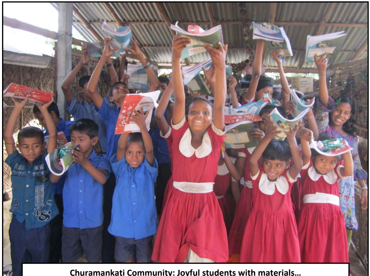
Churamankati Community: Joyful students with materials...