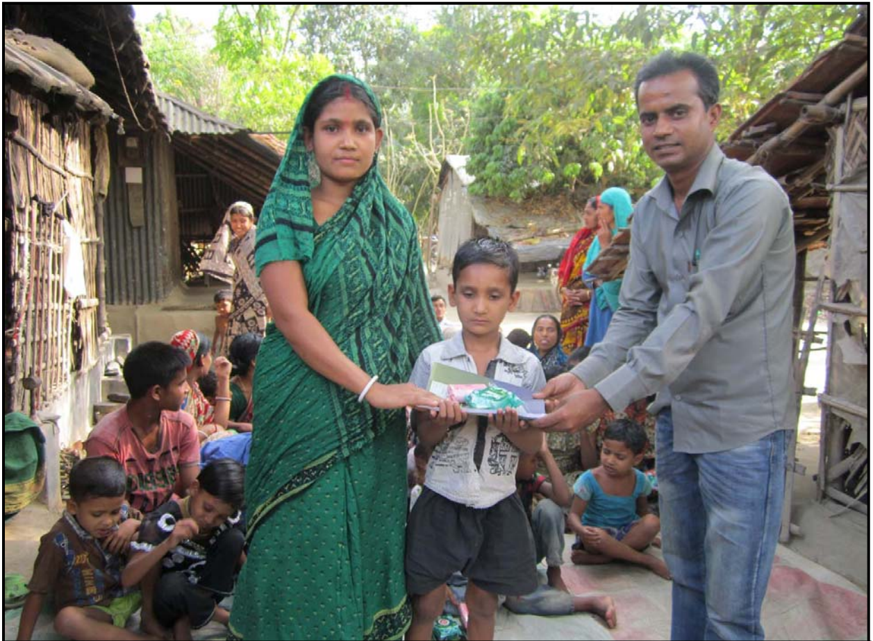
Lolitadaho Community: Distribution Programme...