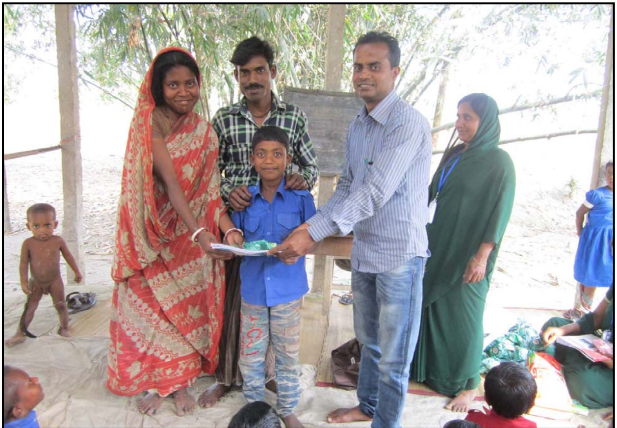
Jogahati Community: Distribution Programme...