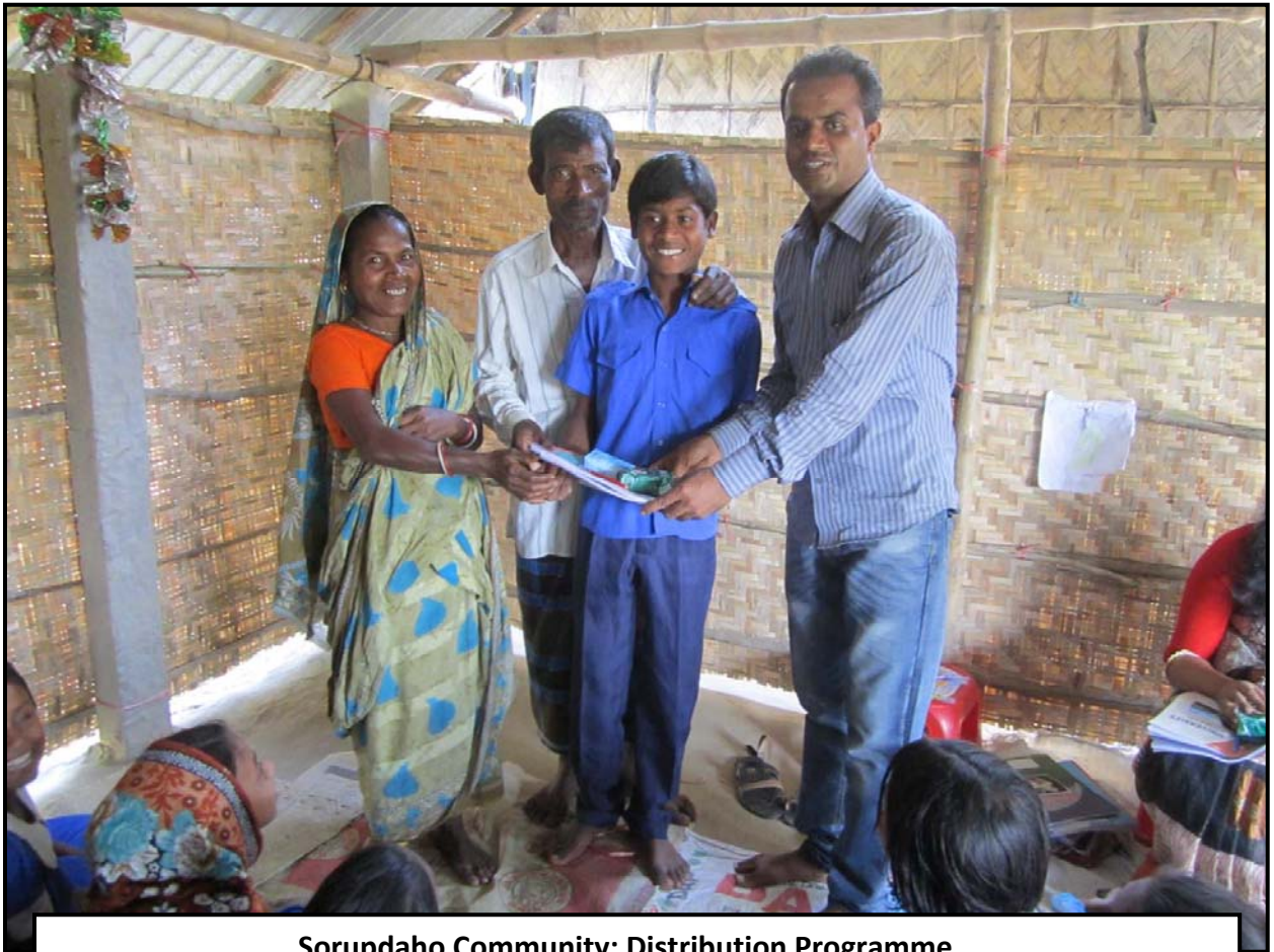
Sorupdaho Community: Distribution Programme...