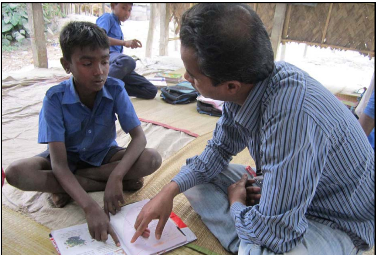
BS project team regularly cross check the teacher-students performance. Accountant checking study progress of a student...