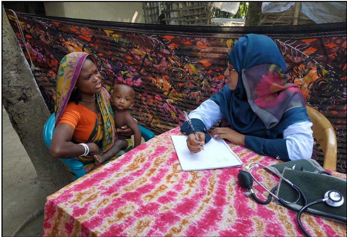
Medical Camp at Sorupdaho...