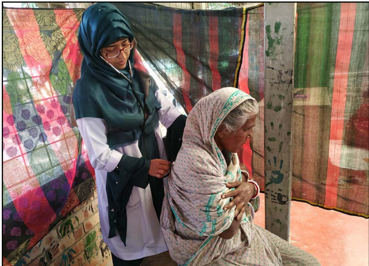
Medical Camp: Doctor making a physical check...