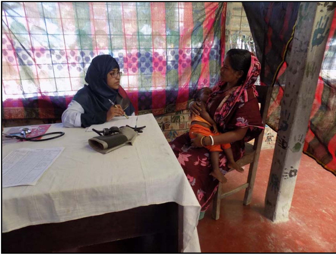
Medical Camp at Jogahati...