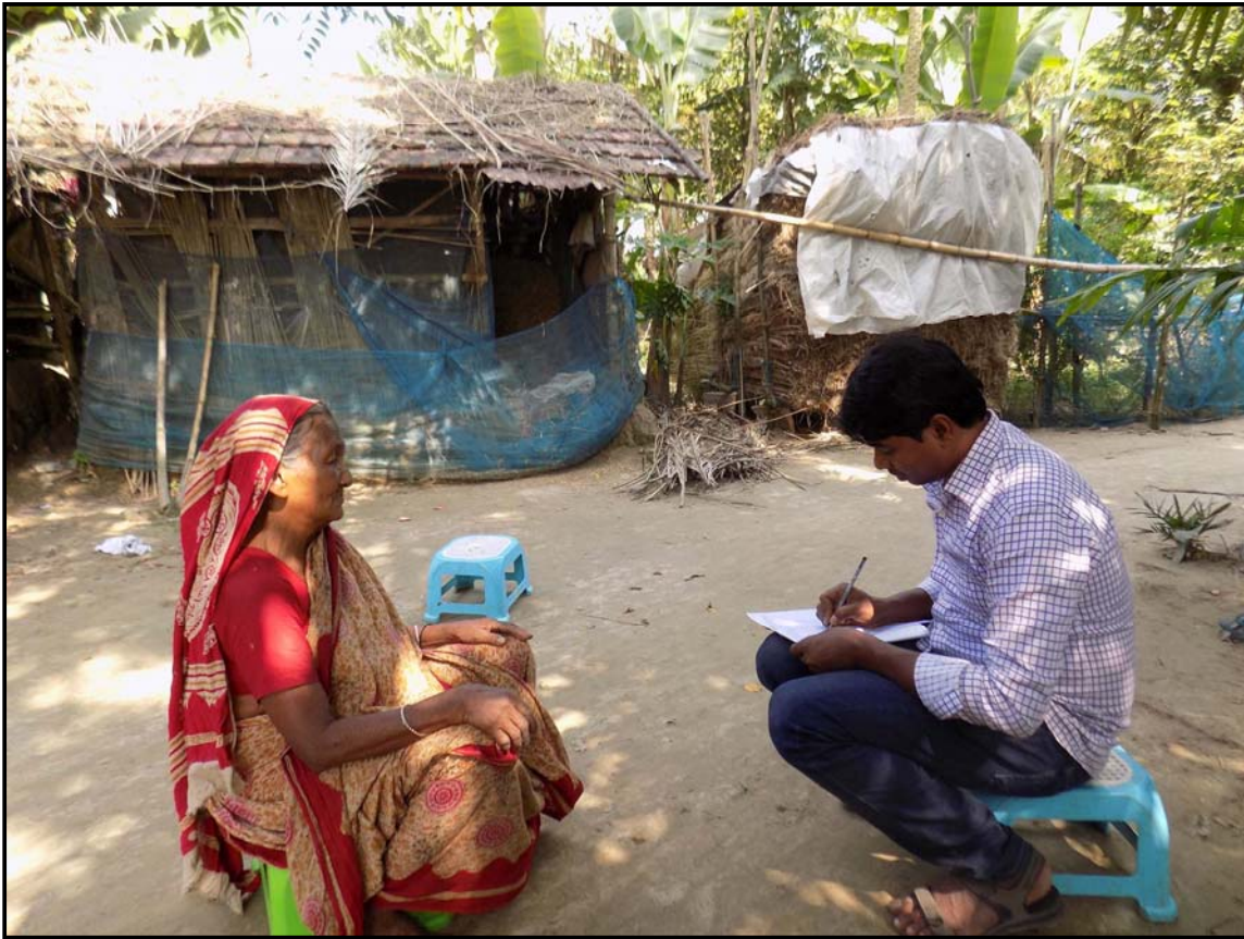
Before medical camp, we made medical screening at villages...