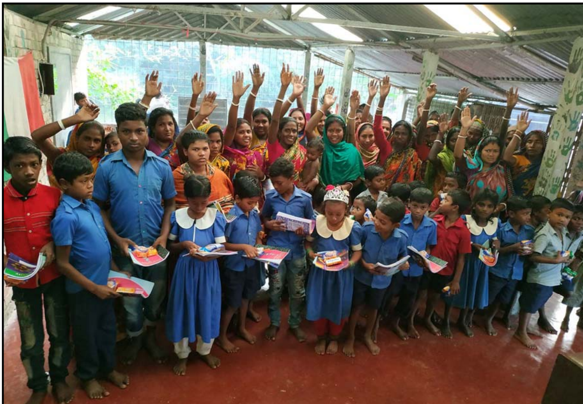
Parents and children determined to improve the result in final exam...