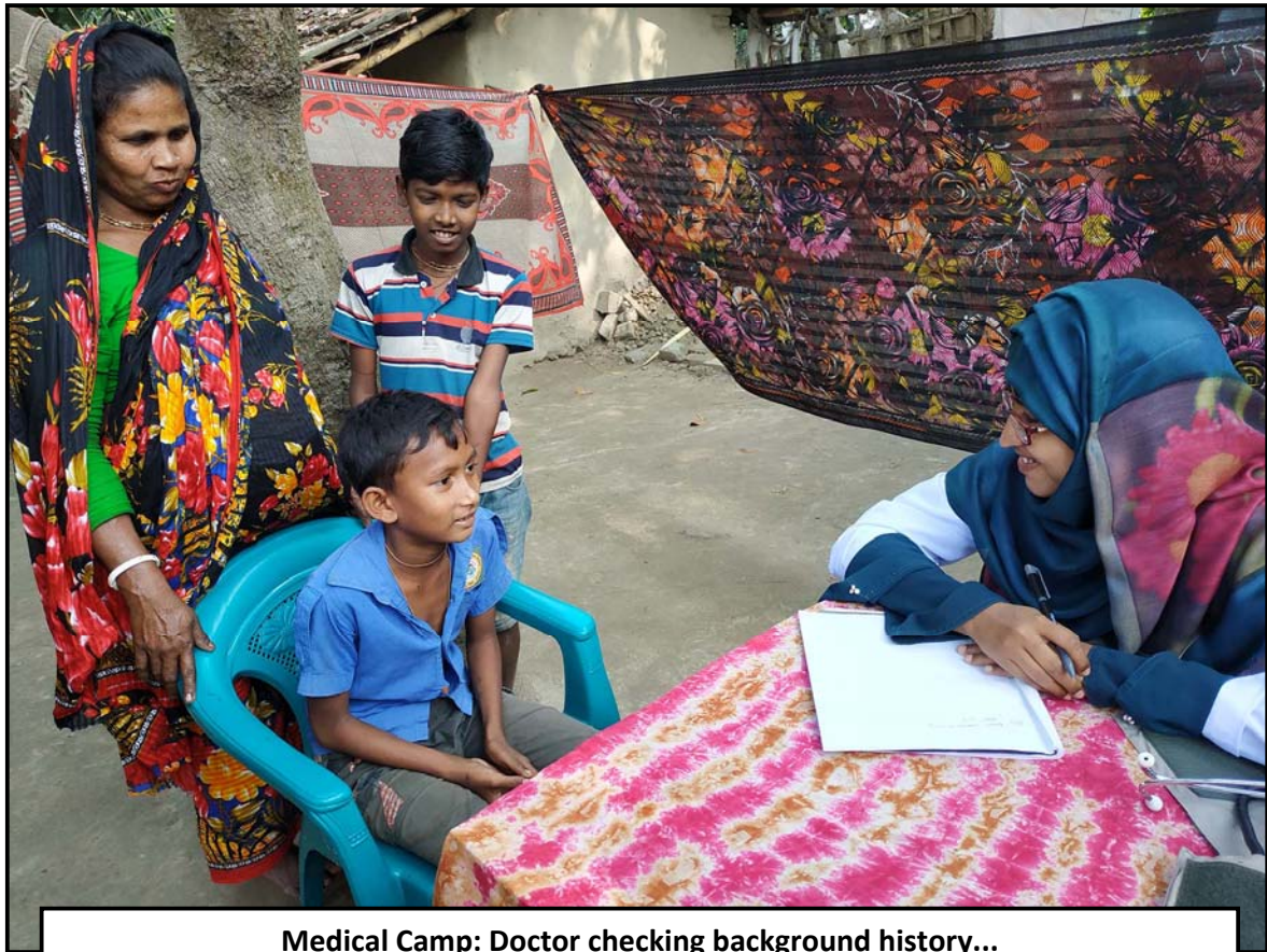
Medical Camp: Doctor checking background history...