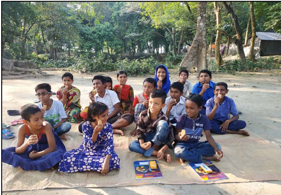
Tuition students enjoy biscuits in every class...