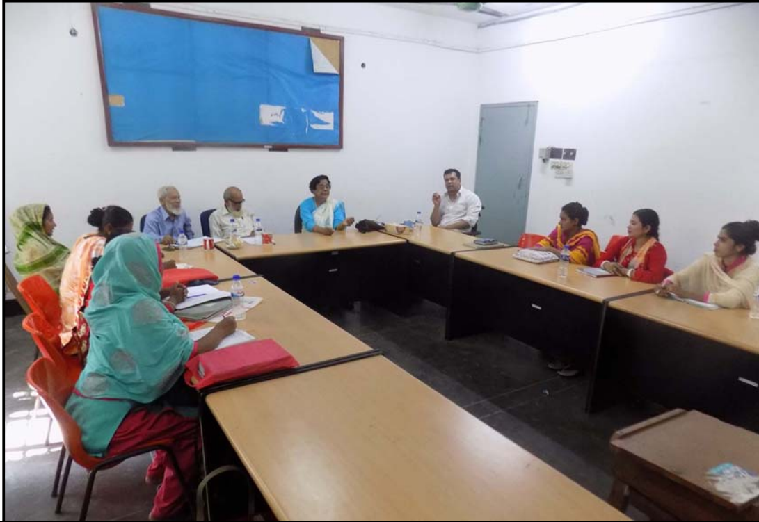
Teachers monthly coordination meeting...