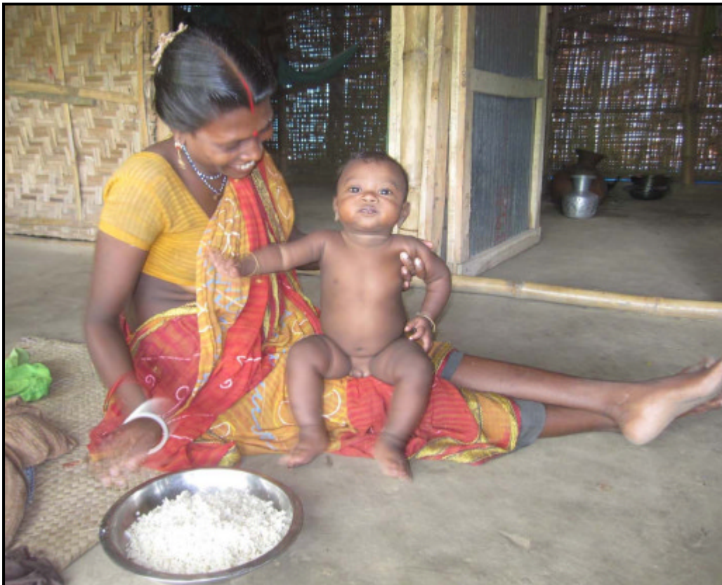
Mother & Child of Jogahati Community