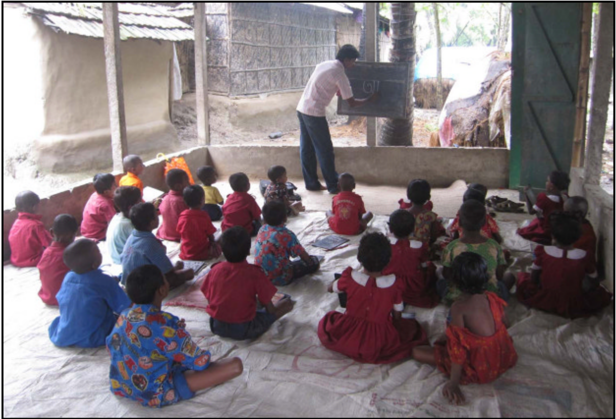
Community Motivator taking class at Jogahati Pre-school....