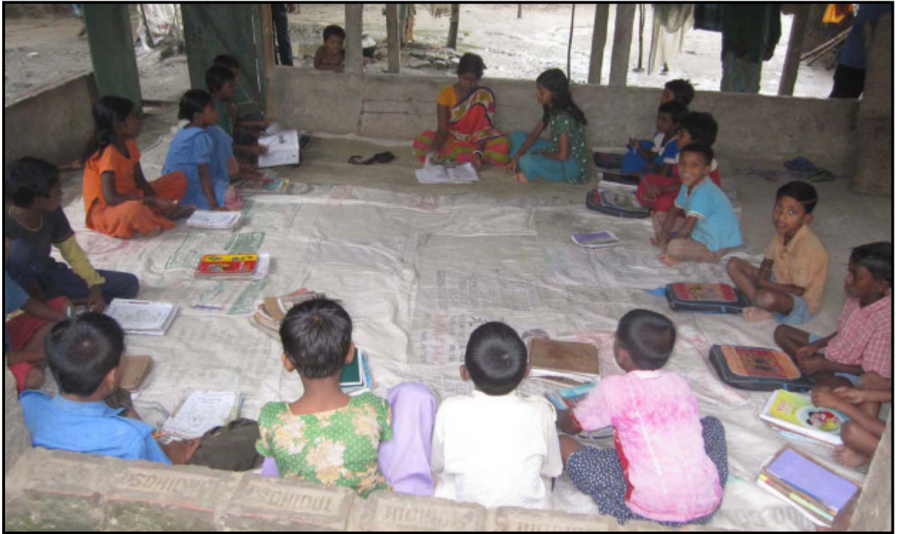
Tuition Programme at Jogahati...