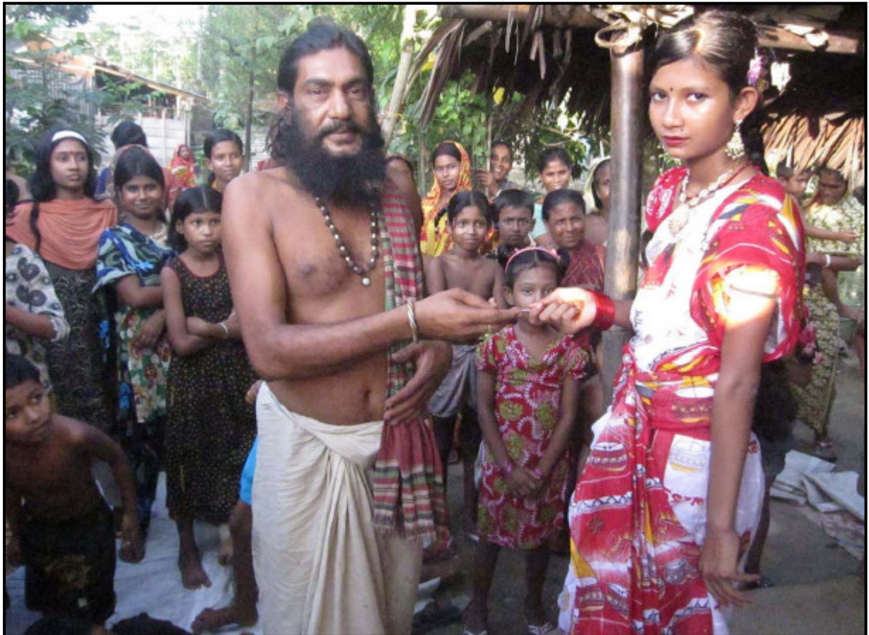
Churamankati Student Receiving Pen as Best Performances Prize from Local Leader...