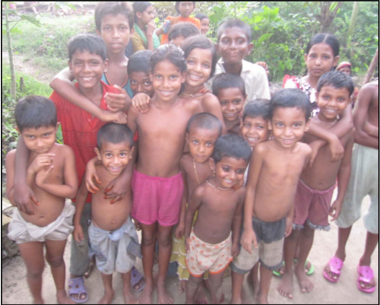
Say Cheese!!!... Smiley Children of Churamankati Community.....