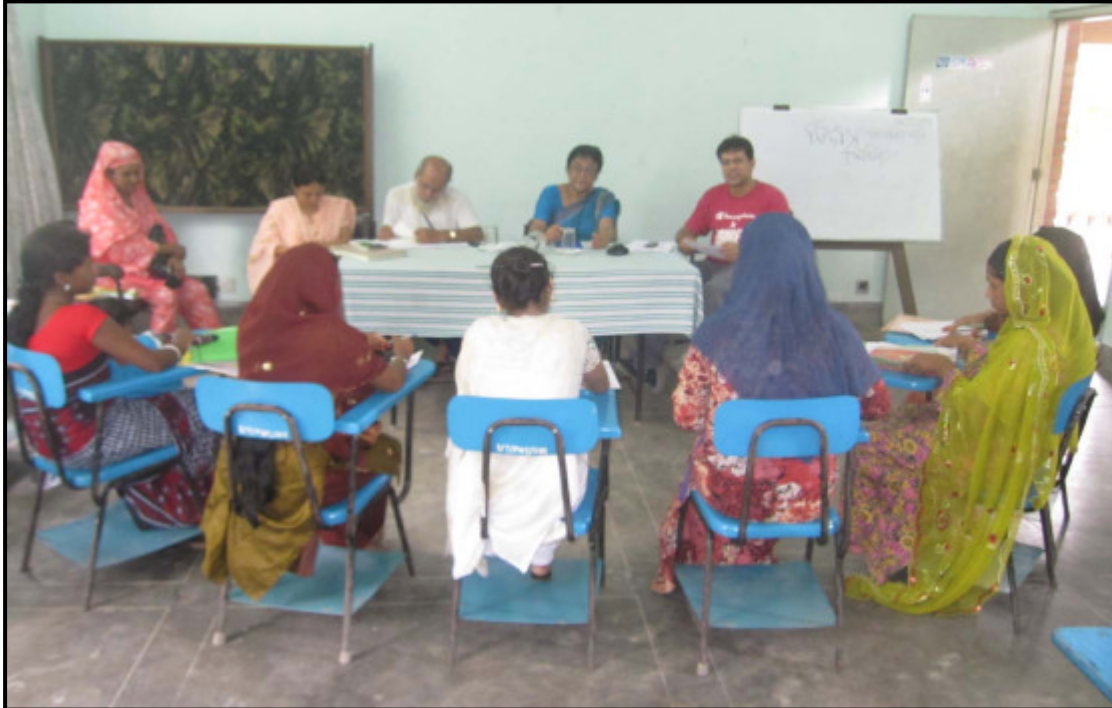
Tuition Teachers Monthly Coordination Meeting...