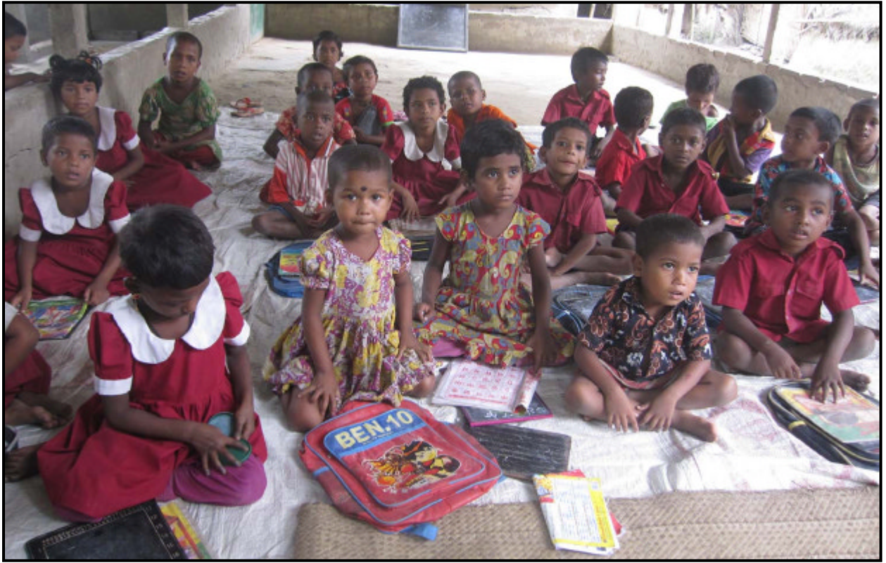
Attentive Students of Jogahati Pre-school...