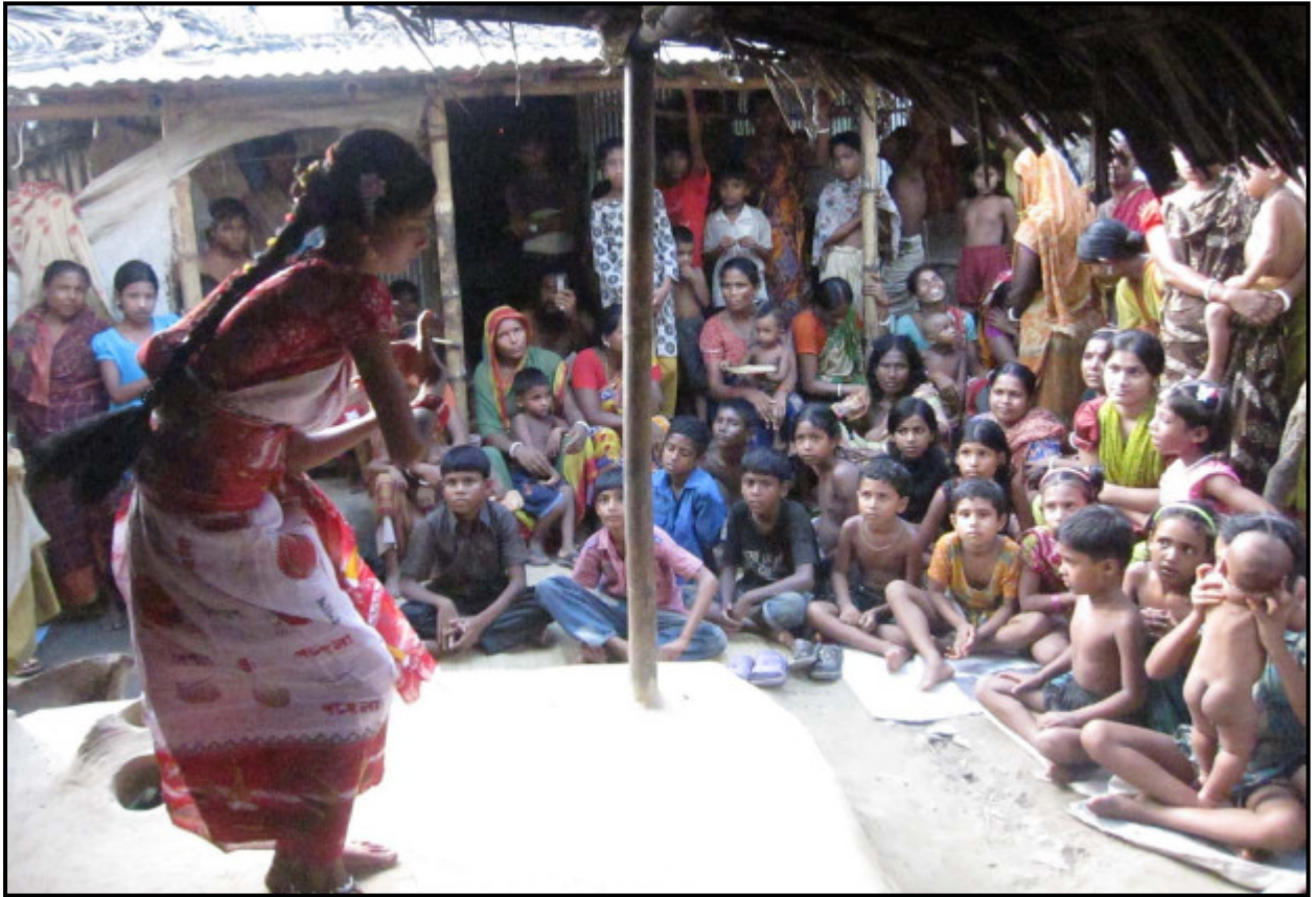
Churamankati Student Performing in Cultural Programme...