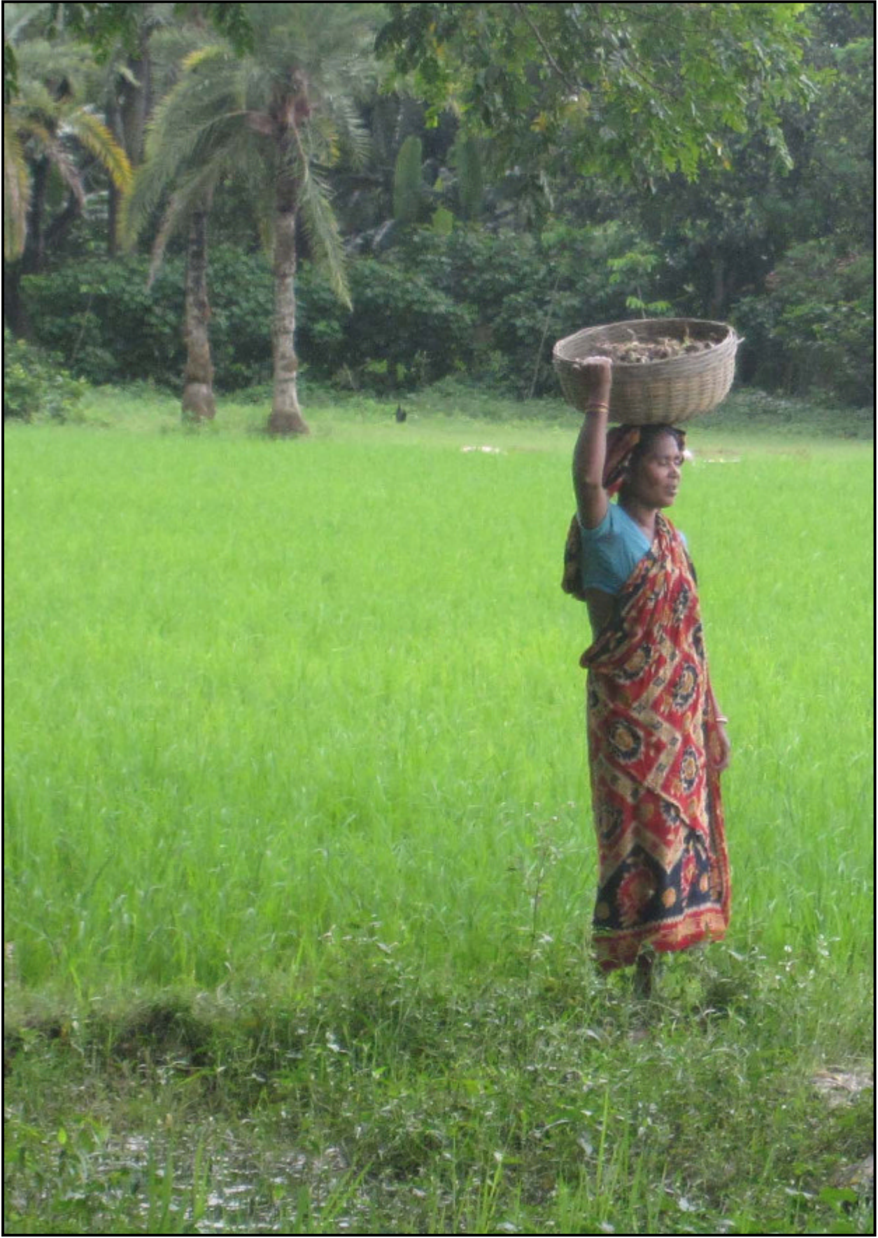
....Hard Work Can Change Life...Active Women of the Community...