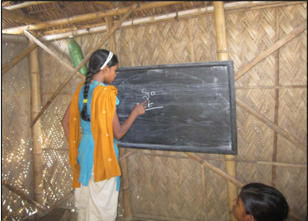
Churamankati Tuition Programme Student solving math....