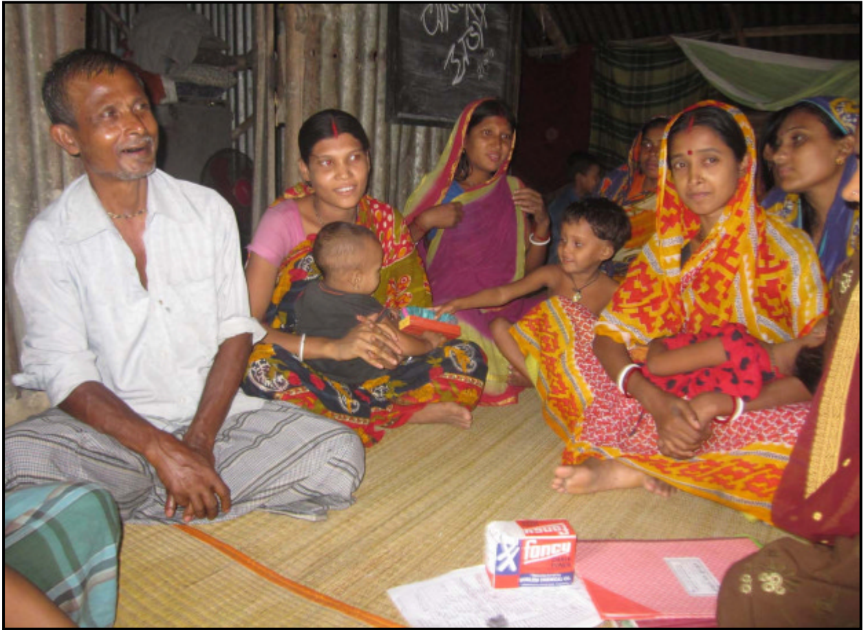
Special Parents Meeting at Lolitadaho Community....