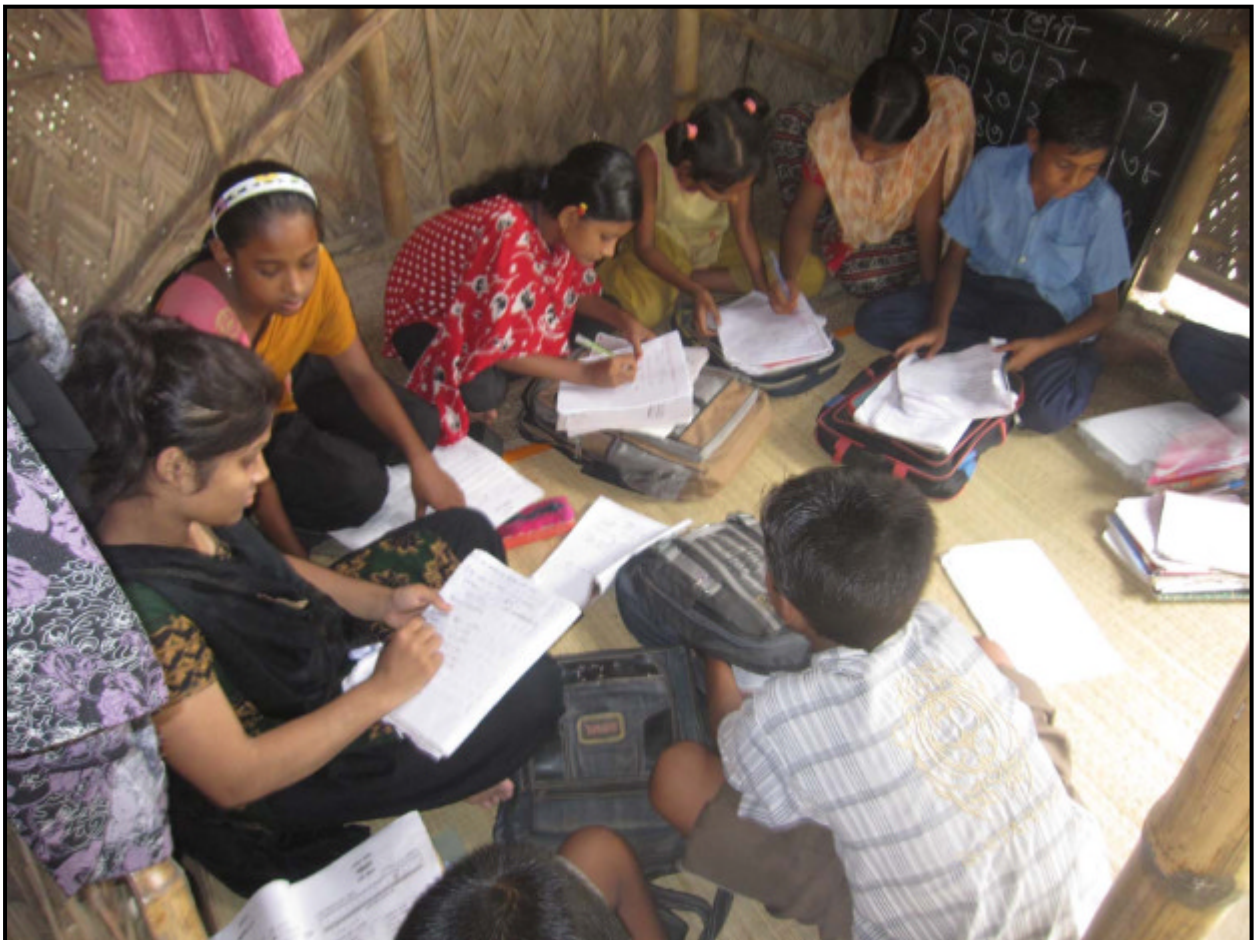
Tuition Programme at Churamankati...