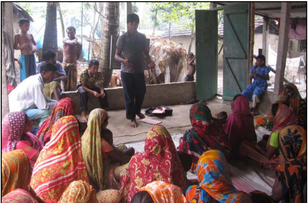
Jogahati Parents Meeting...