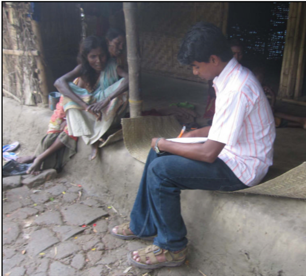
Community Motivator making door-to-door visit at Jogahati...