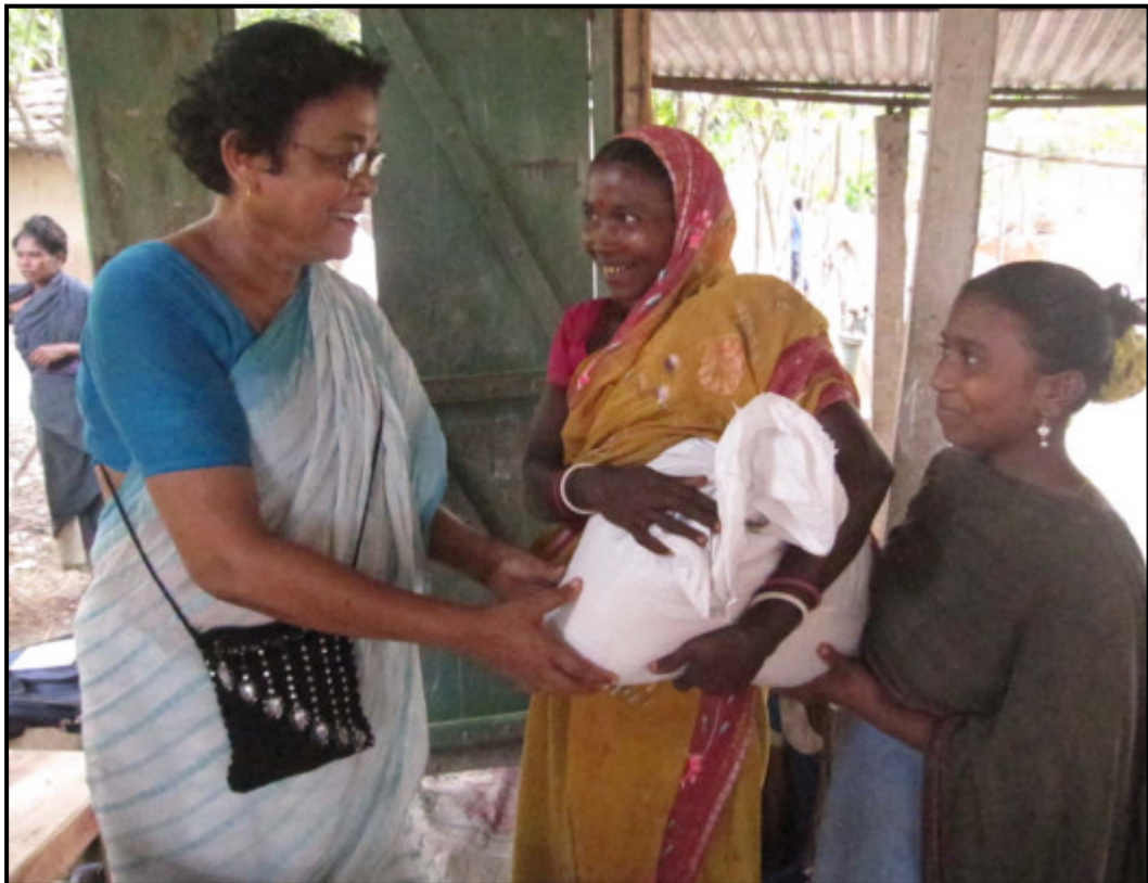
Jogahati Community student BS0002 Maloti receiving materials...