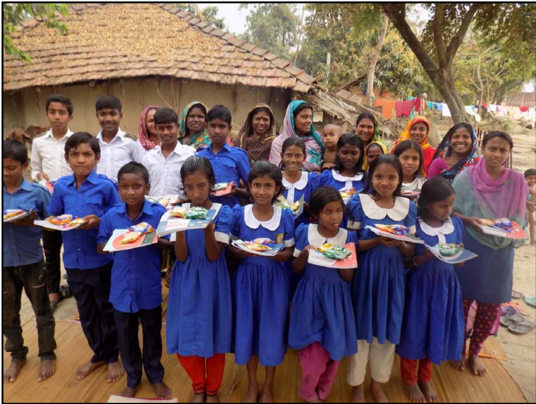
Materials distribution at Sorupdaho community...