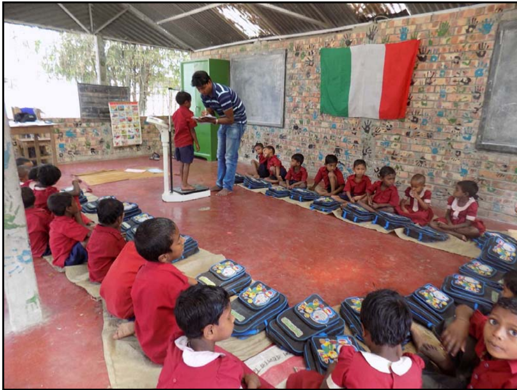
Monthly weight and height check...