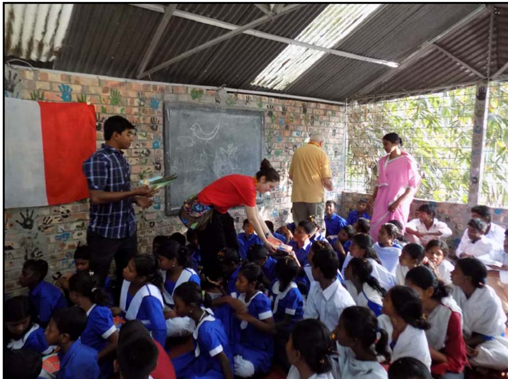
The friends distributed education materials...