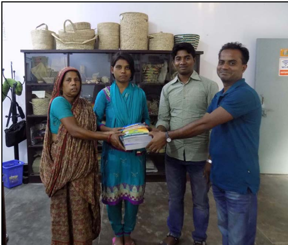
Class guidebook distribution to Boishakhi...