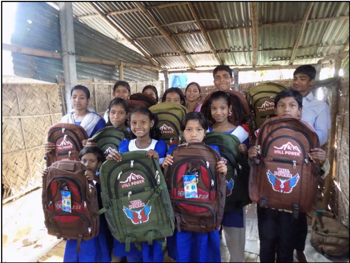
Churamankati students also very happy with new bags...