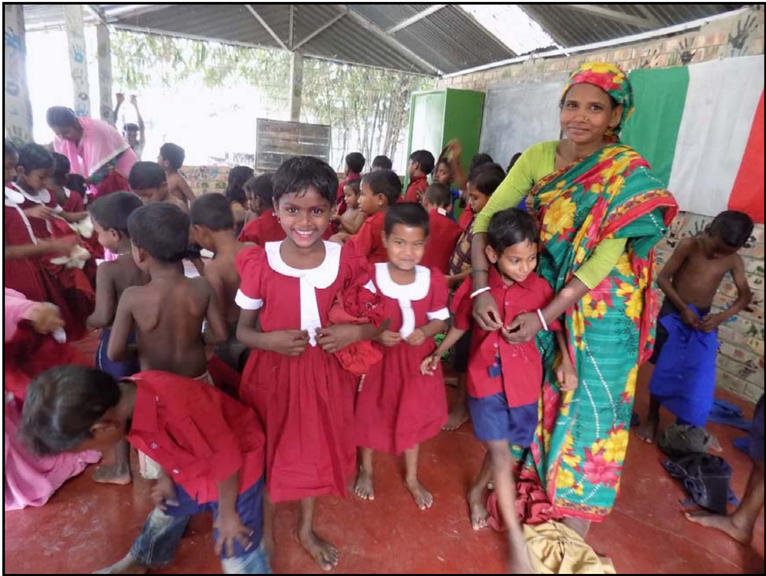
Receiving new uniforms...