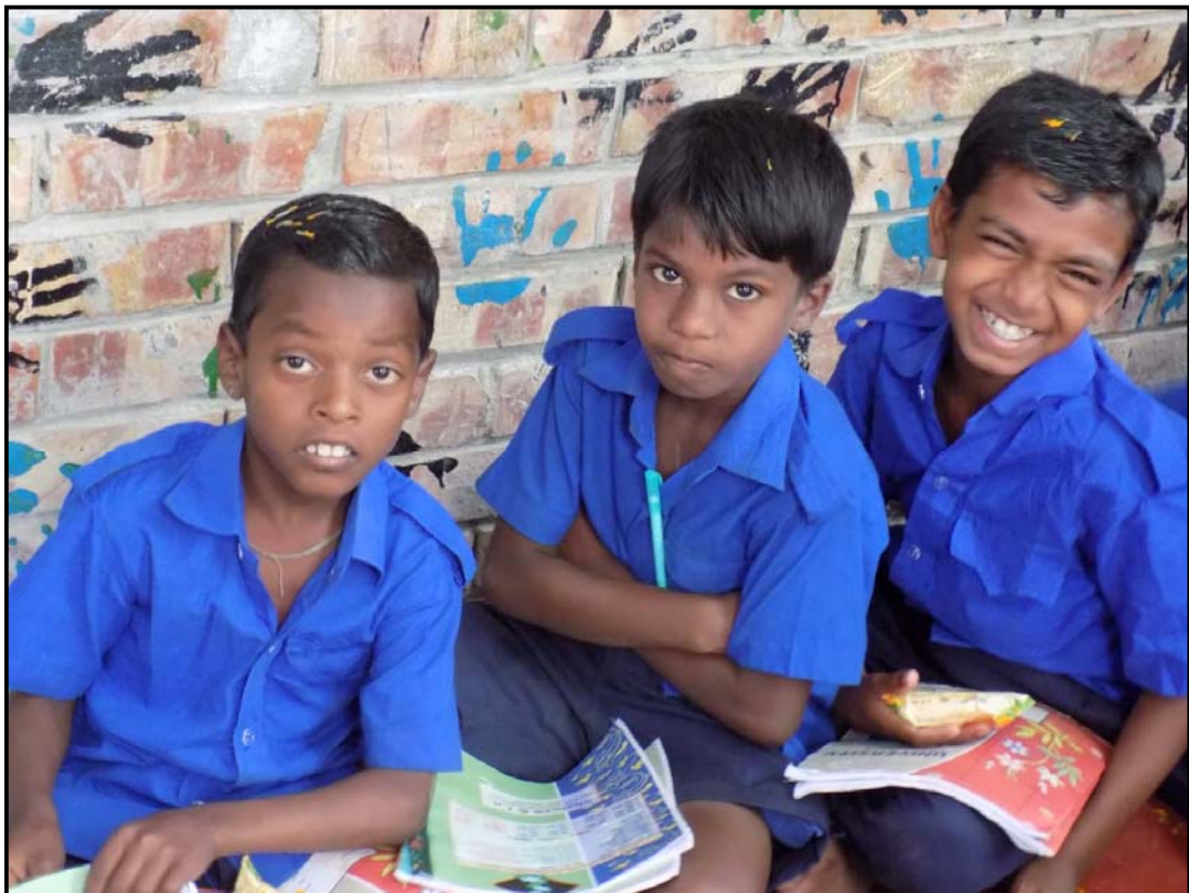
The pose during distribution programme...