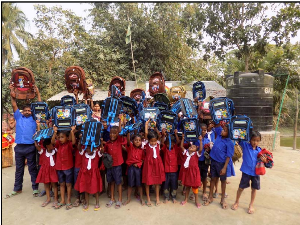
With new bags...