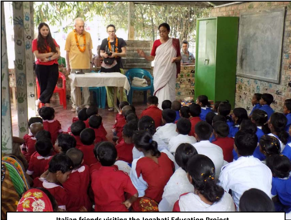
Italian friends visiting the Jogahati Education Project...