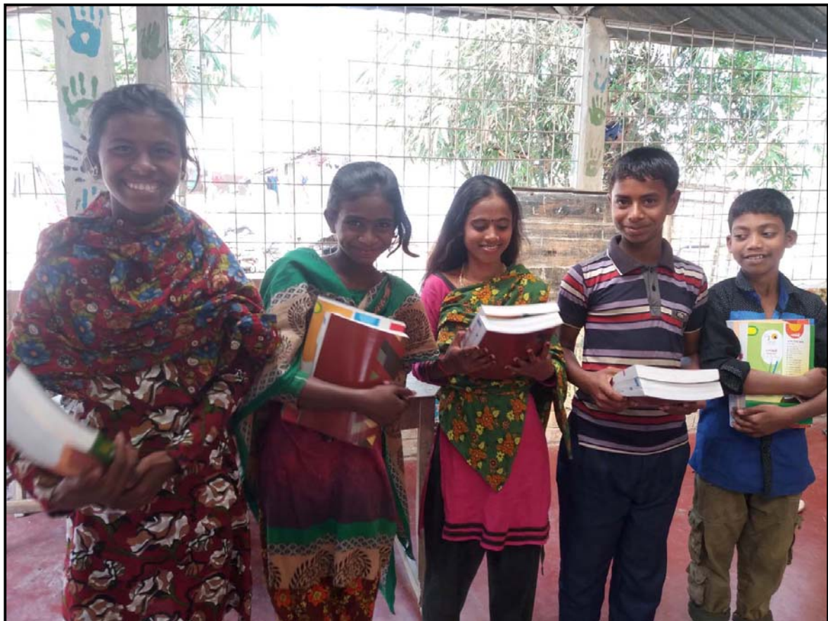
We provided class guidebooks to Jogahati students...