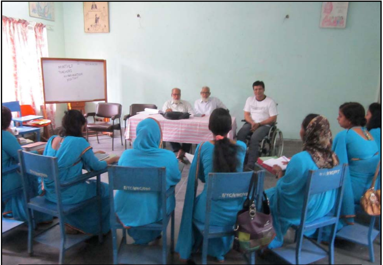
Monthly teacher's coordination meeting at BS Office...