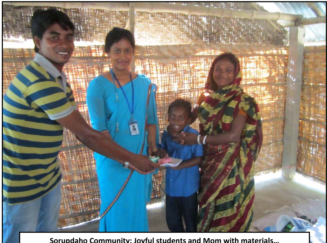
Sorupdaho Community: Joyful students and Mom with materials...