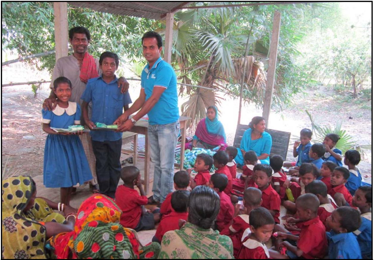
Jogahati Community: Distribution Programme...