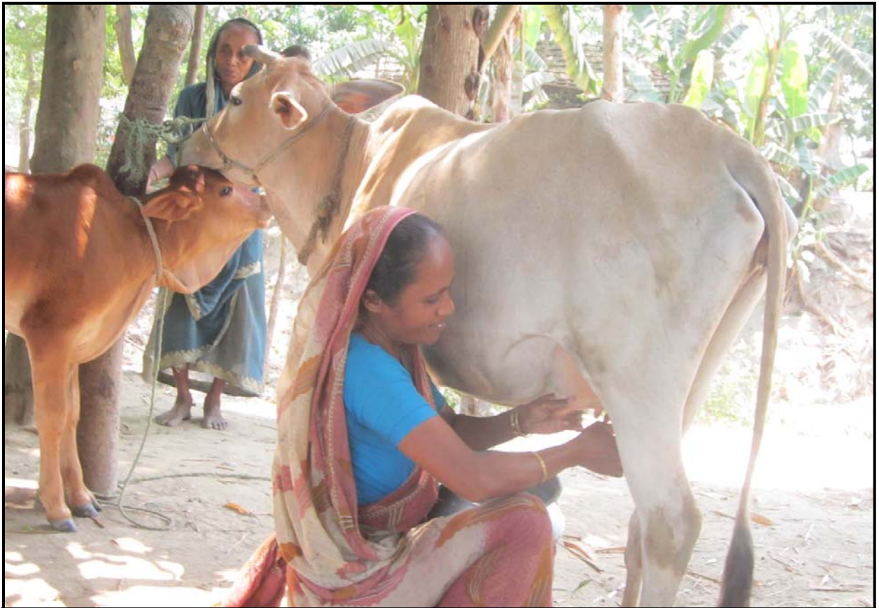
Family collecting milk from the cow...