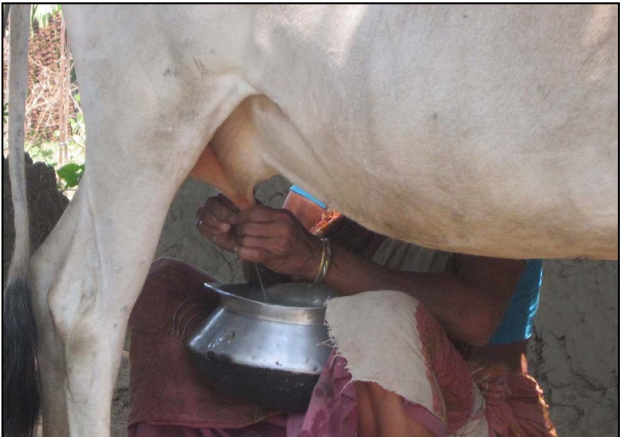
Families utilising the milk for daily nutrition and sell for family income...