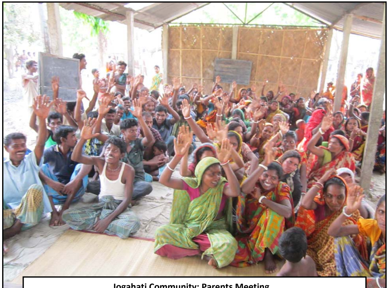
Jogahati Community: Parents Meeting...