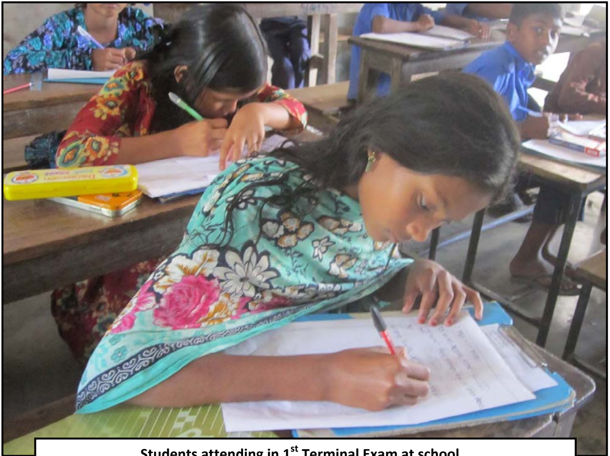
Students attending in 1 st Terminal Exam at school...