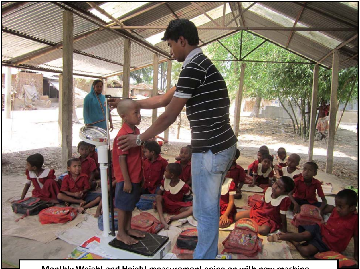
Monthly Weight and Height measurement going on with new machine...