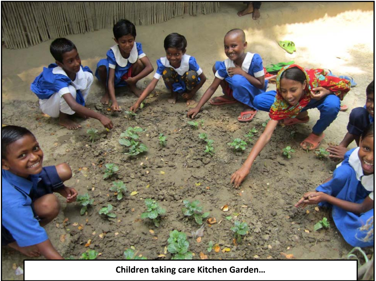
Children taking care Kitchen Garden...