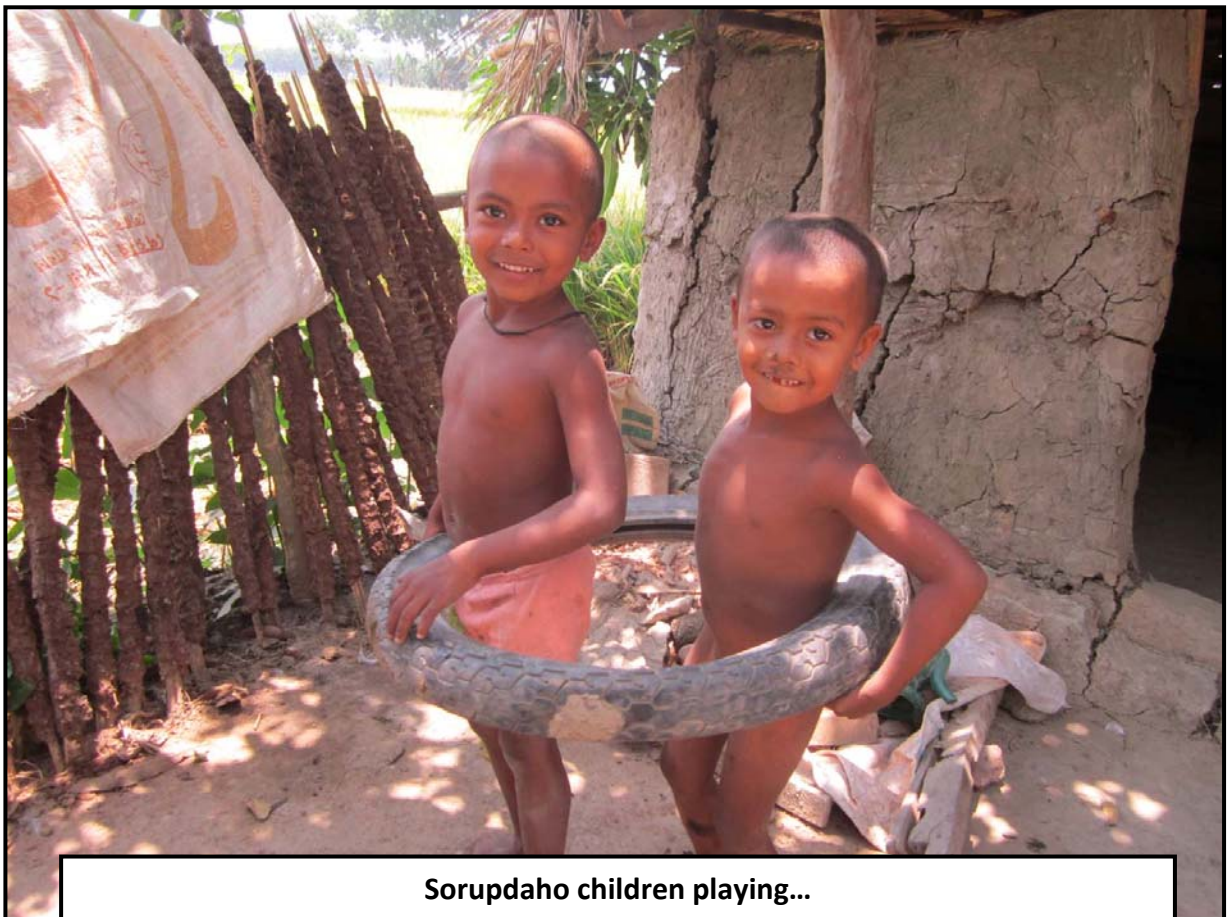
Sorupdaho children playing...