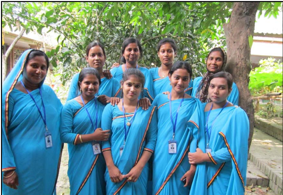
The Tuition Teachers Team...