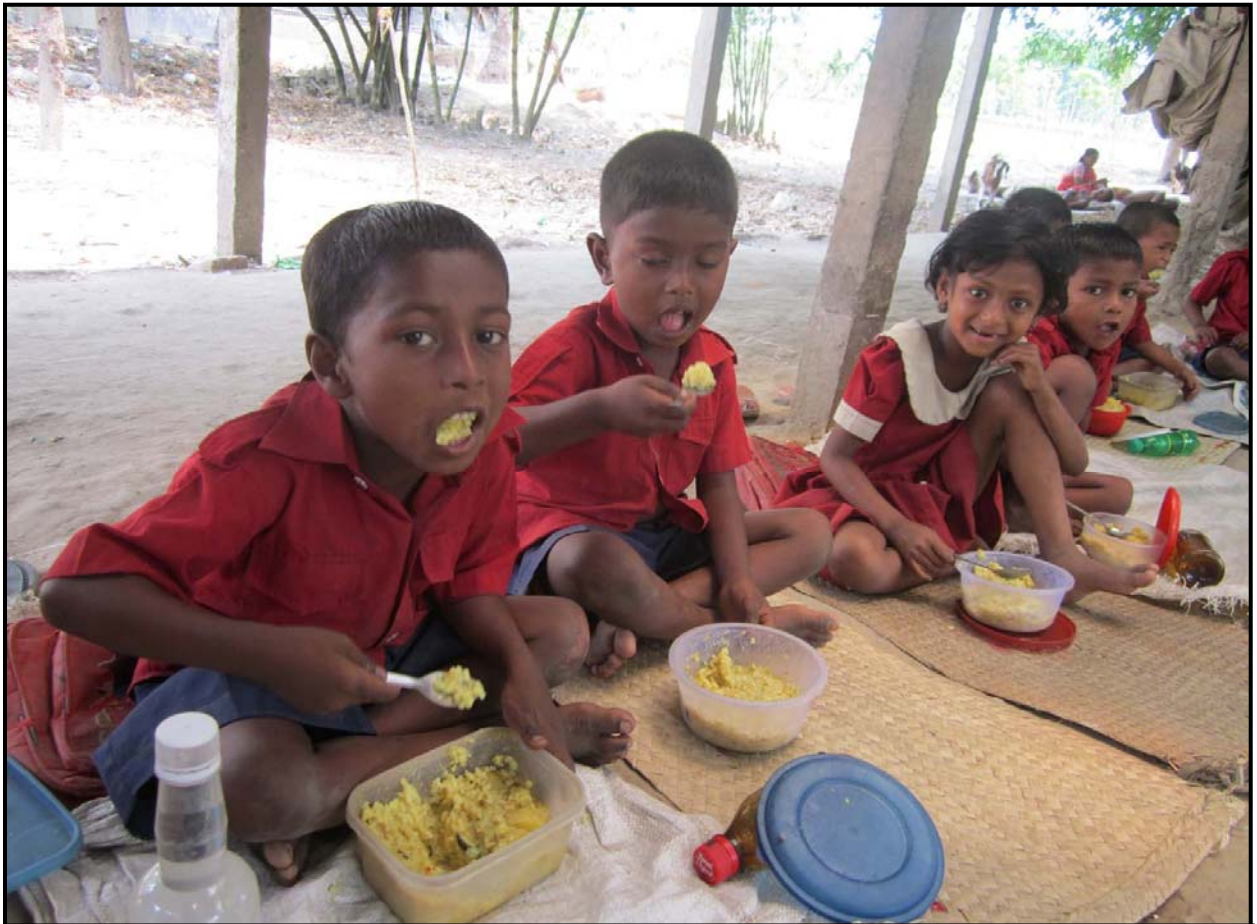
Pre-school students enjoying the Warm Khitchury everyday...