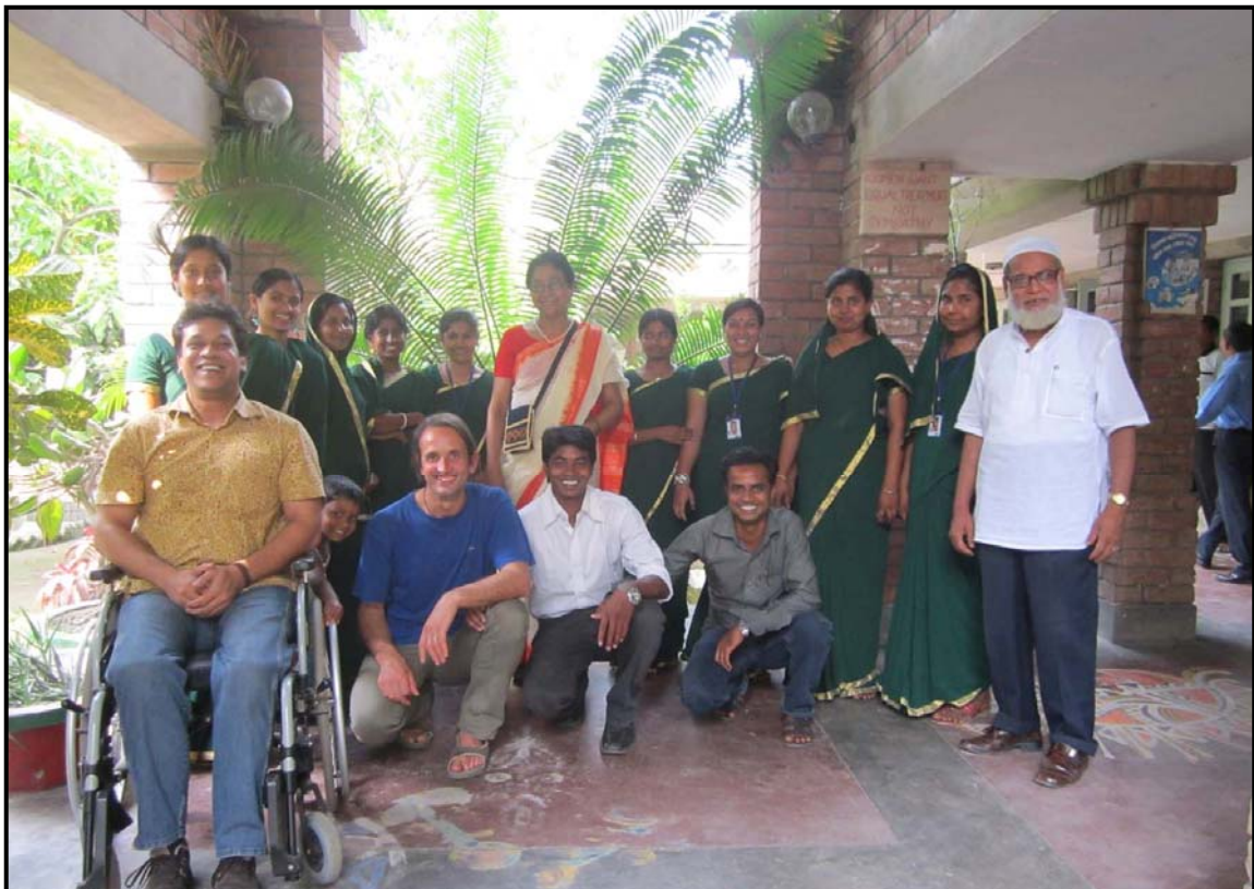
The BS-IDEA Project Team...