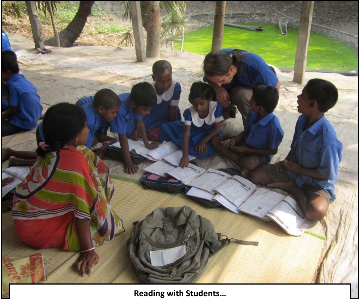
Reading with Students...