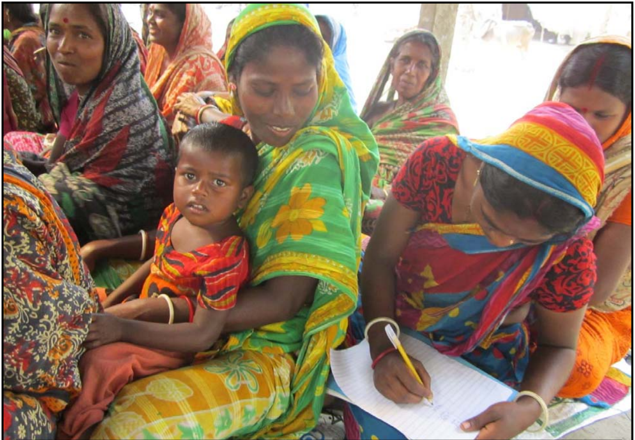
Now Jogahati Parents can sign their name...