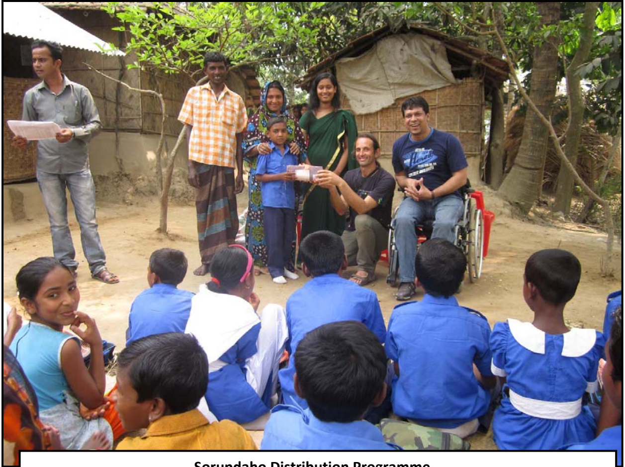
Sorupdaho Distribution Programme...