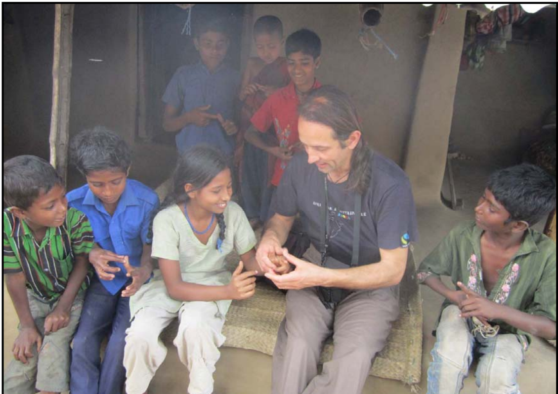
Playing with Students...