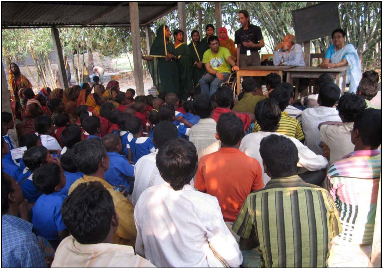
Jogahati Distribution Programme...