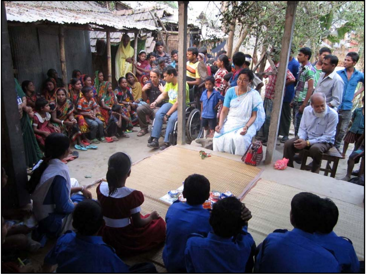
Churamankati Distribution Programme...