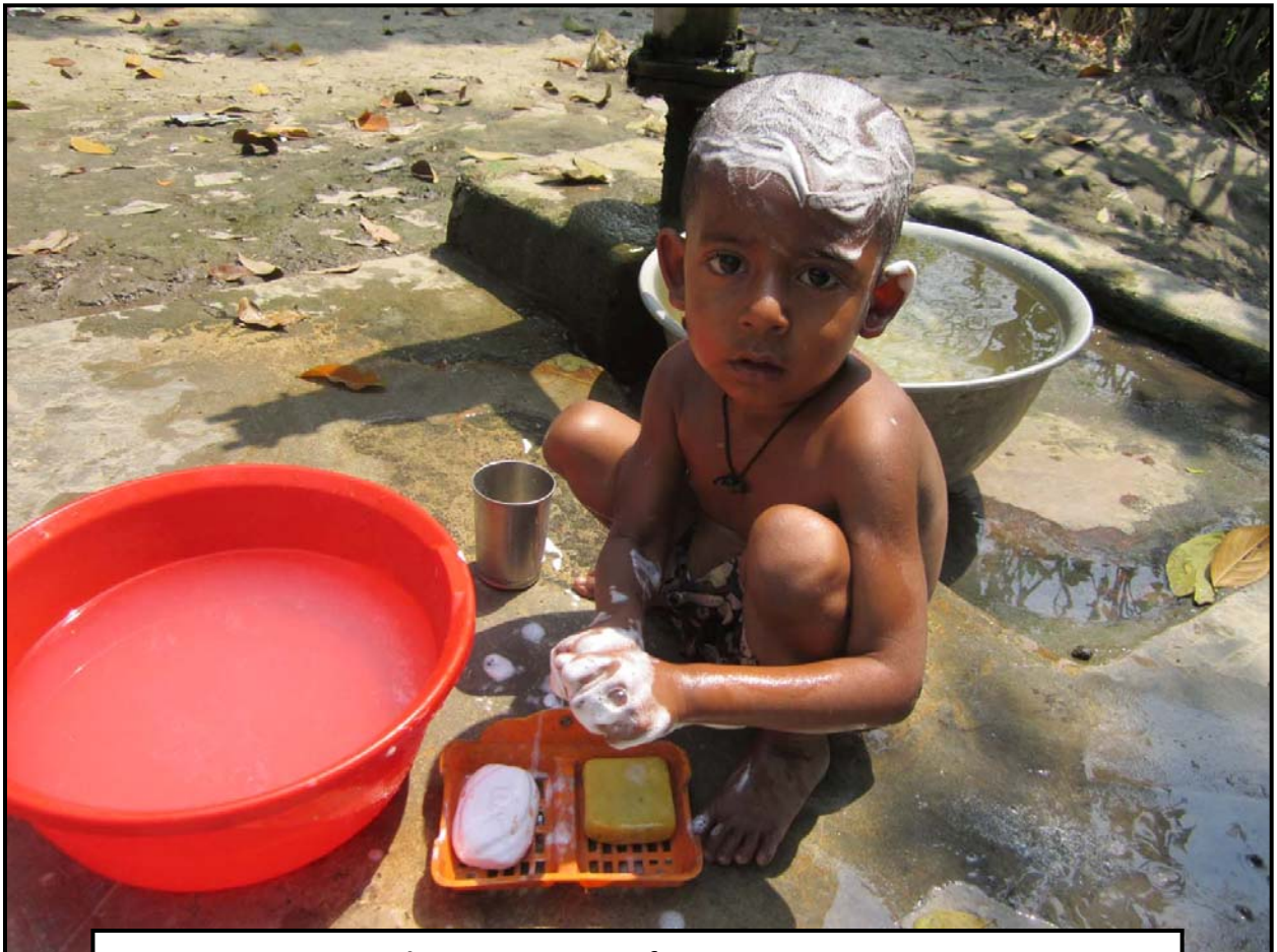
Student using soaps of BS-IDEA Project.....