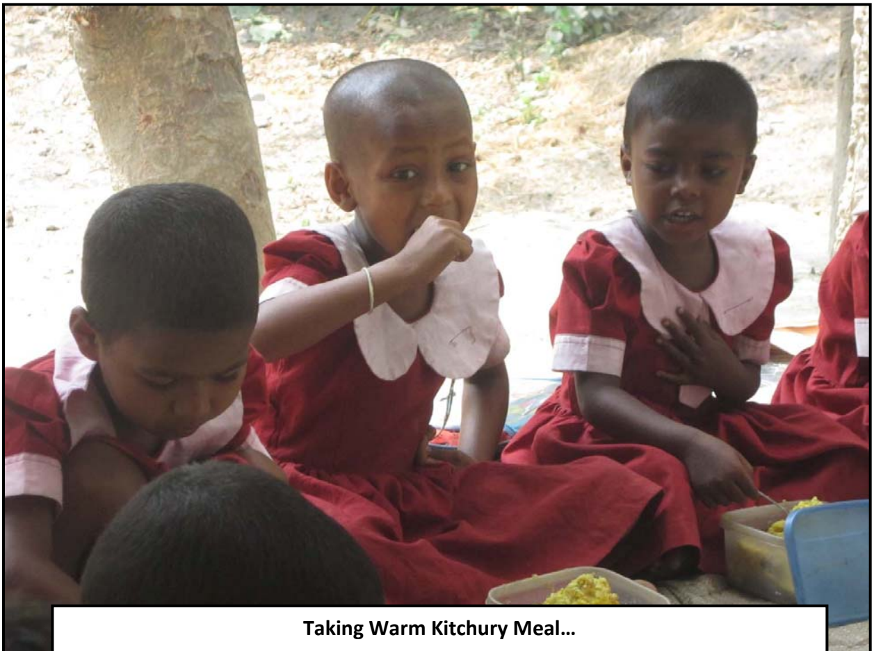
Taking Warm Kithucry Meal...