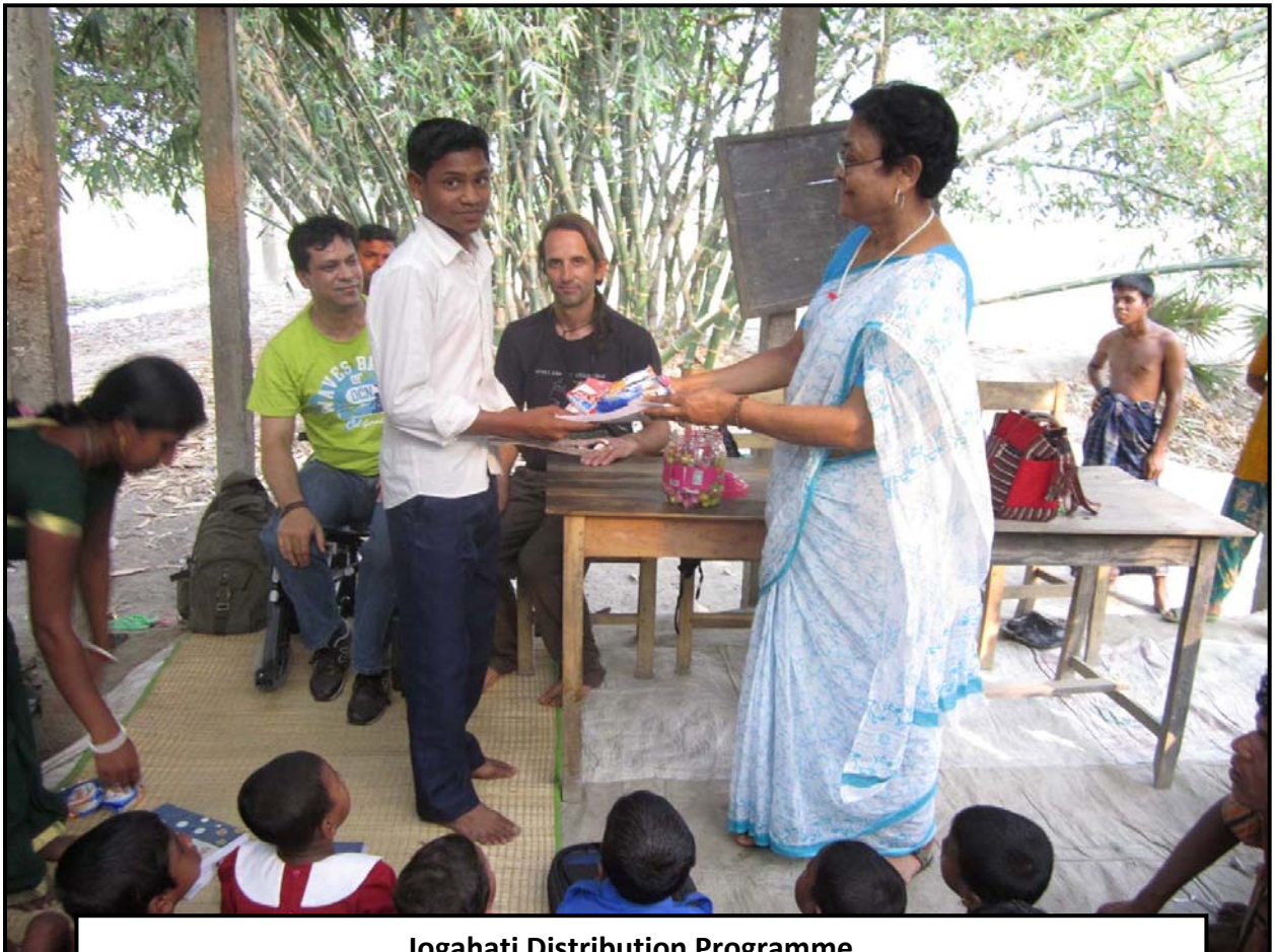
Jogahati Distribution Programme...