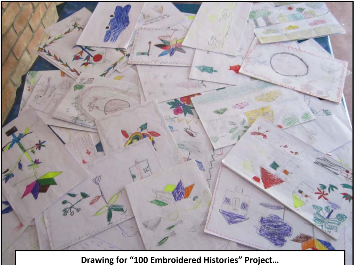
Drawing for "100 Embroidered Histories" Project...