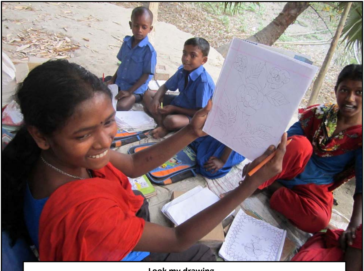
Look my drawing...