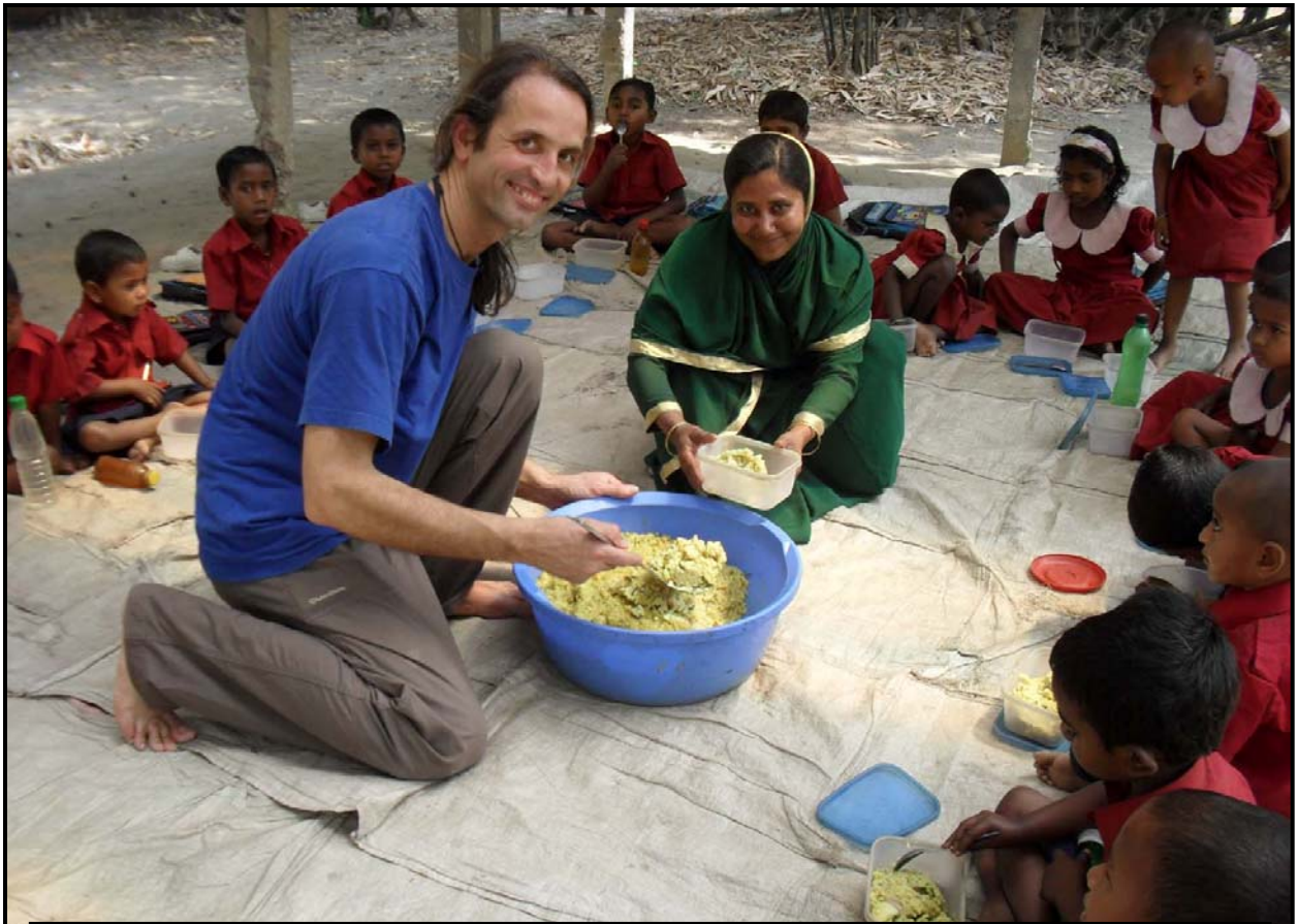
The Kithucry distribution...