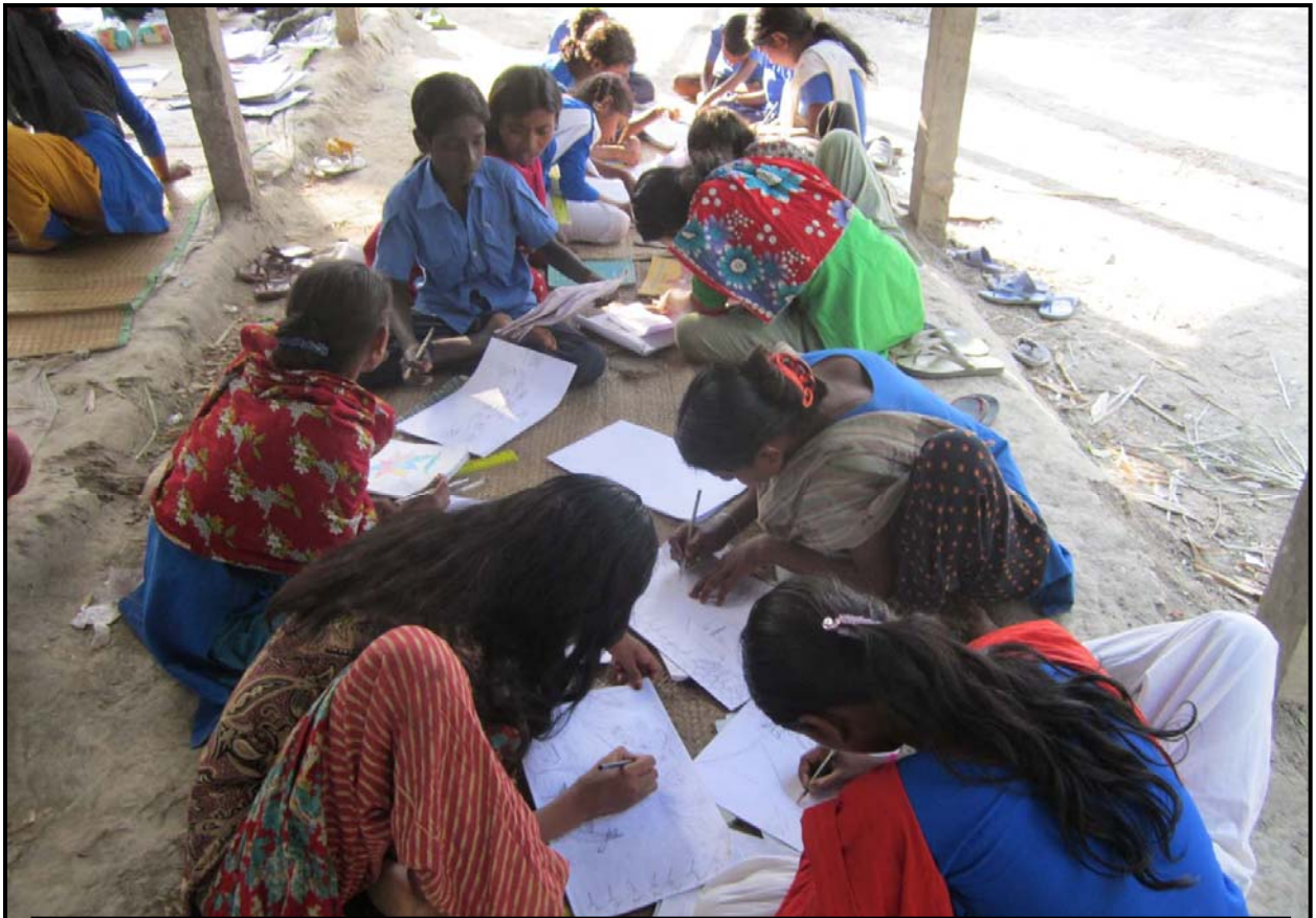
Jogahati Students in Drawing Class...