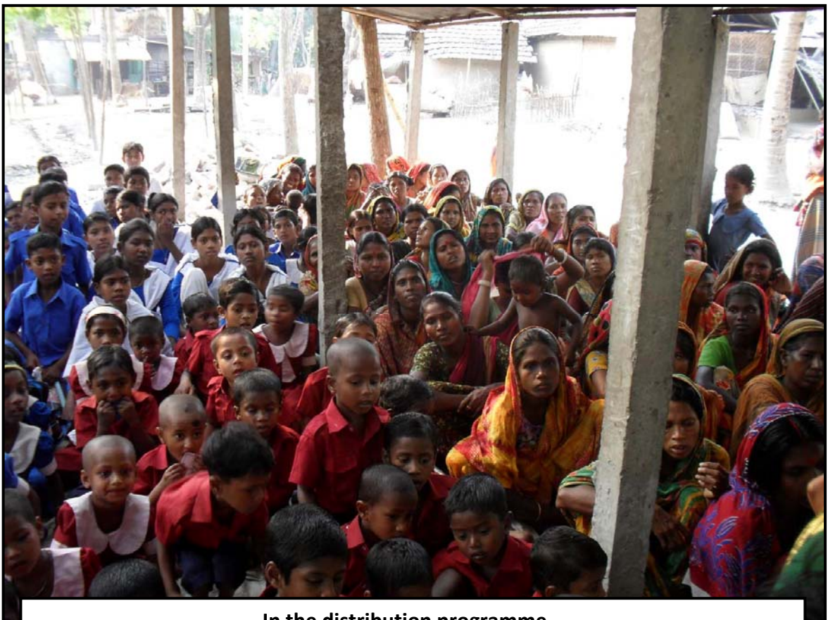
In the distribution programme...