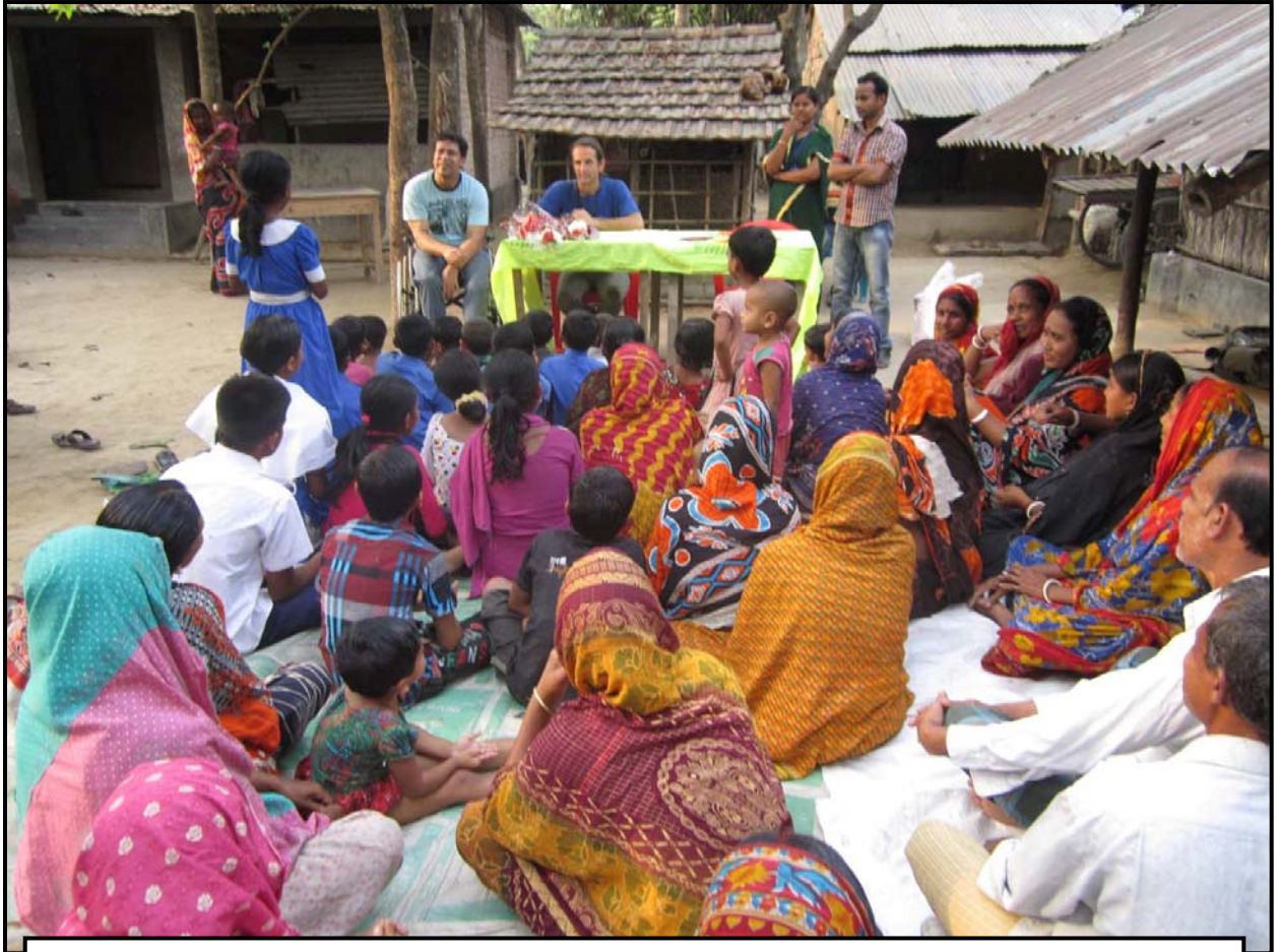
Lolitadaho Distribution Programme...