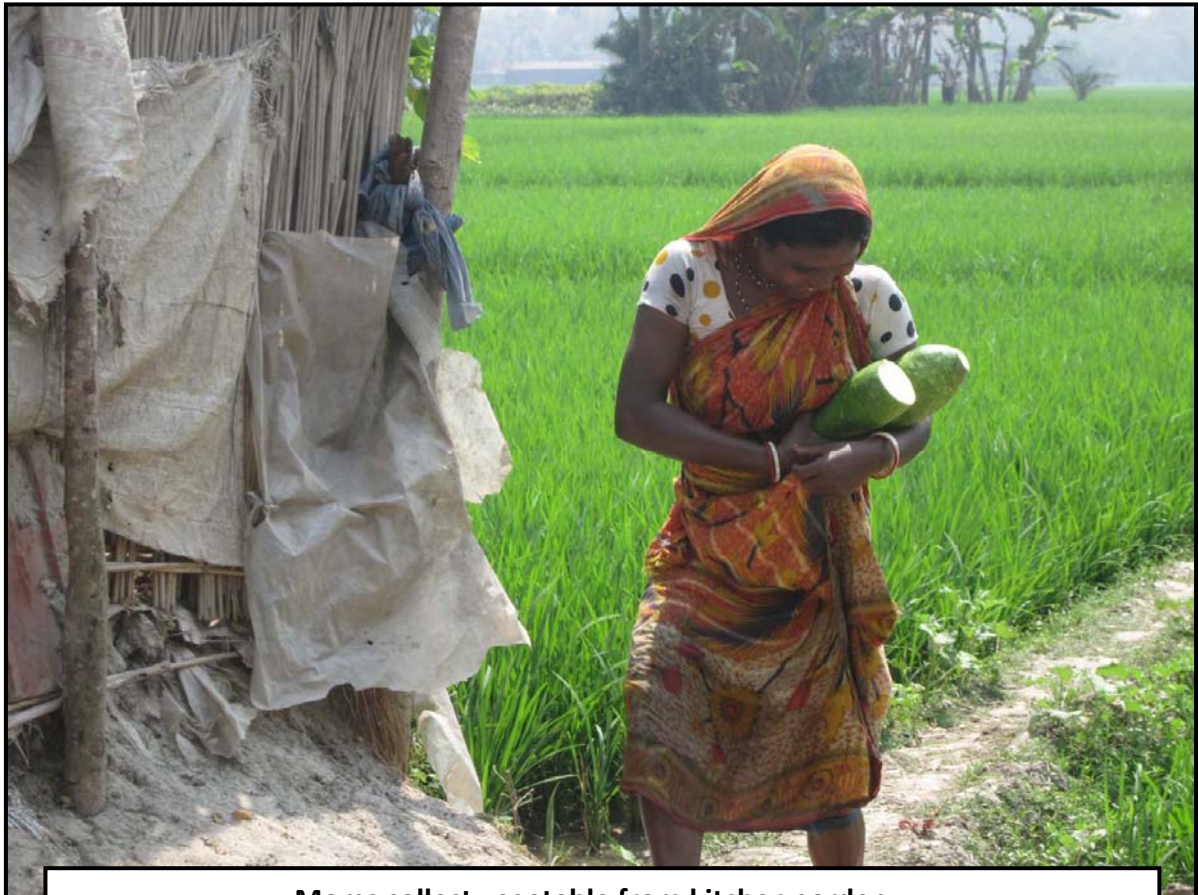
Moms collect vegetable from kitchen garden...