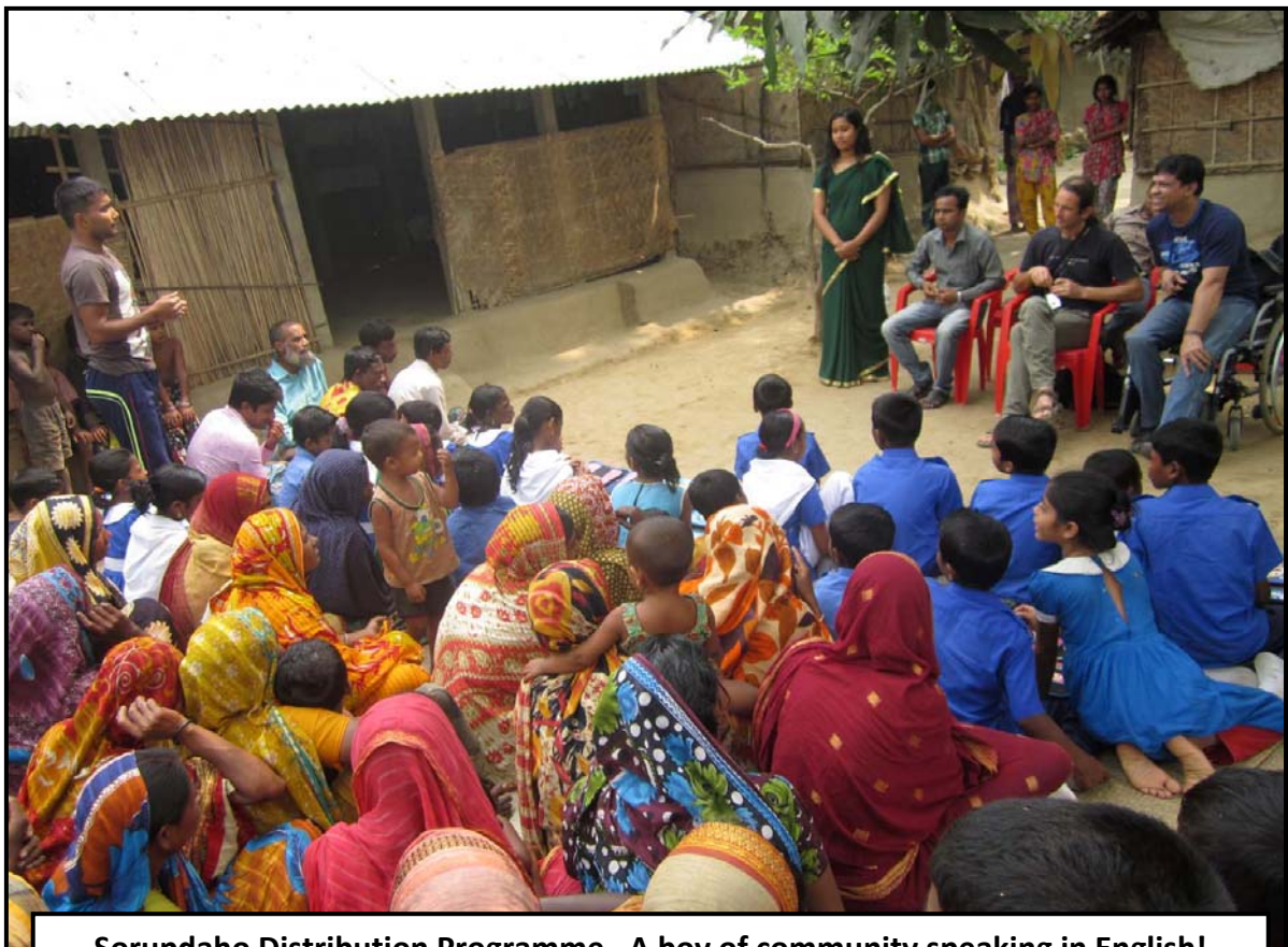
Sorupdaho Distribution Programme...A boy of community speaking in English!