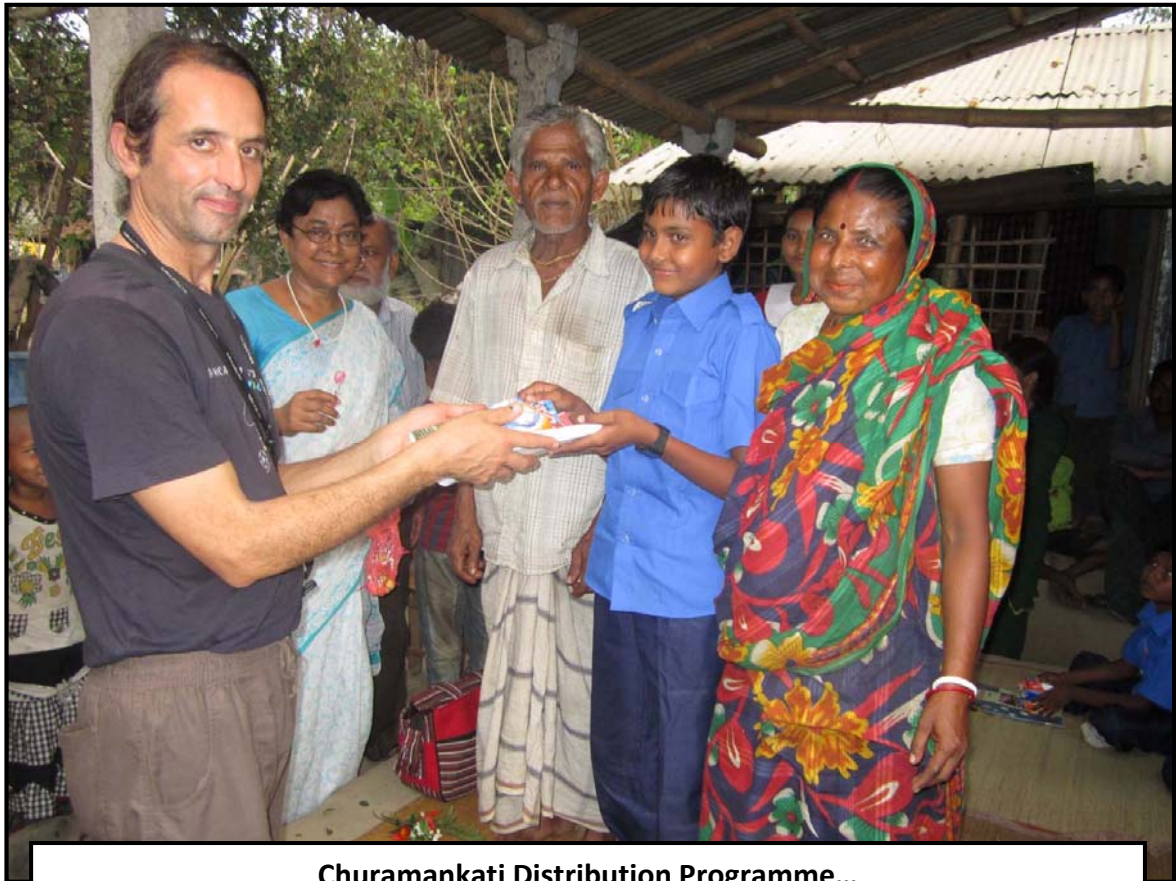
Churamankati Distribution Programme...