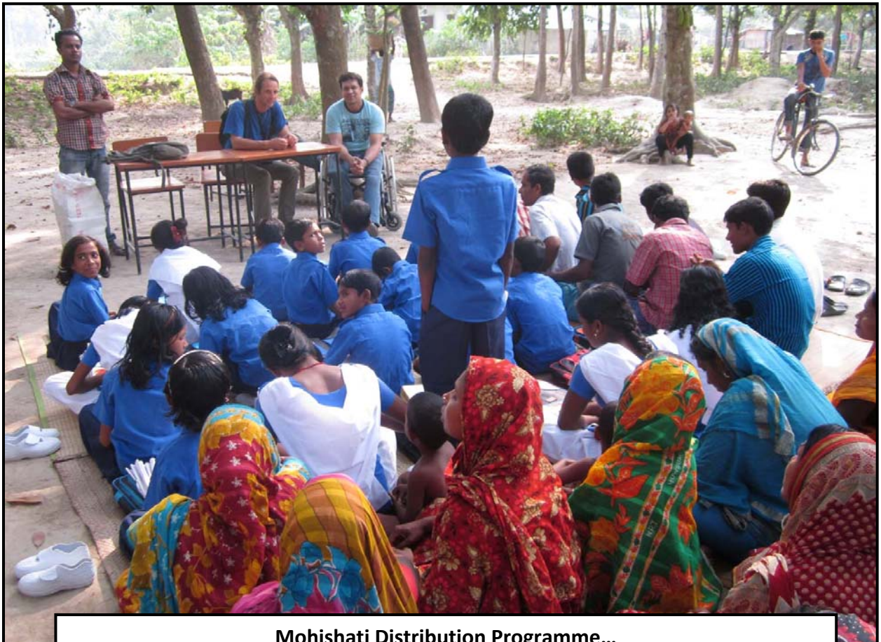
Mohishati Distribution Programme...