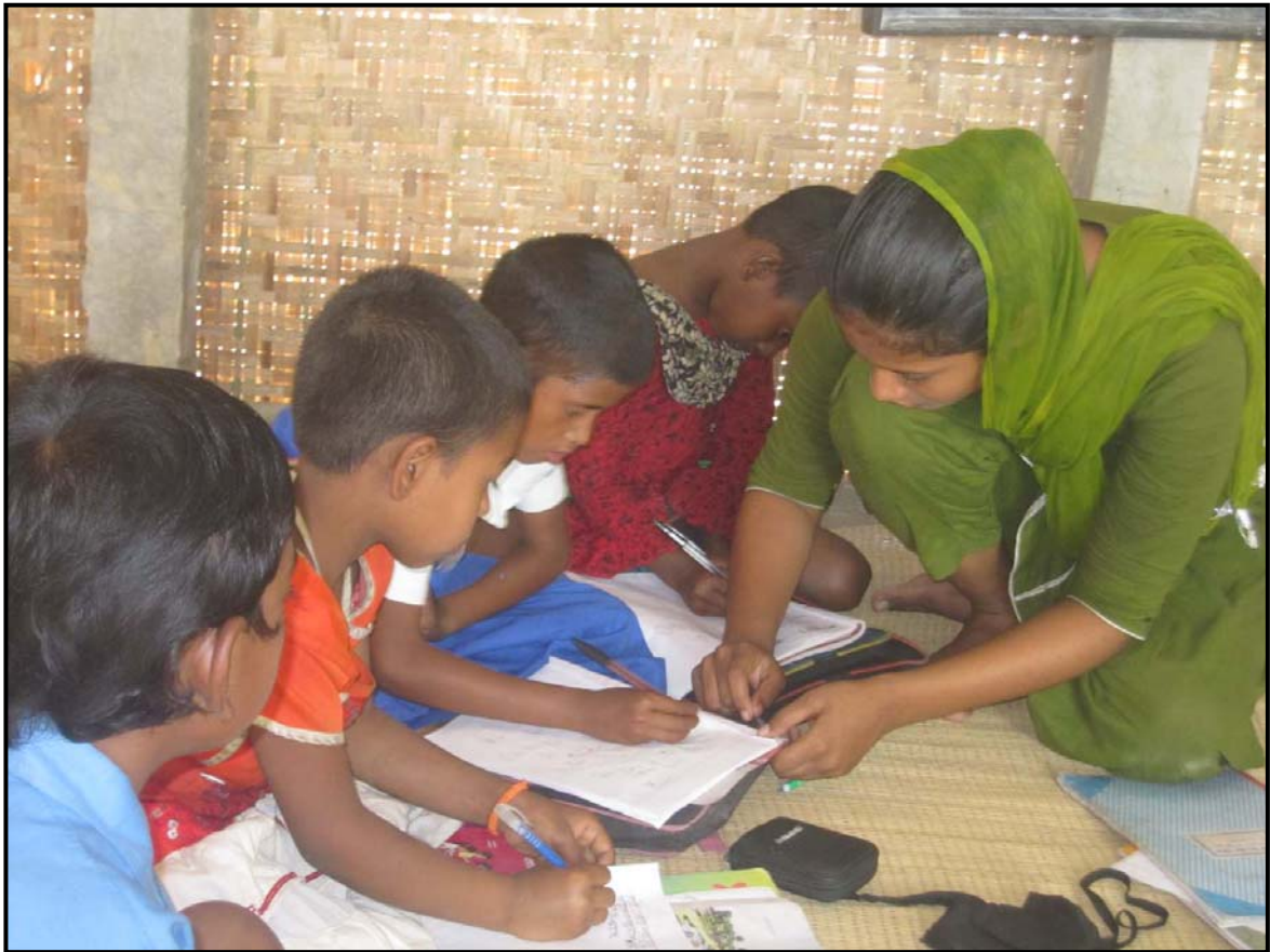
Tuition Programme at Sorupdaho