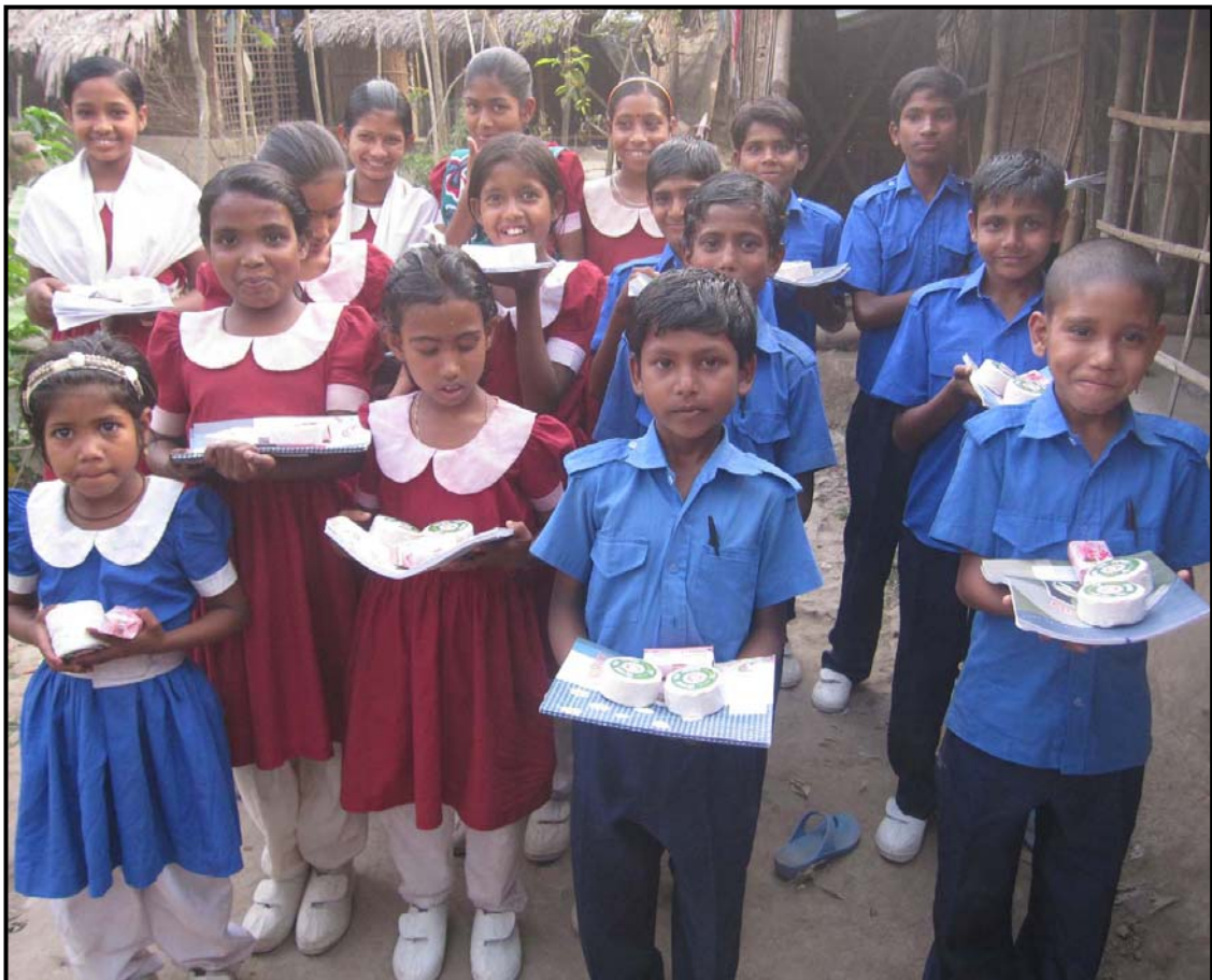
Churmankati students all together with materials...