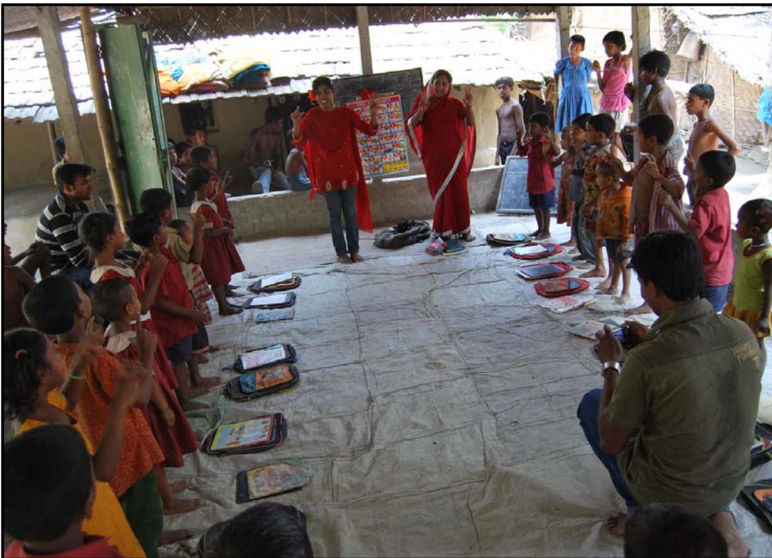
Play and fun at Jogahati Pre-school...