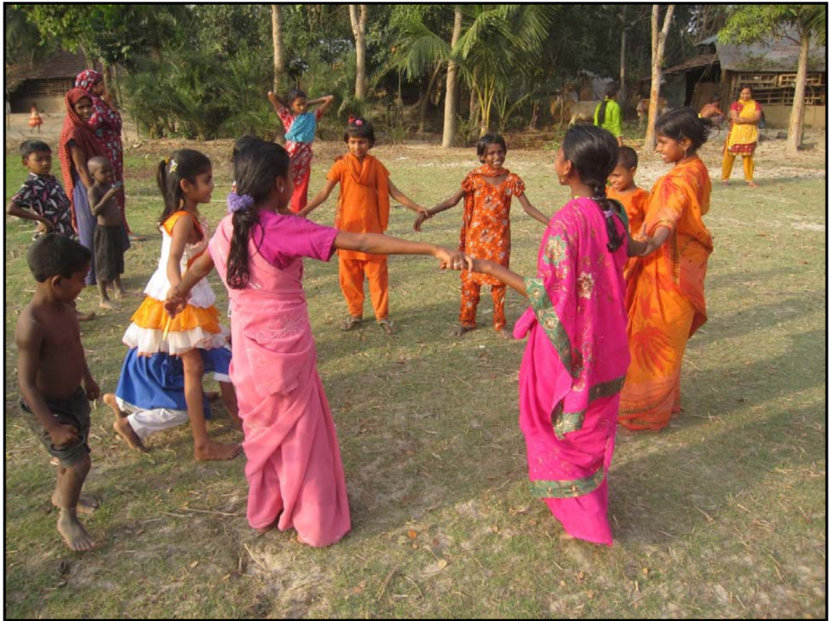
Game and sports at picnic...