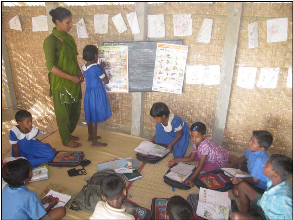
Tuition Programme at Sorupdaho