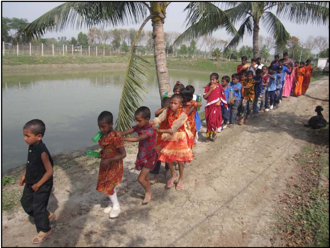
Lets go for picnic...Sorupdaho students on the way for picnic...