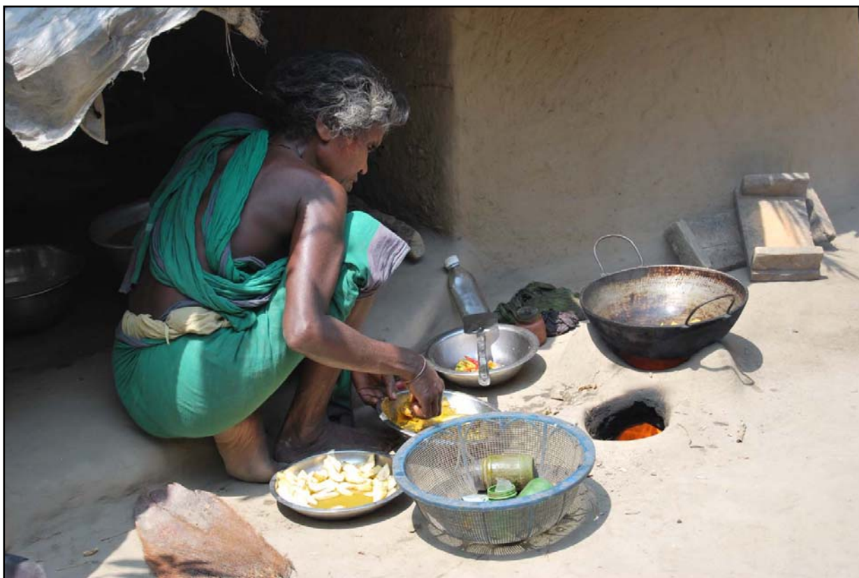
Jogahati Community member preparing meal...