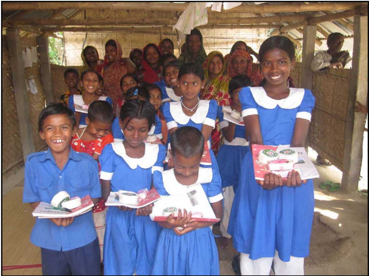
Sorupdaho students all together with materials...