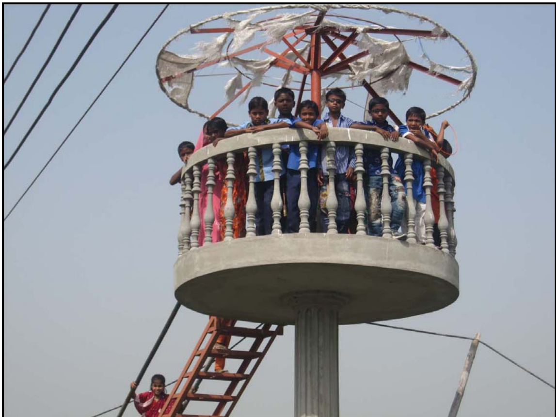
Sorupdaho students at picnic...