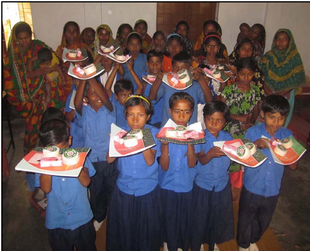
Mohishati students all together with materials...