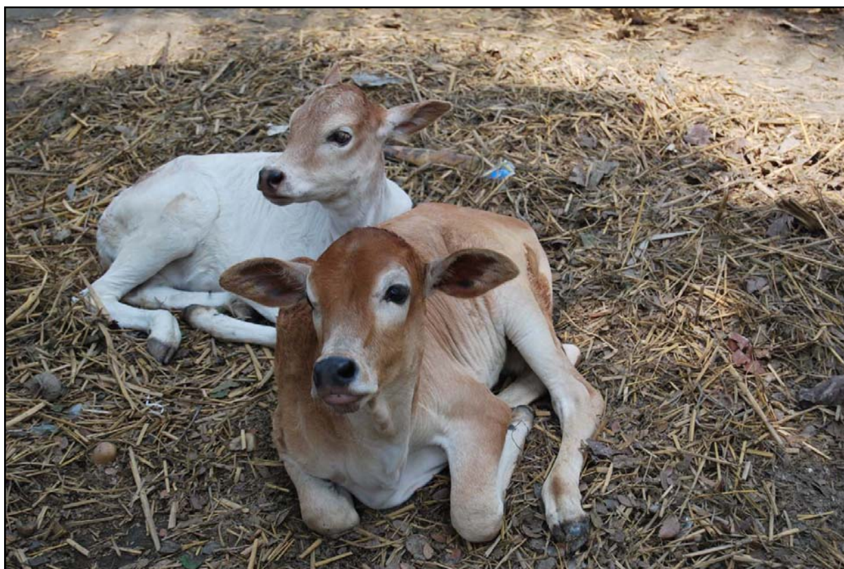
Now Jogahati community people involving in rearing domestic animals...