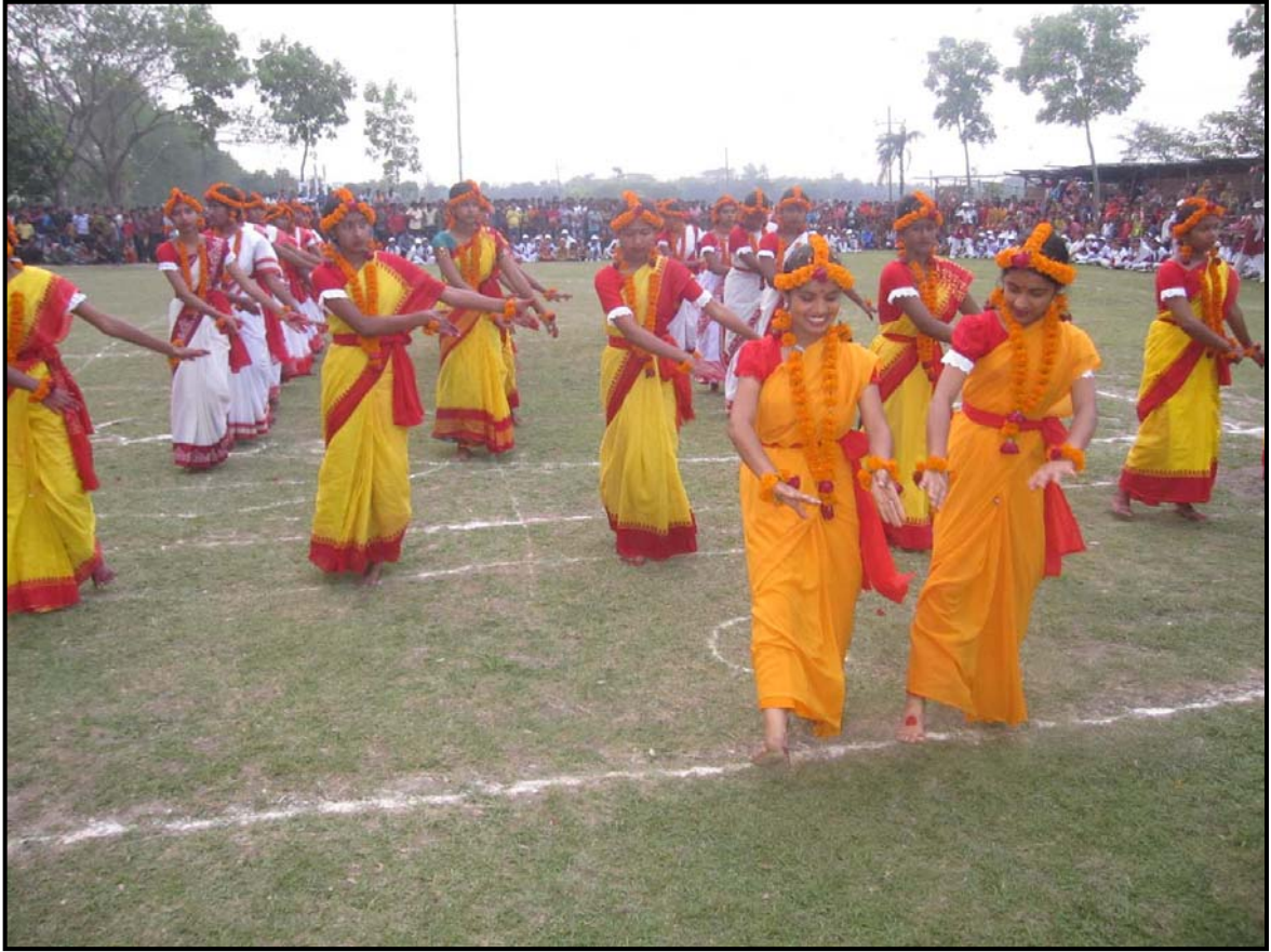
Independence Day cultural programme at local School...our student participate