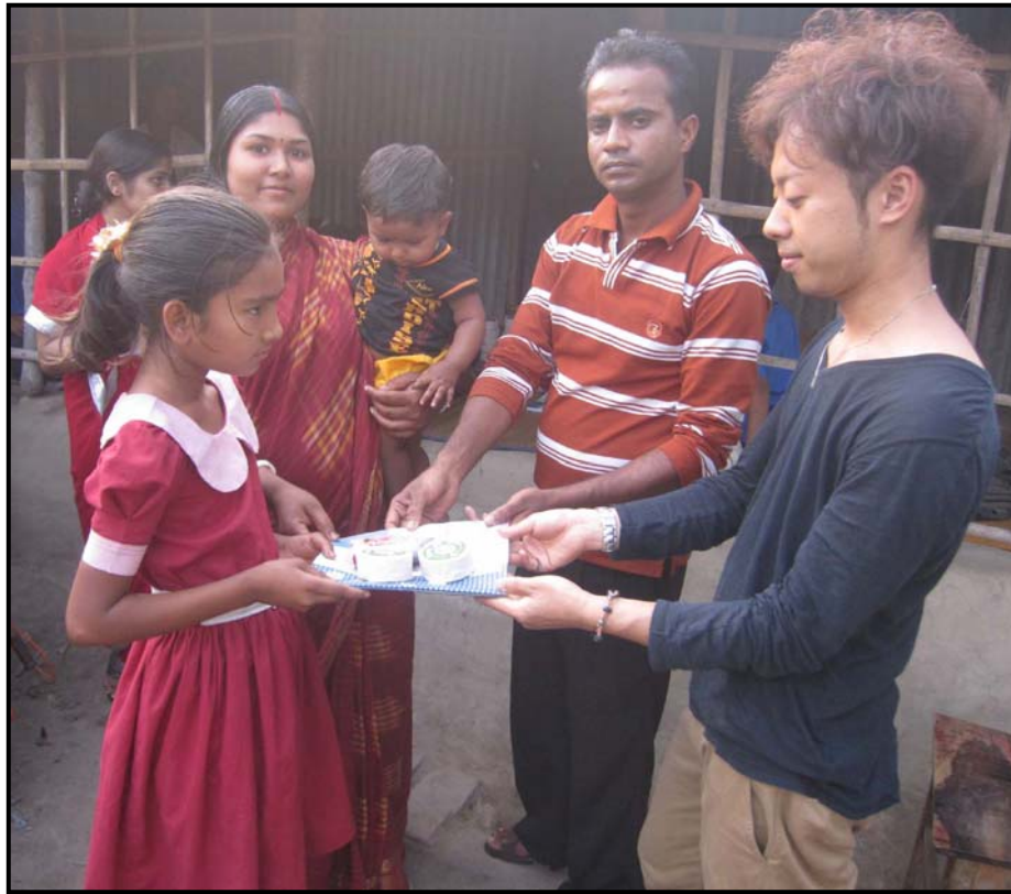
Distribution programme at Churamankati...