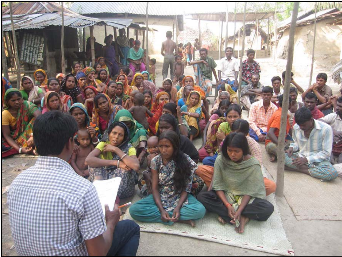
Motivation and awareness programme at community...