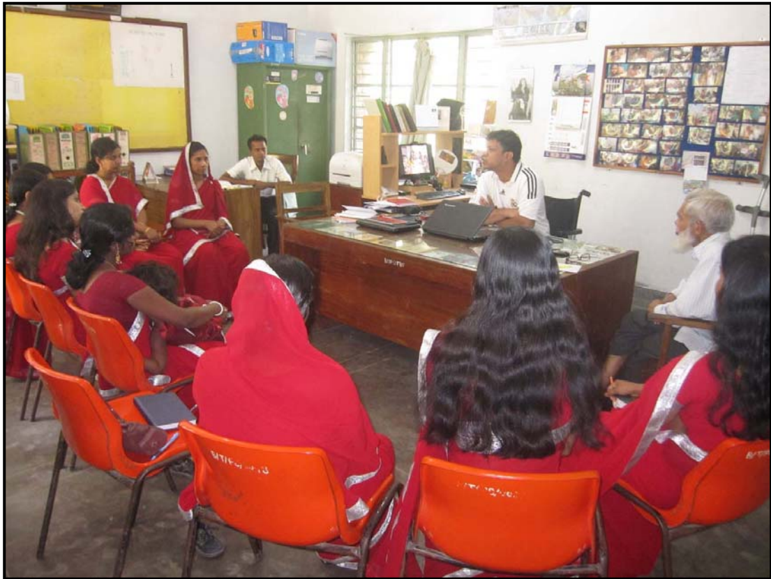
Monthly teachers' coordination meeting...