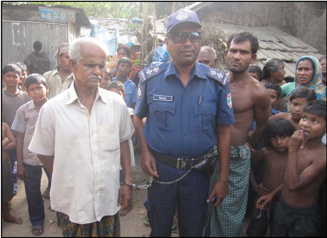
The pervert in under law enforcement custody...