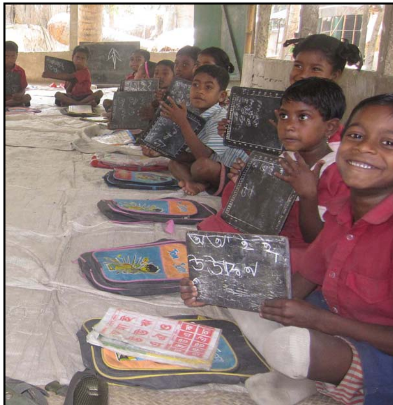
Look I can write...