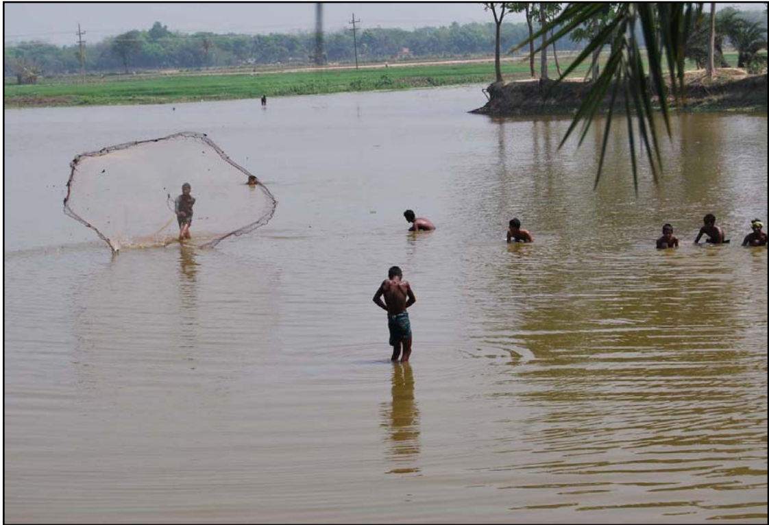
Fishing at the Community...