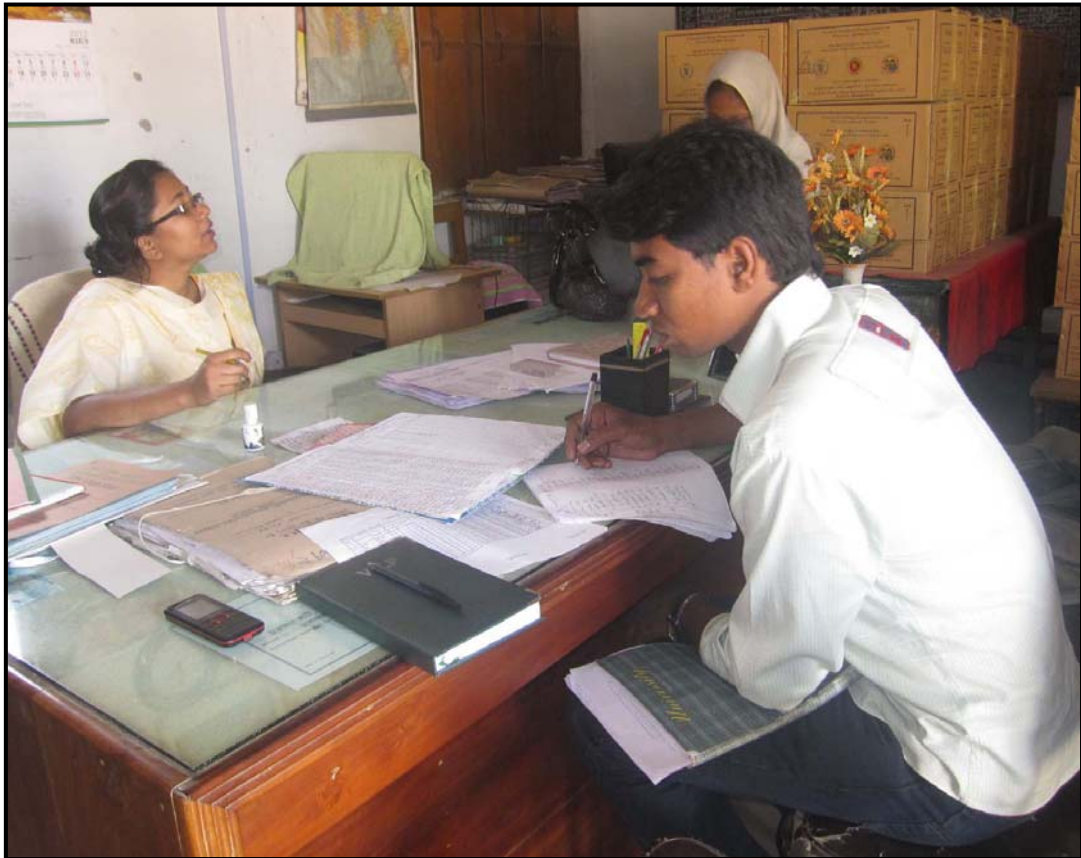
Community Motivator checks and collects student's school attendance...