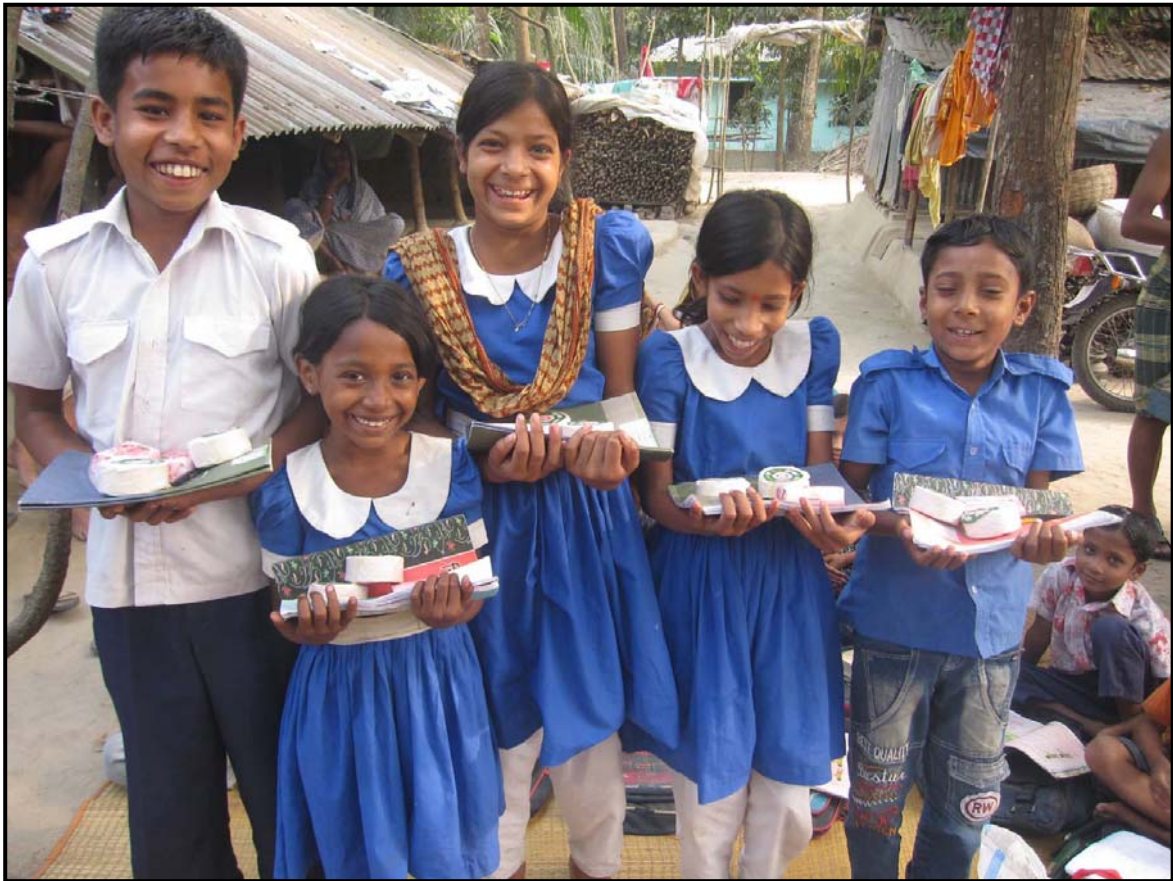
Lolitadaho students all together with materials...