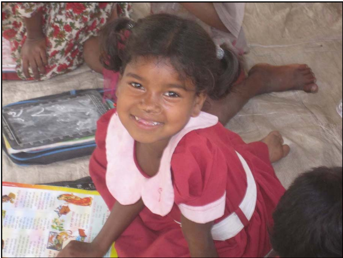
Jogahati Students Pia during the class...