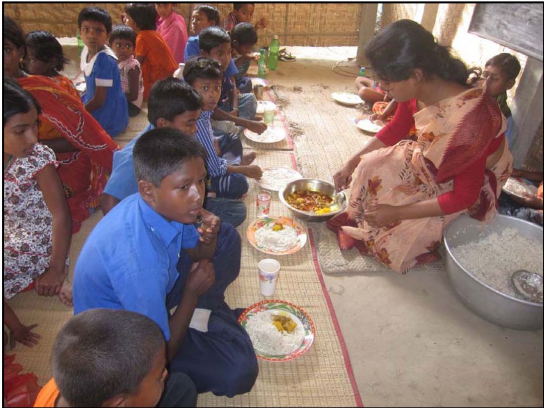
Cook together now eats together...