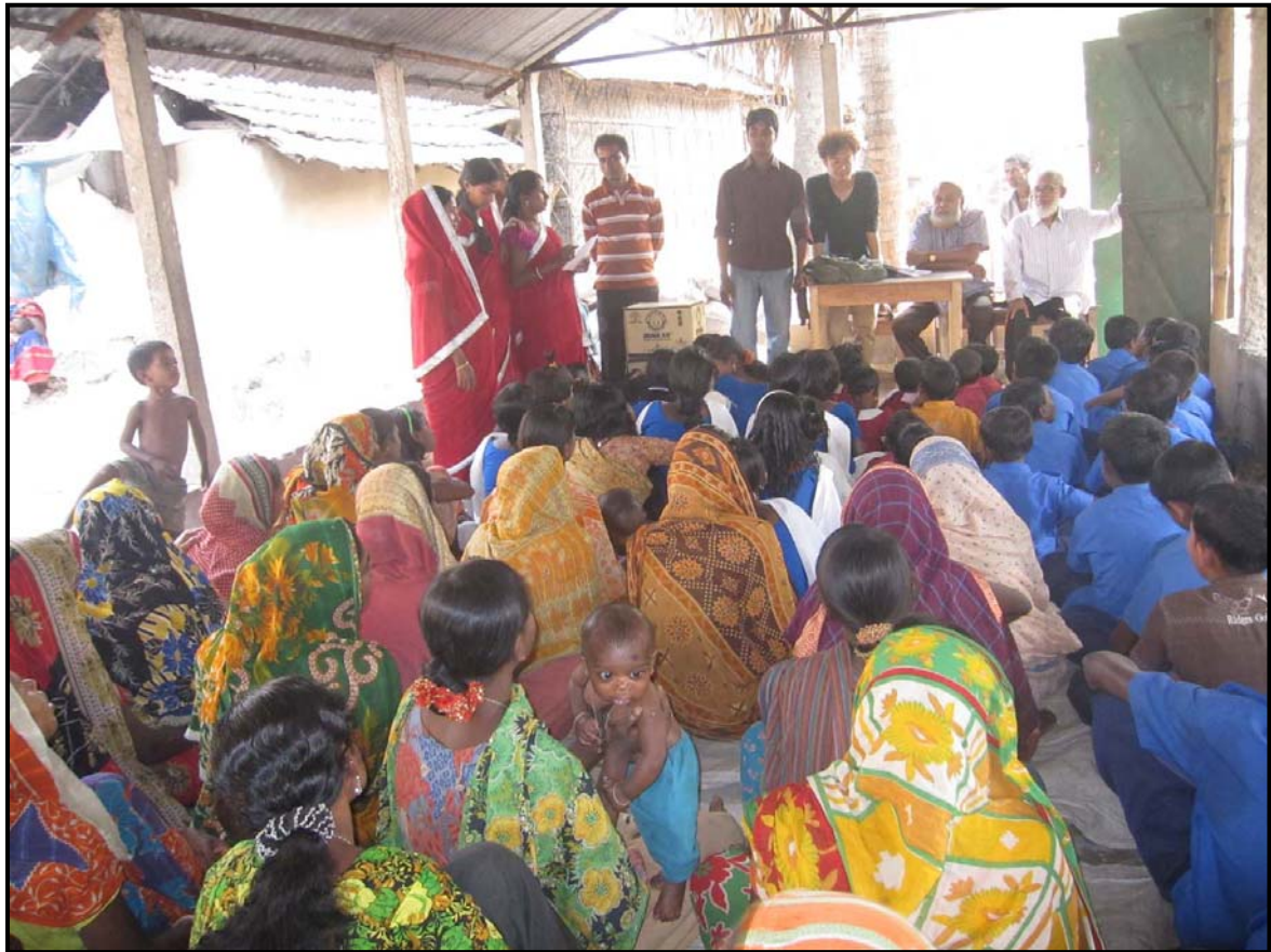
Distribution programme at Jogahati...