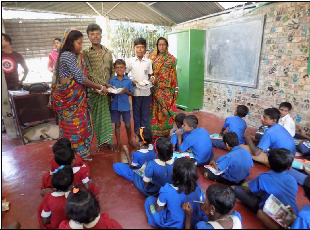
Materials distribution at Jogahati village...