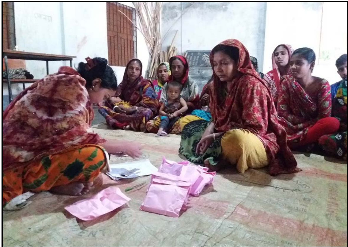
Distributing medicine at Mohishati village...