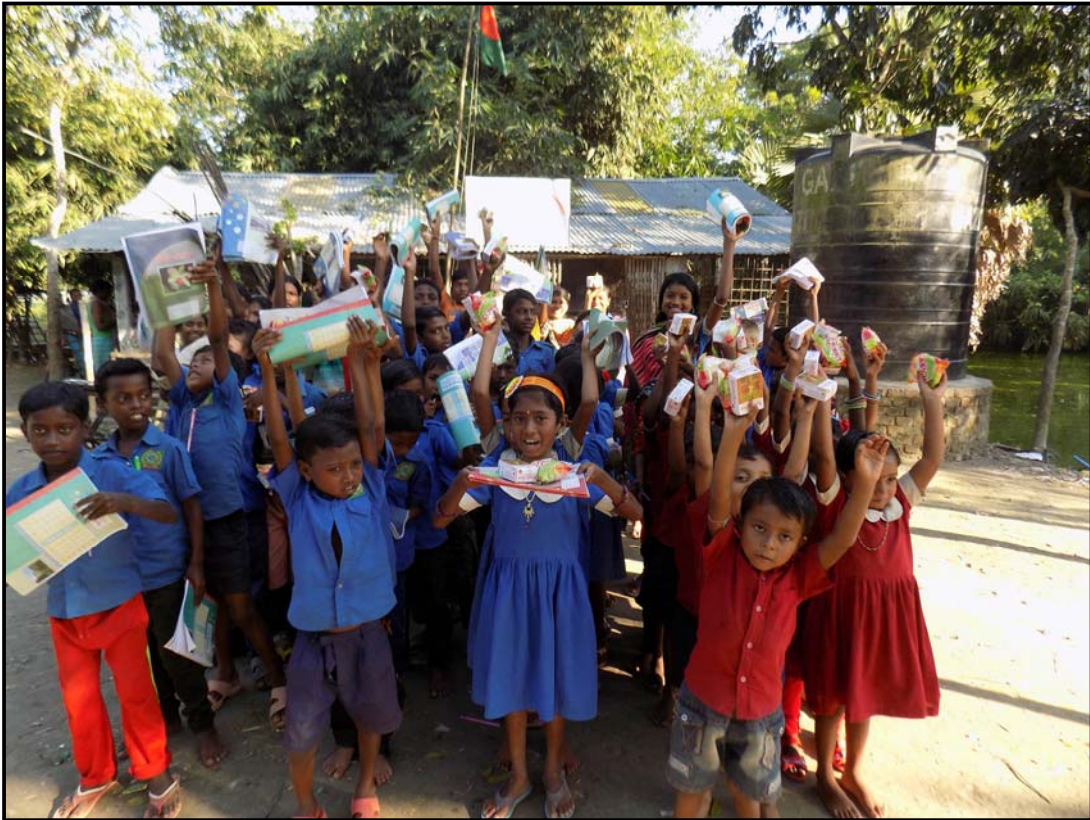
Jogahati students with the materials...