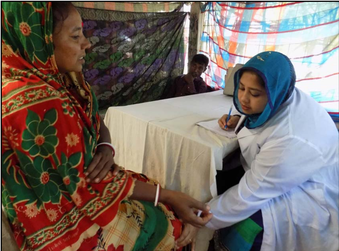
Medical Camp: Doctor visiting village member at Jogahati.....