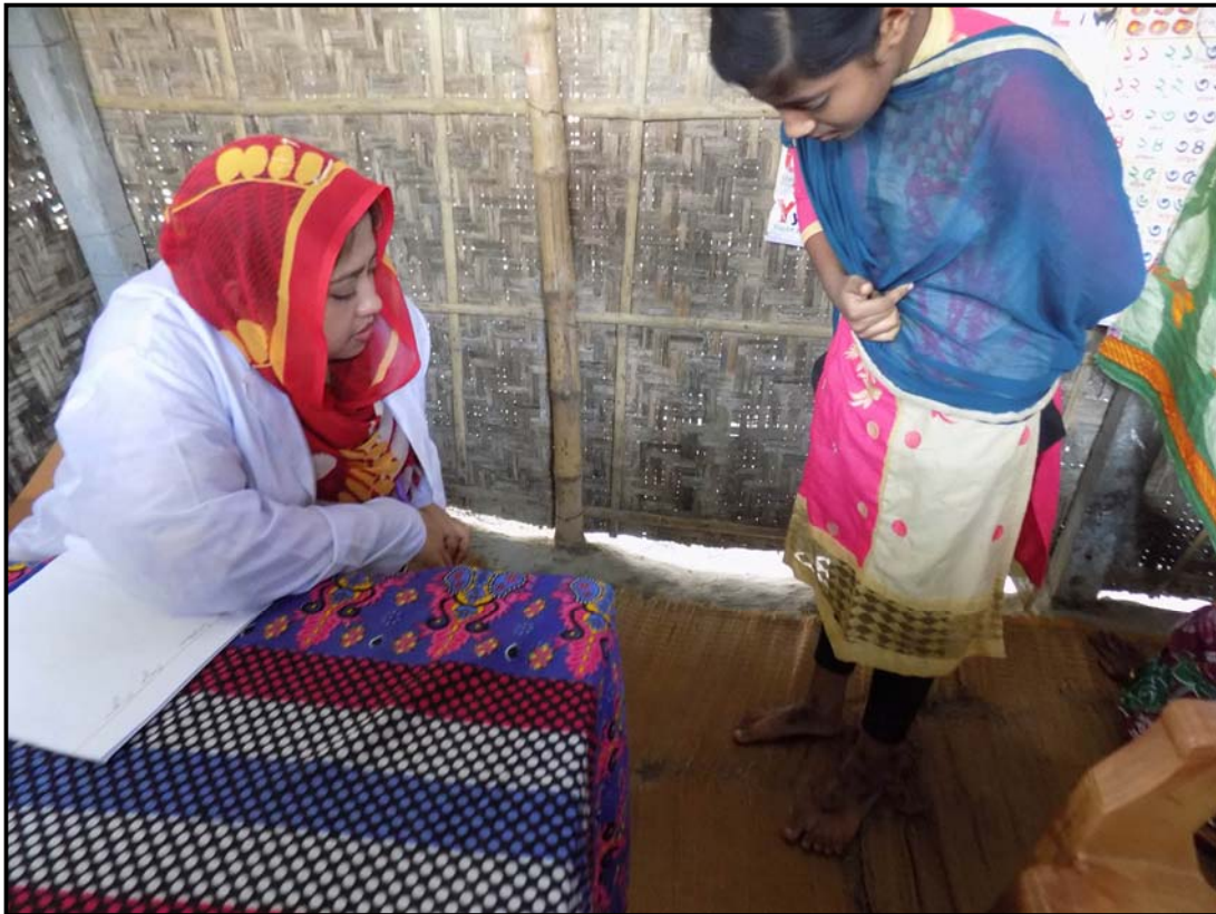
Medical Camp: Doctor visiting student at Churamankati village...