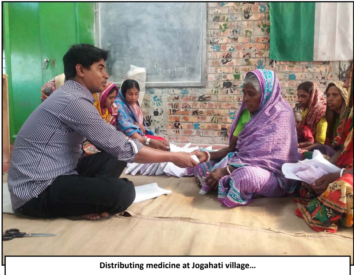
Distributing medicine at Jogahati village...