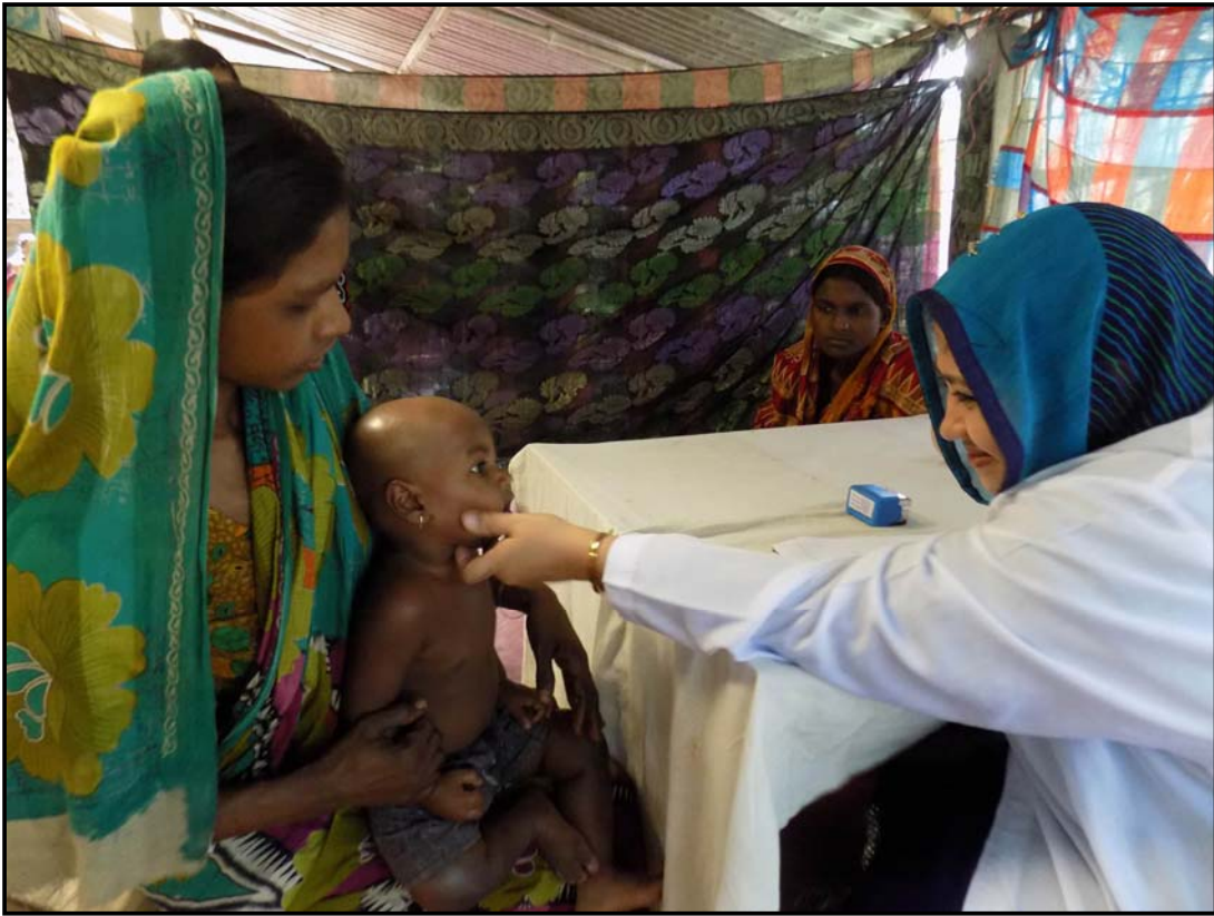
Medical Camp: Doctor visiting mother and child at Jogahati...