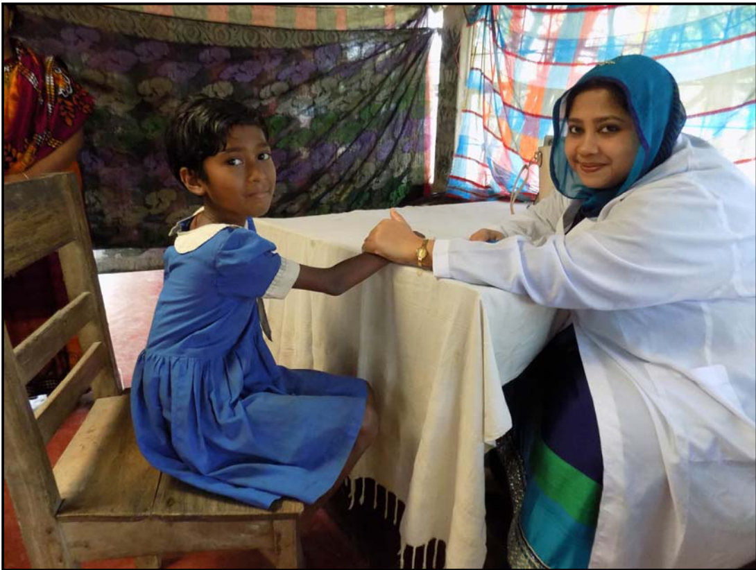
Medical Camp: Doctor & patient posing for the photo...