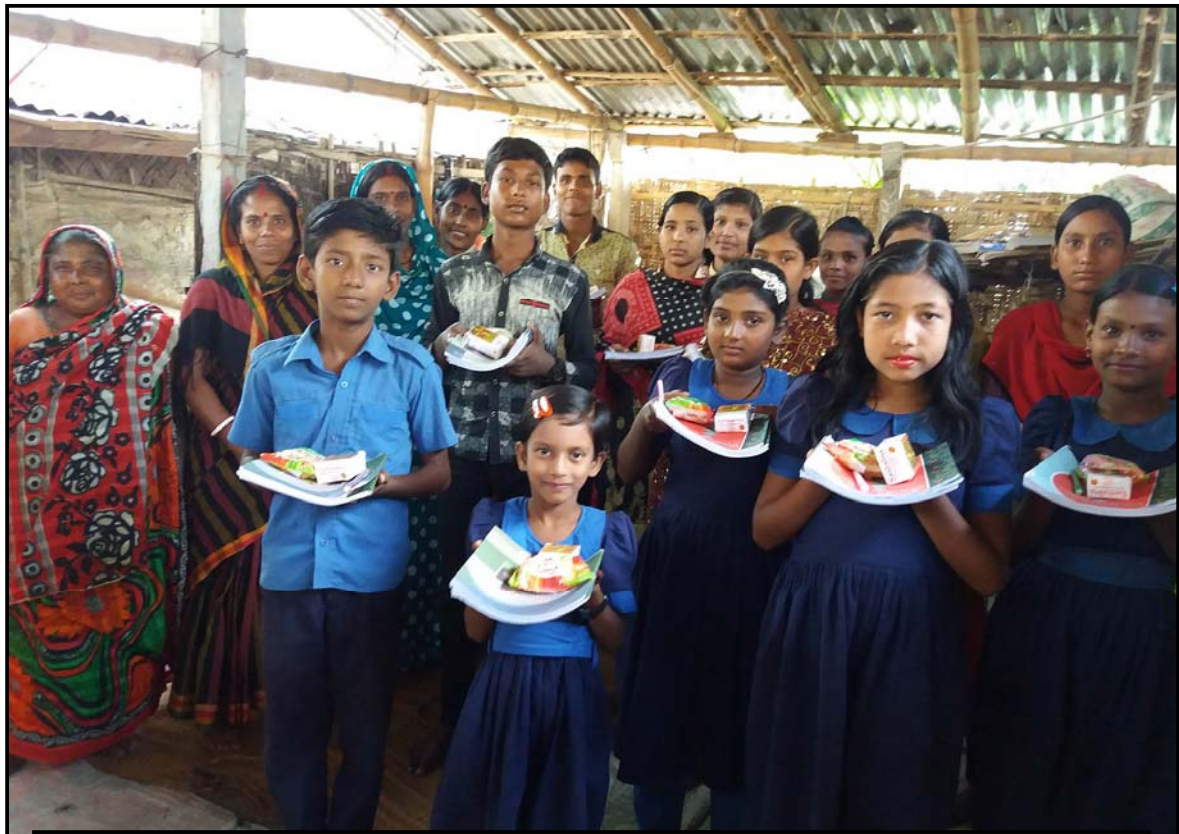
Happy students with the materials...