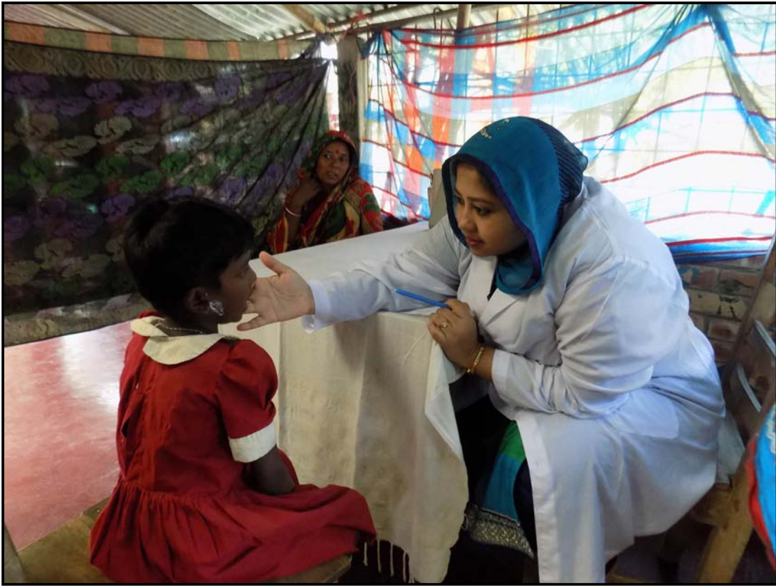
Medical Camp: Doctor visiting student at Jogahati...