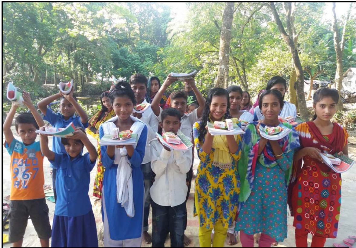
Mohishati happy students with materials...