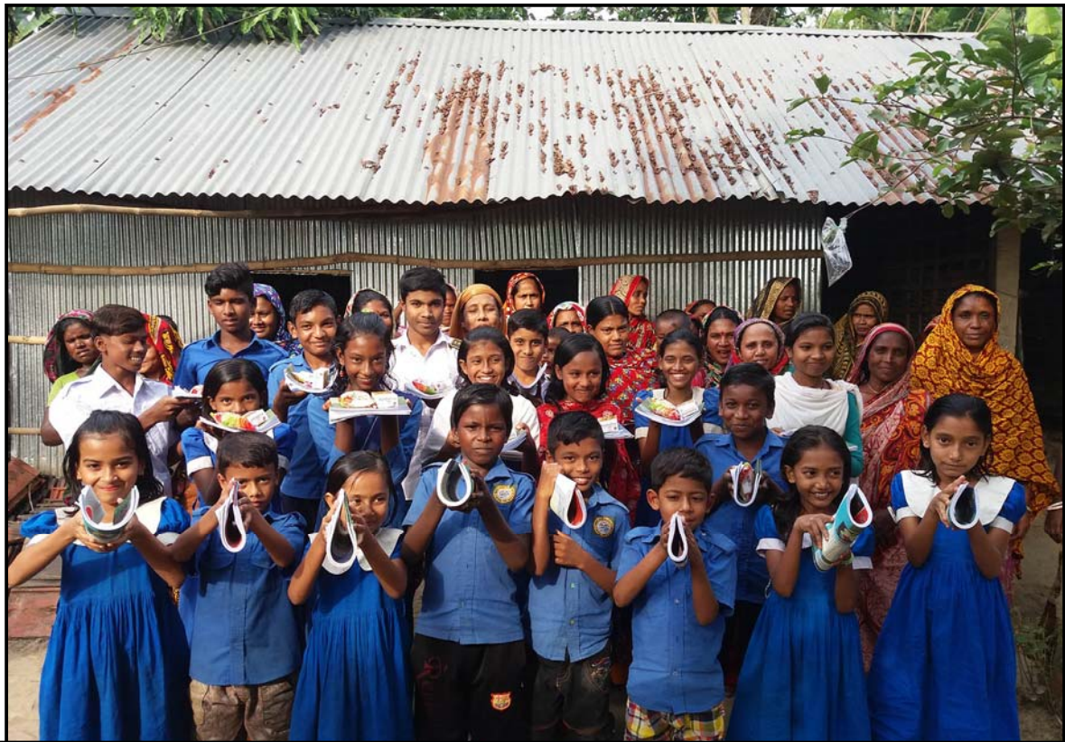
Happy students with the materials...