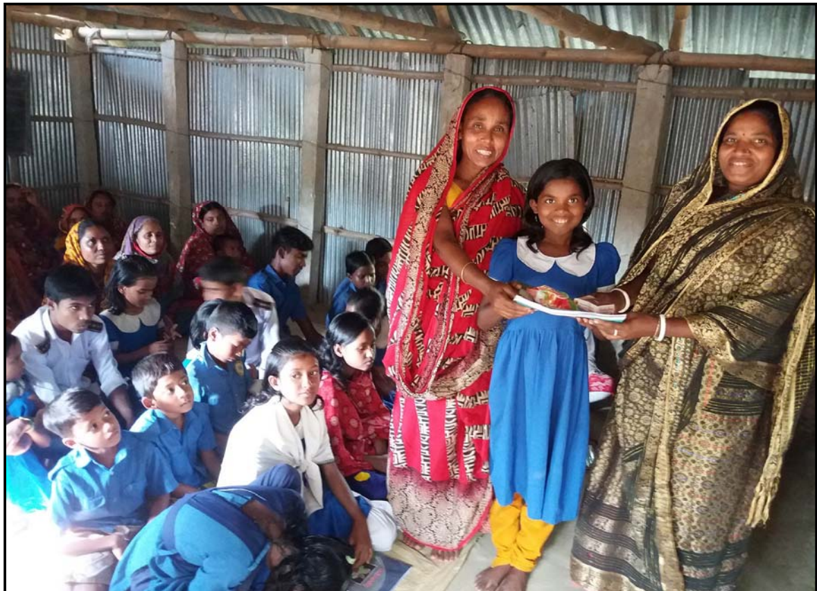
Distributing materials at Sorupdaho village by the village committee...