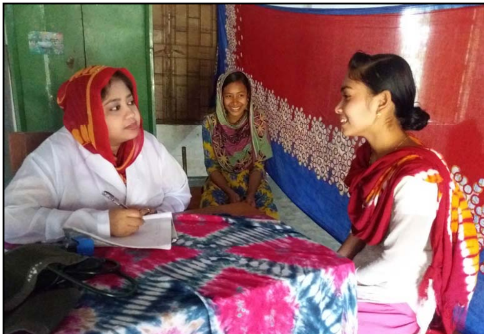
Medical Camp: Doctor visiting students of Mohishati...