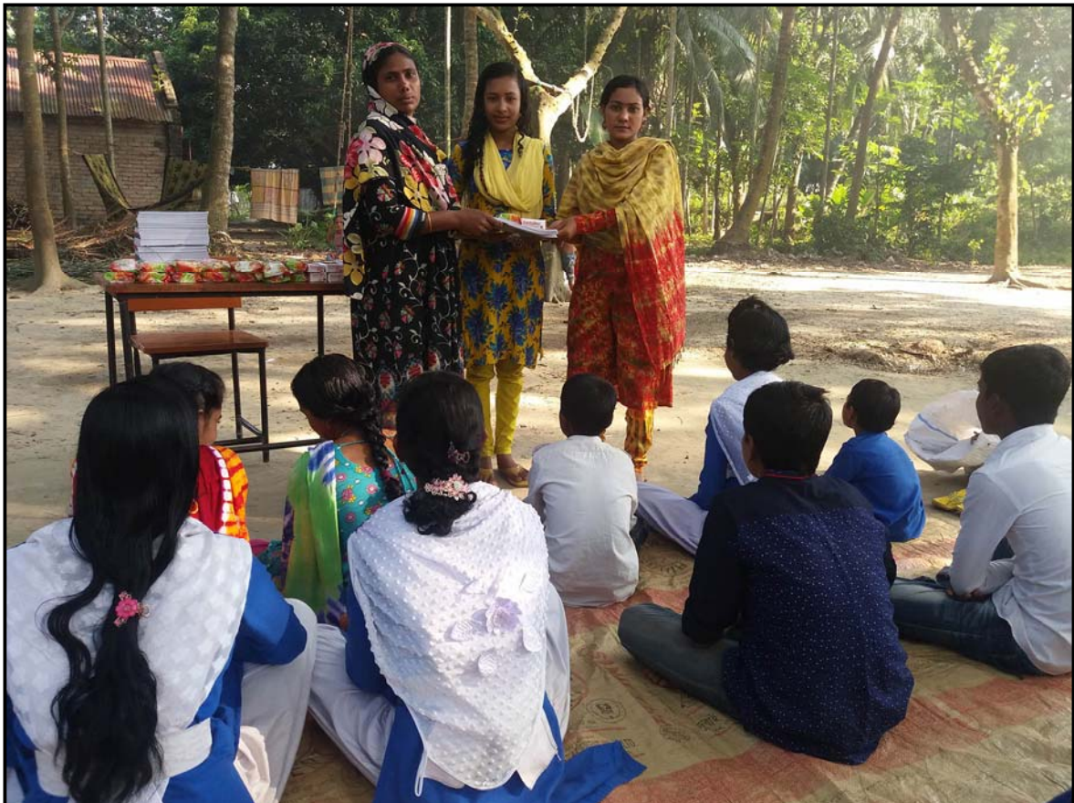
Materials distribution at Mohishati village...