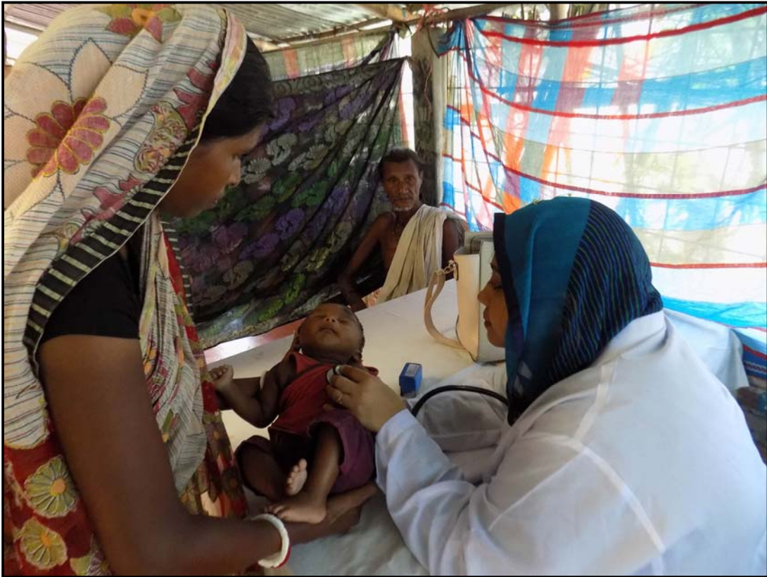
Medical Camp: Doctor visiting mother and child...