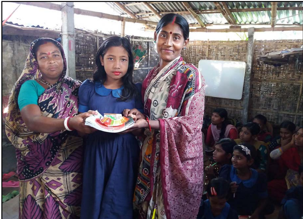
Committee members distributing materials at Churamankati