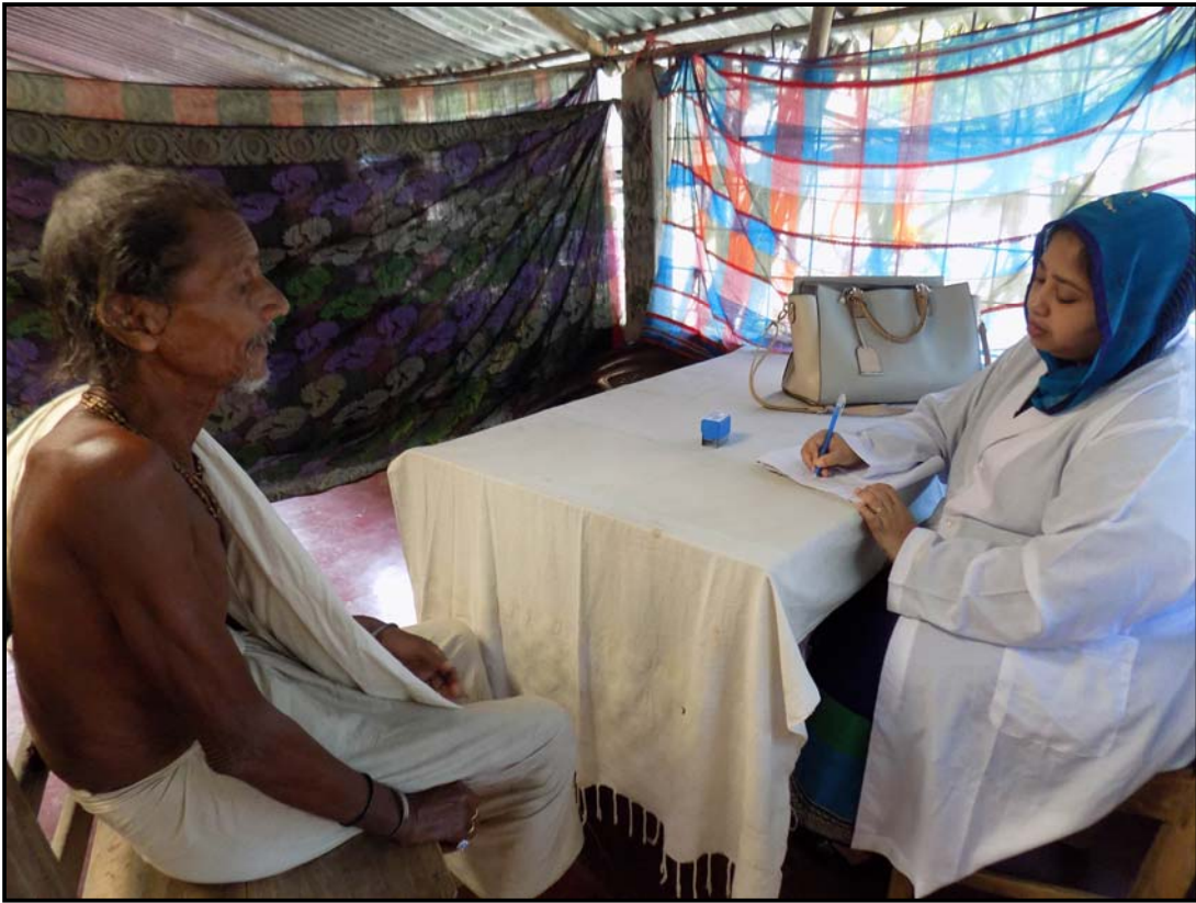
Medical Camp: Doctor visiting old age person in the village...