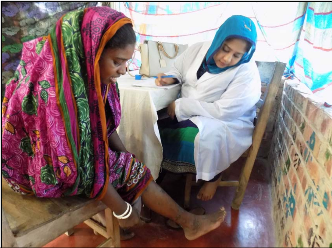
Medical Camp: Doctor visiting mother at Jogahati...