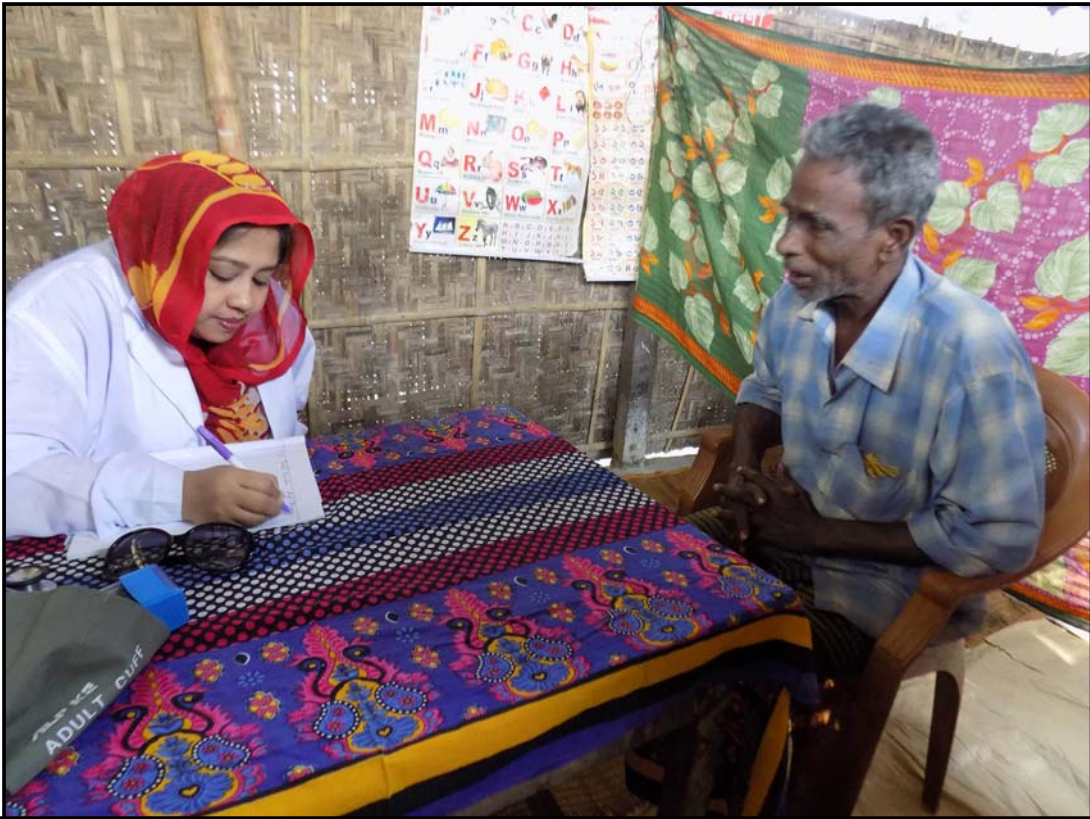
Medical Camp: Doctor visiting old man in Churamankati village...