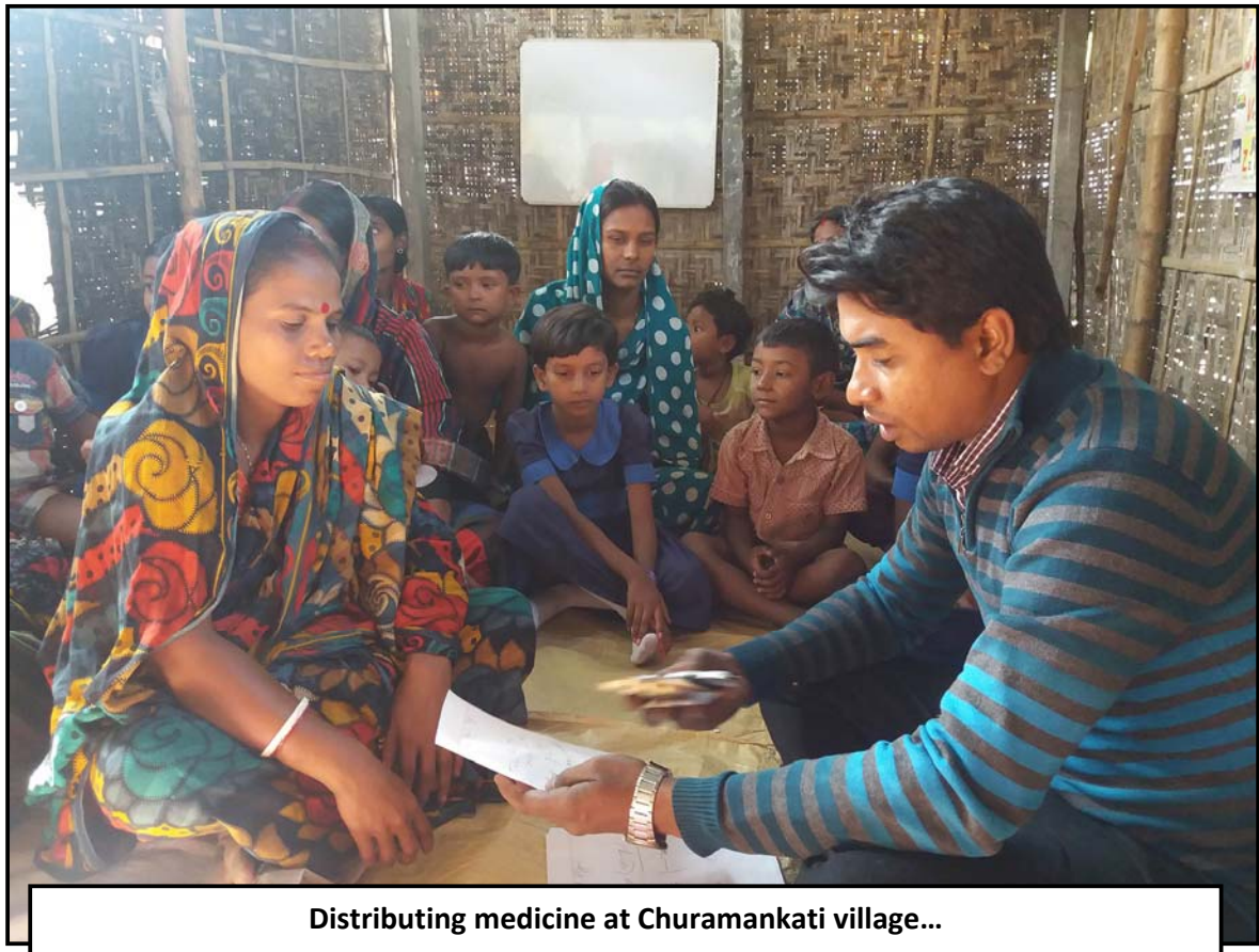
Distributing medicine at Churamankati village...