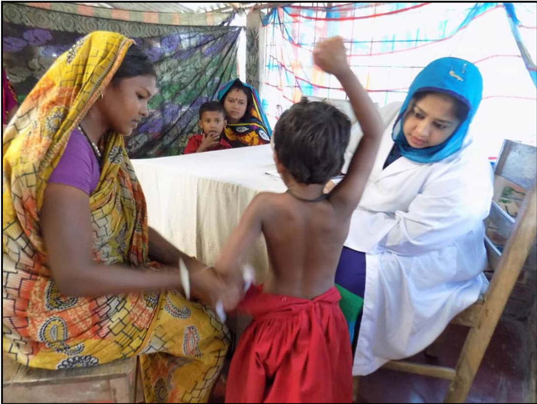
Medical Camp: Doctor visiting mother and student...