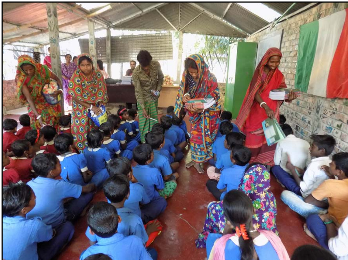
Jogahati students receiving materials from village committee...