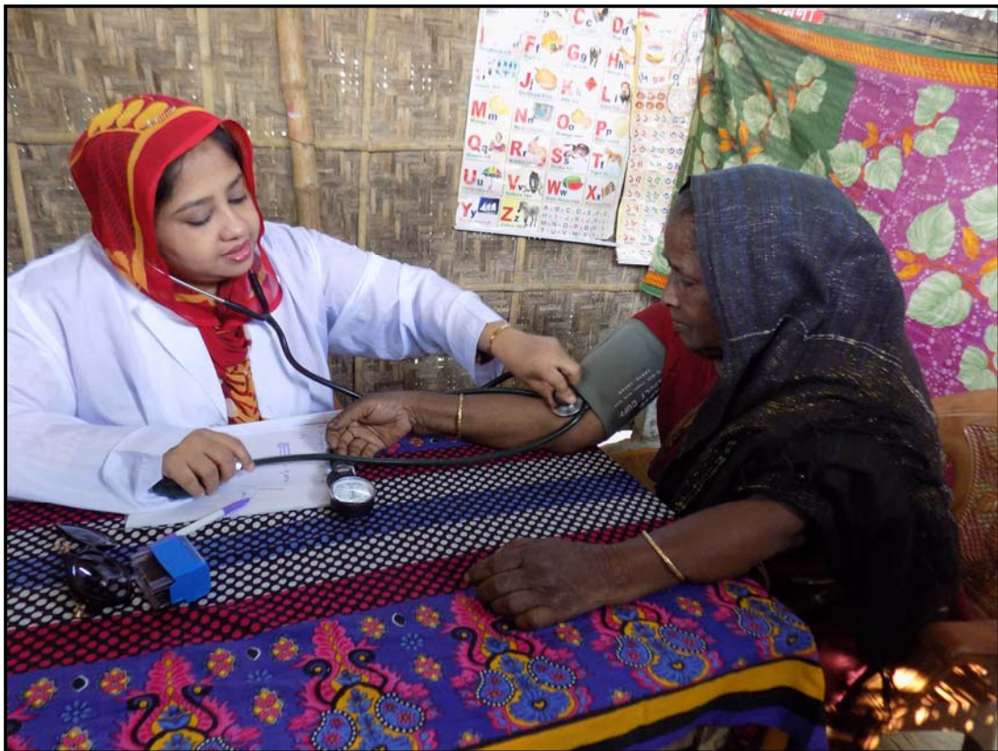
Medical Camp: Doctor visiting old women in village...