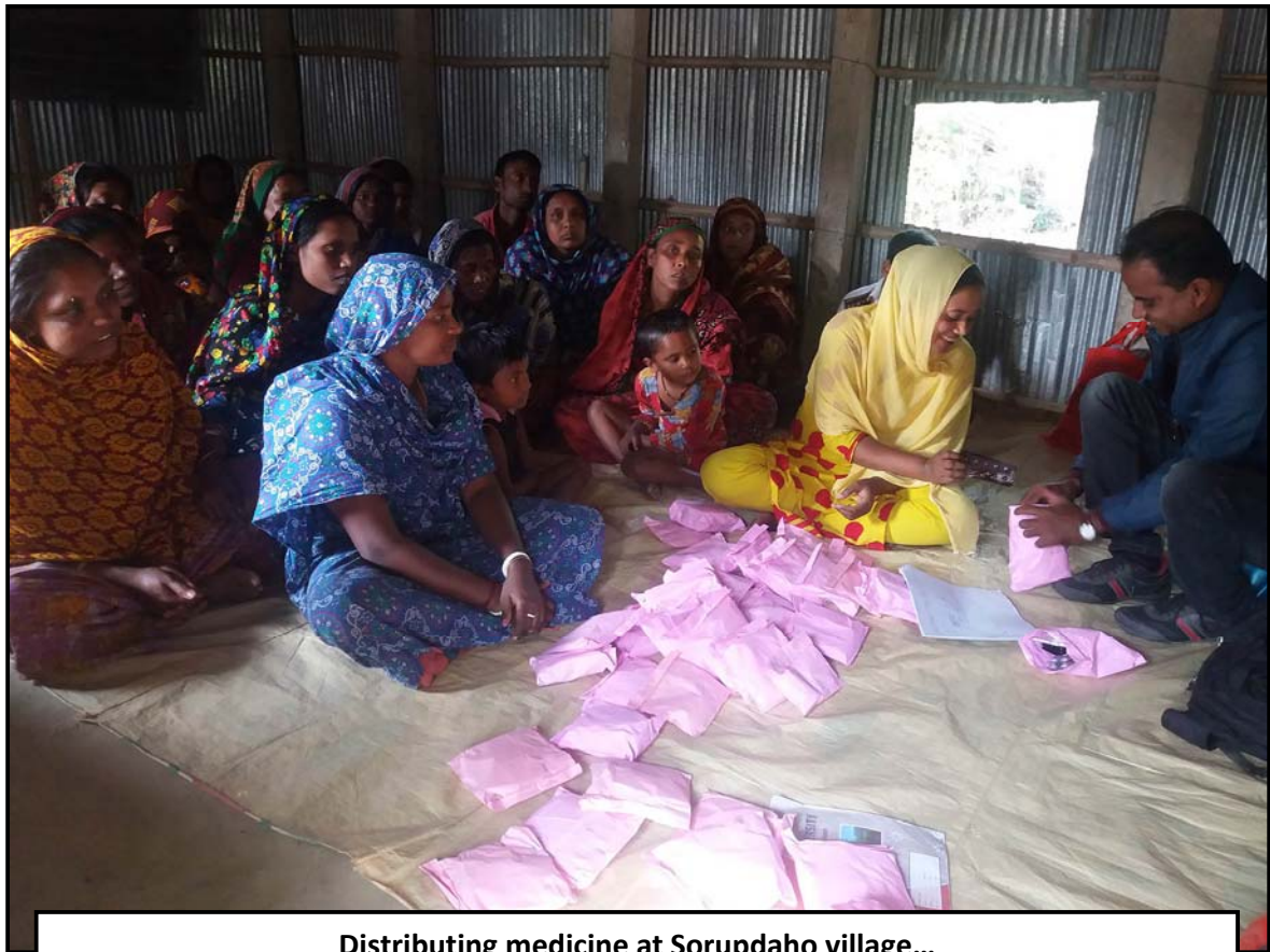
Distributing medicine at Sorupdaho village...