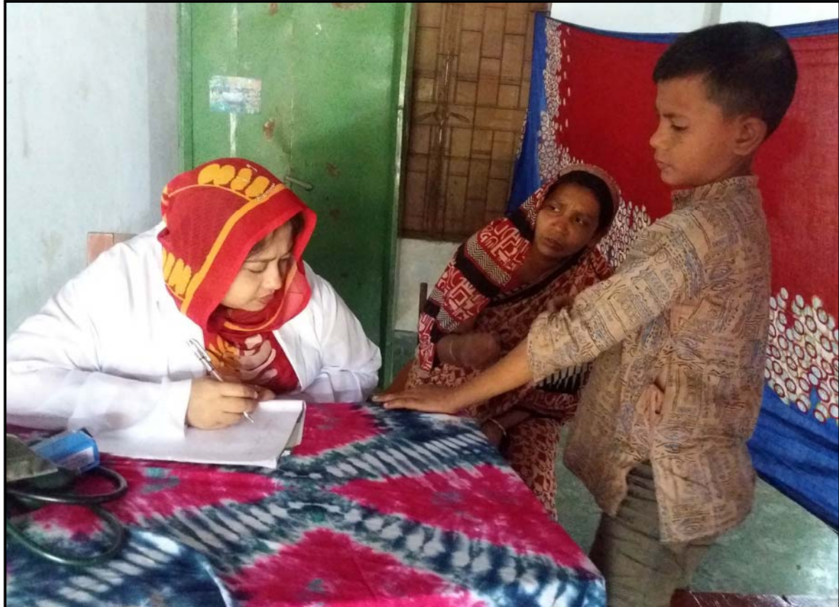
Medical Camp: Doctor visiting mother and student...