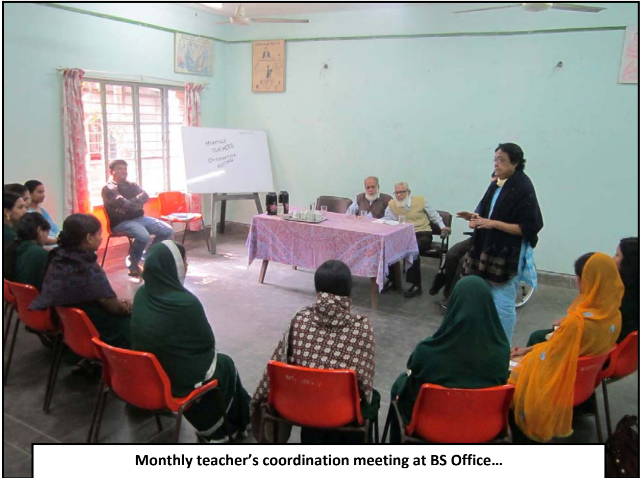
Monthly teacher's coordination meeting at BS Office...