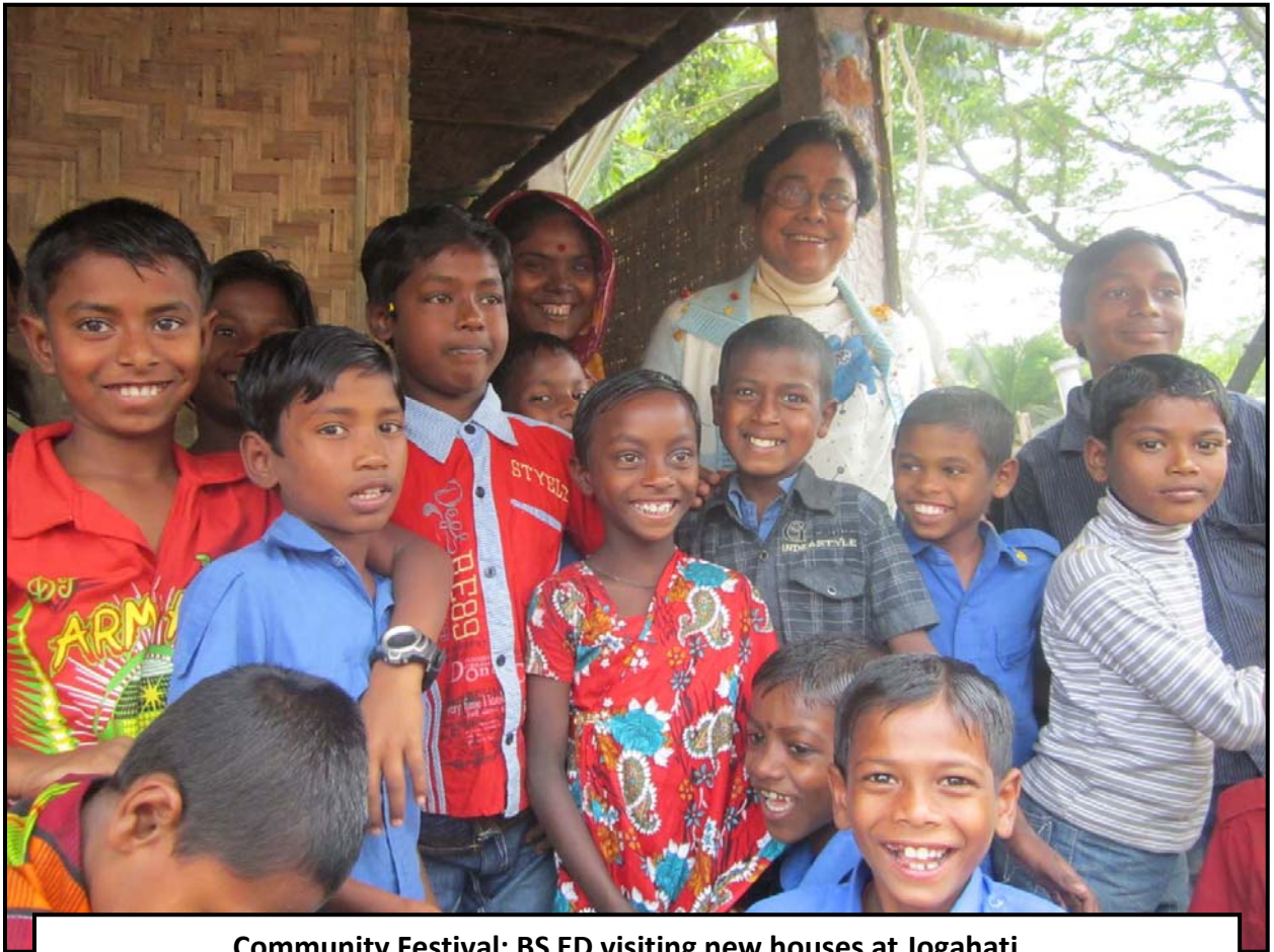
Community Festival: BS ED visiting new houses at Jogahati...