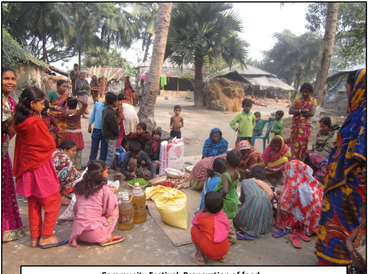
Community Festival: Preparation of food...