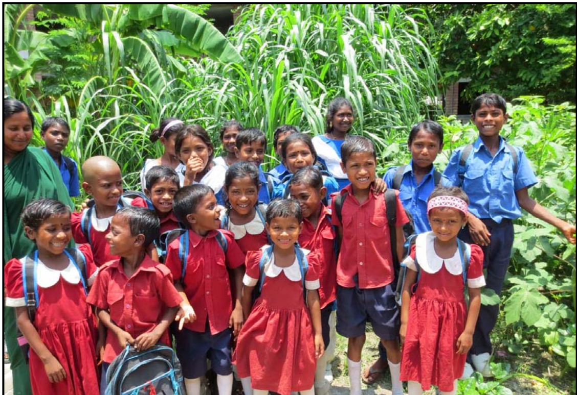
Jogahati children visiting BS Campus...