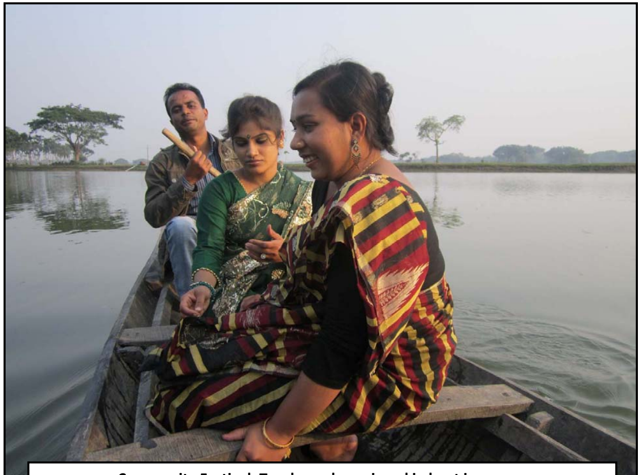
Community Festival: Teachers also enjoyed in boat journey...