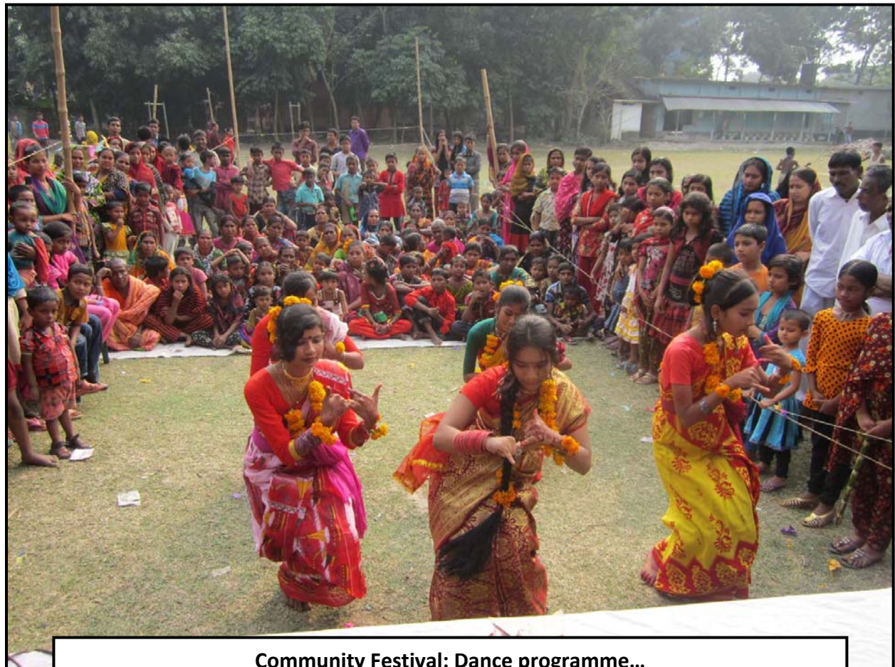
Community Festival: Dance programme...