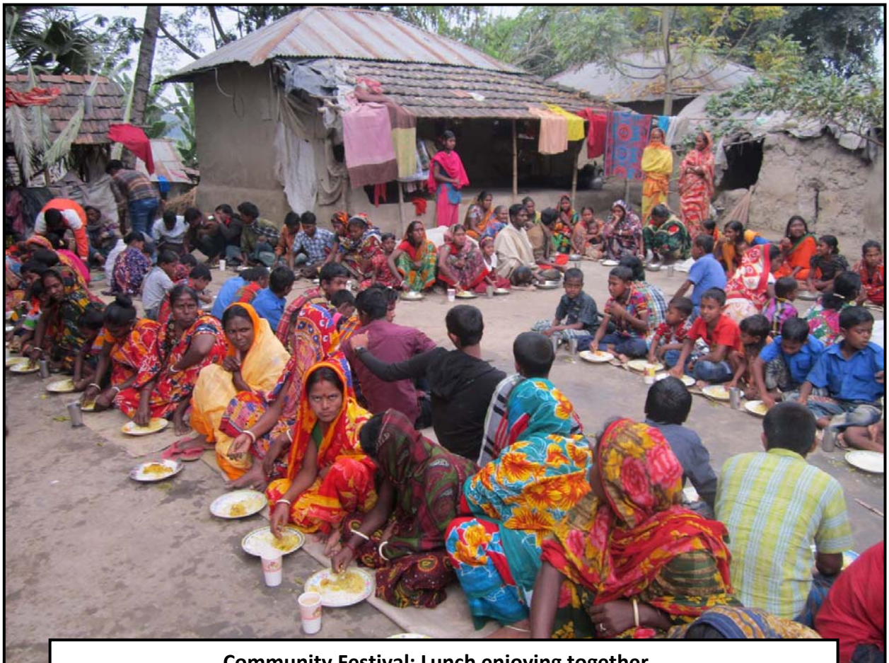
Community Festival: Lunch enjoying together...