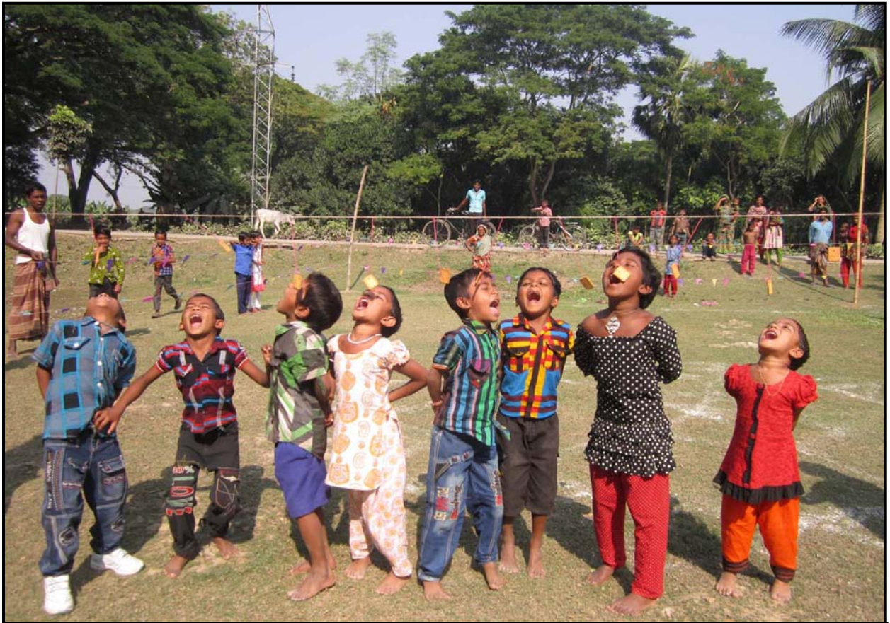
Community Festival: Children playing biscuit race game...