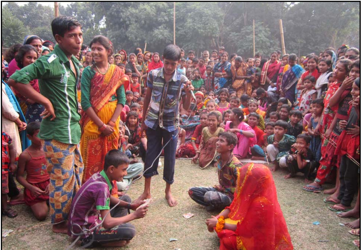
Community Festival: Children play early marriage prevention & awareness drama...