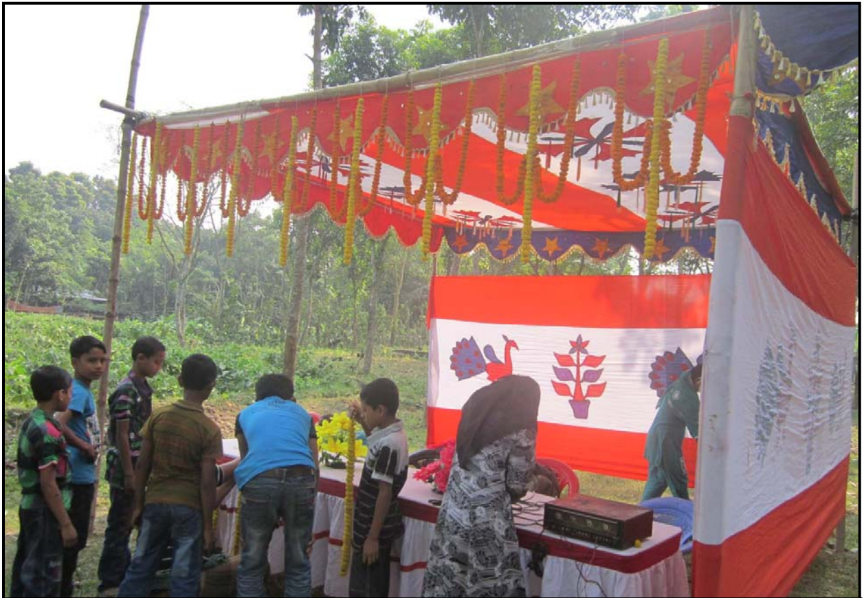
Community Festival: Children decorating the stage for programme...