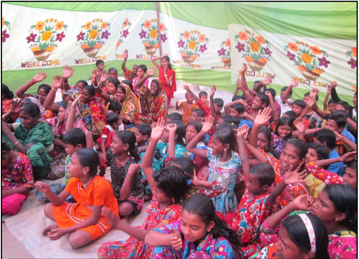
Community Festival: Children and Parents joint declaration to prevent early marriage...