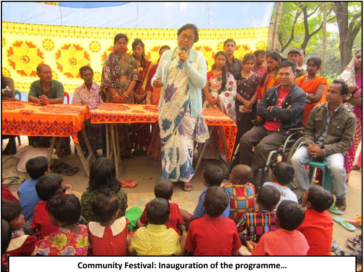
Community Festival: Inauguration of the programme...