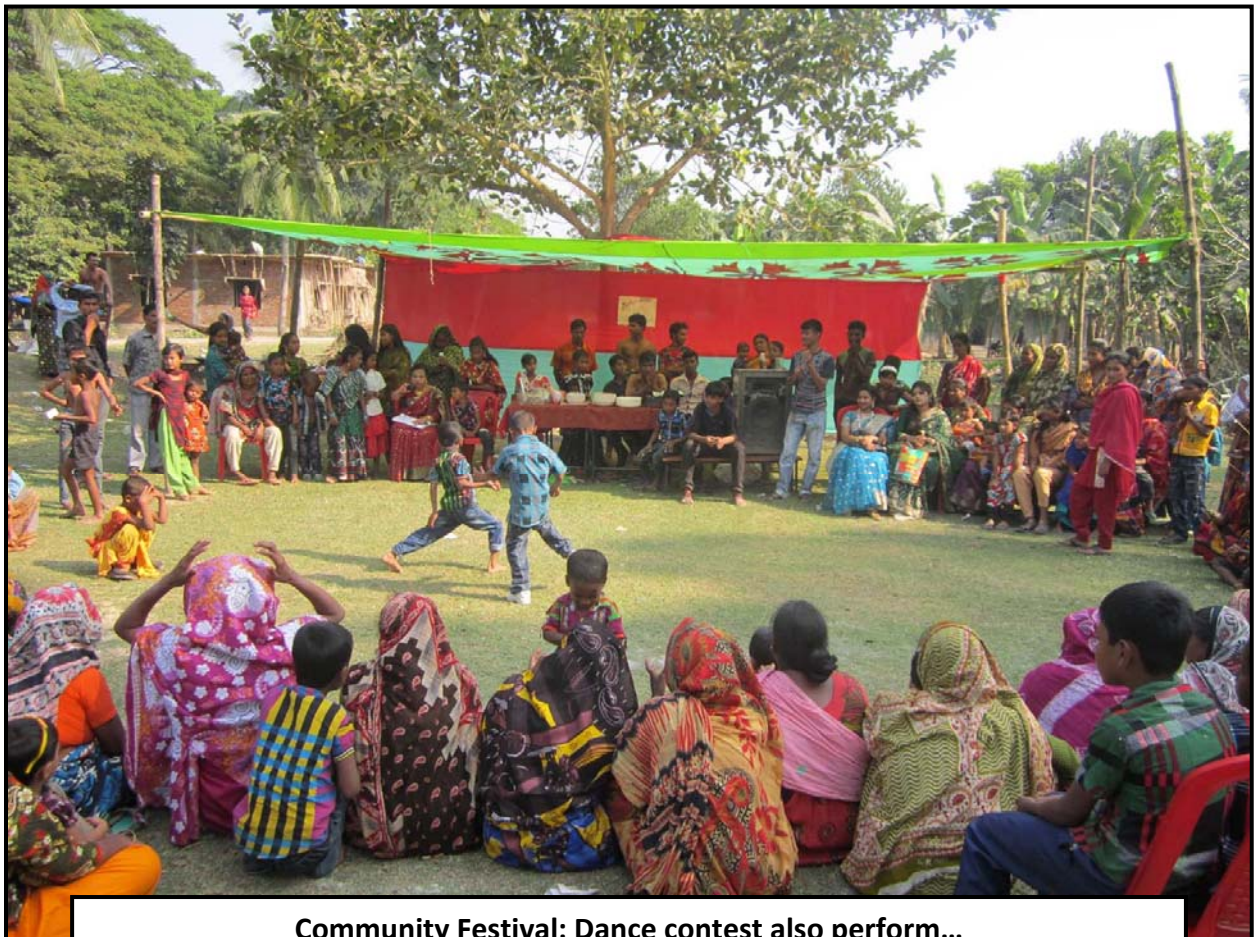
Community Festival: Dance contest also perform...