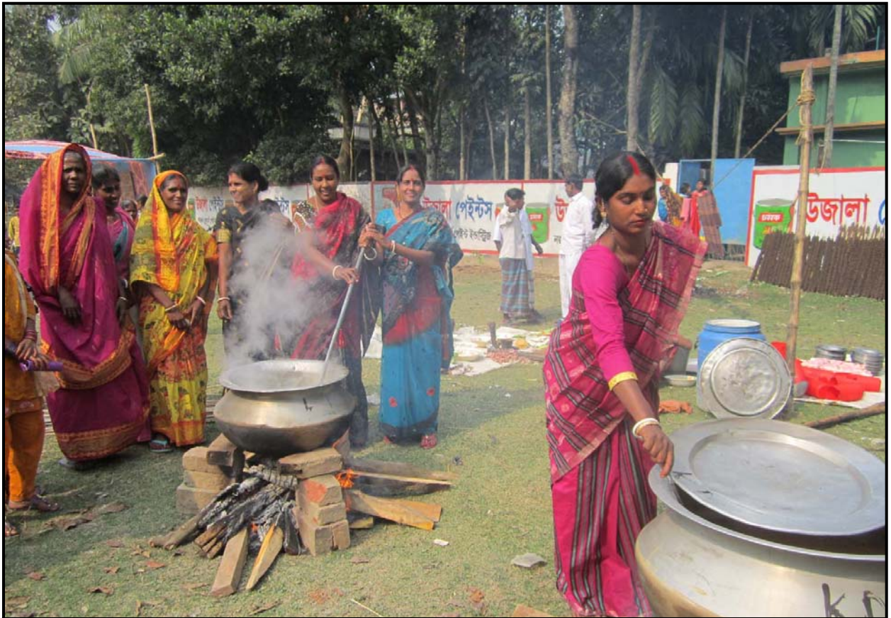
Community Festival: Parents cooking the food...