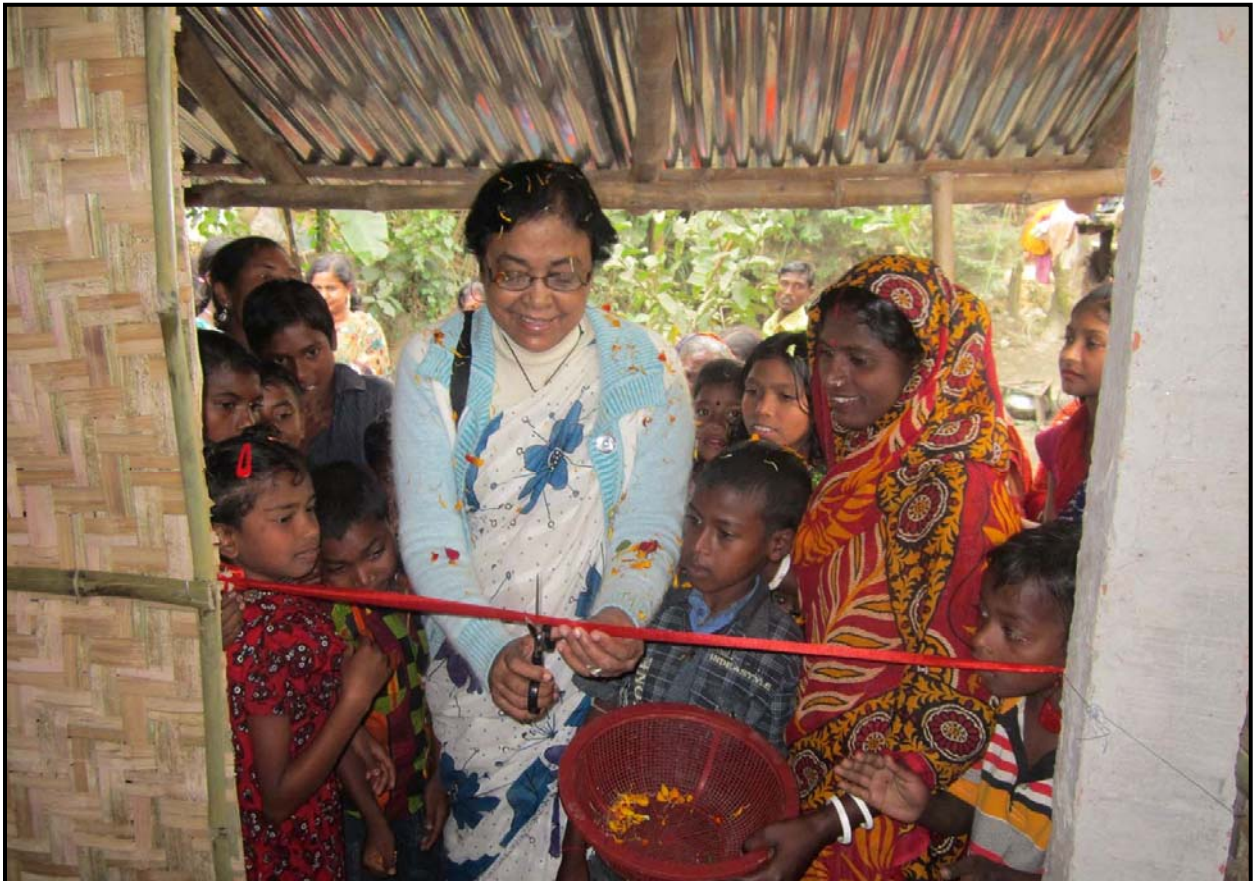
Community Festival: Inauguration of new house at Jogahati...