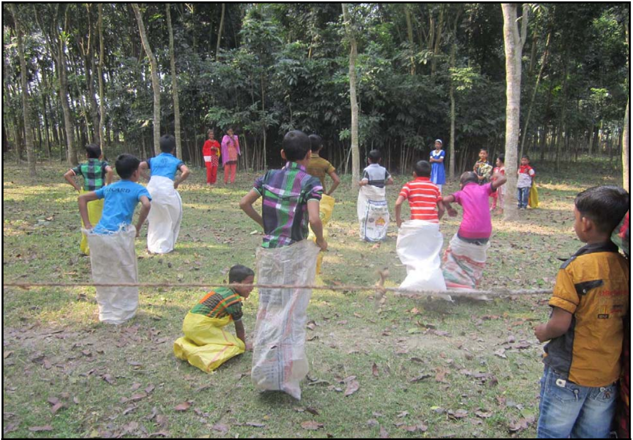
Community Festival: Children in Sack race game...