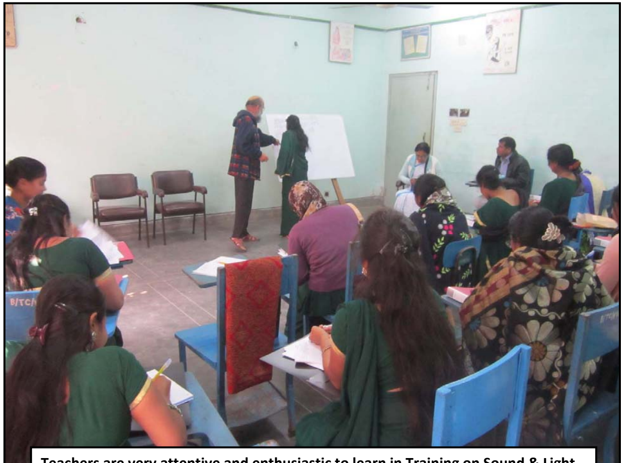
Teachers are very attentive and enthusiastic to learn in Training on Sound & Light...