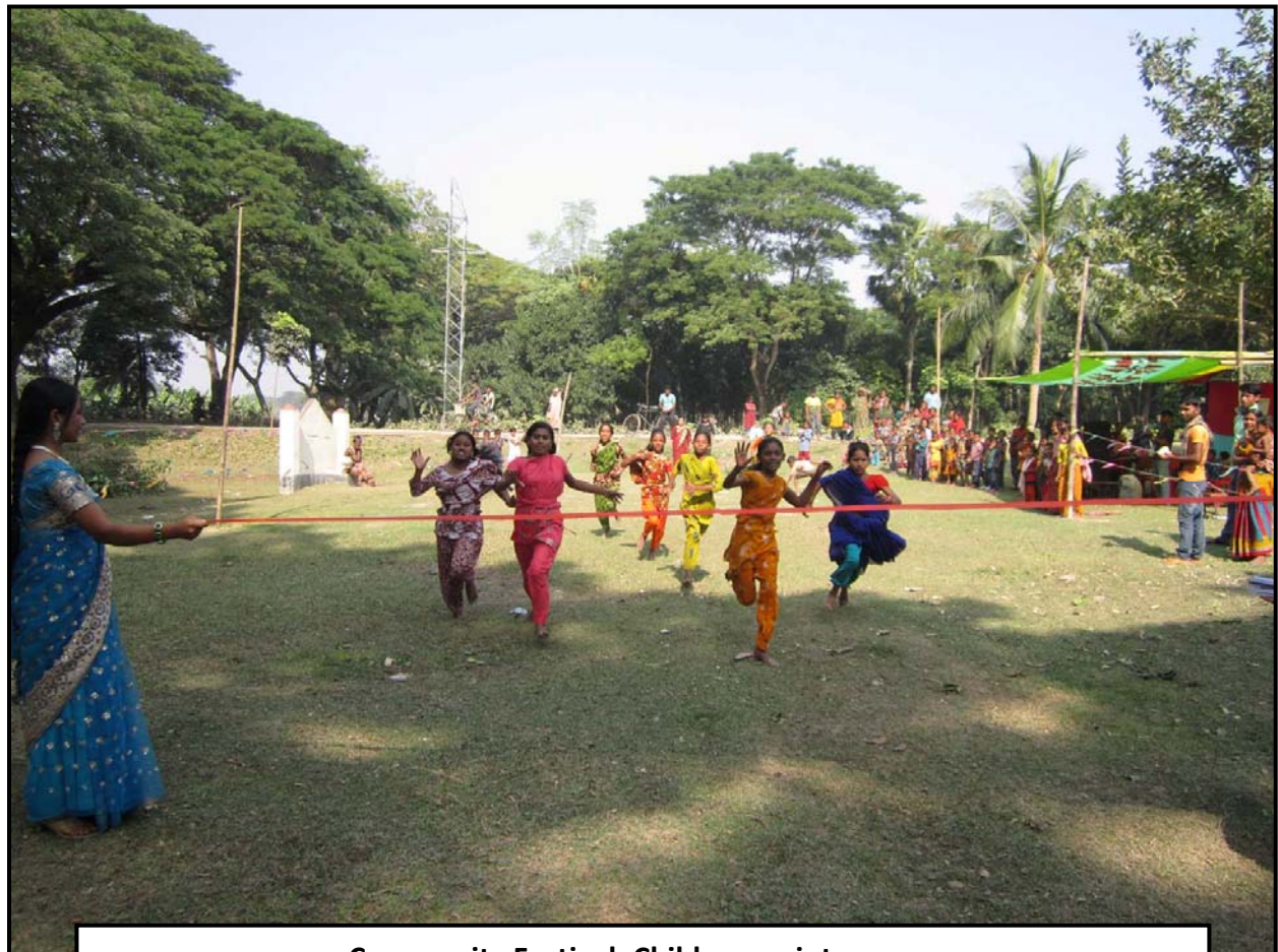
Community Festival: Children sprint game...