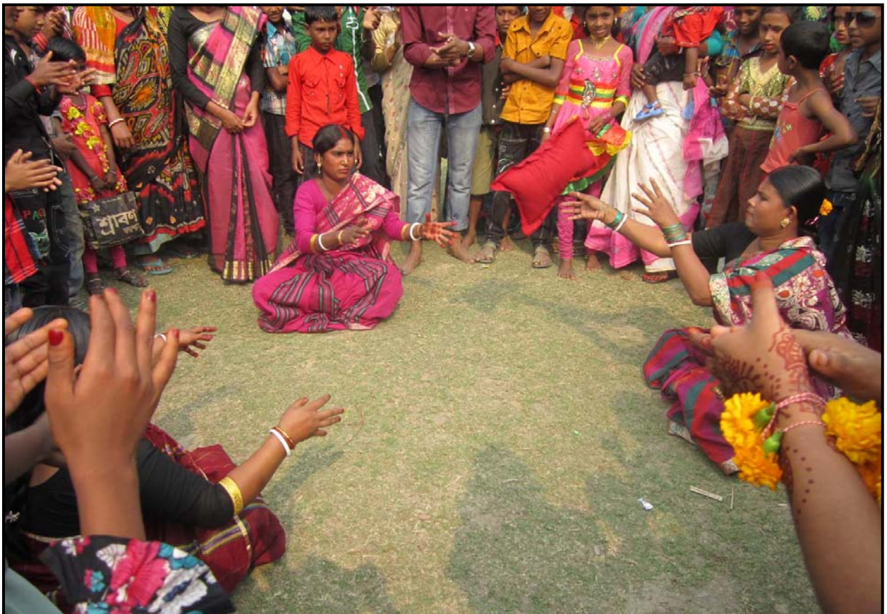
Community Festival: Parents game...