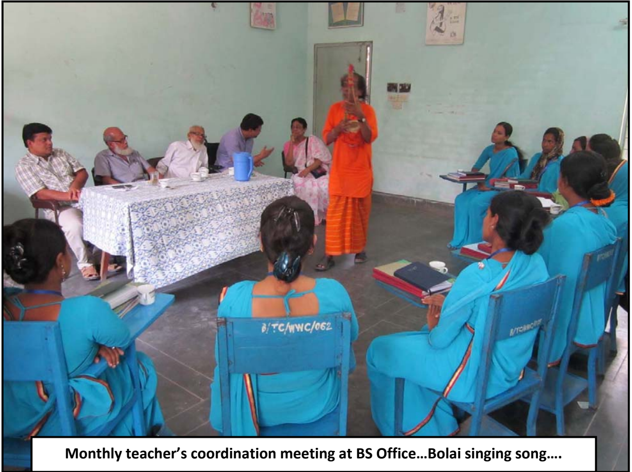
Monthly teacher's coordination meeting at BS Office...Bolai singing song....