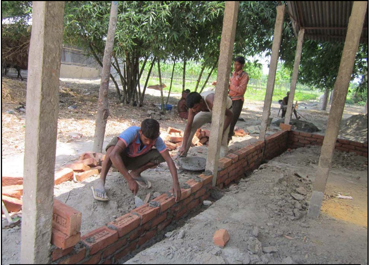
Pre-school Construction: going on...