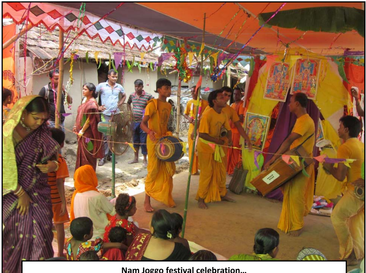
Nam Joggo festival celebration...