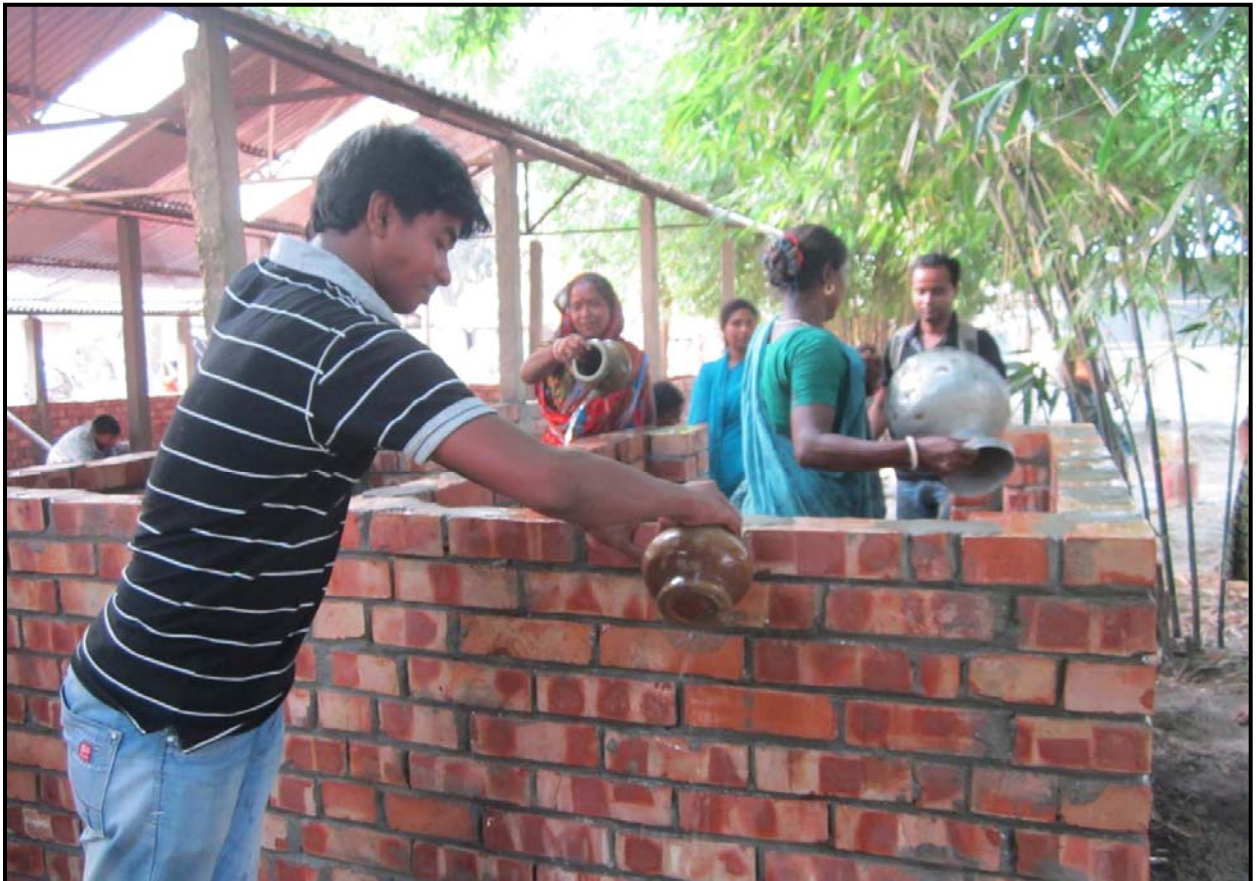
All community member and staffs provide physical labour in construction...