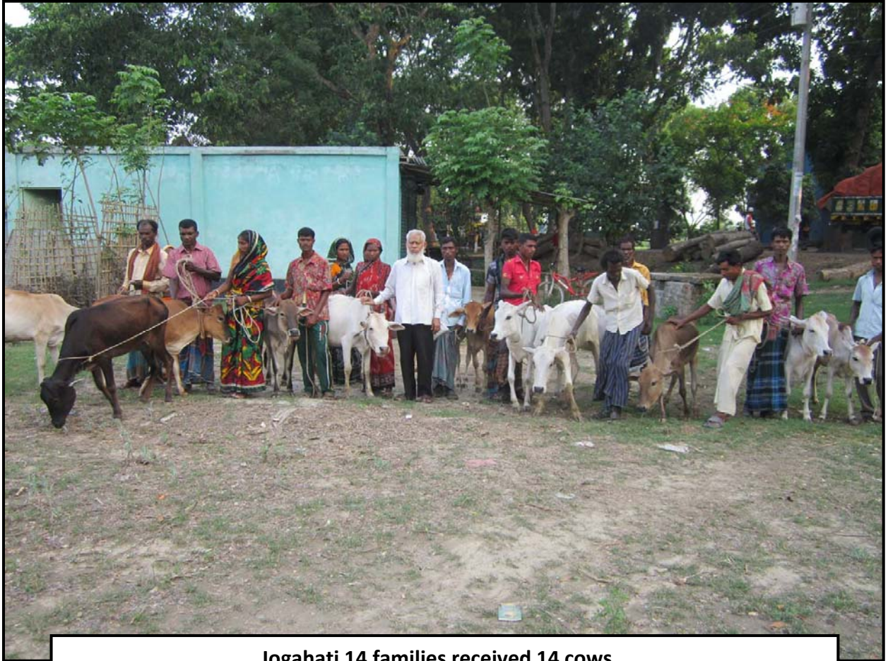
Jogahati 14 families received 14 cows...