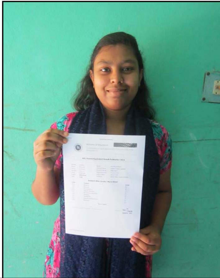
Alryma (BS0023) achieve GPA 5 in SSC exam...