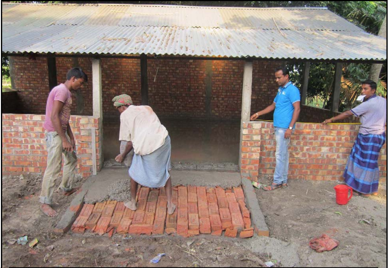
Pre-school Construction: going on...