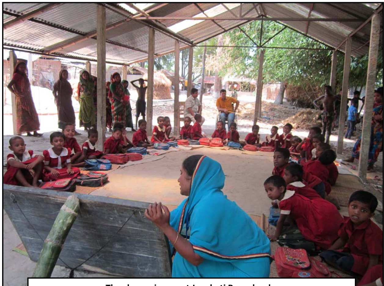
The class going on at Jogahati Pre-school...