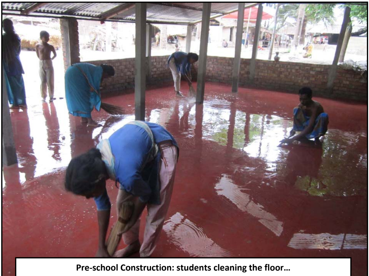
Pre-school Construction: students cleaning the floor...