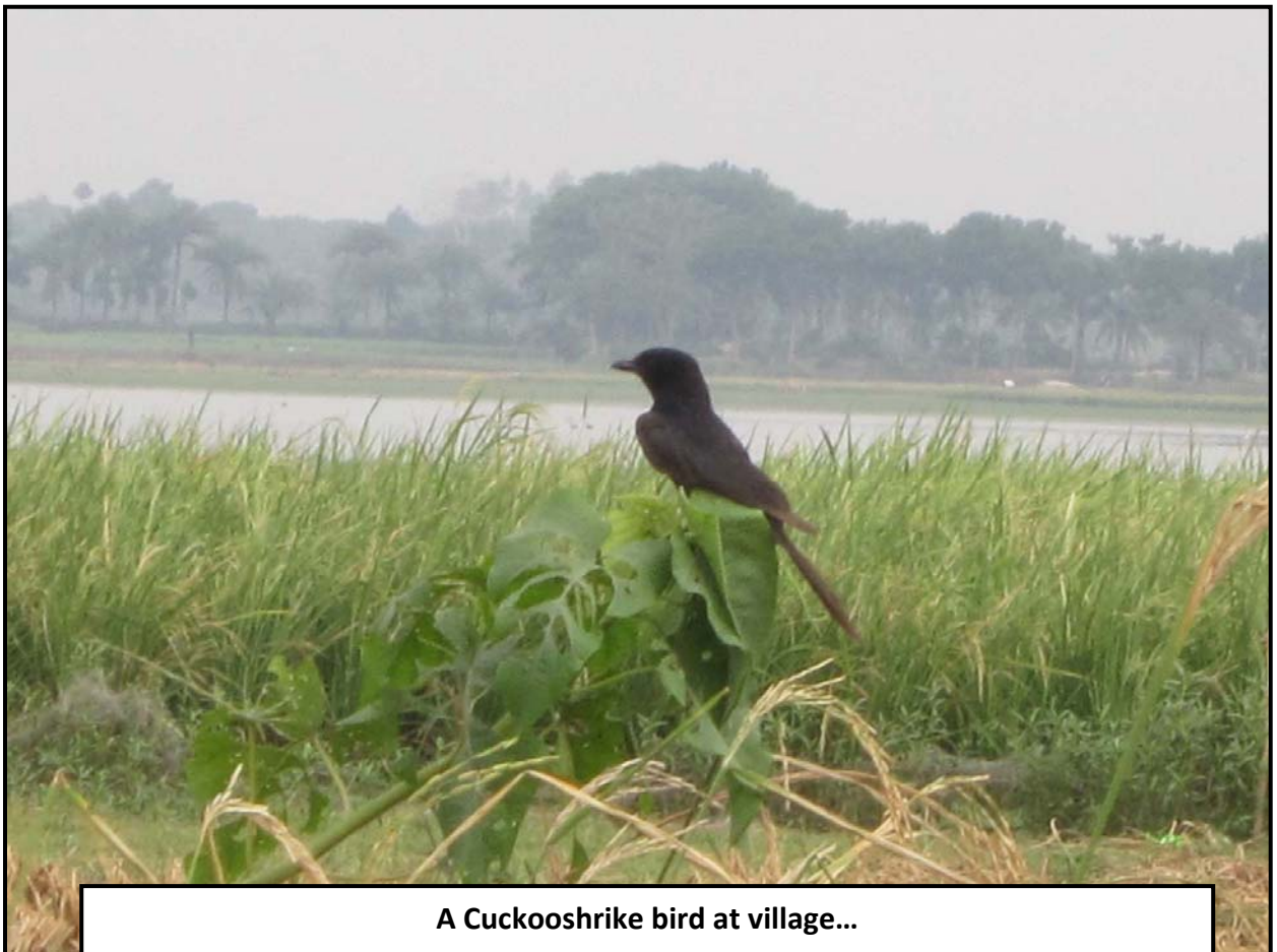
A Cuckooshrike bird at village...