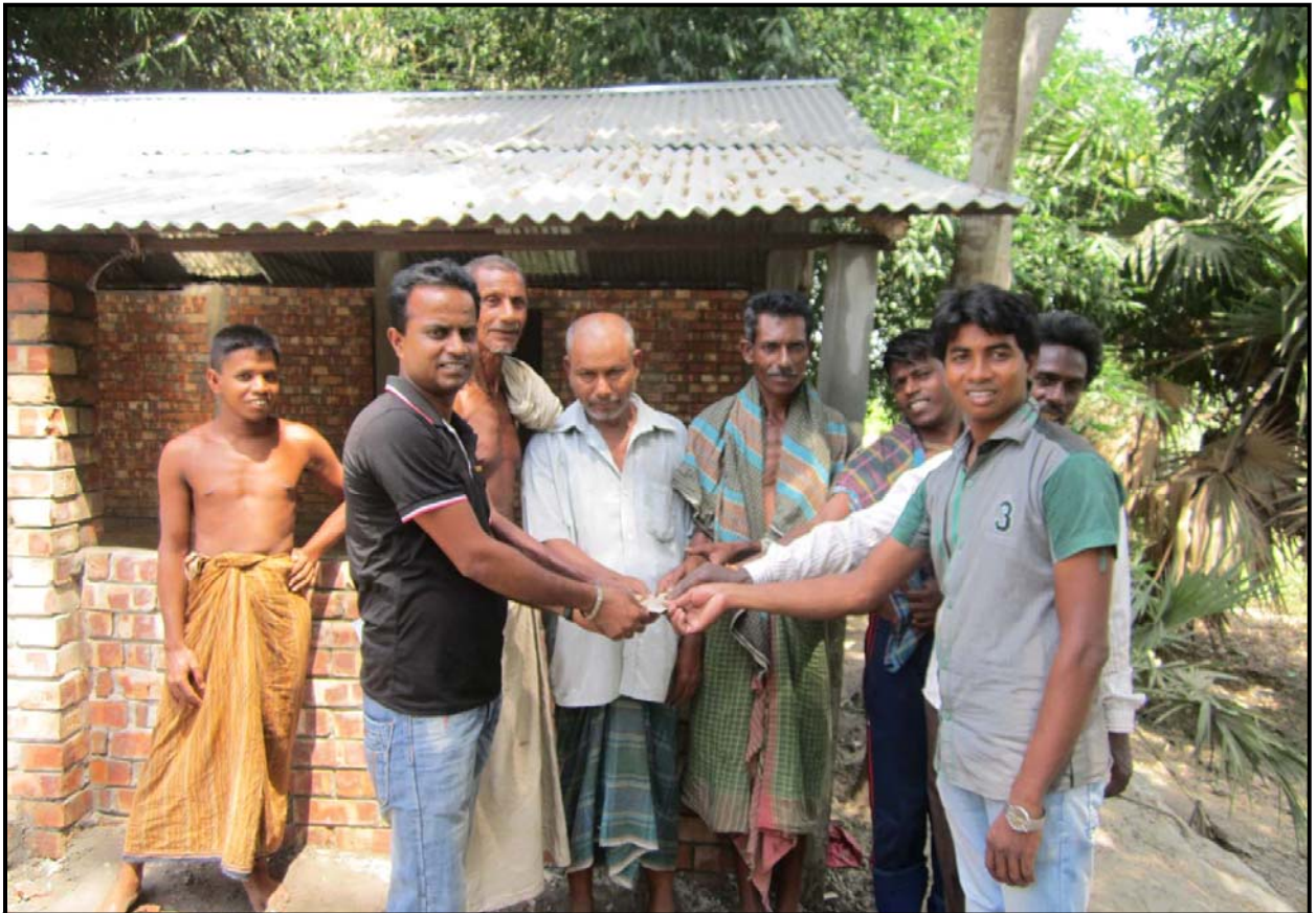
BS officials giving financial contribution for Nam Joggo festival...