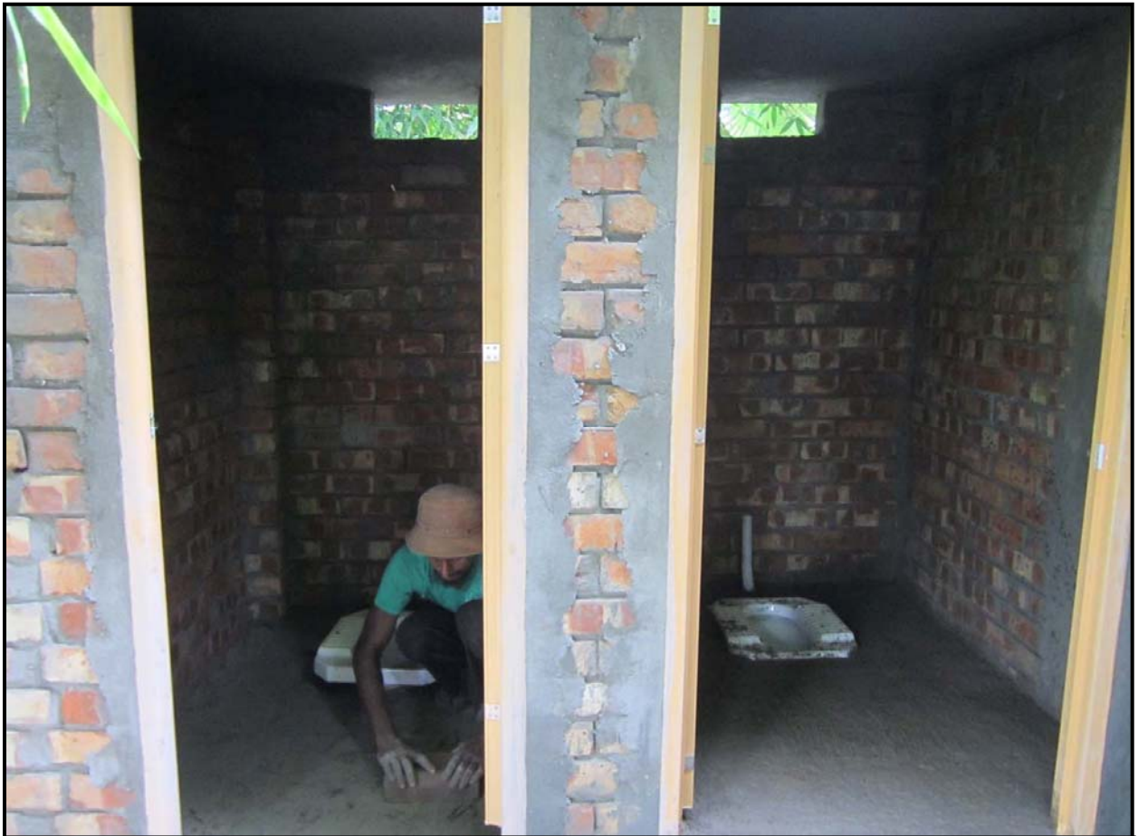
Pre-school Construction: toilet preparation...