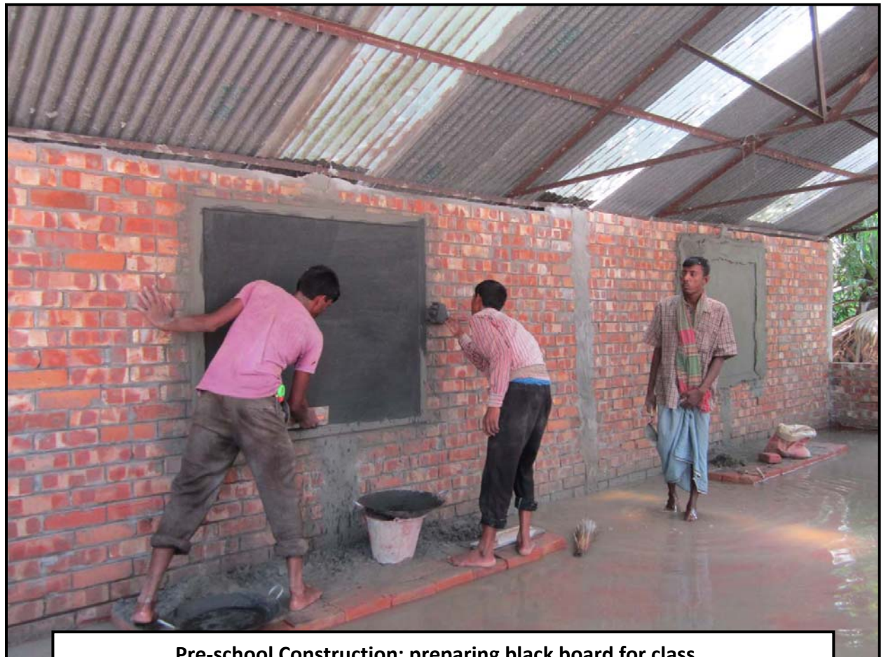
Pre-school Construction: preparing black board for class...