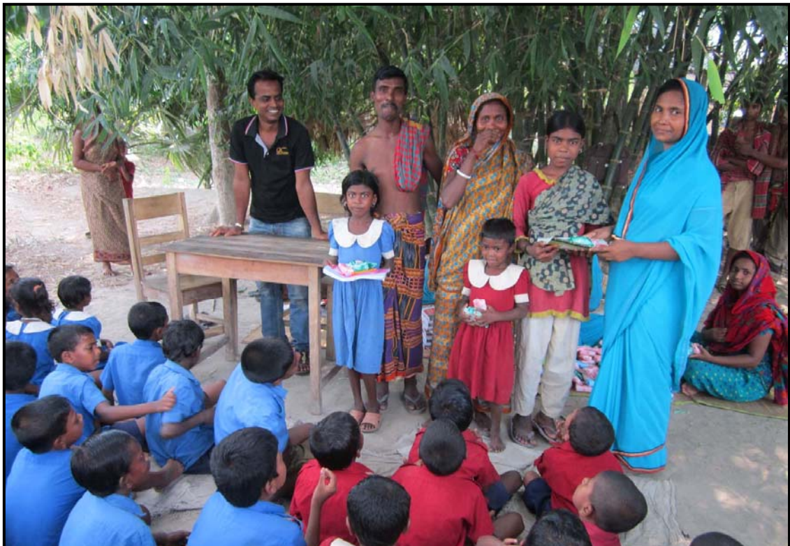
Materials distribution at Jogahati...