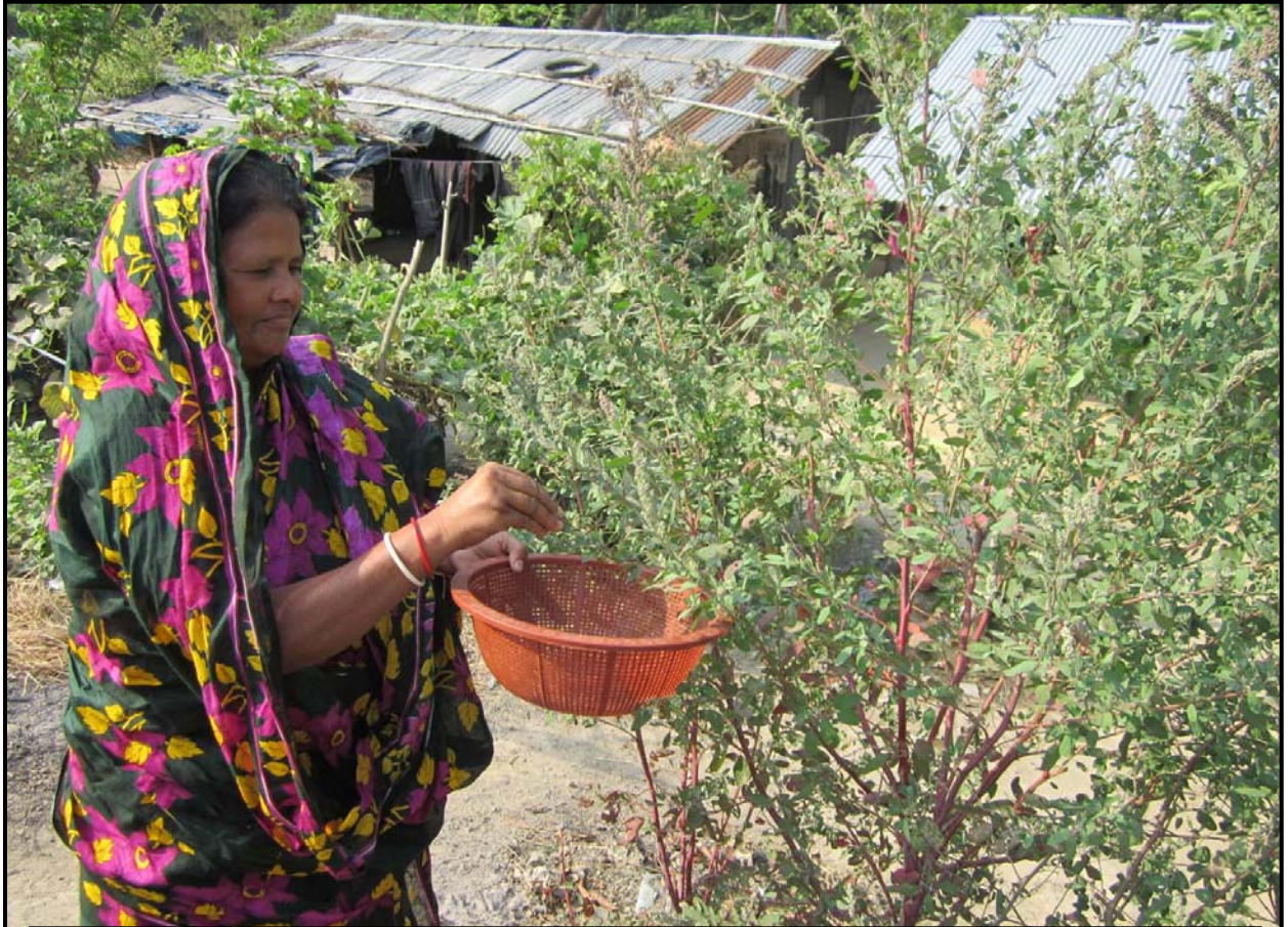
Anonto's (BS0089) family collecting vegetable from kitchen garden...