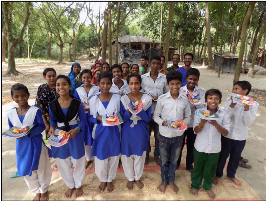
Sorupdaho happy students with materials...