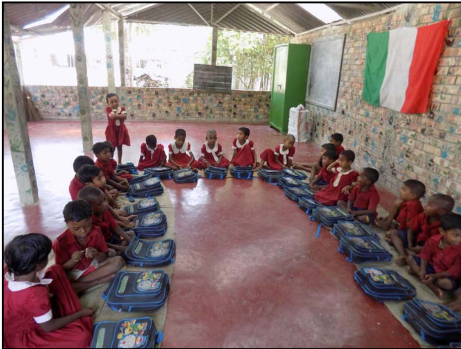
Pre-school class going on....