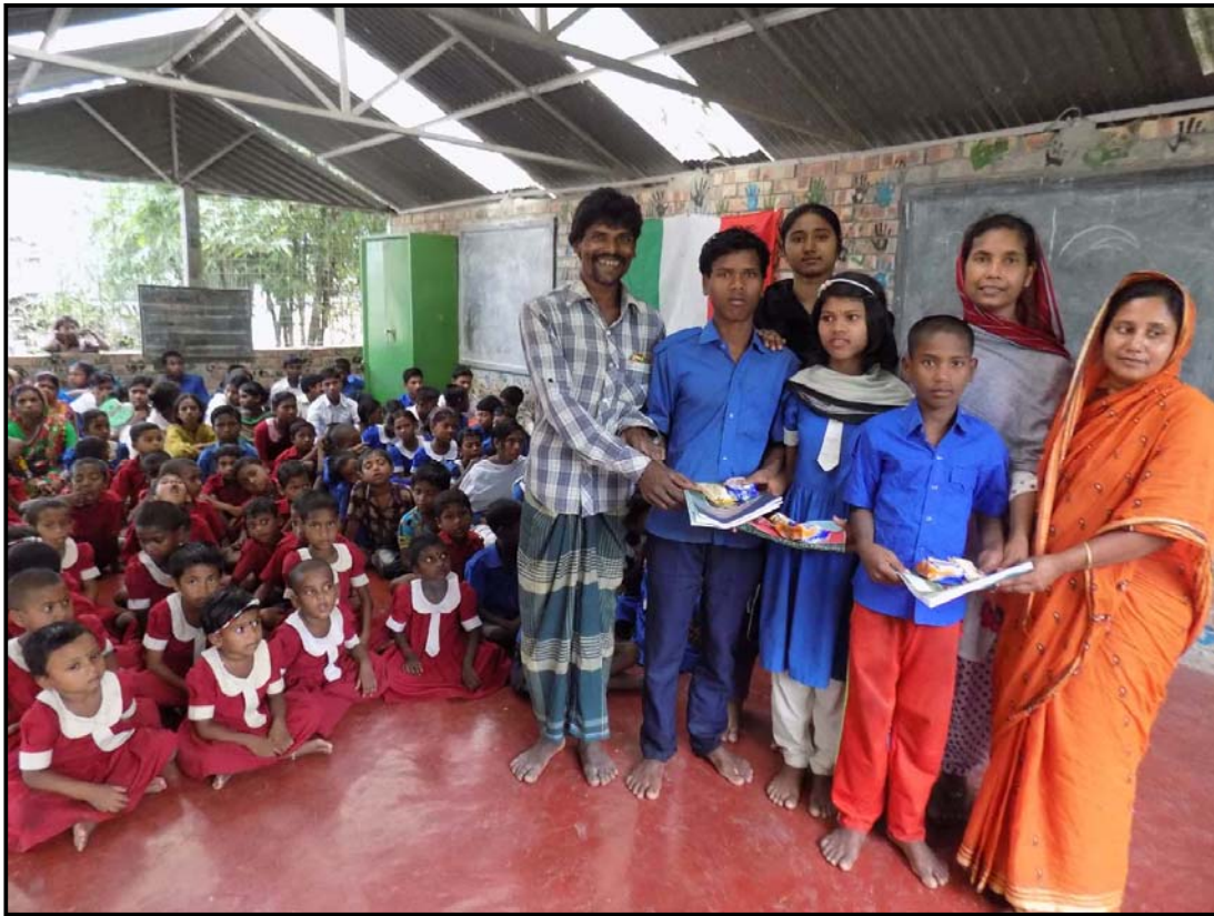
Monthly materials distribution in Jogahati...