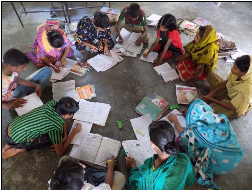
Tuition class at Mohishati community...