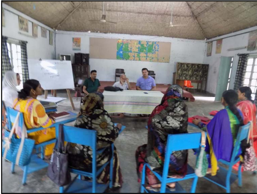
Teacher's coordination meeting...