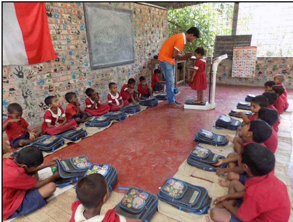
Monthly weight measurement...