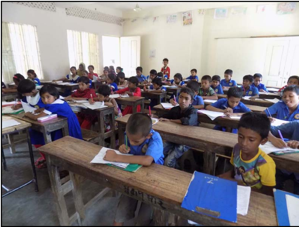
Students attentively giving class exam in govt. school...