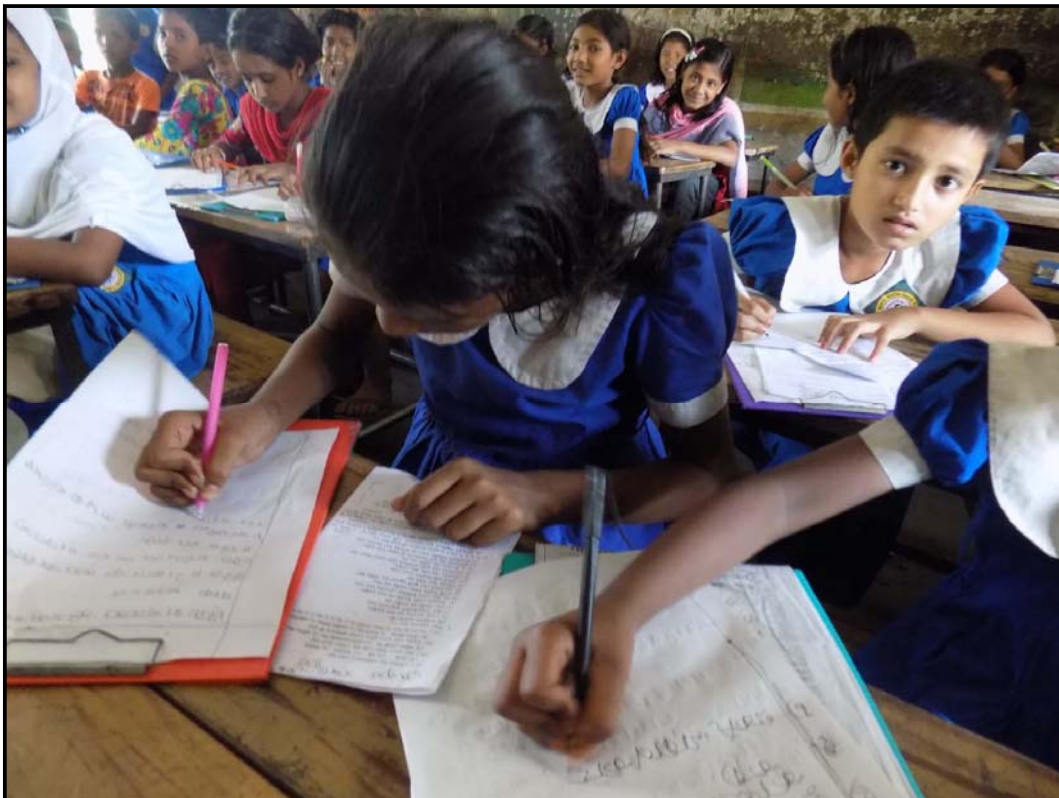
Our children very serious to achieve good result...