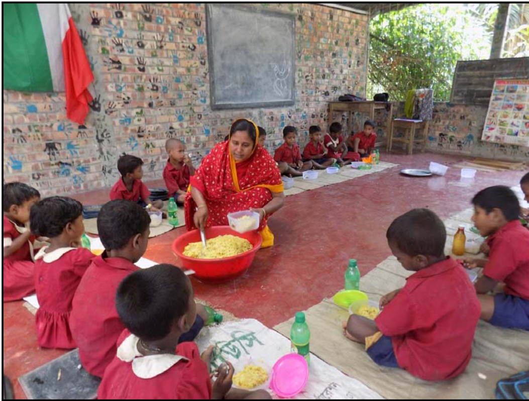
Pre-school students receiving Khitchury meal after class...