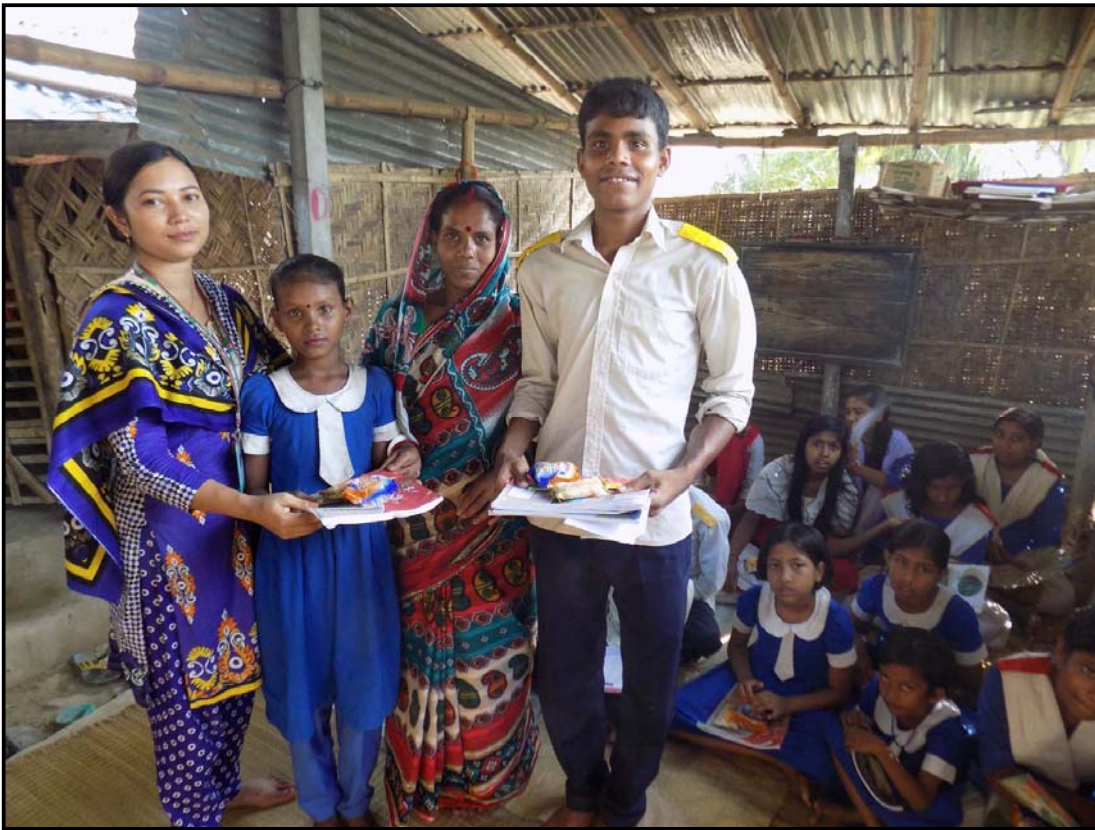
Materials distribution in Churamankati...