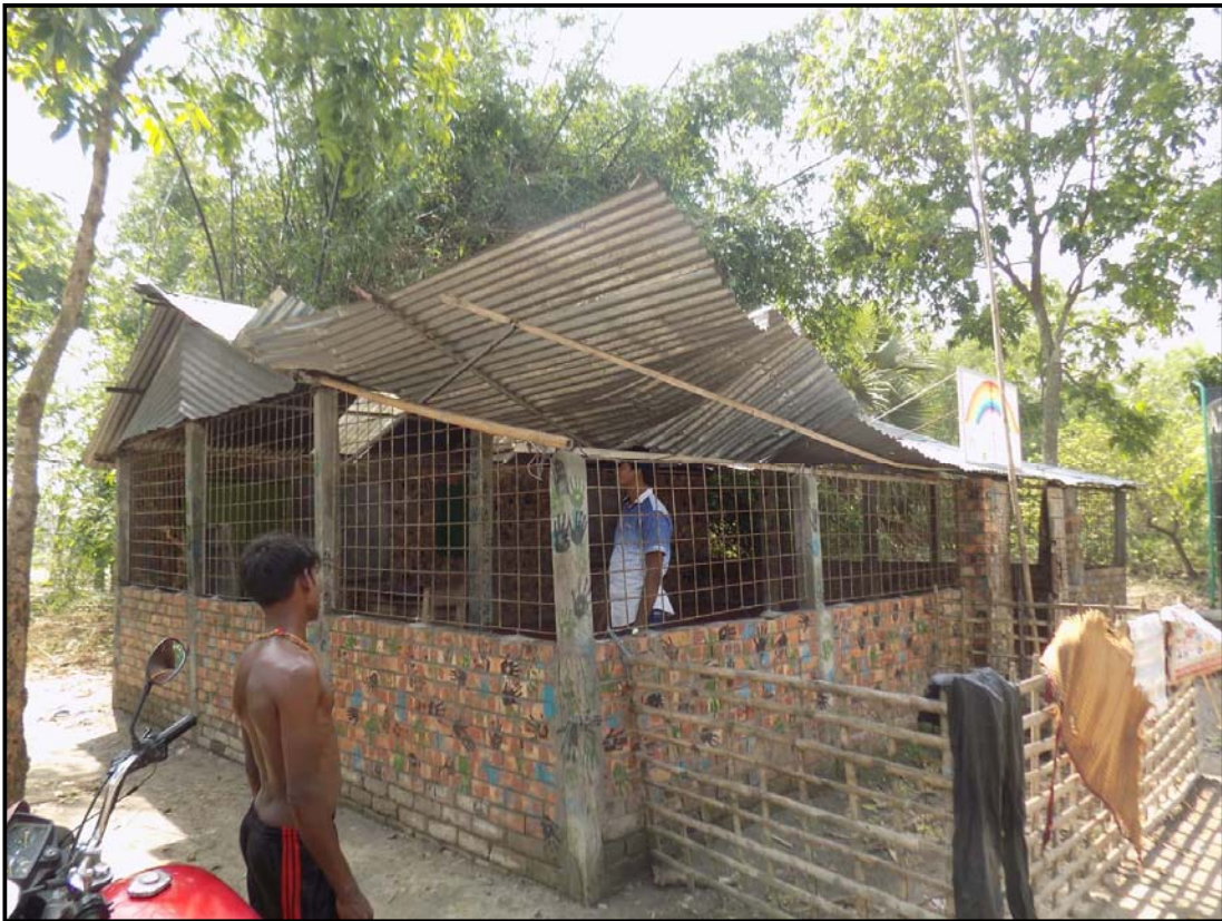
Recent tornado damage pre-school roof...