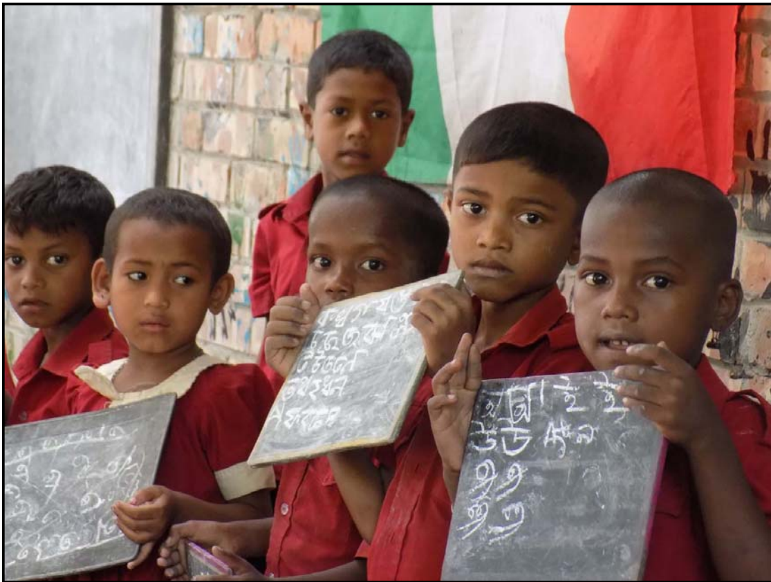
Pre-school kids showing their learnings on Bangla alphabet writing...