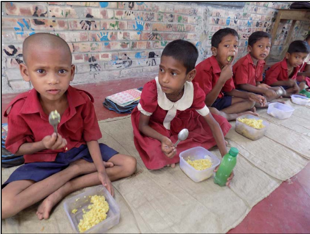
Kids love the Khitchury...