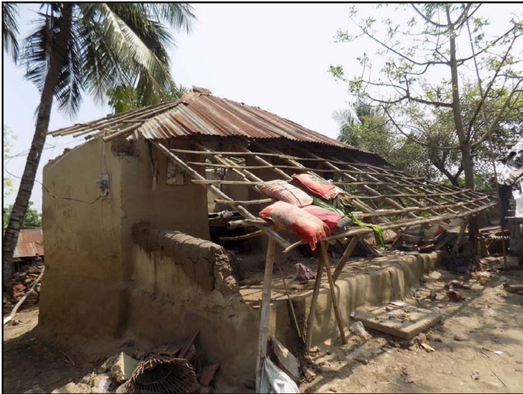
Some houses also damaged by the tornado...