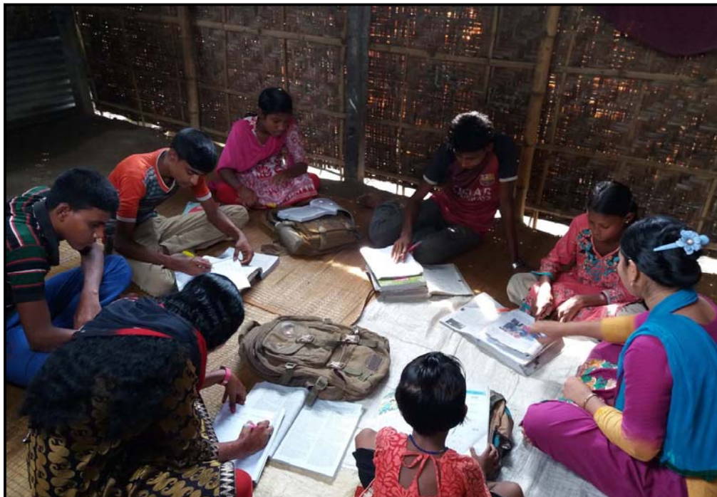
Tuition class going on in Churamankati Community...