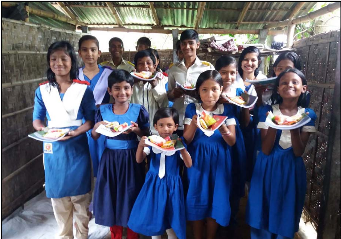
Happy kids with materials at Churamankati village...