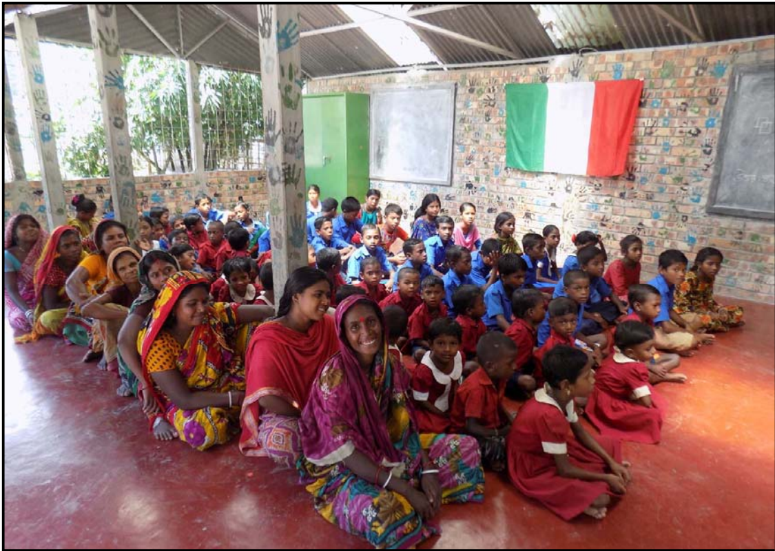
Parents meeting at Jogahati...