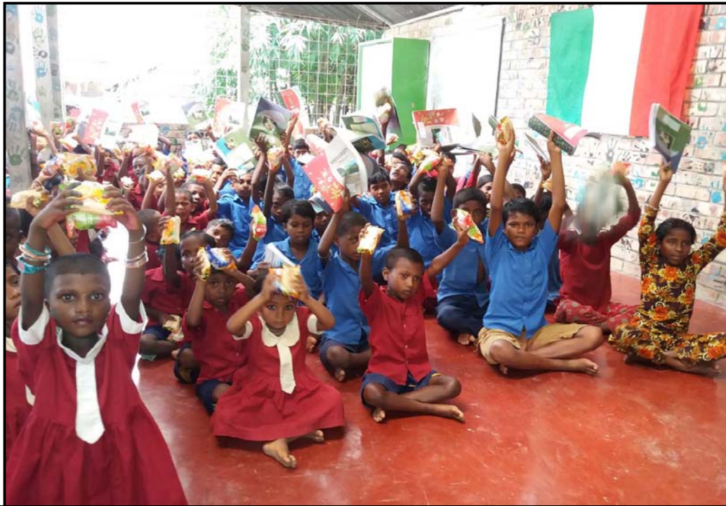
Jogahati kids happy to receive the materials....