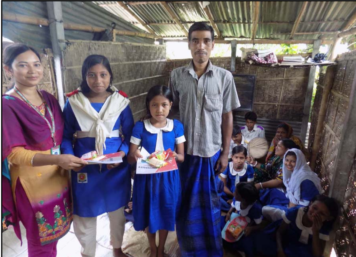
Materials distribution at Churamankati...