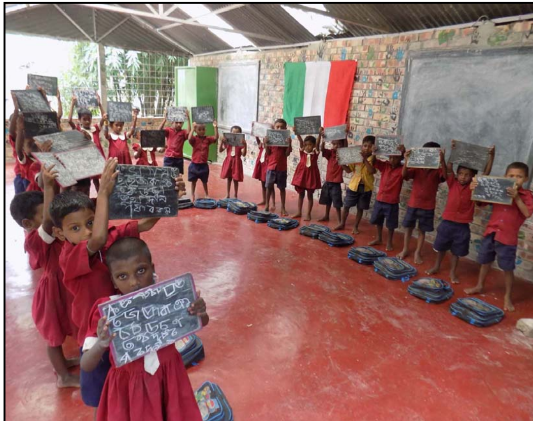
Jogahati Pre-school kids showing their learnings...