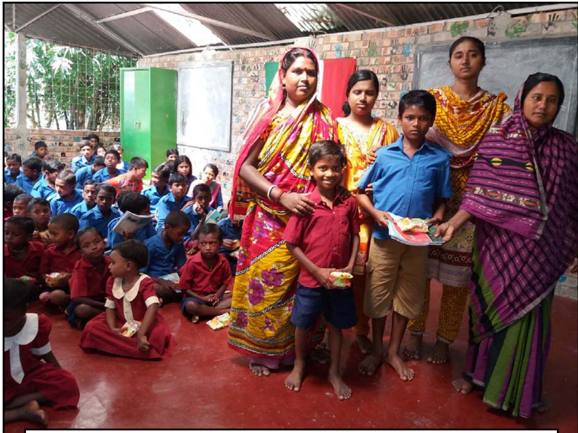
Education materials distribution at Jogahati Village...