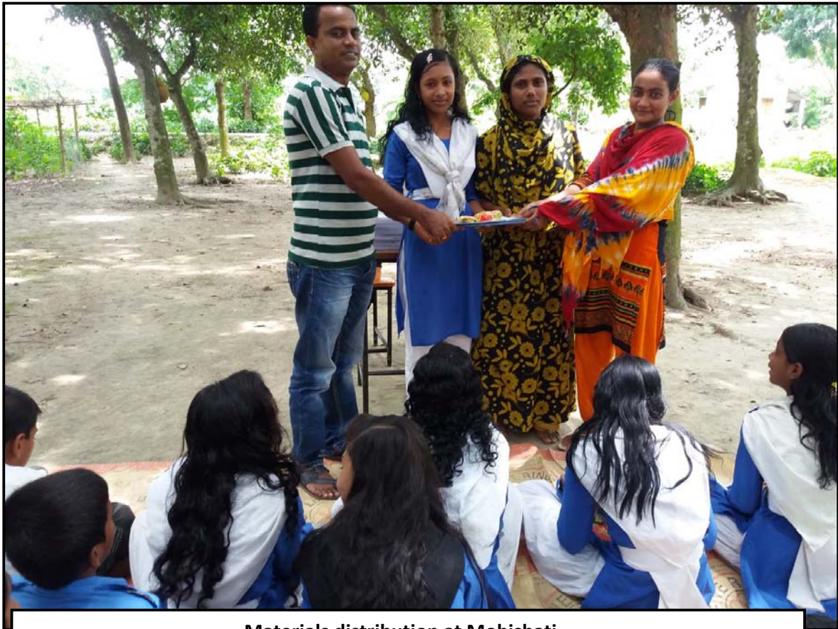
Materials distribution at Mohishati...