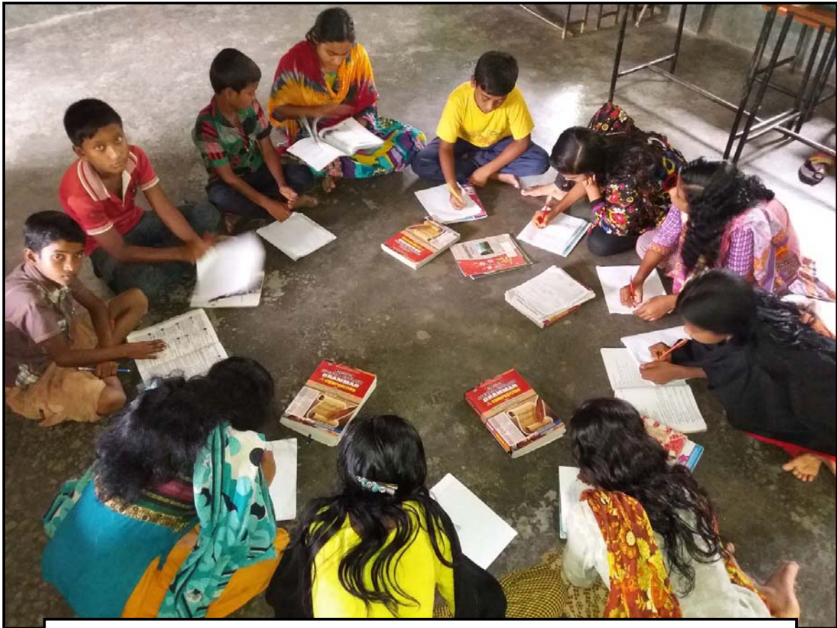
Tuition class going on in Mohishati Community...