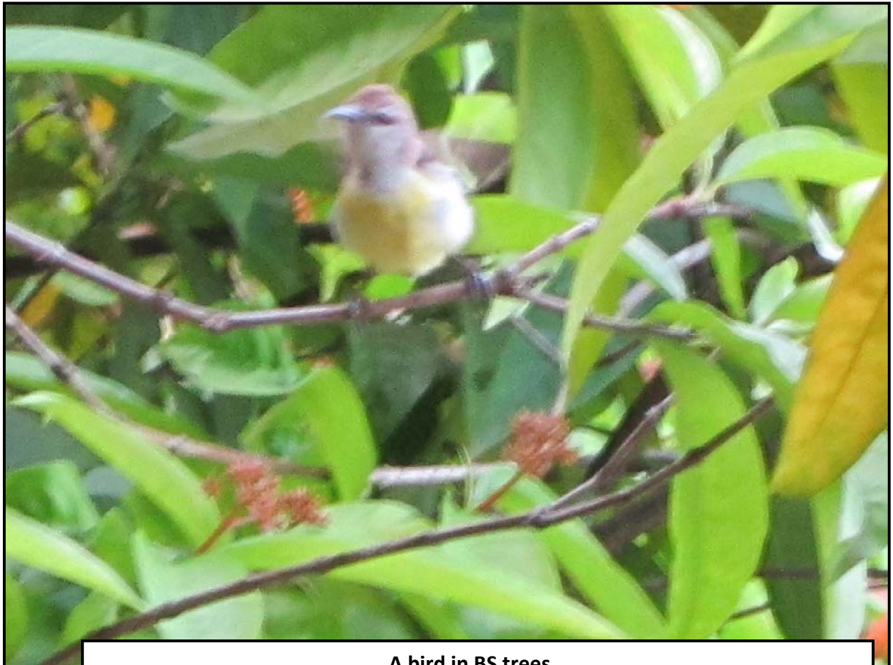
A bird in BS trees...