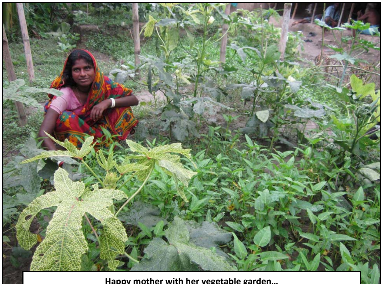
Happy mother with her vegetable garden...