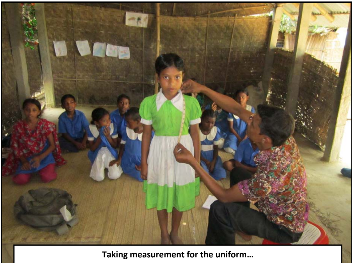
Taking measurement for the uniform...