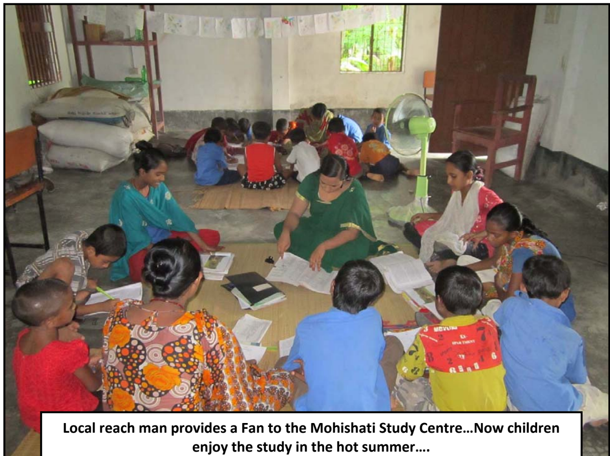
Local reach man provides a Fan to the Mohishati Study Centre...Now children enjoy the study in the hot summer....