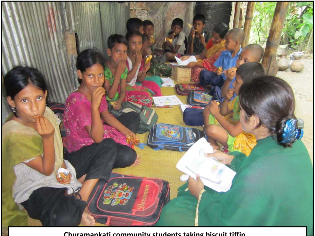
Churamankati community students taking biscuit tiffin...