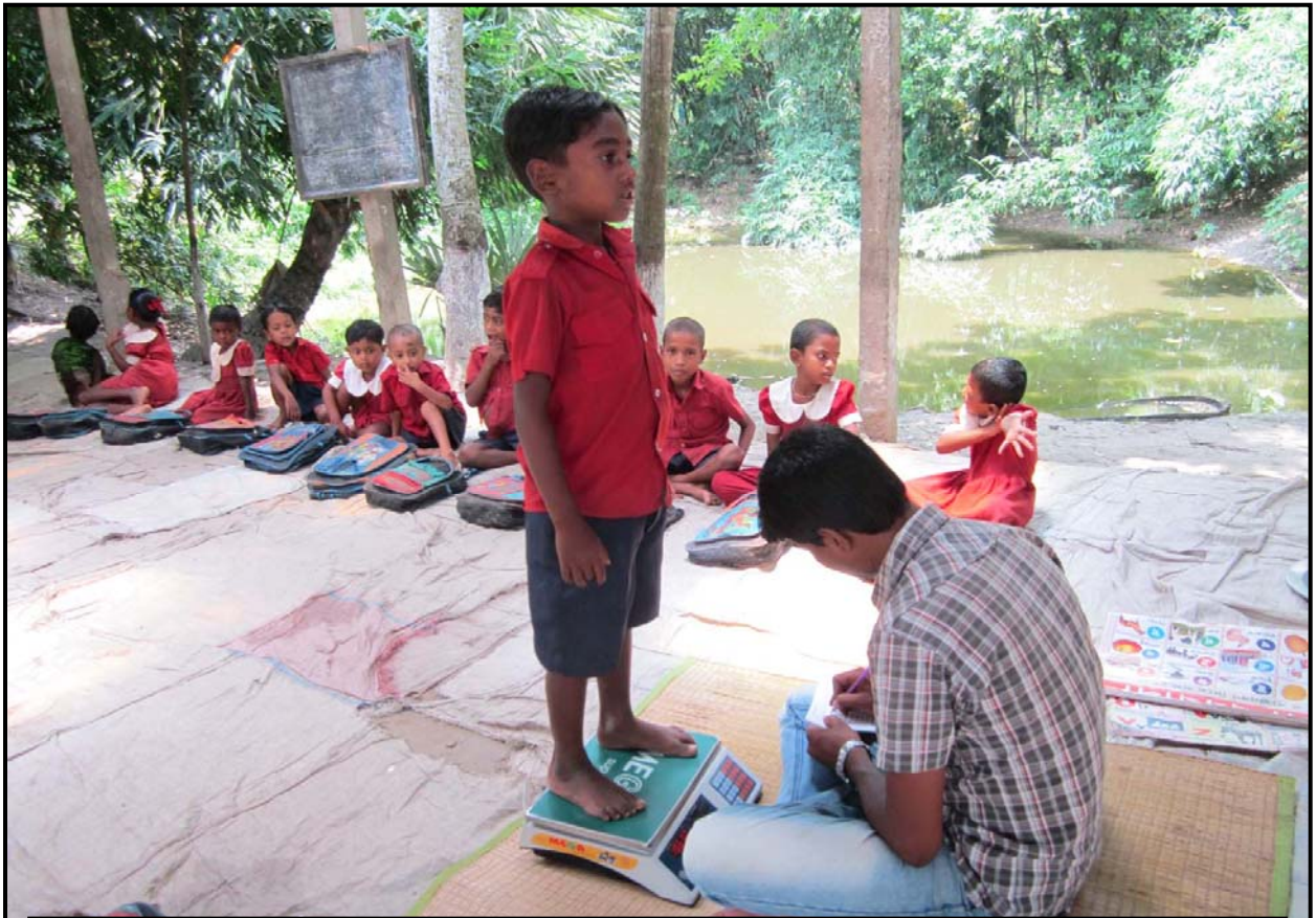
Pre-school monthly weight check-up programme...