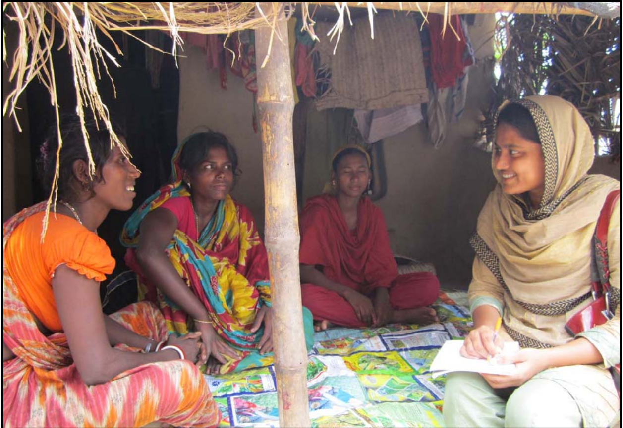
Khulna University, Sociology Department Students visiting Jogahati Community...and taking experience to discuss about life development...