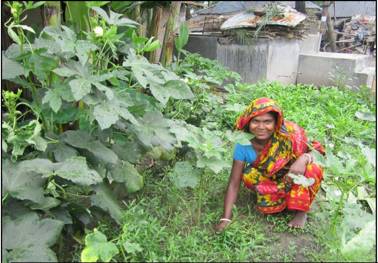
Happy mother with her vegetable garden...