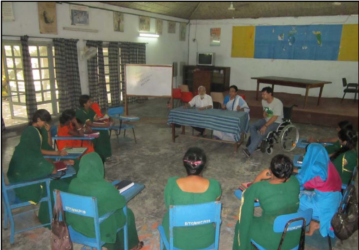
Monthly Teachers Coordination Meeting...