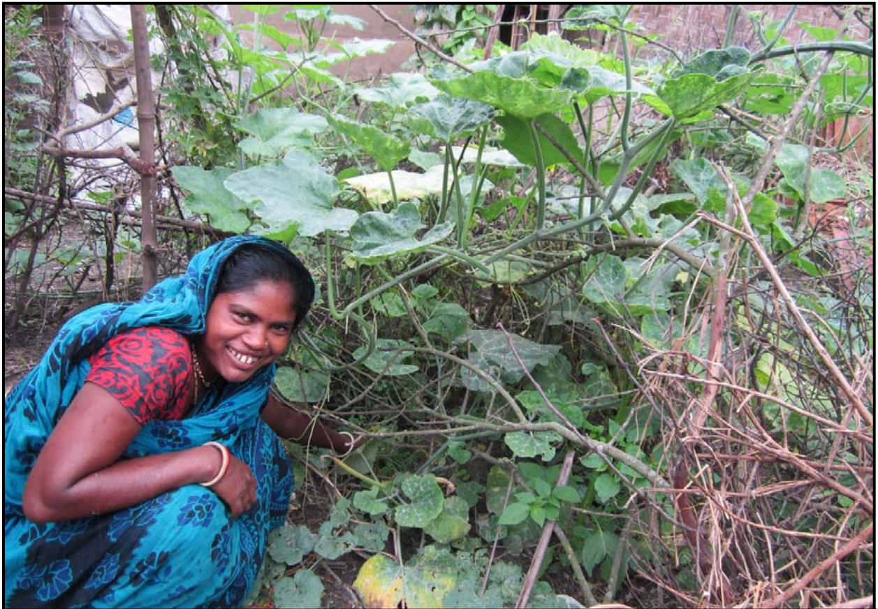
Jogahati happy mother with her vegetable garden...