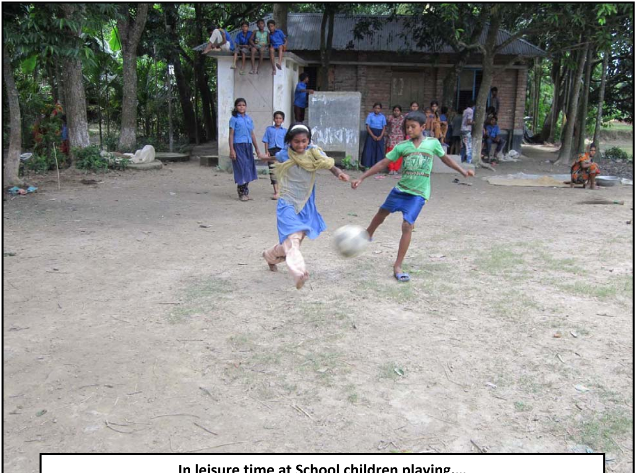
In leisure time at School children playing....