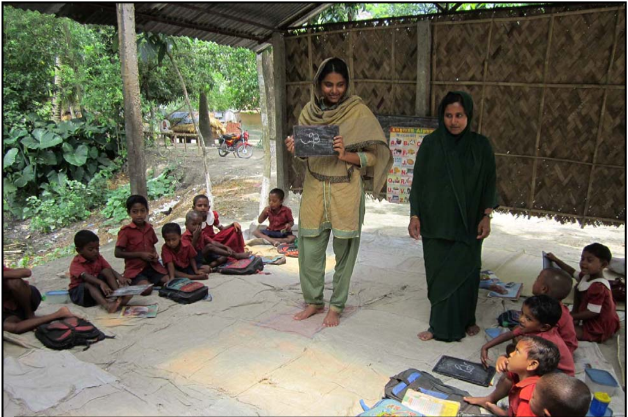
Khulna University, Sociology Department Students visiting Jogahati Community...and taking experience in Development of our children...