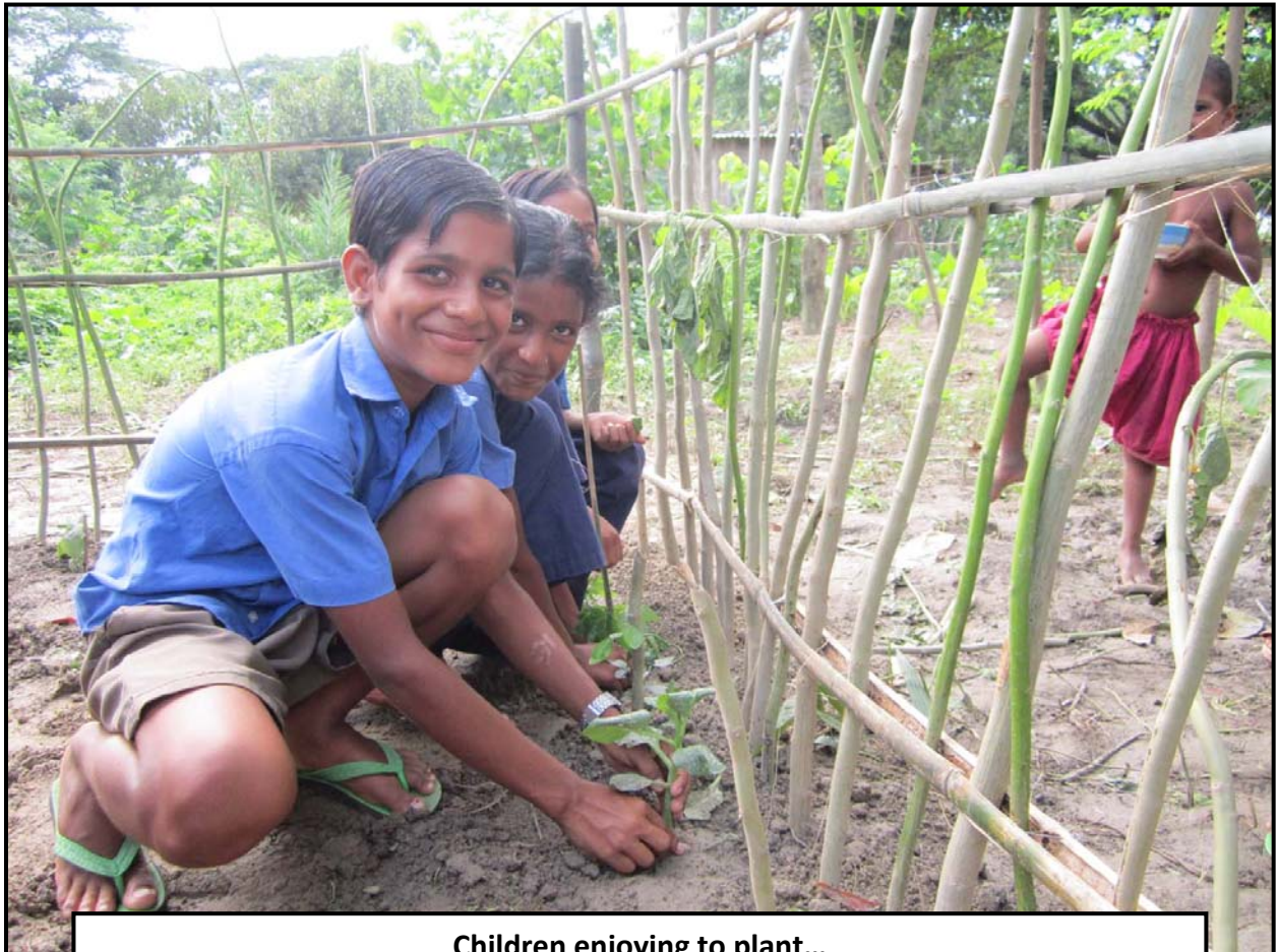
Children enjoying to plant...