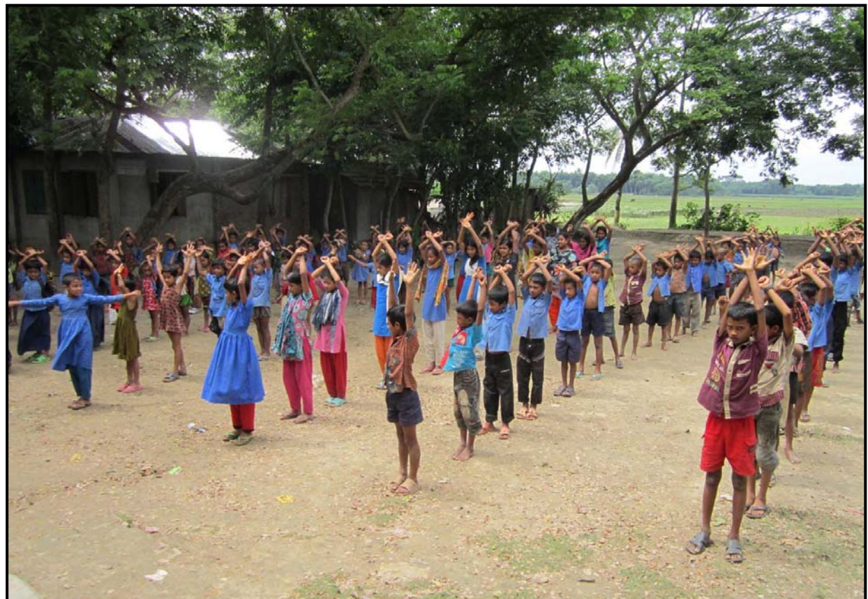
Jogahati Govt. School Morning Exercise...