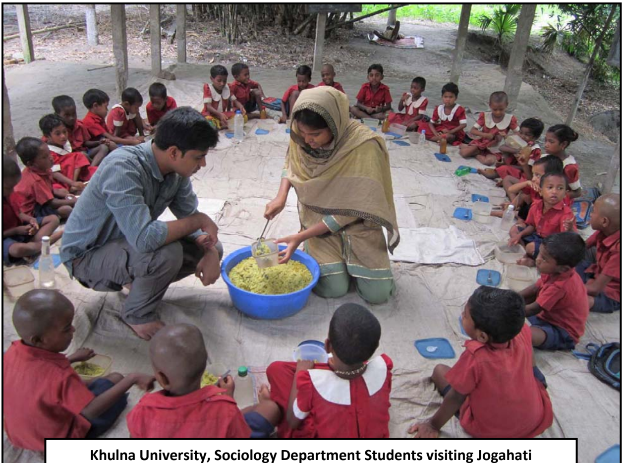
Khulna University, Sociology Department Students visiting Jogahati Community...and distributing warm food to kids...