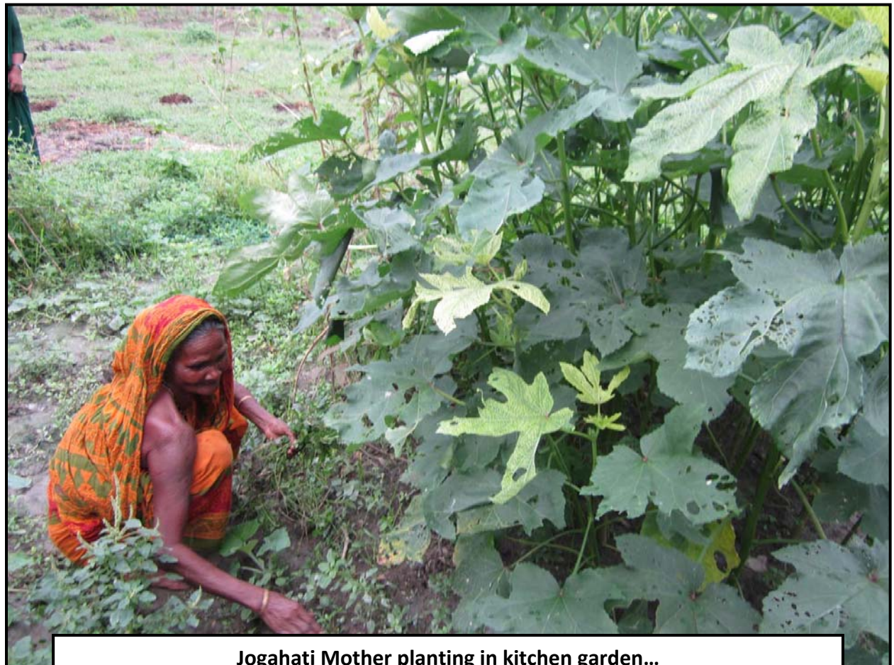
Jogahati Mother planting in kitchen garden...