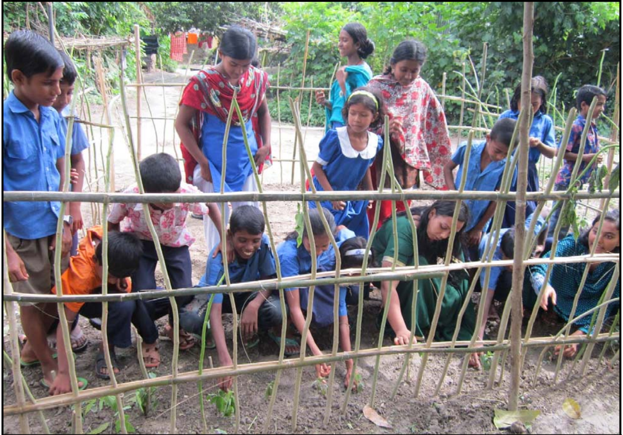
Mohishati students vegetable and flower garden project...