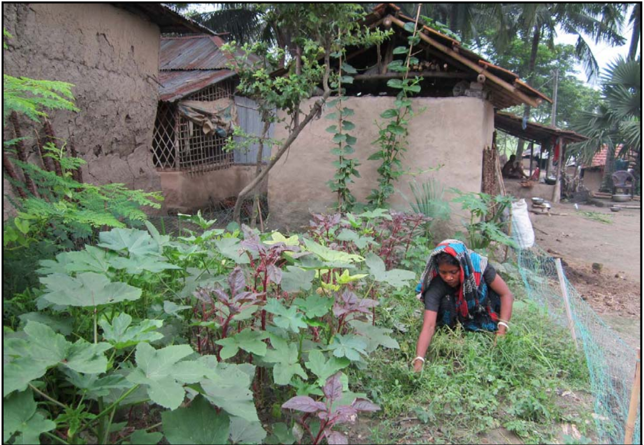
Jogahati Mother planting in kitchen garden...