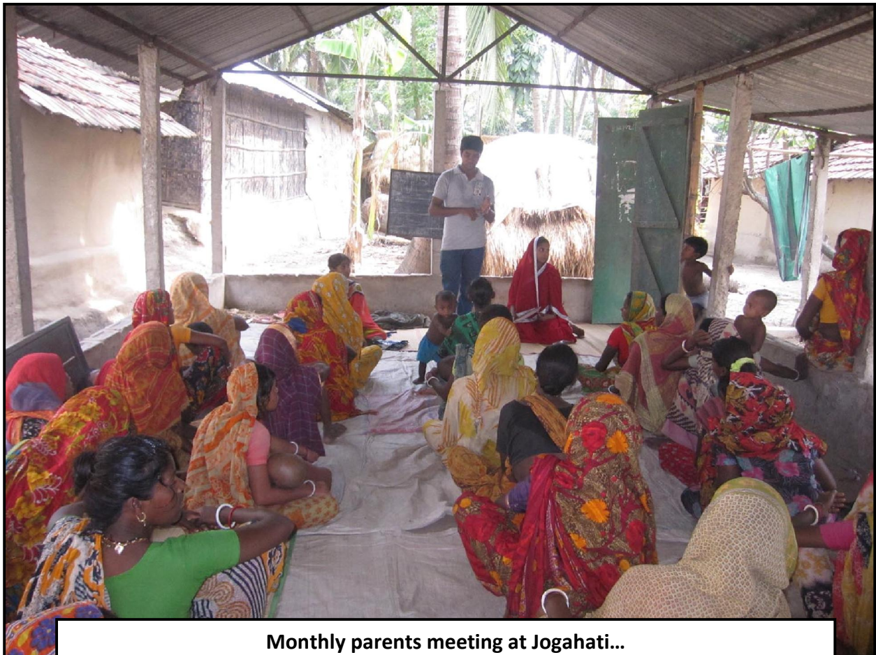
Monthly parents meeting at Jogahati...