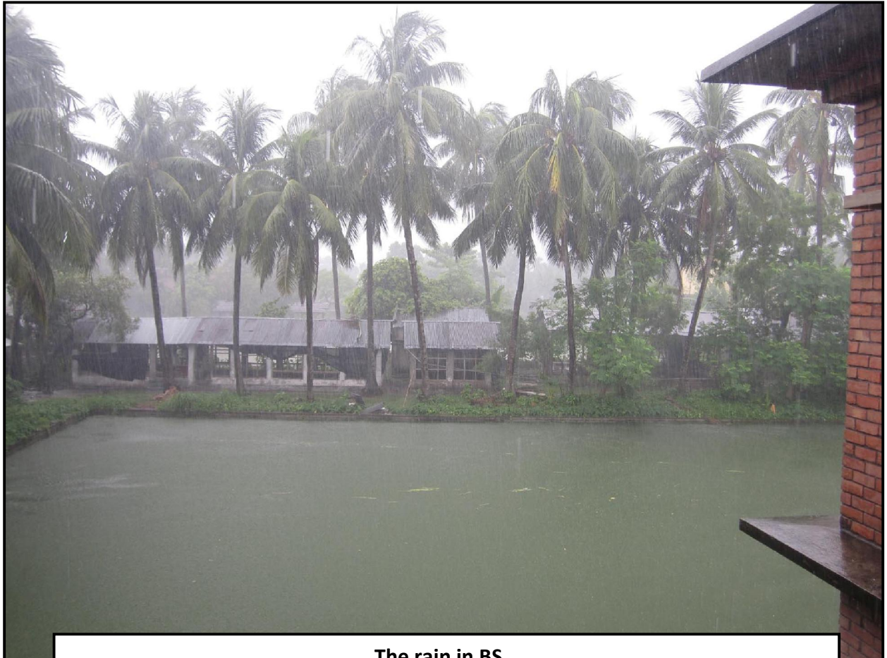
The rain in BS...