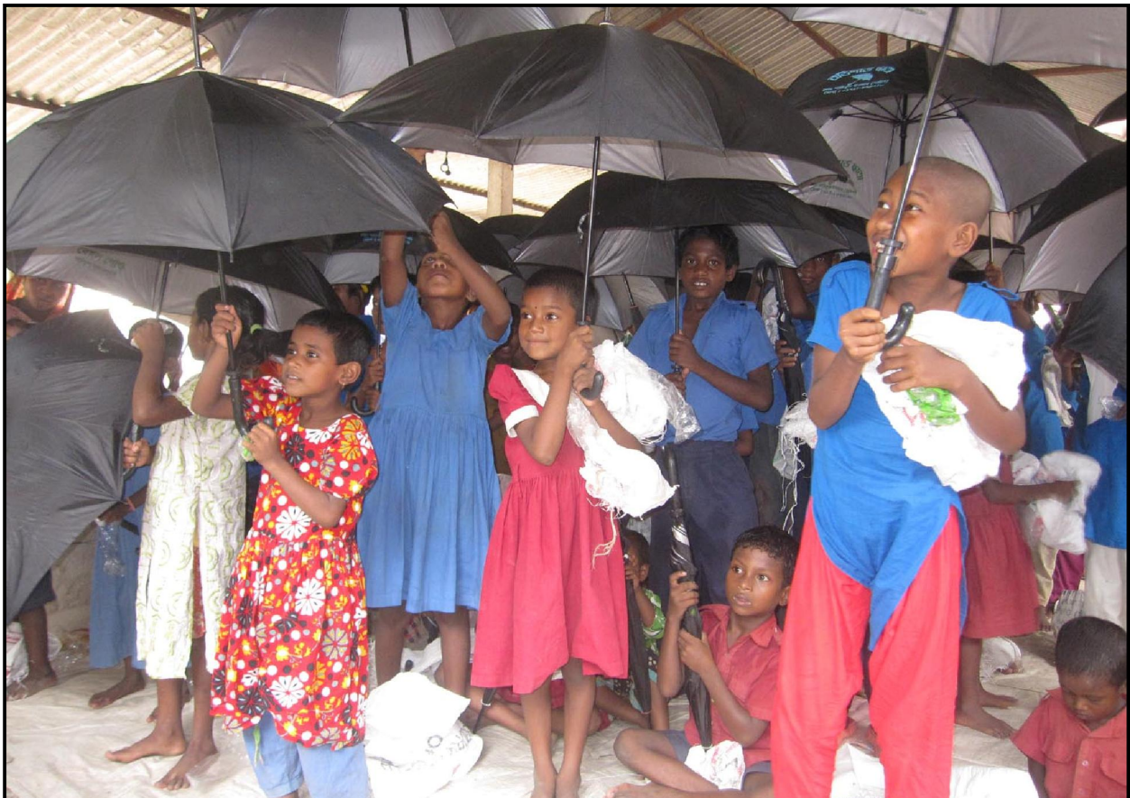
Now the monsoon season and Jogahati students receive the umbrella...