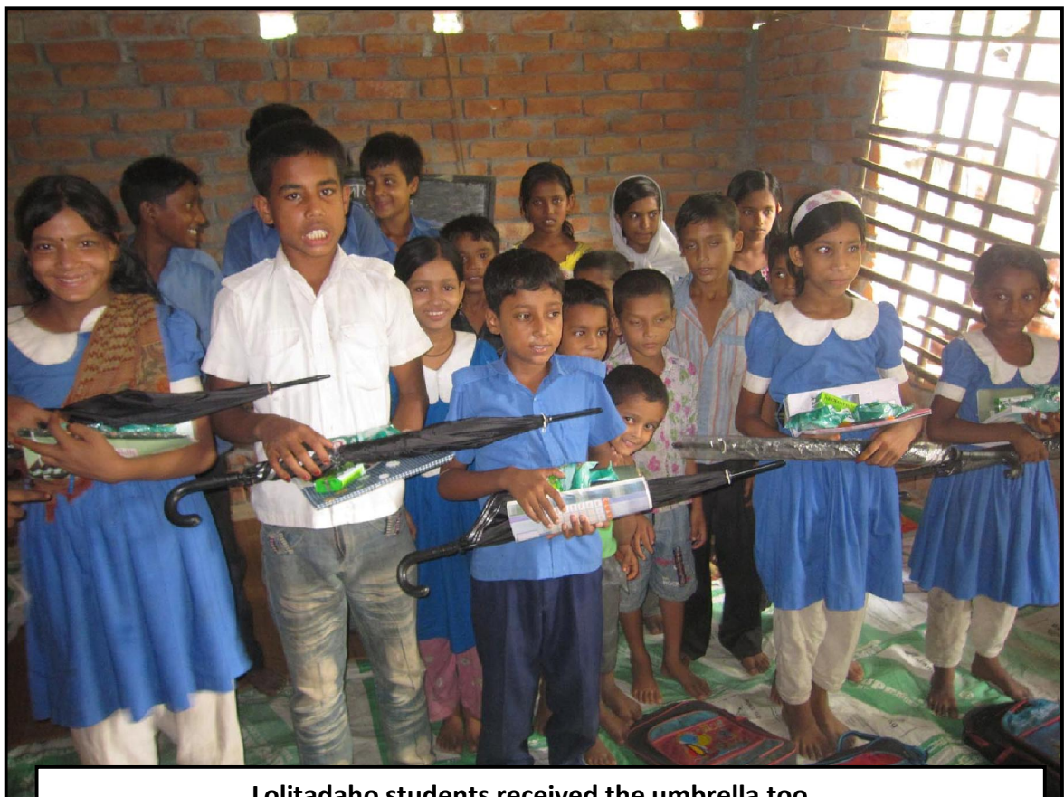
Lolitadaho students received the umbrella too...