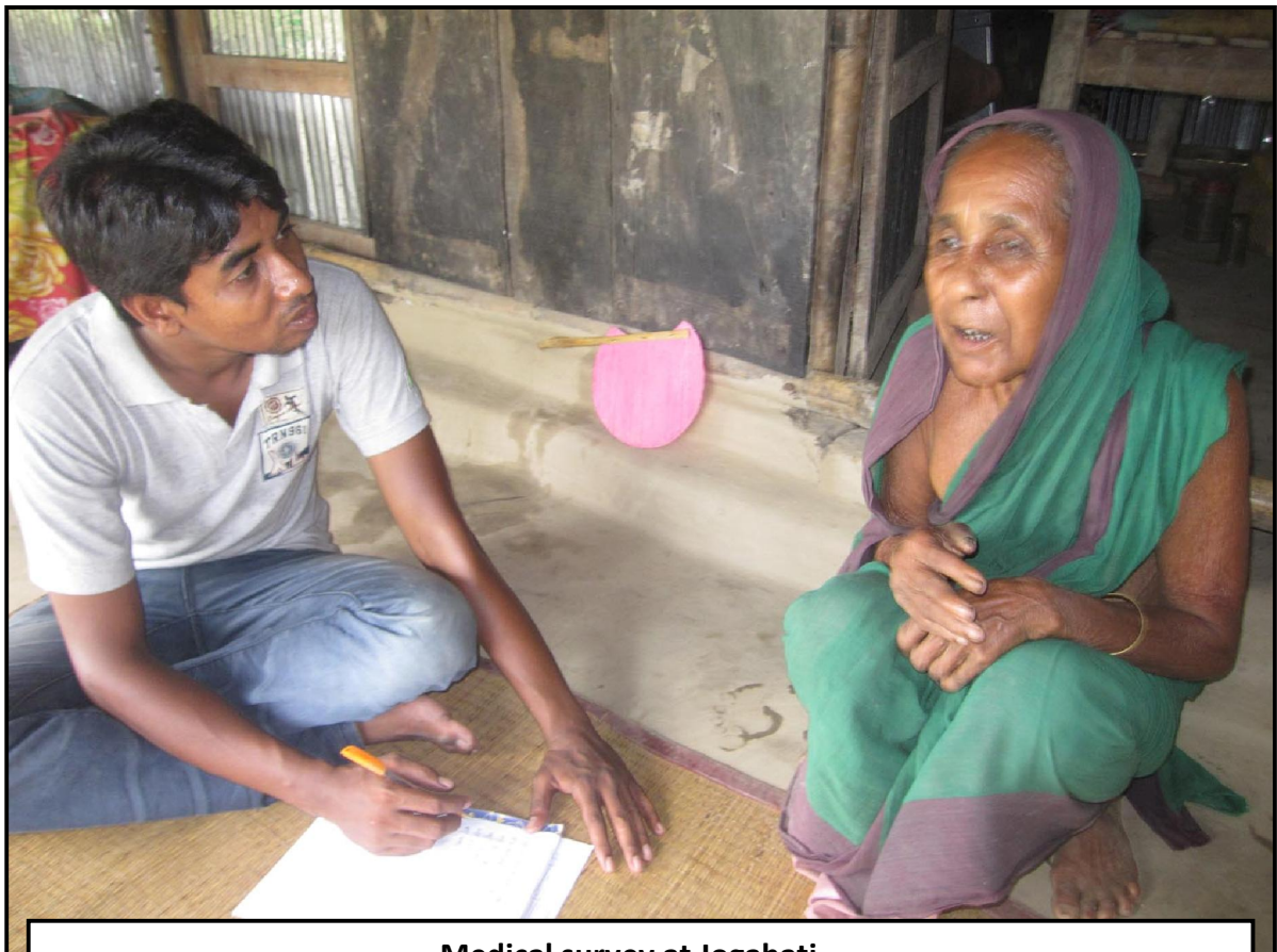
Medical survey at Jogahati...