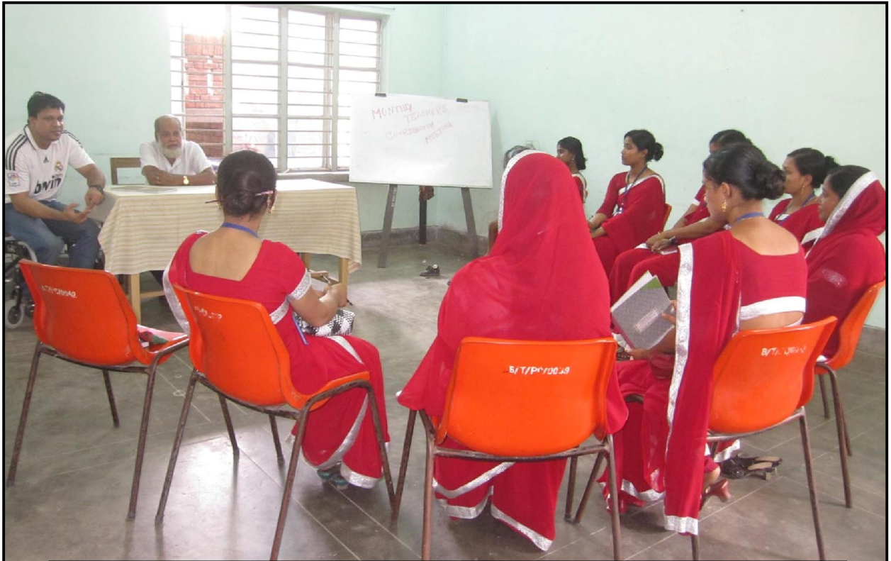
Tuition Teachers Monthly Coordination Meeting...