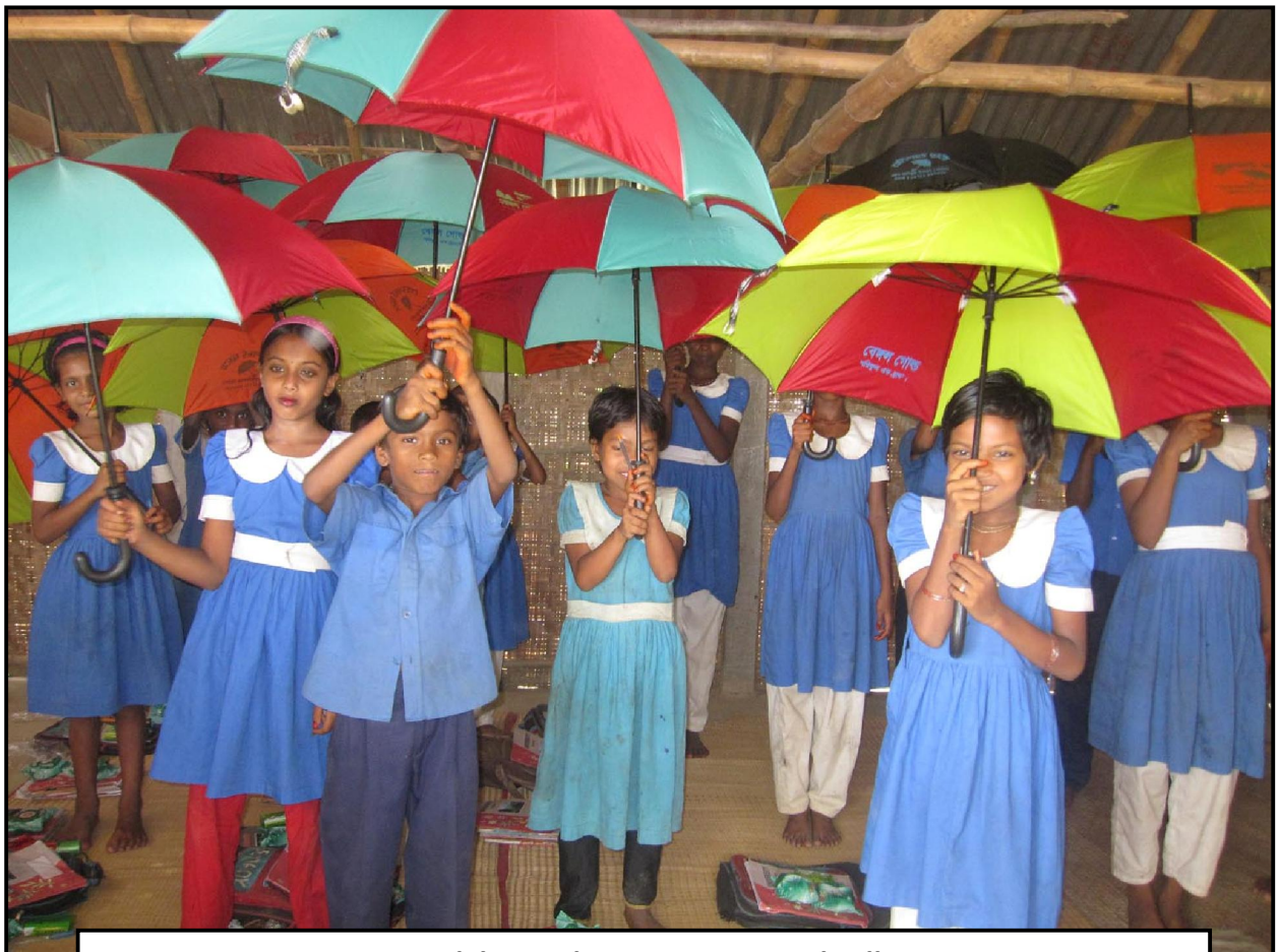
Sorupdaho students receiving umbrella...