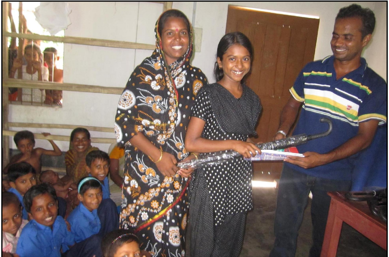
Mohishati students receiving umbrella...