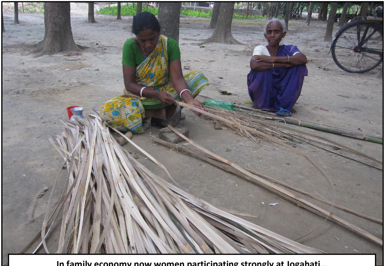
In family economy now women participating strongly at Jogahati...