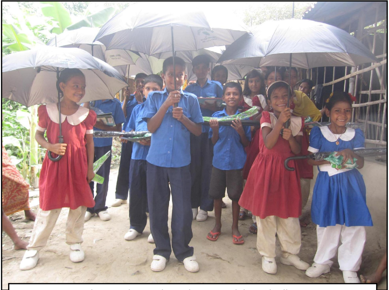
Churamankati students also received the umbrella...