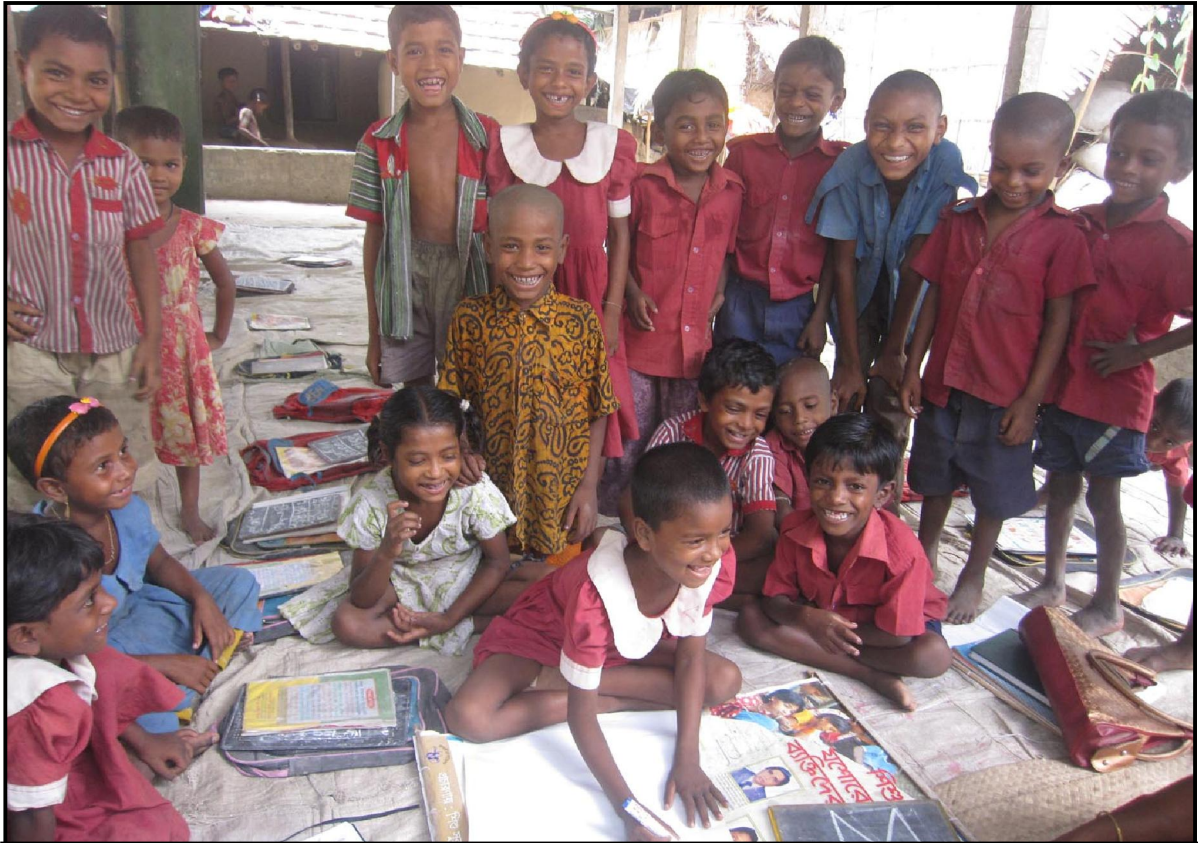
Fun in Jogahati pre-school drawing class...