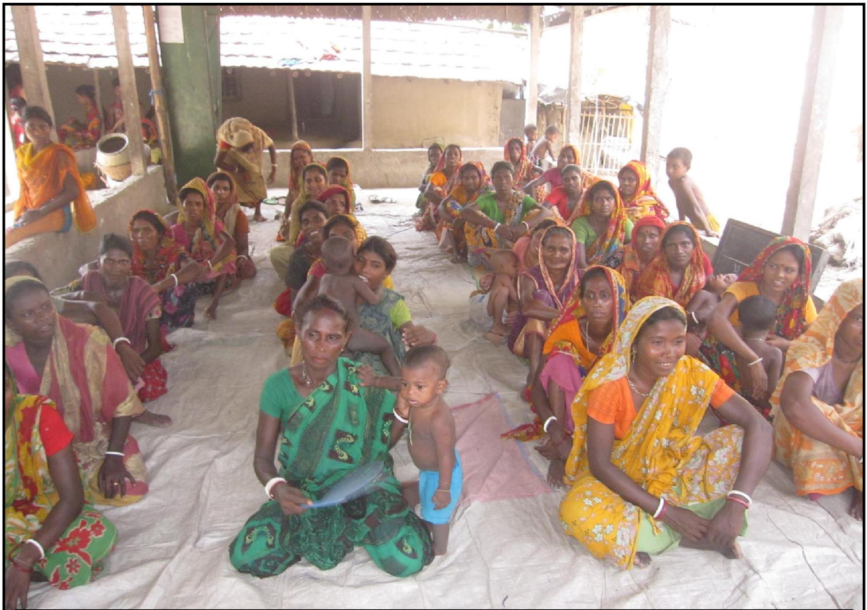
Monthly parents meeting at Jogahati...