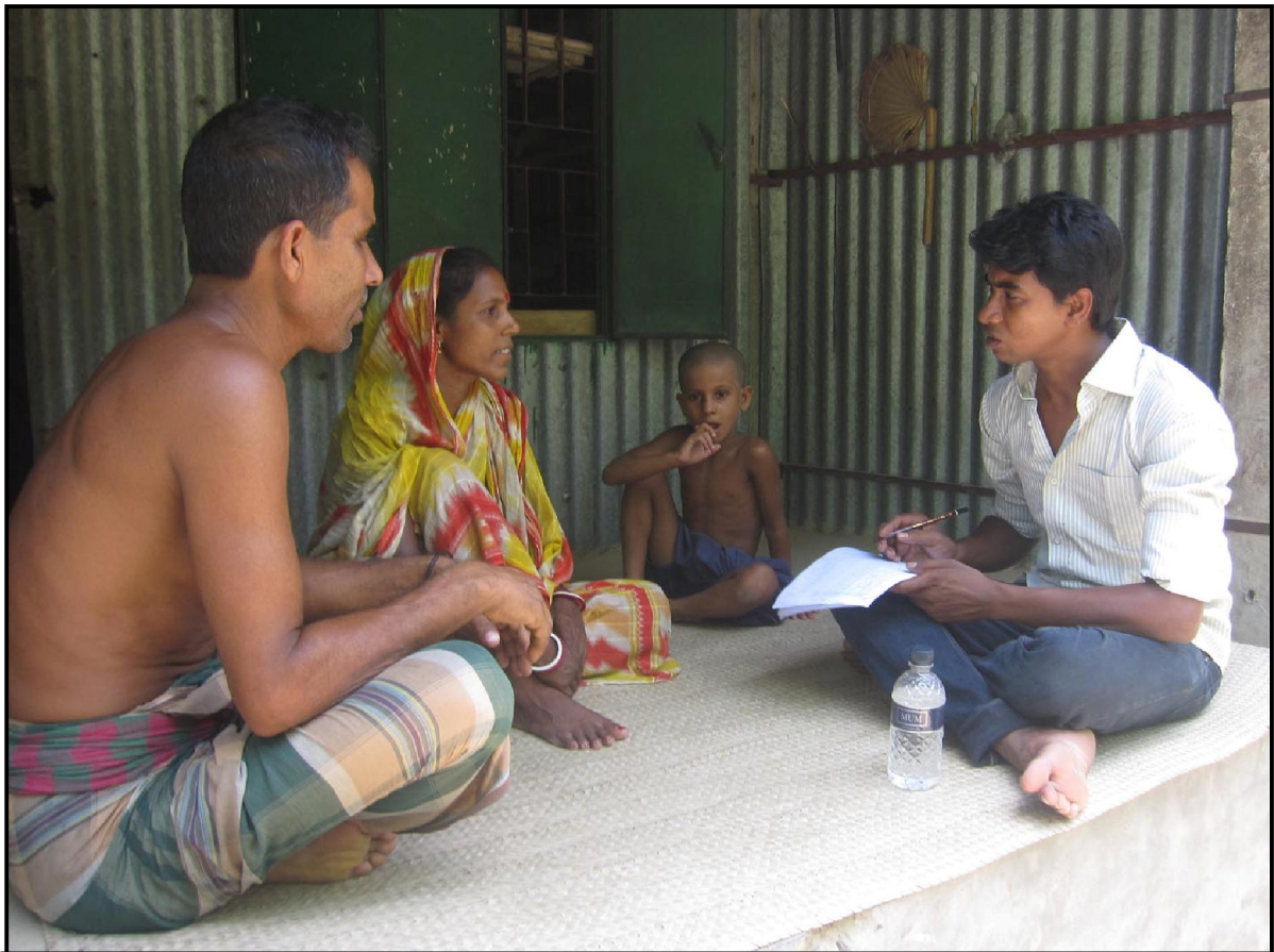
Medical survey at Mohishati...