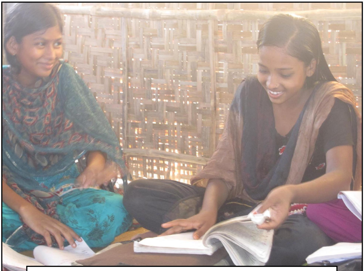
Churamankati students enjoying study in newly built Study Centre...