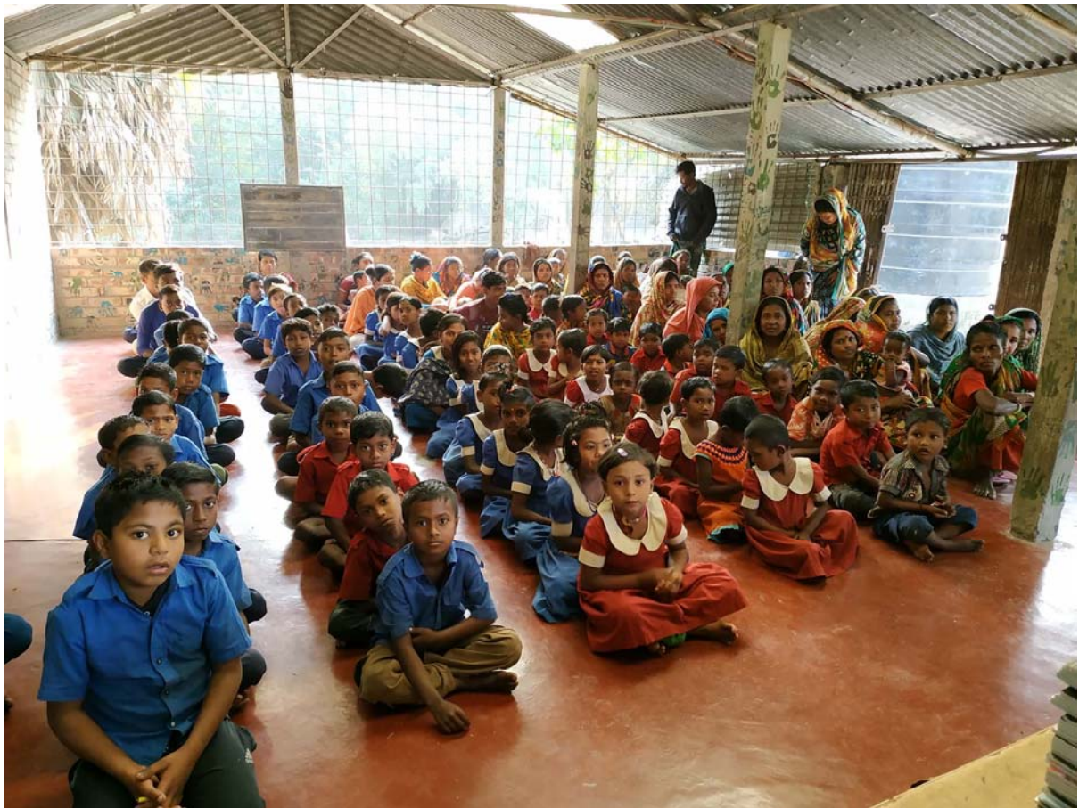
Monthly parents meeting

School Visits: During the month, to check the attendance at school of the adopted students, Community Motivator visited fourteen schools & collage .