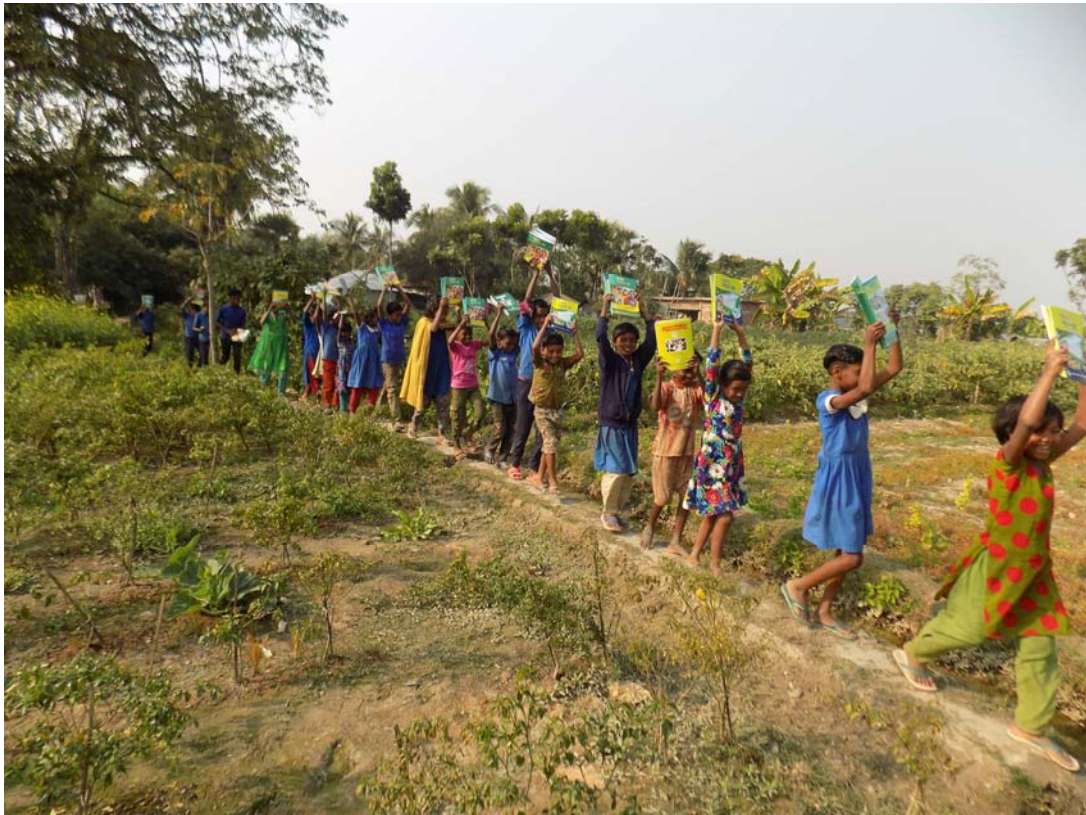
Student start new class with new books....

New Class, New Books: Students started new class and enjoy new books. 7 pre-school students enrolled in local government school and 7 new Jogahati kids enrolled in BS Pre-school. As like previous time we take body measurement of each supported students to prepare school uniform and distributed to the 132 sponsored and 24 non-sponsored pre-school students.