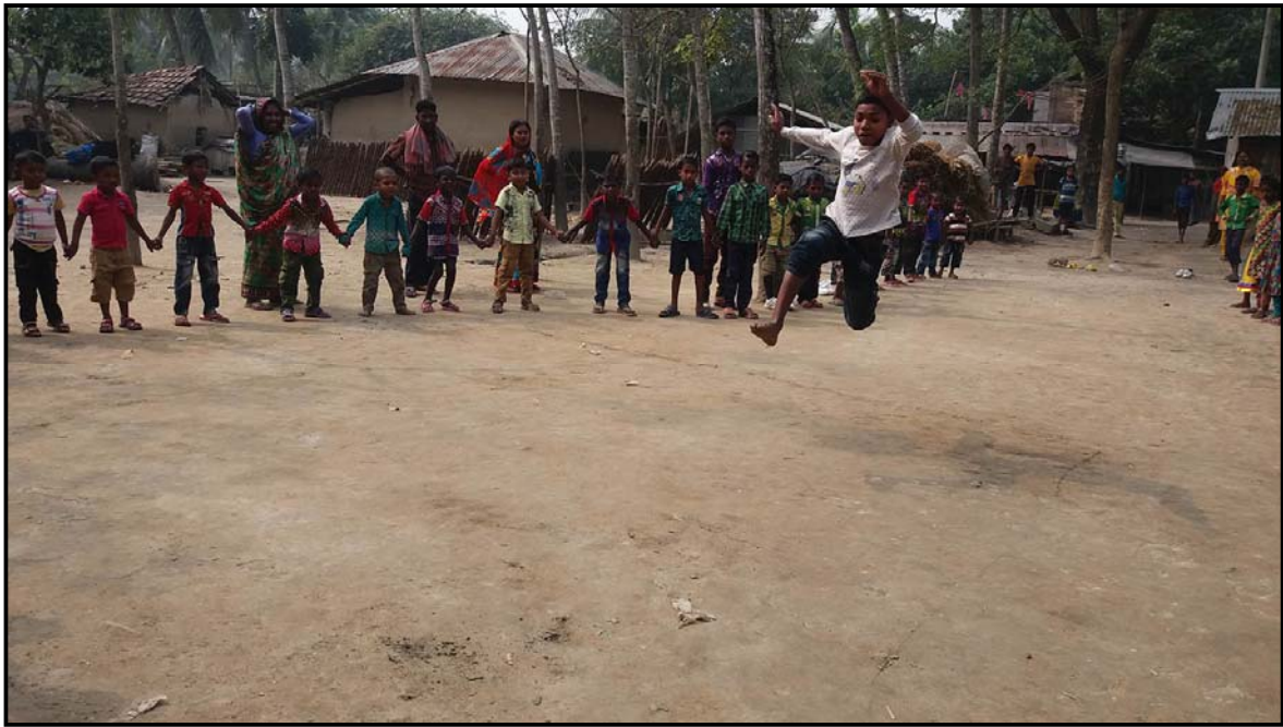
Annual Picnic: long jump events...