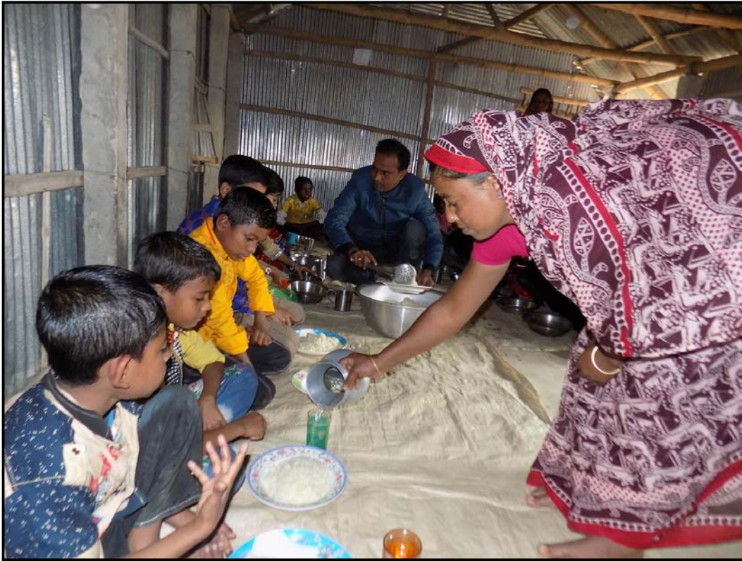
Annual Picnic: Taking lunch together at Sorupdaho...