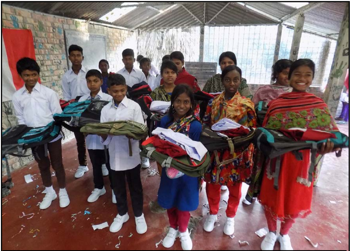
The happy students with new uniform, shoes & socks and bags...