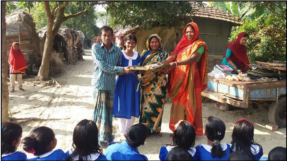
Distribution programme at Sorupdaho village. We distributed School Uniform, Bag and other educational materials.