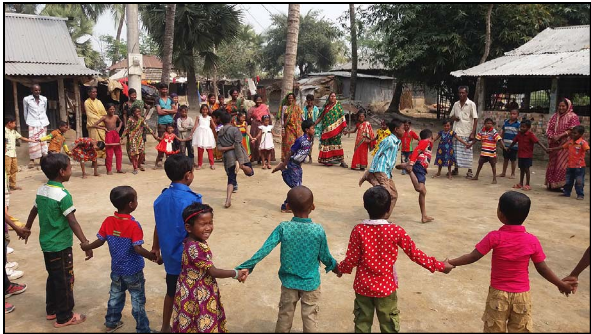
Annual Picnic: chicken run games...