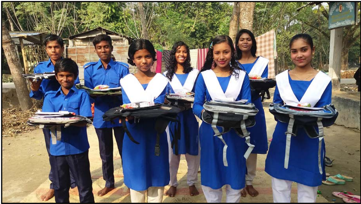
Happy students in Mohishati with the Education materials...