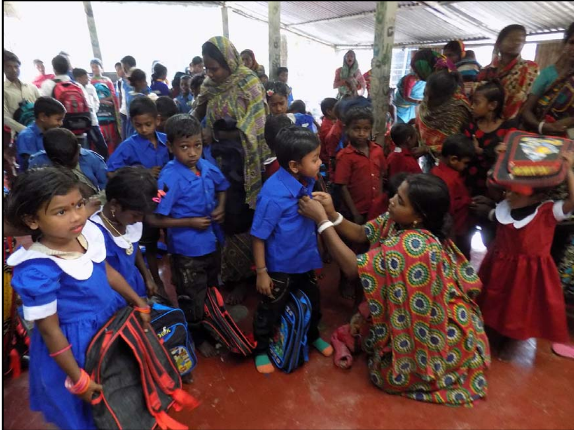
Wear new school uniforms...