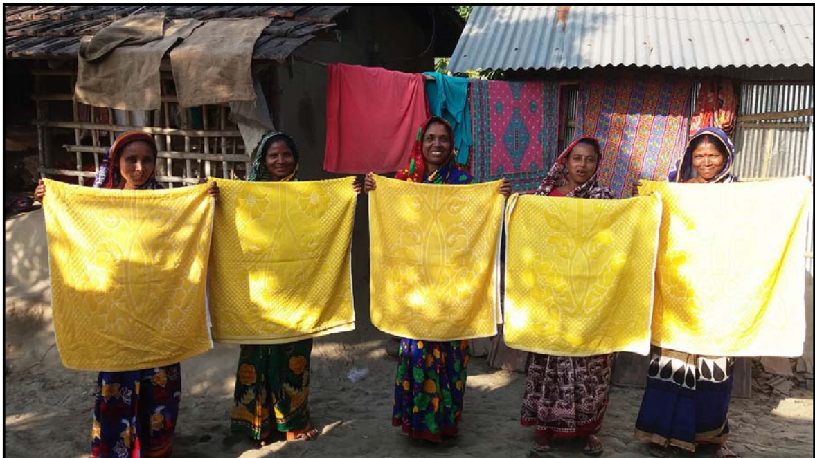
Committee members receive the gift for their work through the year. The gift gives huge motivation. Members received one towel each so the concept of the towel is that, towel keep them clean and they keep the community clean...