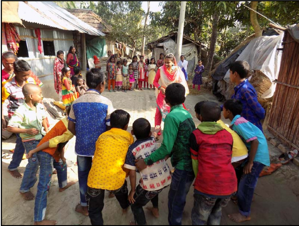
Annual Picnic: more game events...