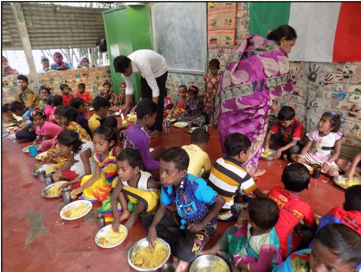
Annual Picnic: Taking lunch together at Jogahati...