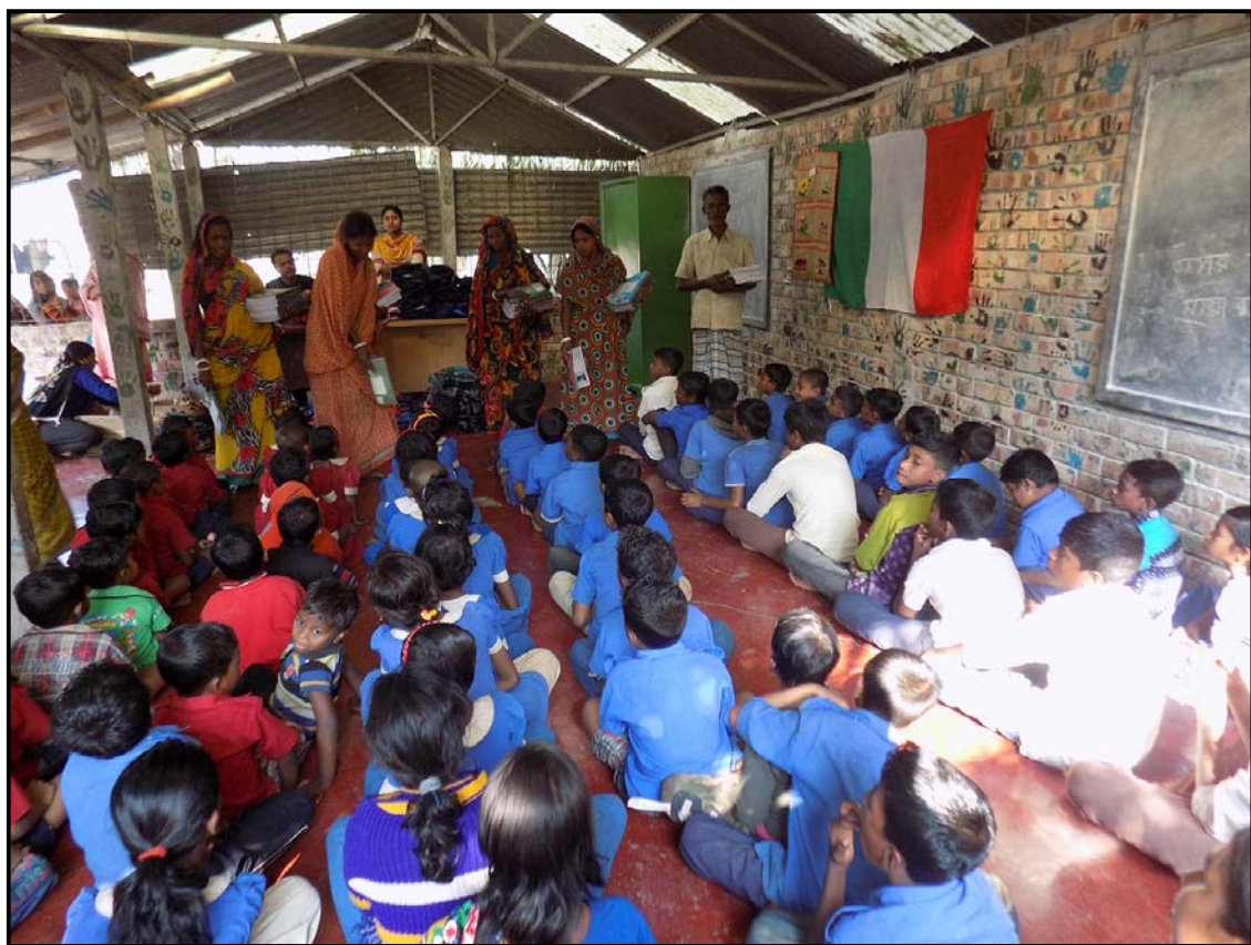
Village committee members distributing materials to Jogahati students...