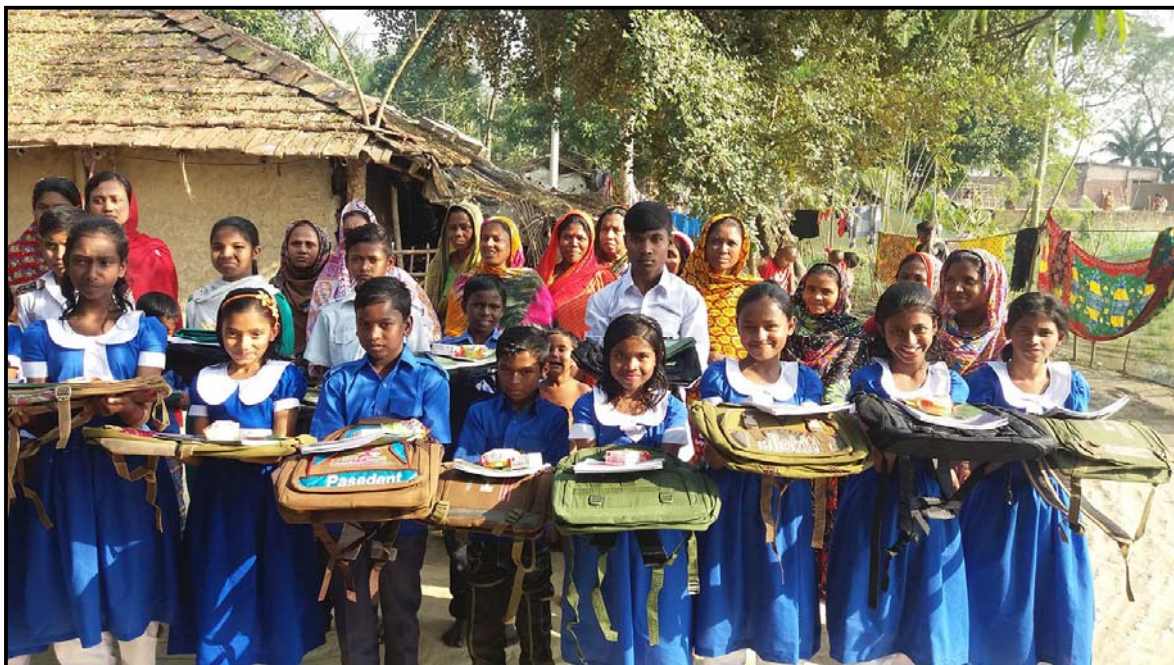
Happy kids with the materials...