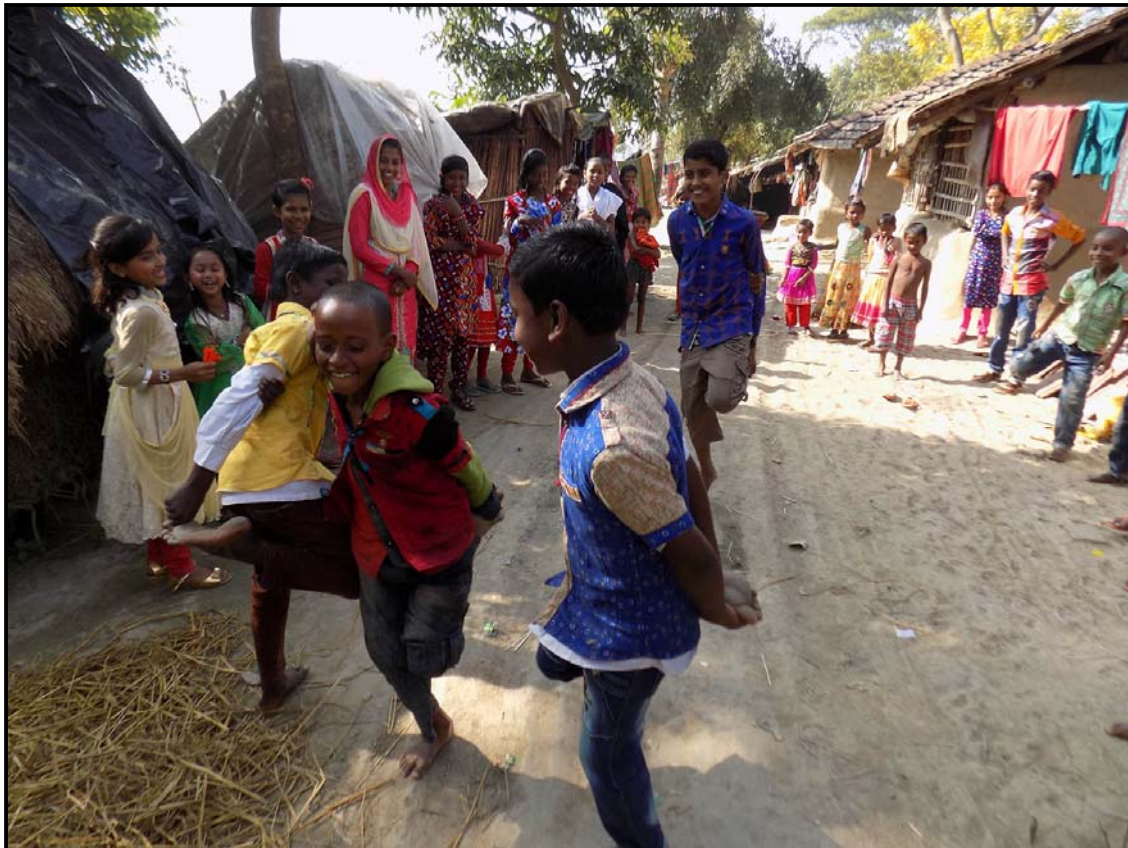
Annual Picnic: chicken run games at Sorupdaho...