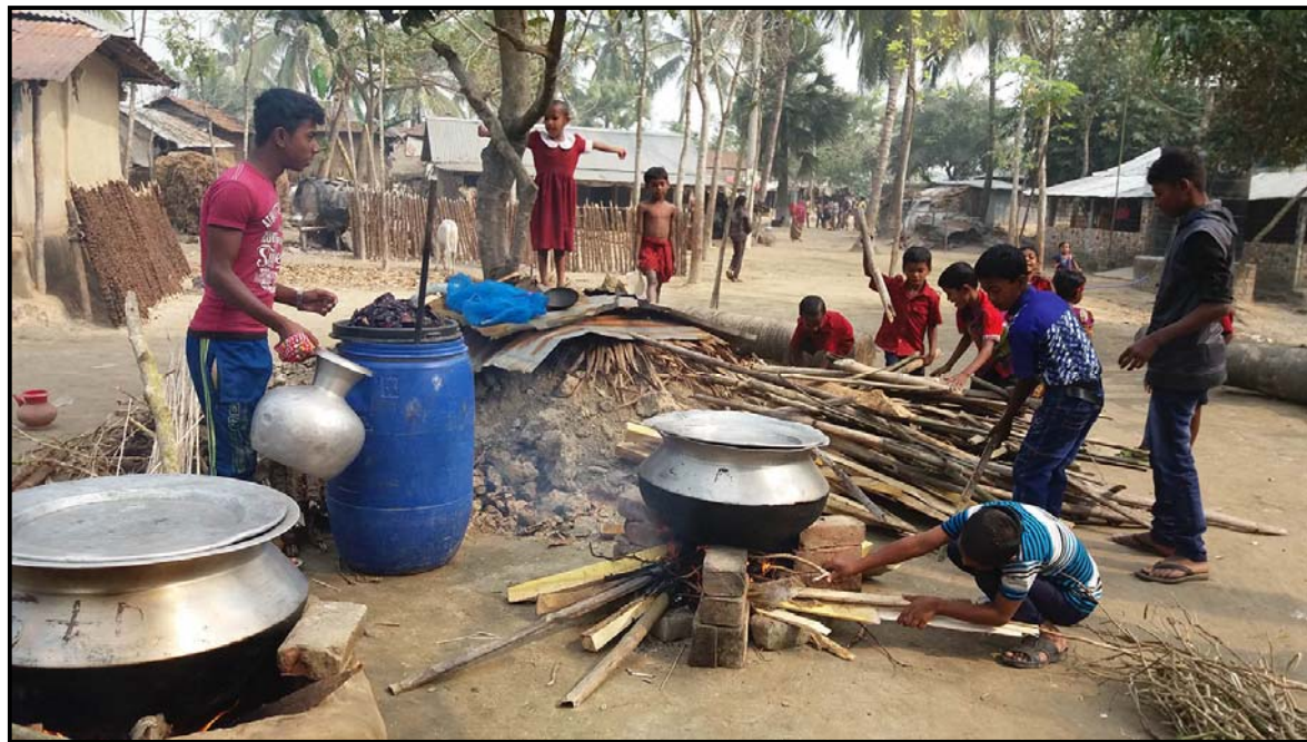
Annual Picnic: at Jogahati students cooking the meal...