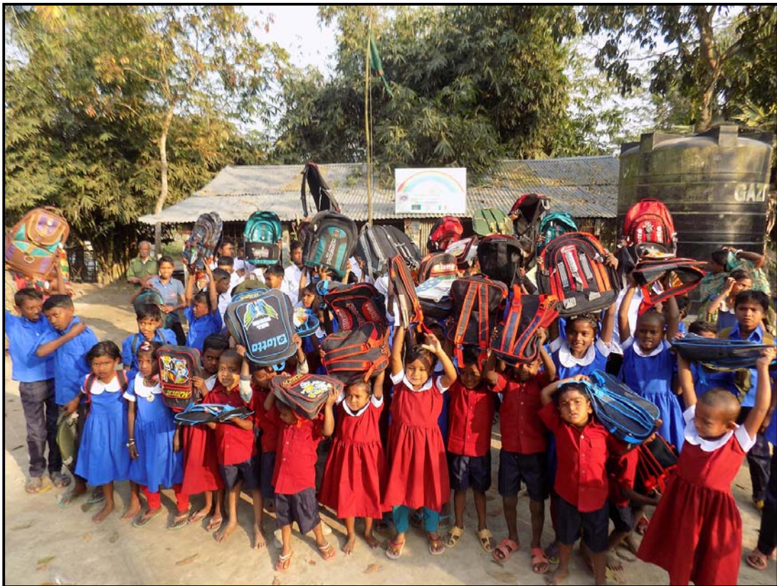
Pre-school kids with the materials...