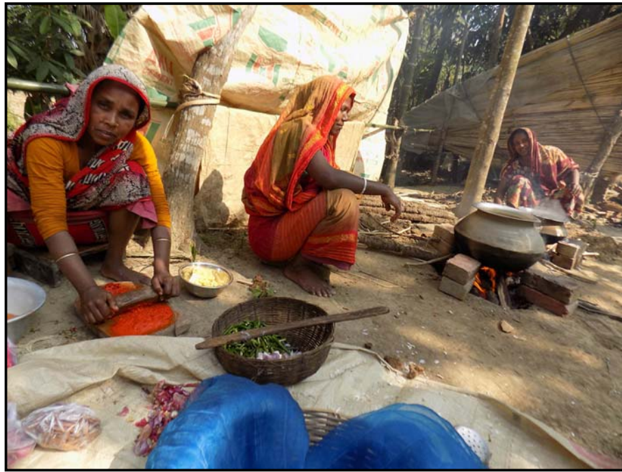
Annual Picnic: Parents also helping for preparing the meal...