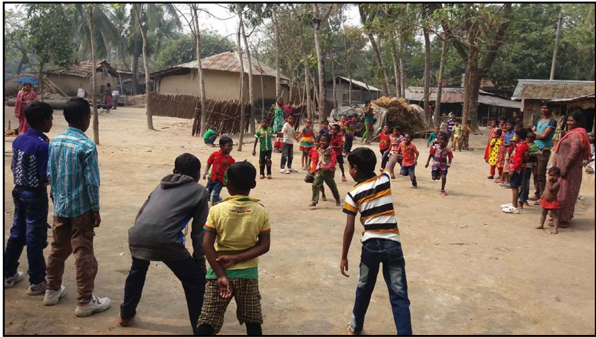
Annual Picnic: sprint games...