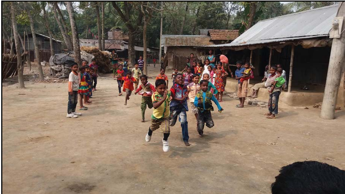
Annual Picnic: Students enjoy the day with games...