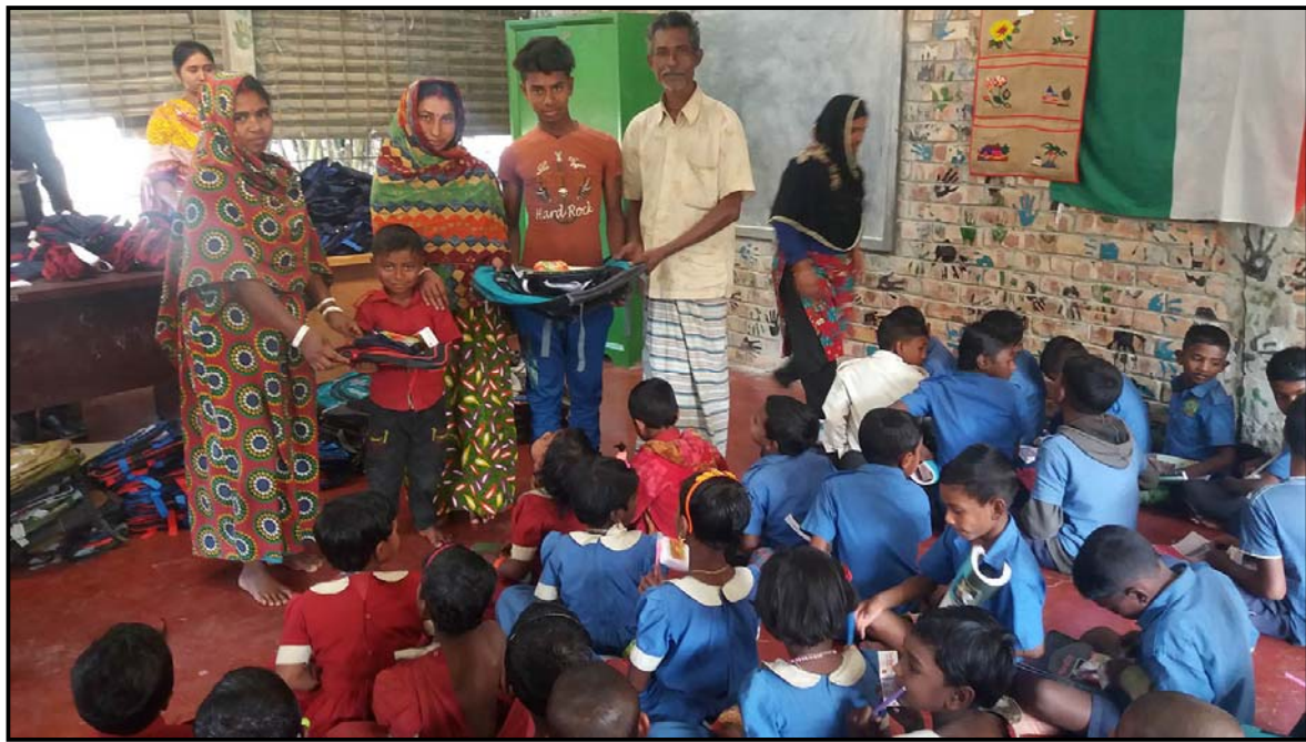
Distribution programme at Jogahati village...