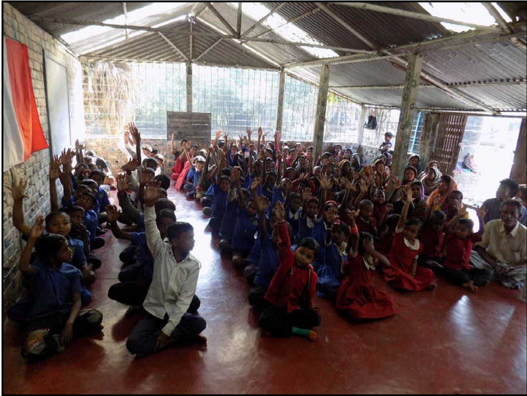
All students oath that this year they will more attentive in study...