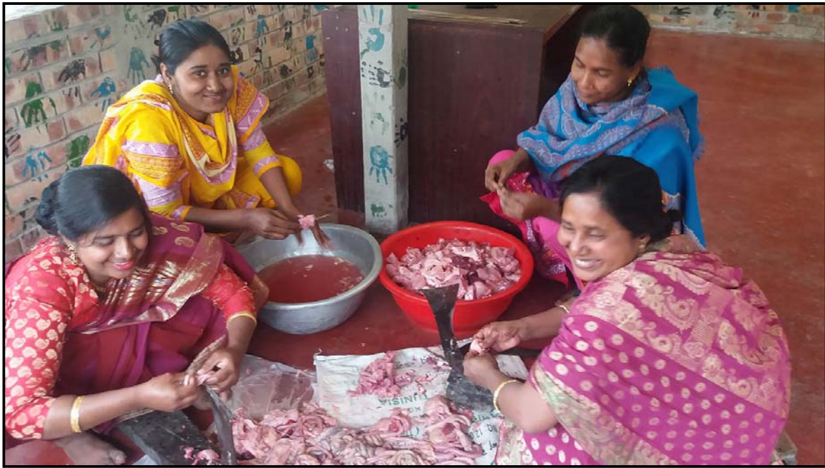
Annual Picnic: at Jogahati teachers helping to prepare the meal...