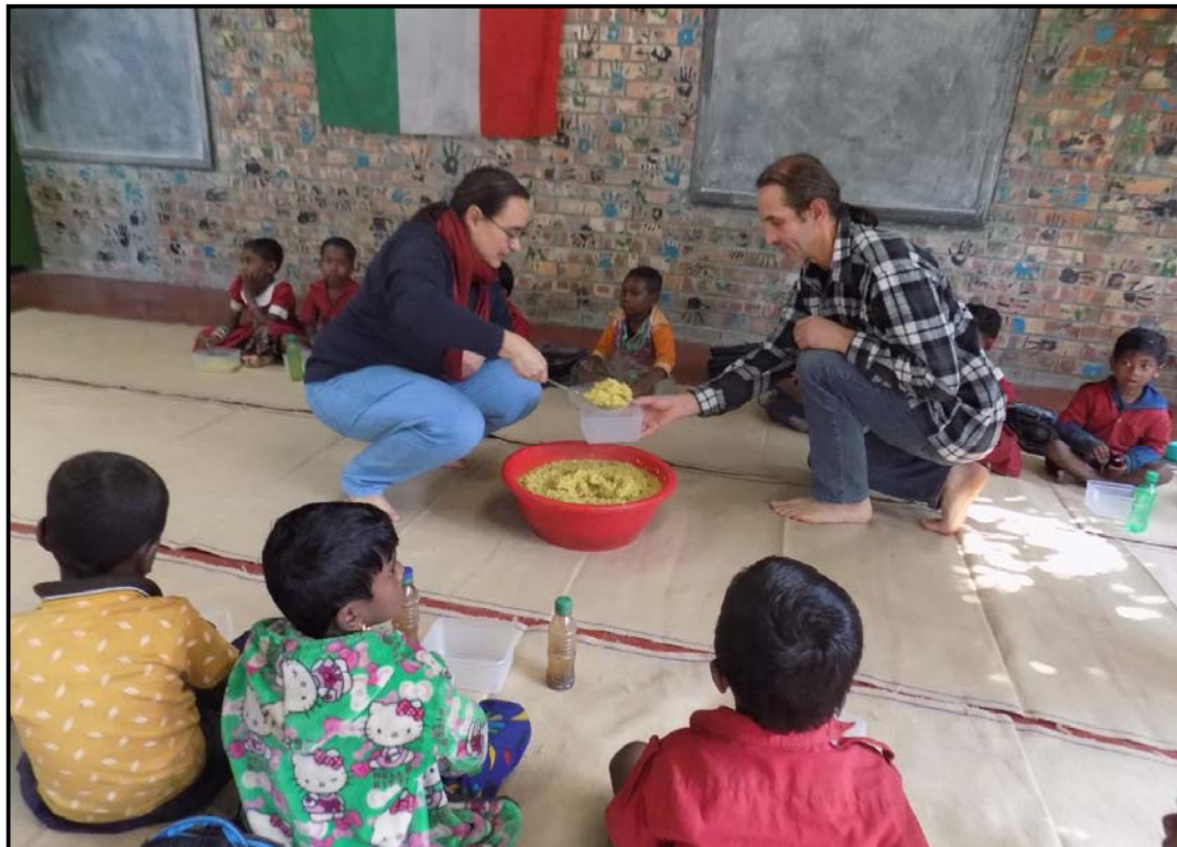
Warm khitchury distribution in Preschool...