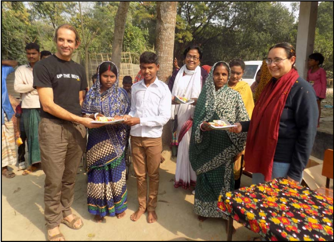
Distribution at Mohishati village.....