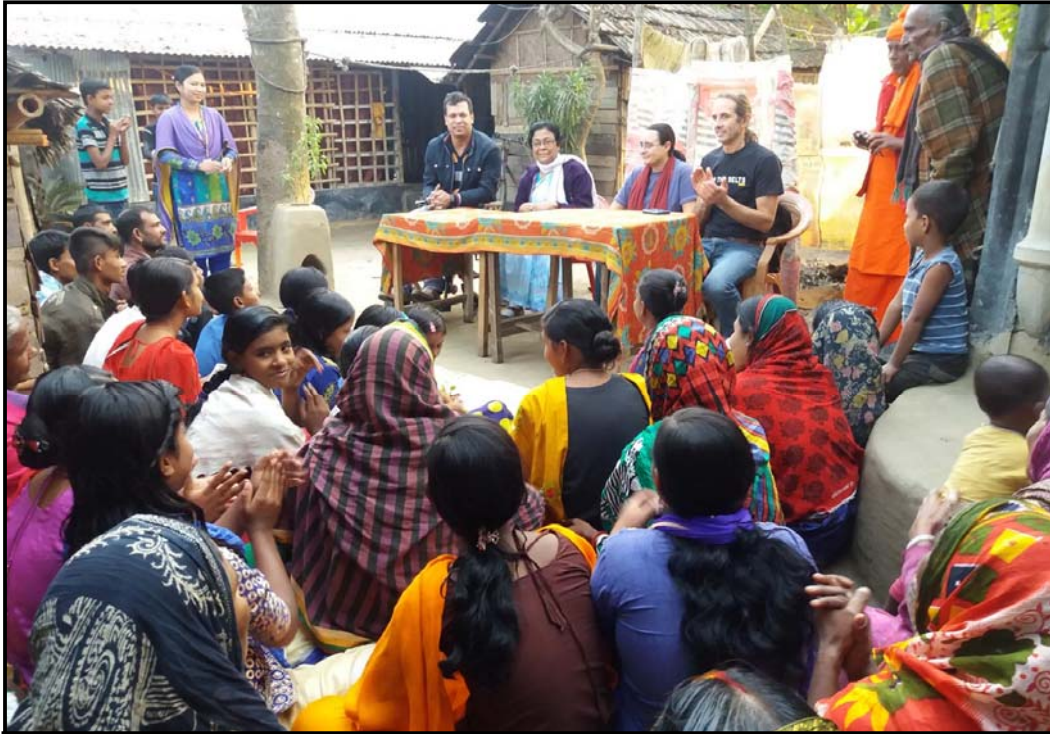
Parents students meeting at Churamankati...