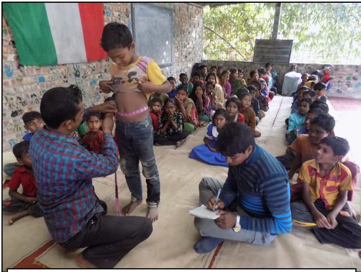
Taking measurement for School Uniform...