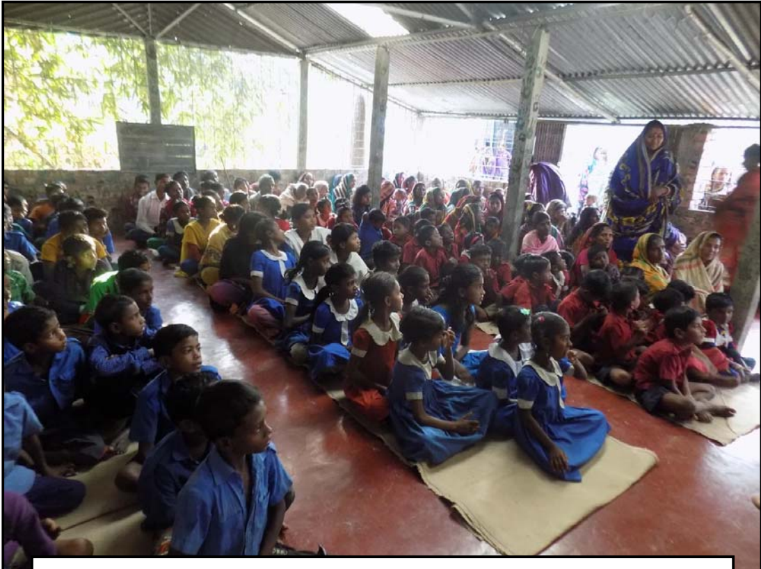
In the meeting Mother expressing how life changing through IDEA Project...