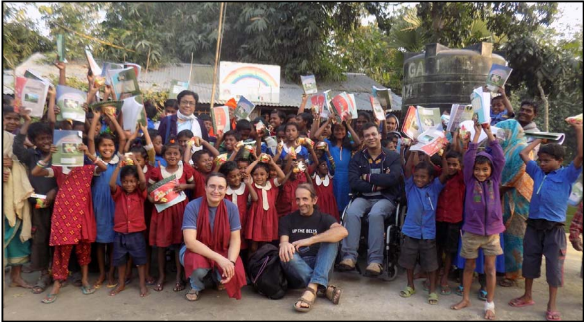
The happy faces together...