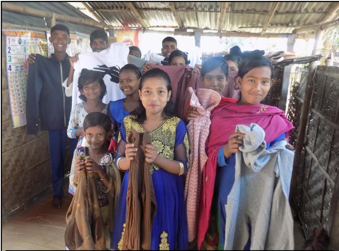
All students of 5 communities receive the warm clothes from DC wife....