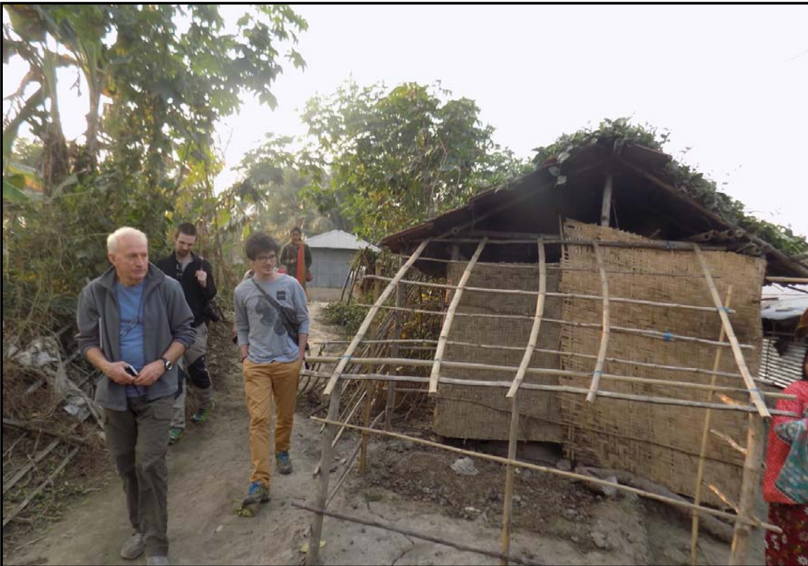
From Sondrio, Italy 5 friends visited the Jogahati village and amazed to see the progress...