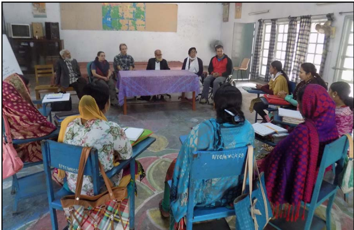
Teachers meeting at BS...