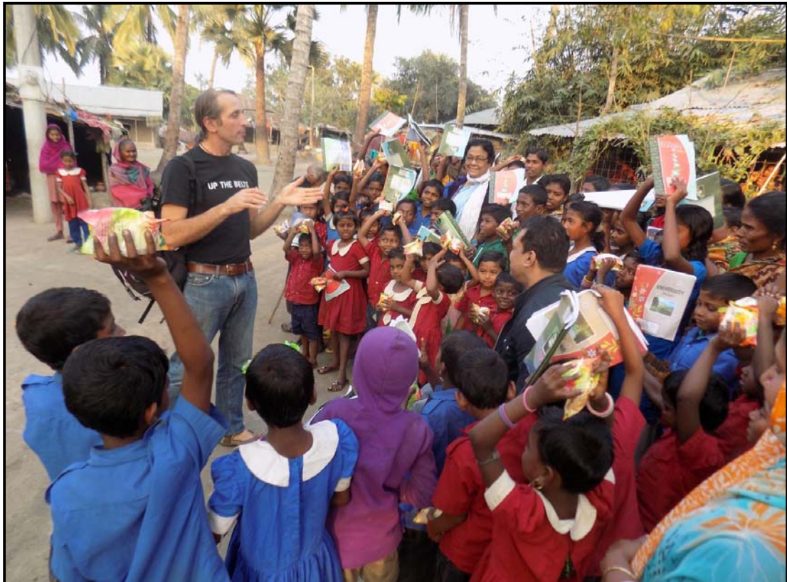
Mr. Super normal man and the kids...