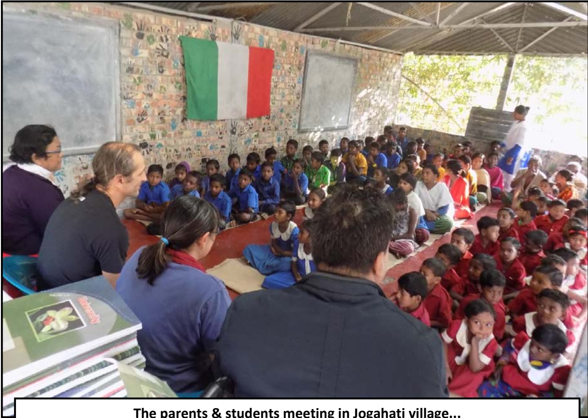
The parents & students meeting in Jogahati village...