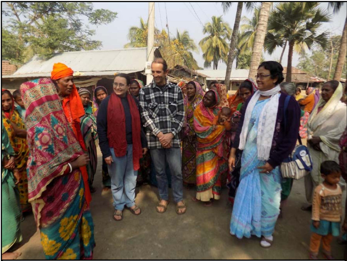
Meeting with Jogahati village....