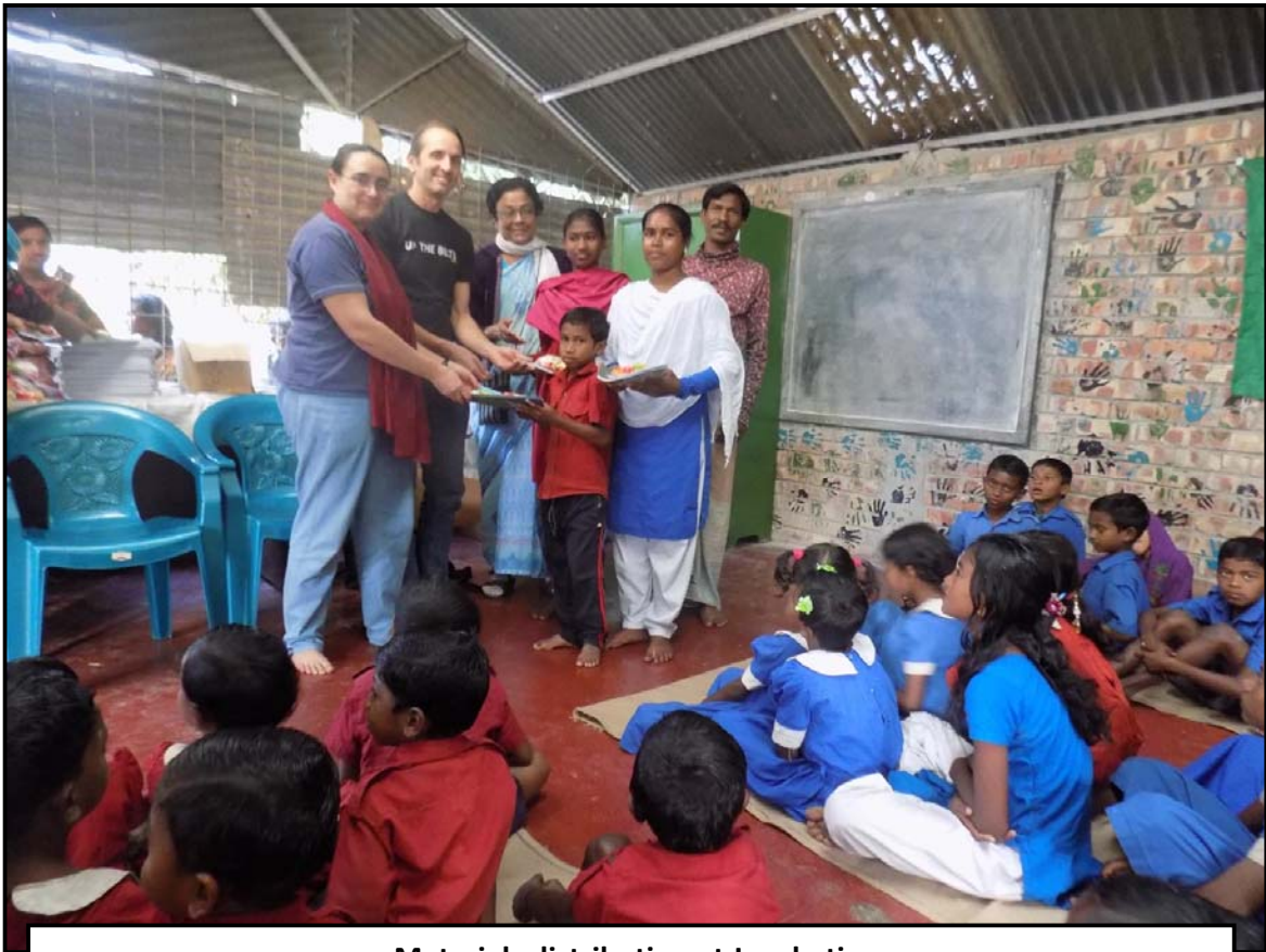
Materials distribution at Jogahati...