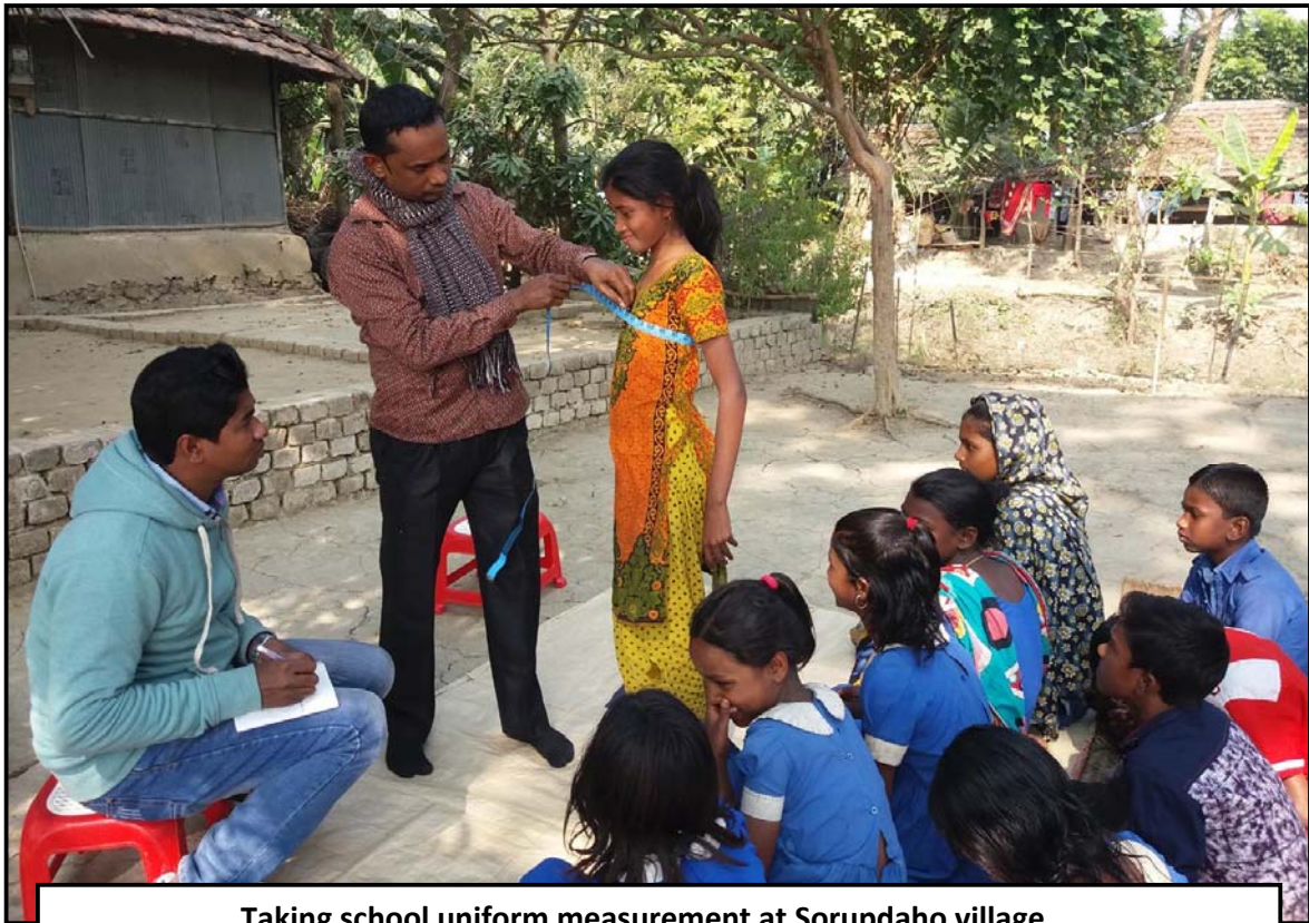
Taking school uniform measurement at Sorupdaho village....