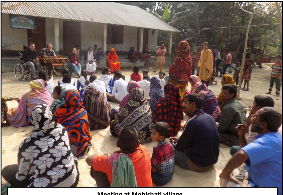
Meeting at Mohishati village...