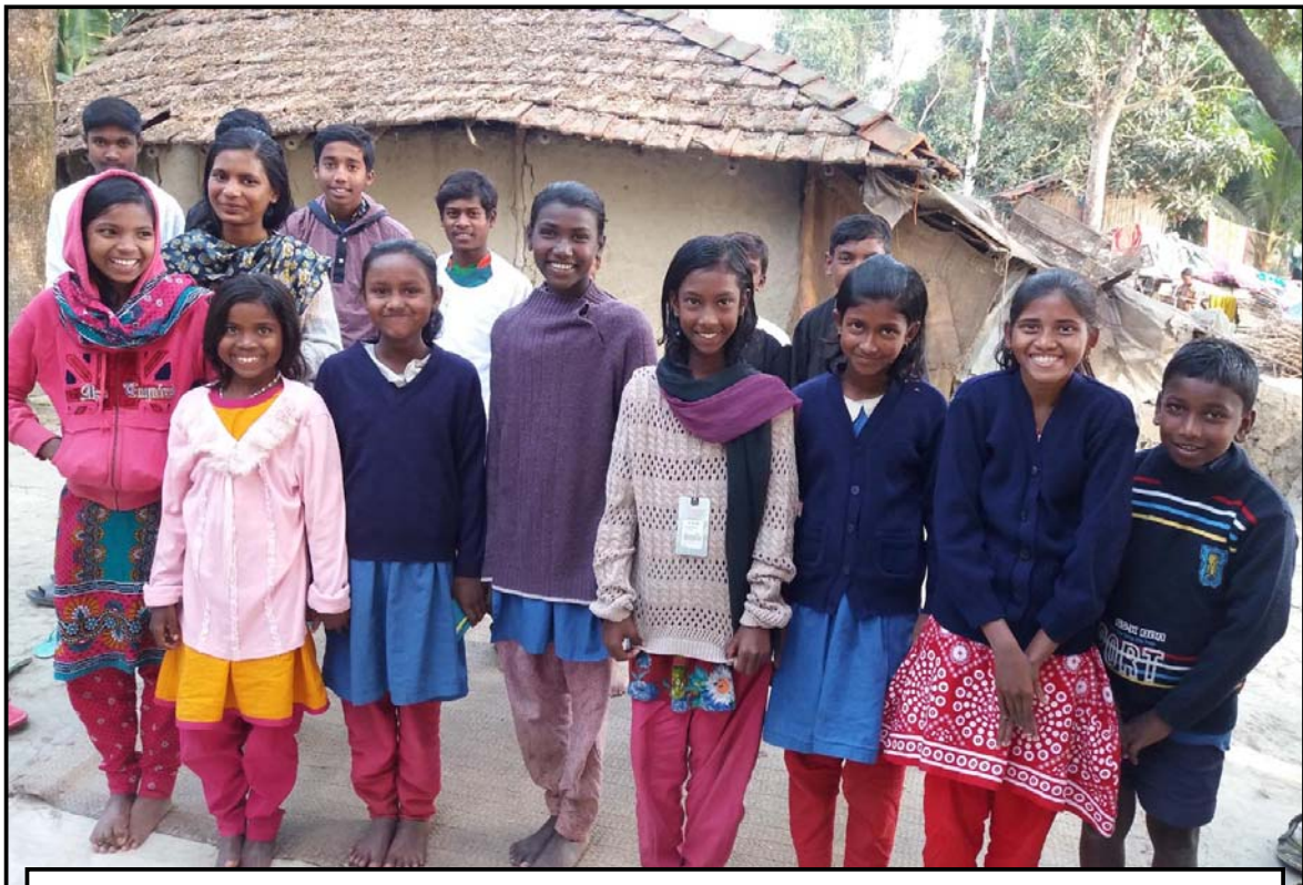
Happy kids with new warm cloths...