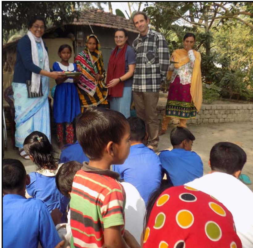
Materials distribution at Sorupdaho village...