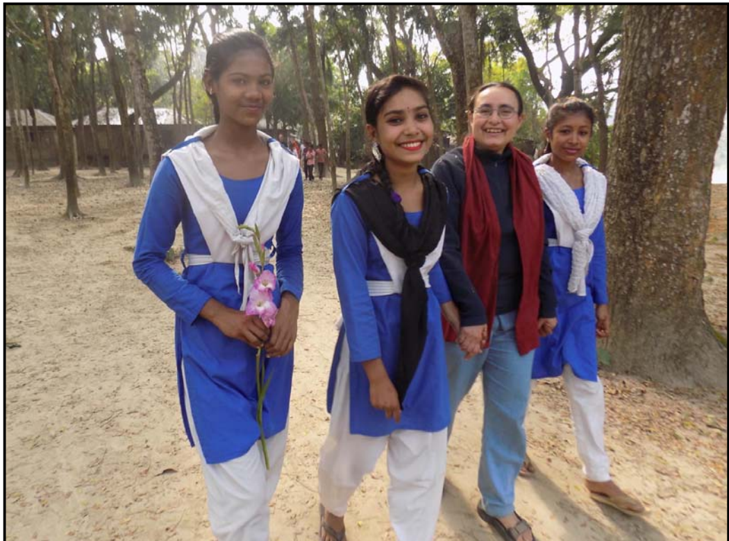
Student enjoyed the time with IDEA friends...