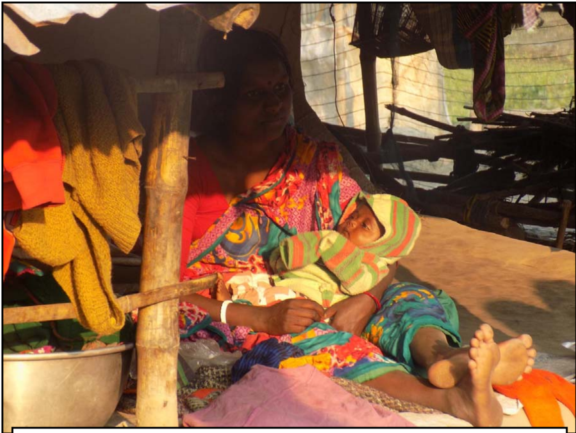
Joghati mother and child enjoying the sun....