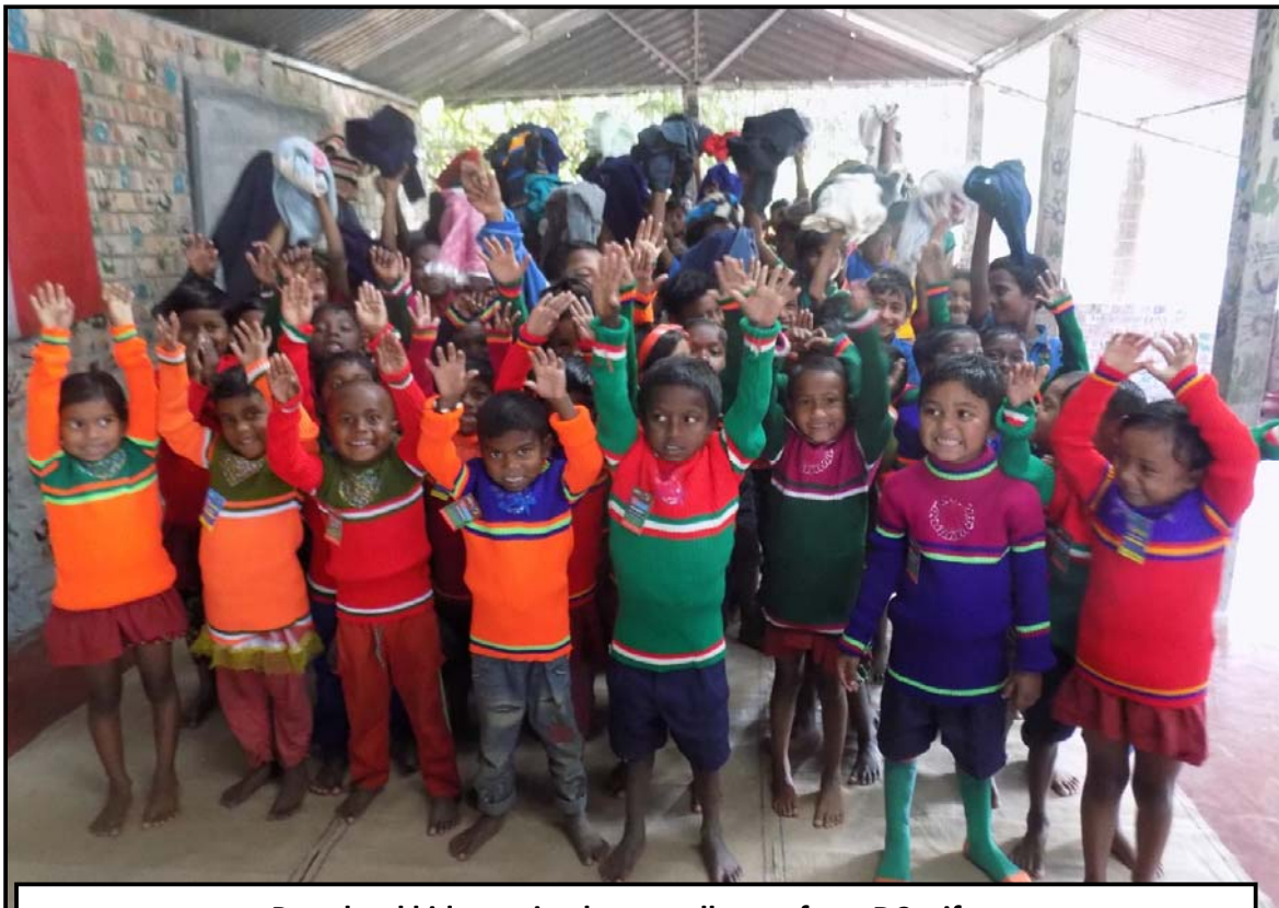
Preschool kids received new pullovers from DC wife...