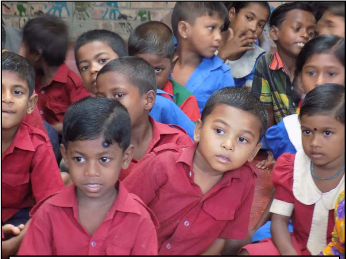
The kids in meeting...