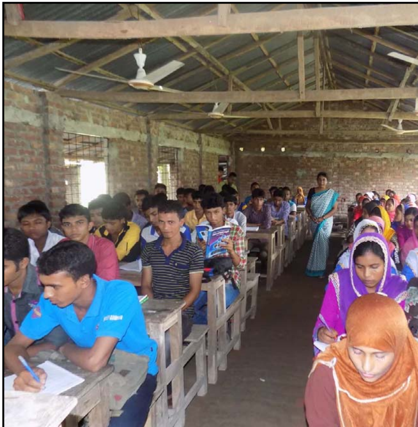
1 st year students and teacher in Collage...