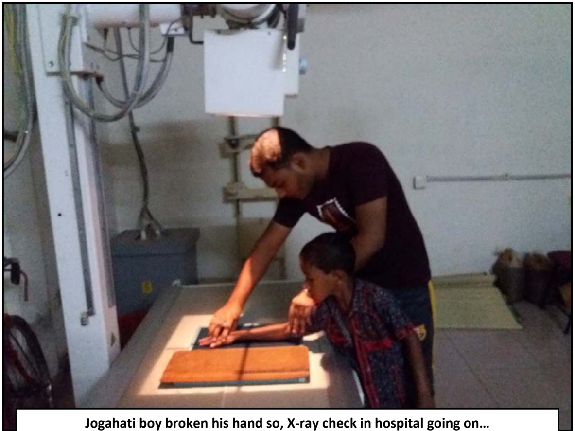
Jogahati boy broken his hand so, X-ray check in hospital going on...