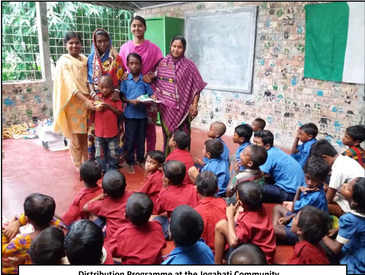
Distribution Programme at the Jogahati Community...