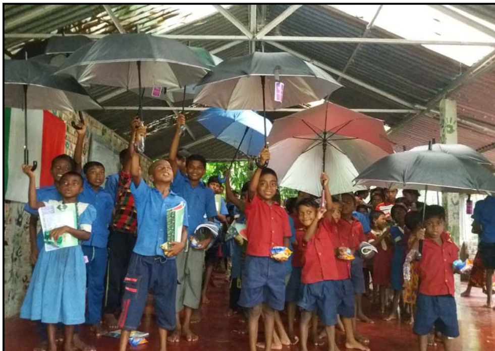
Children happy with materials and umbrella. The rainy days helps to going school..