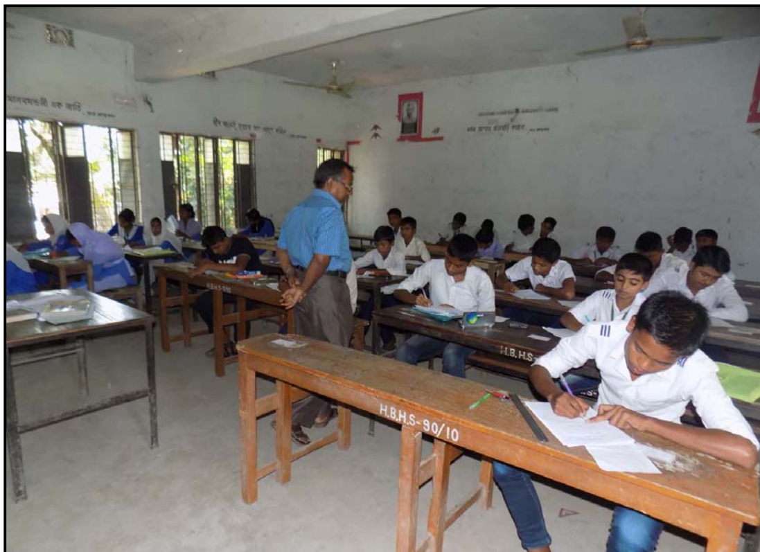
Students giving exam...