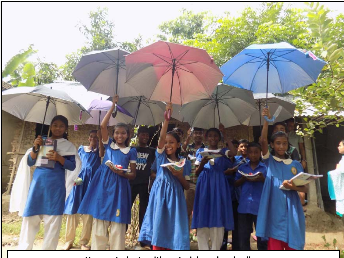
Happy students with materials and umbrella...