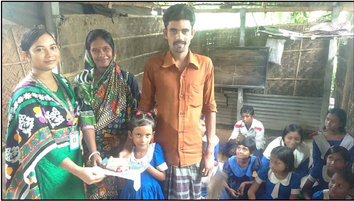
Materials distribution at Churamankati village....