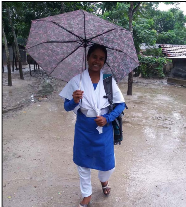
Kakoli first day and first steps for Collage...Jogahati girls first time went to collage...