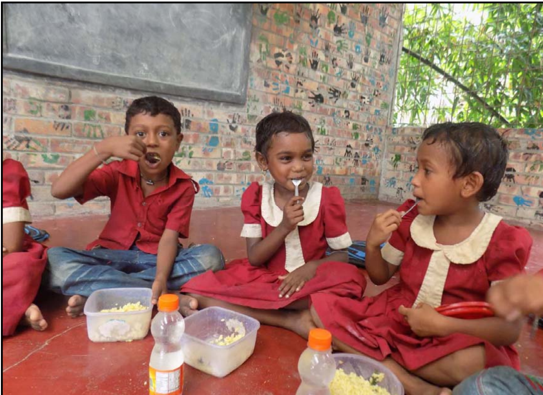
Enjoying the daily Kitchury...