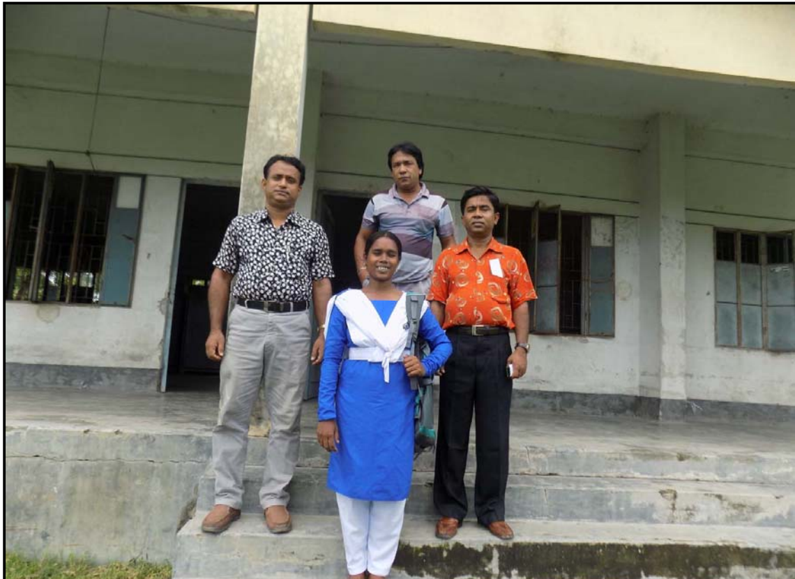
All teachers assured us to provide best guide to Kakoli...