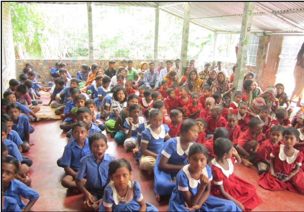
Monthly Parents and Students Meeting at Jogahati...