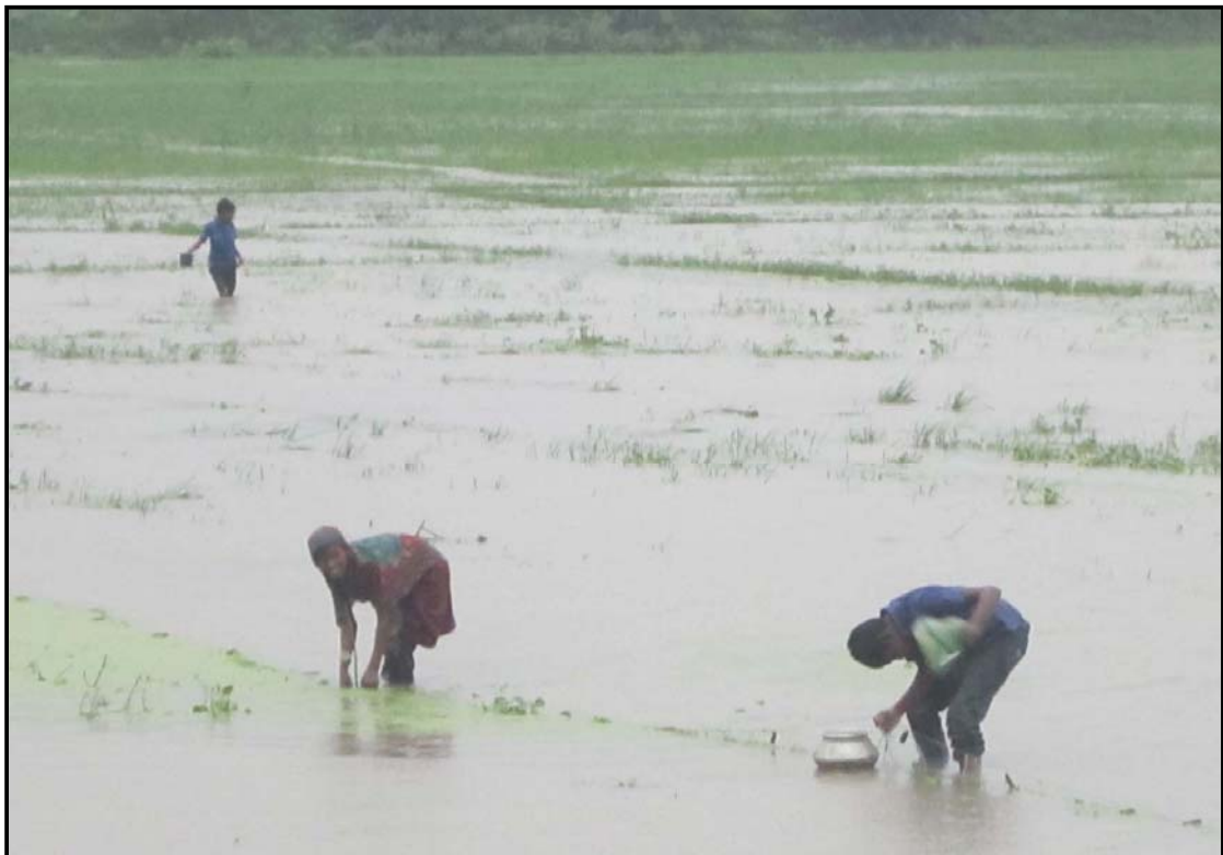
In rainy season, many families and children catch fish from the ponds...