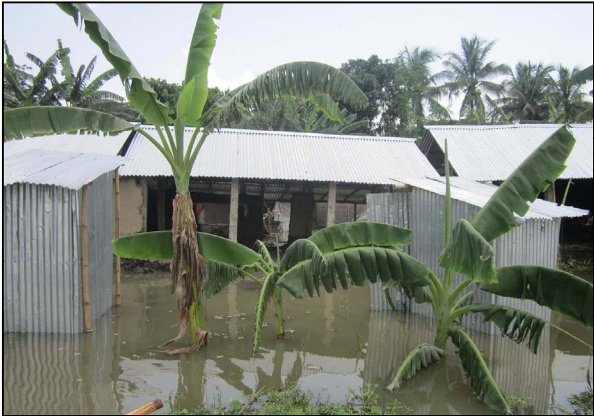
During the rainy season, some houses in Jogahati in under water for couple of days...