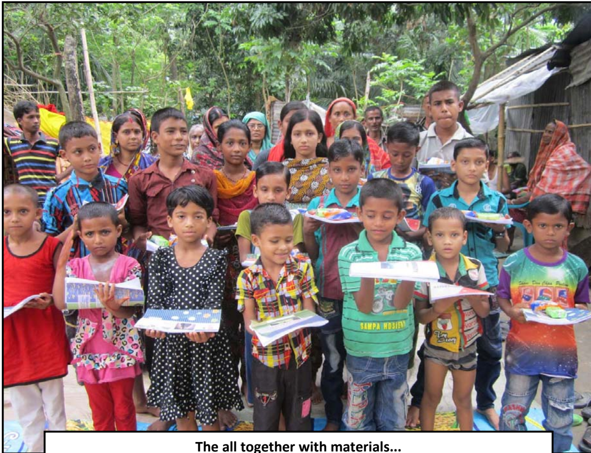
The all together with materials...