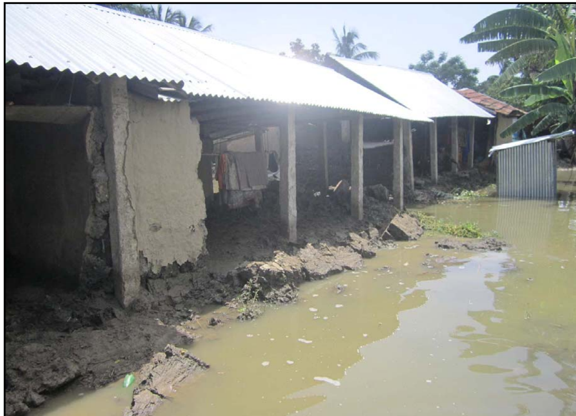
Due to heavy rain water was near the new houses...