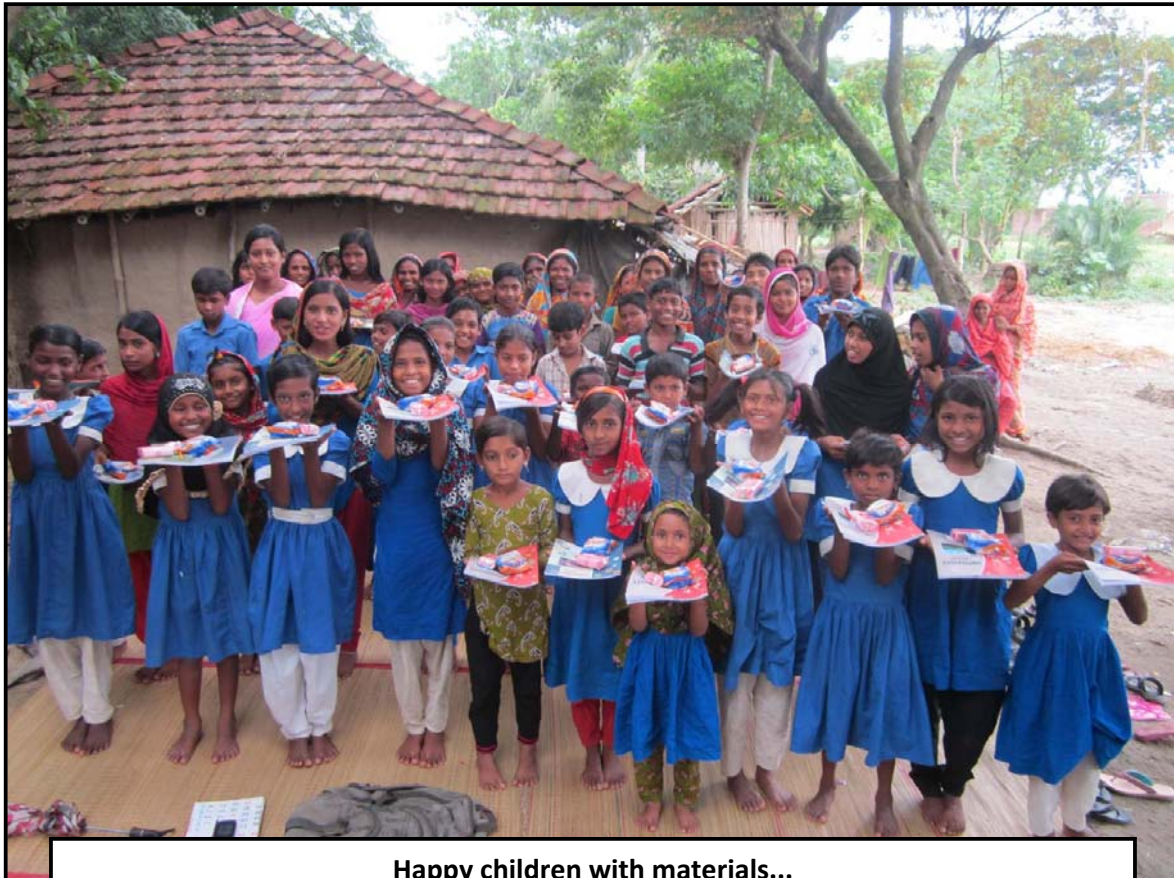
Happy children with materials...