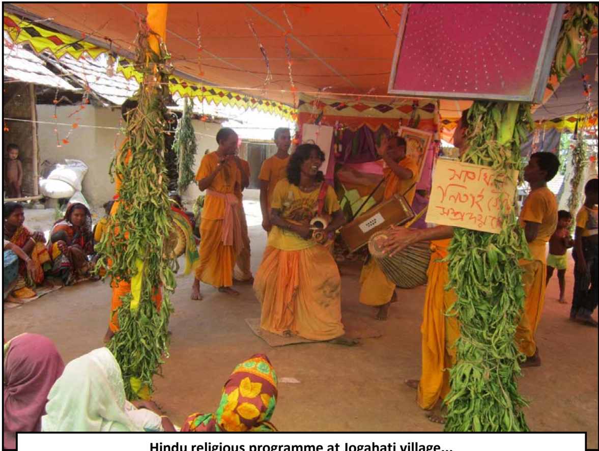
Hindu religious programme at Jogahati village...