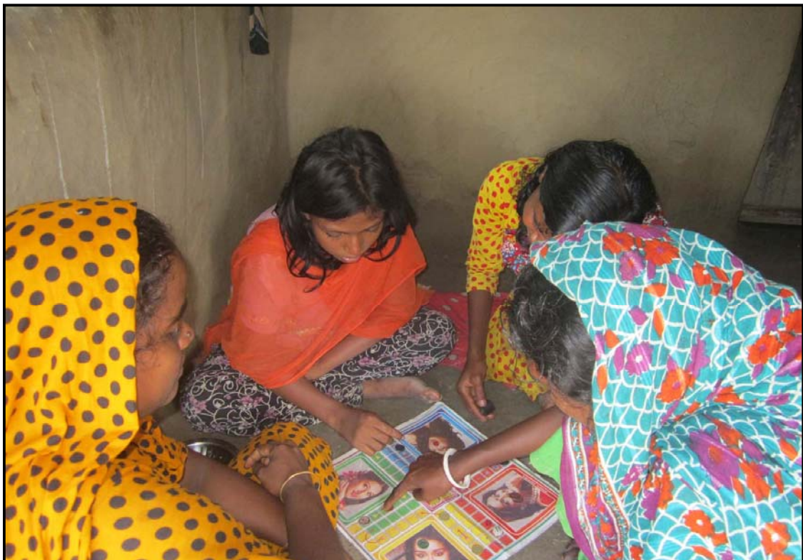
In leisure time girls playing Ludu (kind of board game)...