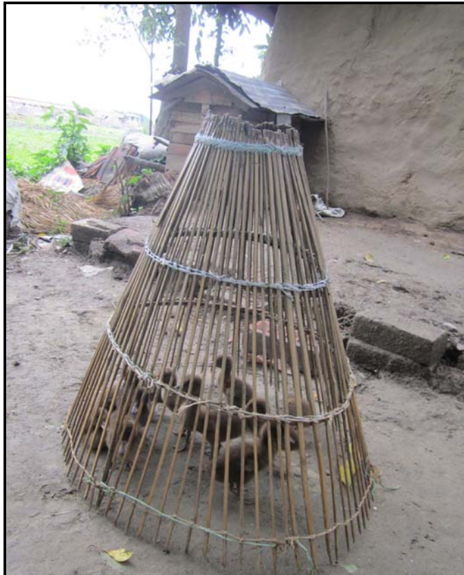
Some family breeding ducks for income generation...