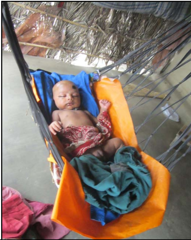
Jogahati Village child sleeping in peace...