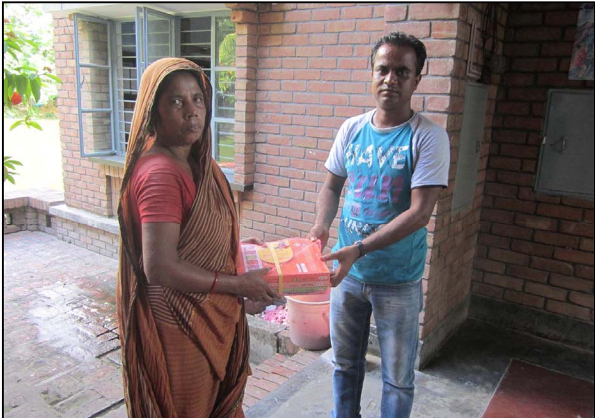
Book distribution to Karuna mother...