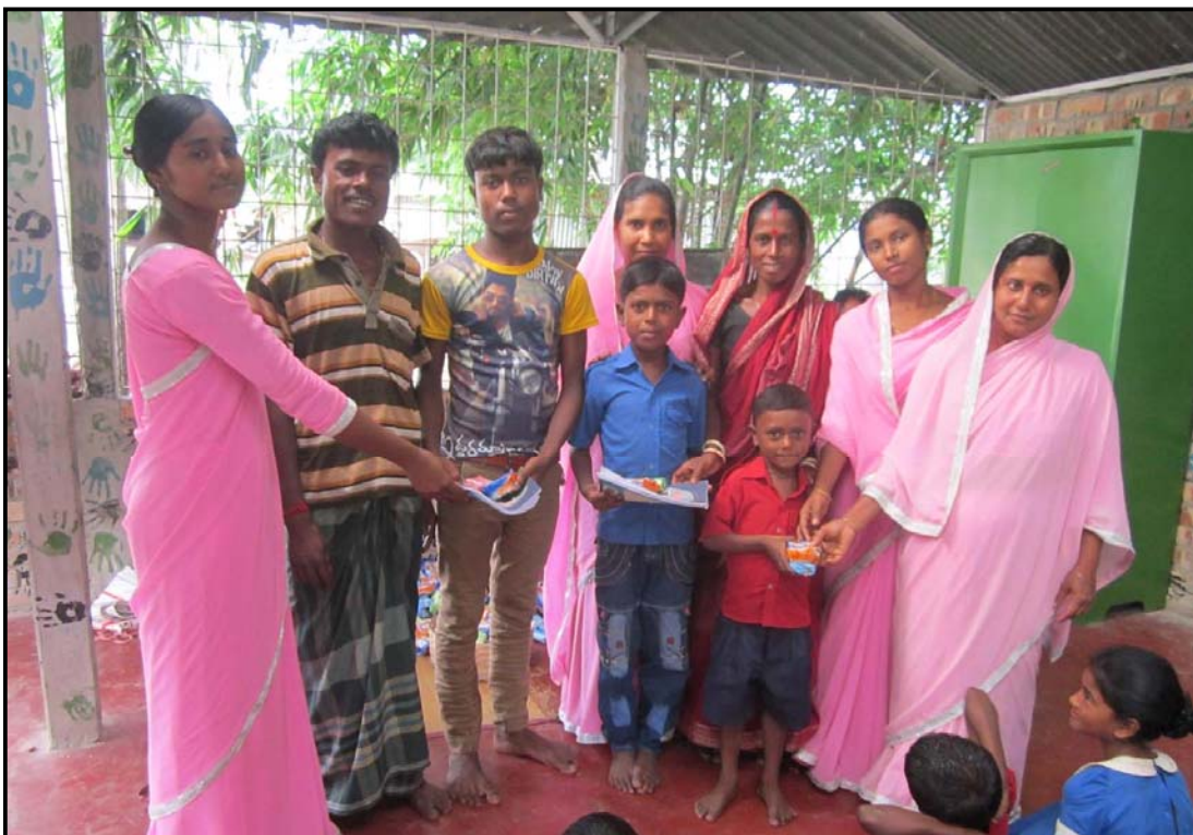
Monthly Materials Distribution at Jogahati...