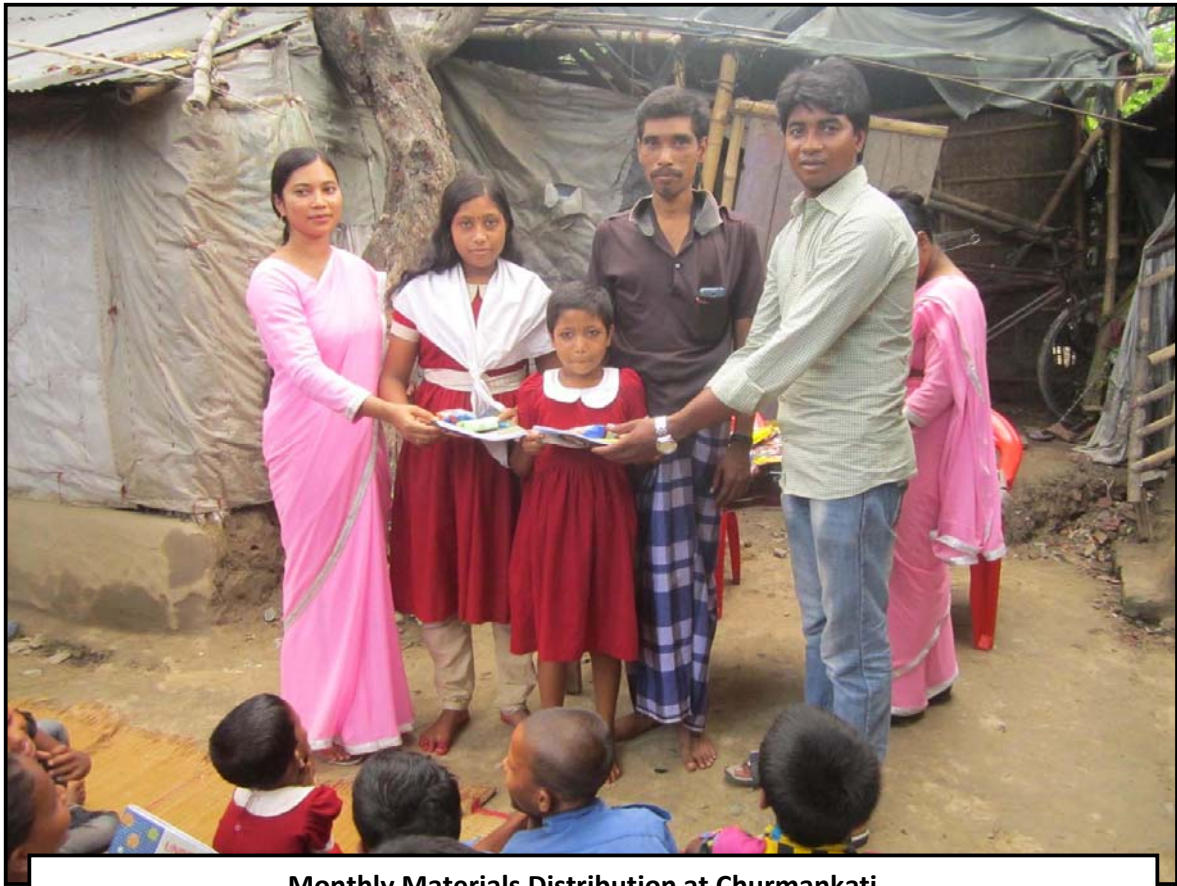
Monthly Materials Distribution at Churmankati...