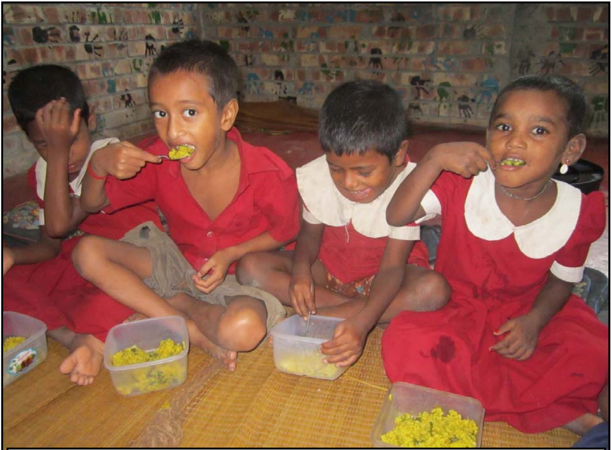
Student enjoying daily food at pre-school...