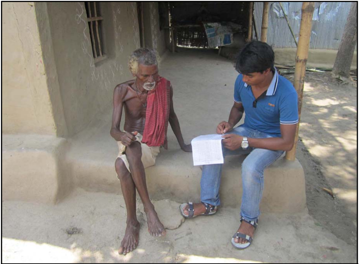
Medical survey at the community...