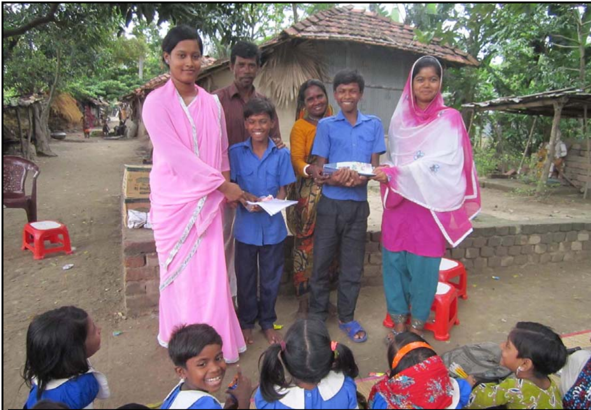
Monthly Materials Distribution at Sorupdaho...