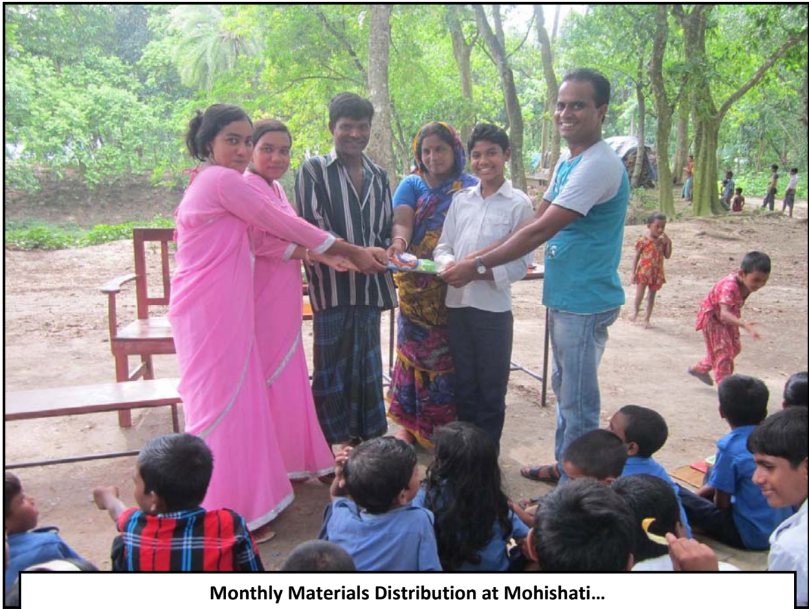
Monthly Materials Distribution at Mohishati...