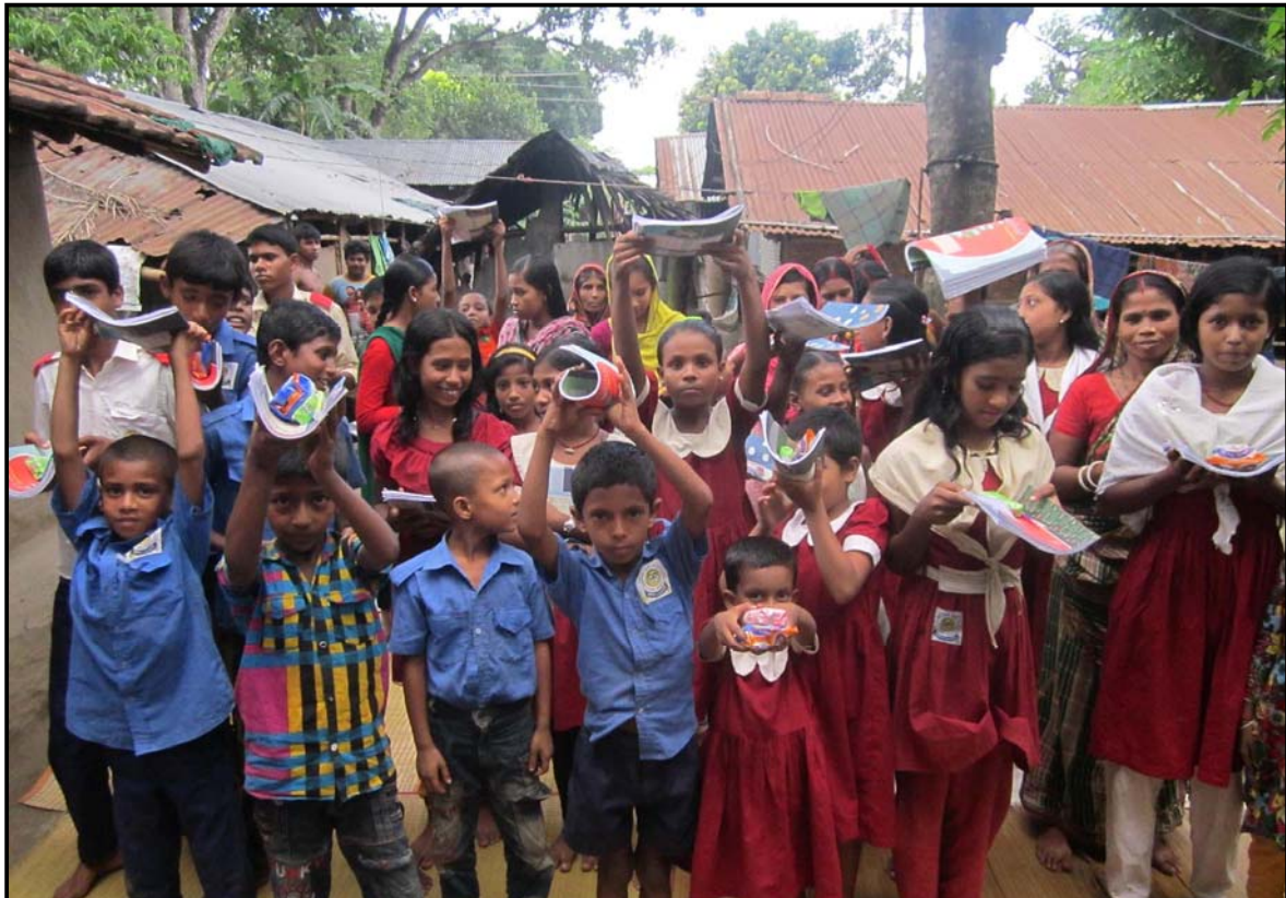
Happy students of Churmankati...