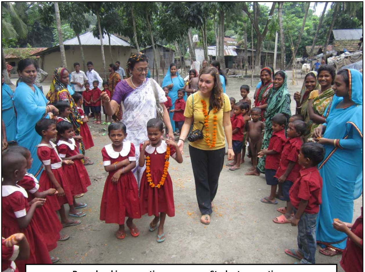
Pre-school inauguration ceremony: Students reception...