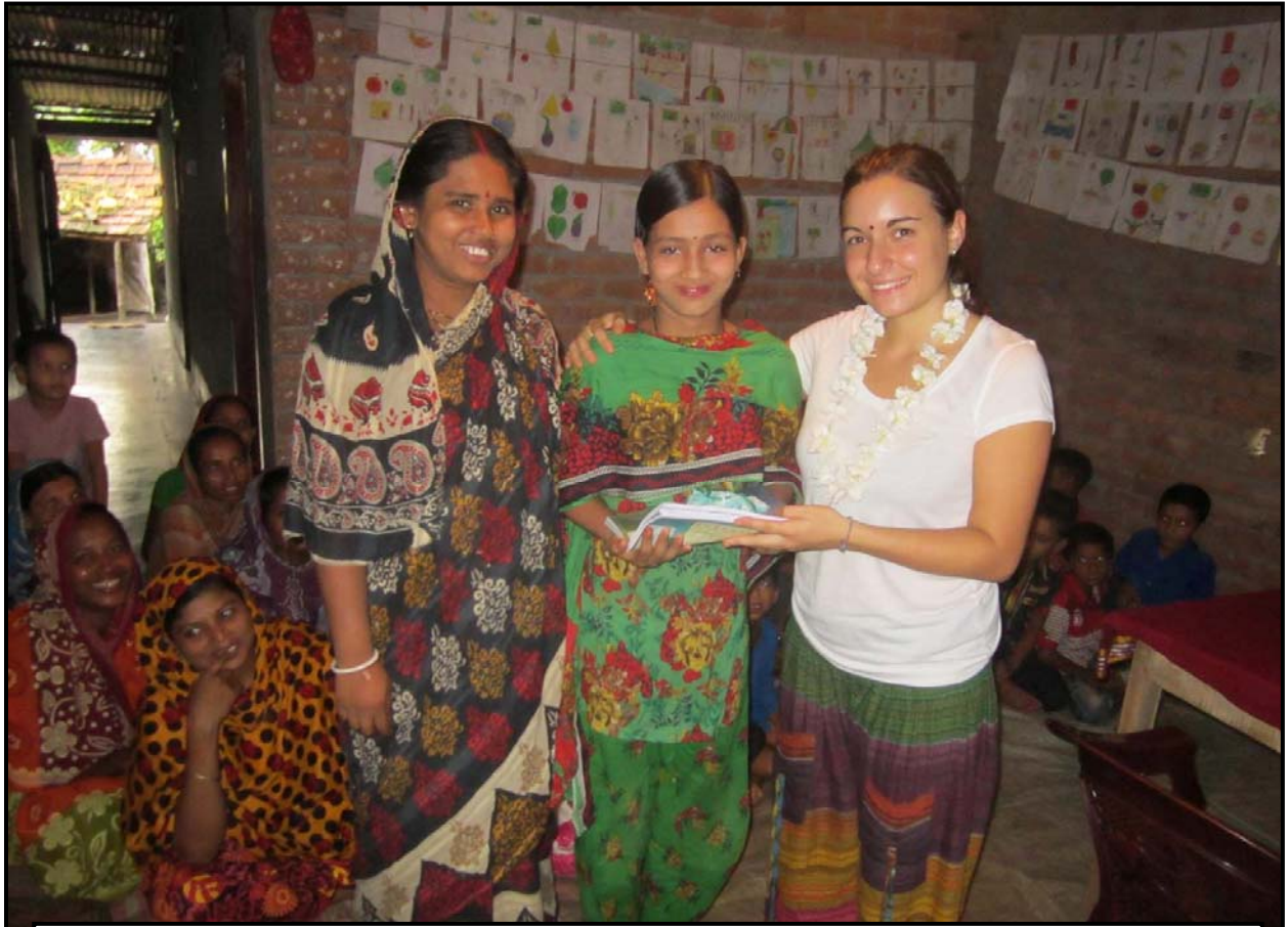
Materials Distribution: at Lolitadaho...