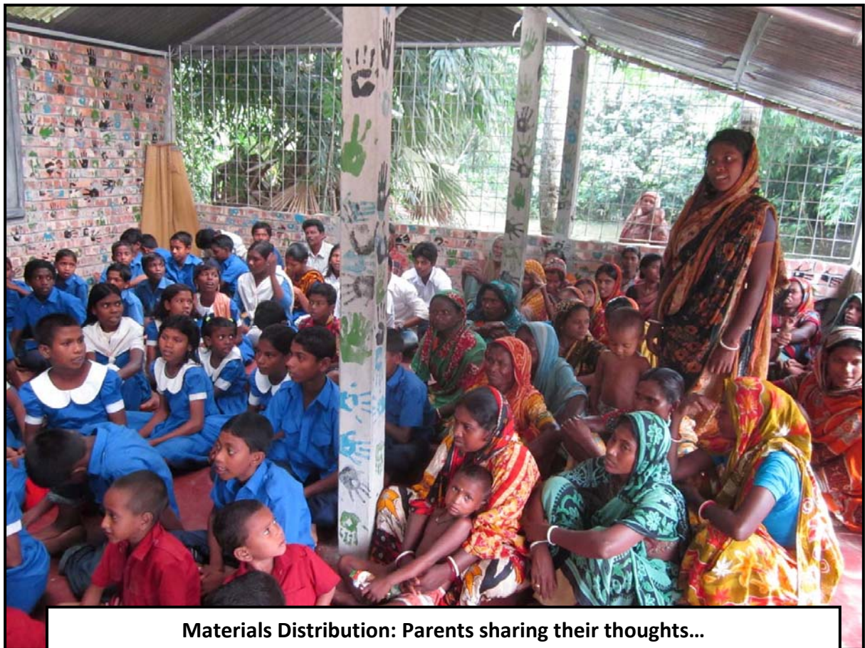
Materials Distribution: Parents sharing their thoughts...