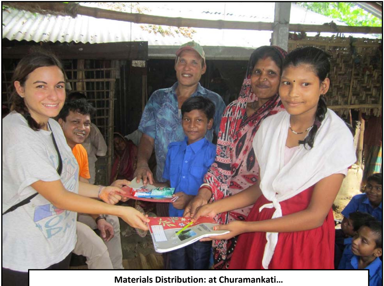
Materials Distribution: at Churamankati...