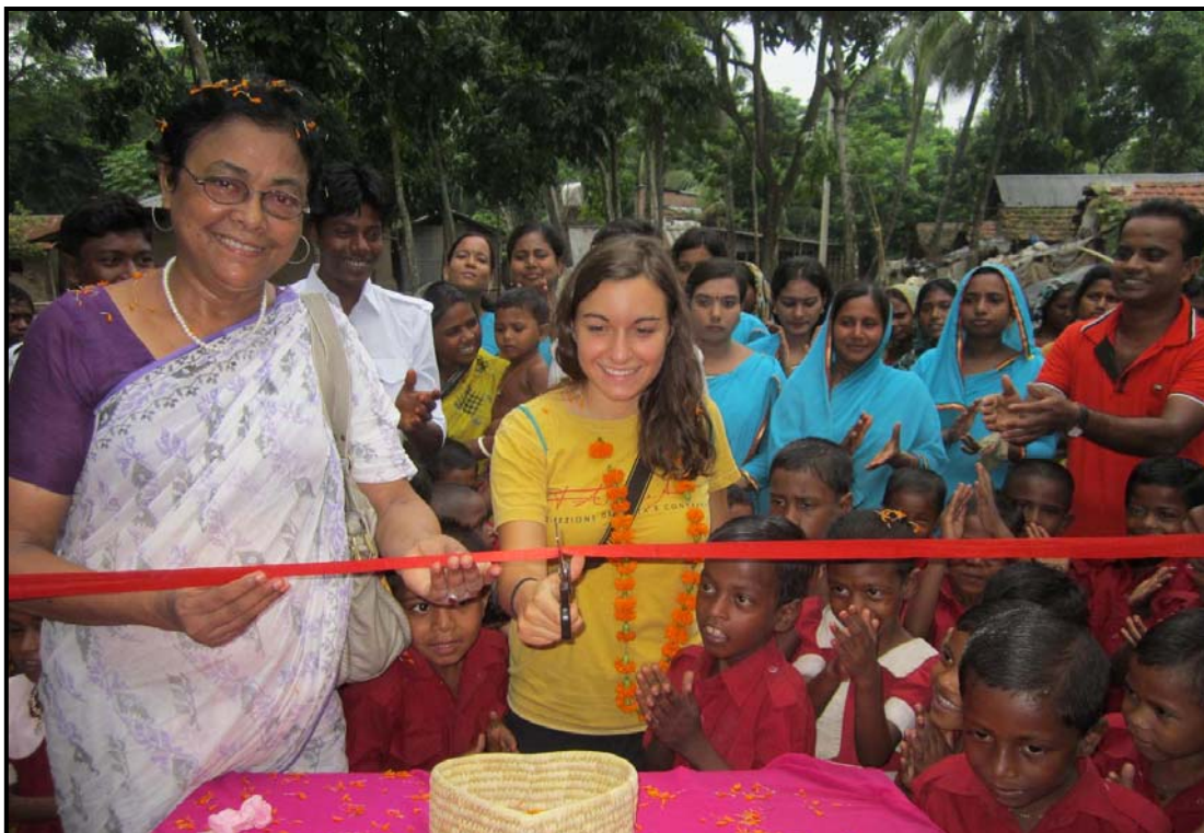
Pre-school inauguration ceremony: Happy opening...