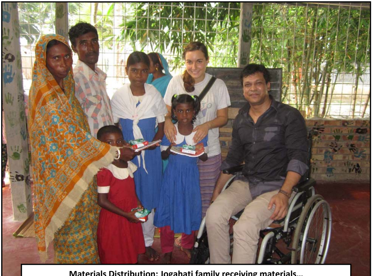
Materials Distribution: Jogahati family receiving materials...