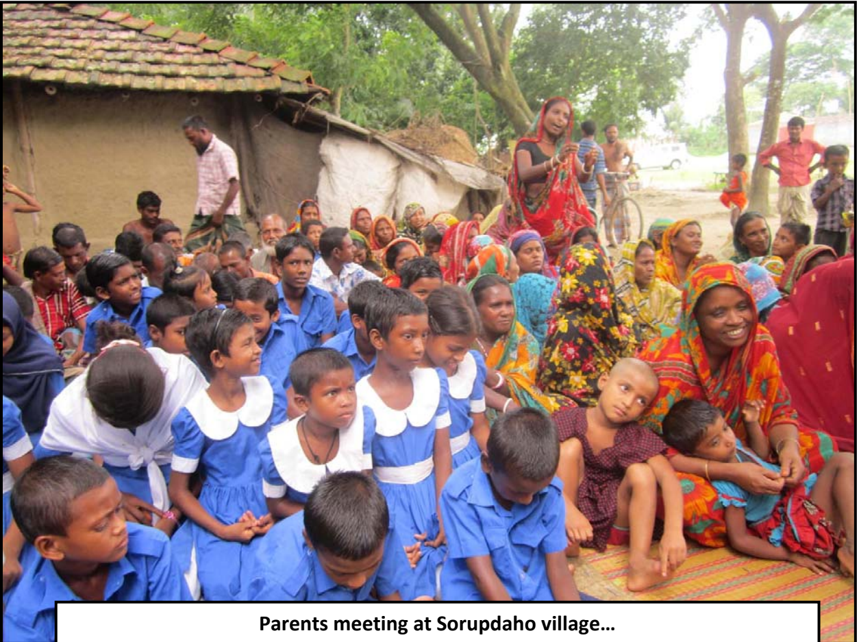
Parents meeting at Sorupdaho village...