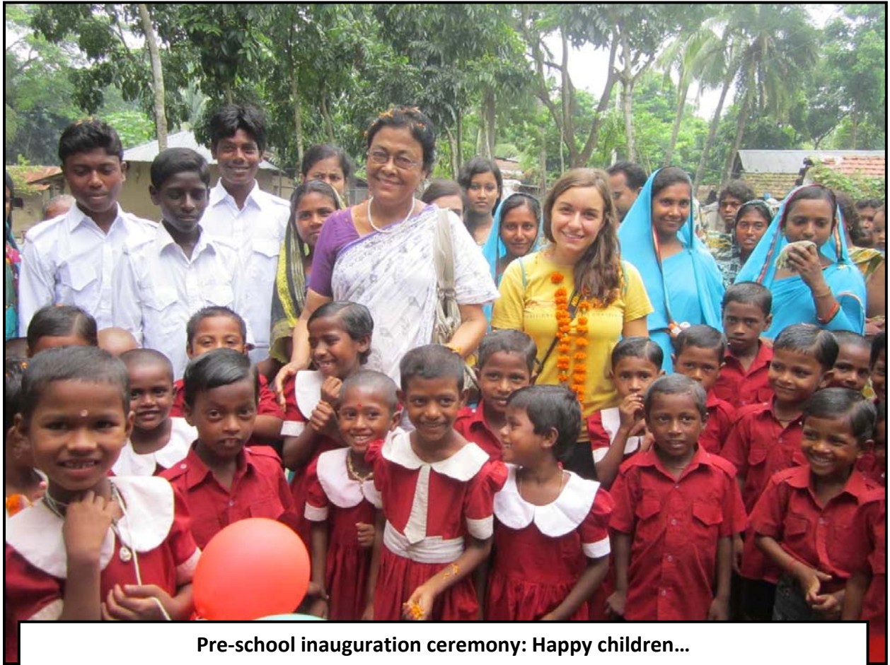
Pre-school inauguration ceremony: Happy children...