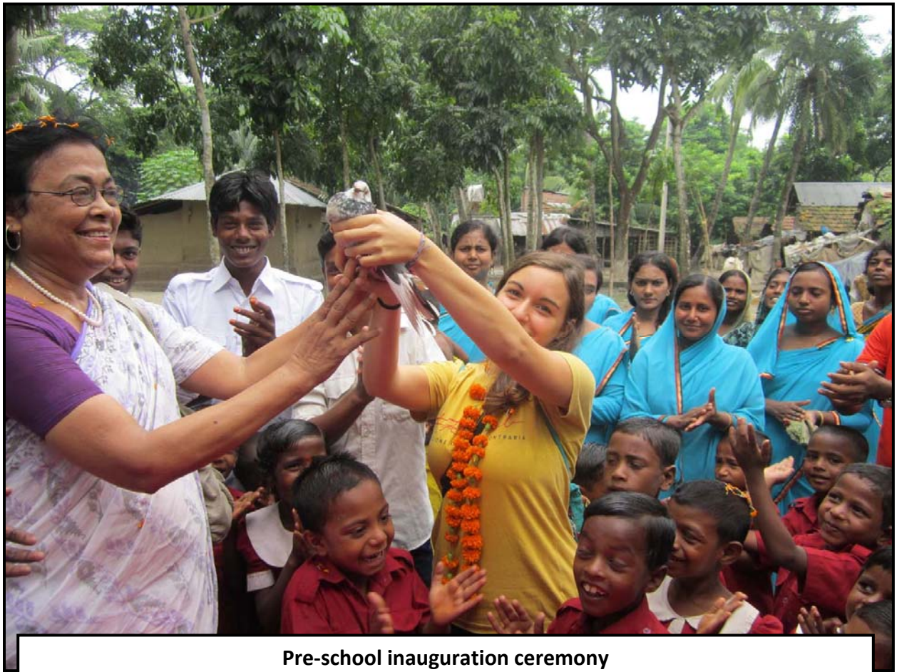
Pre-school inauguration ceremony