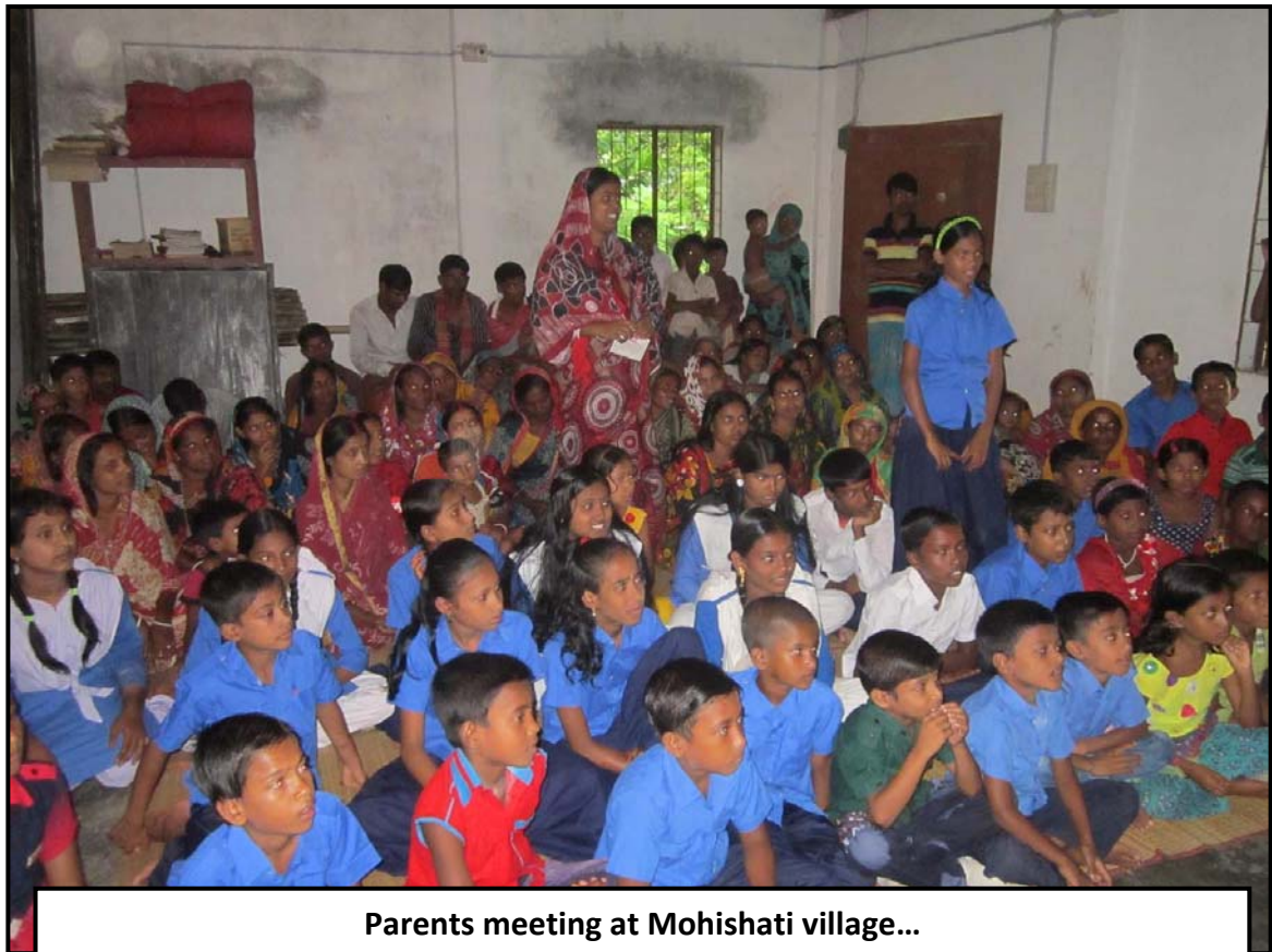
Parents meeting at Mohishati village...