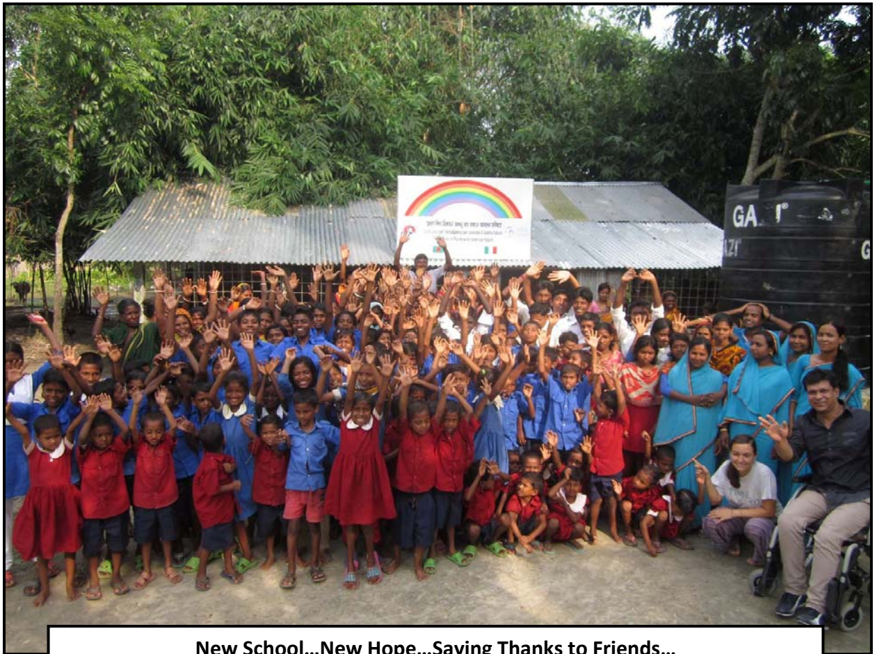
New School...New Hope...Saying Thanks to Friends...