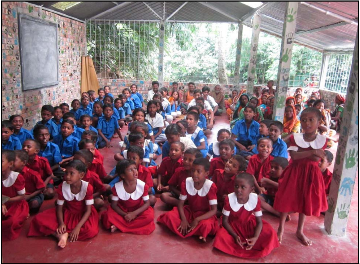
Materials Distribution: Motivational meeting session...