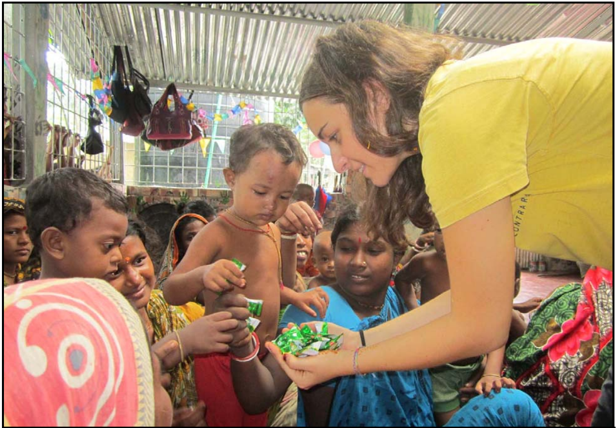
It's a sweet break...