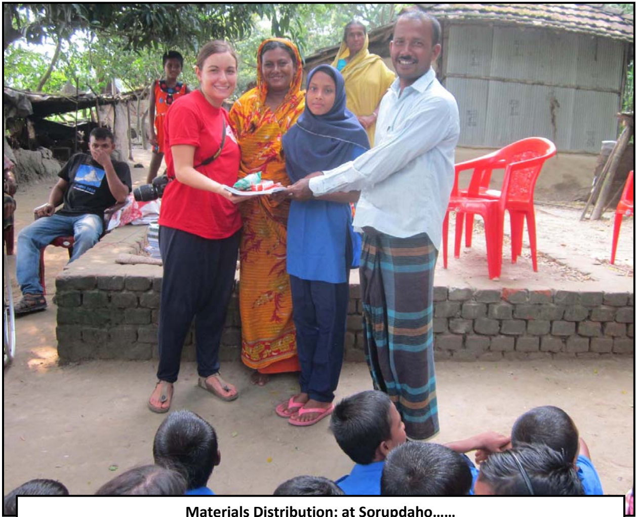
Materials Distribution: at Sorupdaho.....