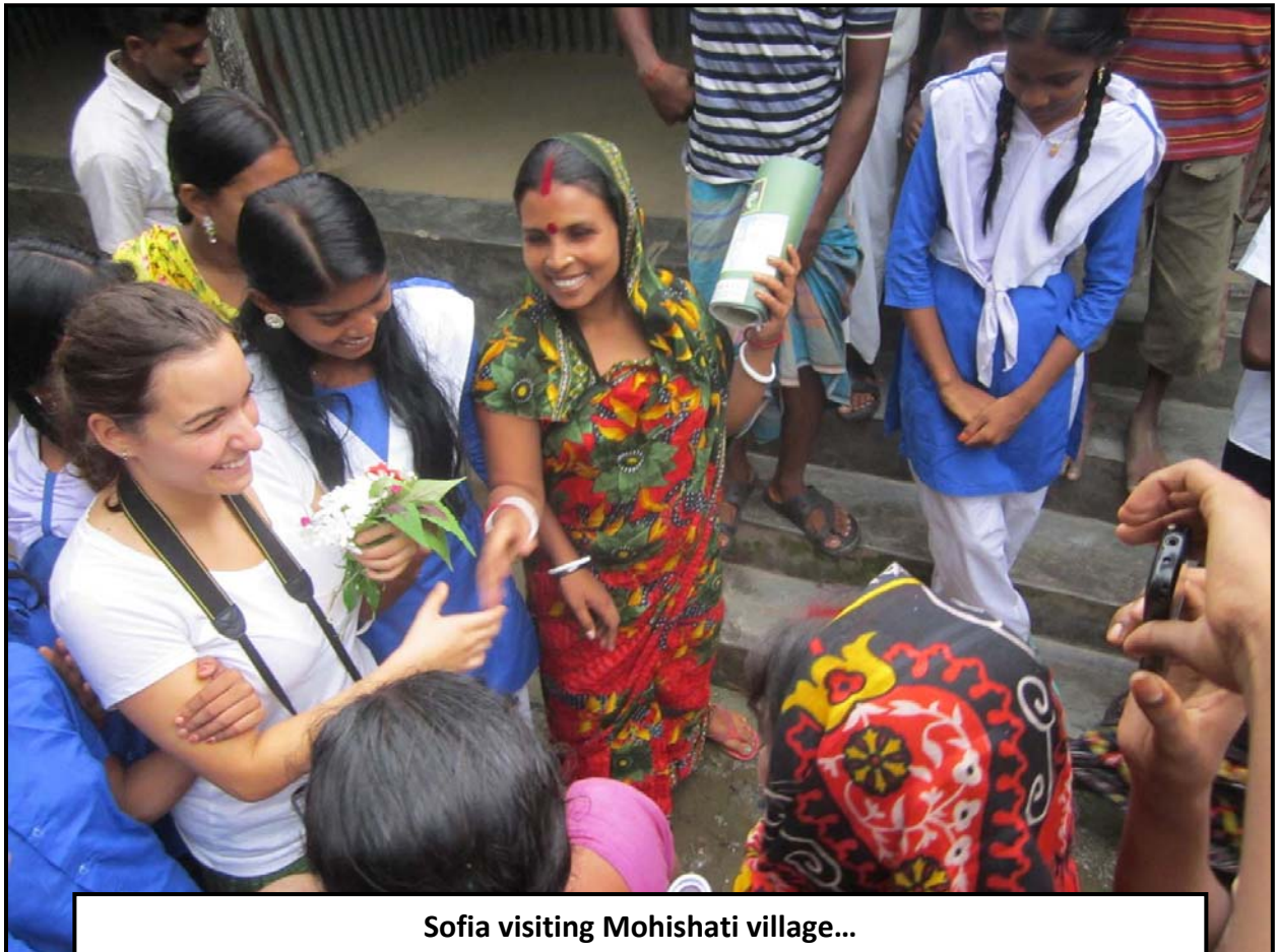
Sofia visiting Mohishati village...