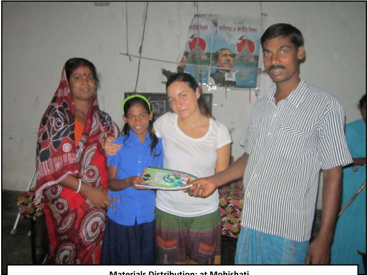
Materials Distribution: at Mohishati...