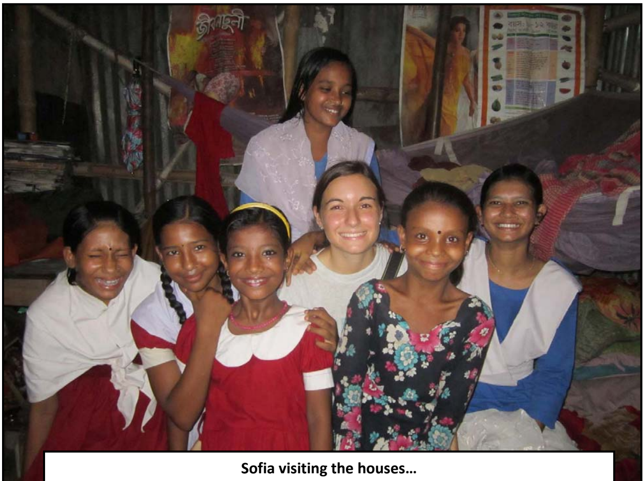
Sofia visiting the houses...