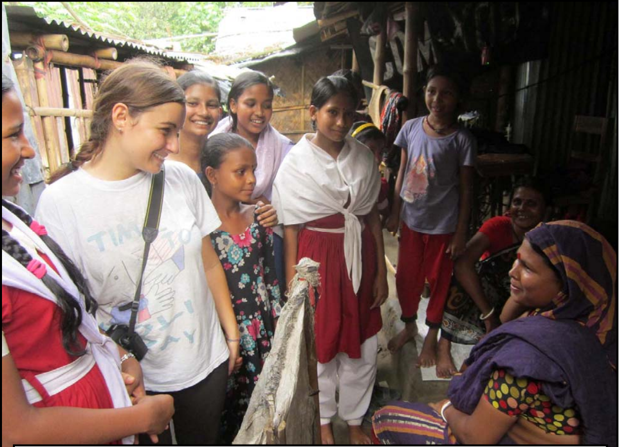
Sofia in community visit...