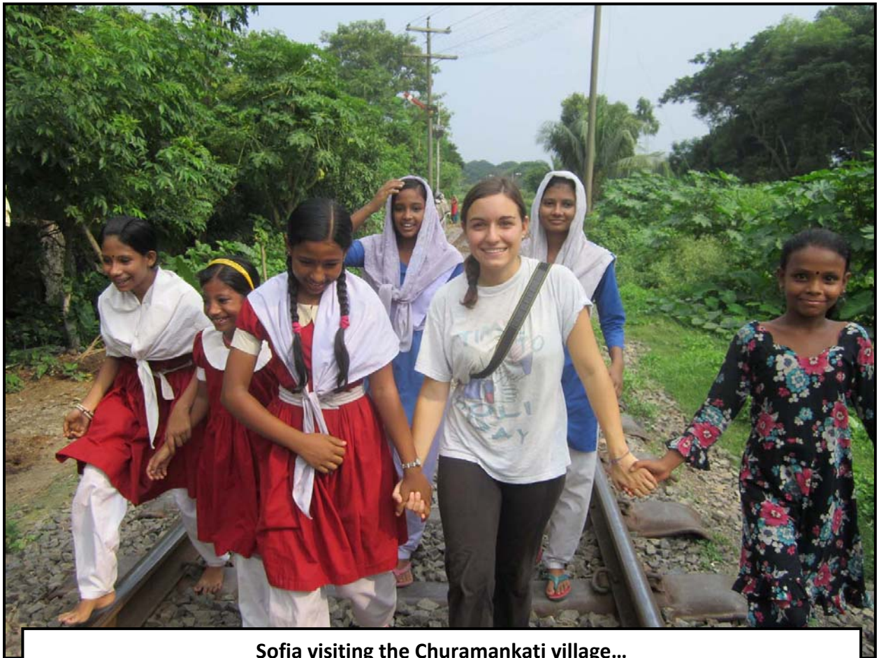
Sofia visiting the Churamankati village...