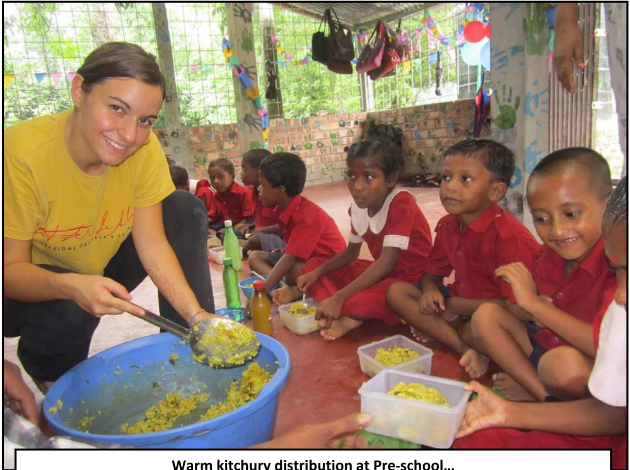
Warm kitchury distribution at Pre-school...