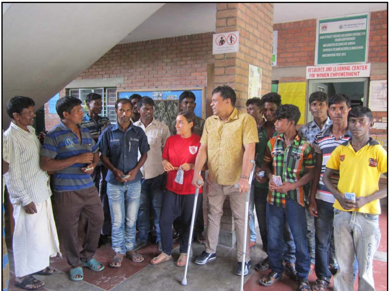
The Jogahati fish farmer with Cash Capital...