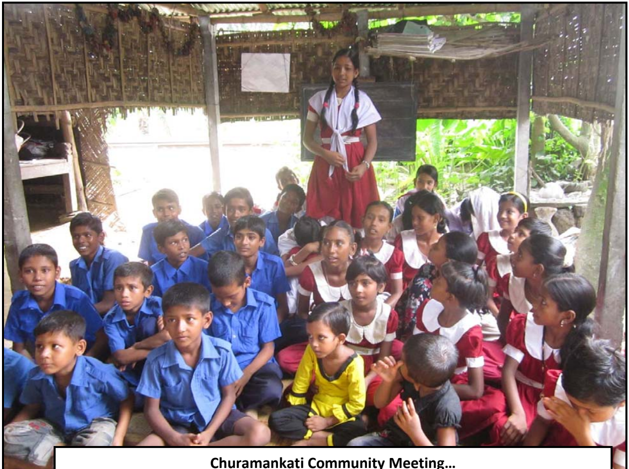
Churamankati Community Meeting...