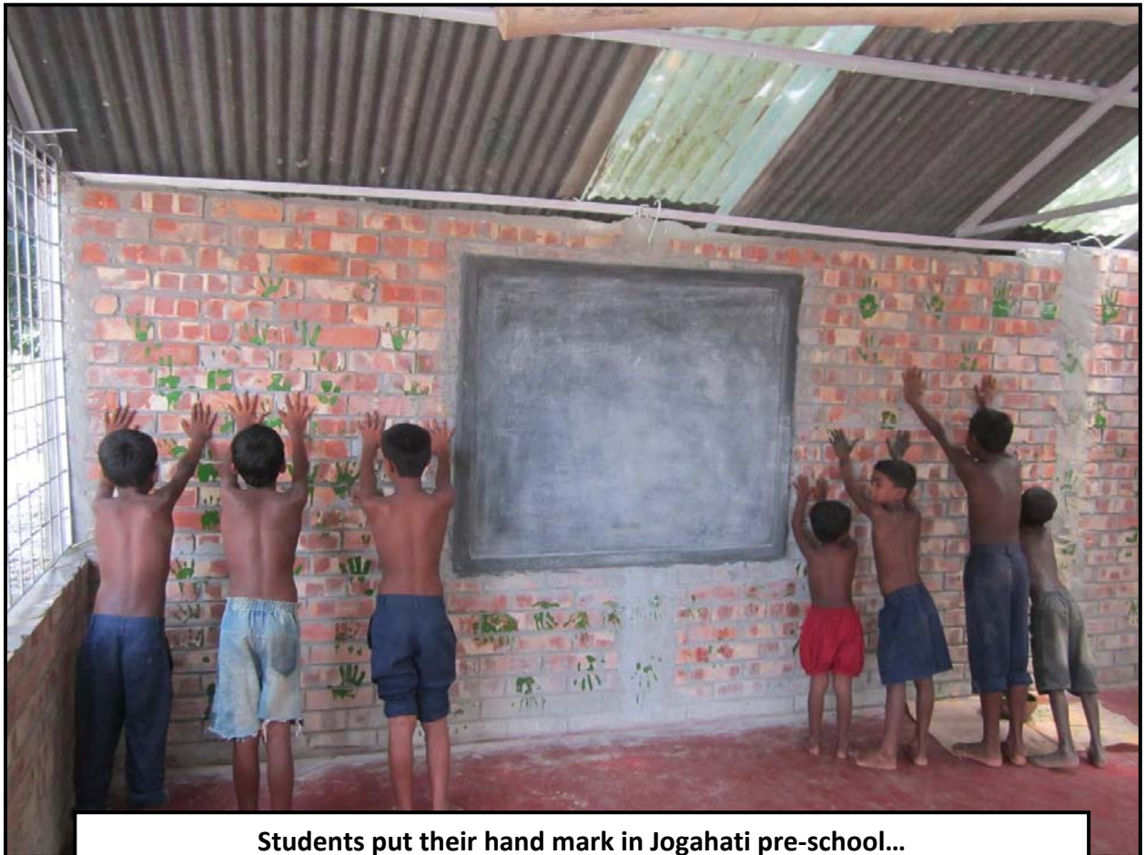
Students put their hand mark in Jogahati pre-school...