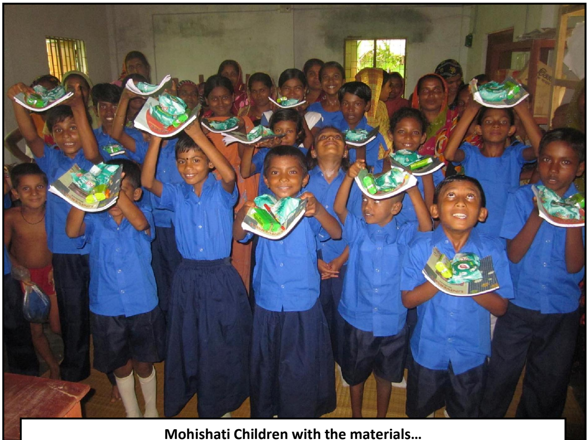
Mohishati Children with the materials...