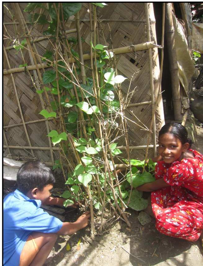
Sorupdaho children in Kitchen Gardening...