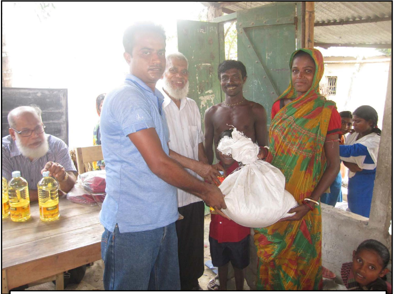
Materials distribution programme at Jogahati...