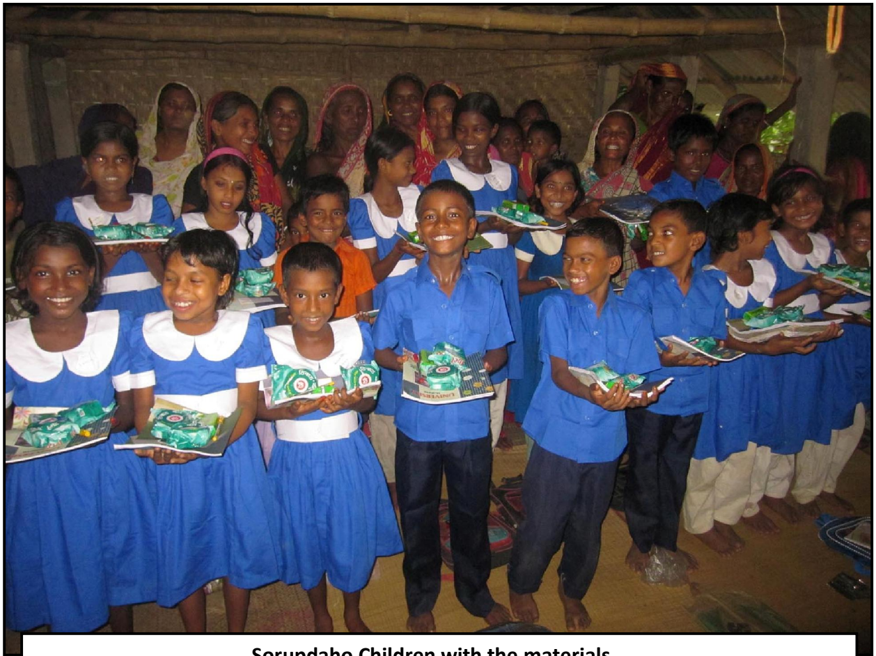
Shorupdaho Children with the materials...