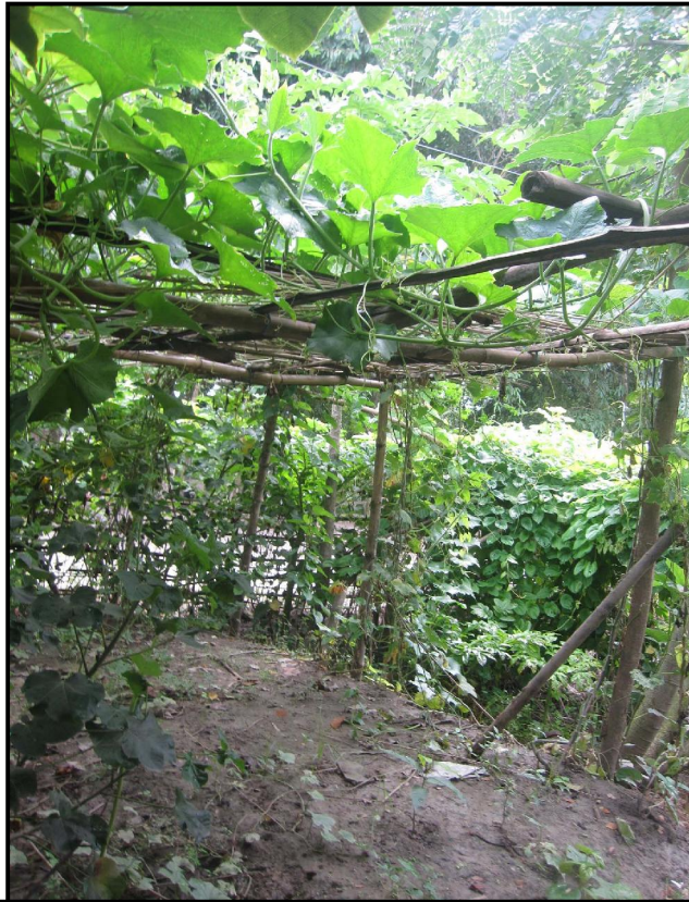
Churamankati Kitchen Gardening.....