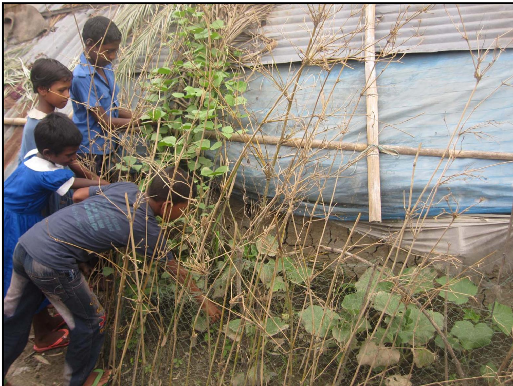
Jogahati children in Kitchen Gardening...