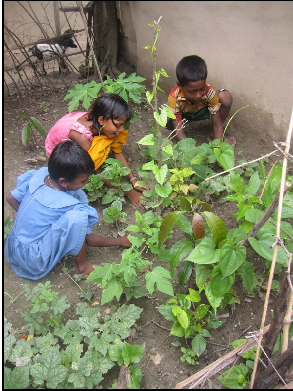
Sorupdaho children in Kitchen Gardening...