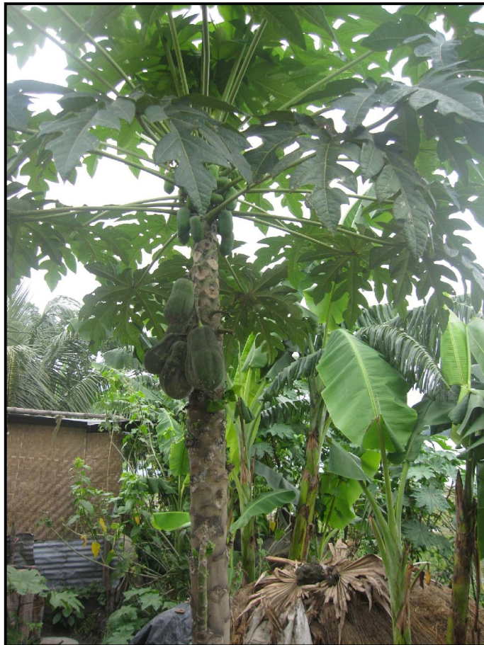
Papaya tree in Jogahati Village...