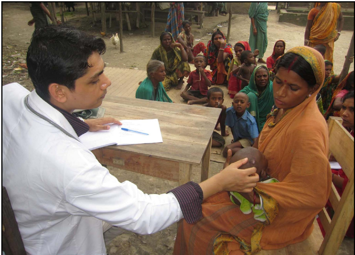
Medical Camp at Jogahati...