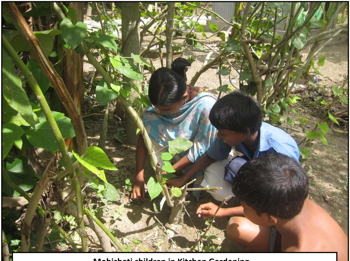
Mohishati children in Kitchen Gardening...