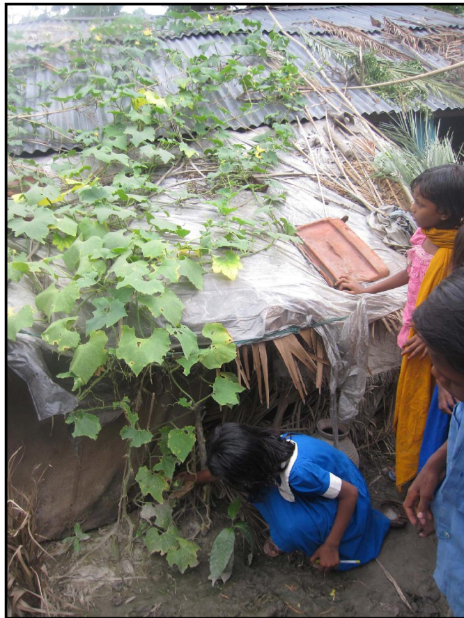
Jogahati children in Kitchen Gardening...