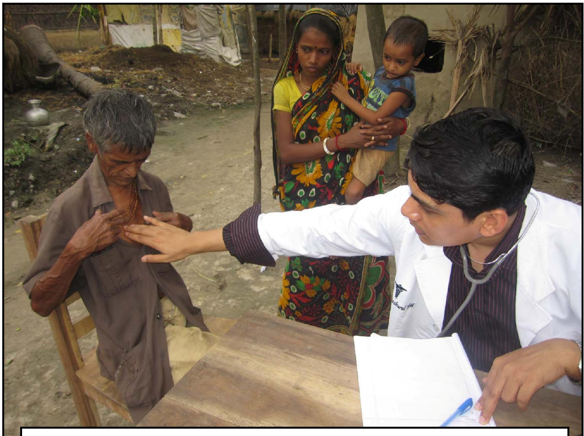
Medical Camp at Jogahati...