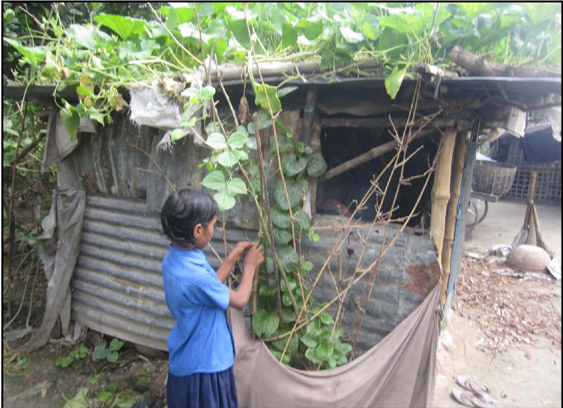
Jogahati children in Kitchen Gardening.....