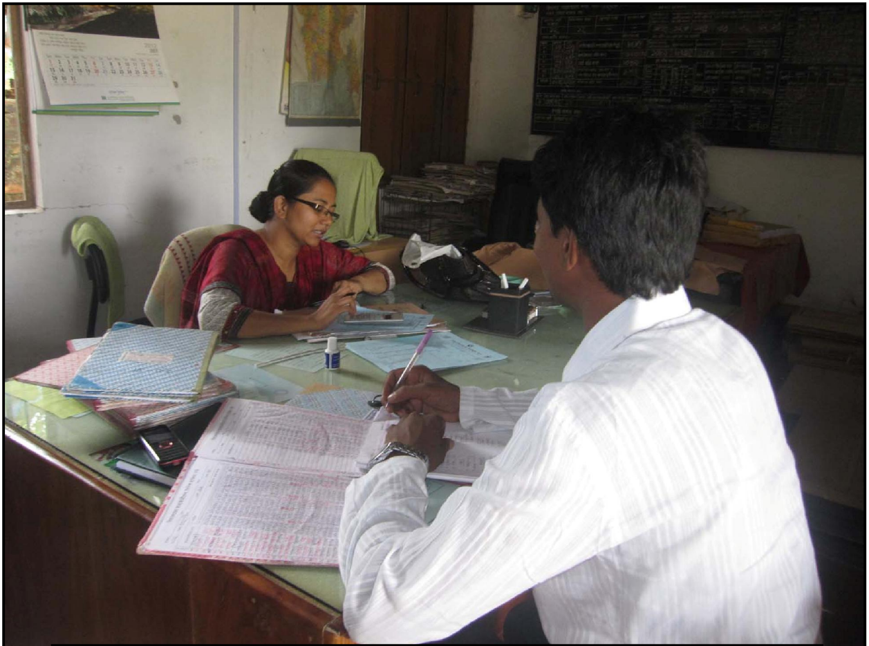
Community Motivator collecting monthly school attendance report...