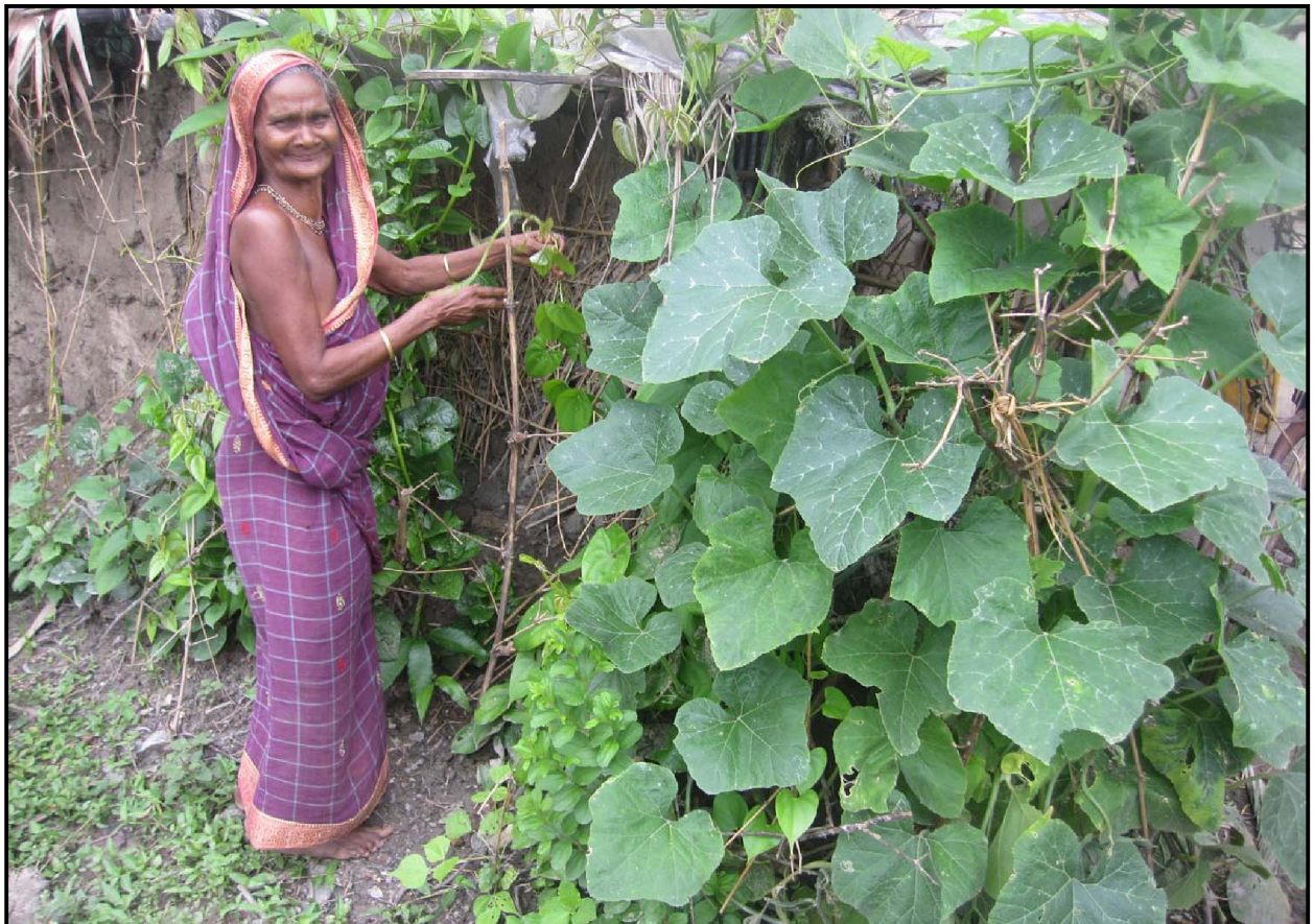
Chonda (BS0022) mom taking care Kitchen Garden plant in Jogahati village...