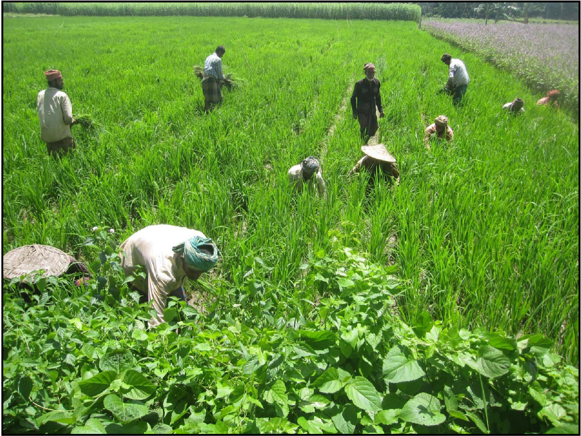
Rice plantation at the community...