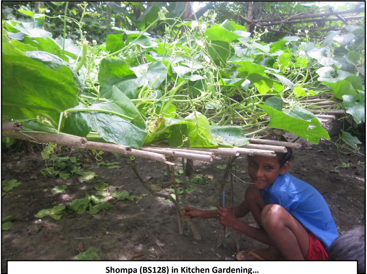
Shompa (BS128) in Kitchen Gardening...