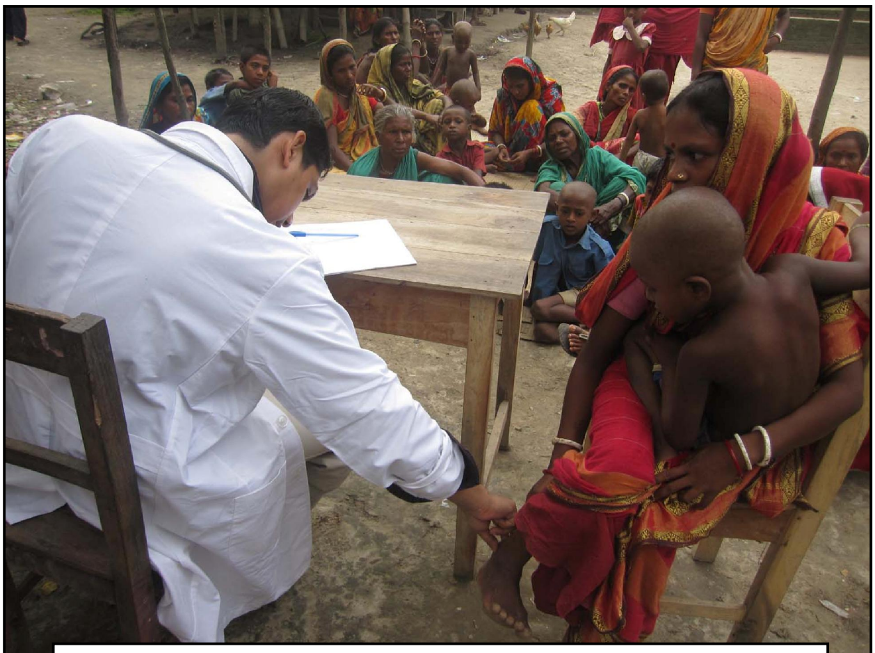
Medical Camp at Jogahati...