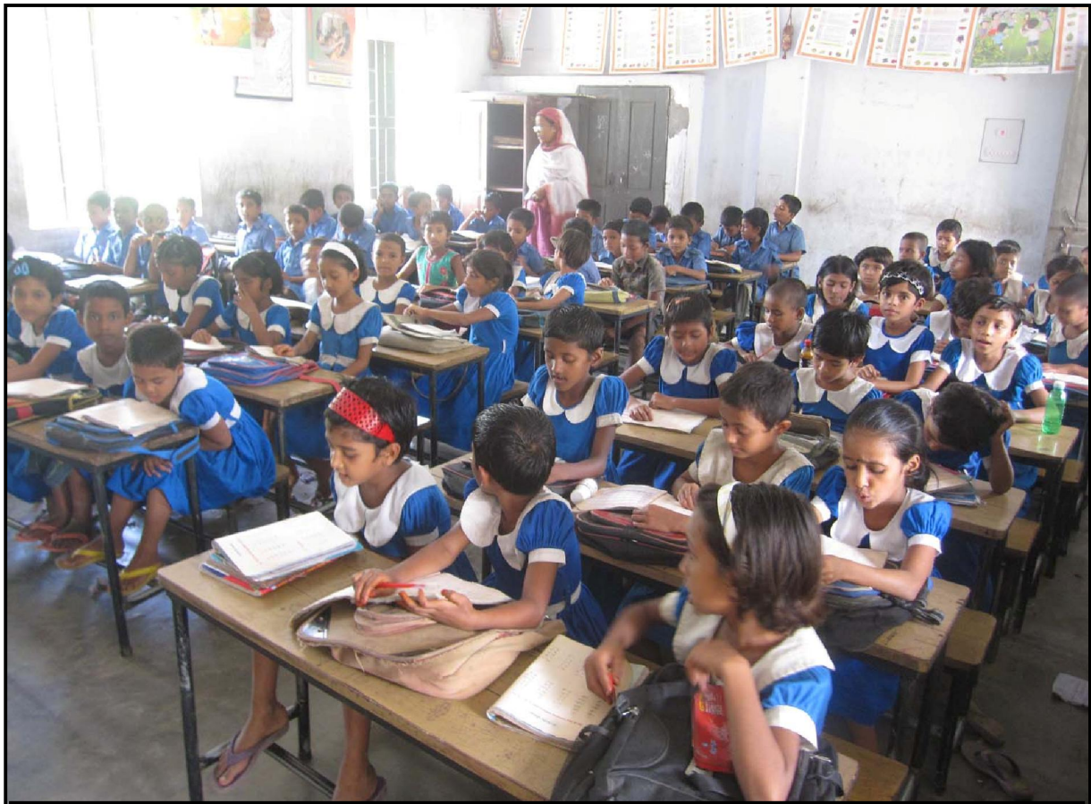
Shorupdaho Govt. Primery School Class room...