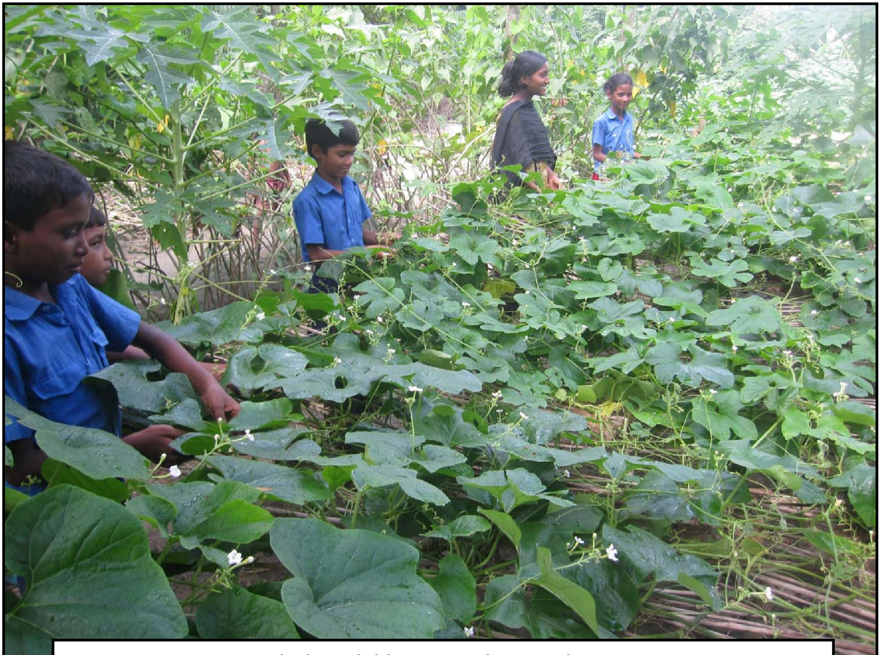
Mohishati children in Kitchen Gardening...