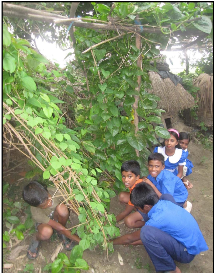
Shorupdaho children taking care of the Kitchen Garden...