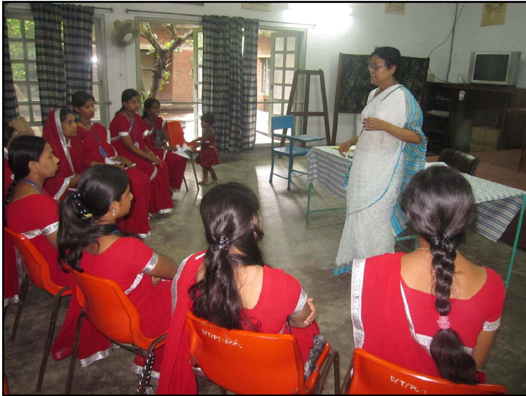
Tuition Teachers Monthly Coordination Meeting...