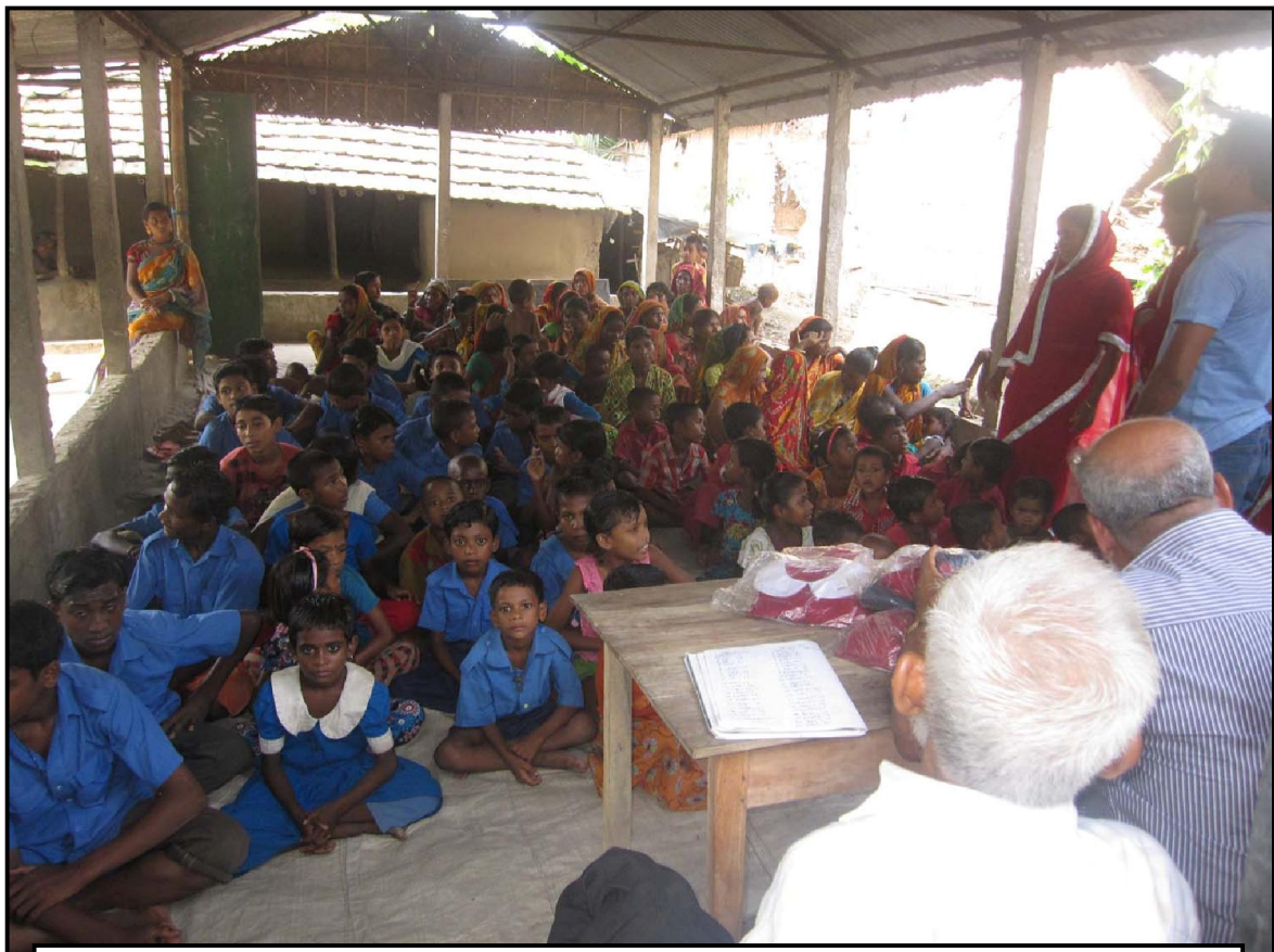
Materials distribution programme at Jogahati...