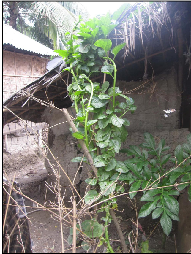
Basella alba or Malabar spinach plant in Jogahati village Kitchen Garden...