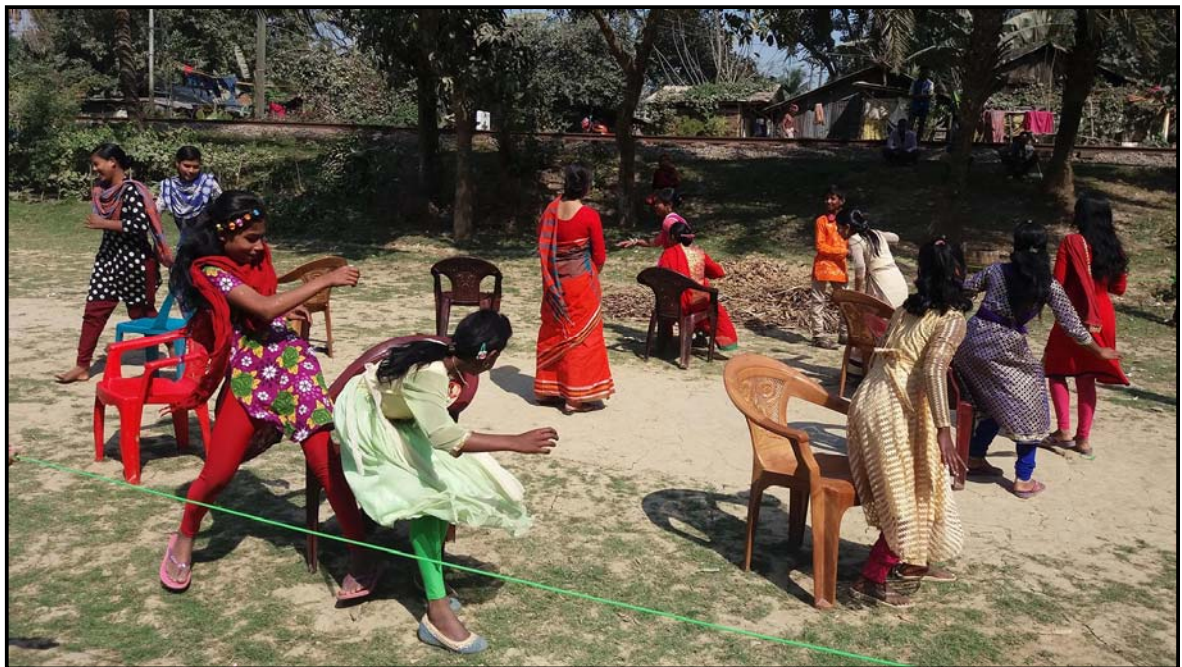
Annual Picnic: Annual Picnic: Students enjoying the musical chair sitting games.....