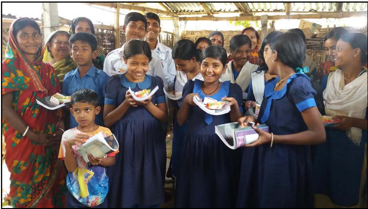
Churamankati students with the materials...