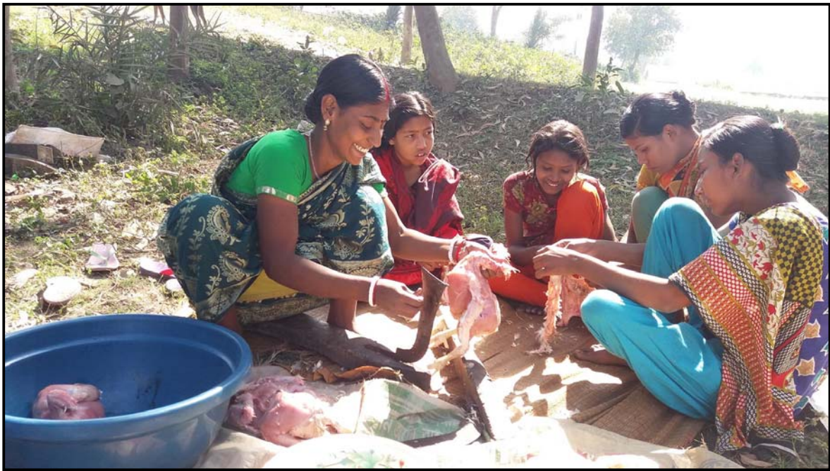
Parents and students together preparation for picnic...