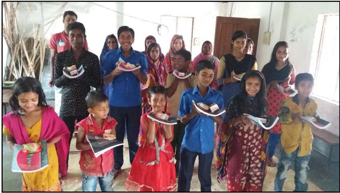
Mohishati students with the materials...