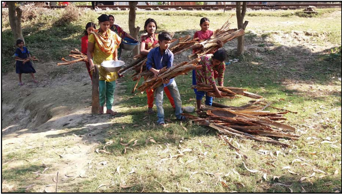
Picnic preparation at Churamankati village...