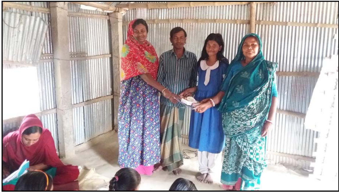
Distribution programme at Lolitadaho village...