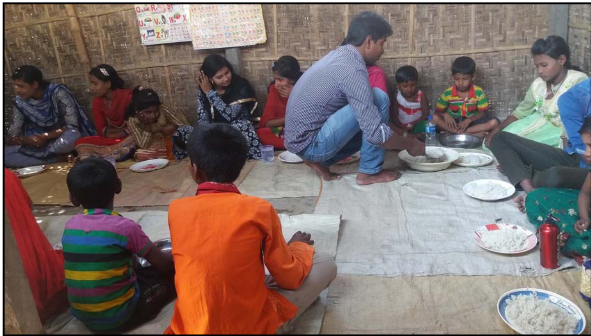
Annual Picnic: Taking lunch together at Sorupdaho...