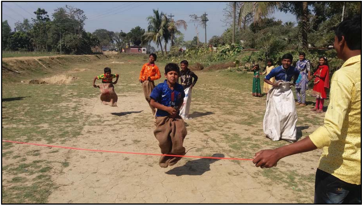
Annual Picnic: Students enjoying the sack race...