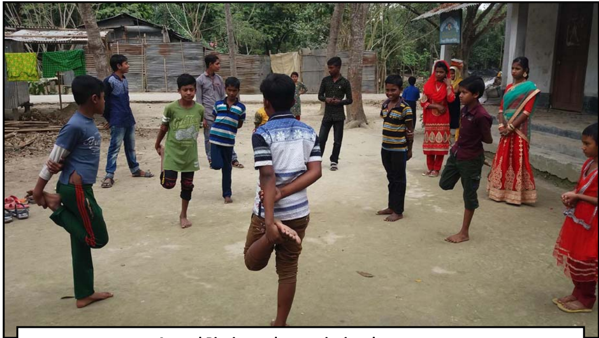
Annual Picnic: students enjoying the games...