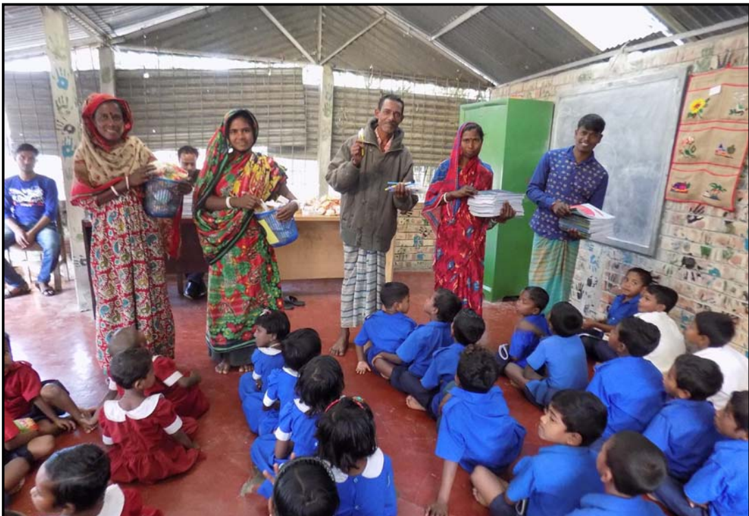
Committee members distributing materials to the students at Jogahati...