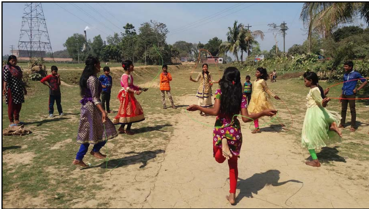
Annual Picnic: Students enjoying the games...