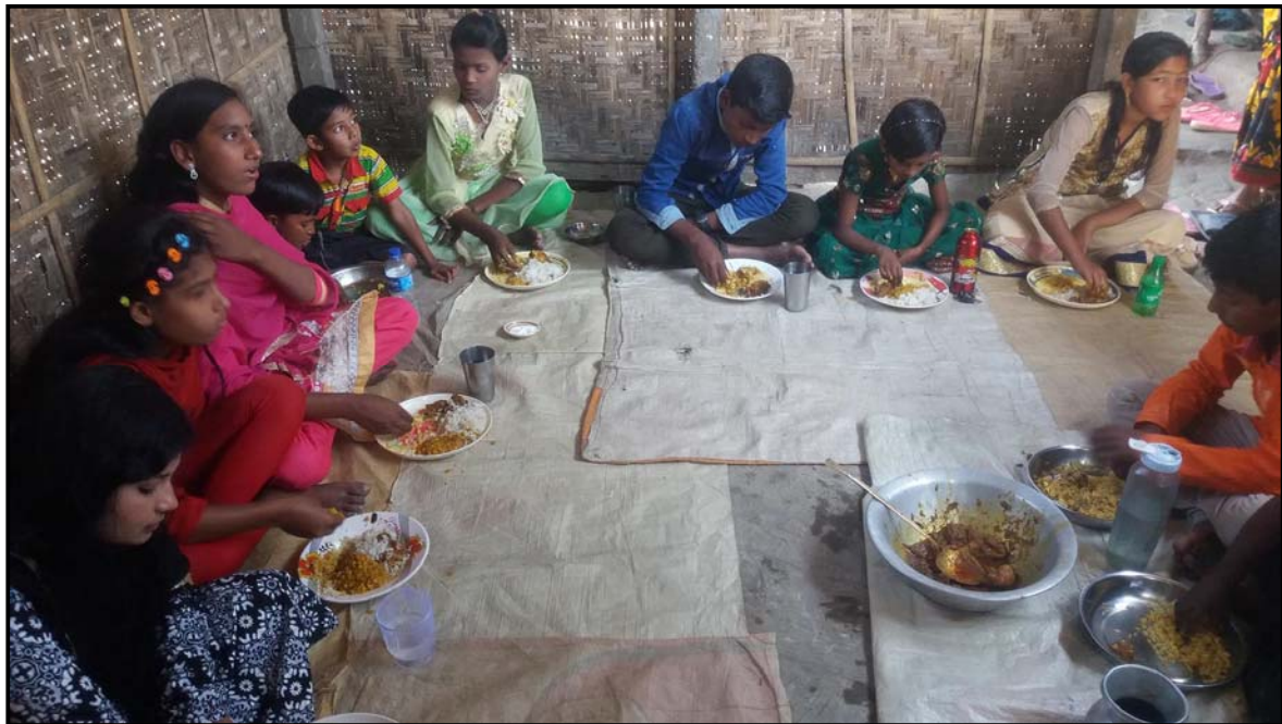
Annual Picnic: Students enjoy the meal together...