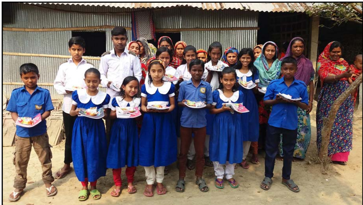
Happy students with the materials...