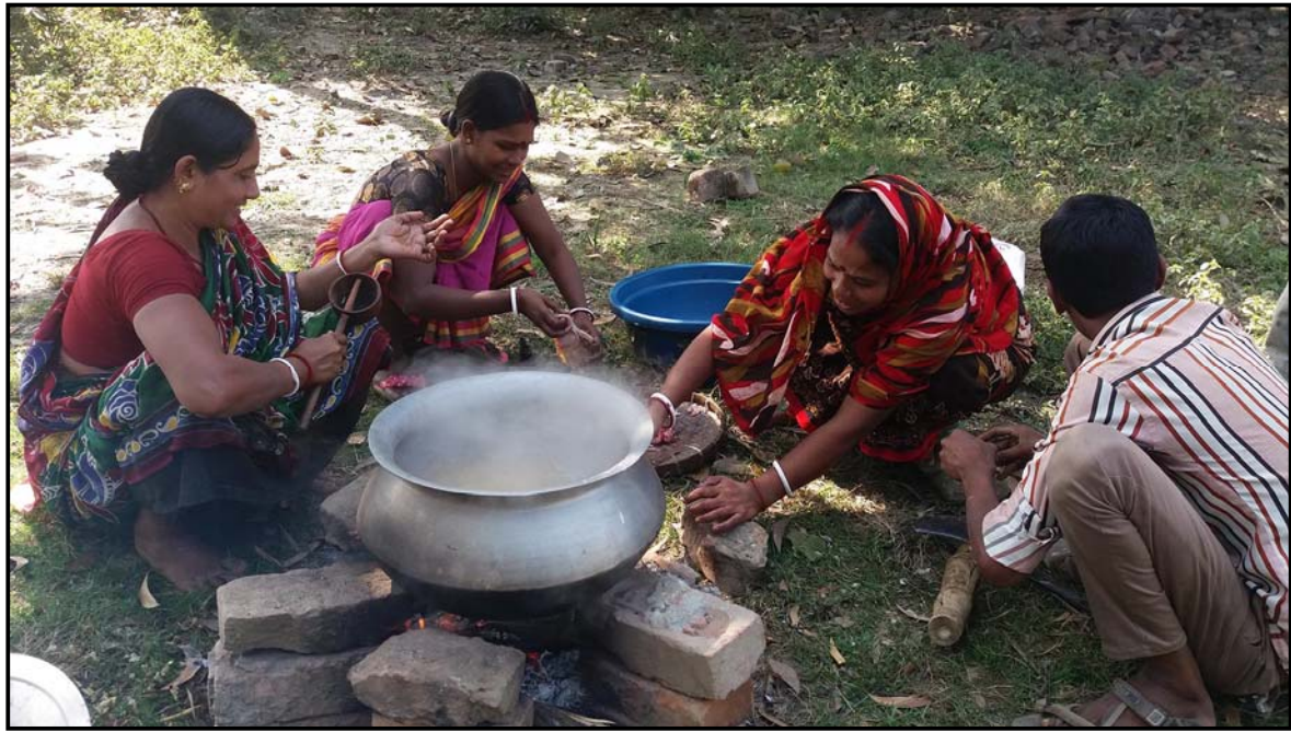
Annual Picnic: Parents cooking the meal...