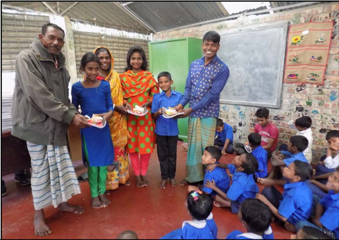
Materials distribution programme at Jogahati village..