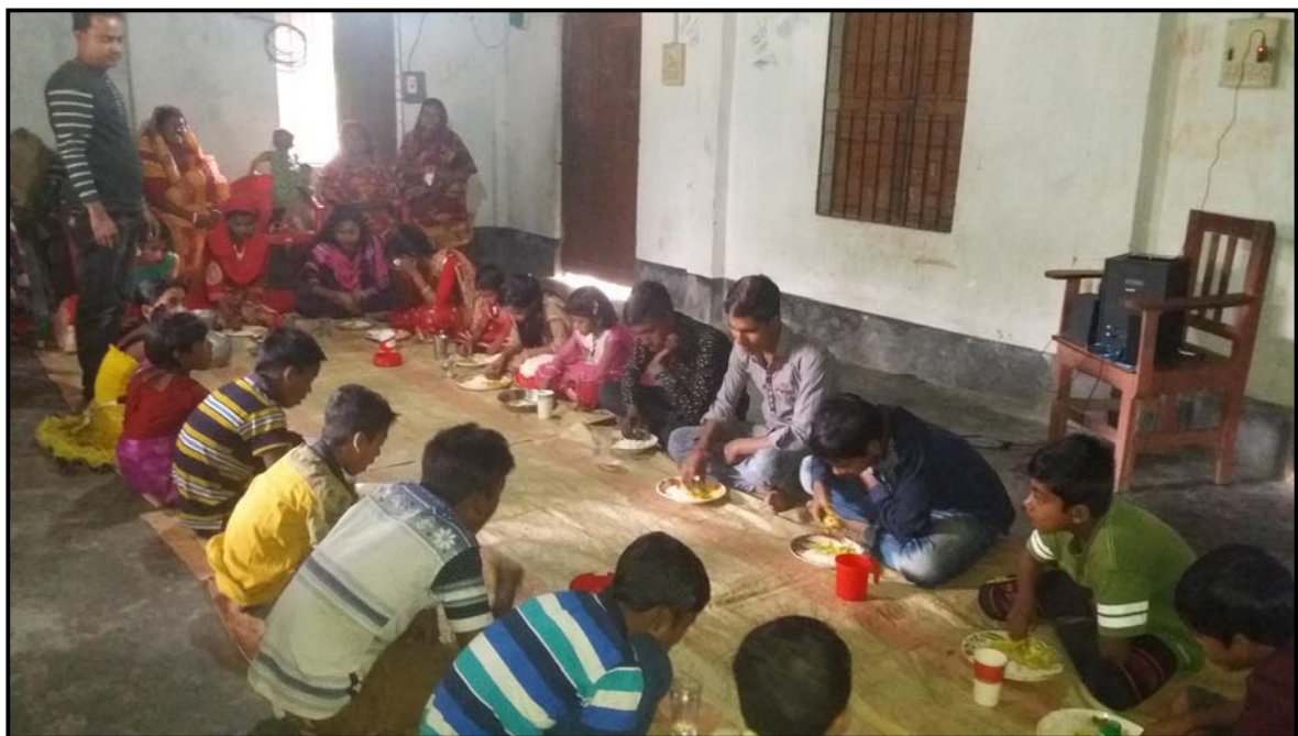
Annual Picnic: lunch together at Mohishati village...