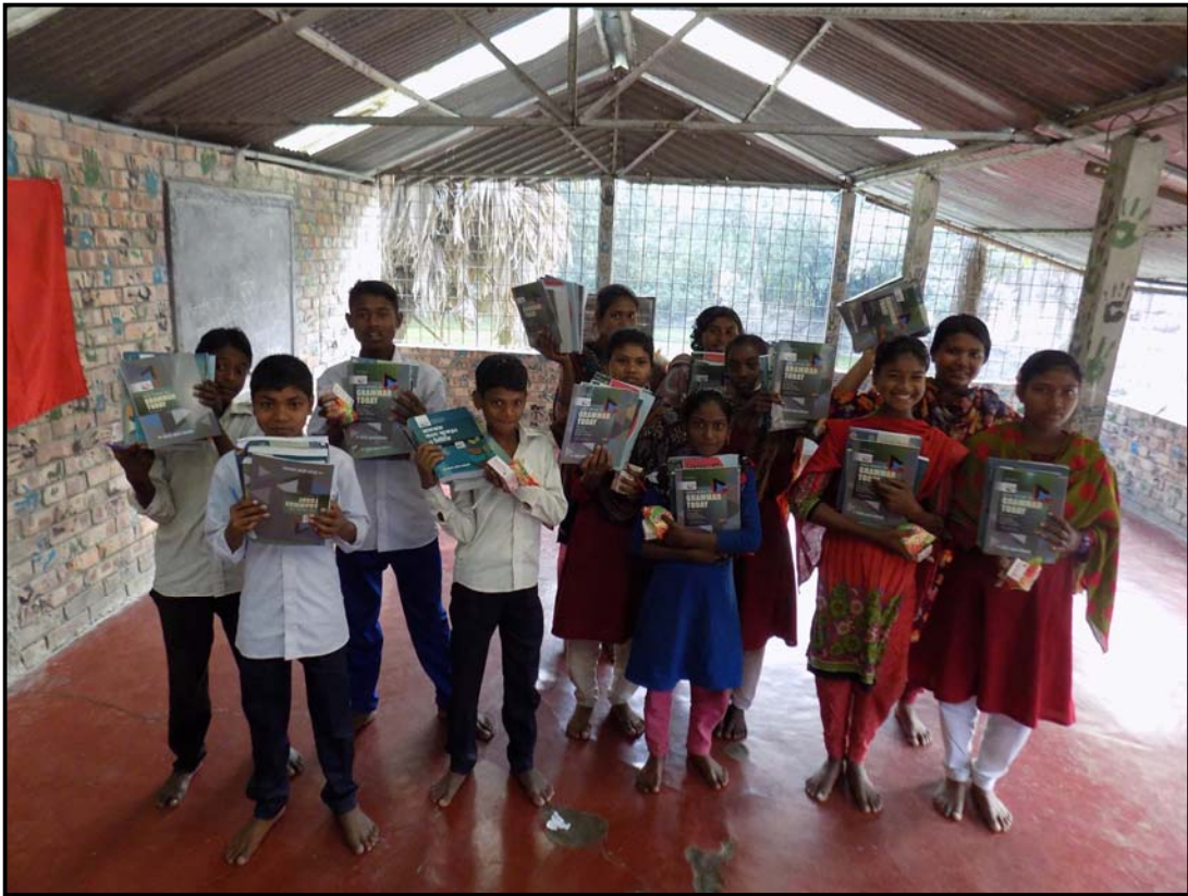
We distributed books to high school students...