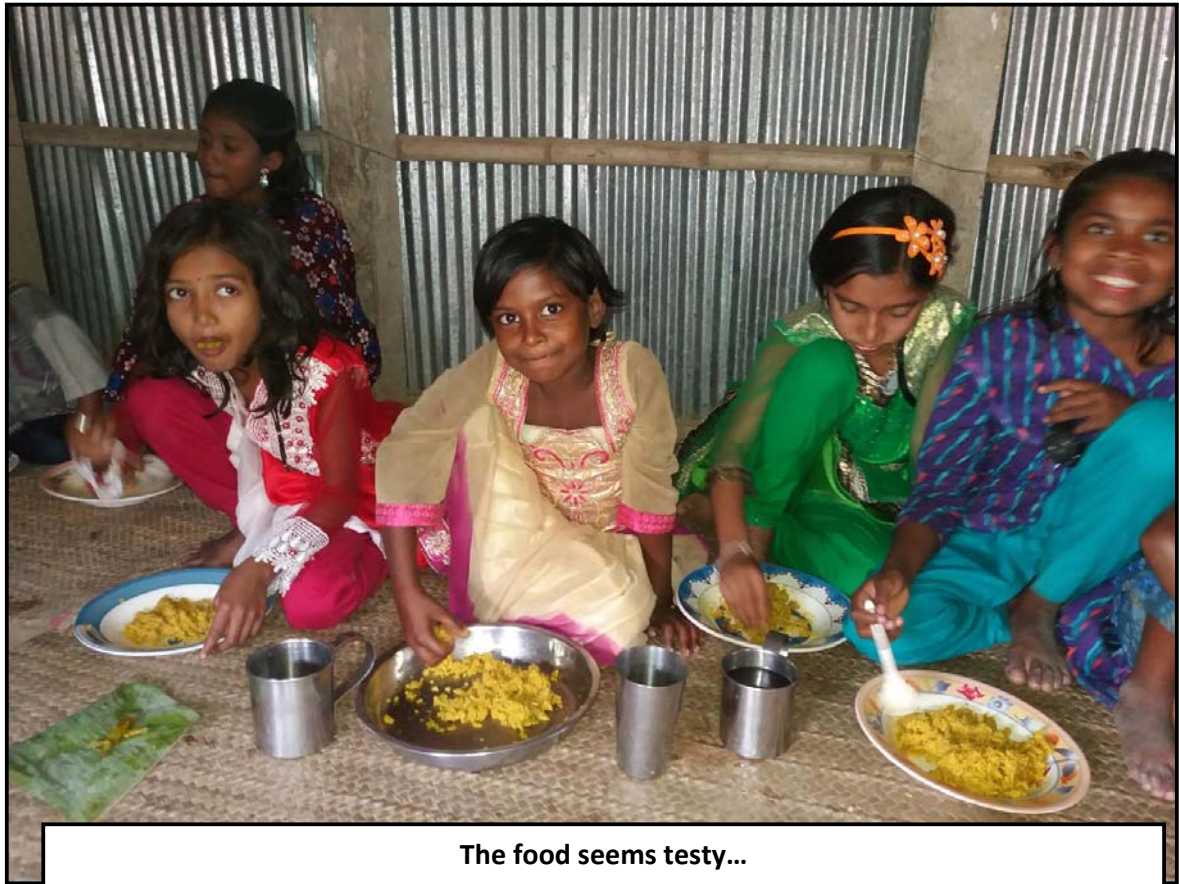
The food seems tasty...