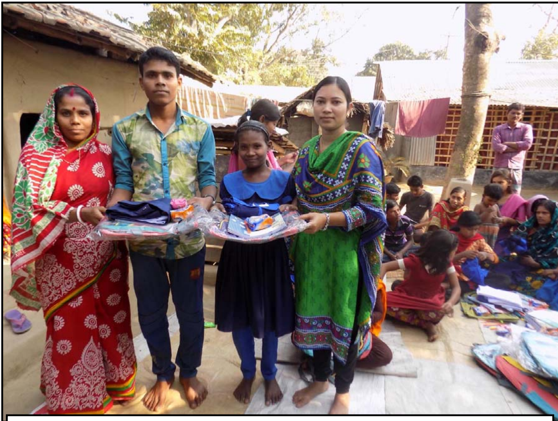
Materials distribution at Churamankati village...