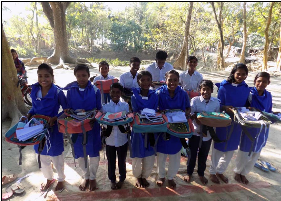
The Mohishati students with new bags, dress and materials...