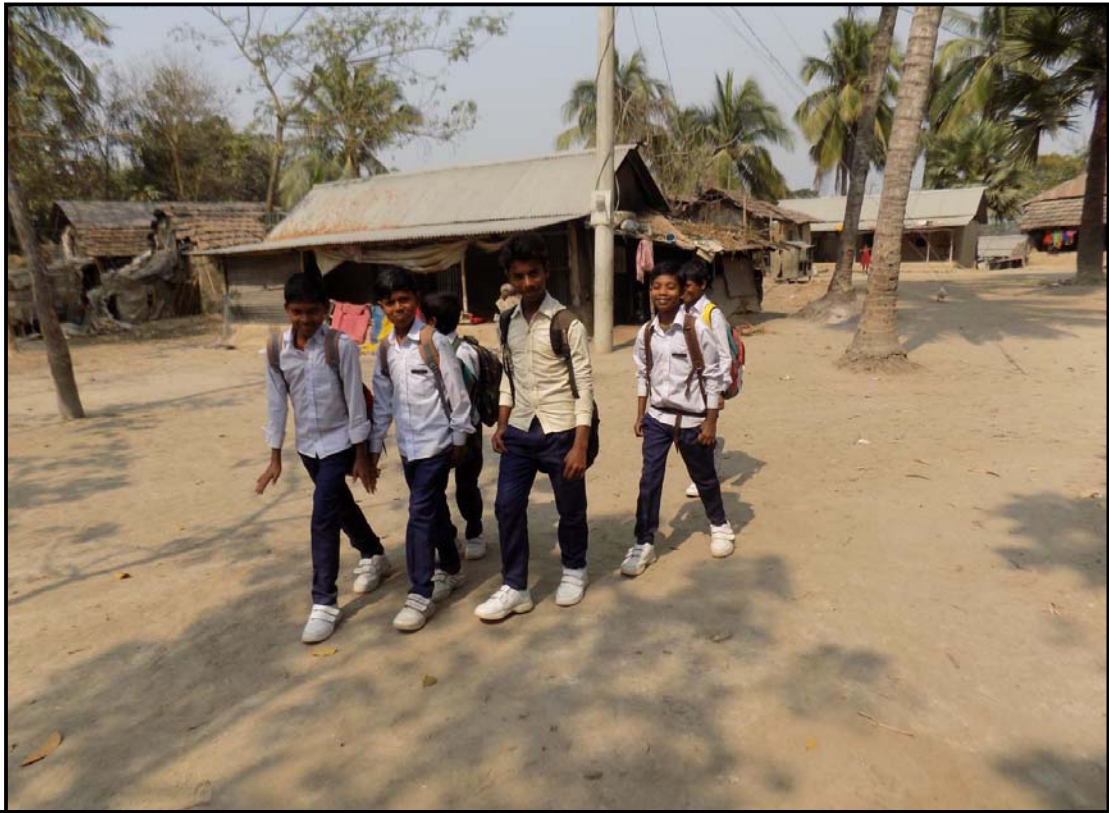
Students going to school with new school shoes, bags & dress...