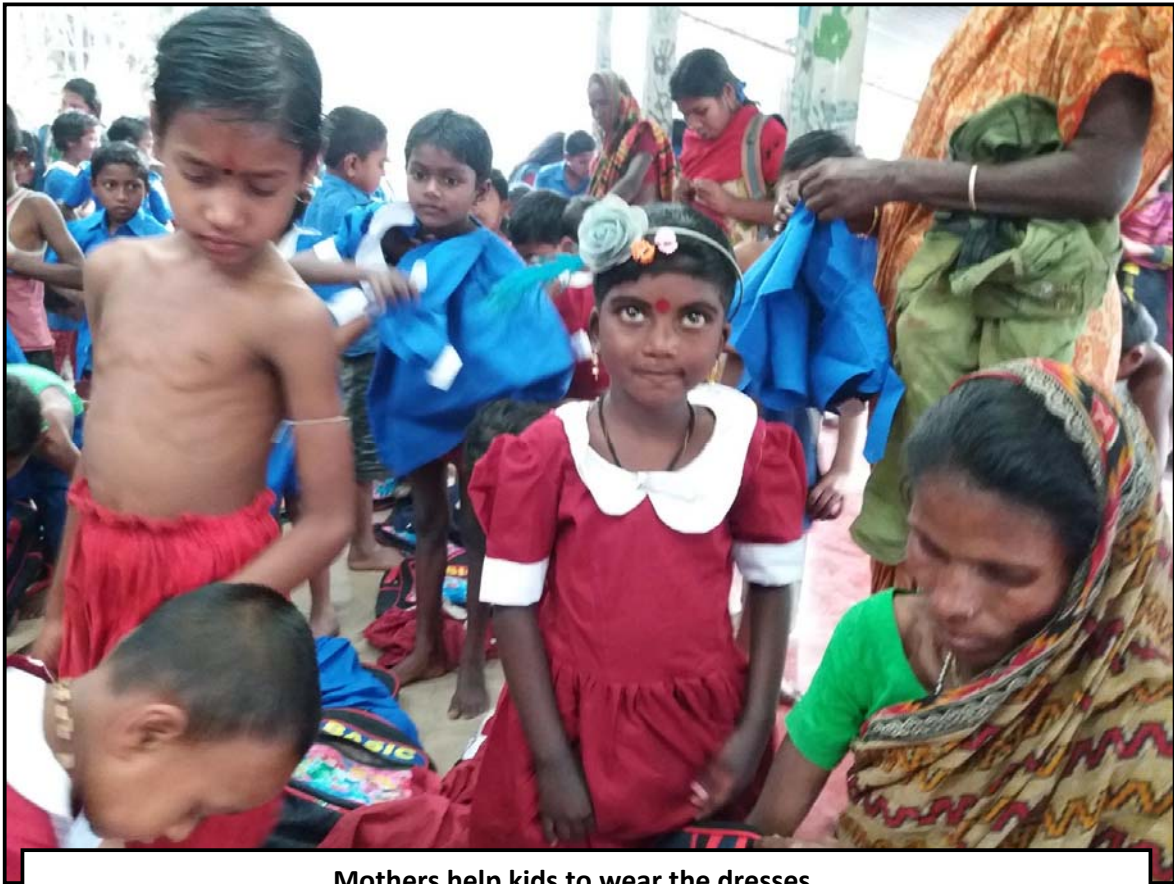
Mothers help kids to wear the dresses....