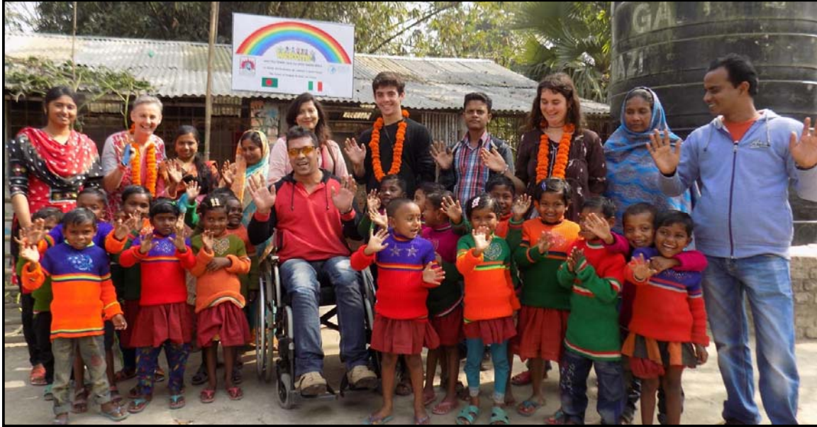
Australian friends and kids...