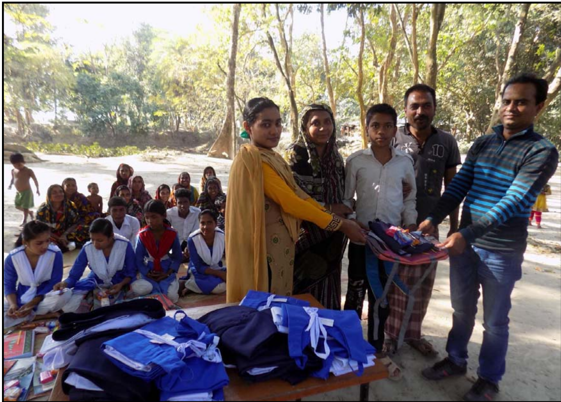
Materials distribution at Mohishati village...