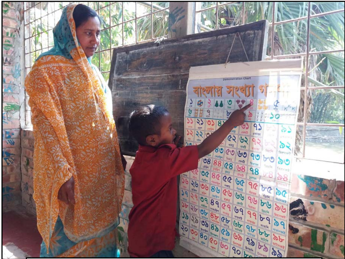
Learning the Bangla numbers in preschool...