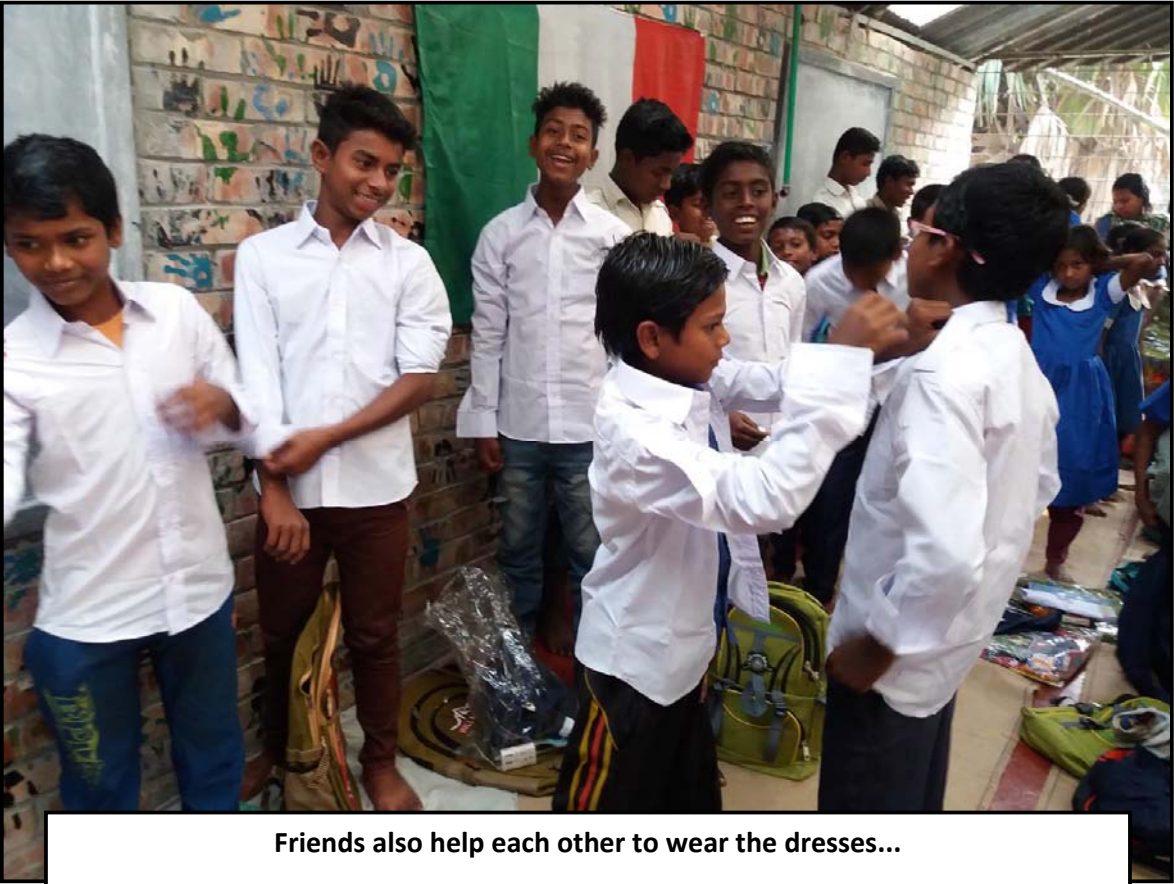
Friends also help each other to wear the dresses...