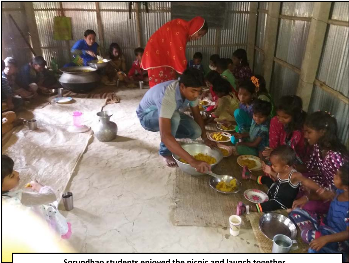
Sorupdhao students enjoyed the picnic and launch together...