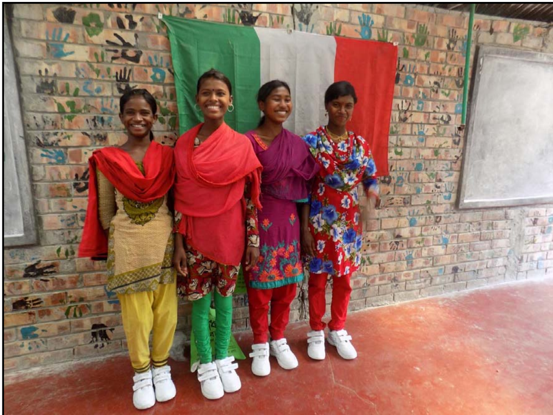
Very happy girls with new school shoes...