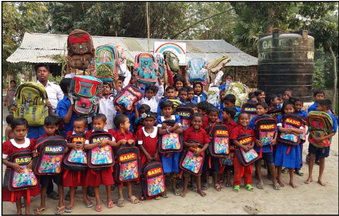
Happy faces with new bags, dress and materials...