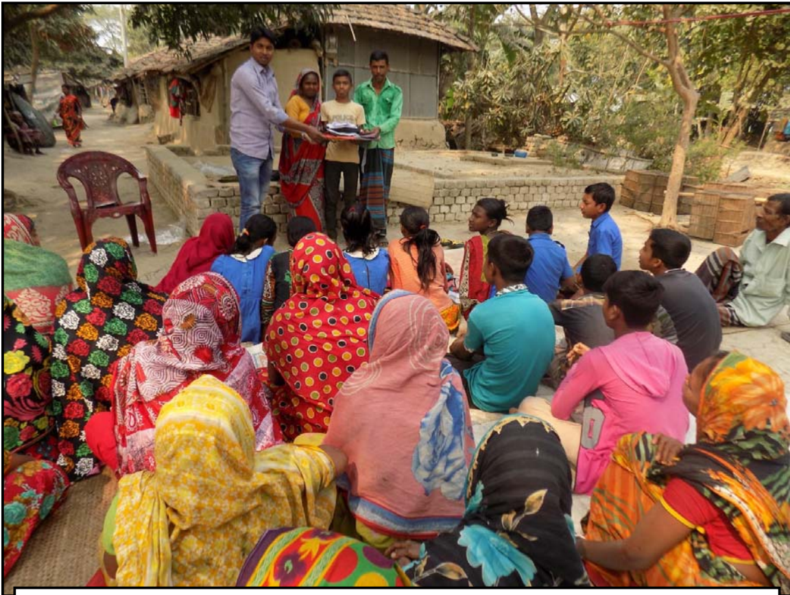
Distribution at Sorupdaho village...