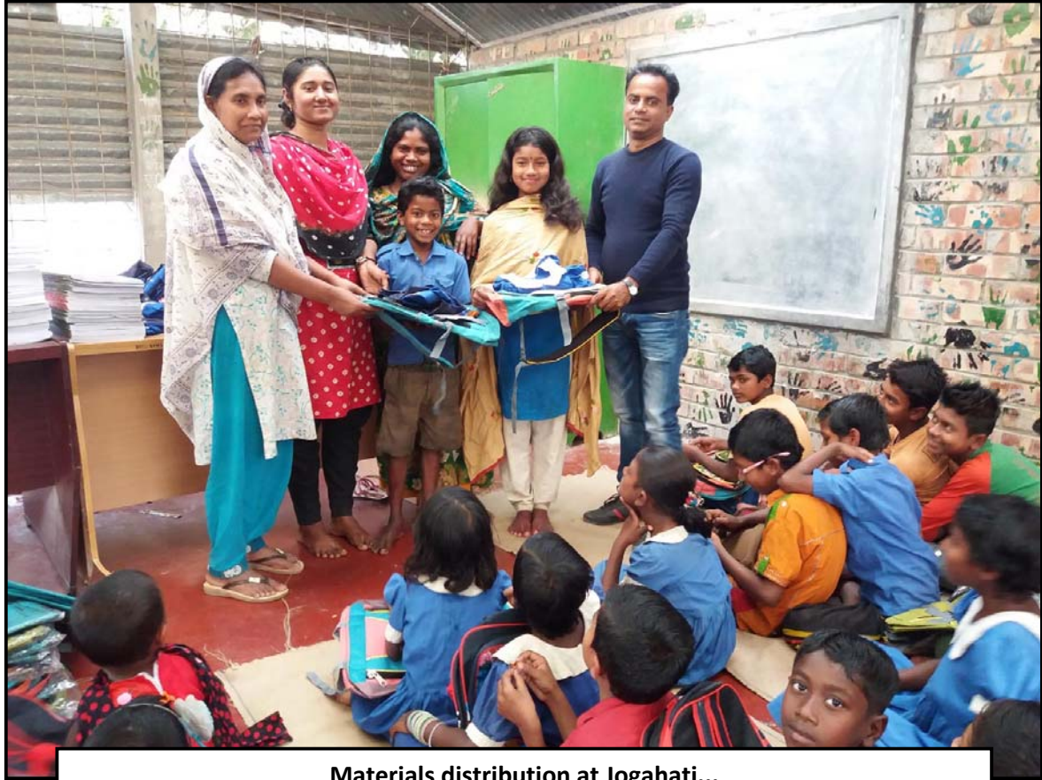
Materials distribution at Jogahati...