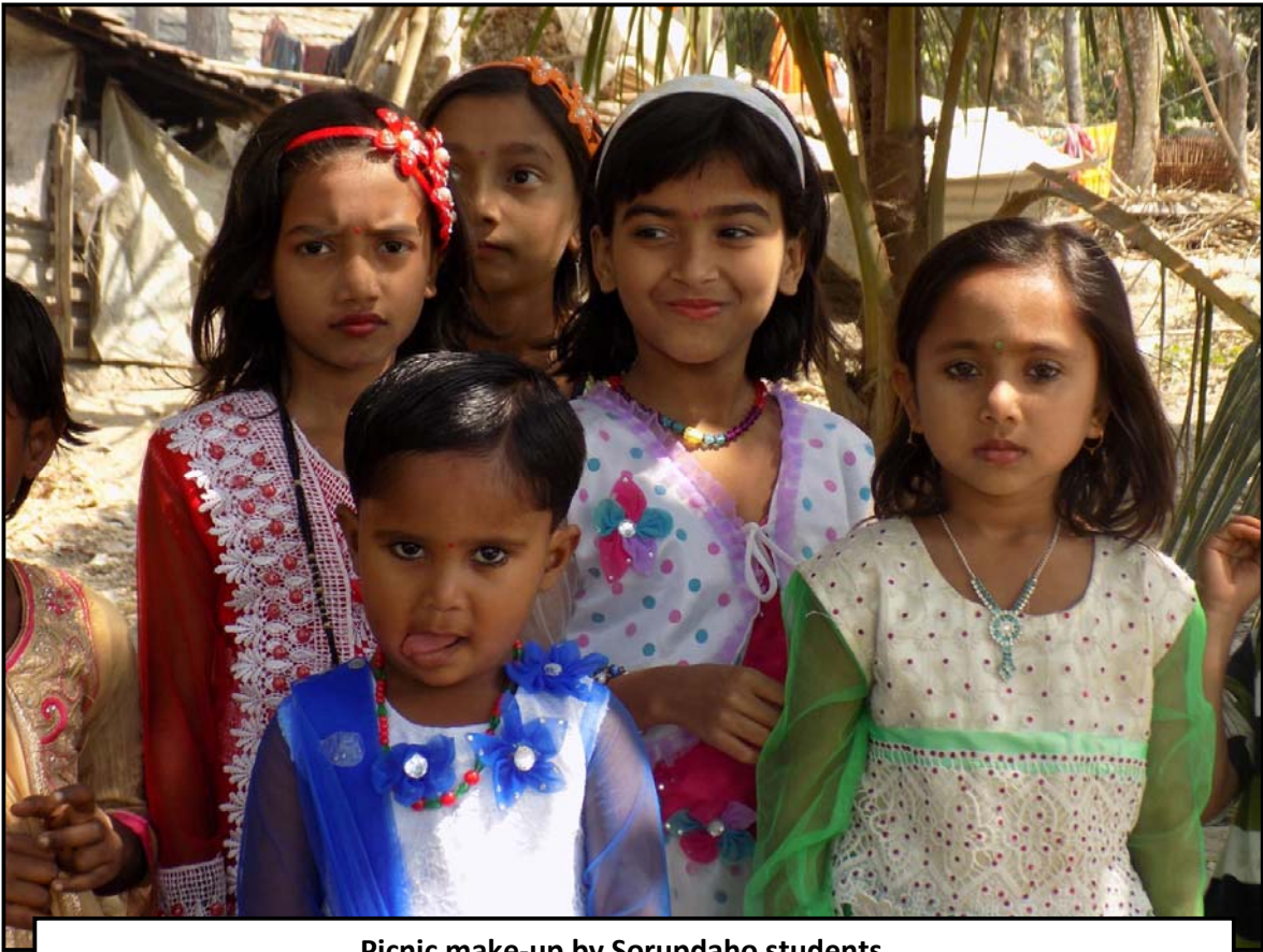
Picnic make-up by Sorupdaho students...