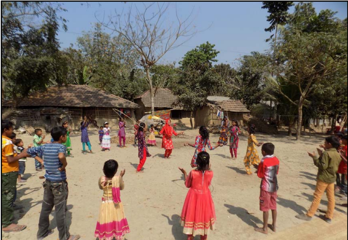
Sorupdaho students spent the picnic day with sports too...