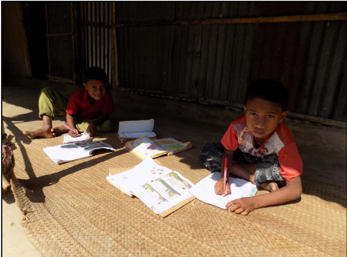
Our students very serious on study at home...