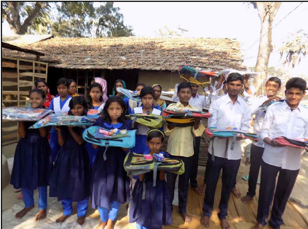
All Churamankati students with new bags, dress and materials...