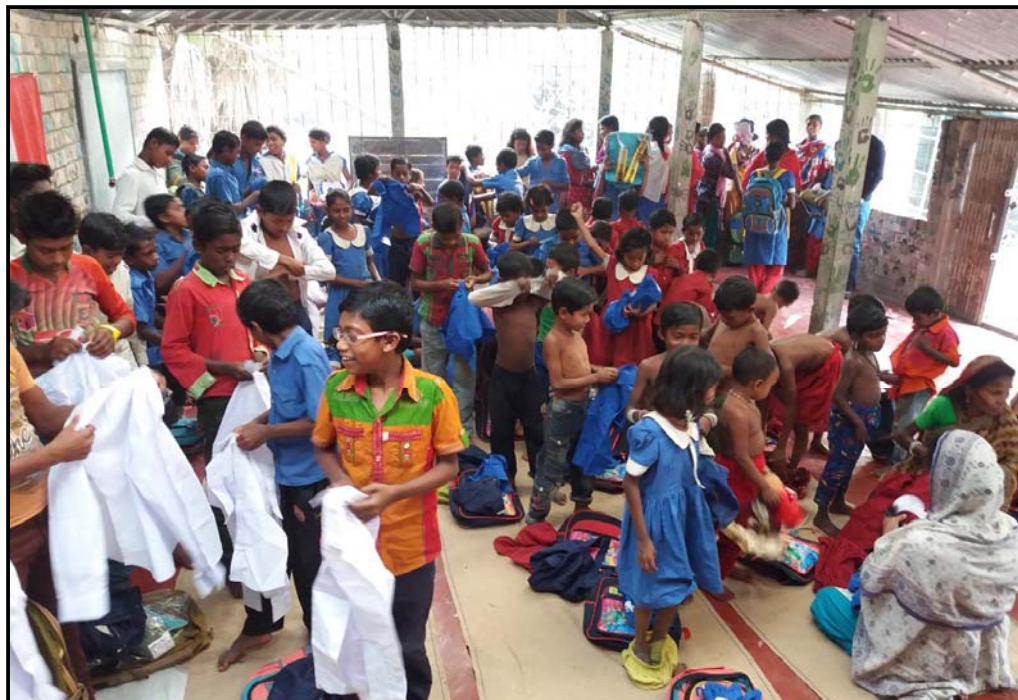
Happy students receive new school uniform, school bag...