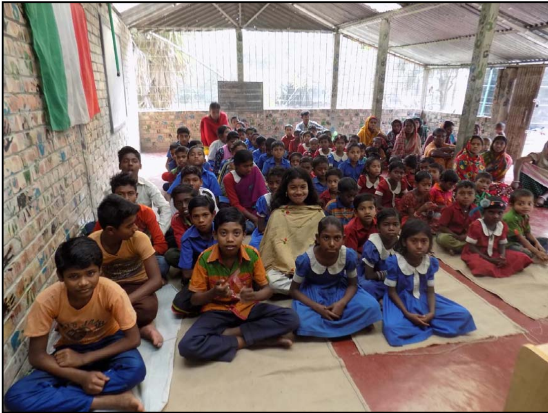
The parents-students meeting at Jogahati....