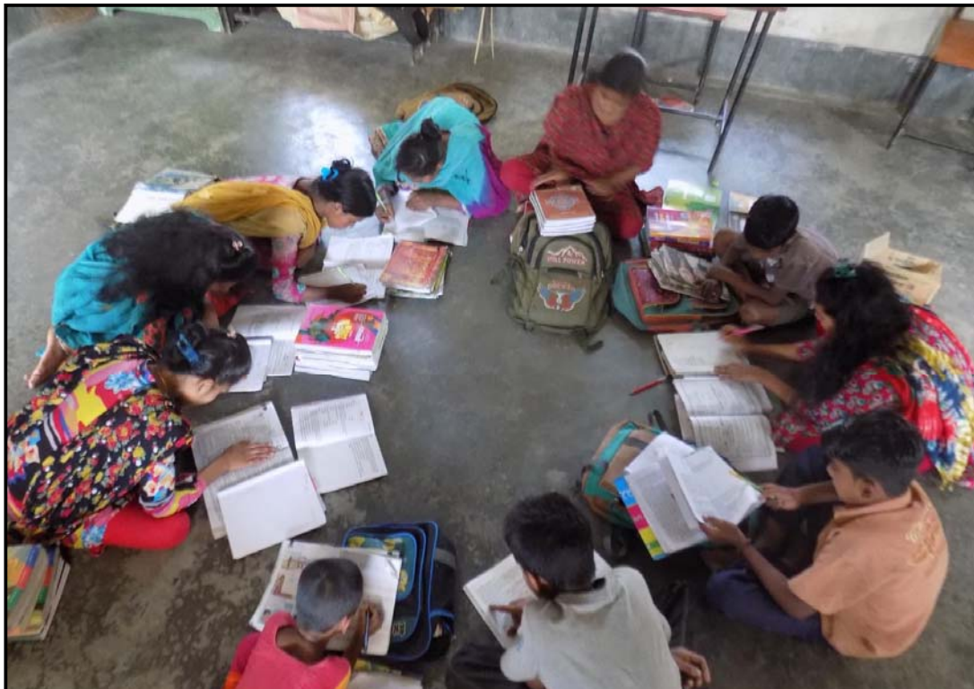
Attentive students taking lessons in Mohishati study centre...