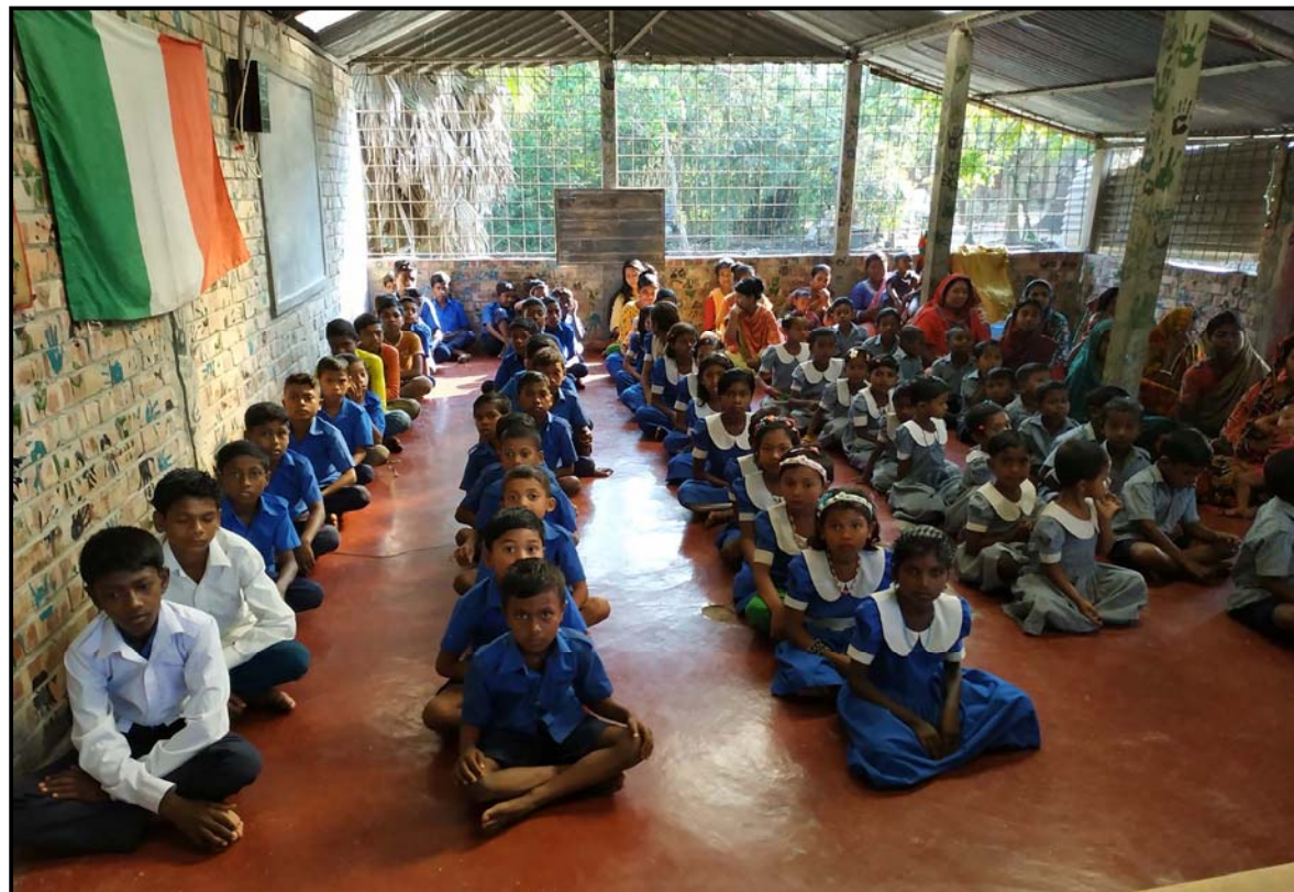
Parents and children meeting at Jogahati...