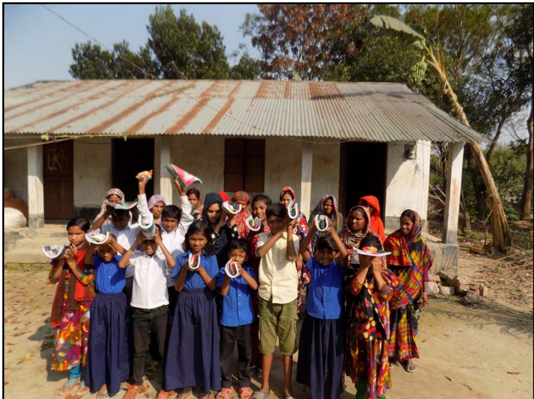
After materials distribution at Mohishati village...