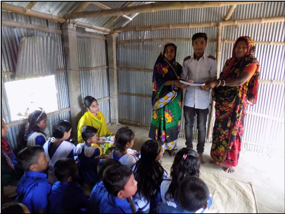
Materials distribution at Sorupdaho village...