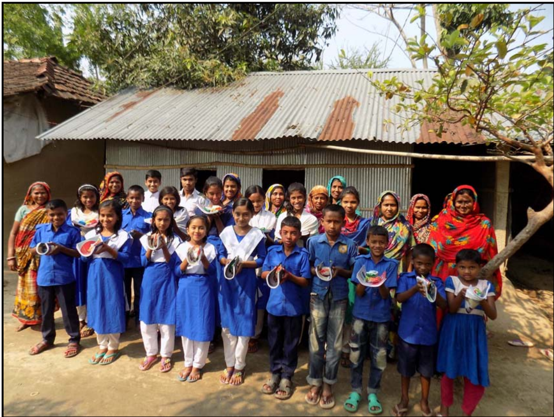
Happy students after materials distribution at Sorupdaho village...