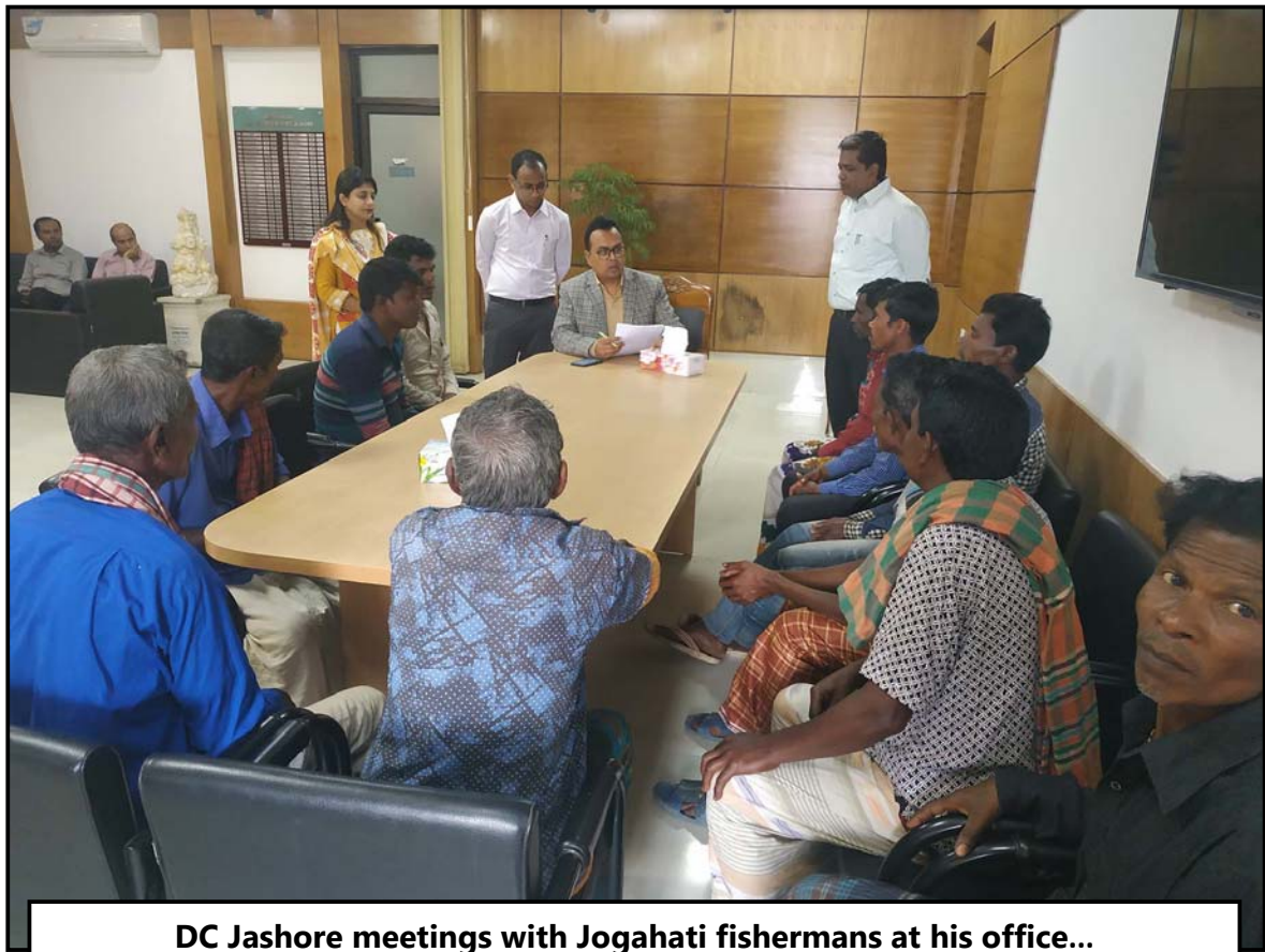
DC Jashore meetings with Jogahati fishermans at his office...