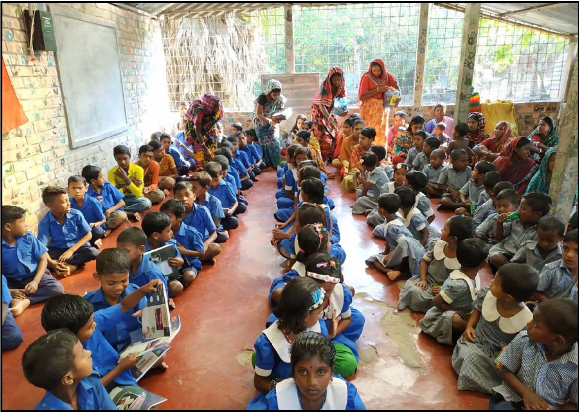
Materials distribution at Jogahati village....