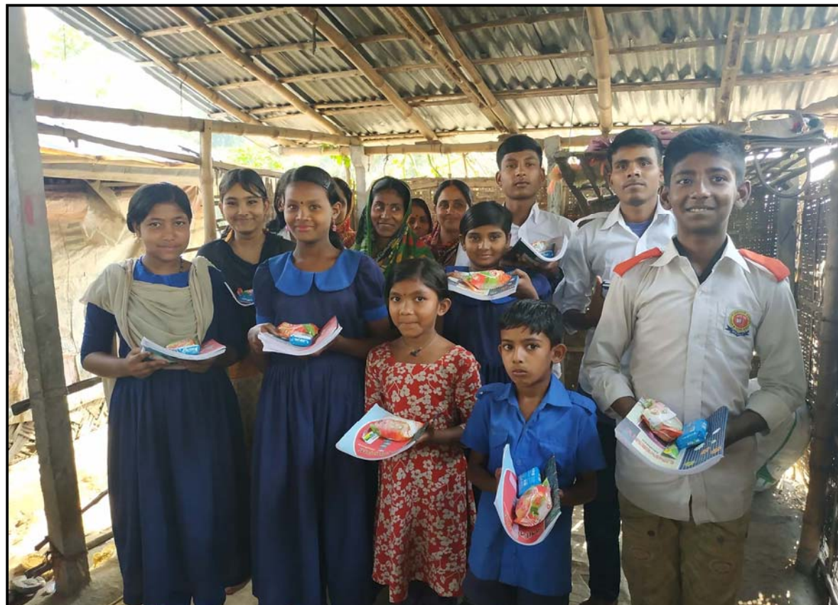
Happy students after materials distribution at Churamankati village...