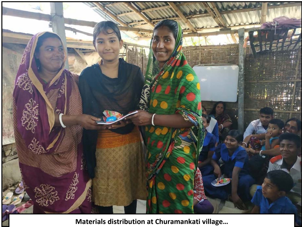
Materials distribution at Churamankati village...