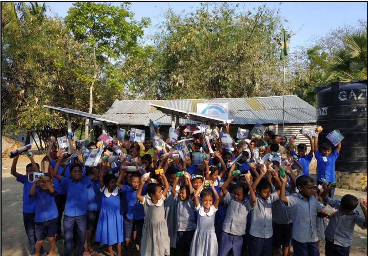
Happy students with materials at Jogahati village...