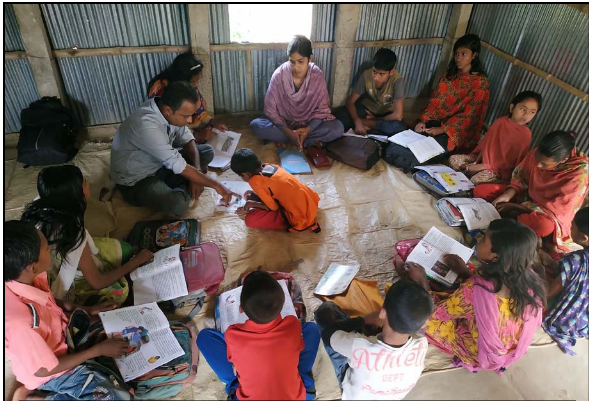
BS project accountant also take class at the tuition programmes to ensure the students study improvement...