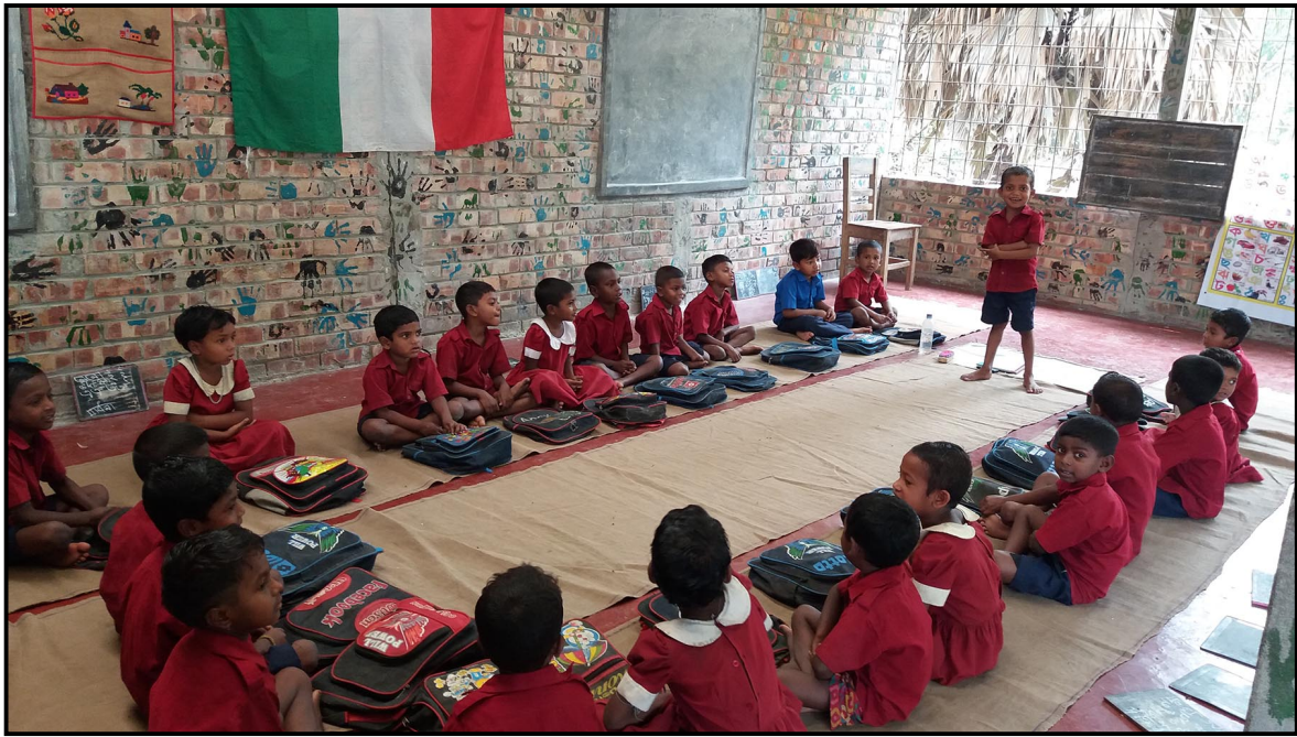
Pre-school students class at Jogahati...