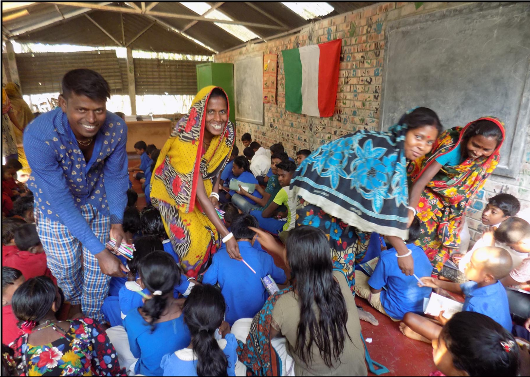
Materials distribution programme at Jogahati village..