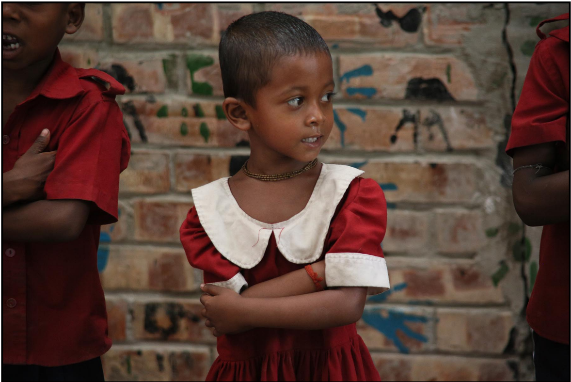
A very attentive student...