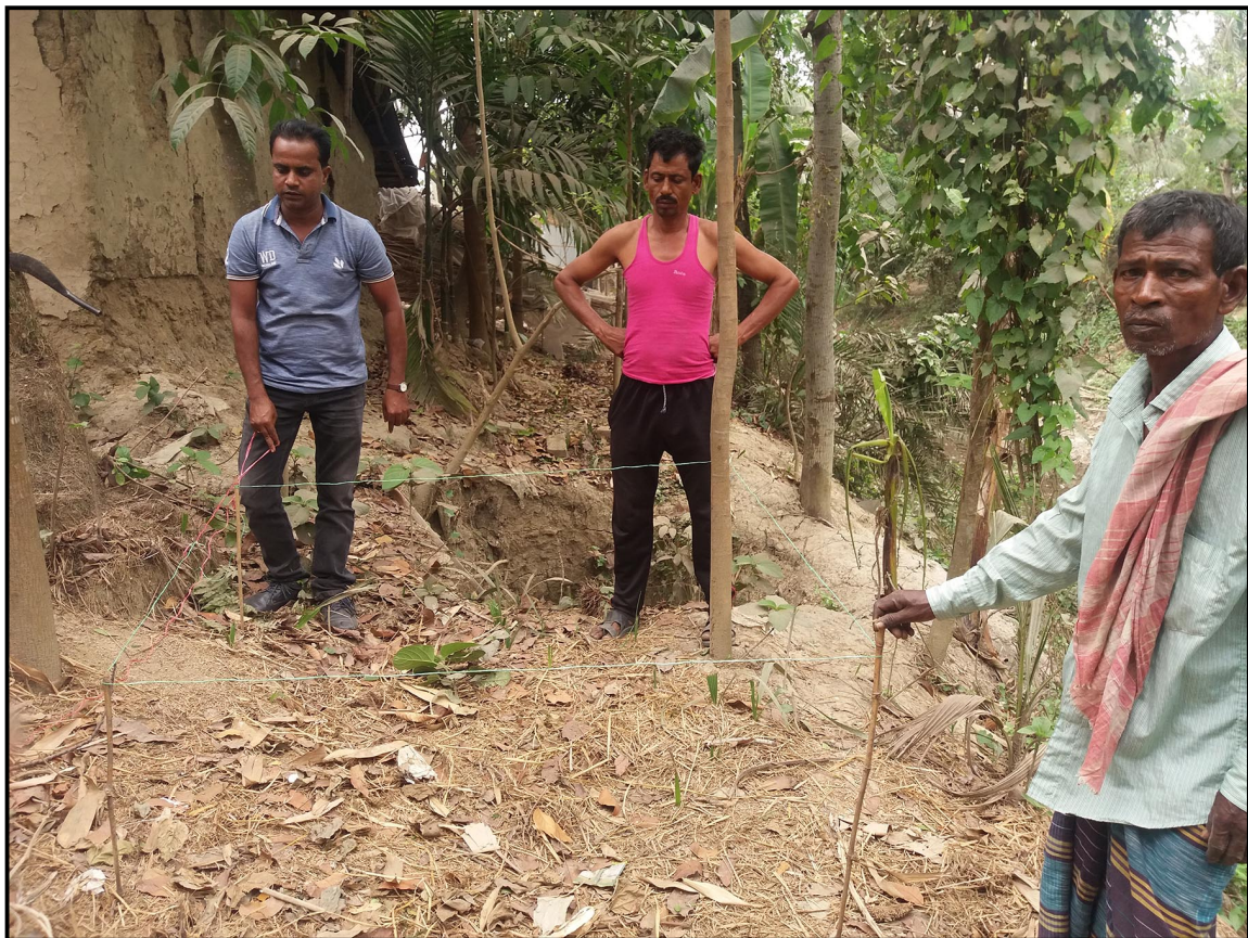
Community members showing the toilet construction location...