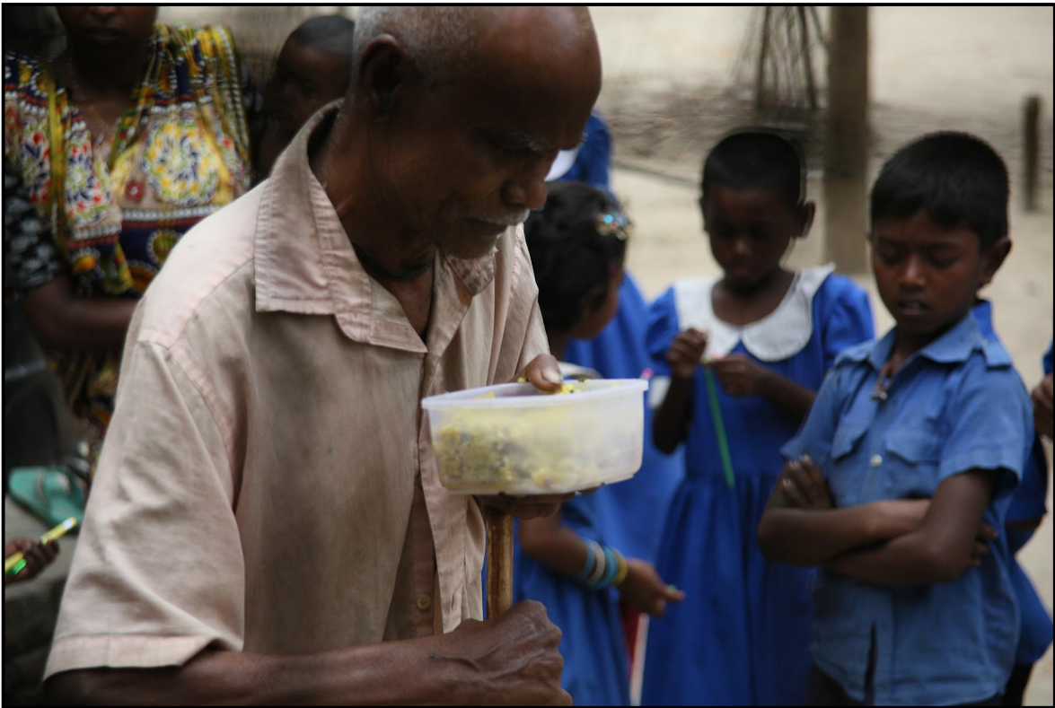
Also elderly members receive the meal...