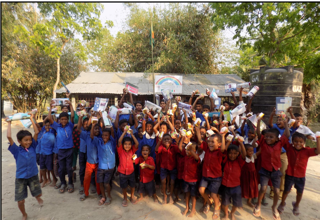
Happy students with the materials...