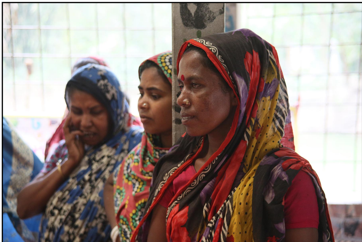
An attentive audience...