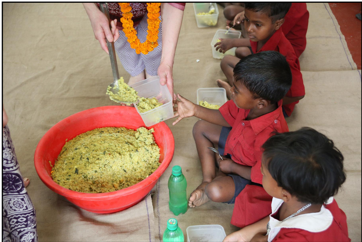
Daily school meal is very delicious...