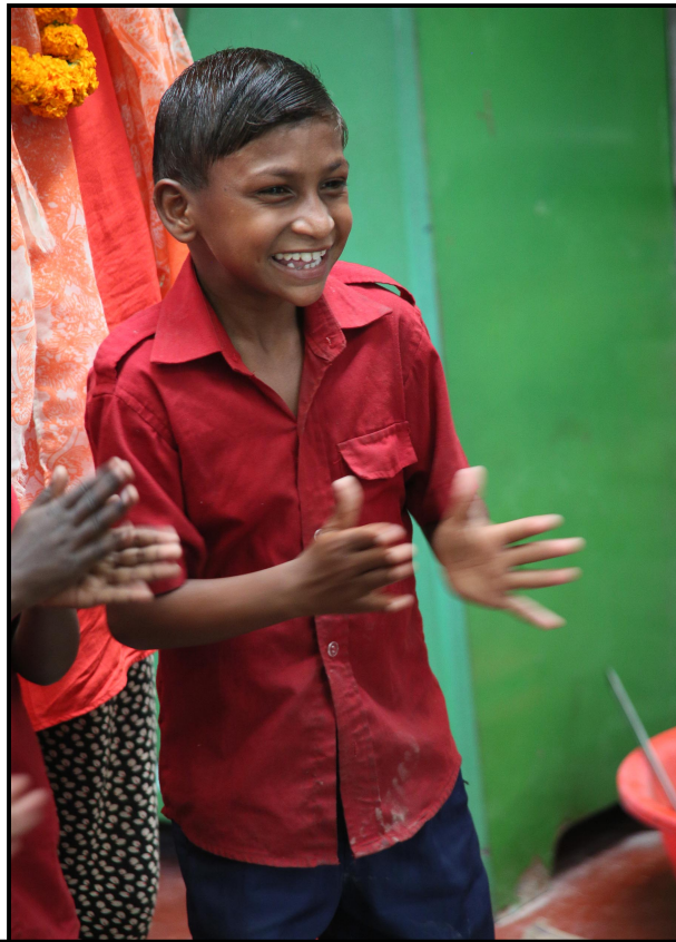
The joy of the study...