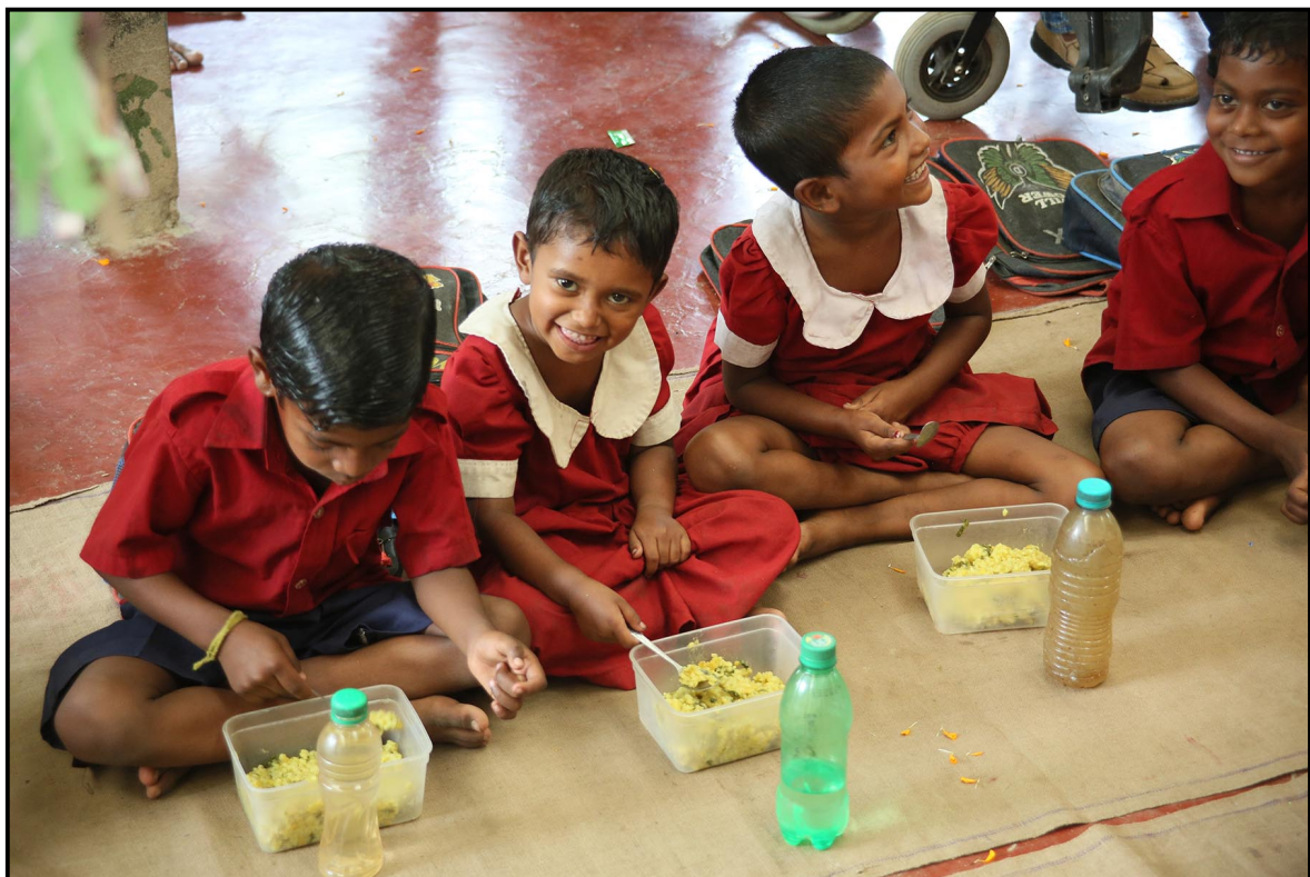
Enjoying the school meal...