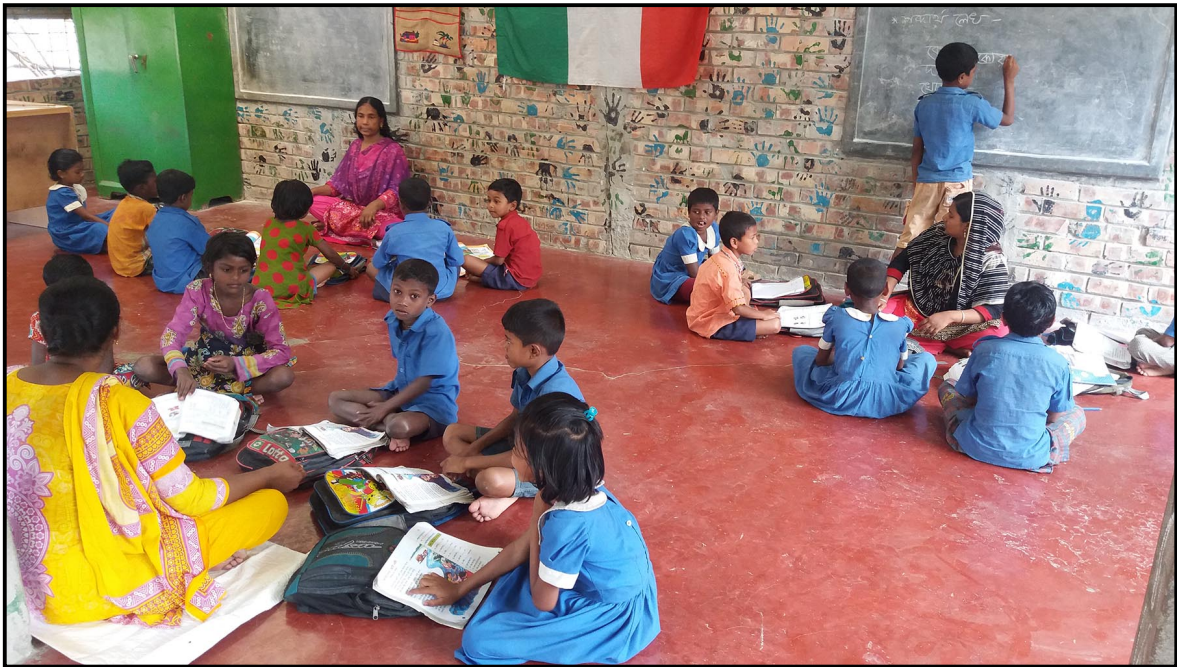
Tuition class at Jogahati village...