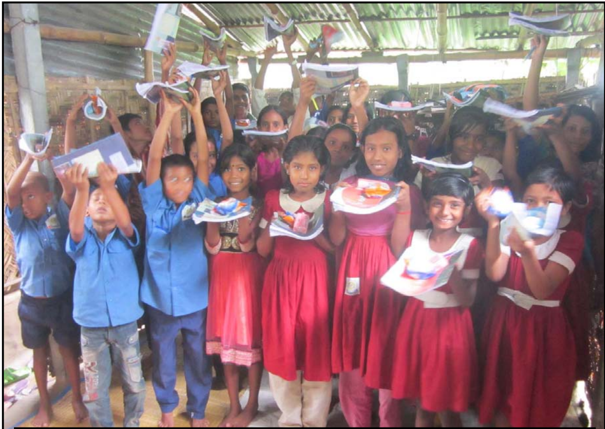
Churamankati Children with Materials...