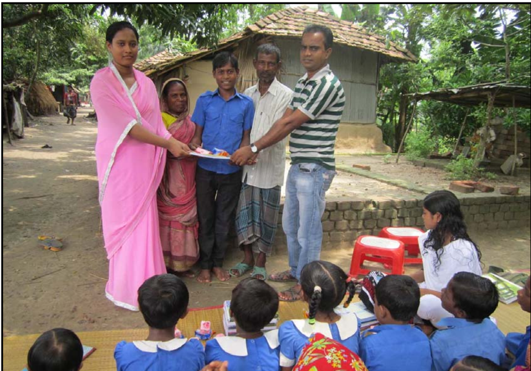
Monthly Materials Distribution at Sorupdaho...