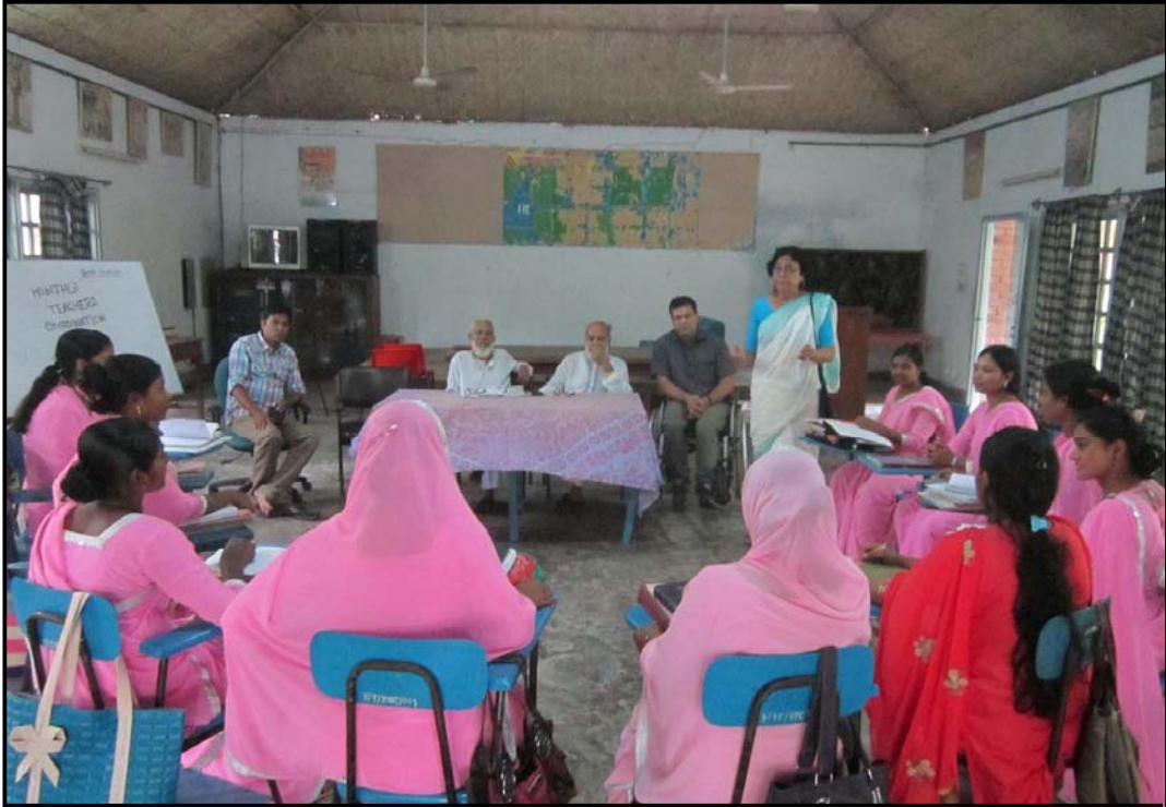
Monthly Teachers Coordinating Meeting...