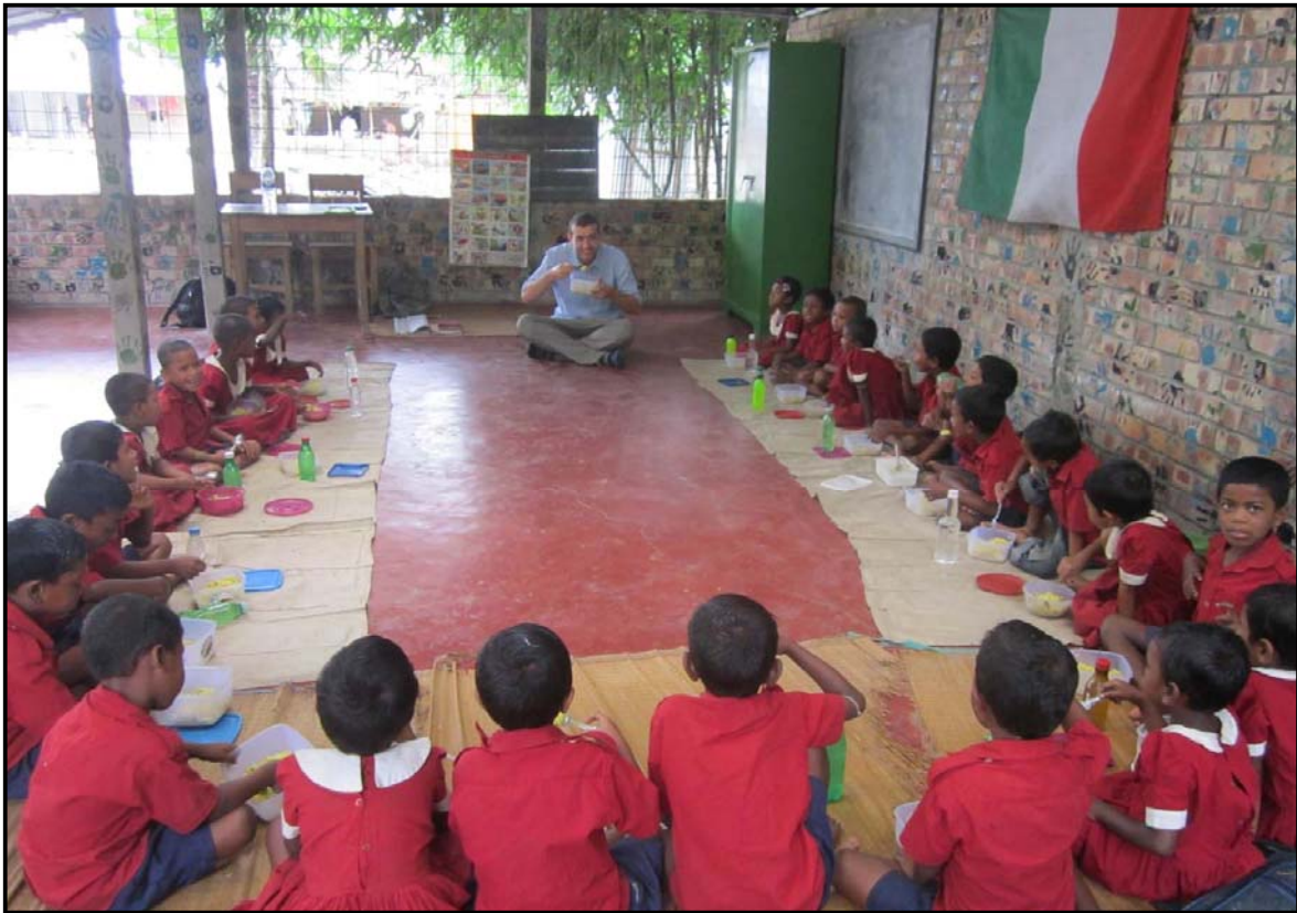
Enjoying the Meal Together...