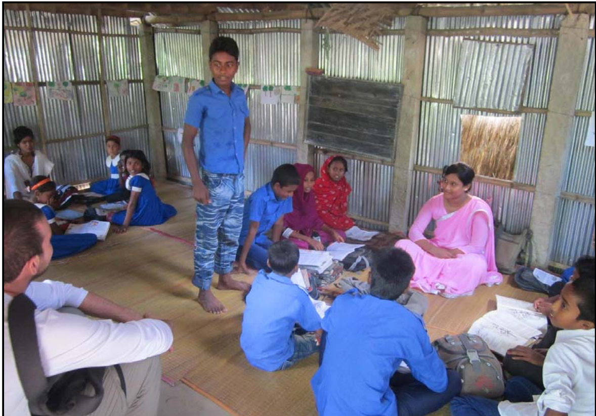
Sorupdaho Tuition Programme...