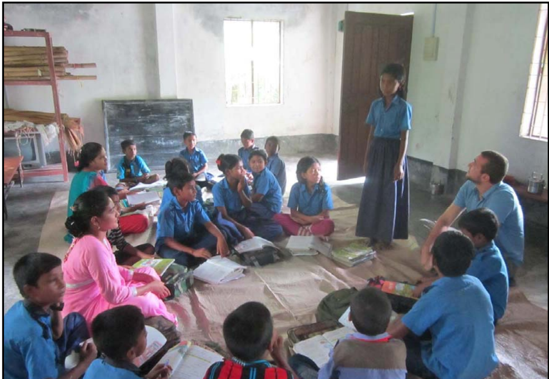
Mohishati Tuition Programme...