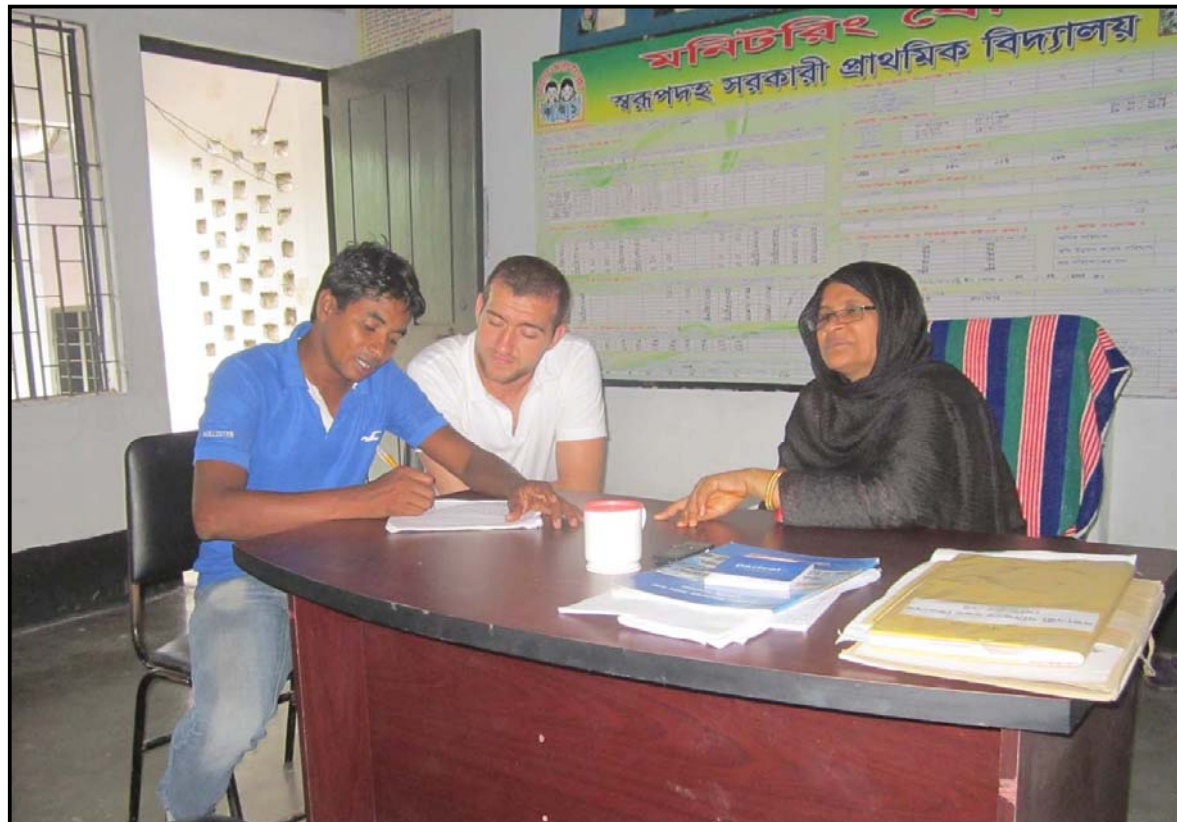
Student School Attendance Collection...