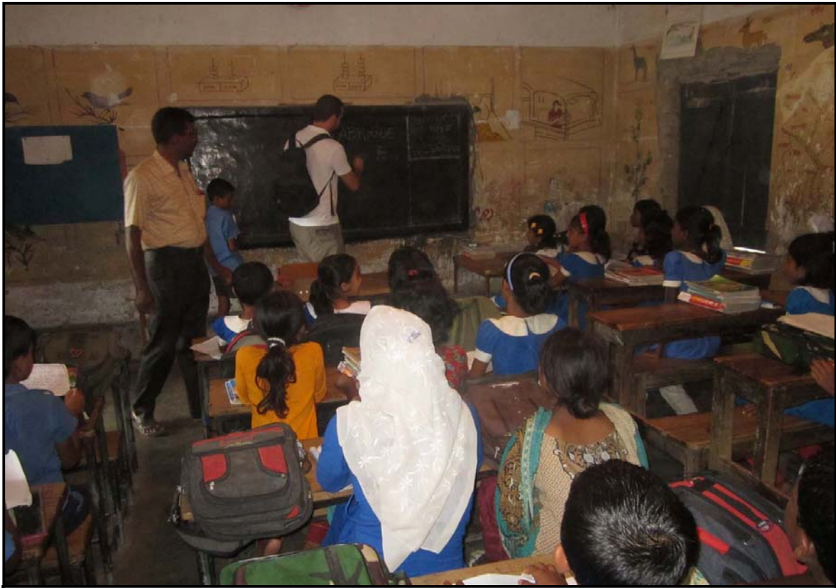
Introducing with Student in Government School...