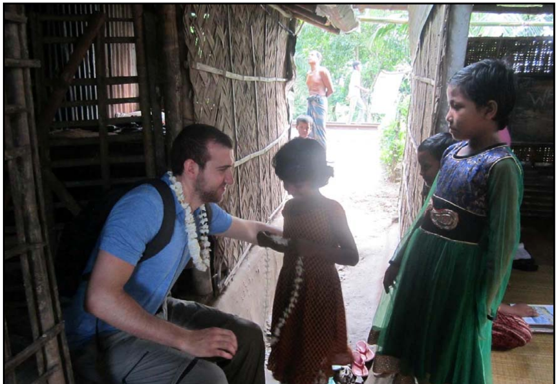
Receiving Flower Reception...