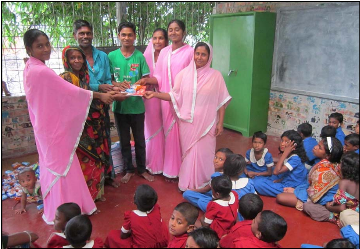
Monthly Materials Distribution at Jogahati...