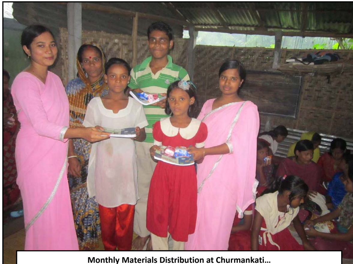
Monthly Materials Distribution at Churmankati...