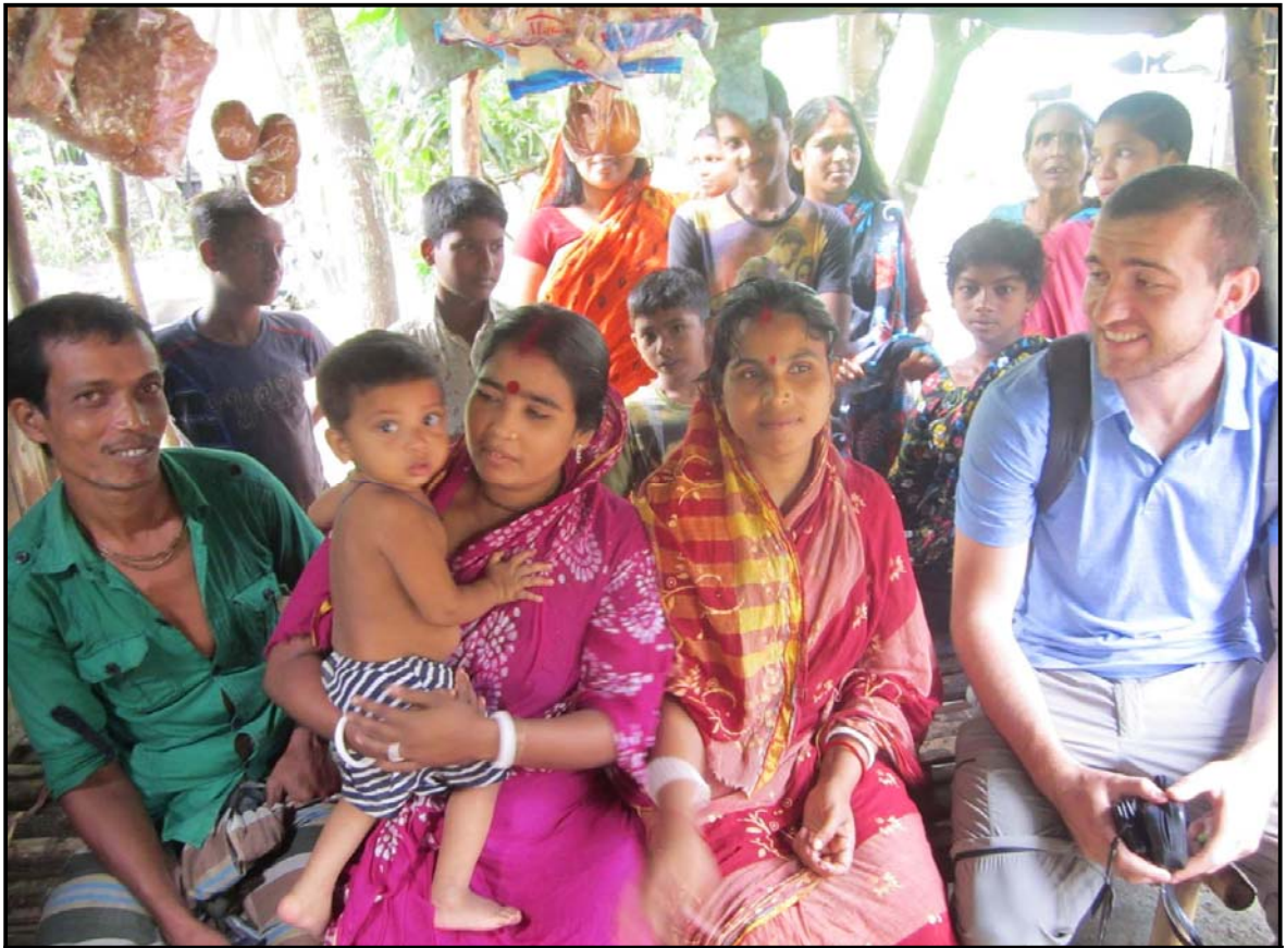
At the community...