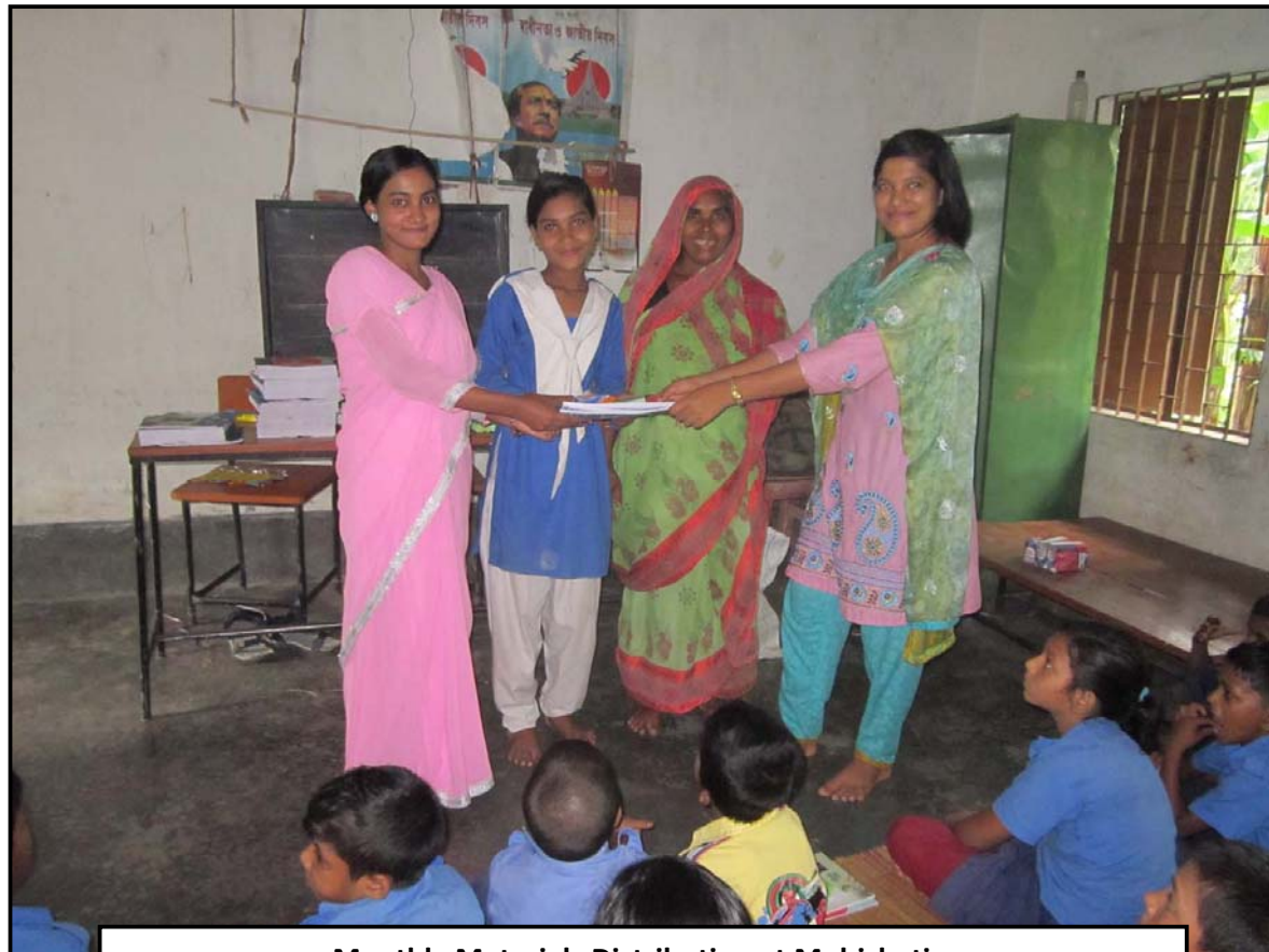
Monthly Materials Distribution at Mohishati...