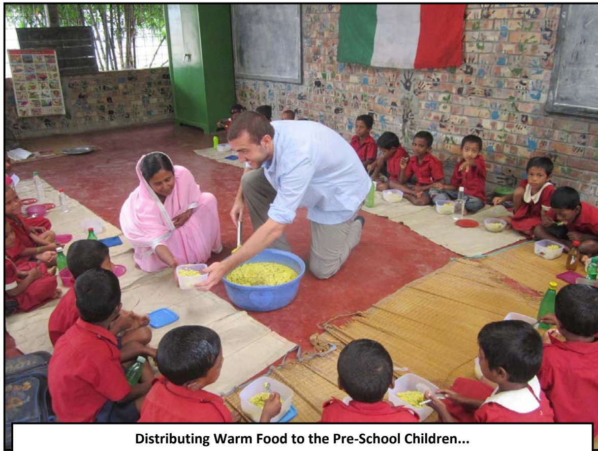
Distributing Warm Food to the Pre-School Children...