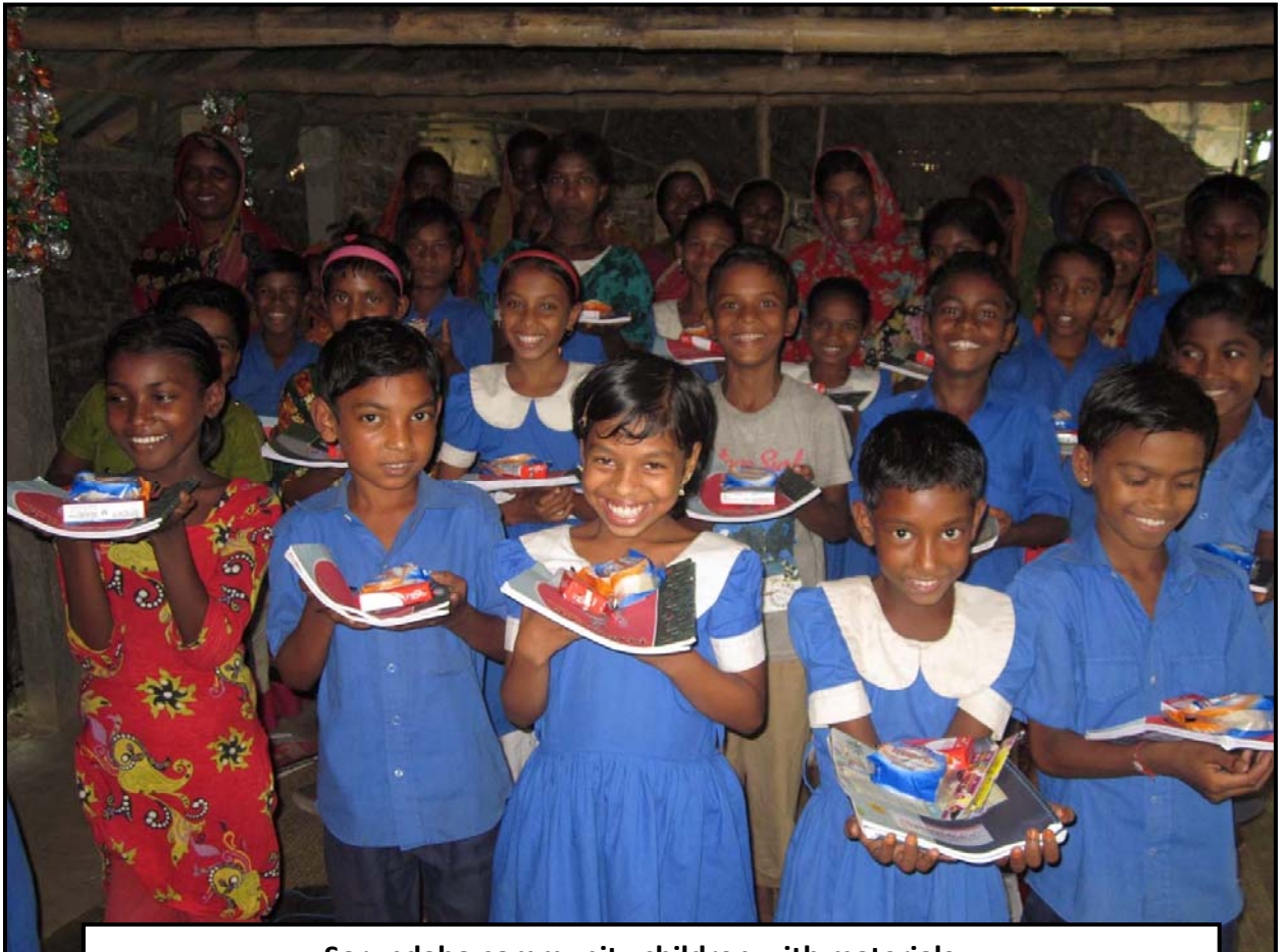
Sorupdaho community children with materials...