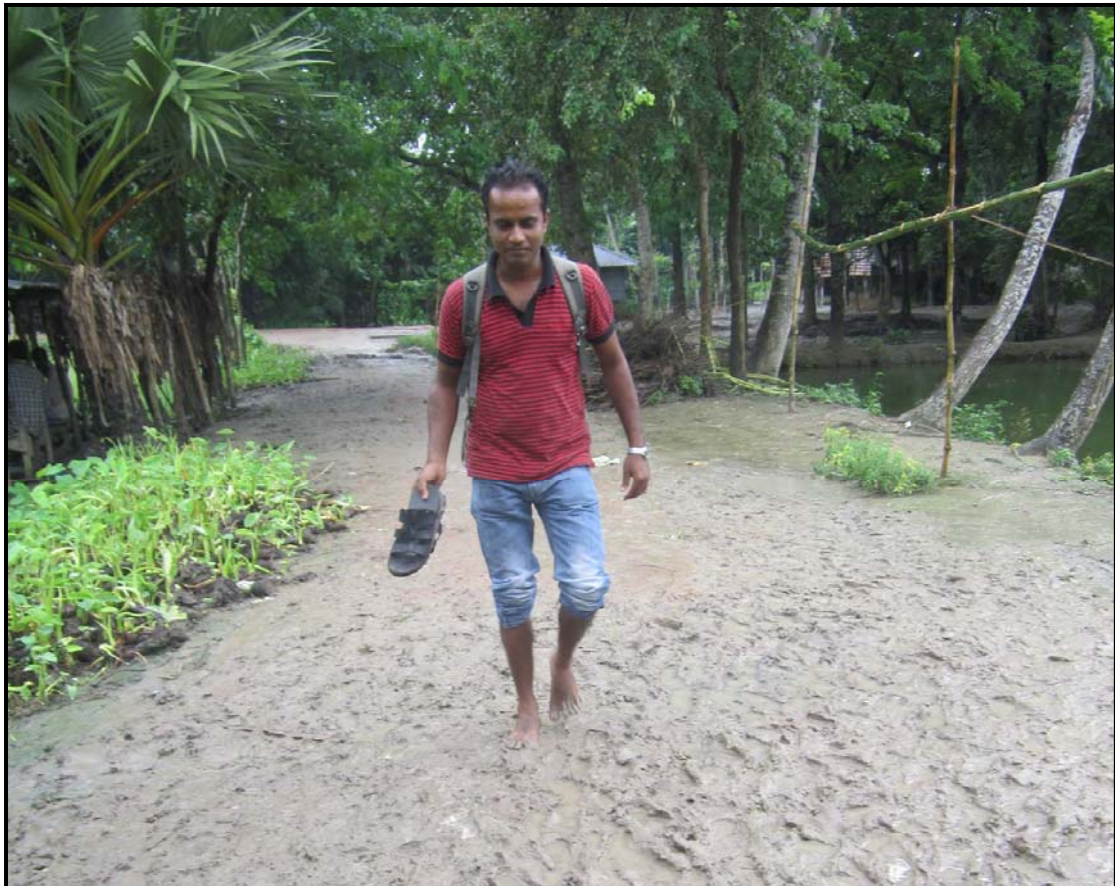
During this rainy time Jogahati road was full of mud...