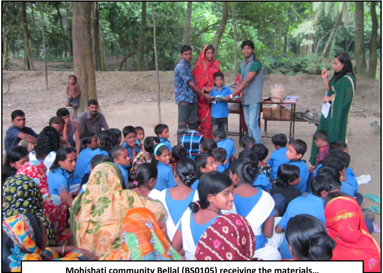
Mohishati community Bellal (BS0105) receiving the materials...