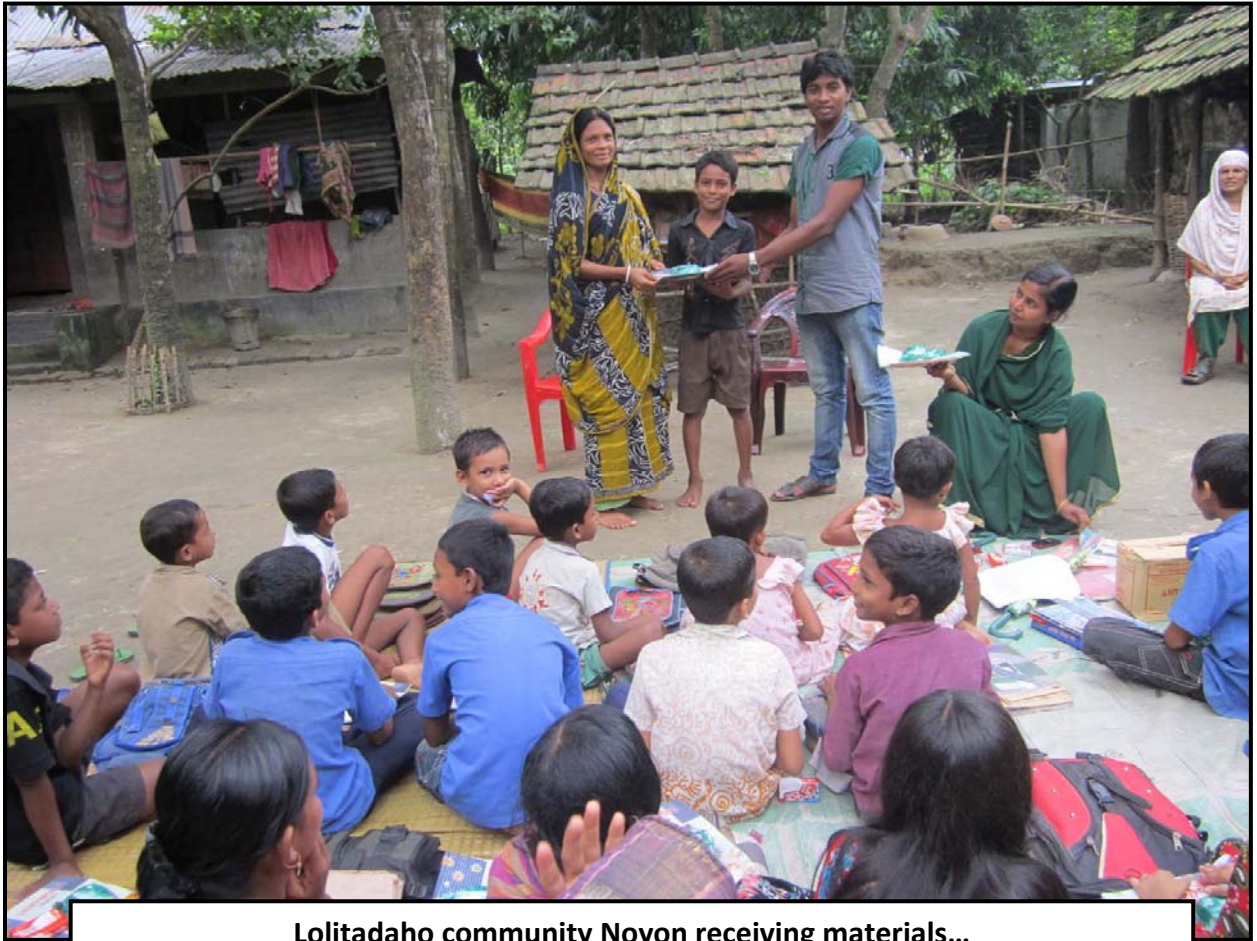
Lolitadaho community Noyon receiving materials...