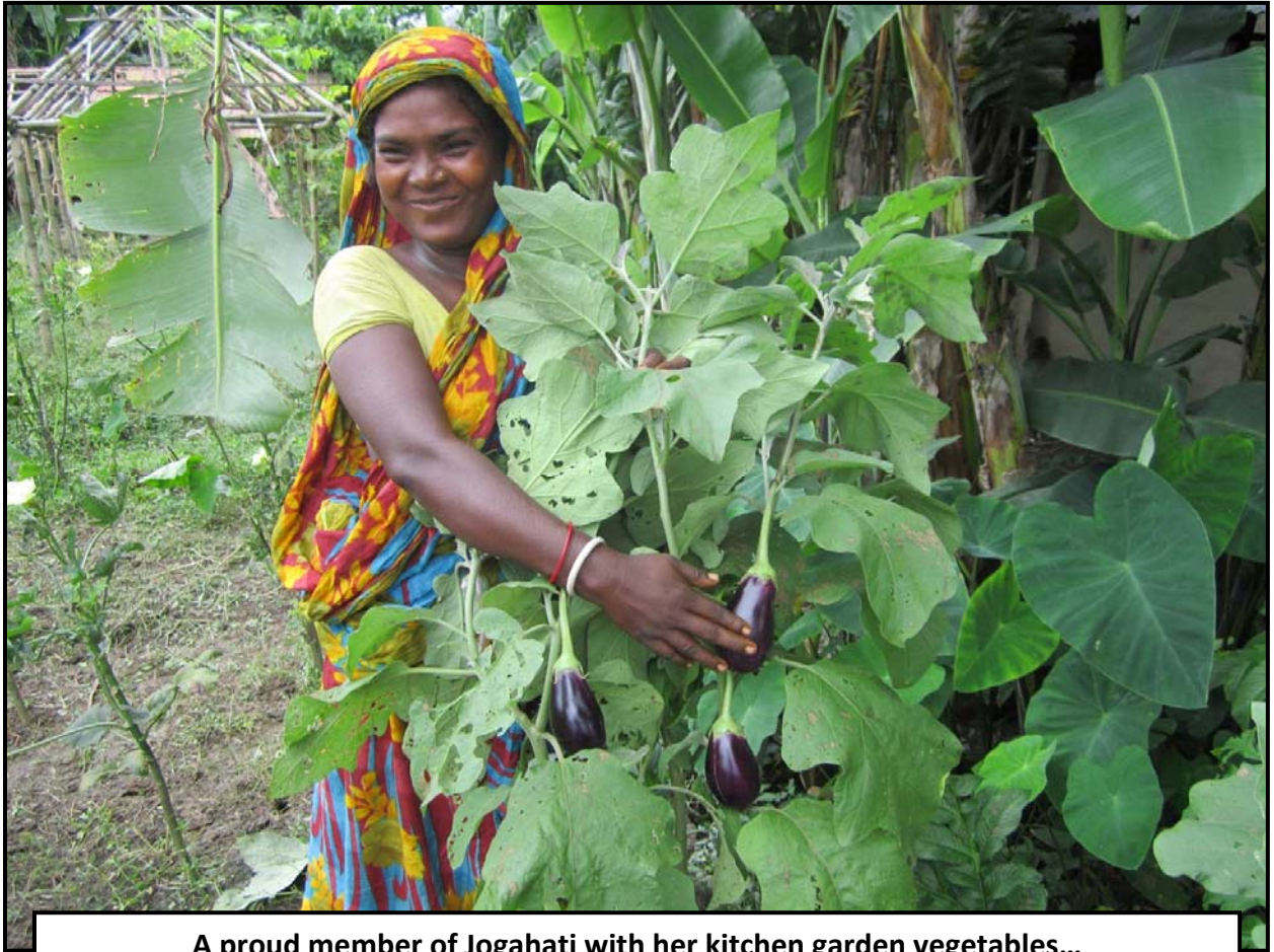
A proud member of Jogahati with her kitchen garden vegetables...