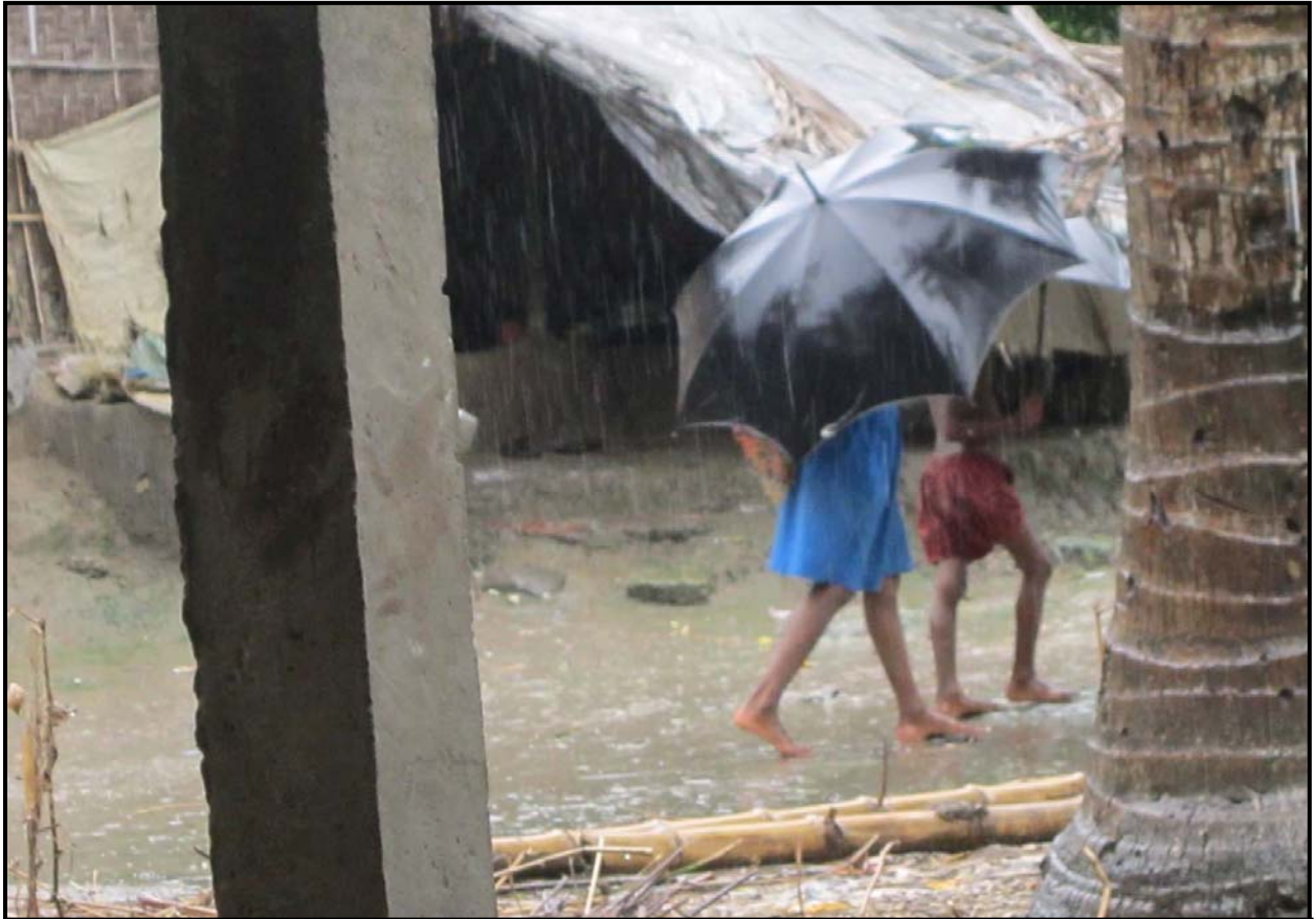
All the month was just rain and rain...