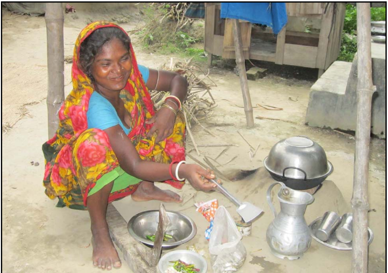
The kitchen garden vegetables are use for daily cooking and some for sell to neighbours