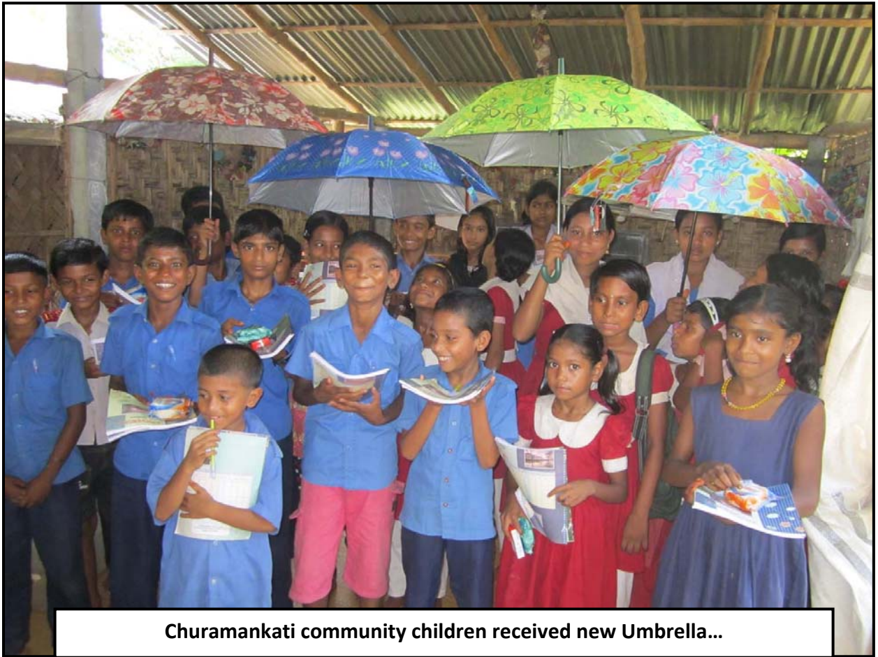
Churamankati community children received new Umbrella...