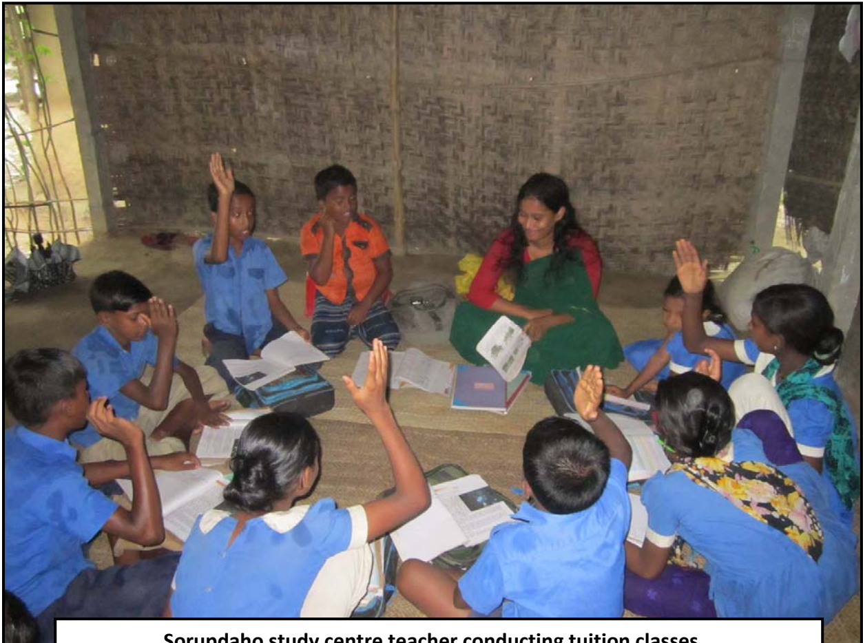
Sorupdaho study centre teacher conducting tuition classes...