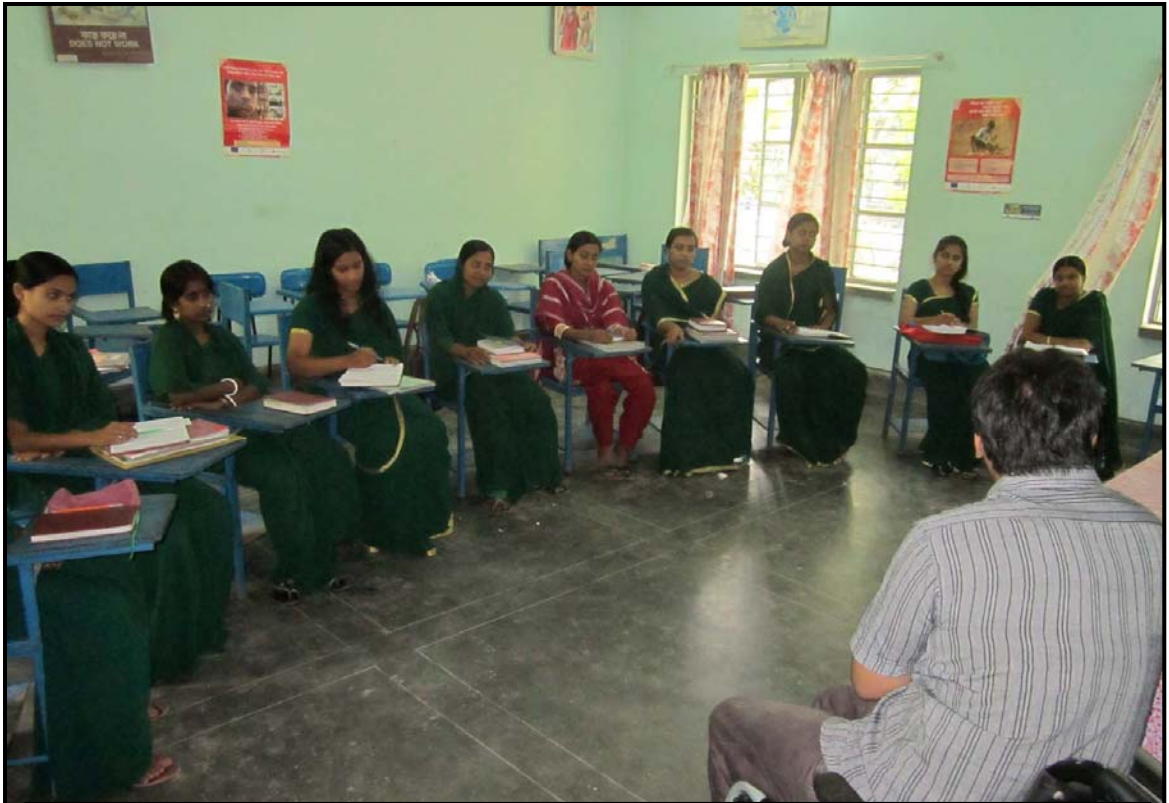
Monthly teacher's coordination meeting at BS Office...