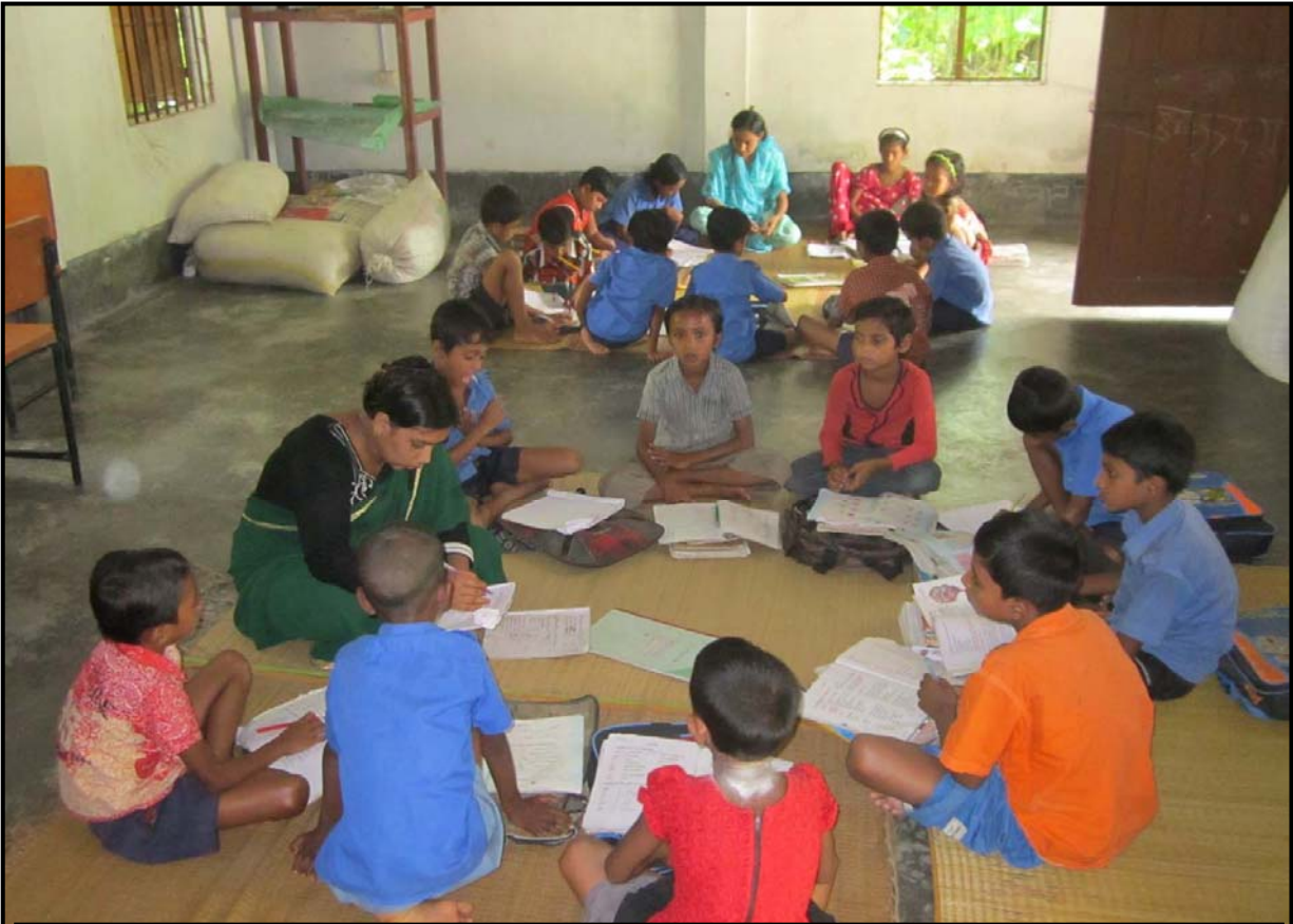
Mohishati study centre teachers conducting tuition classes...