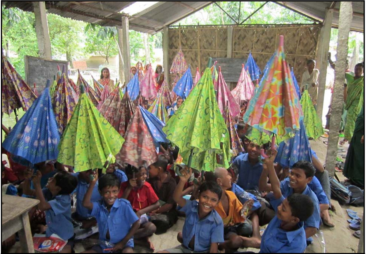
Jogahati children received new Umbrella to protect from rain...