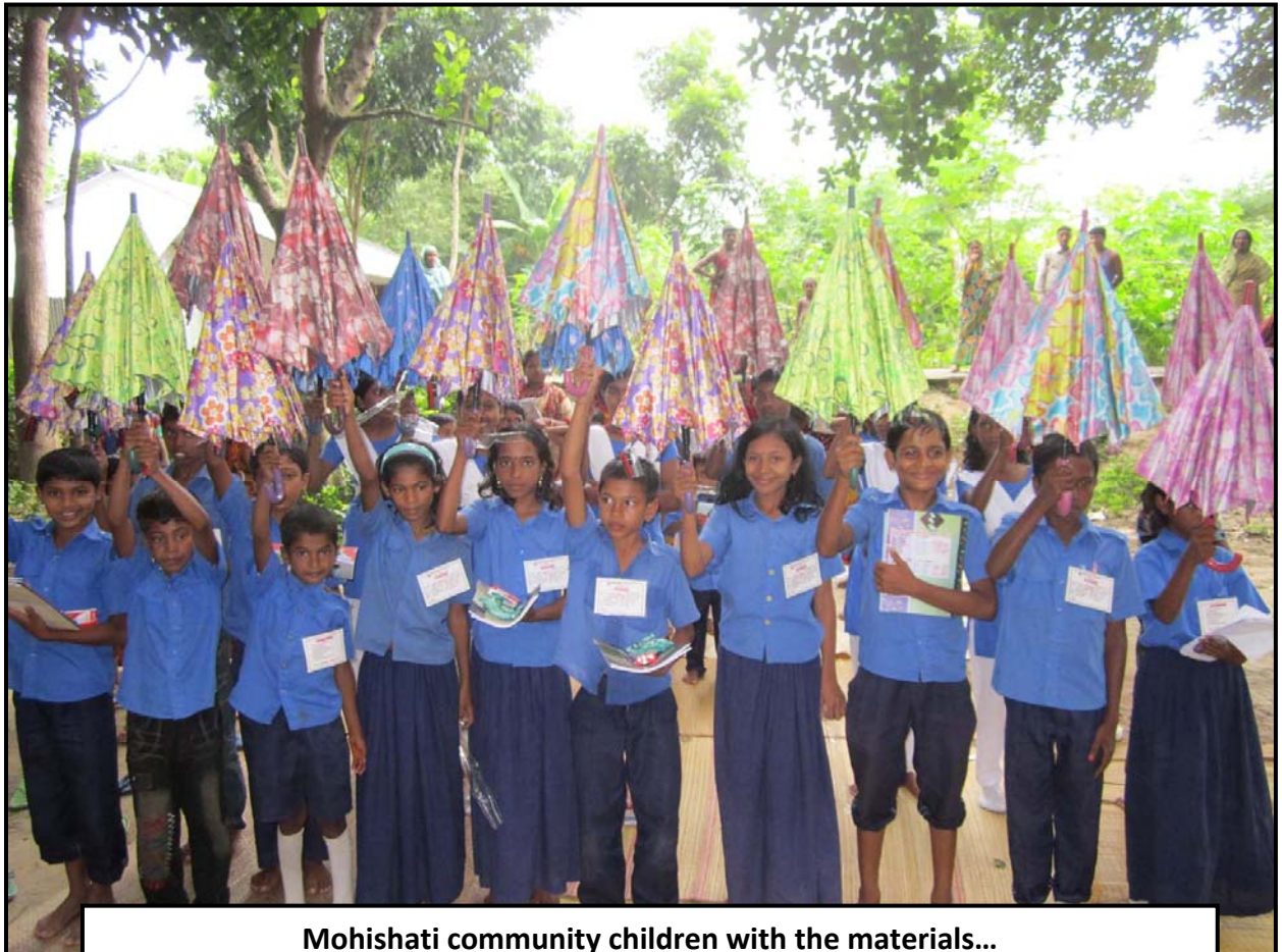
Mohishati community children with the materials...