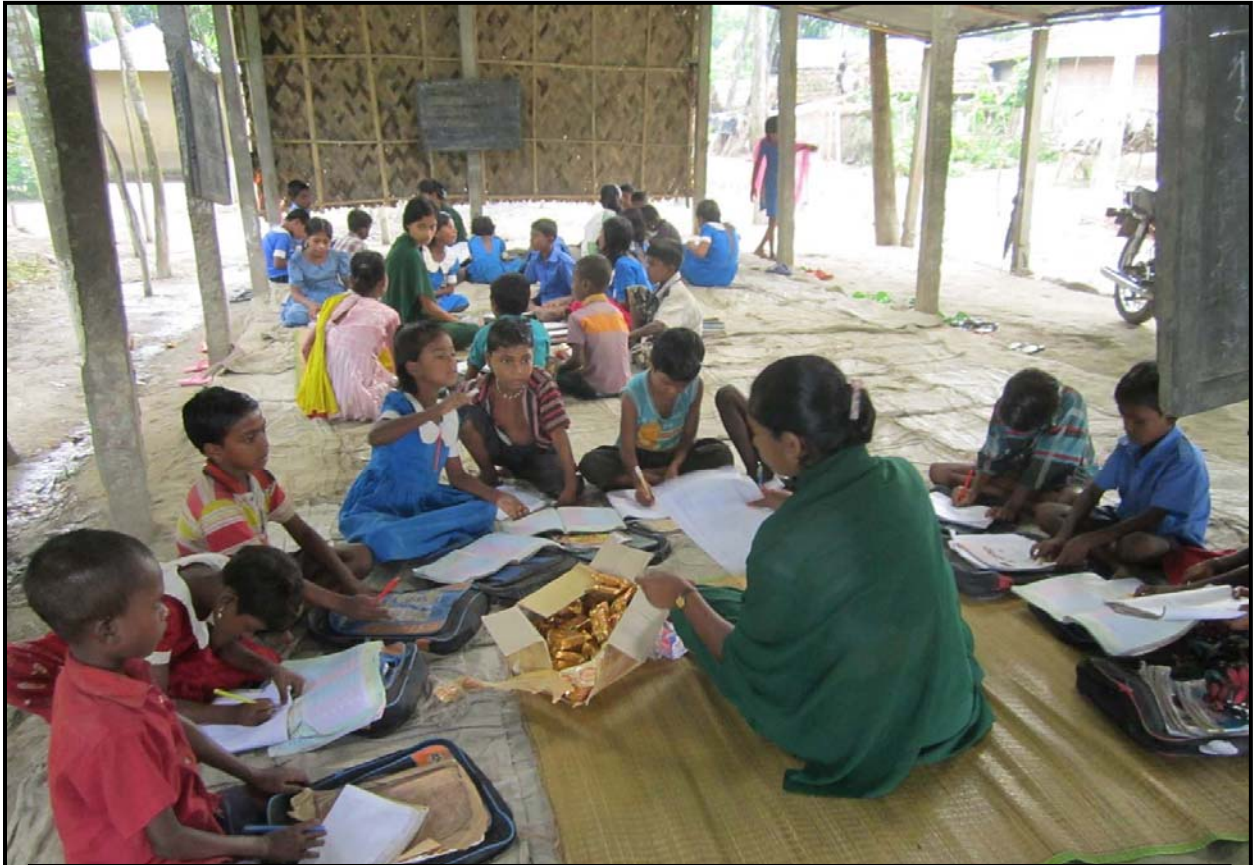
Jogahati study centre teachers conducting tuition classes...