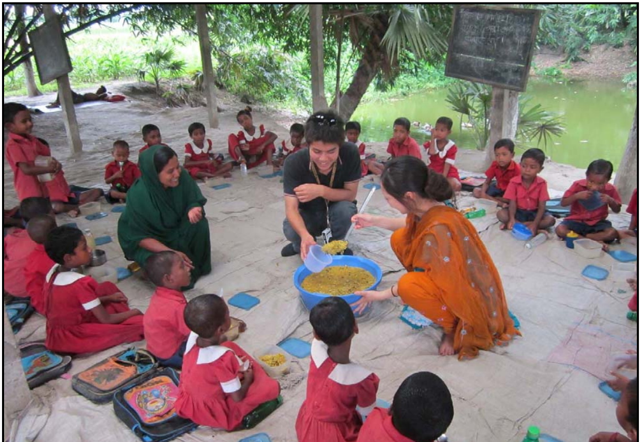
JICA engineers distributing Tiffin to the children...