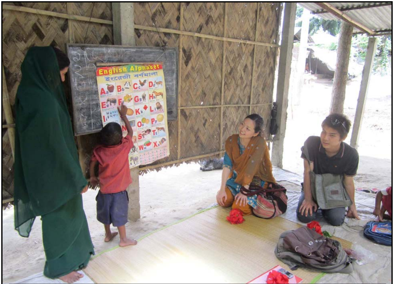
JICA engineers visiting Jogahati Pre-school...