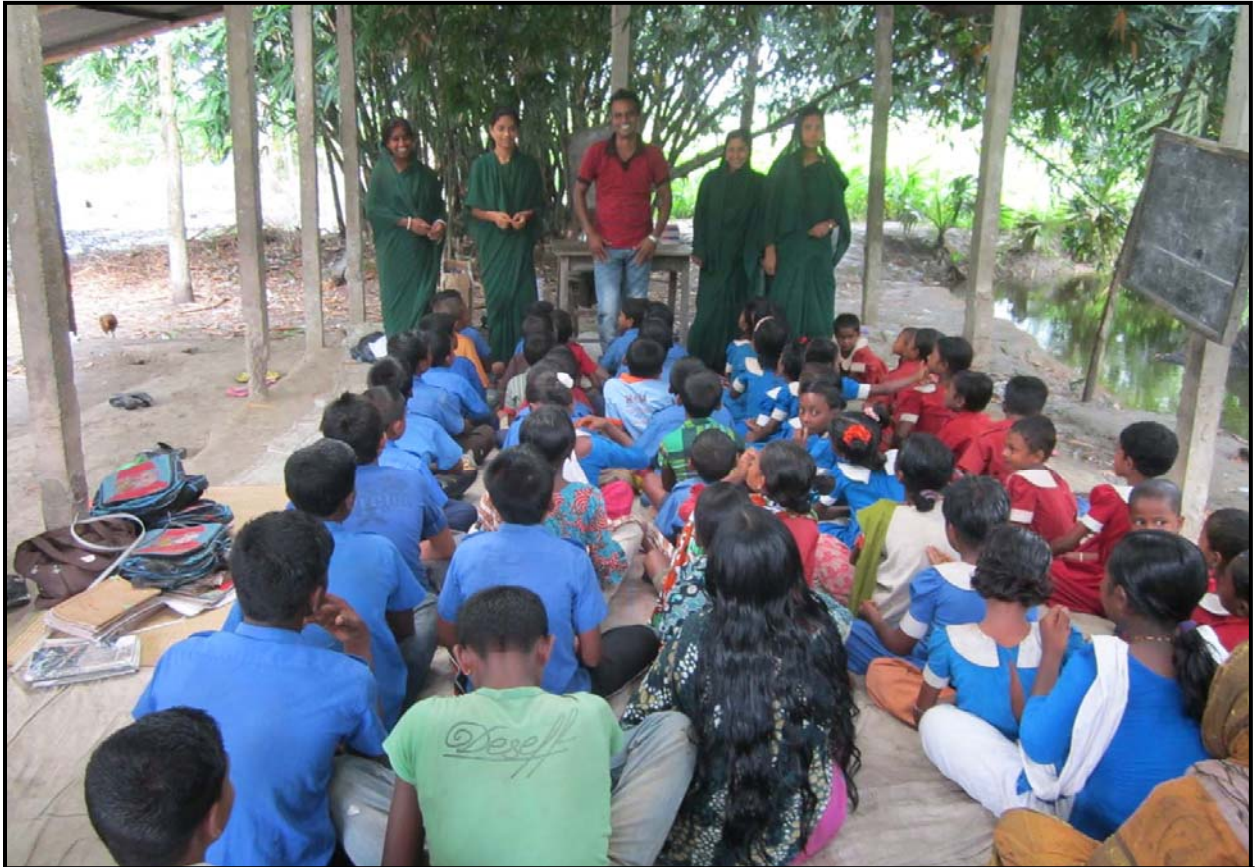
Monthly materials distribution programme at Jogahati...