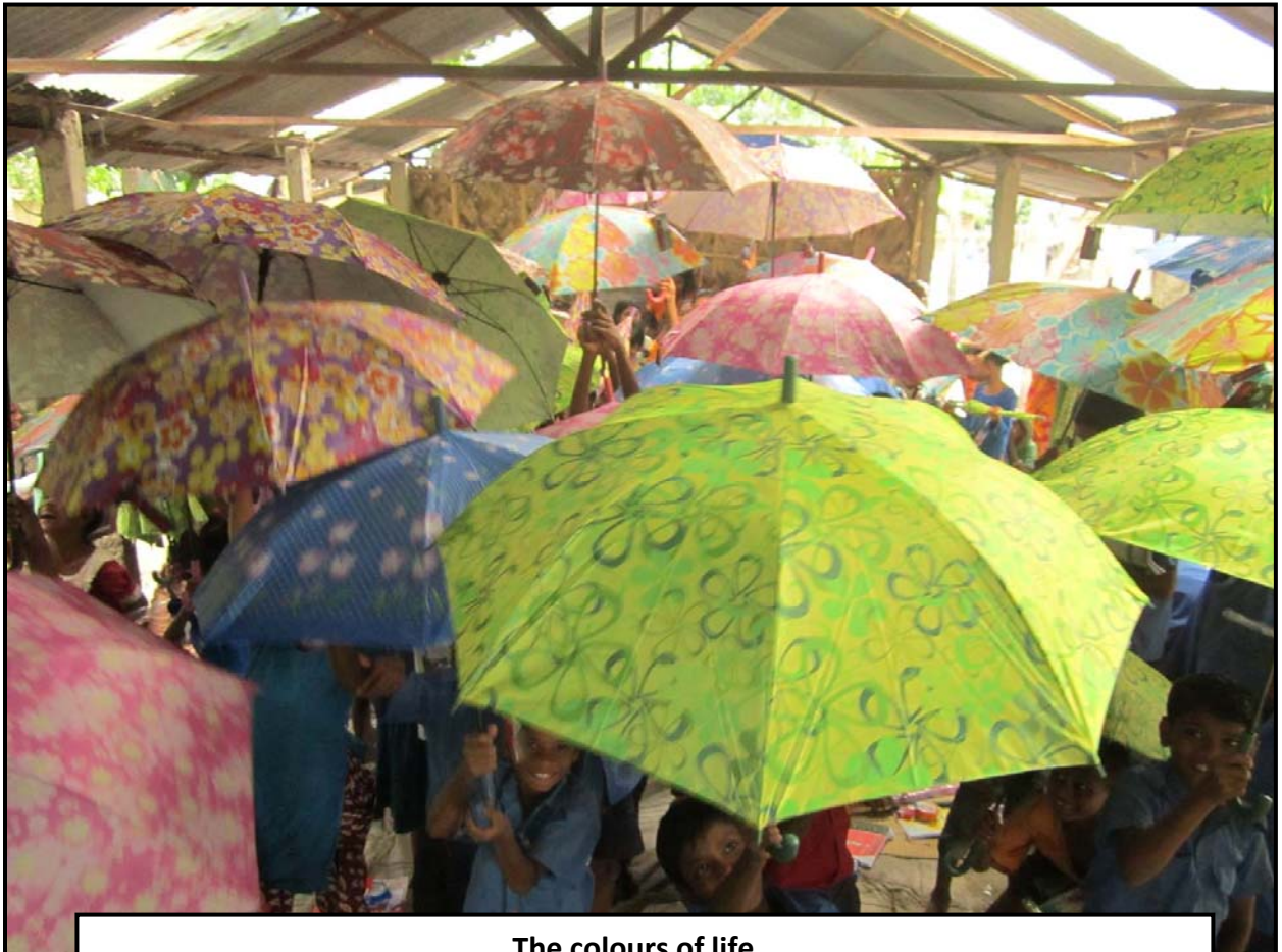
The colours of life...