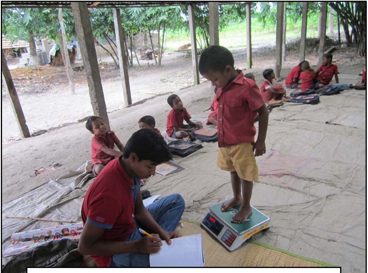
Monthly height & weight measurement check going on.....