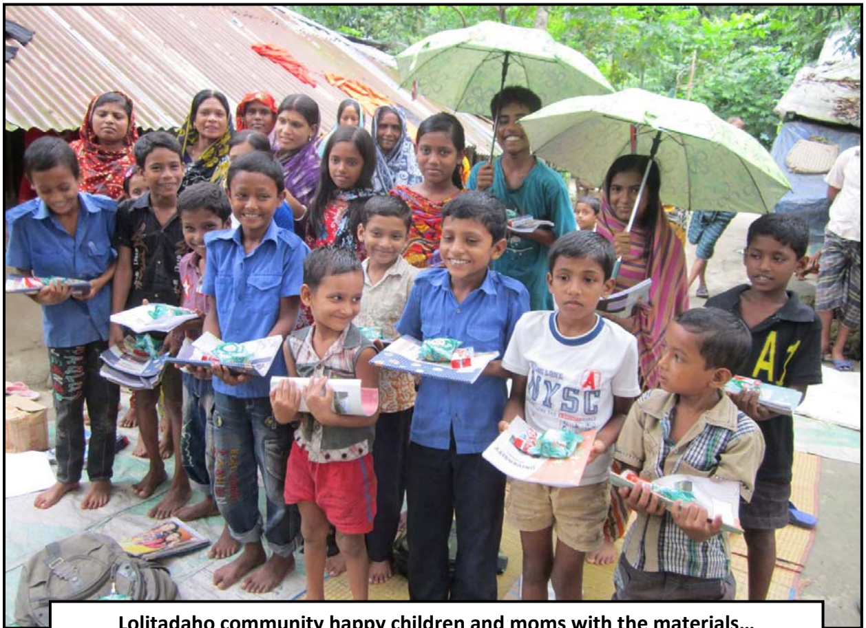
Lolitadaho community happy children and moms with the materials...