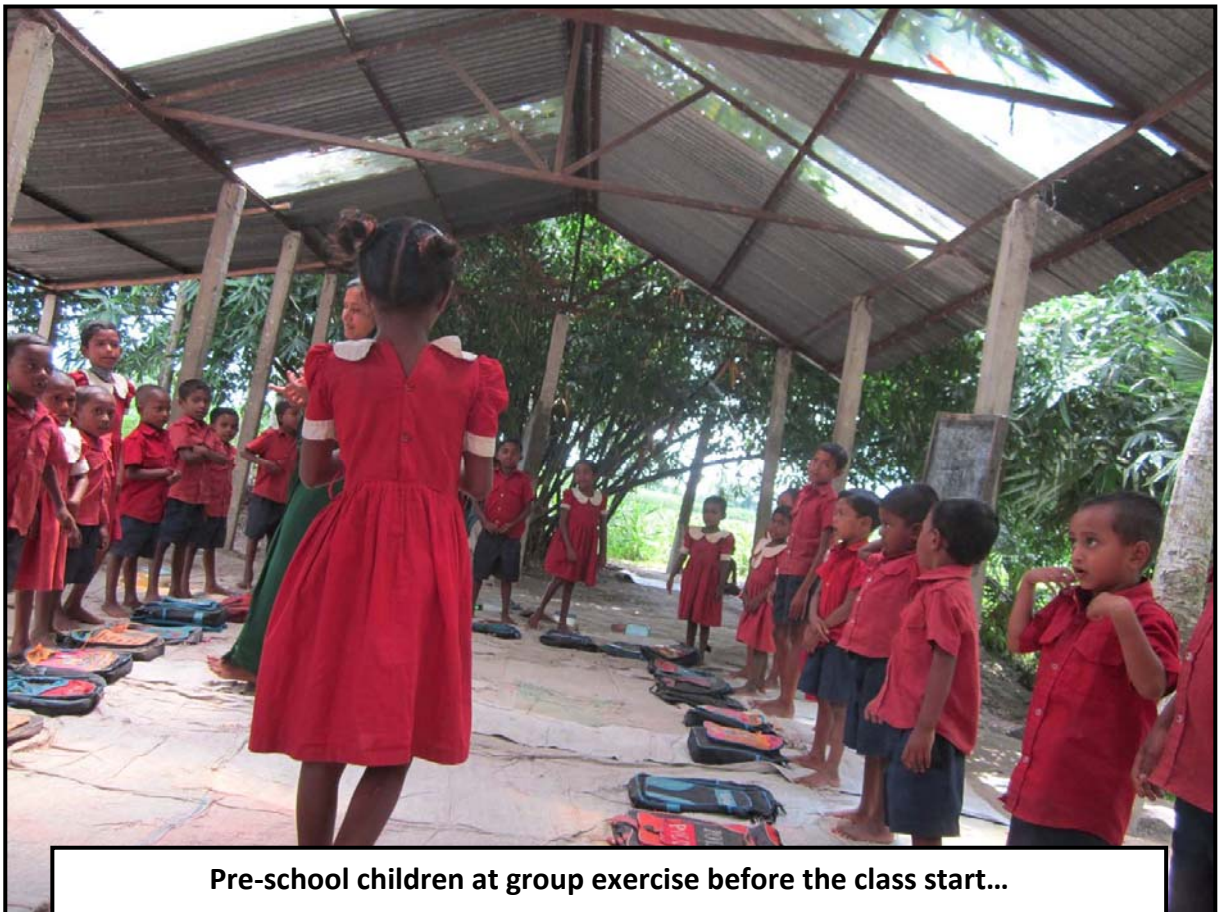
Pre-school children at group exercise before the class start...