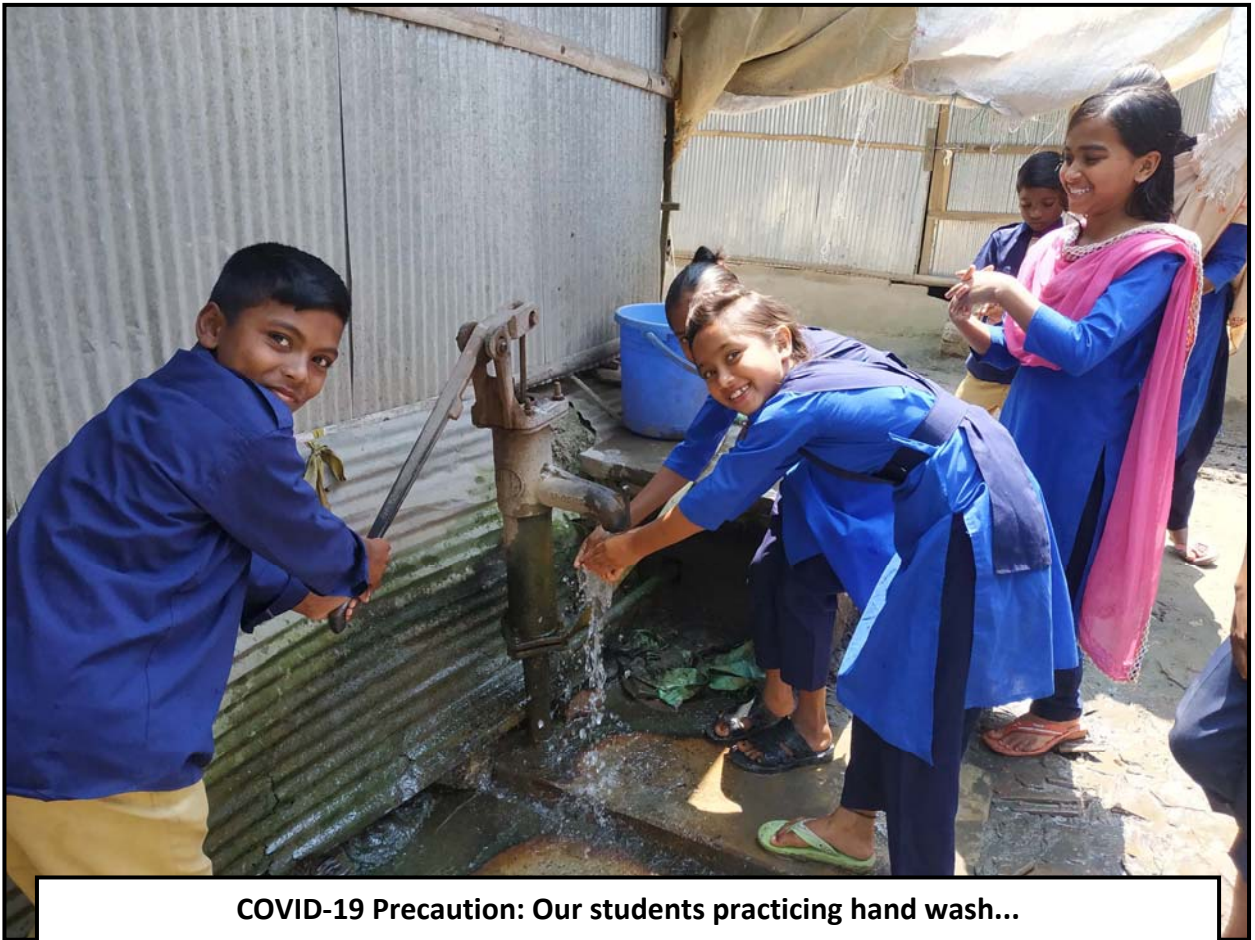
COVID-19 Precaution: Our students practicing hand wash...