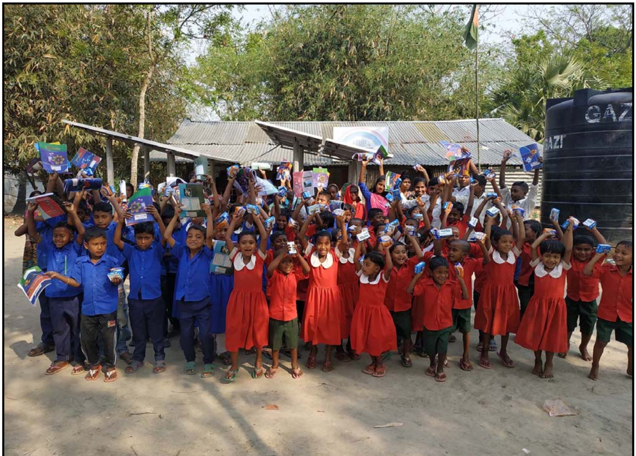
Happy Jogahati students with the materials...