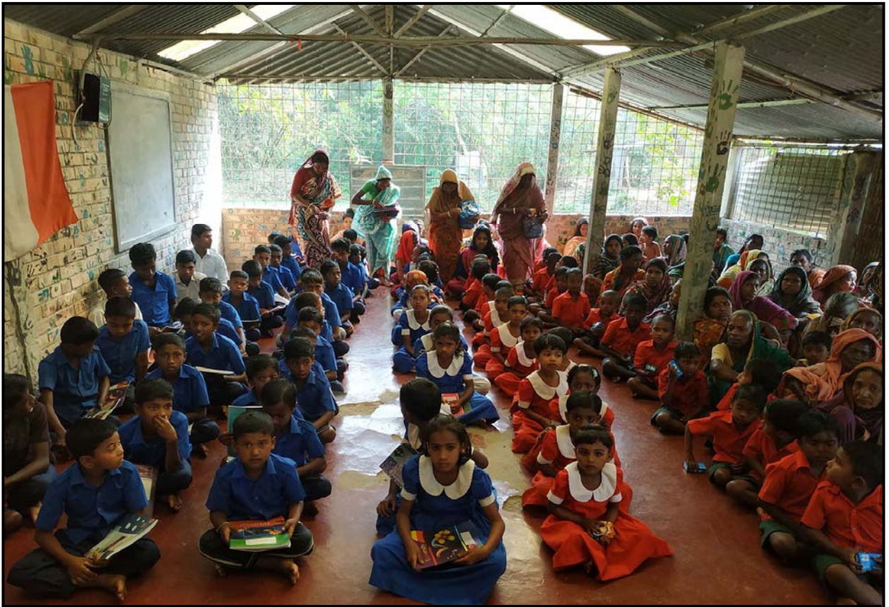
Distributing materials at Jogahati village...