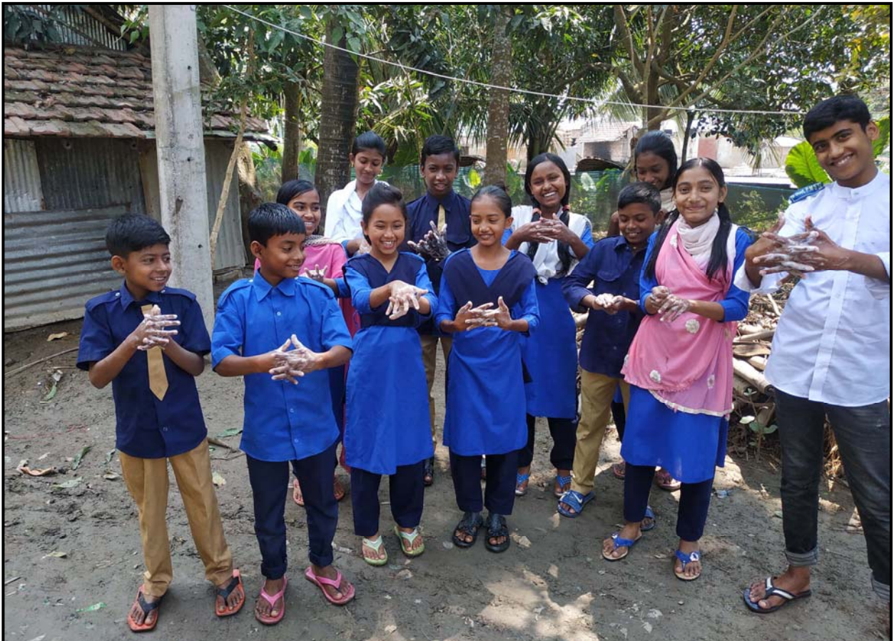
COVID-19 Precaution: Our students practicing hand wash...