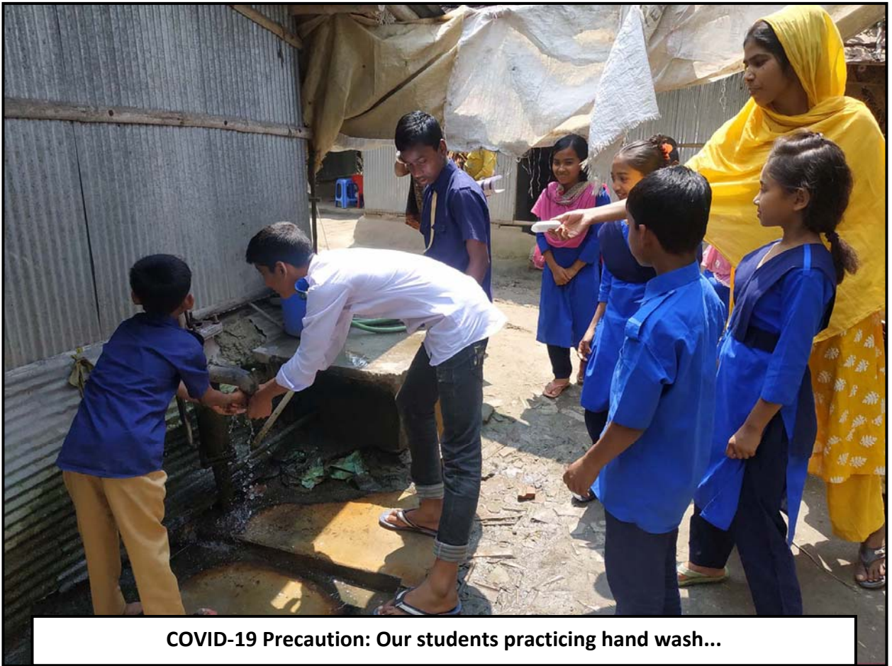
COVID-19 Precaution: Our students practicing hand wash...