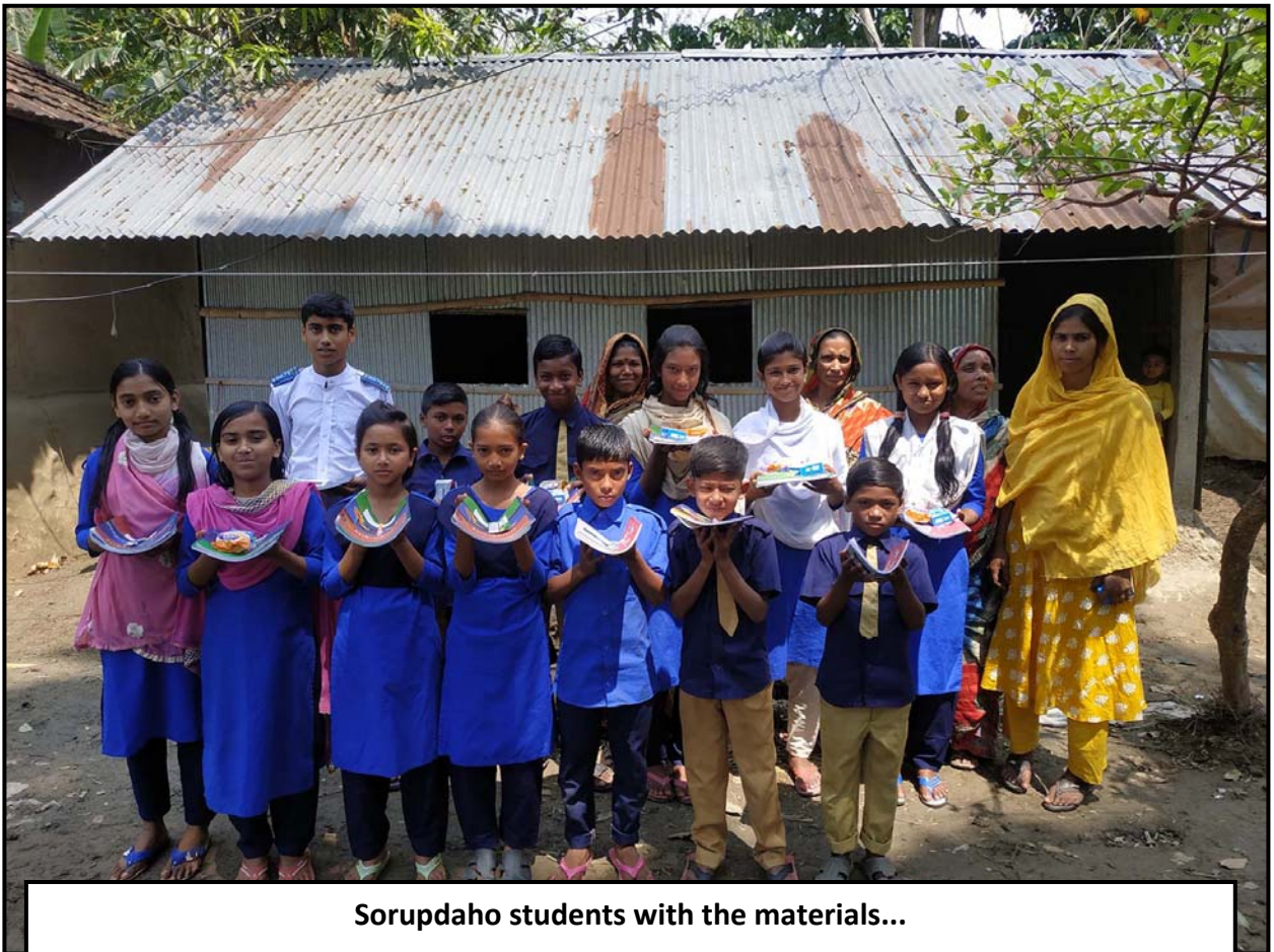
Sorupdaho students with the materials...